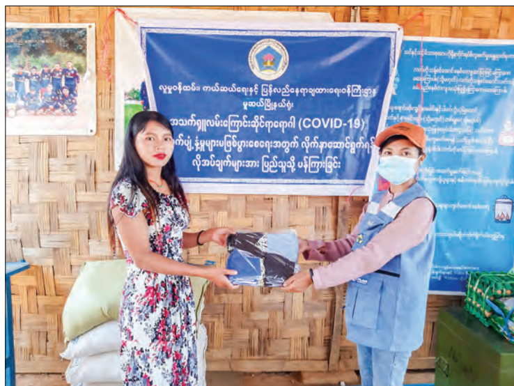
An official from Ministry of Social Welfare, Relief and Resettlement distributes cloth face masks to a person at an IDP camp in Shan State.

Similarly, seven IDP camps in Namhkam, Kutkai and Namtu townships of Shan State received 3,916 cloth face masks and 824