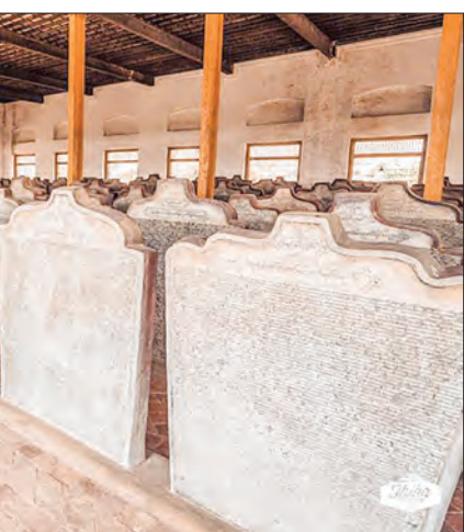
ques for Tri Pitakat treatises.