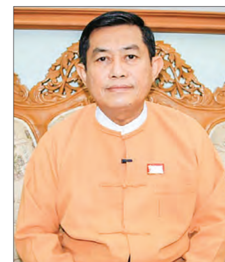
U Win Thein Bago Region Chief Minister

land issues directed by the President's office. Land is closely related to the source of most issues and that's why we have formed a committee dedicated solely to resolve these issues.