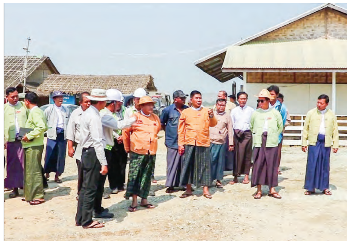
Bago Region Chief Minister U Win Thein visits the construction of the Sittoung River crossing bridge (Yedashe) on 23 February, 2020.