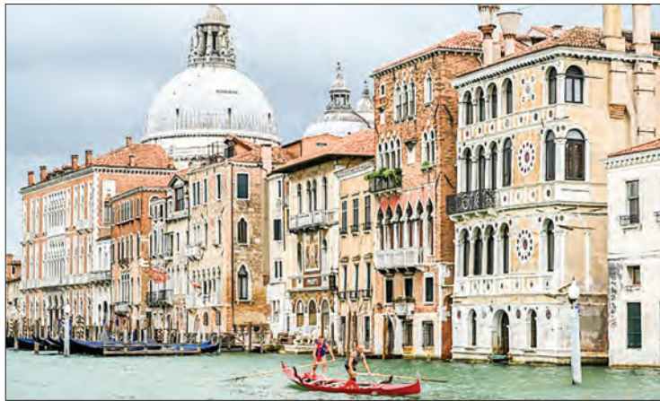
Gondoliers in Venice practise on the Grand Canal as they wait for tourists to return to the city.

Prime Minister Giuseppe Conte also said on Saturday that gyms and cinemas would soon be able to welcome the public again, as the government seeks to restart economic activity while treading cautiously amid the lingering, though waning, coronavi-