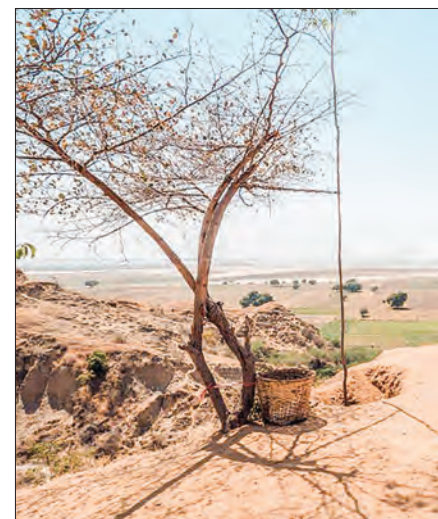
Public relaxation centre can be seen at Hill