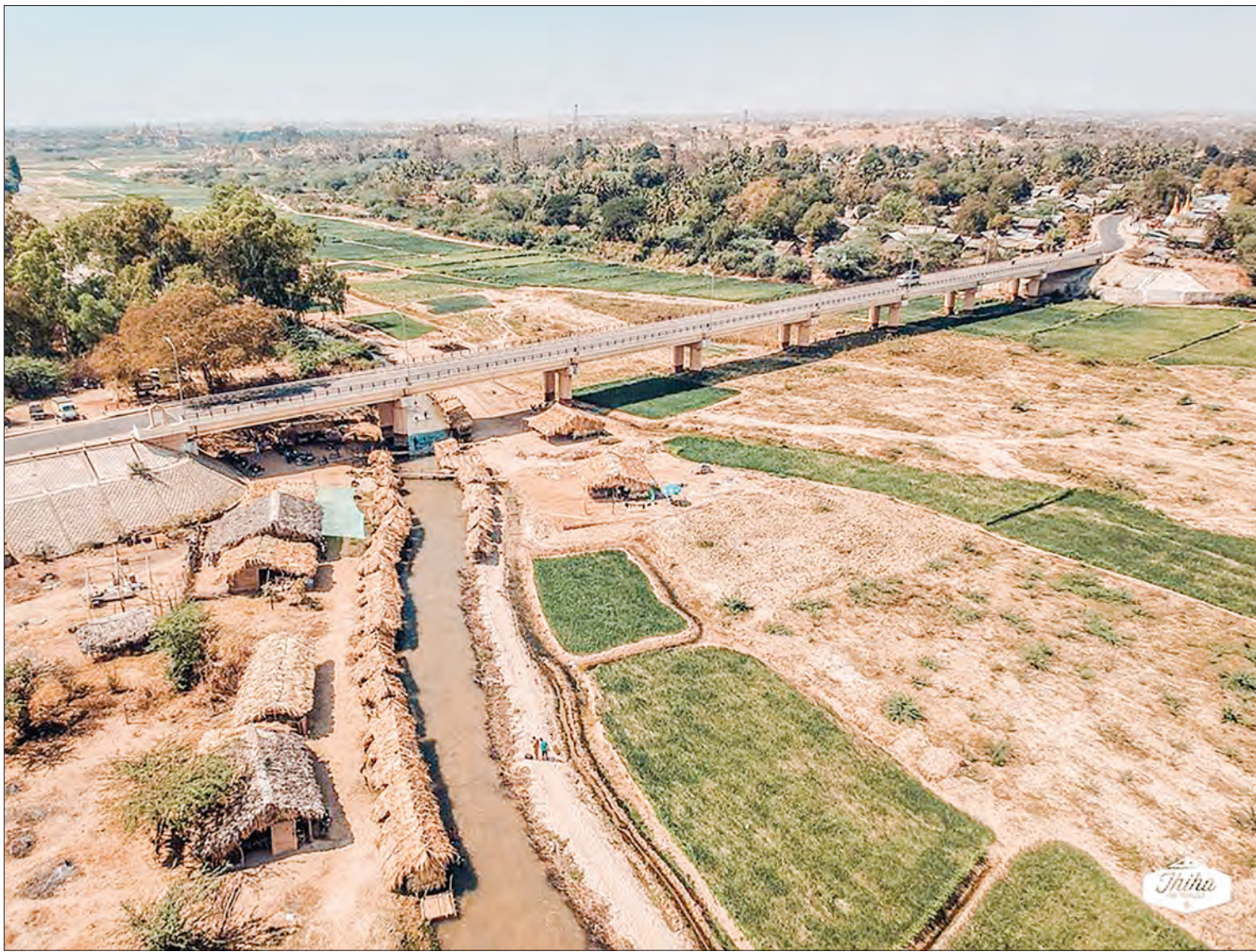
Bird's-eye view of Pinn Creek in summer.