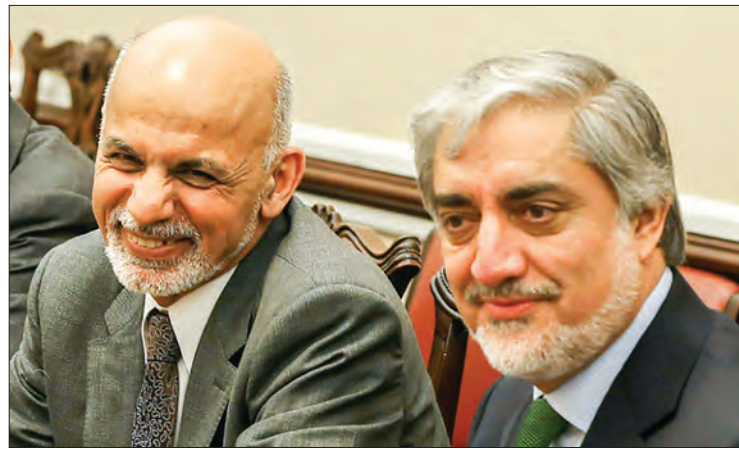
Afghanistan President Ashraf Ghani (left) and Abdullah Abdullah pictured in 2015.