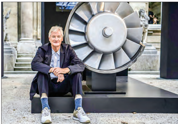
British inventor James Dyson, founder of the Dyson company, topped the Sunday Times rich list for the first time.