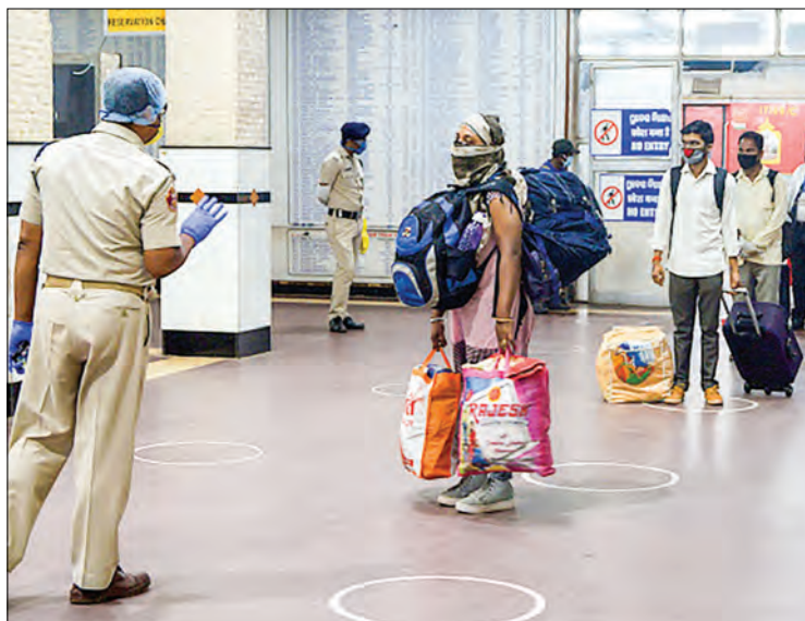
Passengers are seen in the queue with social distance when they are entering to the city railway station for travel in the special train, in Bhubaneswar, India, on 15 May, 2020.

"Corona will be with us for a long time, but our lives cannot