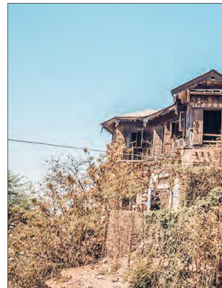
The house with 99 doors taking position for guests to the past.