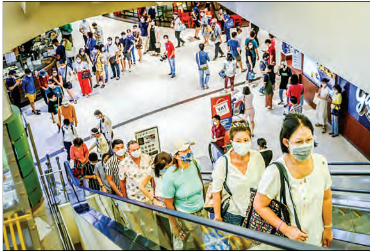
Long queues to enter Bangkok's plush Siam Paragon mall.