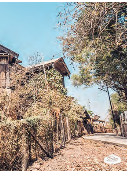
near Sanaynan Pagoda, bring the souls of