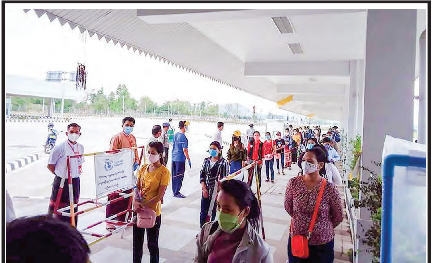
Myanmar migrant workers from Thailand are in queue at a border checkpoint in Myawaddy on 17 May. (NEWS ON PAGE-1)

Write for us We appreciate your feedback and contributions. If you have any comments or would like to submit editorials, analyses or reports please email ce@globalnewlightofmyanmar.com with your name and title. Due to limitation of space we are only able to publish "Letter to the Editor" that do not exceed 500 words. Should you submit a text longer than 500 words please be aware that your letter will be edited.