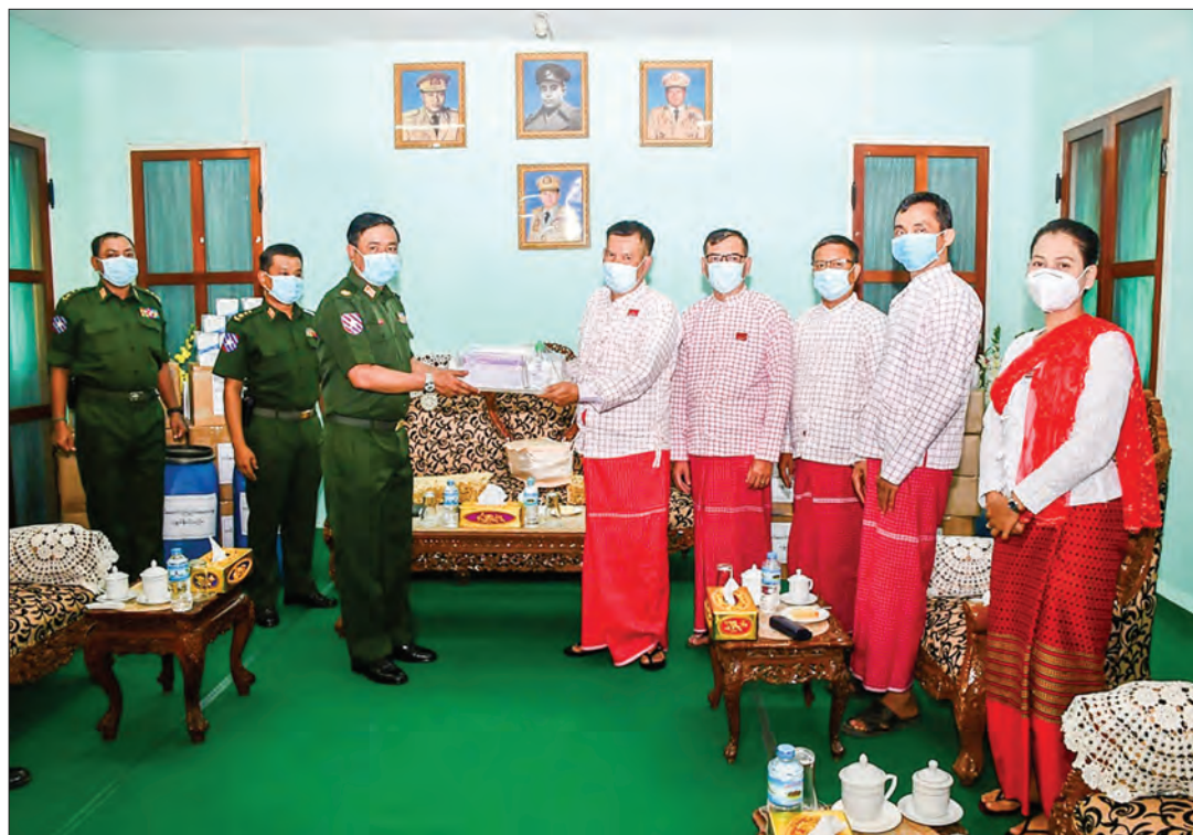
Brig Gen Ko Ko Maung hands over protective equipment and other items for fighting COVID-19 to representative from New Mon State Party at Dawna Yeiktha in South-East Command on 16 May.