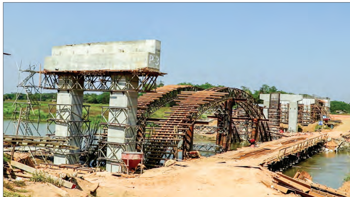
The construction site of the new bridge linking Bago and Yangon.

A: We have constructed 3 16-bedded traditional medicine hospitals, a traditional medicine department office, a 50-bedded hospital and 5 16-bedded hospitals across the region. Furthermore, the FDA performs surprise checks in markets, schools and restaurants using mobile labs.