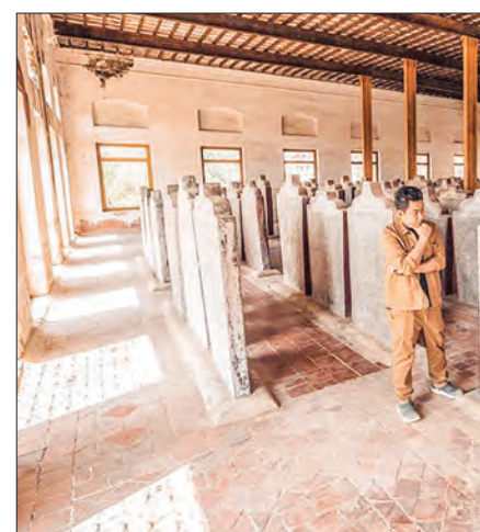
The stone plaque chamber stores 451 plaques