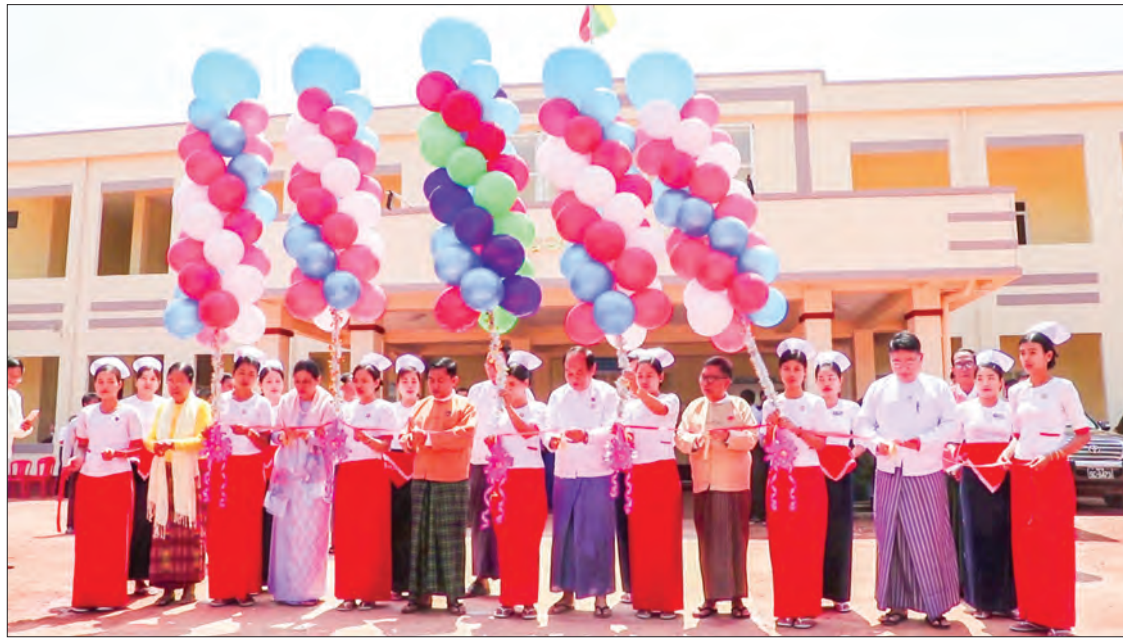
The opening ceremony of extended building of two-storey new patient ward in Waw Township People's Hospital in Bago Region on 10 March 2020.

The electric sector is very important and there is the national objective of achieving complete electrification across the entire nation by 2030. In that regard, we have completed the