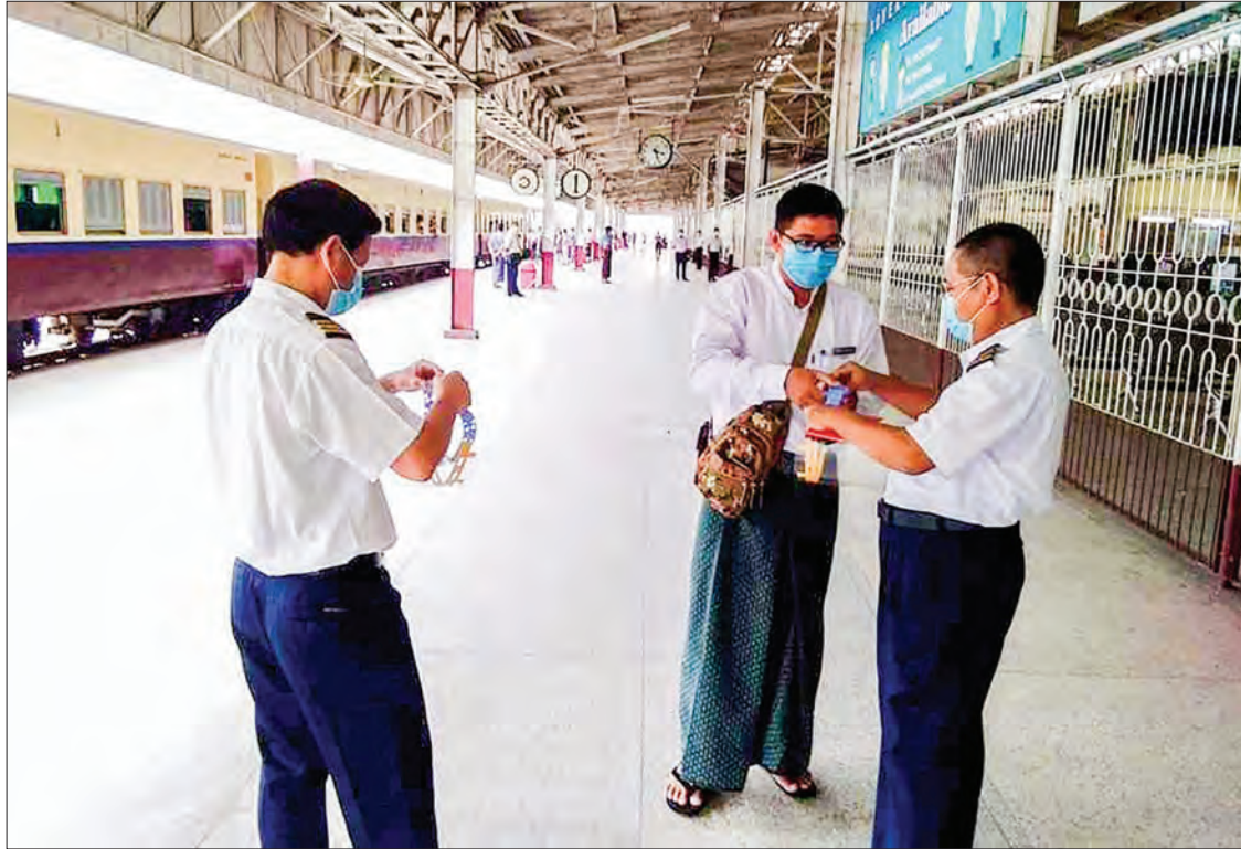
Officials from Myanmar Railways distribute a face shield to a passenger at the Central Railway Station in Yangon.

On the circular railway, five trains run 28 rounds a day, and there were about 7,000 commuters per day during the COVID-19