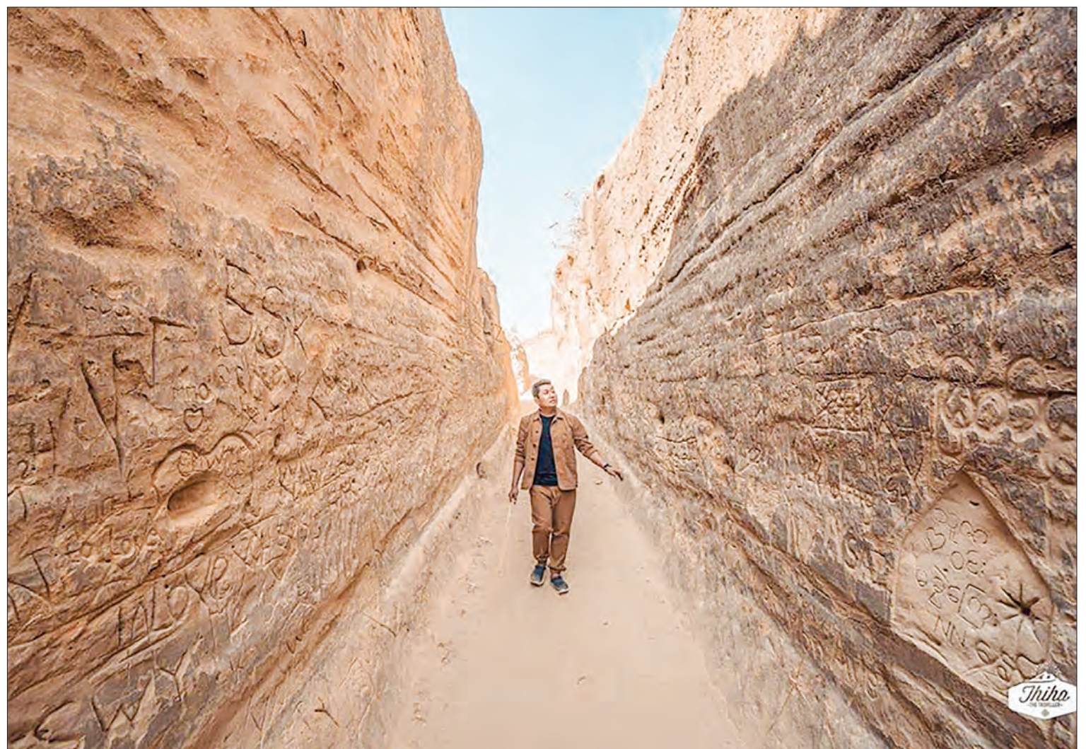
A 31 feet high valley is lovely for taking photos.