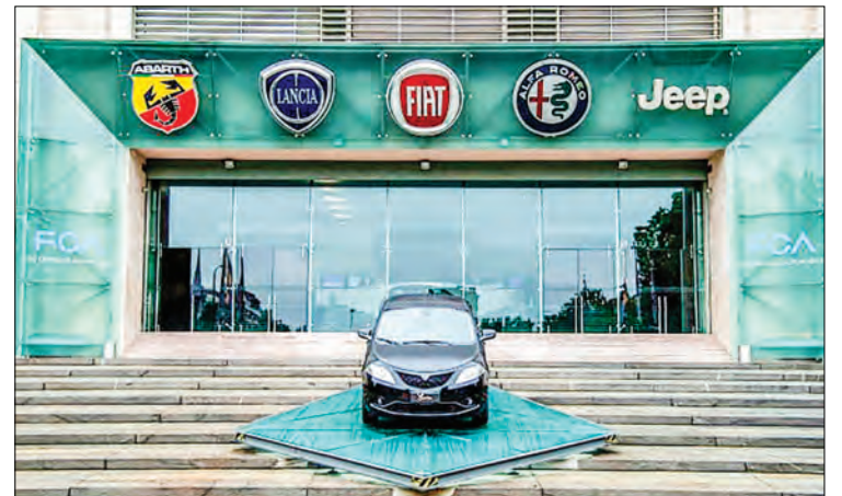
The logos of automobile companies (LtoR) Abarth, Lancia, Fiat, Alfa Romeo and Jeep are pictured at the entrance to the Fiat Chrysler Automobiles (FCA) at the Fiat Mirafiori car plant on 27 May, 2019 in Turin, northern Italy.

Support for companies not based in Italy pose tricky political problems for the government as millions of companies in the country complain of little or no support.— AFP ■