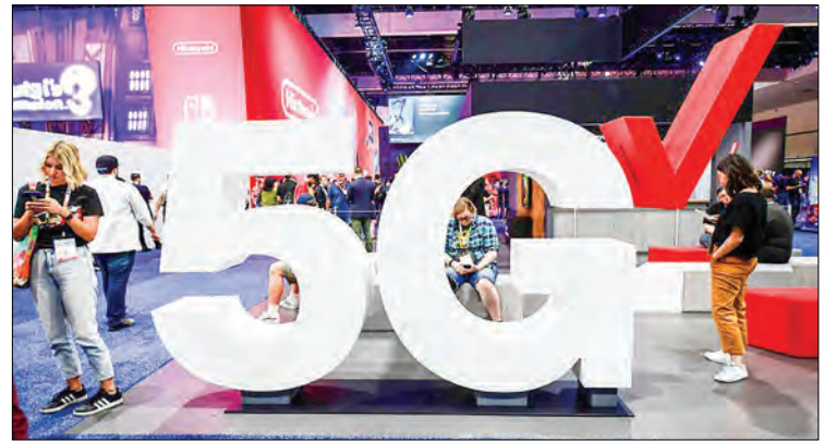
File photo - "New technologies, from 5G and big data to cloud computing and artificial intelligence, are powerful tools to tackle the world's most pressing challenges, including the pandemic," the UN chief said.

"The International Telecommunication Union continues to work with the information and communication technology community and UN agencies to help manage and end this crisis, and recover better," he said.