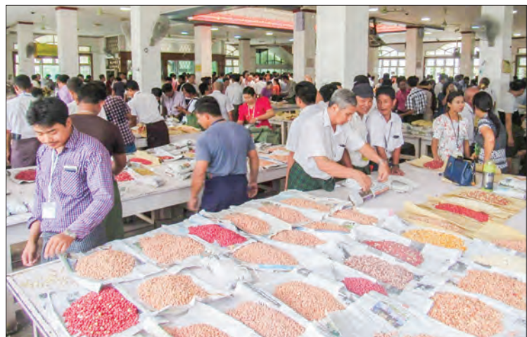
Merchants evaluate quality of pulses at the Mandalay wholesale market last year. FILE PHOTO