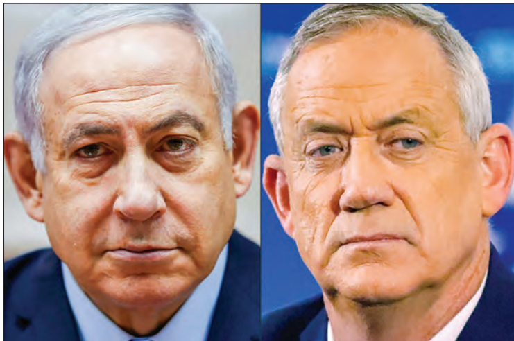
The coalition government was agreed last month between veteran right-wing Prime Minister Benjamin Netanyahu, left, and his centrist rival-turned-ally Benny Gantz, a former army chief.

putes among Netanyahu's bloc apparently resolved, Israel's parliament, the Knesset, was scheduled to meet at 1pm (1000 GMT) to begin the session culminating