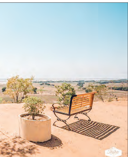
lock of Cupid.