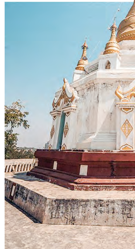
Eight-dimensional Hsutaungpyae Pagoda