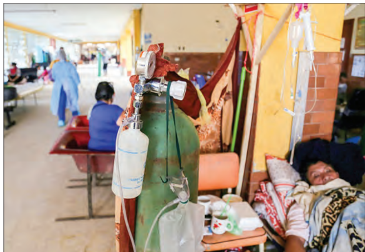
Patients with COVID-19 are treated in the corridor of a hospital in the Amazon city of Iquitos, on 14 May, 2020.

LIMA — Peru said it will construct a fast-build hospital in the Amazon as it seeks to respond to a growing COVID-19 emergency sweeping through the indigenous population.