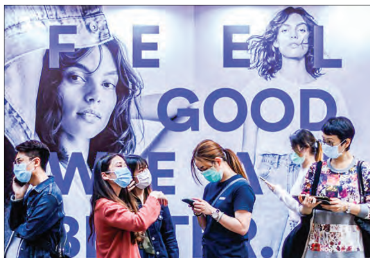
Pedestrians wear face masks as a precautionary measure as they wait for a bus in Hong Kong. Hong Kong will ban all nonresidents from entering the city from midnight on March 24, 2020, in a bid to halt the coronavirus.

TESTS on hamsters reveal the widespread use of facemasks reduces transmission of the deadly coronavirus, a team of leading experts in Hong Kong said Sunday.