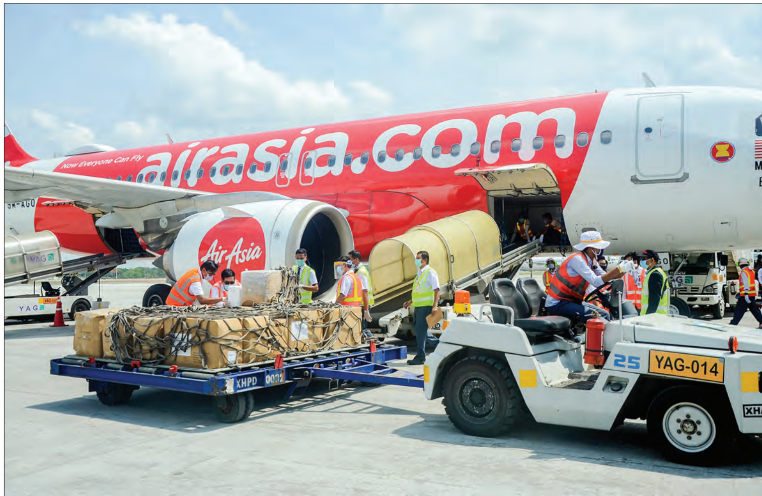
The second batch of medicines and medical equipment arrives at the Yangon International Airport on 17 May 2020.

cial flights remain temporarily suspended as part of measures to contain the spread of COVID-19, the World Food Programme, on behalf of the United Nations in Myanmar, is launching a series of humani-