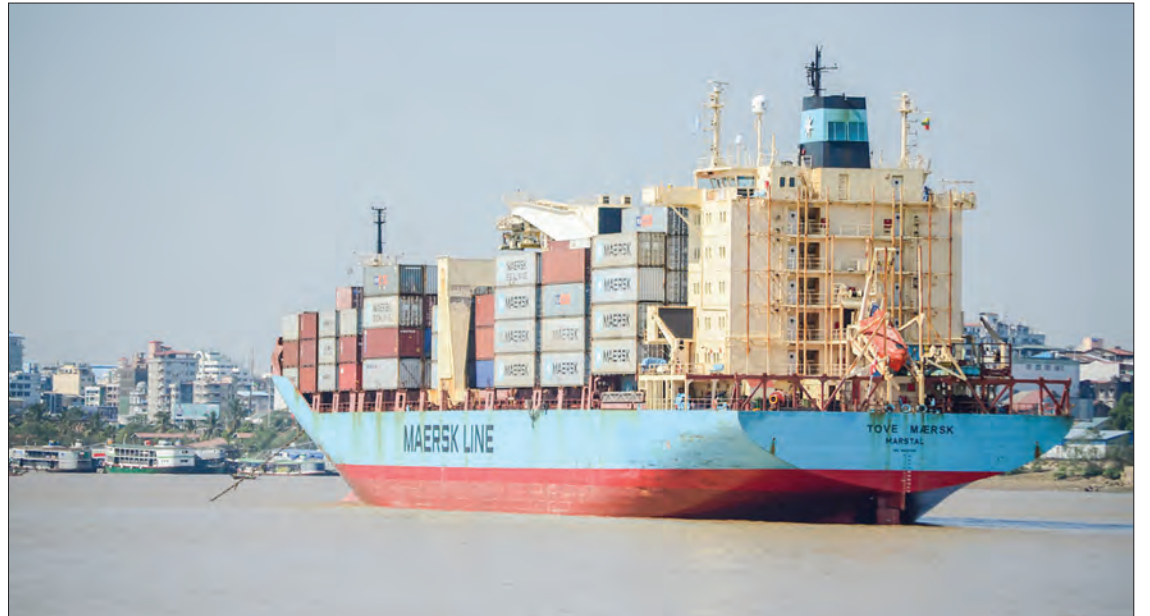
A cargo ship is anchored in the Yangon River.