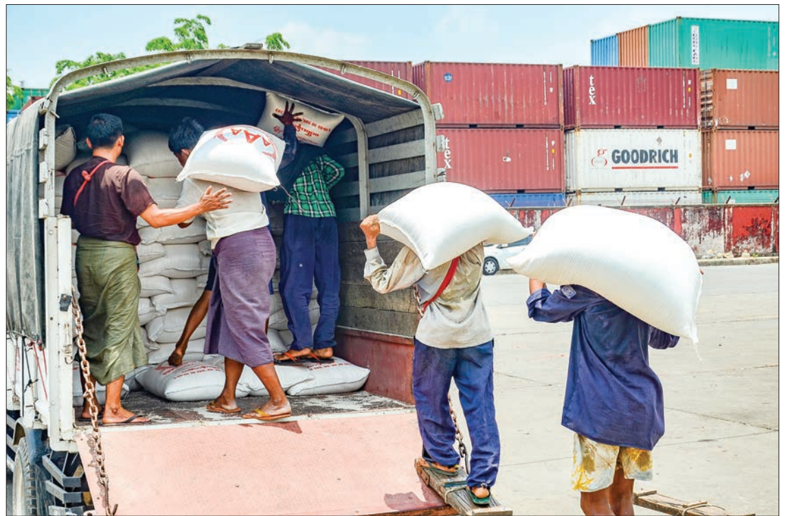
Workers loading the truck with sacks of rice.

Earlier, China accepted the pest-free certificate issued at the Muse border as of 31 May. Now, they will allow the rice bags with the certificates issued only