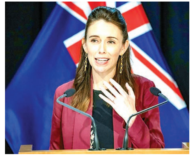
New Zealand has got the virus under control but Prime Minister Jacinda Ardern warned of pain ahead, with unemployment rising and the economy contracting.