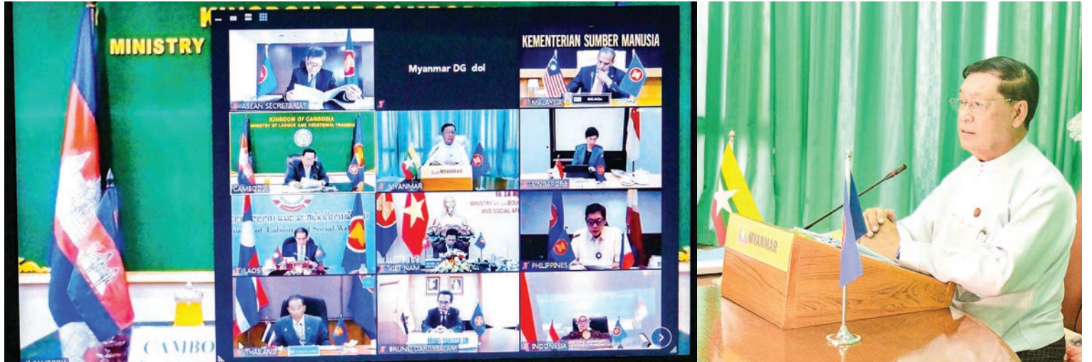
Labour Ministers from ASEAN countries hold the meeting yesterday through video conferencing to discuss responses to impacts of Coronavirus Disease 2019 (COVID-19) on employees and employments in the member countries.

The Secretary-General talked about impacts of COVID-19 on public health, economy, trade and tourism sectors