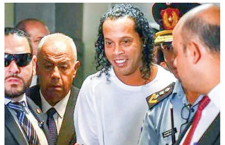
Ronaldinho (in t-shirt) arrives at Asuncion's Justice Palace to testify about his irregular entry in Paraguay on March 6, 2020.

"I was completely caught off guard when I found out that these passports were not valid," Ronaldinho told Paraguayan newspaper ABC last month in his only public statement since his release.—AFP