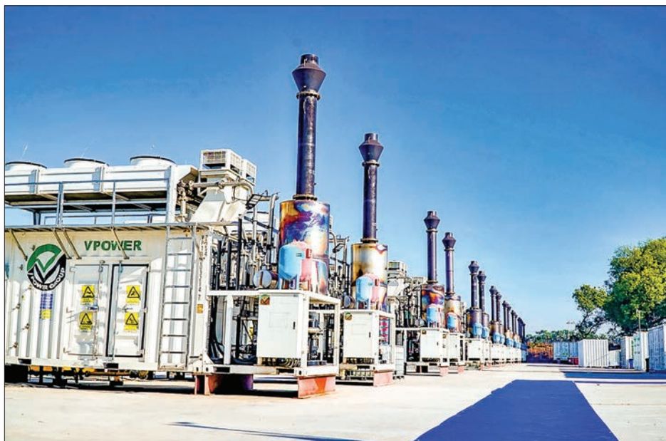
The gas-fired power plant in Magway Region.