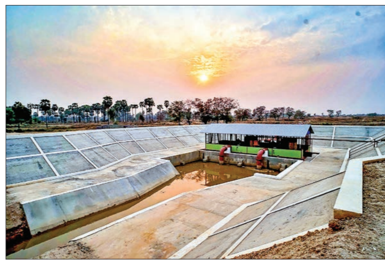
War Yar Thazi Water pumping seen in Magway Region.