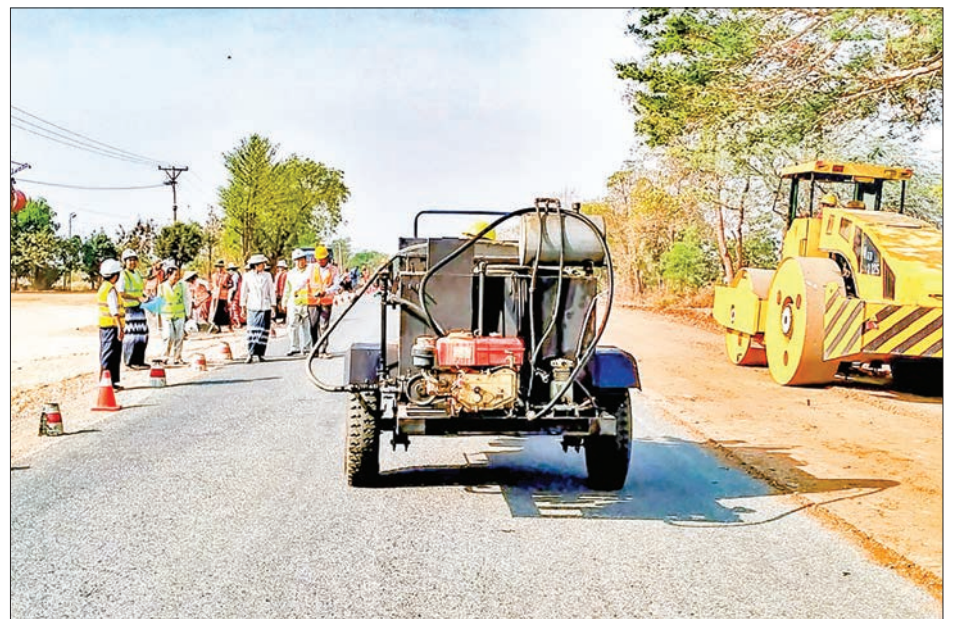
Engineers and workers repairing the Minbu-An Road in Magway Region.