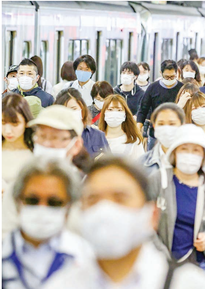
People wearing face masks walk at Fukuoka Station in southwestern Japan on May 14, 2020. The government is set to decide later in the day on partial lifting of a state of emergency as the spread of the novel coronavirus seems to have subsided.