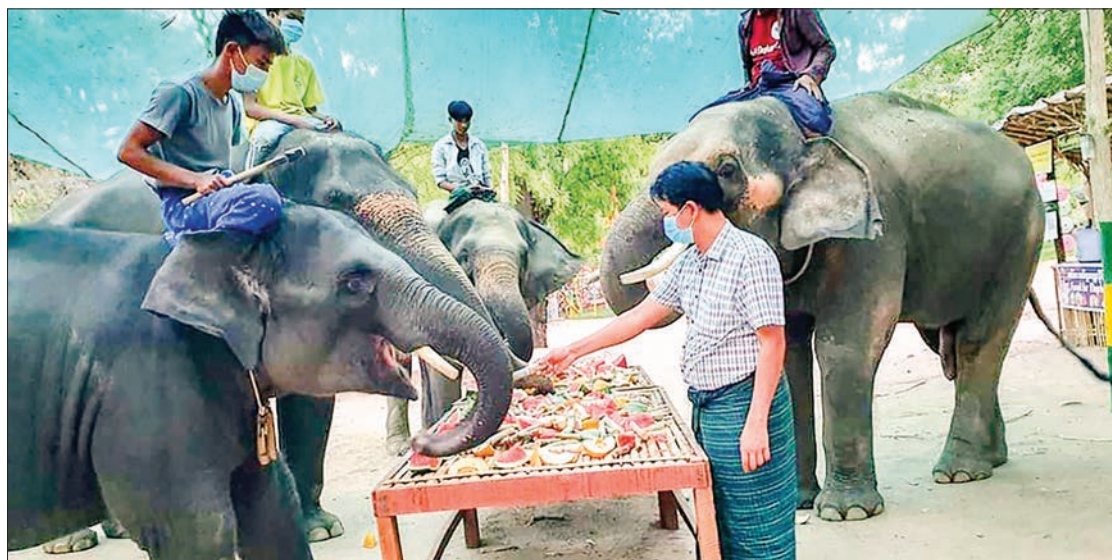
People feeding elephants. The feeds were donated by well-wishers across Myanmar during the pandemic period.