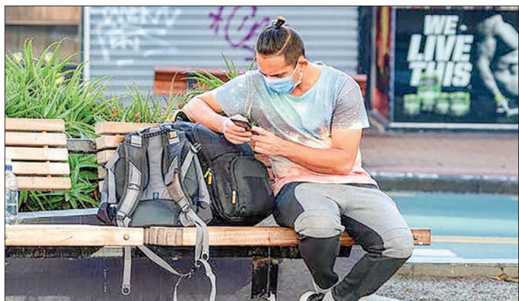
Masked man in New Zealand waits for bus.

H ERE are the latest developments from Asia related to the novel coronavirus pandemic: