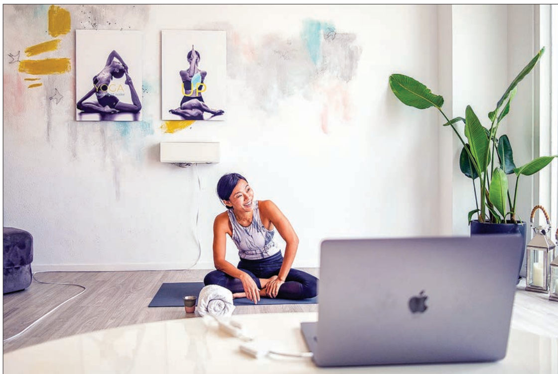
A yoga instructor concludes a live streamed yoga class via the Zoom online video conferencing platform in the midst of coronavirus.

“The impact of the pandemic on people’s mental health is already extremely concerning,” said Dr Tedros Adhanom Ghebreyesus, Director-General of the World Health Organization. “Social isolation, fear of contagion, and loss of family members is compounded by the distress caused by loss of income and often employment.”