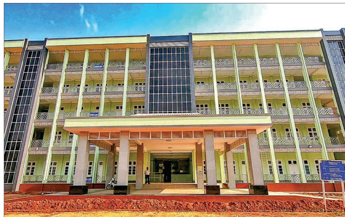
The five-storey building of the Magway General Hospital.

The road department is implementing the 2,187-mile road project with the involvement of