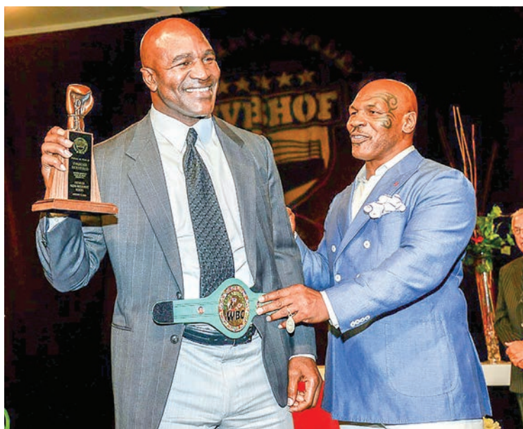
Former heavyweight boxing champions Evander Holyfield (left) and Mike Tyson (right) are looking to fight charity exhibition bouts in their 50s.

LONDON—Boxing promoter Eddie Hearn has questioned whether a return to the ring for Mike Tyson at 53 would be ethical.