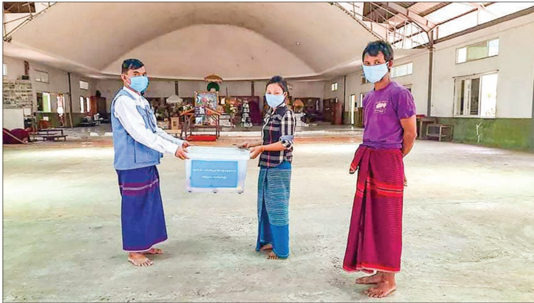
Staff from Ministry of Social Welfare, Relief and Resettlement offers medical aids for COVID-19 prevention in Kyitkyina.

No new case of COVID-19 at 8 pm on 14 May: Total figure remains at 181