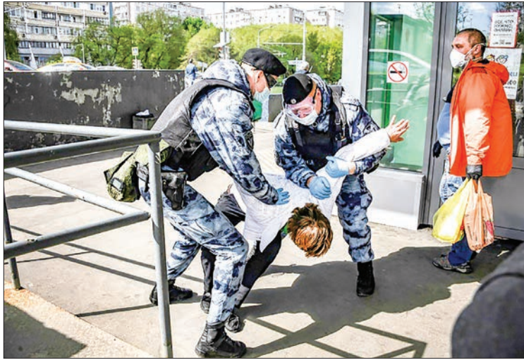
Russian National Guard (Rosgvardia) officers detain a man in front of a supermarket in Moscow after city authorities made it mandatory to wear gloves and a mask in public places.

WASHINGTON — The coronavirus may never go away and populations will have to learn to live with it just as they have