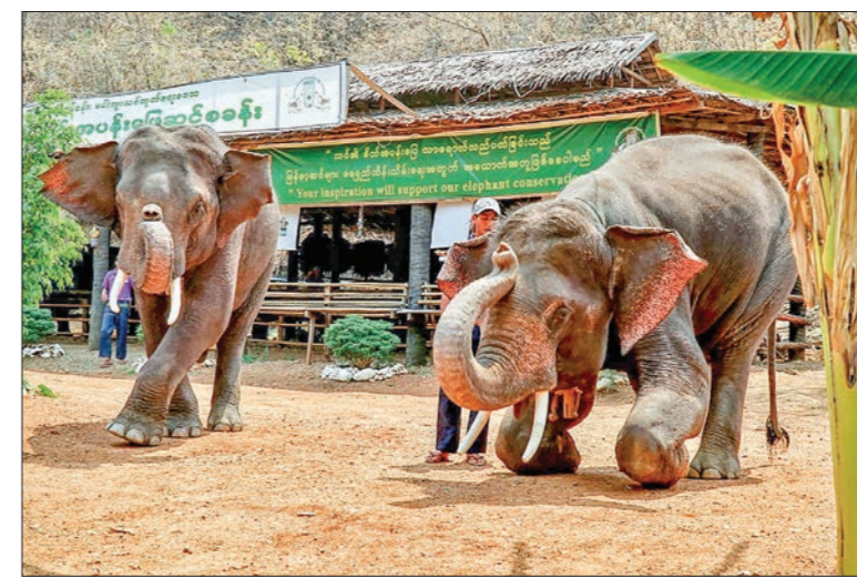
Elephant camp near Mann Shwe Settaw Pagoda in Minbu becomes popular for holiday makers.