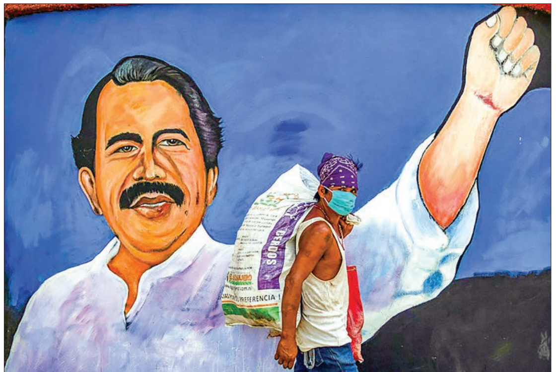
Nicaragua has reported only 16 coronavirus cases and five deaths, but civil society groups claim the number is much higher.

The state’s Republican House Speaker Robin Vos and Senate Majority Leader Scott Fitzgerald said the ruling allowed “people to once again gather with their loved ones or visit their places of worship without the fear of violating a state order.”—AFP ■