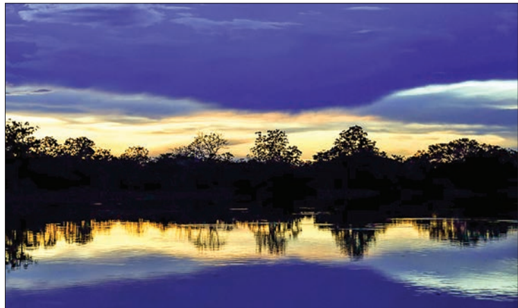
Researchers say the urbanization of once-wild areas like the Amazon contributes to the emergence of diseases that pass from animals to humans.