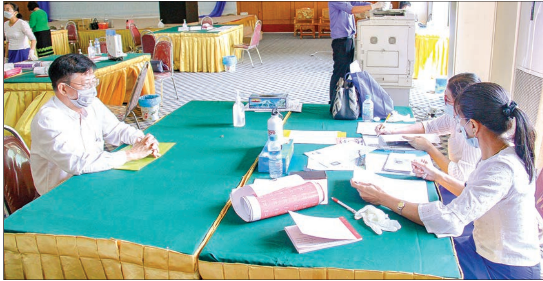
Staff giving service to the businessperson in applying for loans amid COVID-19.