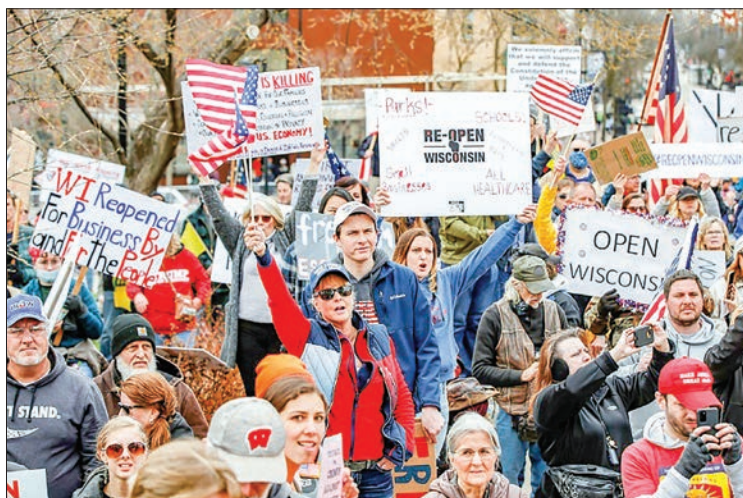
Americans across the country have staged anti-lockdown demonstrations.