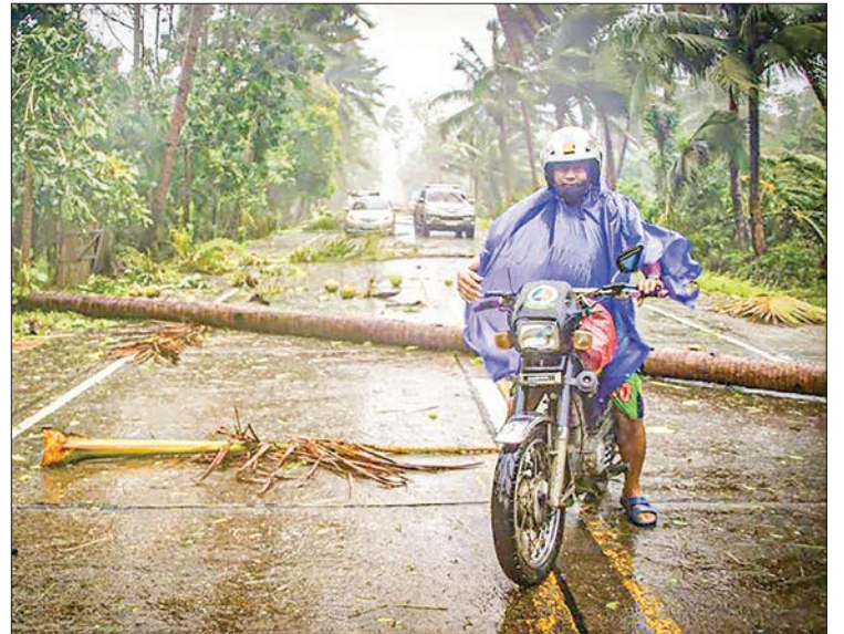
Tens of thousands have been forced to evacuate in the Philippines because of a powerful typhoon.

Typhoons are a dangerous and disruptive part of life in the Philippine archipelago, which gets hit by an average of 20 storms and typhoons each year.—AFP ■