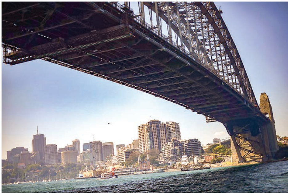
Prime Minister Scott Morrison has warned of further pain to come for Australia's economy.

The Treasury has forecast the unemployment rate will reach 10 percent in the June quar-