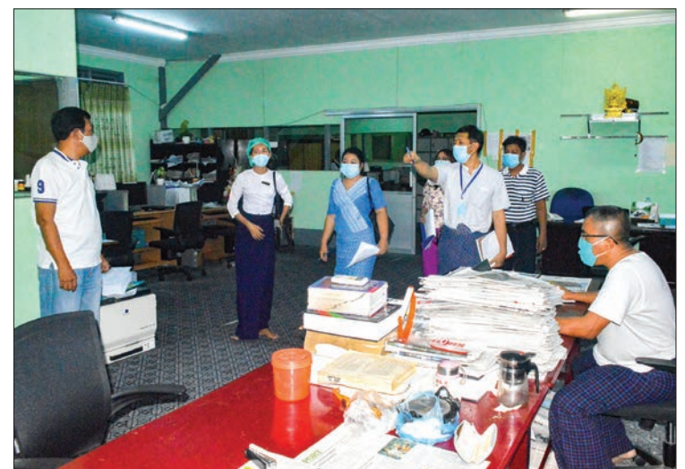
Joint team inspects newsroom of the Global New Light of Myanmar newspaper yesterday.

The team checked the workplaces of the GNLM in line with the guidelines and directives of both ministries concerning the prevention, control and treatment measures against coronavirus pandemic.—GNLM