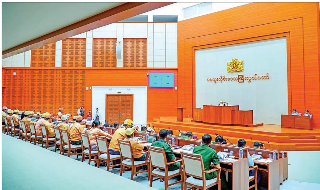
The Magway Region Hluttaw Meeting being convened.

The region office of the Information and Public Relations