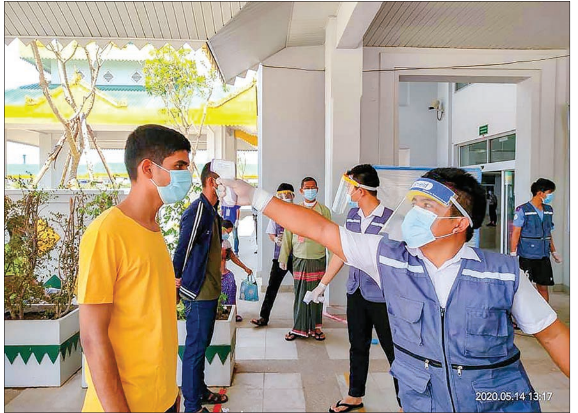
Staff testing the body temperature of the Myanmar Nationals returned from Thailand through Myawady Friendship Bridge (2) yesterday.