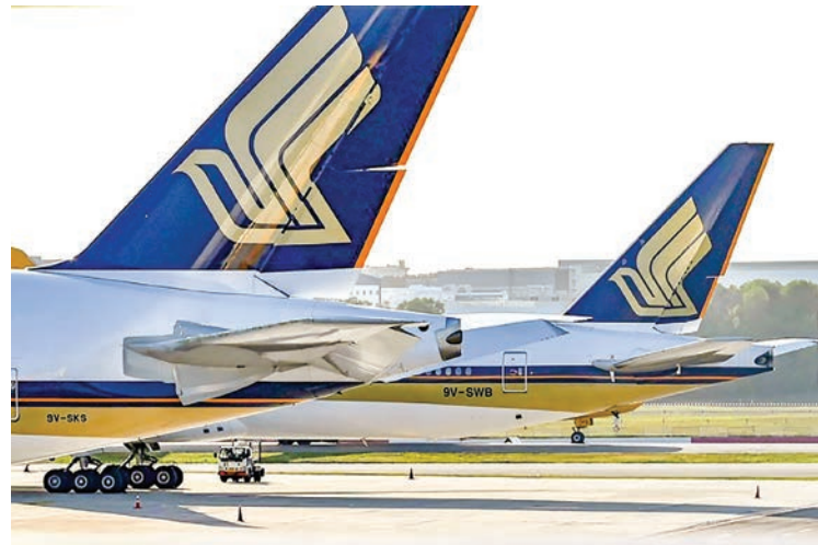
Singapore Airlines reported an annual loss of almost $150 million, driven by the collapse in air travel caused by the coronavirus pandemic.

almost $150 million Thursday, driven by the collapse in air