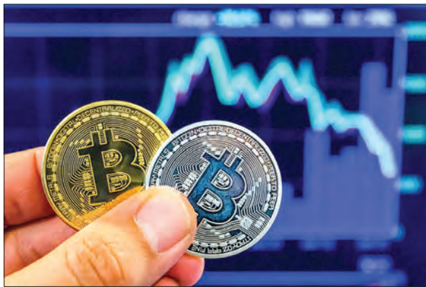
Bitcoin was created in 2008.

SINGAPORE — Bitcoin rose Wednesday after undergoing an eagerly awaited adjustment that occurs every few years to limit the amount of the virtual currency on the market, building on a recent coronavirus-driven rally.