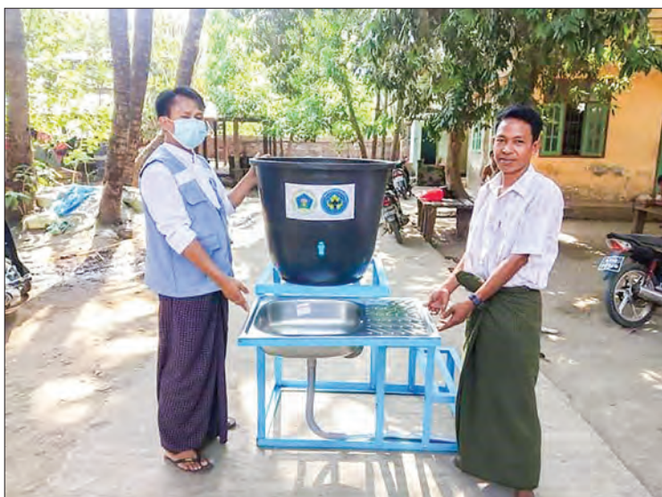
An official from Ministry of Social Welfare, Relief and Resettlement distributes a hand washing basin to a person at an IDP camp.