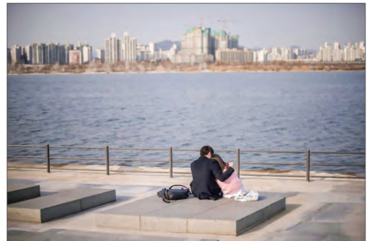
Under the revised law, adults who have sex with under-16-year-olds will be prosecuted for child sexual abuse or rape regardless of any alleged consent.

Despite its economic and technological advances, South Korea remains a traditional and patriarchal society, where victims of sexual assault have been shamed for coming forward.