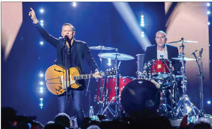
Bryan Adams was slammed for comments about how "bat eating" triggered the coronavirus pandemic, which has caused his London shows to be cancelled.