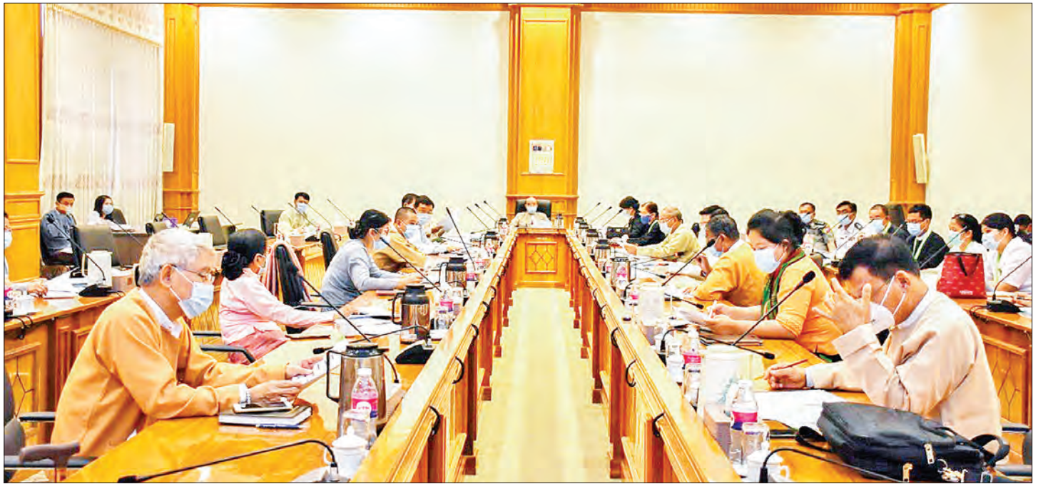
Pyidaungsu Hluttaw Deputy Speaker U Tun Aung chairs meeting of Joint Bill Committee yesterday.