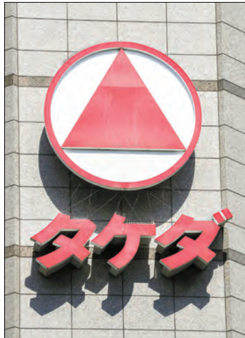
Photo taken on 20 April 2018, shows a logo of Takeda Pharmaceutical Co. installed on its head office building in Tokyo.

The forecast does not reflect any impact from the plan to launch the clinical study in cooperation with 10 plasma companies, such as Biotest and CSL Behring, and the National