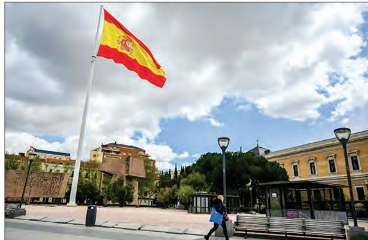
Spain's retirement homes have been badly hit by the coronavirus outbreak.