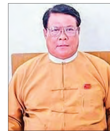
Sagaing Region Chief Minister Dr Myint Naing

Another MMK (6) billion was spent in replacing power lines and