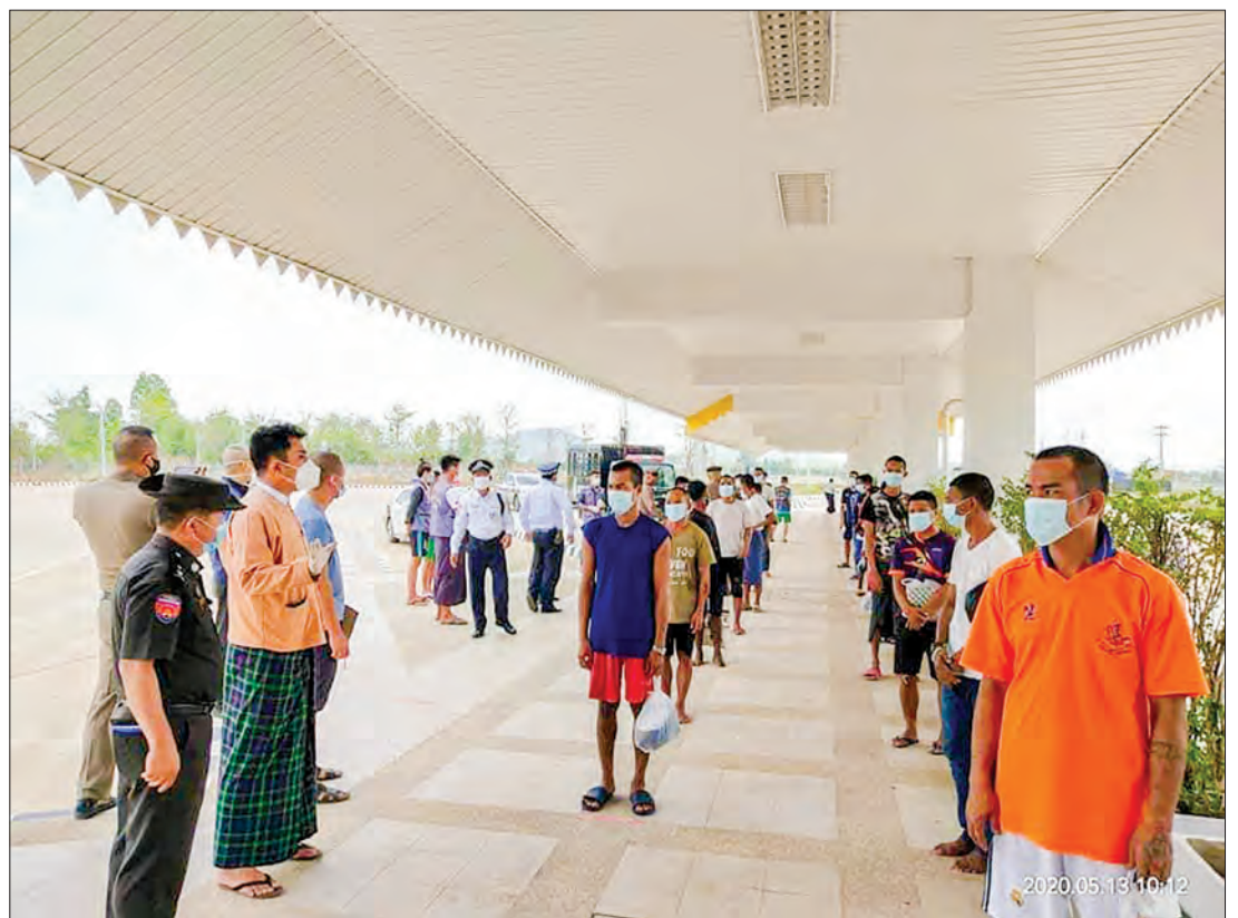
Myanmar citizens returned from Thailand to Myanmar queue for immigration processes in Myawady yesterday.

MYANMAR officials reaccepted 16 Myanmar citizens who have served jail terms in Thailand for various offences.