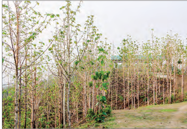
Commercial teak is seen under cultivation in Seikpyu Township.

With the decline in the quality of the natural forest in this modern time, the local