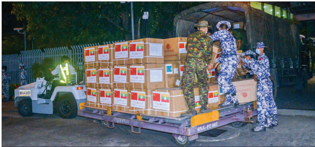
Photo shows the boxes of PPE donated by Chinese People's Liberation Army to Myanmar Tatmadaw to fight against COVID-19.

A special flight of Chinese People's Liberation Army carried 10,000 sets of personal protective equipment (PPE) for the Myanmar Tatmadaw on 12 May evening.