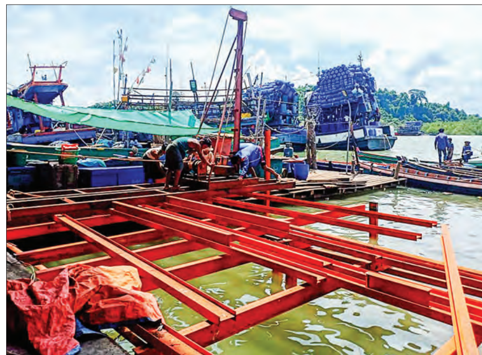
Construction of state-owned pontoon jetty is underway in Kawthoung district.

A state-owned pontoon jetty will be constructed in Kawthoung district in order to inspect the fisheries products onboard the ships and also to load and unload the fish from the fishing vessels.