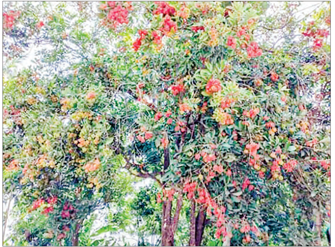
Rambutan are highly produced in Kyaikmaraw Township, Mon State.

Myanmar exports agro products and a number of fruits to China, which accounts for