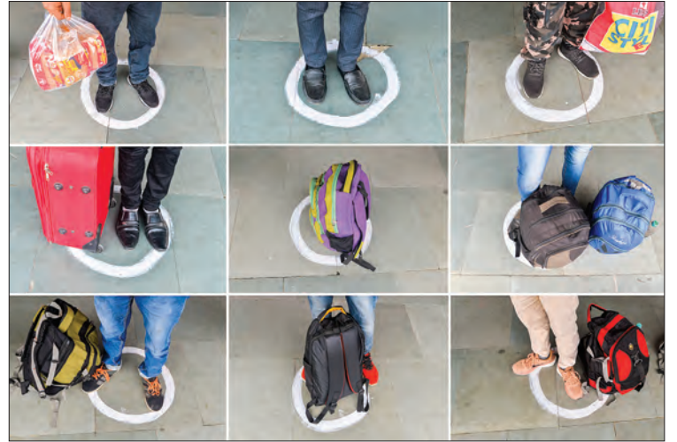
This combination of pictures created on 13 May, 2020 shows passengers standing on a circle painted on the ground with their luggages to maintain social distancing while waiting to board train to Assam at New Jalpaiguri railway station after the government eased a nationwide lockdown imposed as a preventive measure against the COVID-19 coronavirus, on the outskirts of Siliguri on 13 May, 2020.

ter contraction is meanwhile expected to be far steeper than the first. And adding to the grim news, UK output dived by a record 5.8 per cent in March from the previous month.