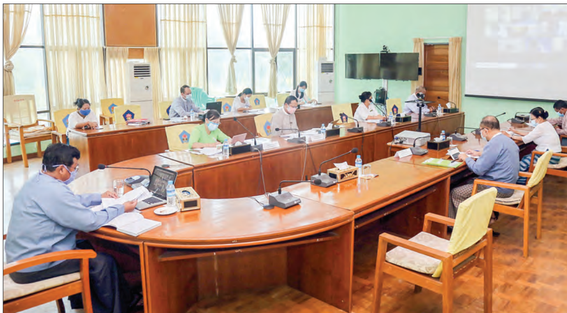
PWDs working committee discusses progress of works in the 5 th meeting through video conferencing yesterday.

Vice Chairman explained 19 resolutions in the 4 th meeting of working committee, the com-