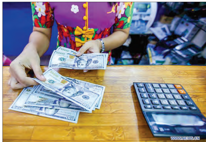
A clerk checks US hundred dollars bills at a foreign currency exchange counter in Yangon. FILE PHOTO