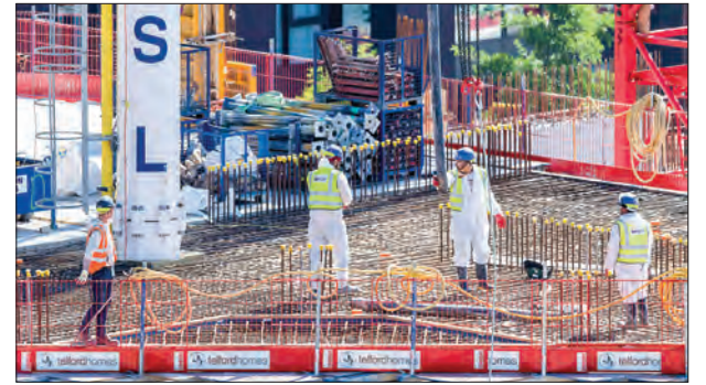
Construction workers wearing PPE (personal protective equipment), some including face masks, work to build new apartments and a retail complex at Nine Elms in south London on 12 May 2020, as life in Britain continues during the nationwide lockdown due to the novel coronavirus pandemic.

"With the arrival of the pandemic, nearly every aspect of the economy was hit in March, dragging growth to a record monthly fall," said Jonathan Athow, deputy national statistician for economic statistics at the ONS. "Services and con-