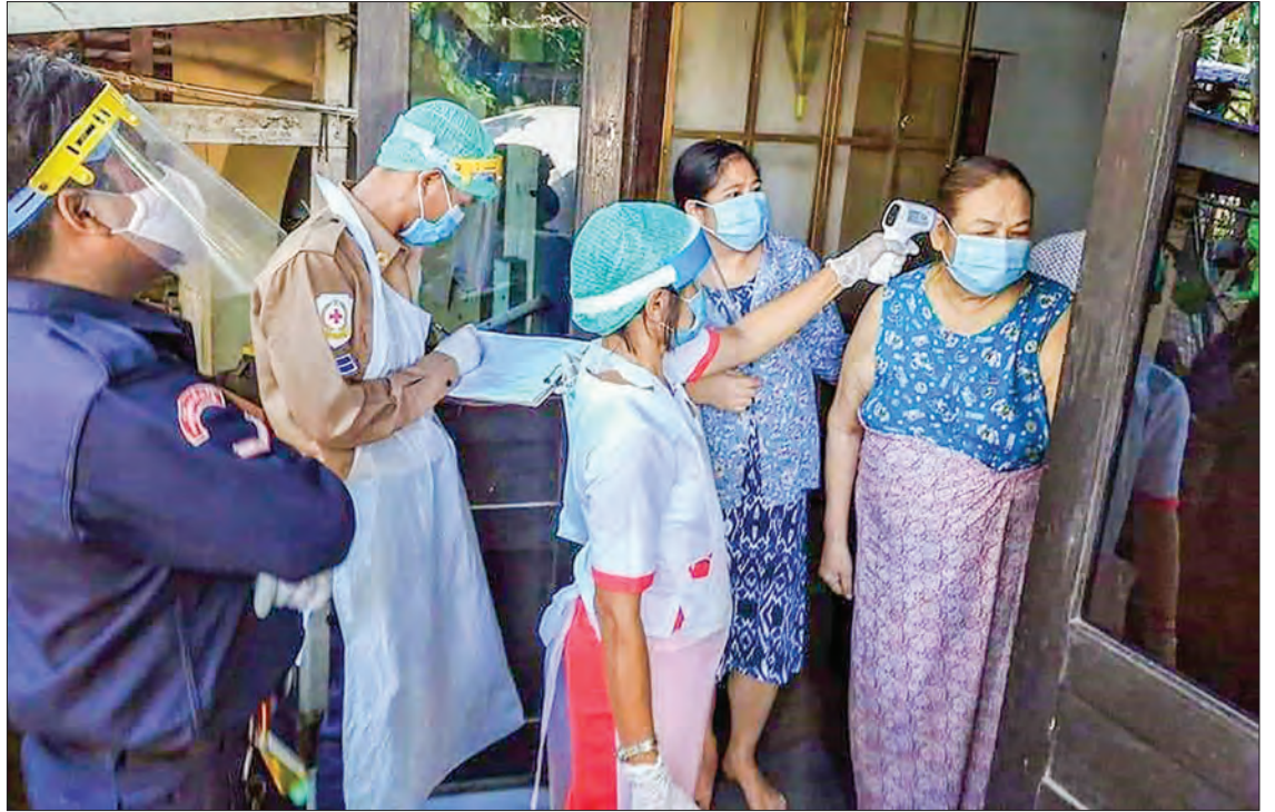
Health workers conduct medical tests in a suburban area of Yangon.

There are 29 wards in Hlinethaya Township. Over 700,000 people are living in these wards