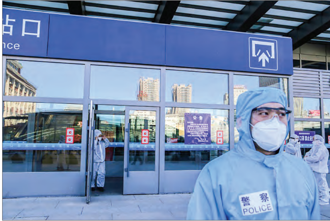
Police officers wearing protective suits stand outside Jilin railway station after the Chinese city partially shut its borders and cut off transport links after the emergence of a local coronavirus cluster.

A cluster of infections was reported in the suburb of Shulan over the weekend, with Jilin's vice mayor warning Wednesday that