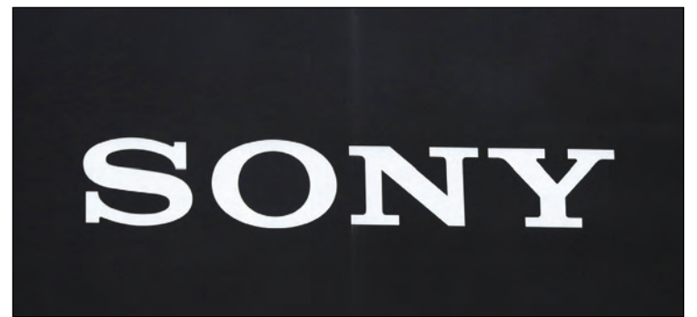
File photo taken on 1 March 2019, shows the logo of Japanese electronics and entertainment company Sony Corp. on its signboard in Tokyo’s Chuo Ward.

The Chilean economy grew 1.1 per cent in 2019, the poorest performance in a decade mainly due to social upheaval that disrupted productivity in the fourth quarter last year. — Xinhua ■