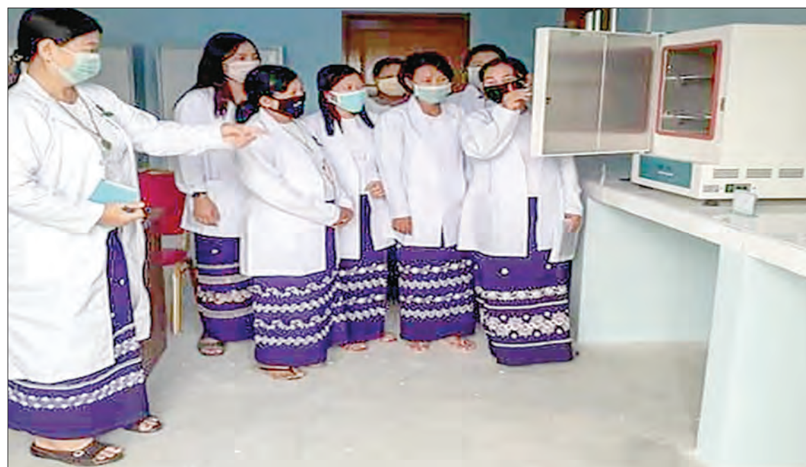
The soil laboratory in Nandawun Ward in Monywa, Sagaing Region.