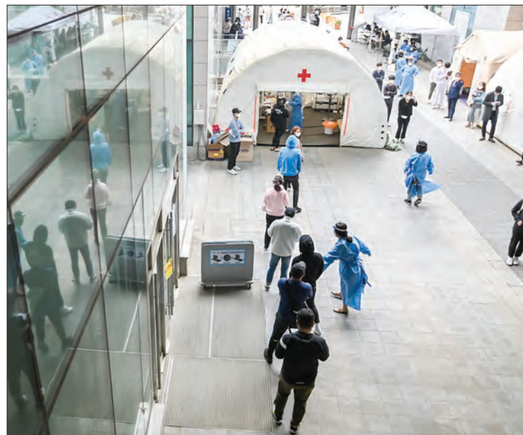
People wait in line to take tests for the COVID-19 coronavirus at a virus testing station in the nightlife district of Itaewon in Seoul on 12 May 2020.

will return to competitive action for the first time in months after the coronavirus shutdown when three of the world's top 10 women tee off in South Korea on Thursday.