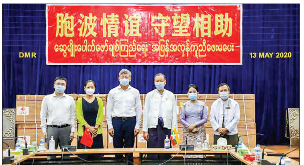
Chinese Ambassador hands over medical supplies for COVID-19 to Myanmar.