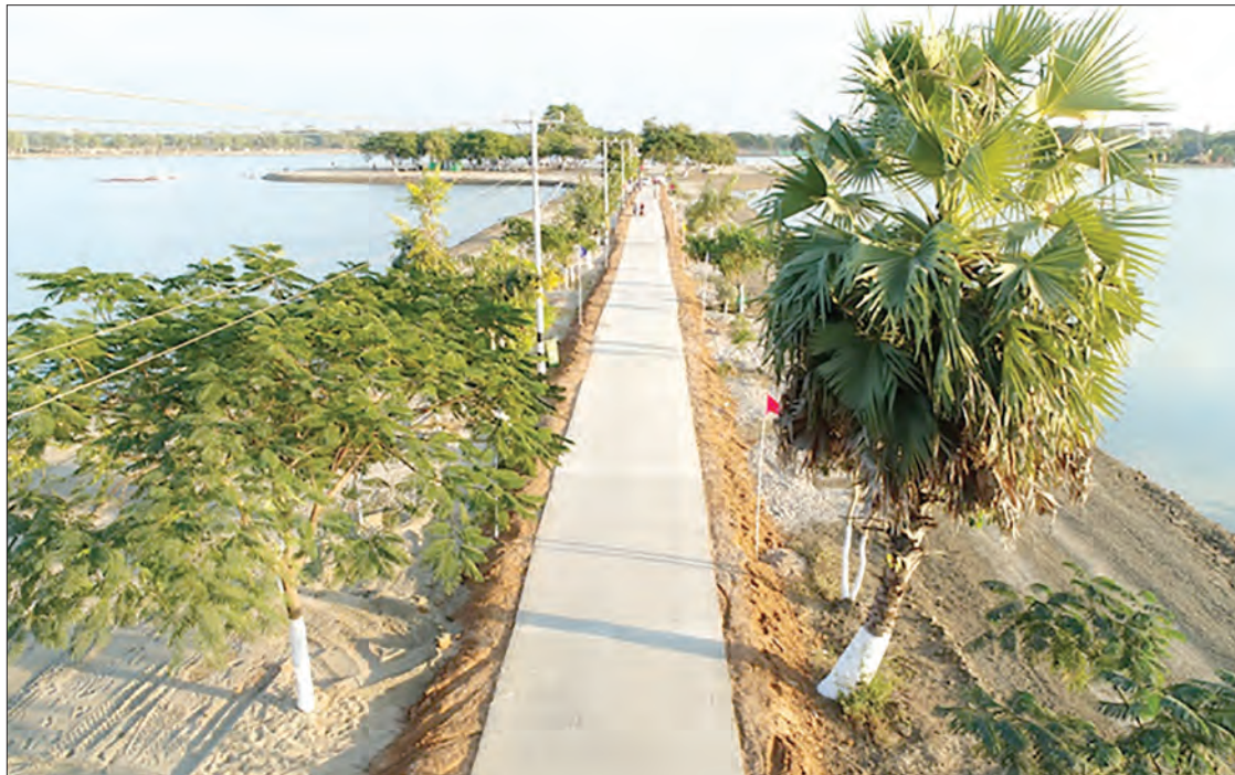
Kanthayar Lake in Monywa has been upgraded with scenic surrounding in the fourth-year period of the Sagaing Region Government.

Moreover, the imported machinery for the investment will