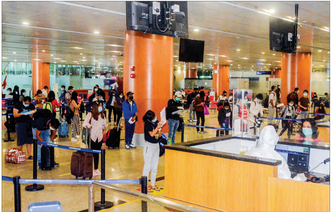
Myanmar citizens landed at Yangon International Airport by 3 rd relief flight from Singapore yesterday afternoon.