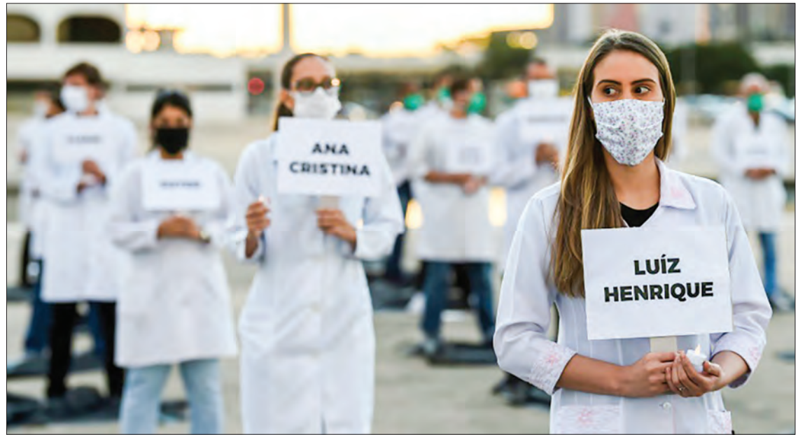
Brazilian nurses honour health workers who have died of the coronavirus at a demonstration in Brasilia.

On Tuesday the US registered 1,894 coronavirus deaths in 24 hours, a steep rise after daily tolls fell below 1,000 on Sunday