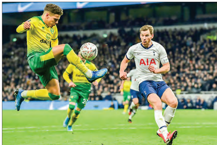
Norwich's sporting director says Championship clubs should not be promoted if their season cannot finish.

Premier League clubs hope to resume training next week while observing social distancing but the lower leagues remain in a state of flux. A number of lower-division teams have furloughed their players to save money during health crisis. An English Football League board meeting is set for Wednesday to discuss how to finish the season, followed by talks between all 24 Championship clubs. — AFP ■