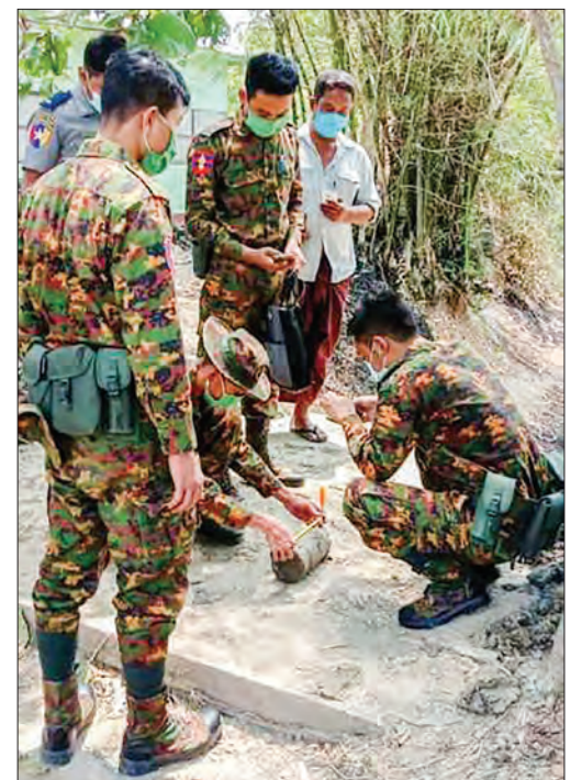
Military personnel and police members are inspecting an old bomb found in Pyawbwegyi Sanpya Village of Dala township.