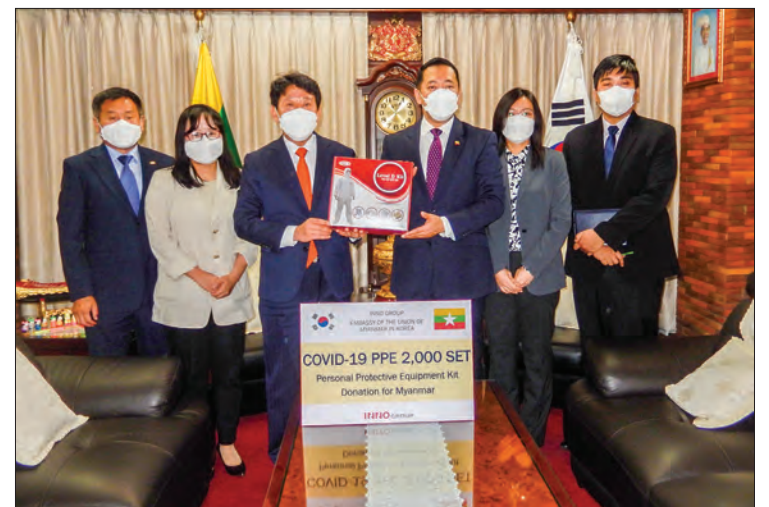
Korea INNO Group gives 2,000 kits of Level D PPE to Myanmar.