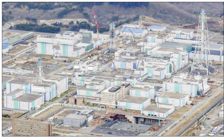
File photo taken from a Kyodo News helicopter on April 24, 2020, shows a spent nuclear fuel reprocessing plant in Rokkasho, Aomori Prefecture, northeastern Japan.

TOKYO—Nuclear regulators on Wednesday said a trouble-plagued fuel reprocessing plant in northeastern Japan has passed safety checks, bringing it a step closer to beginning operations after more than two decades in limbo.