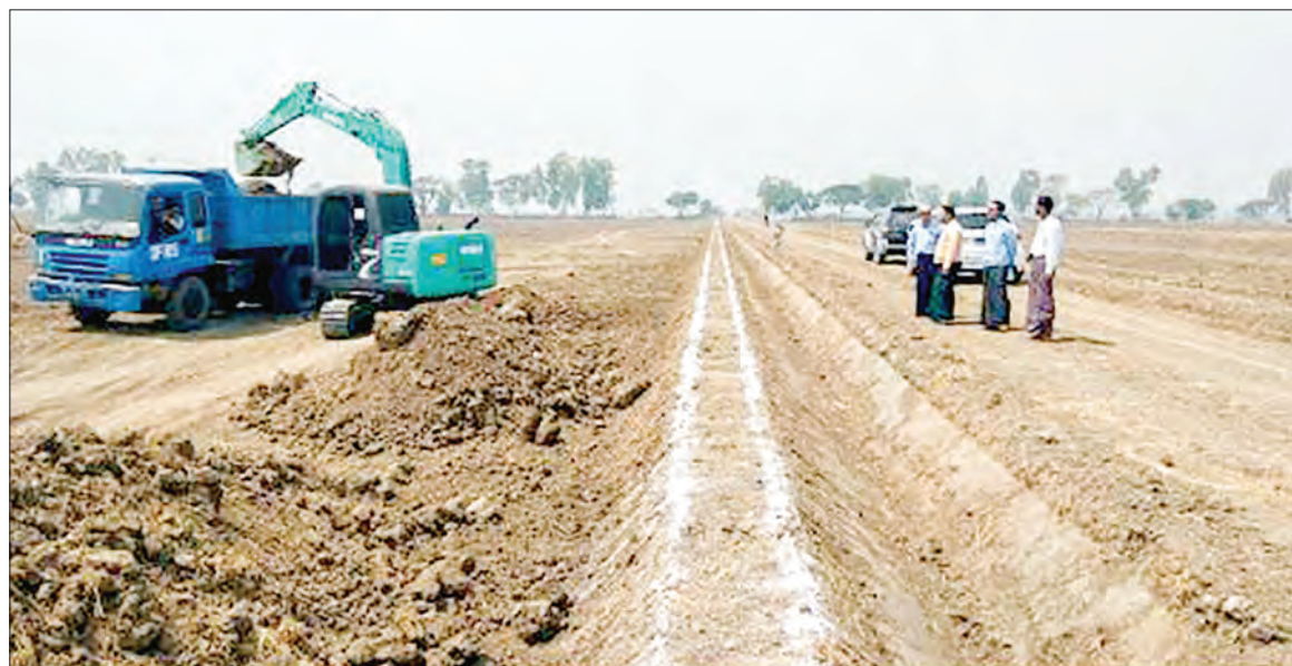
Sagaing Region authorities inspect digging drainage channel through a field.

A: During the fourth-year period, we continued the three guiding policy such as that of the agriculture and the animal breeding sectors being given priority for more development; that of the communication and electricity supply; and that of the development of