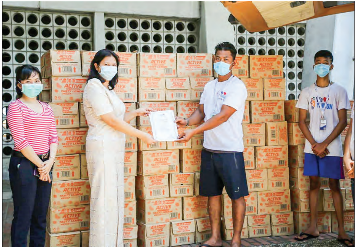
A member of We Love Yangon Group presents back the certificate of honour to an official from the donor organizations.

3,600 bottles of 100 Plus Active (Non-Carbonated) Testy Lemon at the Thuwunna Stadium in Yangon yesterday. — Kyaw Khin ■