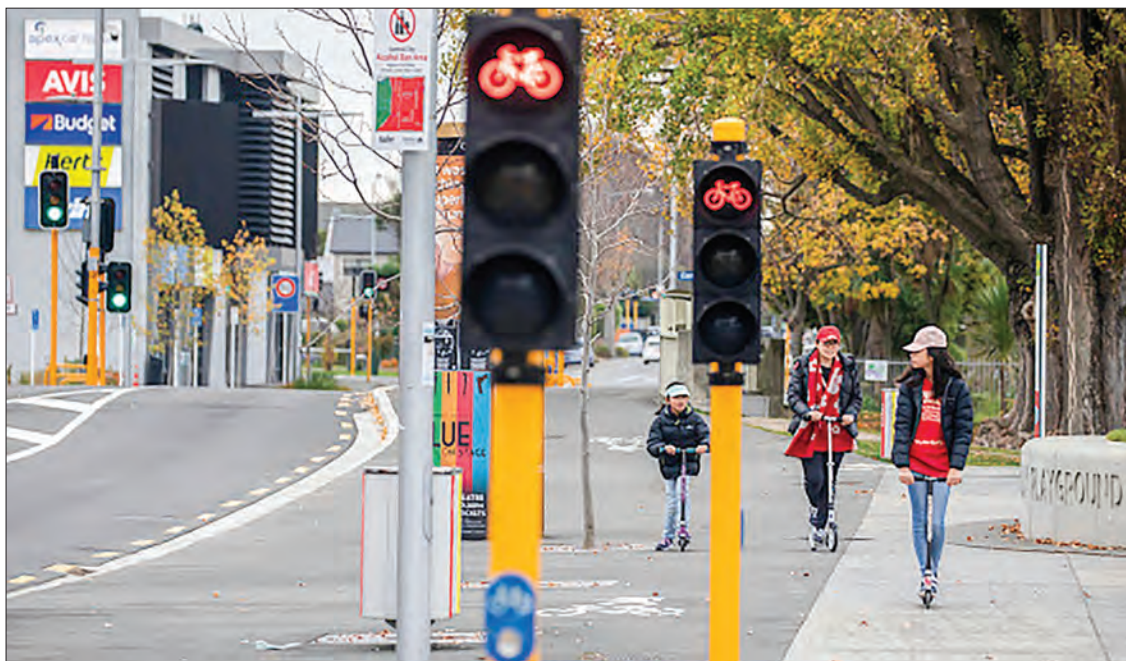
A woman and two girls ride kick scooters beside a deserted road ahead country shift to COVID-19 alert level 2, in Christchurch, New Zealand, on 13 May, 2020.

The partial lifting of restrictions comes despite concern over Britain's death toll from the virus — the second highest in the world — and confusion about the new rules.