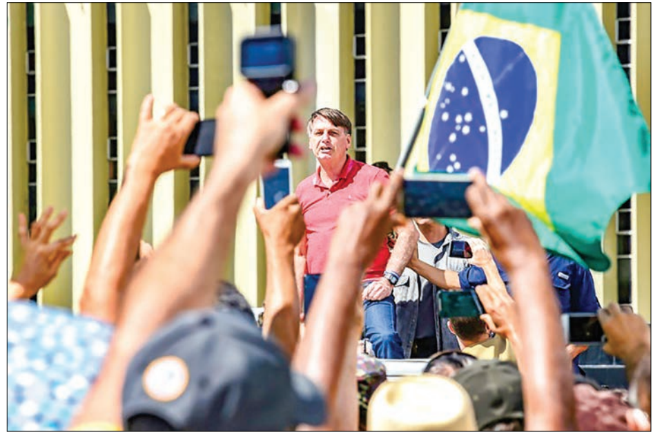
President Jair Bolsonaro has sometimes joined his supporters protesting against quarantine and social distancing measures to combat the new coronavirus outbreak.

“We know from history that anytime there’s such a cacophony in a situation like this, such huge disagreement on