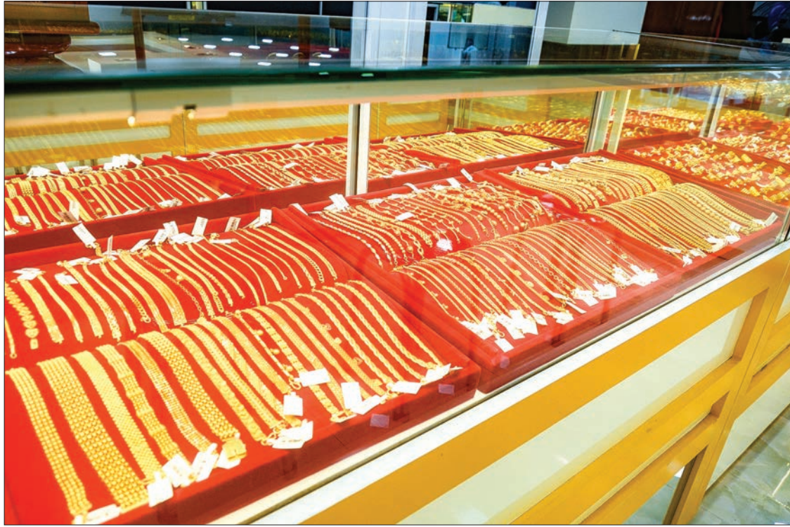
The gold necklaces being displayed at a gold shop in Yangon.

"We met with the Bureau of Special Investigation, township administrator and director of the related departments. For now, the market is expected to reopen on 16 May after extended precautionary restriction period until 15 May by the Committee on Prevention, Control and Treatment of New Coronavirus 2019 will ease. The association will call for the executive meeting on the morning of 16 May. We will ensure mandatory health