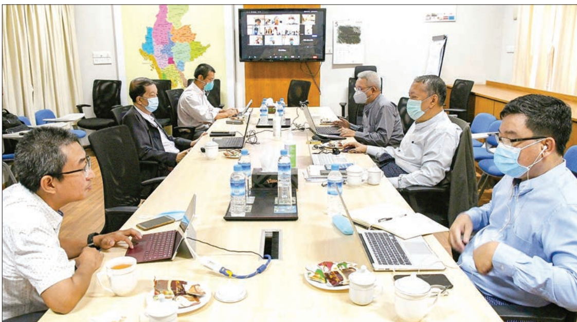
Government coordination committee holds discussions with New Mon State Party on COVID-19 measures

THE New Mon State Party made an agreement to work together with the government on the