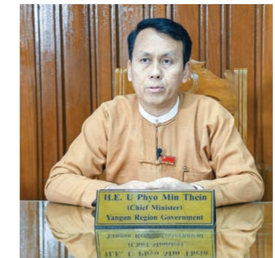
Yangon Region Chief Minister U Phyo Min Thein.

The regional government is working hard to implement 100 per cent electrification across Yangon Region in 2020 and improve the socioeconomic situation of rural areas. The self-help electrification programme was