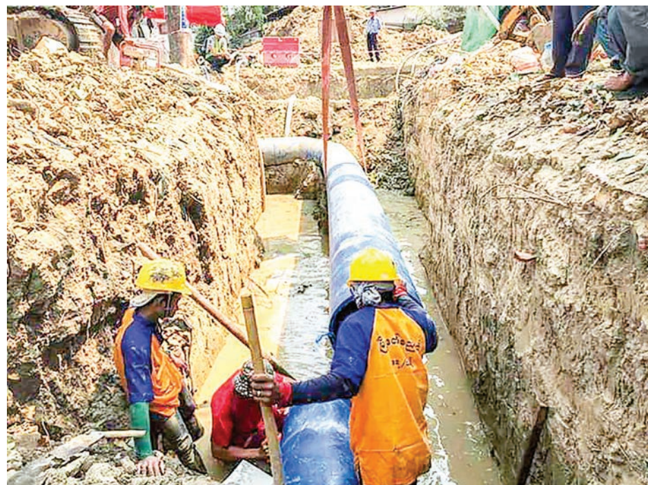
Yangon City Development Committee’s workers laying water pipeline to the Eco Green City.

The regional chief minister said systematically relocating squatters helps to fulfill the labour pool requirements in industrial zones and preserve the integrity of fire safety and water safety there as well. He said dense populations of squatters are a fire hazard and they also clog up the sewers, responsible for creating floods in the rainy season.