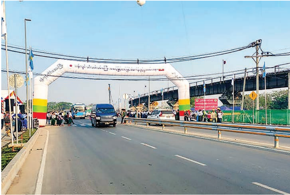
The view of the new Thanlyin-Thilawa Road in Yangon Region.