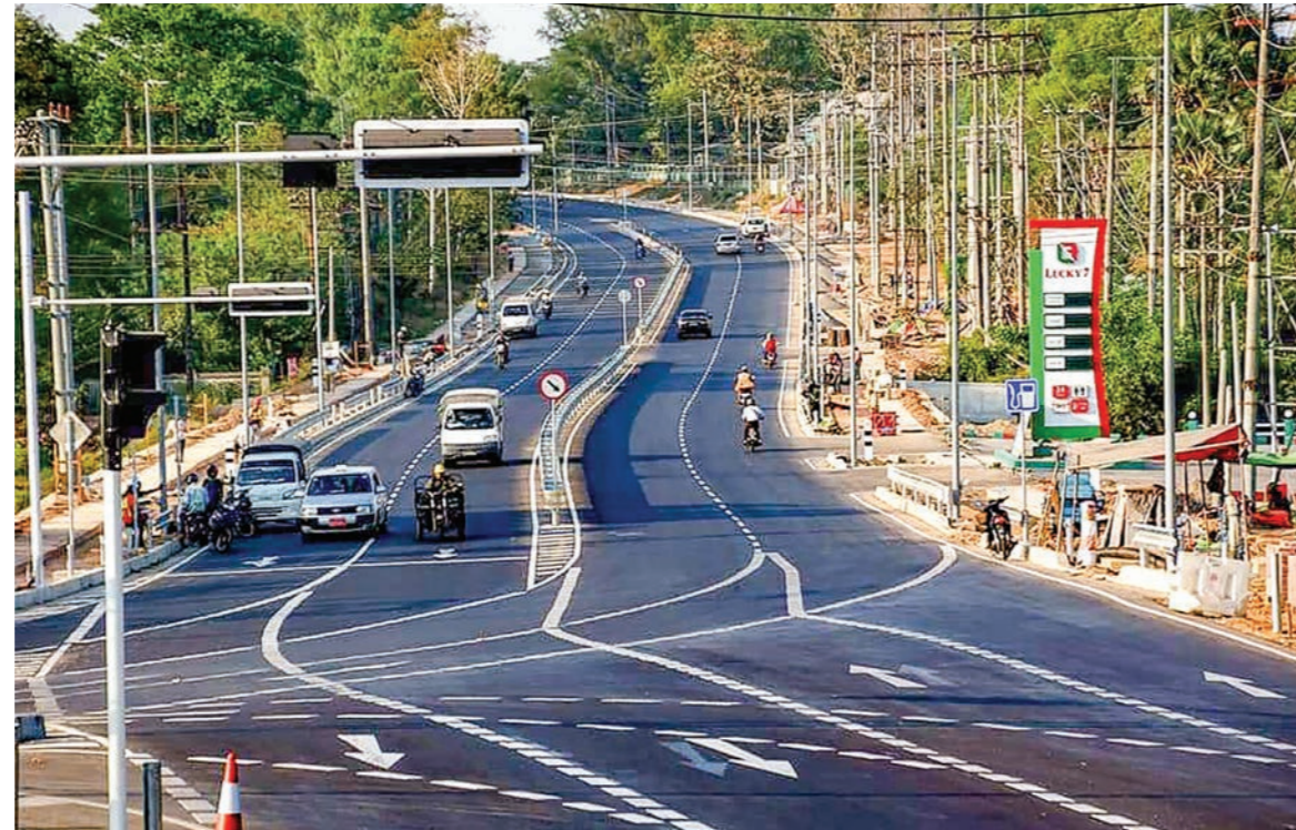
The Thanlyin-Thilawa Road in Yangon.

The Yangon Region government is collaborating with the Japan International Cooperation Agency (JICA) to assess septic tanks in back alleys, working together with Clean Yangon and Doh Eain enterprise in restora-