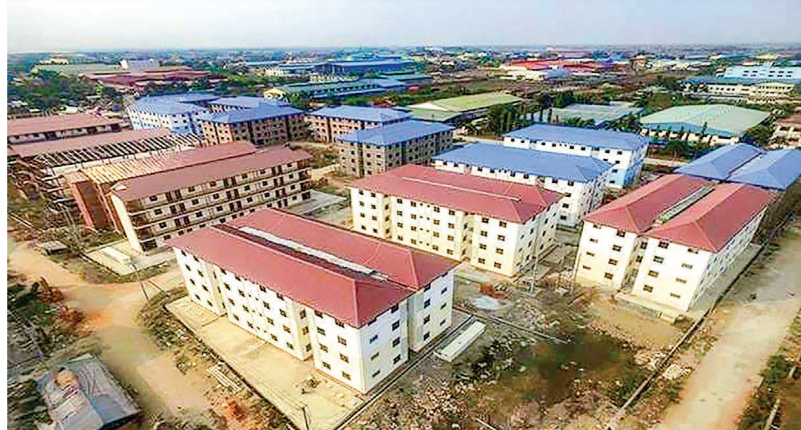
The aerial view of Kanaung low-cost housing in Yangon.

Yangon Region is located at the intersection of the Yangon River, Bago River and Nga Moe Yeik River. An initial survey is being conducted to install a pump system to drain the rising tide and in-