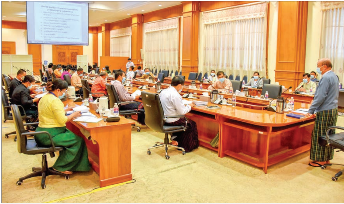
Pyidaungsu Hluttaw Deputy Speaker U Tun Tun Hein chaired the Pyidaungsu Hluttaw Joint Bill Committee meeting in Nay Pyi Taw yesterday.