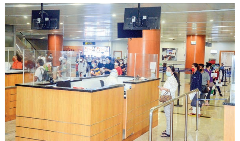
Second group of Myanmar citizens from Thailand arrived at Yangon International Airport by a relief flight yesterday.

In accordance with the directives of National-Level Central Committee on Prevention, Control and Treatment of Coronavirus Disease 2019 (COVID-19), the Ministry of Foreign Affairs, in coordination with the Myanmar embassy in Bangkok and other relevant ministries in Myanmar, arranged the first relief flight for 135 citizens on 6 May, totalling 202 persons from the Kingdom.—MNA (Translated by Aung Khin)