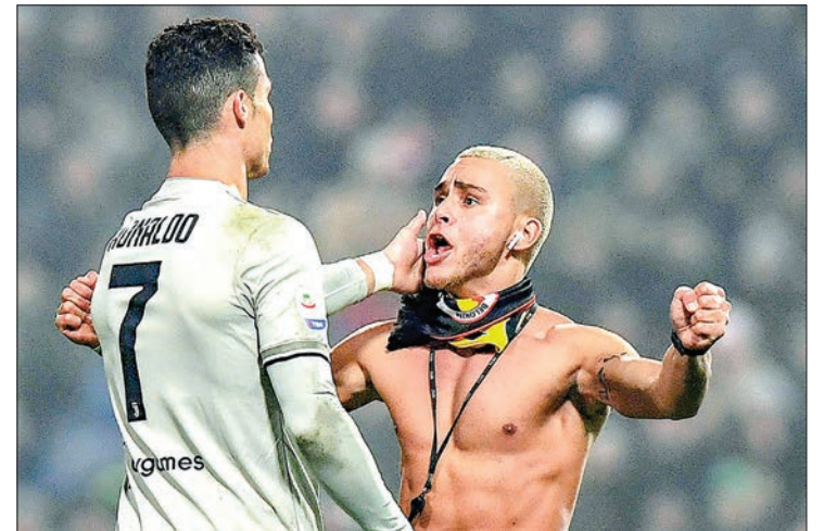
A spectator (right) who emerged on the pitch comes face to face with Juventus forward Cristiano Ronaldo (left) during the Italian Serie A soccer match between Sassuolo and Juventus at the Mapei Stadium-Citta del Tricolore stadium in Reggio Emilia, Italy on Feb. 10.