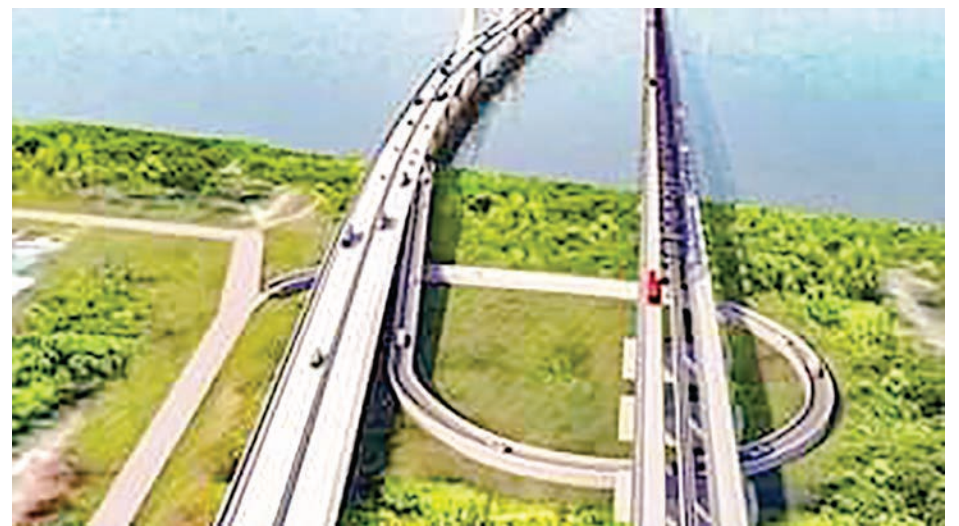
The aerial view of the Bago River-crossing Bridge.

In addition, construction on Bago River Bridge (3) has begun and will connect Yangon and Thanlyin to support Thilawa Special Economic Zone. An important bridge to Dala is also being constructed in order to simultaneously implement regional development in Dala Township.