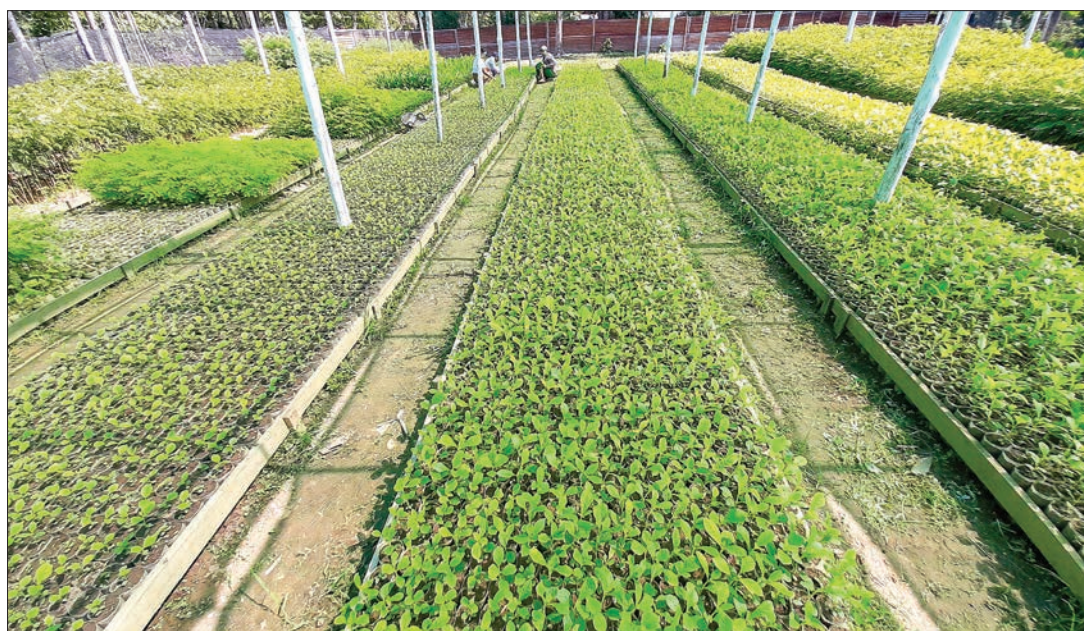
Planting of perennial crops and decorating trees are seen before being in Mong Hpyak Township.