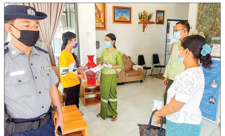
Officials inspect a hotel in Myawady on 10 May and found foreigners stranded at the border town due to suspension of airlines and closure of border checkpoints amid COVID-19.