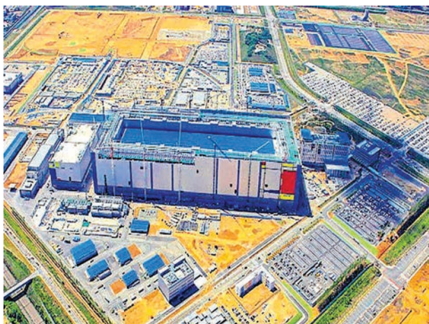
Citing security reasons, Japan last July placed new restrictions on exports of three key materials needed by South Korean companies to produce semiconductors and display panels. A file aerial photo of Samsung's new semiconductor plant in Pyeongtaek, South Korea.

SEOUL — South Korea's Trade, Industry, and Energy Ministry on Tuesday renewed calls for Japan to lift trade restrictions it imposed last year against