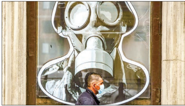
Russia has the fourth highest number of coronavirus cases globally after the United States, Spain and the United Kingdom.

MOSCOW — President Vladimir Putin on Monday said stay-at-home orders for most workers in Russia would end this week even as the country registered a record increase in new coronavirus infections.