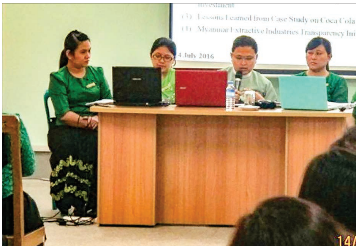
The internal seminar on Responsible Investment was conducted at the office of Directorate of Investment and Company Administration in Yangon at (14:00) pm on 14 th July, 2016. That meeting was attended by officials led by Deputy Director-General.

first guideline. The OECD guidelines mentioned that enterprises should ensure that timely and accurate information is disclosed on all material matters regard-