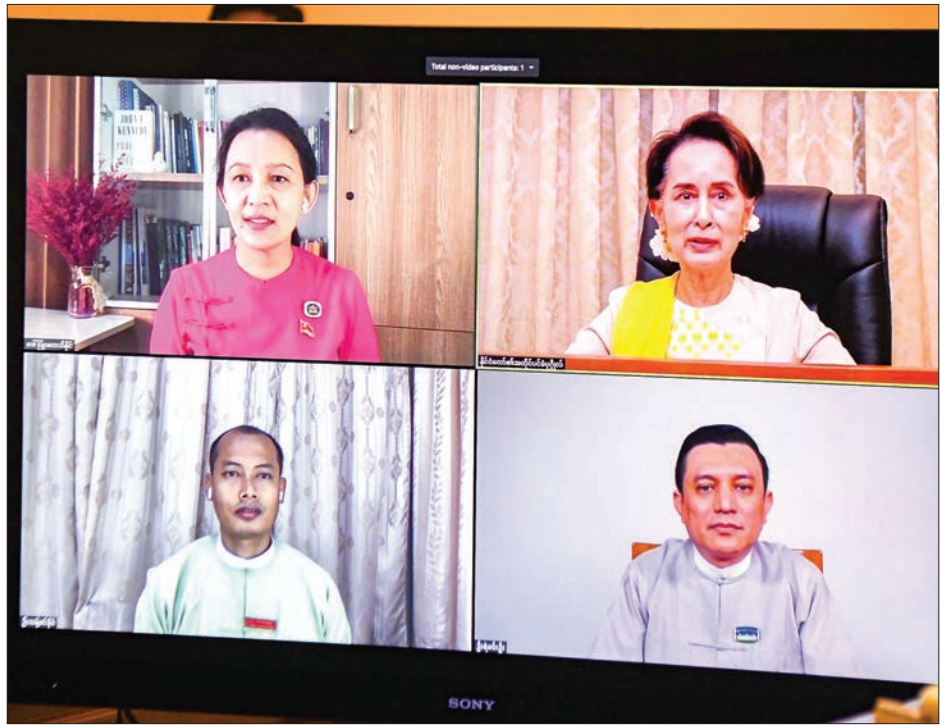
State Counsellor Daw Aung San Suu Kyi holds video conference on management of market places with officials and Hluttaw MP yesterday.

STATE Counsellor Daw Aung San Suu Kyi held a video conference yesterday from the Presidential Palace in Nay Pyi Taw, to discuss managing the market places during the COVID-19 period.