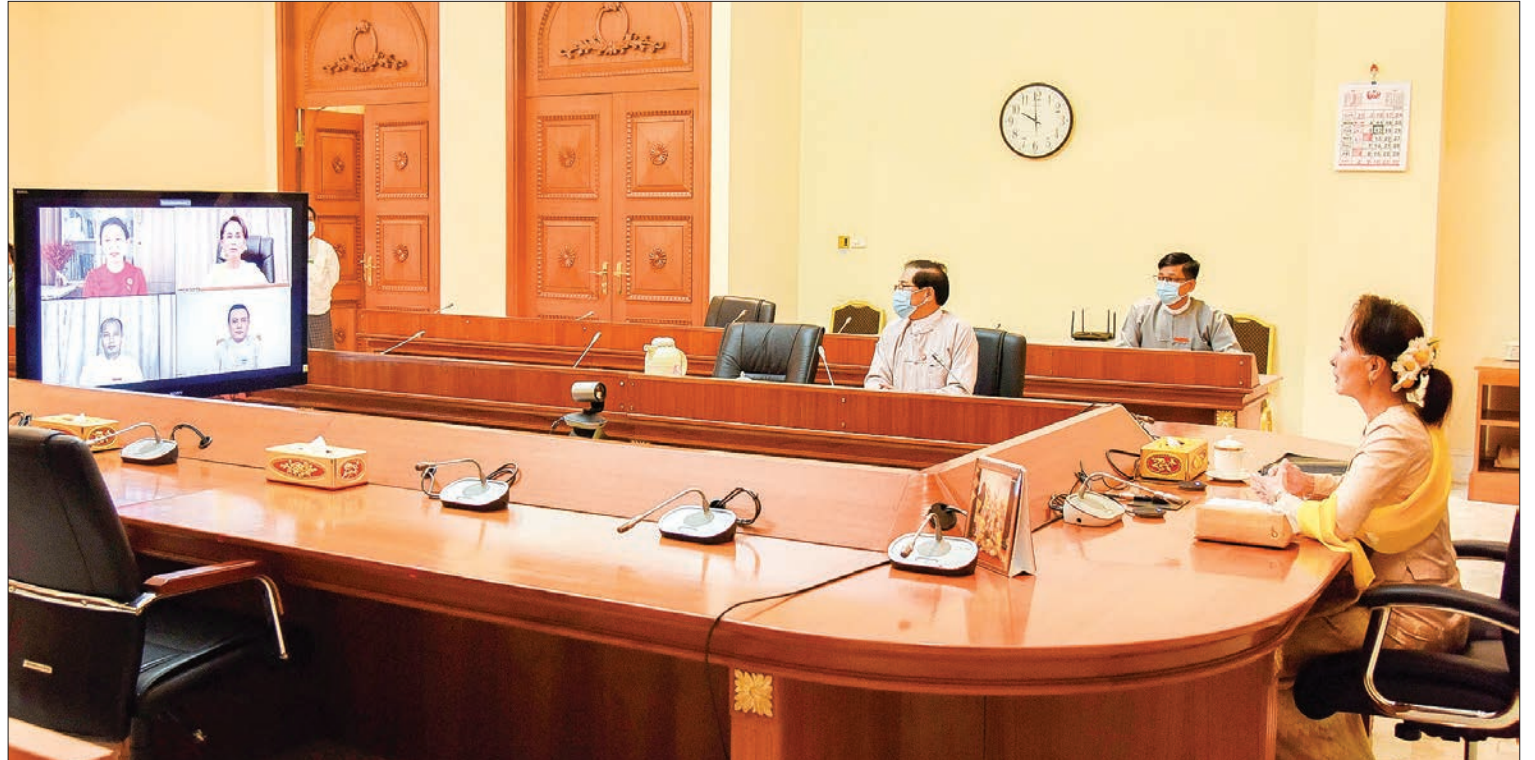
State Counsellor Daw Aung San Suu Kyi holds video conference on management of market places with officials and Hluttaw MP yesterday.

In her concluding remarks the State Counsellor said she wanted everyone to think of pragmatic ways to adapt to a new way of living for the long-term; those new ways could be found from experiences; endurance was the main factor to enter a long-term battle; to have endurance hope