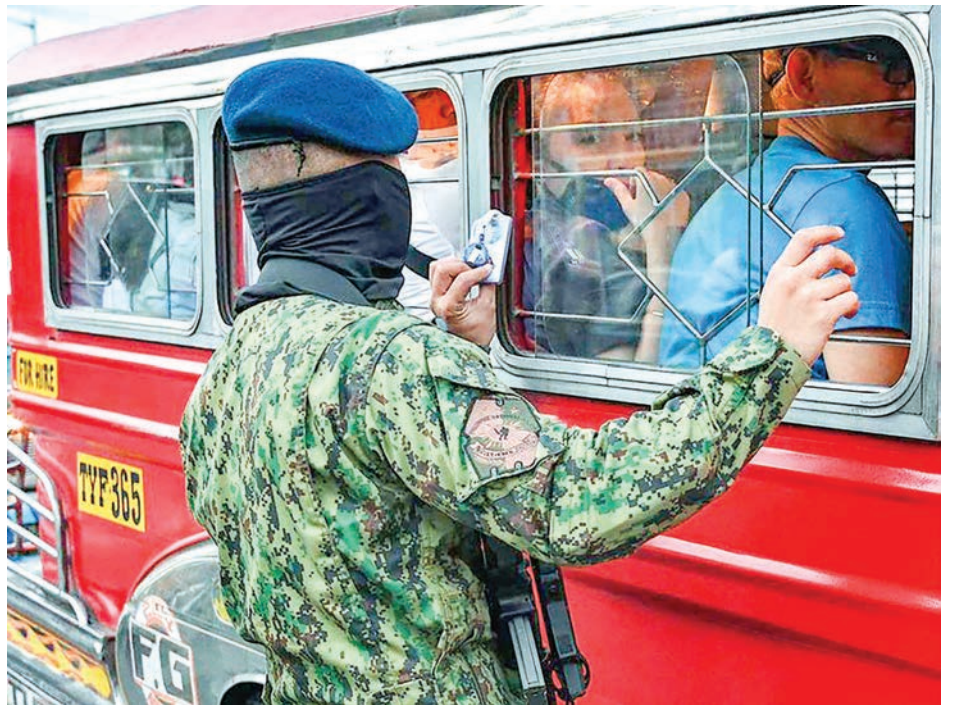
SLASH LOADS: The government ordered buses, taxis and city trains to slash loads so each passenger would be a seat apart from the next, with people running fevers not allowed to board.

Duterte, in a statement issued earlier, cautioned that the envisioned easing would not mean COVID-19, the respiratory disease caused by the new coronavirus, has disappeared. The president also stressed that the nation could not afford another wave of infection. Roque said Tuesday that more movements of people will be allowed in the other areas of Luzon, where quarantine protocols will be relaxed.—Kyodo ■