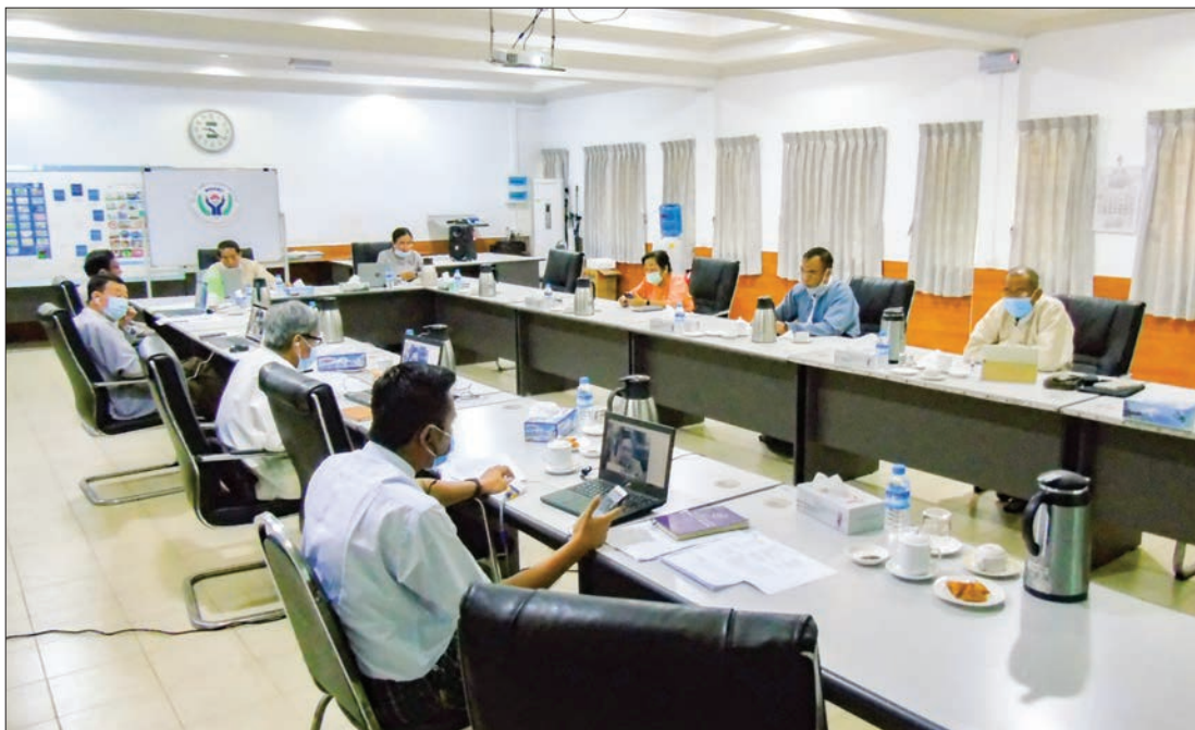
The 1 st work group meeting of the South East Asia National Human Rights Institutions Forum (SEANF) was held on video conferencing.

THE South East Asia National Human Rights Institutions Forum (SEANF) is holding its 1 st work group meeting under the 2020 rotating chairmanship of Indonesia from 12 to 14 May.