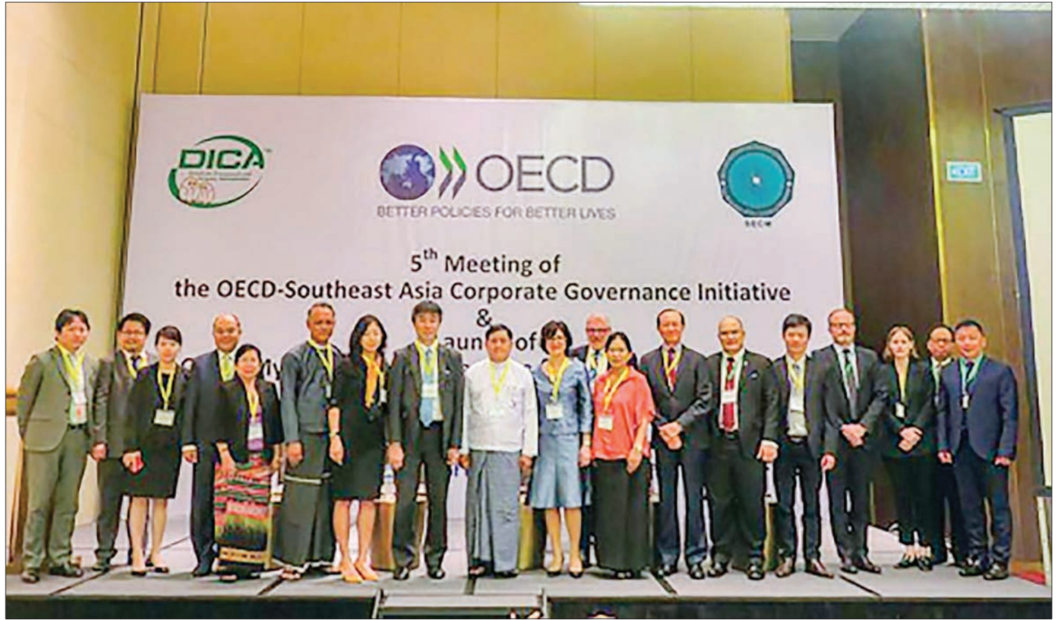
The Fifth Meeting of OECD-Southeast Asia Corporate Governance Initiative was held at Pan Pacific Yangon Hotel on 28 March 2018 with the collaboration of the Directorate of Investment & Company Administration, Ministry of Planning & Finance, Securities and Exchange Commission of Myanmar (SECM), OECD and the Government of Japan.

Today's global countries recognize the aforesaid basic