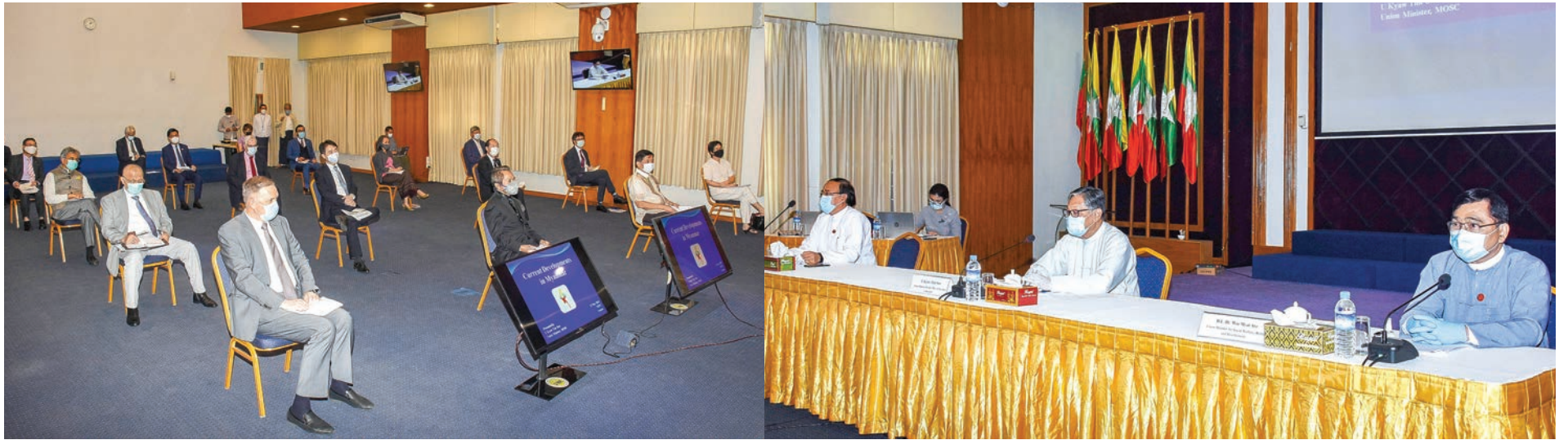
Union Ministers met with foreign missions and delegations at the National Reconciliation and Peace Centre in Yangon yestersay to inform the ongoing works of Myanmar government.