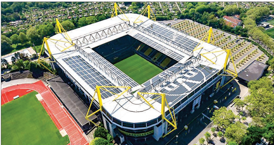
German fans are being warned to stay away and authorities have warned matches could be halted if too many supporters gather outside the grounds.

But there remain issues to be decided such as the quarantine of players in case of positive tests for coronavirus. —AFP