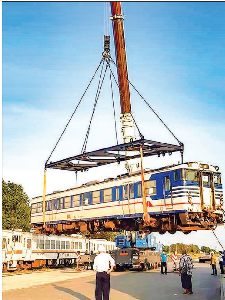
RBE 21 coaches are seen unloading from the ship at Yangon Thilawa Port.

RBE 21 coaches, which were donated by Japan, arrived in Yangon Thilawa Port. These coaches, which had run in Japan, will operate on Yangon circular railway, according to Myanmar Railway (MR).