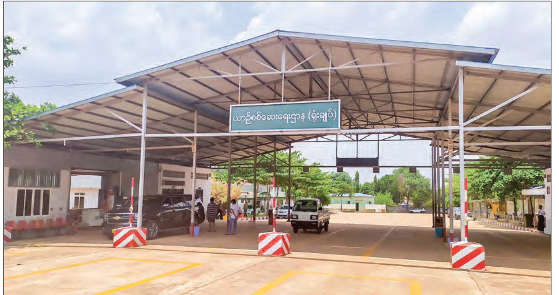
Vehicles are being checked at the vehicle inspection department (head office) in Yangon.

The department will grant relief and not consider the period from 26 March to 10