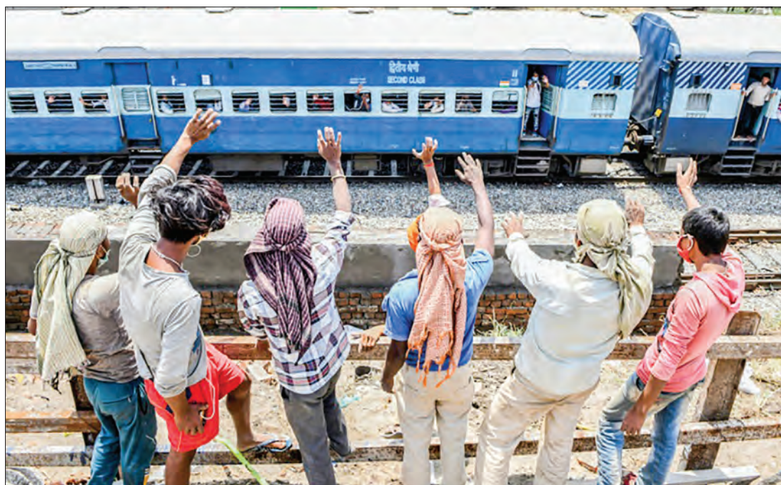
Since early May some 366 special trains in India have operated to help stranded rural migrant workers who lost their city jobs return home.

NEW DELHI — One of the world's largest train networks will "gradually" restart operations from Tuesday as India eases its coronavirus lockdown, as the number of cases passed 60,000 with more than 2,000 deaths.