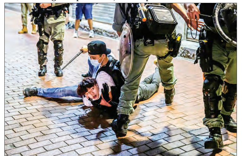
Many of Hong Kong's protesters are youngsters.

In an interview with pro-government Ta Kung Pao newspaper published Monday, Lam described the current secondary school programme as a "chicken coop without a roof" and said her government would soon unveil their plans.—AFP ■ "In terms