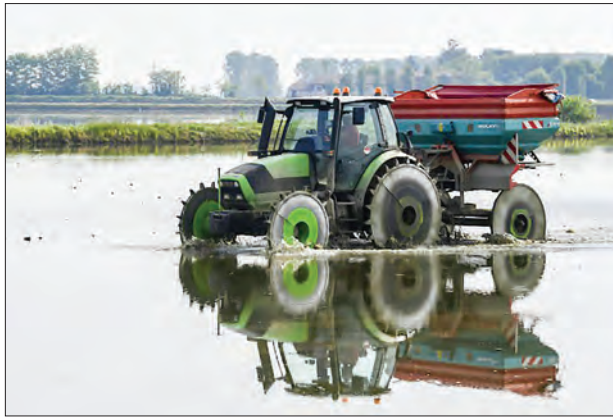
Such has been the demand for rice at home — never mind from China — that fellow Italian staple pasta has been left in the shade in recent weeks.