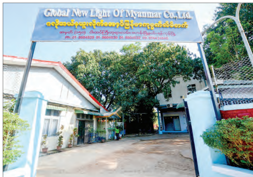
The Global New Light of Myanmar Press in Bahan Township, Yangon.