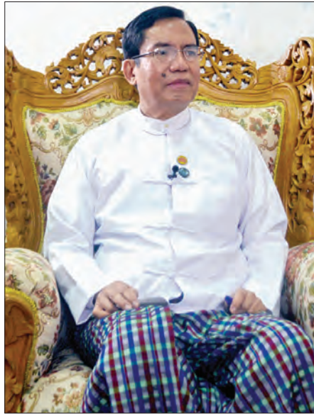
U Aung Hla Tun (Deputy Minister)

A: Total of (16) IPRD offices have been selected and upgraded with the cooperation of Daw Khin Kyi Foundation, where knowledge sharing programmes are implemented using mobile library and computer training courses. The Daw Khin Kyi Foundation has entrusted knowledge related items and expertise worth MMK (1,000) millions including (17) mobile libraries, computers and books on 15 September 2019.