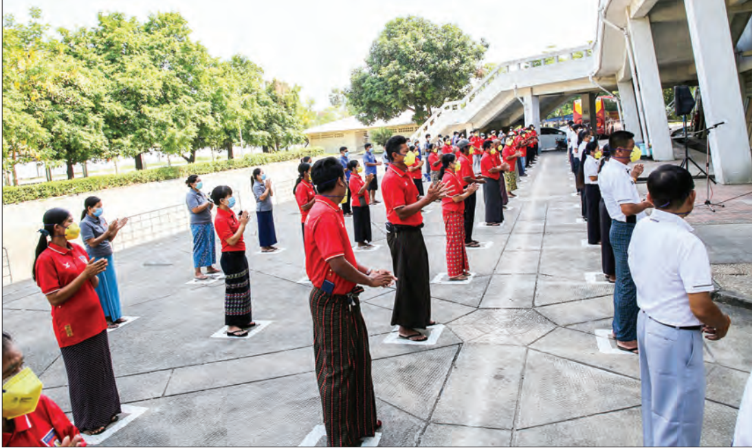
Staff and coaches of Myanmar Football Federation waiting for receiving donated foodstuffs at the Thuwunna Stadium in Yangon on 11 May 2020.