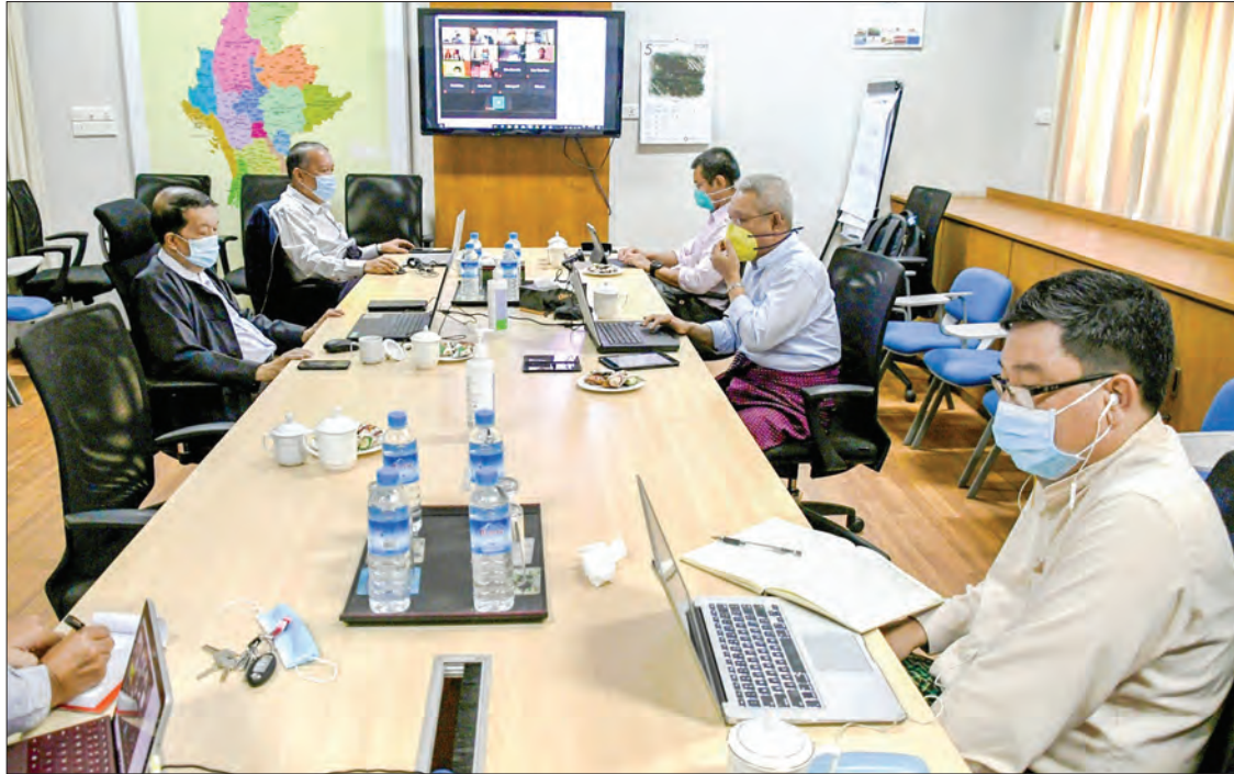
Representatives of government and ethnic armed organizations discuss solutions to challenges and obstacles in carrying out COVID-19 measures.

He said they briefly discussed forming a joint-committee related to international assistance and the World Bank and options thought up by the