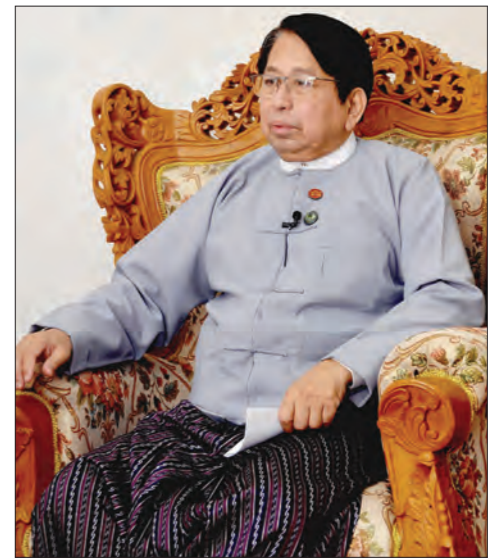
Dr Pe Myint (Union Minister)

UNESCO and other similar bodies are doing its job in media ethics. The responsible authorities for the Facebook are also curbing the fake news through the "Community Standard" system. Our MOI is also doing the same