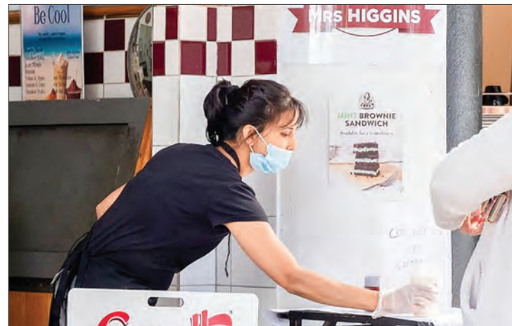
A woman (R) receives her order outside a small shop on the first day of the easing of restrictions in Wellington on 28 April, 2020, following the COVID-19 coronavirus outbreak.

While social distancing must still be followed, the advice that people isolate themselves at home and "stick to your bubble" will no longer apply.—AFP ■