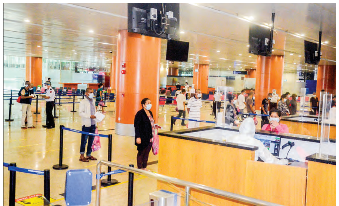
Former Myanmar detainees arrived at Yangon International Airport by Malaysia Airlines yesterday.