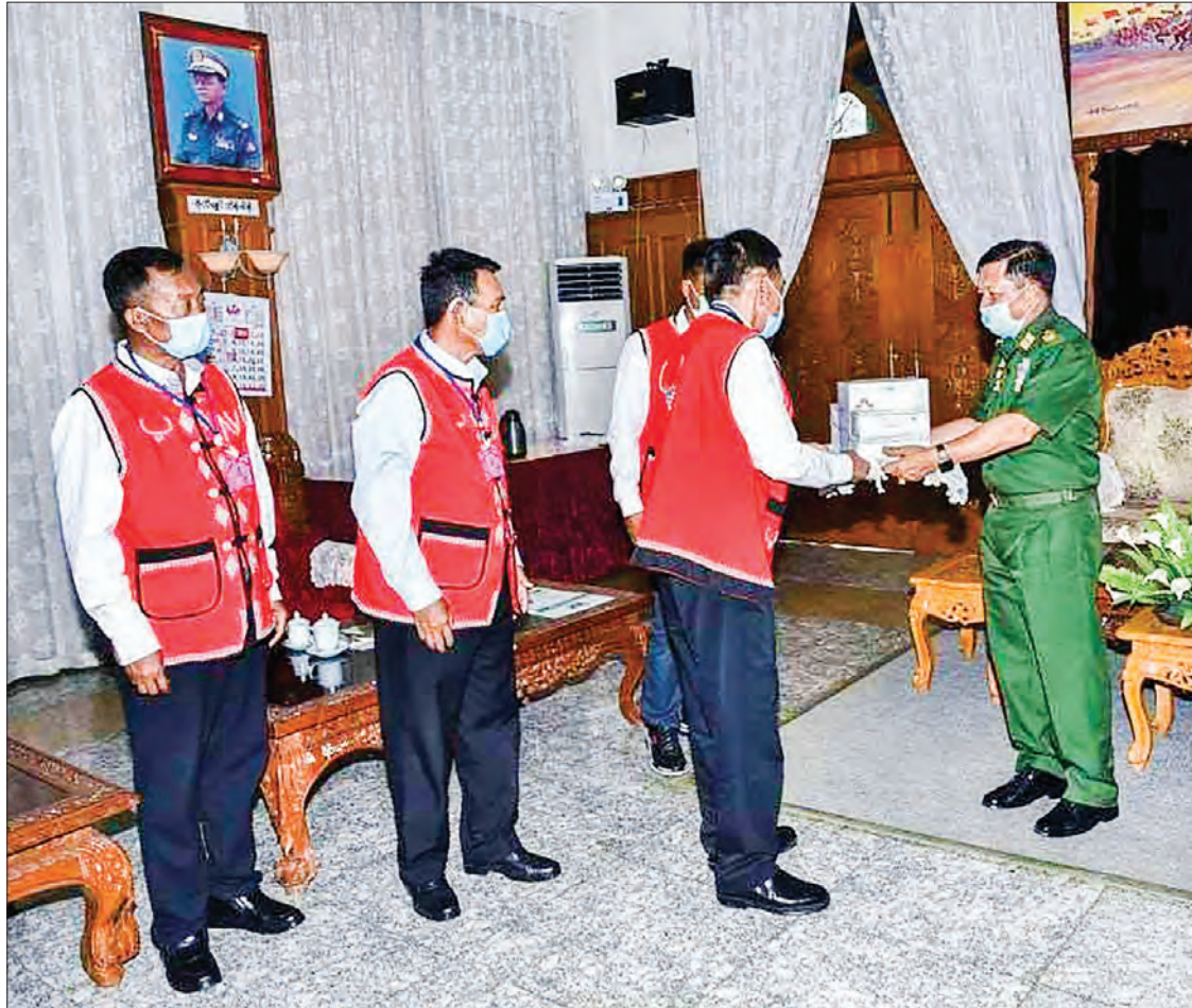
Senior General Min Aung Hlaing (r) presents medical supplies to a representative of Wa ethnic group at the headquarters of Golden Triangle Avenue of Triangle Region Command.

The Senior General and party also paid homage to Abhaya Raza Muni Buddha Image kept in the Buddha Park near Pankwe Village, about 15 miles southeast