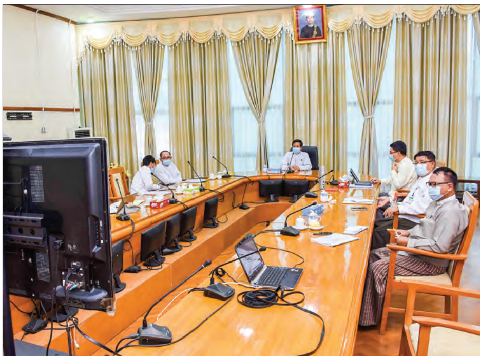
Deputy Minister for Commerce U Aung Htoo chaired a meeting on “Doing Business” cooperation.