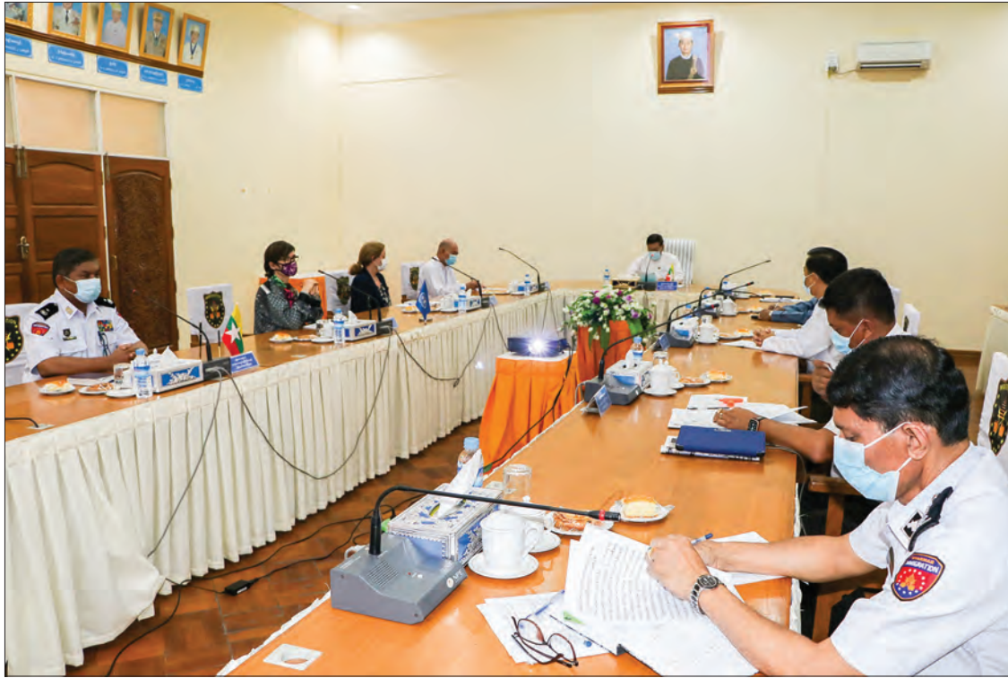
Union Minister for Labour, Immigration and Population U Thein Swe attends signing ceremony with UNDP, UNHCR to support for repatriation programmes in Rakhine State.

Union Minister U Thein Swe said that the MoLIP, the UNDP and the UNHCR signed an MoU on 6 June 2018 for supporting repatriation programme of IDPs