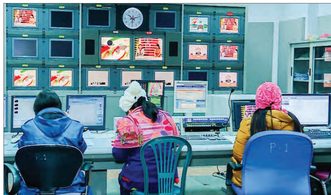
MRTV's engineers working in production control room.