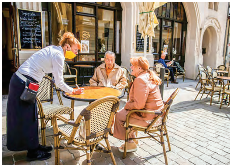
Most shops and playgrounds have reopened in Germany, children are gradually returning to classrooms and states are to varying degrees reopening restaurants, gyms and places of worship.

BERLIN — Germany's coronavirus spread appears to be picking up speed again, official data showed Sunday, just days after Chancellor Angela Merkel said the country could gradually return to normal.