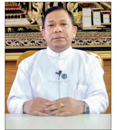
U Ye Naing (Director-General of MRTV)

A: Distribution of news in ethnic nationalities’ language is ongoing. In October 2019, we have distributed (4) pages news sup-