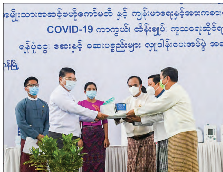
Private sector donates funds and medical supplies for measures against COVID-19.

At the ceremony, 12 well-wishers donated a total of K 2,593 million and US$ 11,400 worth of cash funds and medical supplies. Myanmar Gems and Jewellery Entrepreneurs Association donated K 2,100 million worth of 50,000 PPEs and eight accessories, Myanmar Shwe Nagar Agricultural Group Co., Ltd and China Merchants Group 4,000 PPEs, 4,000 glasses and 4,500 masks, and UPG Paint & Coating Co., Ltd six ventilators. Jade Mountain Gem Co., Ltd.