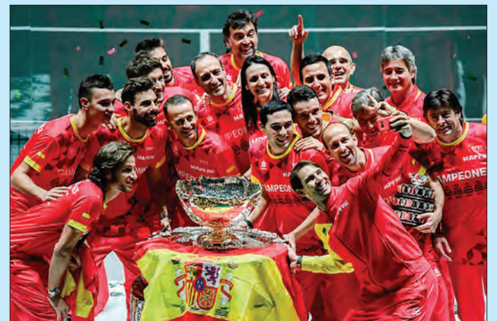
Champions: Rafael Nadal takes a selfie with teammates after Spain won the 2019 Davis Cup in Madrid.

BARCELONA—Barcelona football star Gerard Pique said Sunday he was "pessimistic" that the Davis Cup Finals, which his company finances, would be held in Madrid this year.