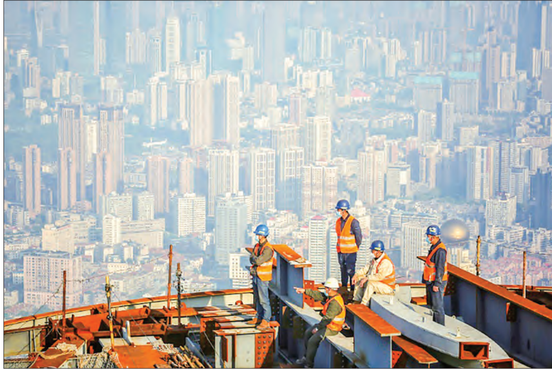
The deadly coronavirus first emerged in the central Chinese city of Wuhan late last year.

Authorities also issued stay-at-home orders and travel bans in Shulan, a city of around 670,000 people in northeastern China, after three new infections were confirmed there.