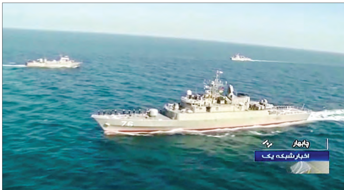
Iranian frigate "Jamaran" is seen during naval drills in December 2019.

The vessel had been towed ashore for "technical investigations", it said in a statement, calling on people to "avoid spec-