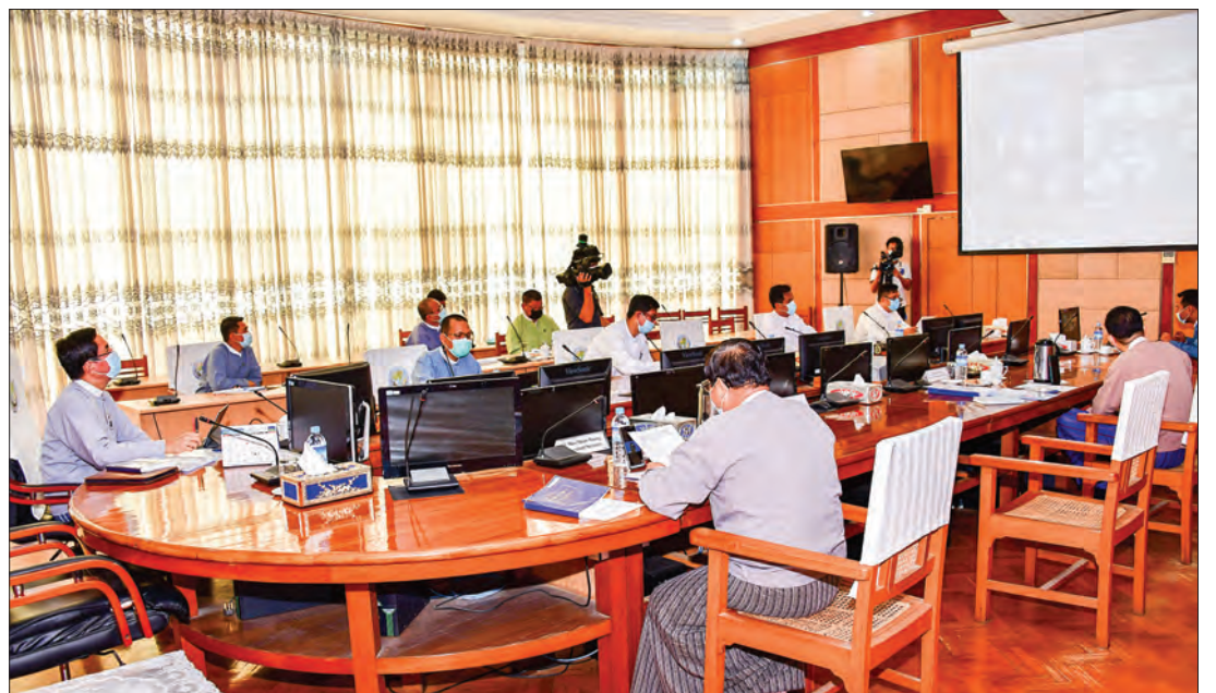
Deputy Minister for Information U Aung Hla Tun attends video conference checking on progress of production and distribution of schoolbooks in Nay Pyi Taw.

THE Ministry of Information and the Ministry of Education held the 2/2020 coordination meeting yesterday on the progress of production and distribution of schoolbooks for 2020-2021 academic year.