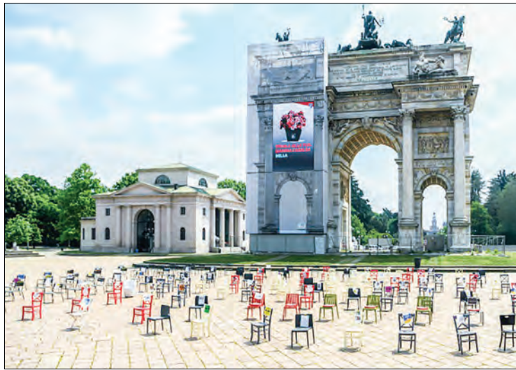
Italian output data make for grim reading.

The decline hit all sectors, "but the 50 per cent drop in transport equipment was just aston-