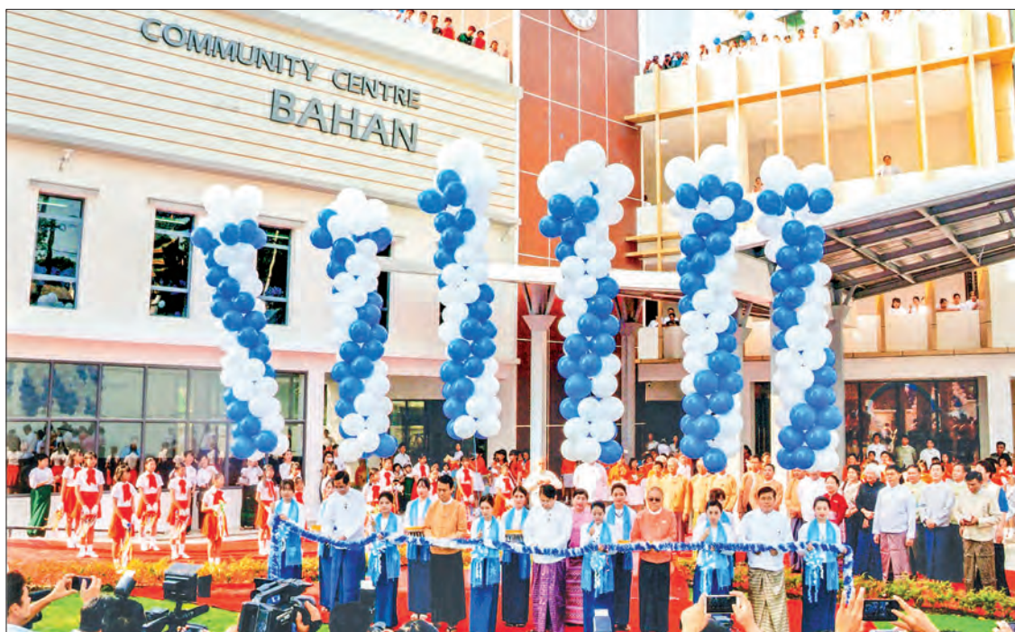
Union Minister Dr Pe Myint and Yangon Region Chief Minister U Phyo Min Thein, together with MOI senior officials, open Community Centre of Information and Public Relations Department in Bahan, Yangon.

A: At the moment news about COVID -19 pandemic are being submitted to the esteemed readers such as that of the news from the Ministry of Health and Sports; that of other ministries; that of interviews and roundtable talks; and that of news from foreign countries. All in all, we would try our best in fulfilling the needs of the people with new features and stays on with the reputation as People’s Newspapers.