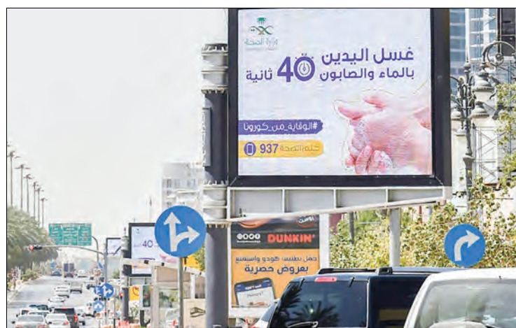
Saudi is raising VAT from 5 per cent to 15 per cent as the kingdom seeks to generate revenue due to the slump in oil prices.

In an apparent effort to sweeten the bitter pill, state energy giant Aramco slashed do-