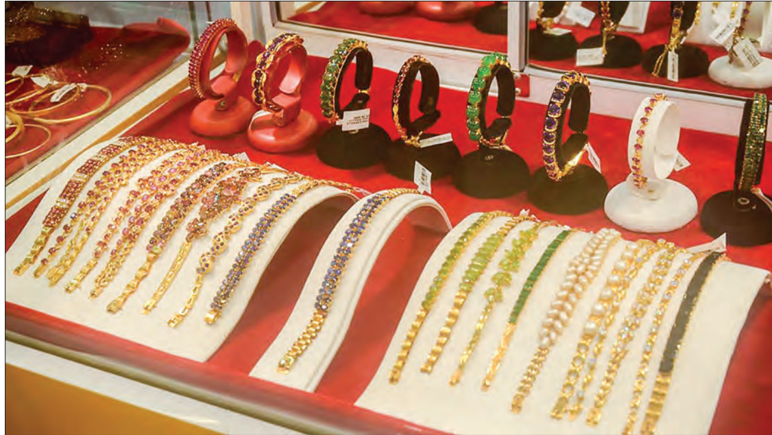
Gold jewellery on display at a shop in Yangon.

“If domestic gold would be priced at above K1.2 million per tical if it is evaluated on the