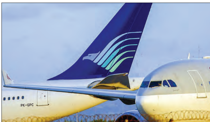
Garuda has temporarily cut salaries to help cope with an air travel slump sparked by the global pandemic.

State-controlled Garuda — which operates a fleet of more than 200 aircraft with its Citilink subsidiary — has temporarily