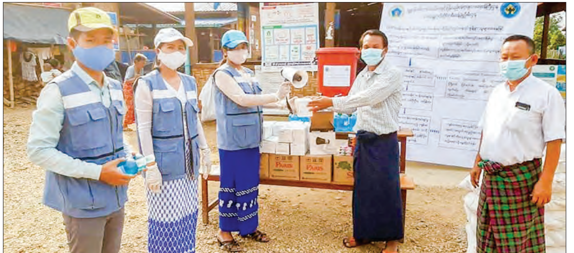
Officials from Ministry of Social Welfare, Relief and Resettlement distributes healthcare items to a person at an IDP camp.

The ministry also provided 10,600 cloth masks, 1,750 bottle of hand sanitizer, 30 bags of lime powder, 2 hand speakers and 2 memory sticks to the