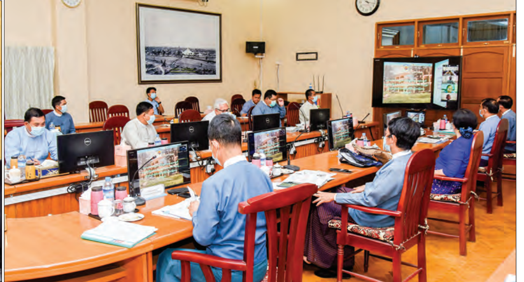
Union Minister Thura U Aung Ko presided over a meeting with officials on preparations for facility quarantines.