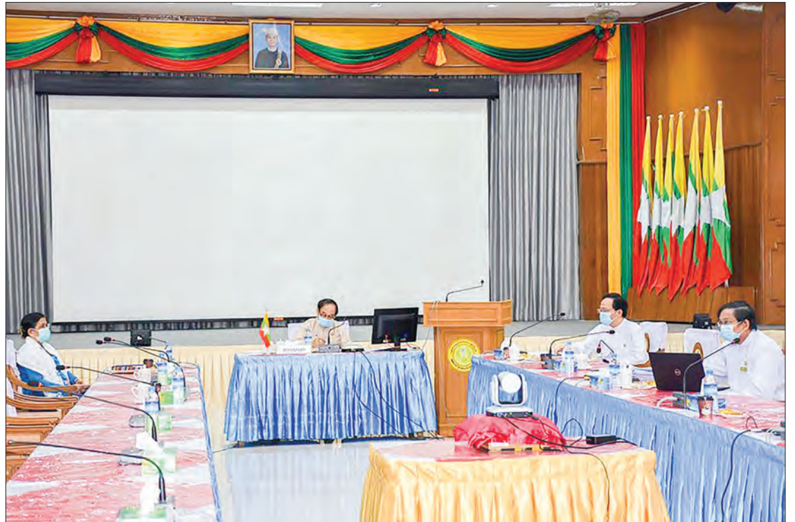
Union Minister for Health and Sports Dr Myint Htwe participates in the Special Video Conference of Health Ministers of ASEAN and the United States on 30 April.

Dr Myint Htwe also explained Myanmar's efforts on fighting against the pandemic, with promoting the role of vol-