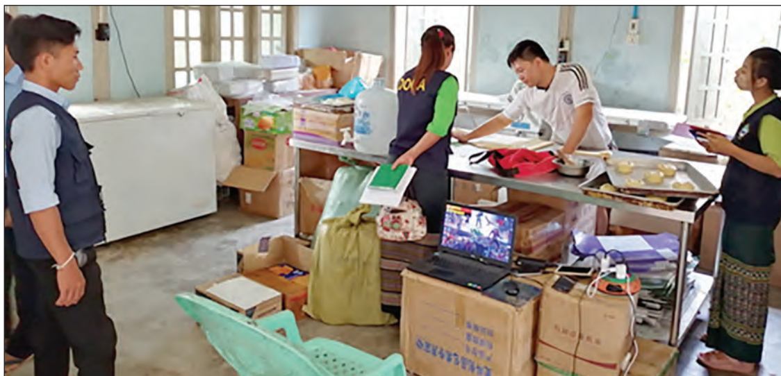
Officials of the Consumer Affairs Department inspect a factory.