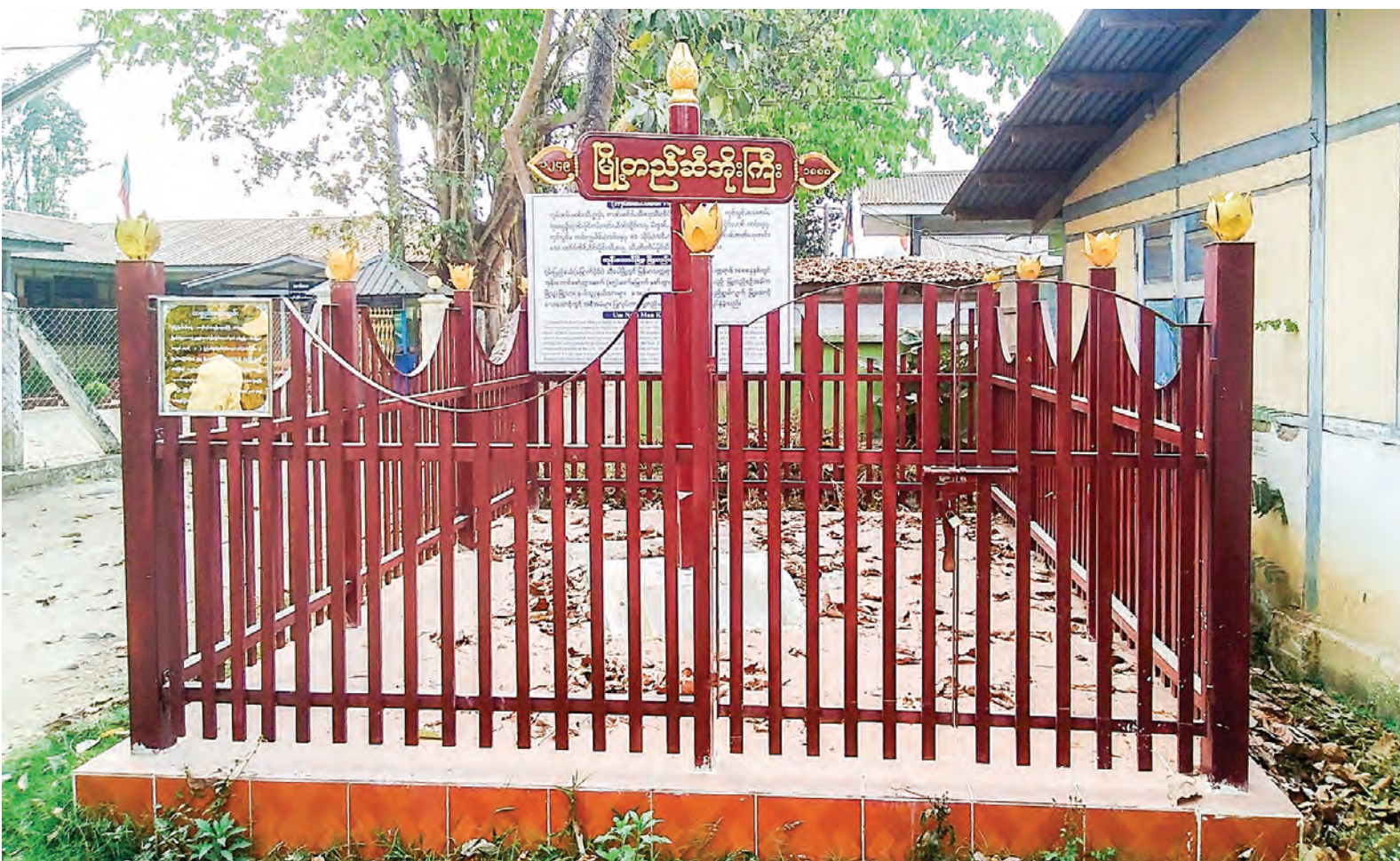
A holy oil pot at the northeast corner of the town.

Facts about Hsipaw Township (Ministry of Home Affairs)