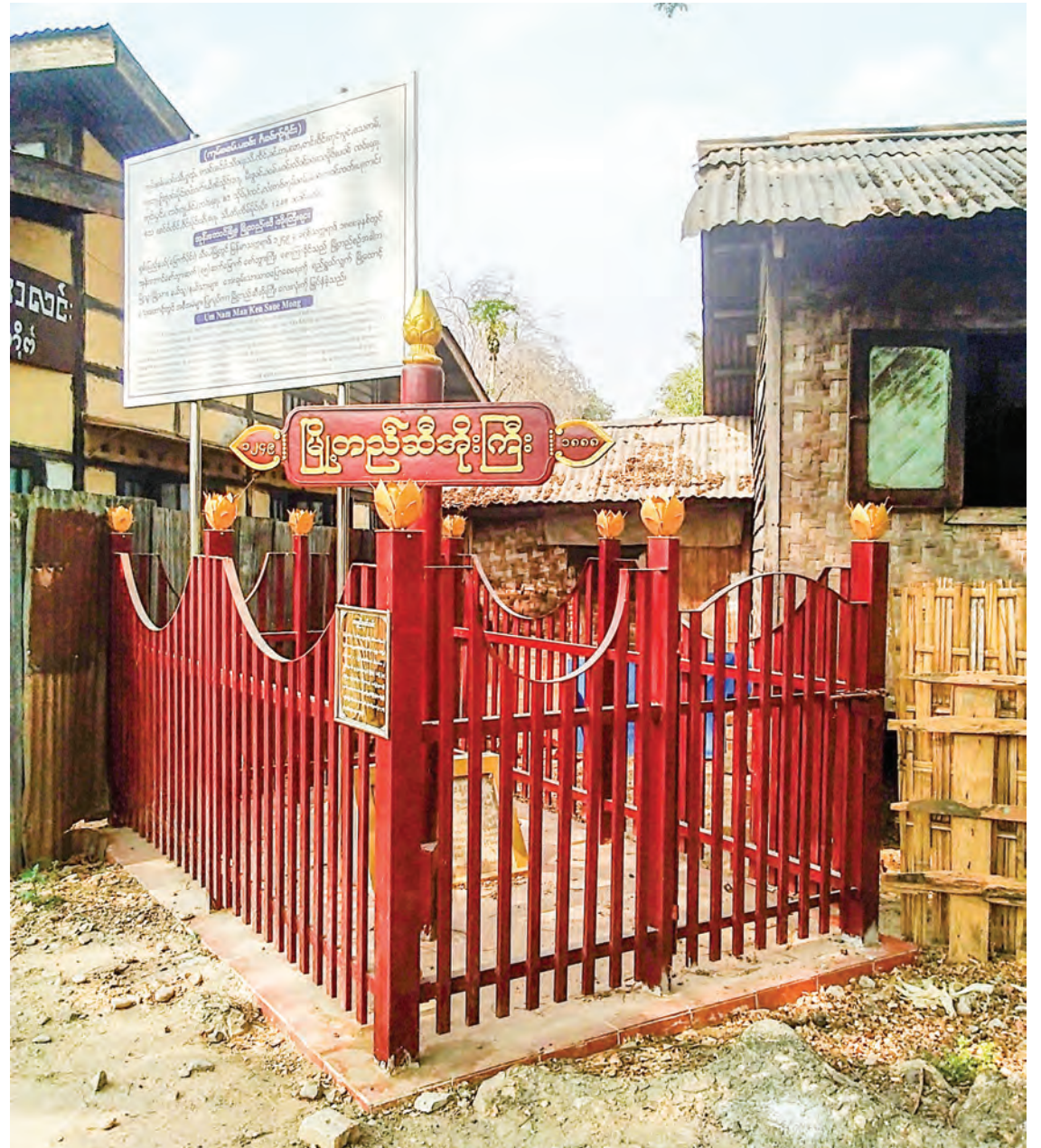
A holy oil pot at the northwest corner of the town.

Four holy oil pots were placed underground at Shwen-