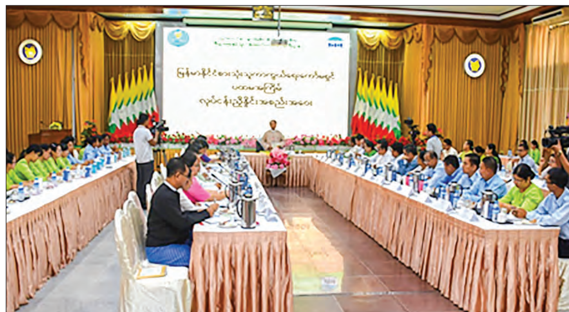
Myanmar Consumers' Rights Commission holds its first meeting.