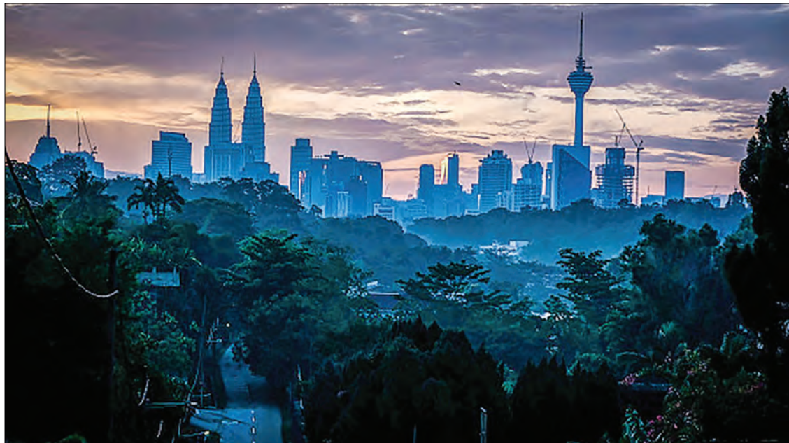
A view of Kuala Lumpur City at dawn on Earth Day 2020 taken from the top of Kenny Hills in Kuala Lumpur, Malaysia, on 22 April 2020.

The extension of the lockdown means all schools, colleges, educational institutions, shopping malls/markets, and modes of transportation will continue to remain shut. Though, according to the new guidelines issued by the Ministry of Home Affairs, some relaxations would be allowed in those areas which have no COVID-19 cases. “After a comprehensive review and in view of the lockdown measures having led to significant gains in the COVID-19 situation in the country, the Ministry of Home Affairs today ordered to extend the lockdown for a further period of two weeks beyond 4 May,” said an official press release.—Xinhua