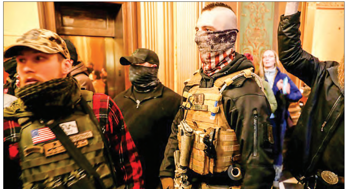
Some of the protesters who entered the Michigan state capitol on April 30, 2020, demanding coronavirus lockdown orders be lifted, were armed.

The protest comes a day after a Michigan court ruled that