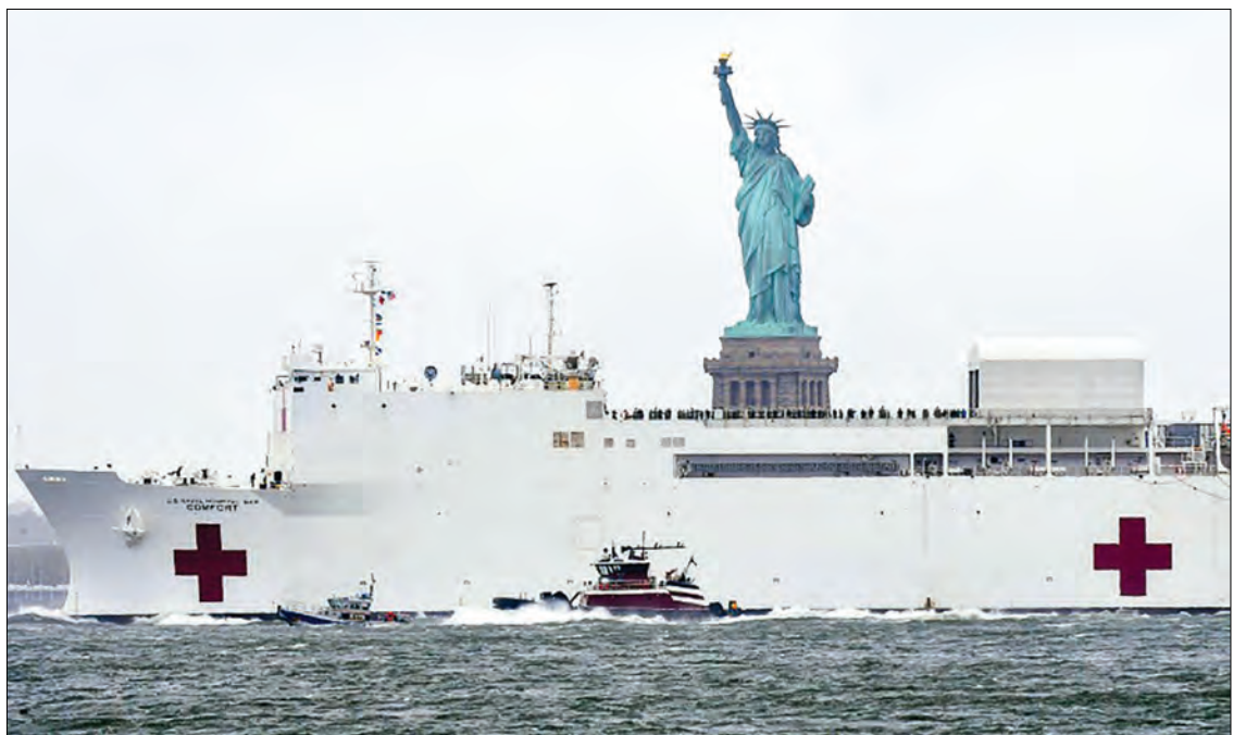
The hospital ship USNS Comfort passes the Statue of Liberty as it departs New York City.

While death rates slowed in most of Europe, the global toll from the pandemic has now topped 230,000. — AFP ■