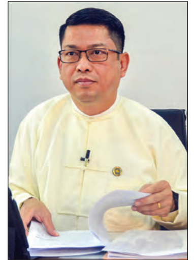
U Min Min (Director-General, Department of Trade).

A: In the past, some produce and items were not allowed for exports, and now oil crops and lives animals are permitted to export, in line with the changing situations. Moreover, the import procedures are also amended. Many import restrictions being imposed in the past on foreign companies,