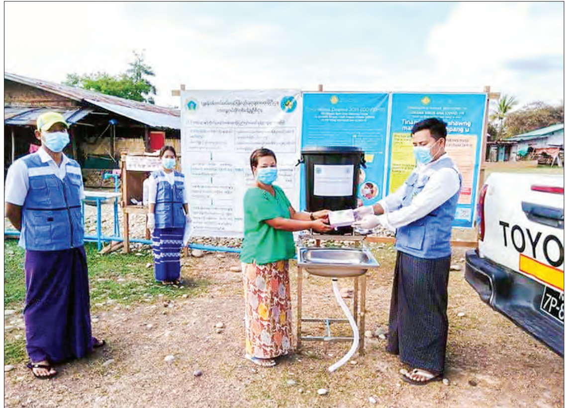
Staff of the Ministry of Social Welfare, Relief and Resettlement distribute wash basin to the displaced people in a camp.