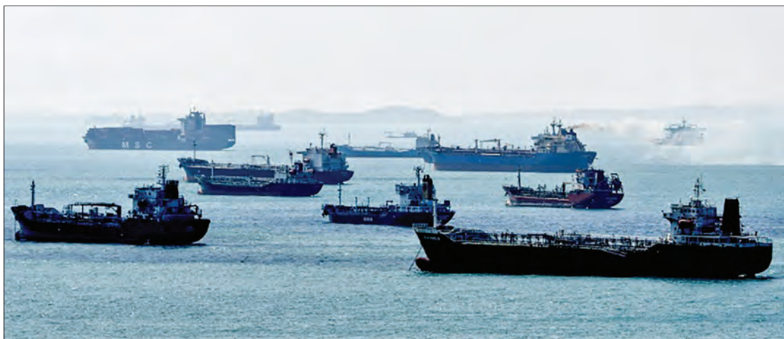
Oil tankers are anchored off the western shores of Singapore, where tycoon O.K. Lim built up his oil empire from a single-truck outfit through hard work and high-risk gambles, a rags-to-riches tale that made him a legend among crude traders.

The firm played a key role in helping the city-state become the world's top ship refuelling port, observers say, and it expanded into ship chartering and management with a subsidiary that has a fleet of more than 150 vessels. The picture that emerges of Lim himself, now in his 70s, is complex.—AFP ■