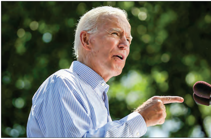
In this file photo taken on 18 May, 2019, former US Vice President Joe Biden speaks during the kick off of his presidential election campaign in Philadelphia, Pennsylvania.