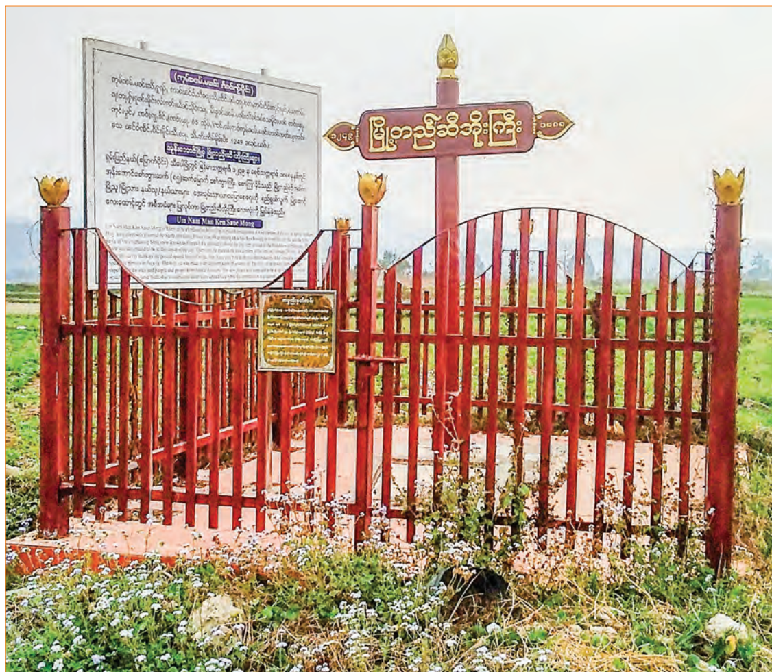
A holy oil pot at the southwest corner of the town.