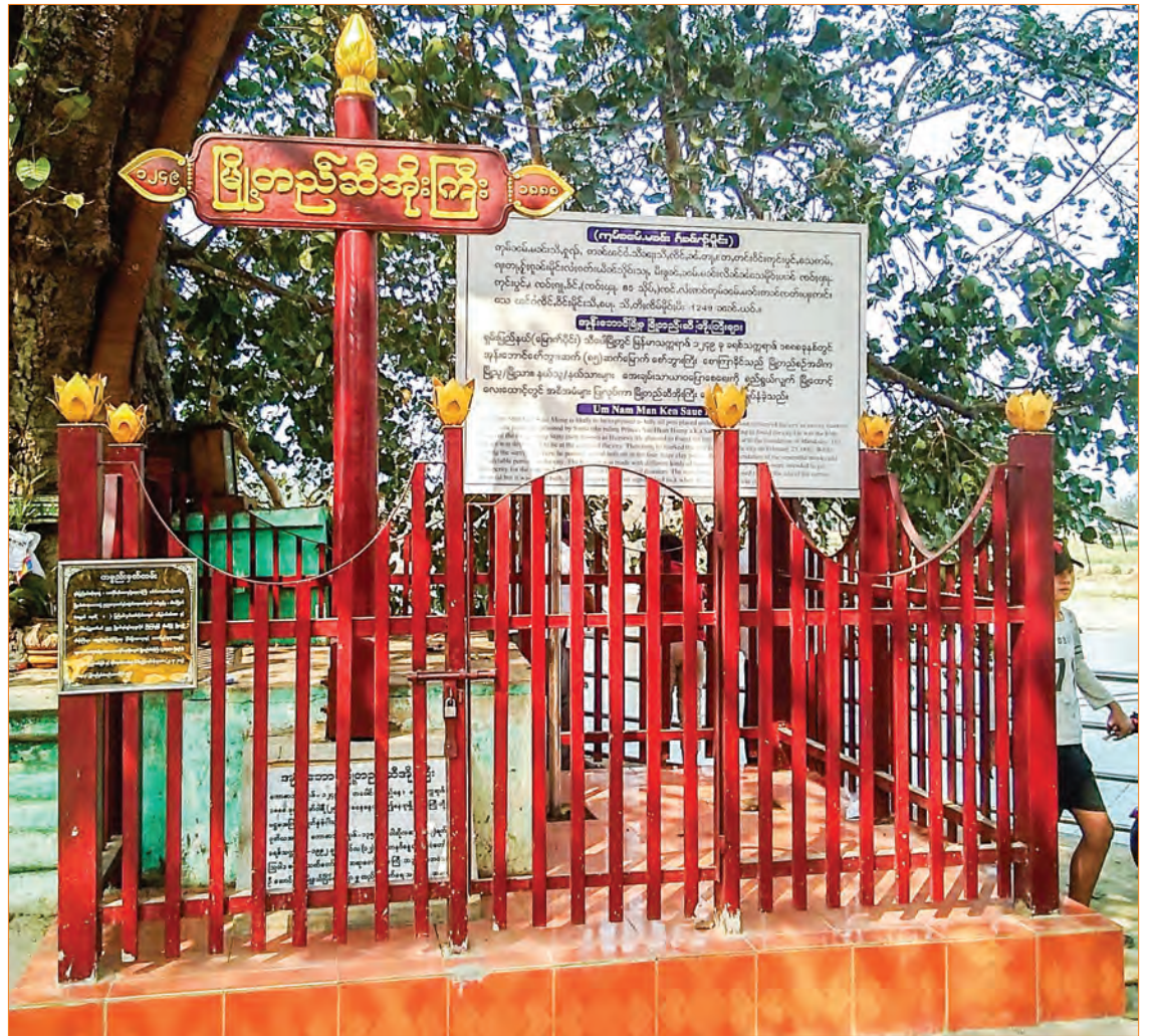
A holy oil pot at the Shwenyaungbin northeast corner of the town.

The records of the Ministry of Home Affairs stated Sao Kyar Khaing (aka) Sao Hkun Seng, son of Saofa Sao Kyar Tun of Hsipaw built Hsipaw in shape of Mandalay City in March 1888. The city was established at the mouth of