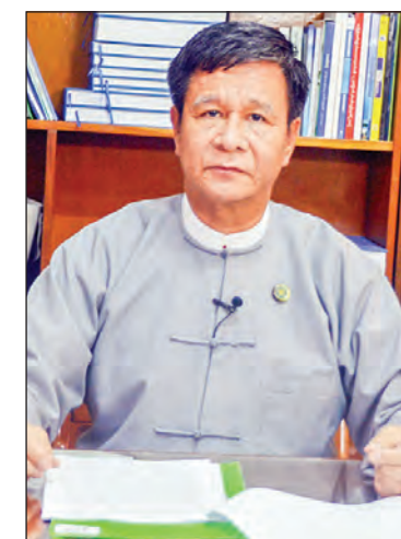
U Aung Htoo (Deputy Minister)

A: We have enacted such as that of Consumer Protection Law; that of the Safeguard Law; and that of the IP Law. With these laws being activated in the country, more investment is expected in the country.