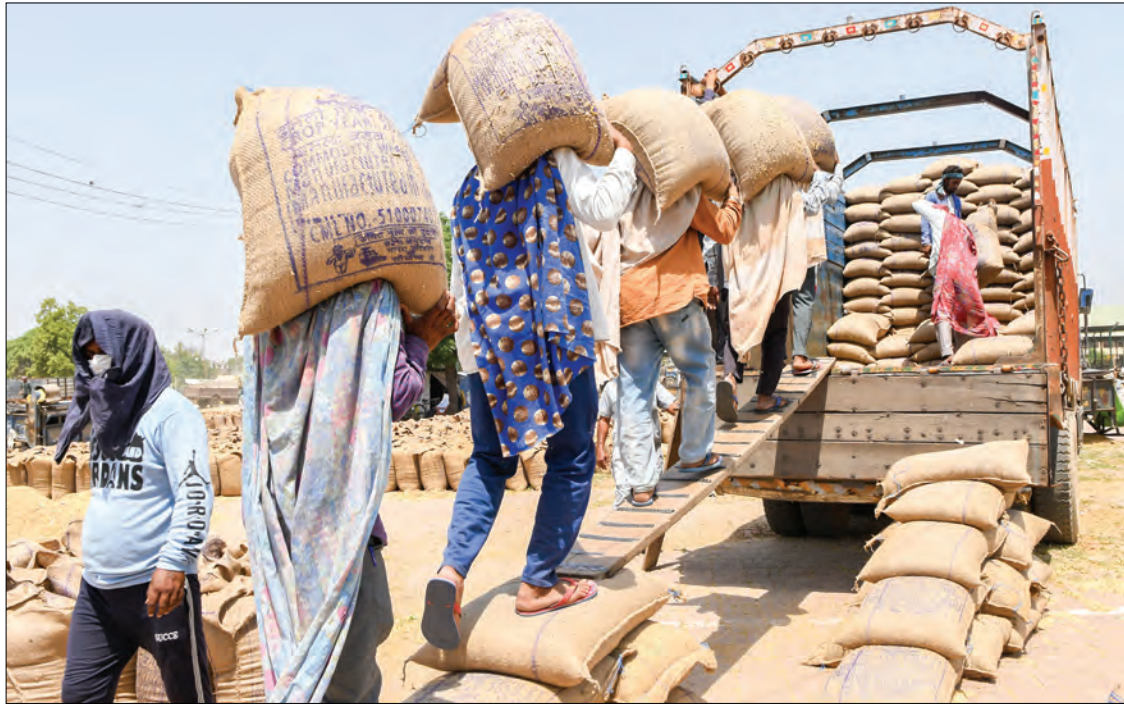
Labourers load sacks of wheat grains onto a truck on International Labour Day at a railway station during a government-imposed nationwide lockdown as a preventive measure against the spread of the COVID-19 coronavirus, in Amritsar on 1 May 2020.

In the United States, which has the highest toll, 63,019 people have died. Italy is the second hardest-hit country, with 27,967 dead, followed by the United Kingdom with 26,711, Spain 24,824 and France 24,376.