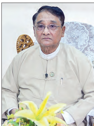
Dr. Than Myint (Union Minister)

Vice President U Henry Van Thio is the Chairman of the Myanmar Special Economic Zones Central Committee (MSEZCC) and I am responsible as the Secretary. I