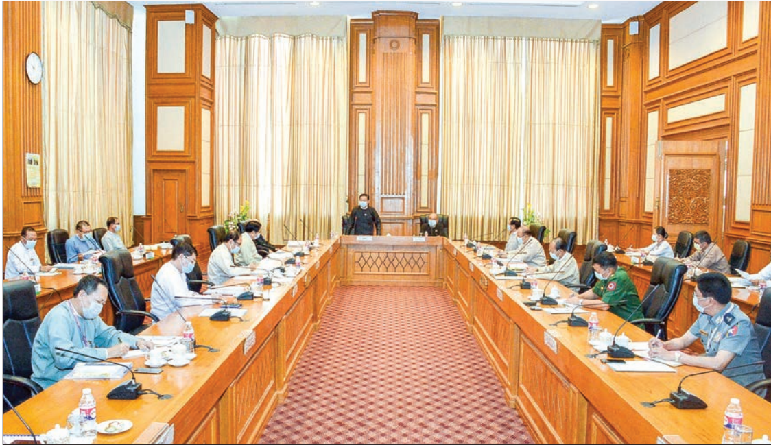
Central Committee on Organizing Second Hluttaw Meetings holding the meeting for 16 th regular session in Nay Pyi Taw yesterday

THE Central Committee on Organizing Second Hluttaw Meetings held meeting 2/2020 in Nay Pyi Taw yesterday.