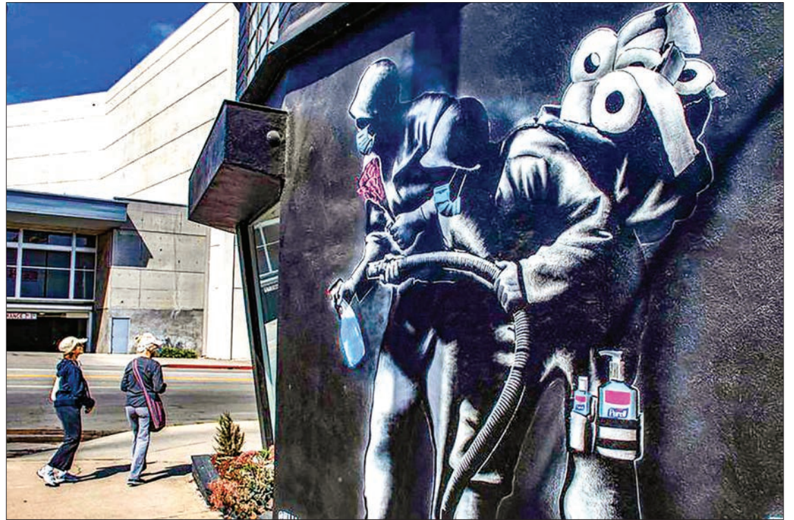
People walk by an apocalyptic mural by Hijackhart, where soldiers wearing face masks fight Covid-19 with disinfectant and hand sanitizers during the coronavirus pandemic in Los Angeles.

On Wednesday, the LA County reported 1,541 new cas-