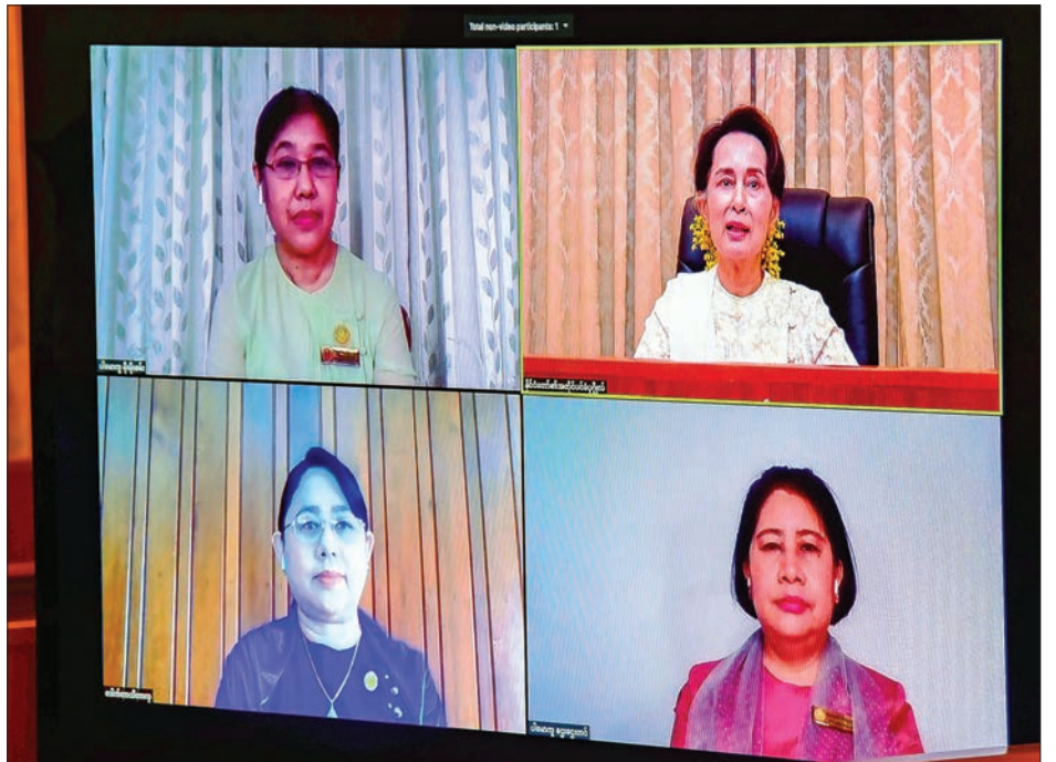
State Counsellor Daw Aung San Suu Kyi discusses situation of fighting the COVID-19 disease during the video conference with the health professionals.

S TATE Counsellor Daw Aung San Suu Kyi, in her capacity as the Chairperson of National Central Committee for COVID-19 Prevention, Control and Treatment, held a video conference yesterday from the Presidential Palace in Nay