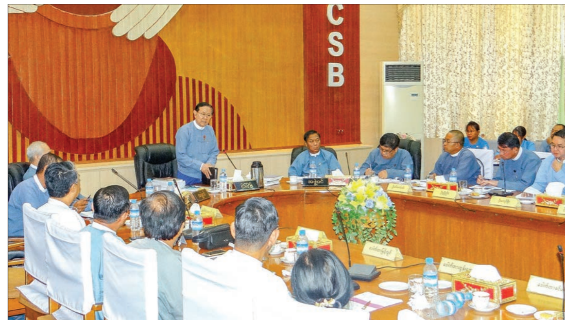
Officials discuss during the Foreign Study Committee meeting.

The Public Service Motivation Survey was conducted on 409 deputy directors general, directors and deputy directors of five departments, and the results will be announced and distributed at the relevant offices.