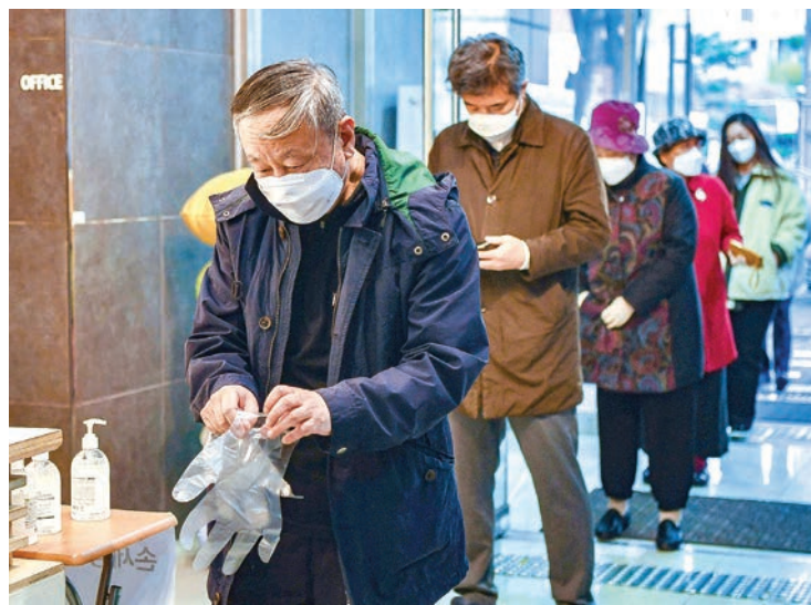
A man puts disposable gloves on at a polling station in Seoul before voting in South Korea's general election on April 15, 2020, amid the ongoing fight against the novel coronavirus.

The authorities also said they have seen no infection cases linked to the April 15 general election, and that no such case is likely to emerge now that a two-week incubation period has passed since tens of millions of voters went to the polls. The country saw a surge in daily new cases in late February due to mass transmissions among people linked to a minor religious