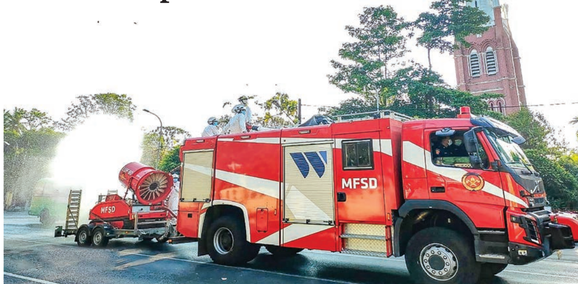
Fire Services personnel carrying out disinfections in Bahan Township, downtown areas of Yangon.

MEMBERS of Defence Services and Fire Brigade have used 637.5 gallon of disinfectants and 25,500 gallons of water in respective