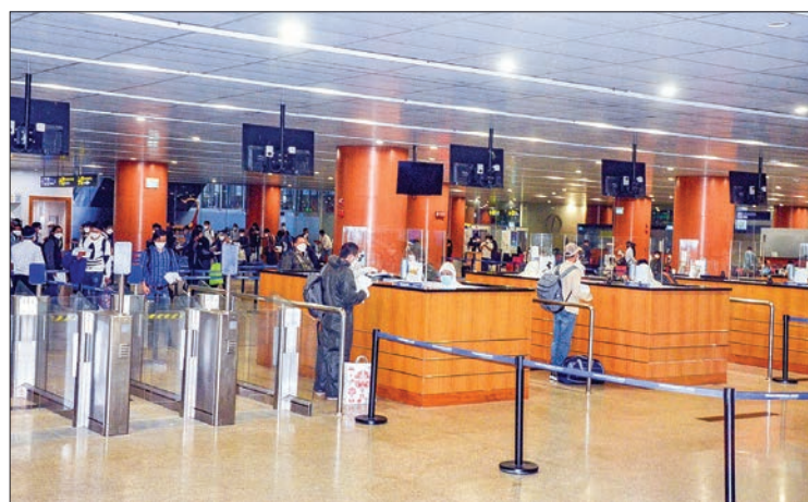
Myanmar nationals doing their immigration processes at the Yangon International Airport.

When 96 Myanmar nationals arrive at Yangon International Airport, ensuring immigration processes are efficient, to comply with directives issued by the Ministry of Health and Sports, to be quarantined for 21 days at their designated hotel which will be organized by the Ministry of Labour, Immigration and Population, Ministry of Health and Sports and the Yangon Region government.—MNA (Translated by Zaw Htet Oo)