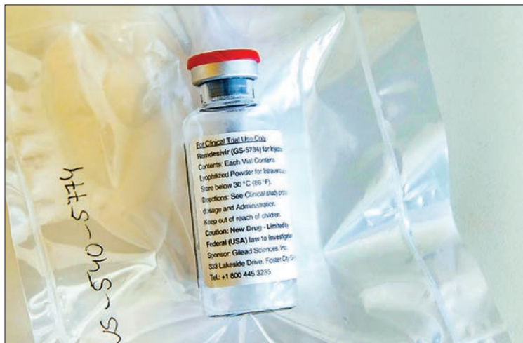
The drug remdesivir appears to help treat those suffering from COVID-19, the disease caused by the novel coronavirus.