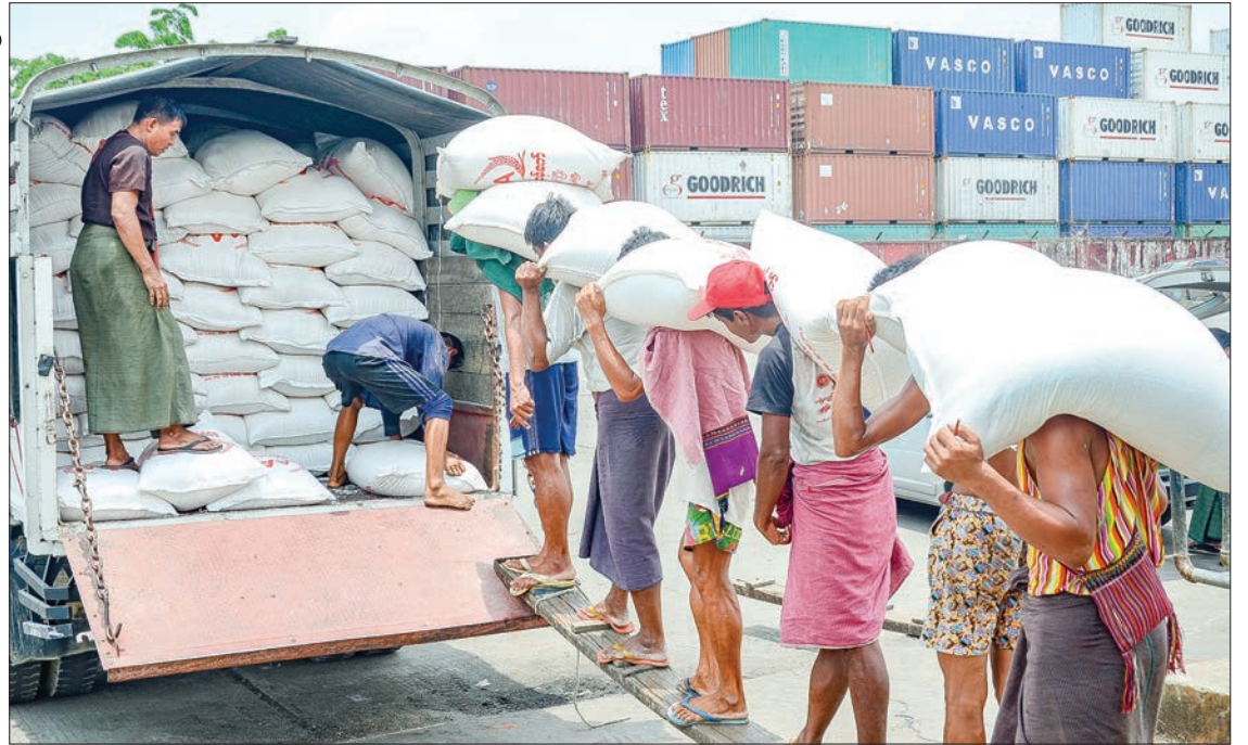
Workers loading the vehicle with sacks of rice at Botahtaung jetty in Yangon.

The Ministry of Commerce imposed an export quota of 100,000 tonnes of rice through sea