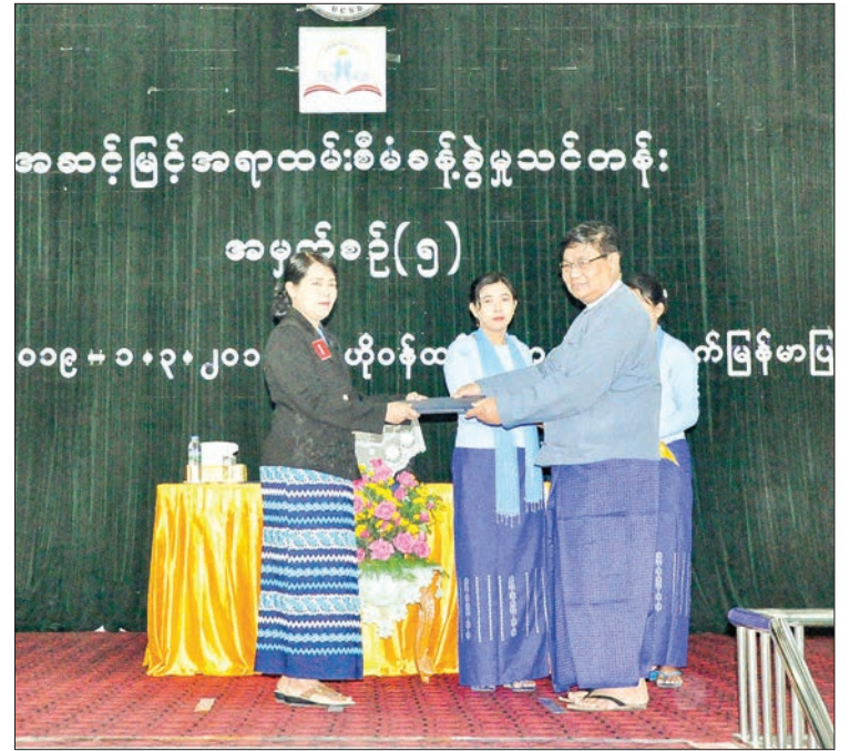
Graduation ceremony of the 5 th Senior Level Official Management Course organized by the Central Institute of Civil Service.