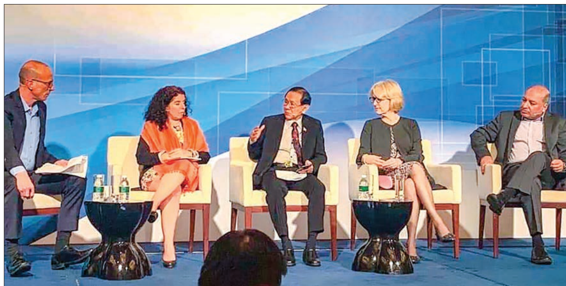
The Union Civil Service Board (UCSB) is currently undertaking a variety of reform activities in collaboration with international organizations. Various workshops discussed the support for civil service, improvement of international Exchanges.

UCSB introduced the Online Application System (OAS) on 14 September 2019. The Union level body approved the appointment of 7,183 employees who meet the requirements as