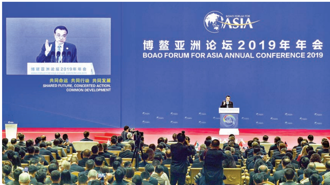
Chinese Premier Li Keqiang delivers a speech during the Boao Forum for Asia in the southernmost Chinese province of Hainan on March 28, 2019.

"In response to international efforts to contain the disease and prioritizing the health and safety of all participants, the forum's Board of Directors made the difficult decision of not holding this year's annual conference," organizers said in a statement.