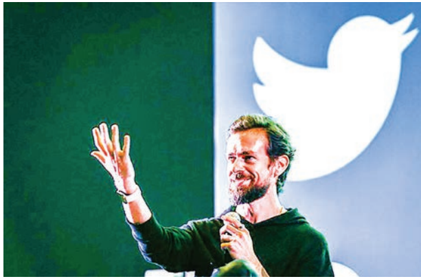
Twitter saw a jump in new users in the past quarter amid a global pandemic but posted a net loss as ad revenue softened. Twitter CEO Jack Dorsey.

He said Twitter's goal is to "serve the global conversation" and that the platform is "helping the world stay informed, and