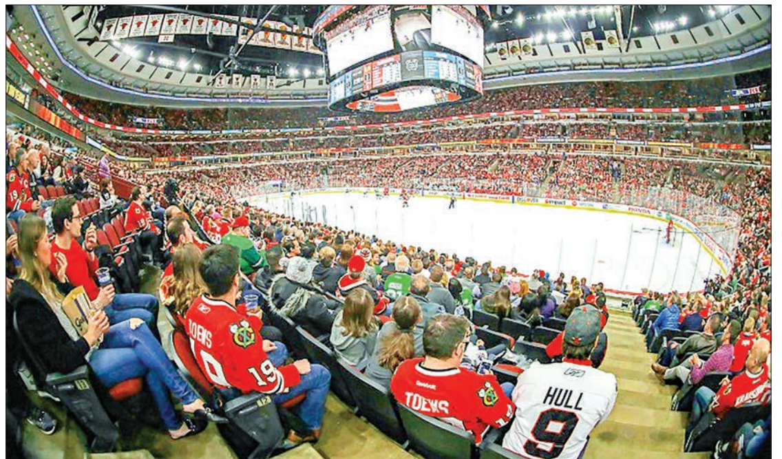
Fans watch as the Chicago Blackhawks take on the San Jose Sharks in a NHL game at the United Center in Chicago on March 11 a day before the league shut down due to the coronavirus pandemic.

LOS ANGELES (United States) — The NHL plans to reopen some of its team training facilities as early as mid-May in areas where stay-at-home and social-distancing restrictions are trending favourably, the league said on Wednesday.