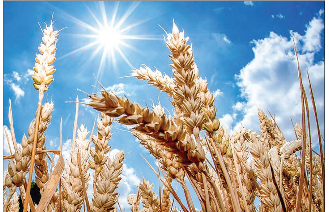
A picture taken on July 6, 2018 shows the bright sun shining over a wheat field in Giesen, northern Germany.

the type of UV light that was used, Lloyd Hough, a DHS scientist overseeing the test, said: “The spectrum of light that was used was designed to approximate natural sunlight that you would expect to see at noon at sea level at a mid-latitude location (e.g., mid-Atlantic, 40 degrees N) on the first day of