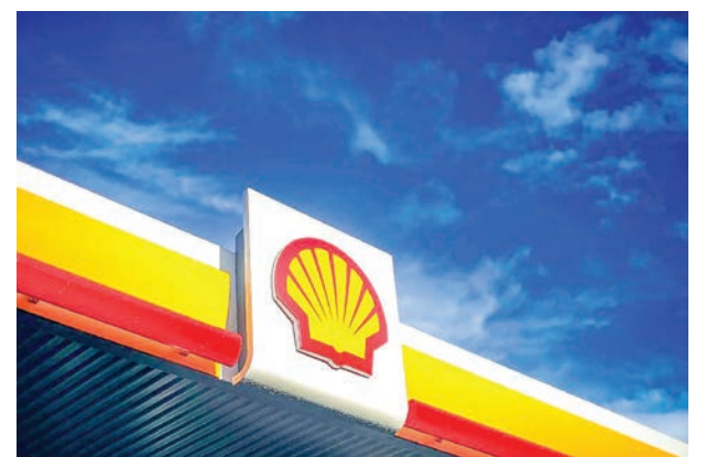
Royal Dutch Shell has cut its dividend for the first time since the 1940s.

It warned that the pandemic would spark a difficult second quarter — with no price bounceback in prospect.—AFP ■