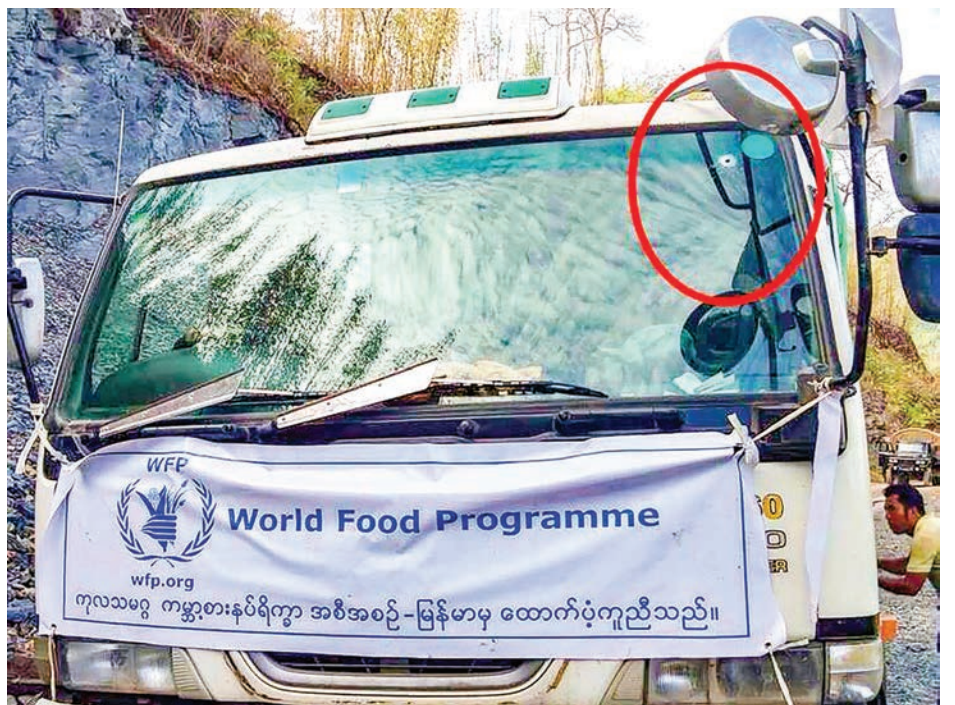
The windshield of the World Food Programme's vehicle shot by AA terrorists.