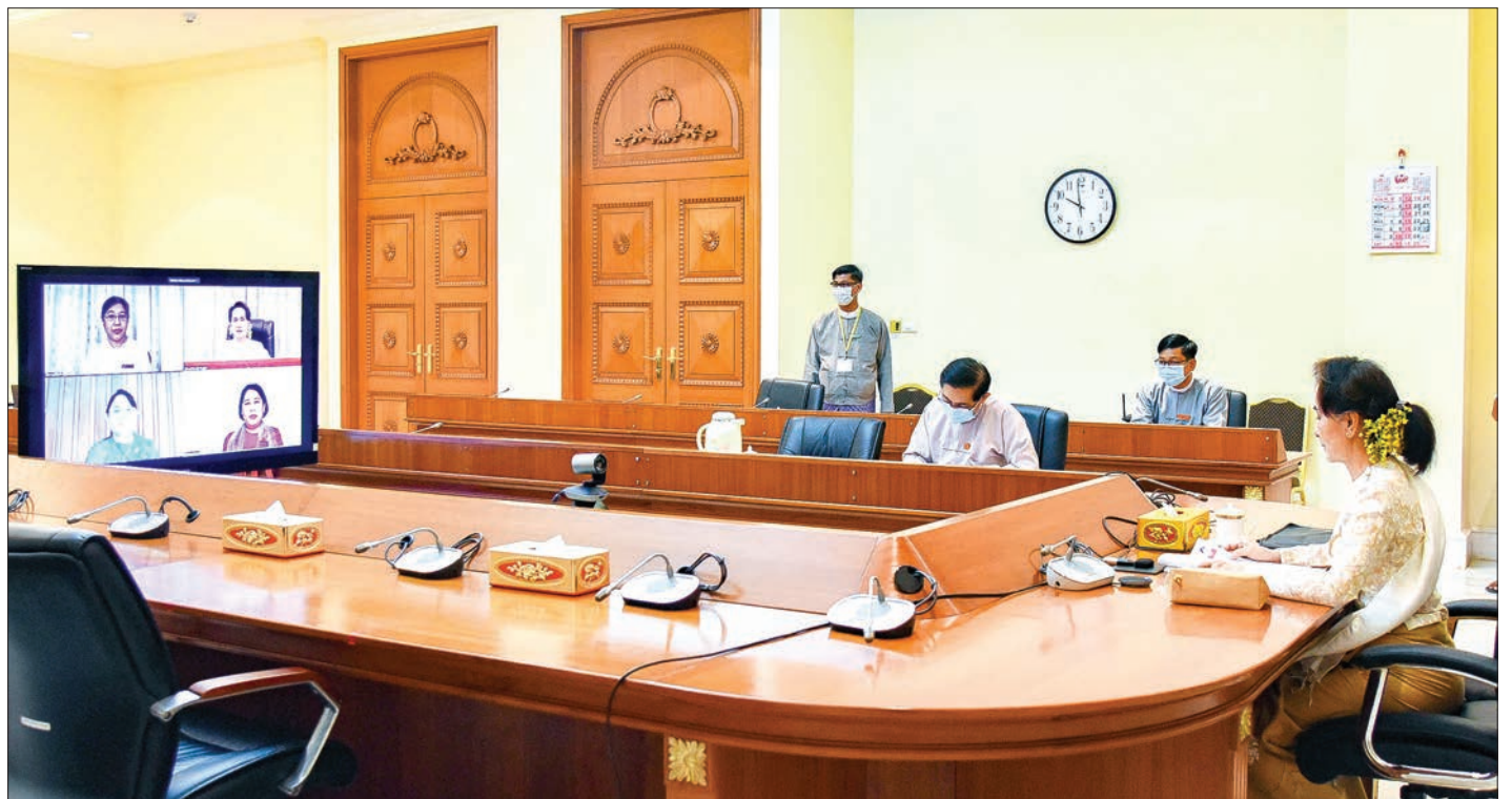
State Counsellor Daw Aung San Suu Kyi discusses situation of fighting the COVID-19 disease during the video conference with the health professionals.

anmar migrant workers were about to come back home as the government has requested to delay their return until 30 April; the number of returnees would be over 100,000 and most of them were from Thailand and Malaysia; the government will accept Myanmar migrant workers whether they went legally or not; public participation was highly expected with full awareness of possible infection to every person; unity, solidity and empathy were required. She also expressed her appreciation for the efforts of Ministry of