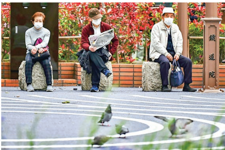
With the initial month-long period coming to an end next week, local media reported that Japan's Prime Minister Shinzo Abe was now expected to extend the measure, either until the end of May or early June.

It was not yet clear when any extension would be announced, but Abe has said he will not wait until the last minute, to allow business and institutions including schools time to prepare accordingly.—AFP ■