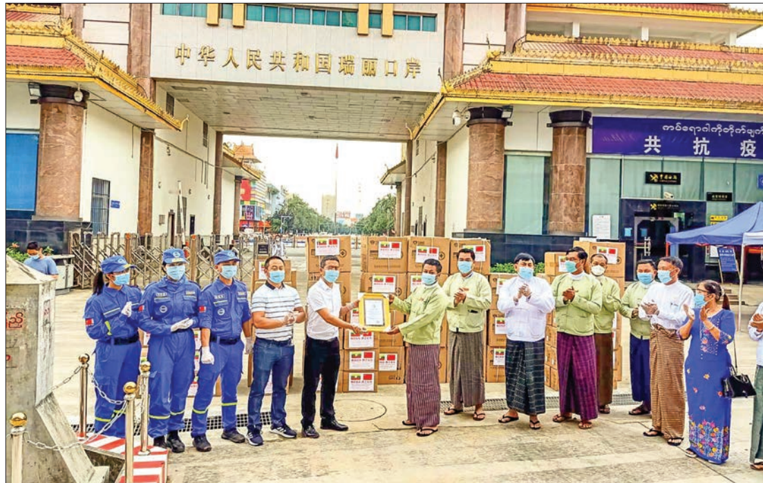
Well-wishers donating COVID-19 prevention aids in Muse.

Charity organizations such as Blue Sky from Shweli, Mi Hsaung Pone foundation and Hsaung Chin Link foundation from China donated COVID-19 prevention aids worth K48 mil-