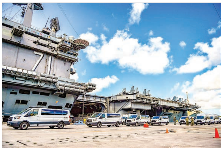
The Theodore Roosevelt aircraft carrier is docked in Guam.