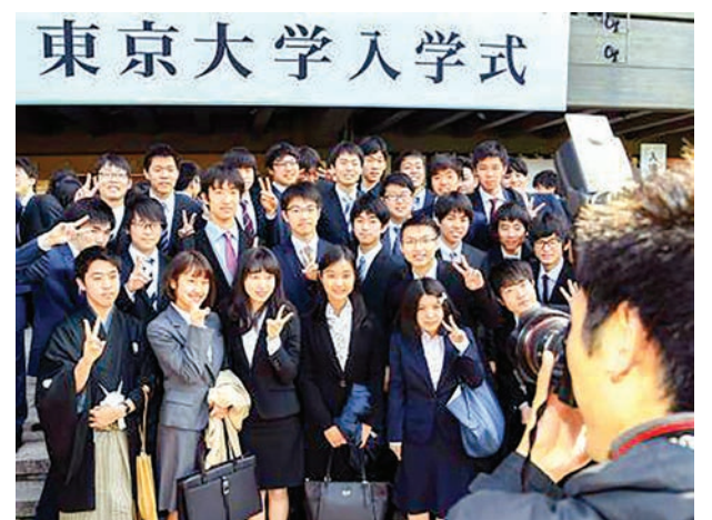
Newly enrolled students of the University of Tokyo, Japan's most prestigious national university, pose for a photo before the start of the school's entrance ceremony at Nippon Budokan hall in Tokyo on April 12, 2016.

an increase in the recruitment of global talent.—Tokyo ■