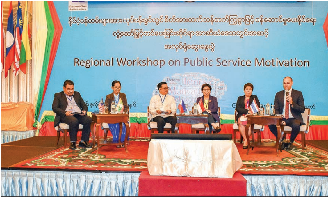
Aiming to enrich workplaces with new ideas, Union Civil Service Board holding the Regional Workshop on Public Service Motivation with the support of UNDP in Nay Pyi Taw on 29 July 2019.