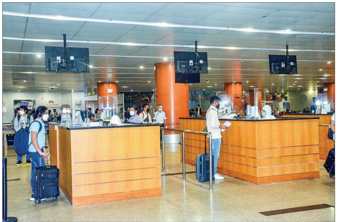
Myanmar nationals returned from South Korea to Myanmar seen at the Yangon International Airport yesterday.

The 96 Myanmar nationals in South Korea were brought back in the first batch and the Ministry of Foreign Affairs is