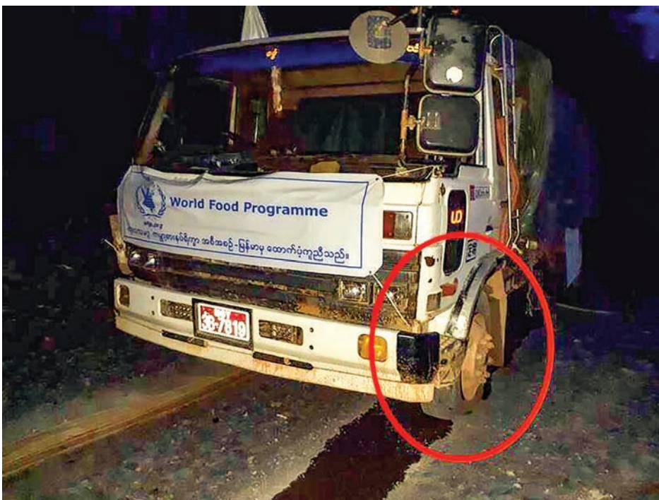
The vehicle of the World Food Programme destroyed by AA terrorists.

About 10,000 metre west of Sami Town, the AA terrorists followed and