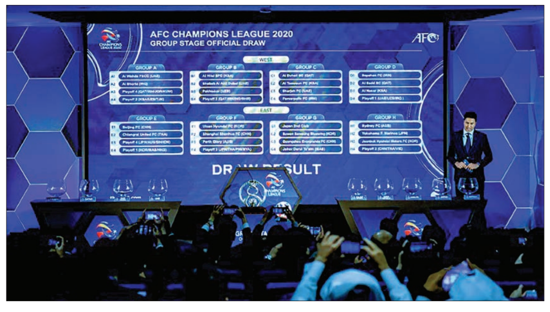
The draw for the Asian Football Confederation playoff and group stages was made at AFC headquarters in Kuala Lumpur in December, but so far less than two of the first six rounds have been played.

June qualifiers for the men's 2022 World Cup and 2023 Asian Cup had already been postponed.—AFP ■