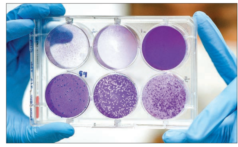
A researcher works on virus replication in order to develop a vaccine against the coronavirus COVID-19.

There are currently no approved vaccines or medication for the COVID-19 disease, which has killed more than 120,000 people worldwide and infected nearly two million.— AFP ■