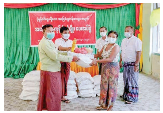
Rakhine authorities hand over food aid to local people.

Distribution to all 80,059 households in 5 townships in MraukU District, 27,174 households in Maungtaw District, 30,148 households in Kyaukpyu District were also complete yesterday.—Tin Tun (IPRD)