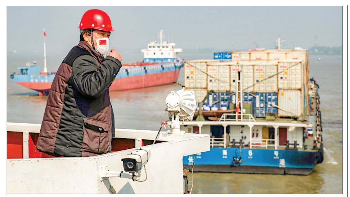
China has largely brought the disease under control within its borders and the March fall in trade was far lower than expected.

12 WORLD 15 APRIL 2020 THE GLOBAL NEW LIGHT OF MYANMAR