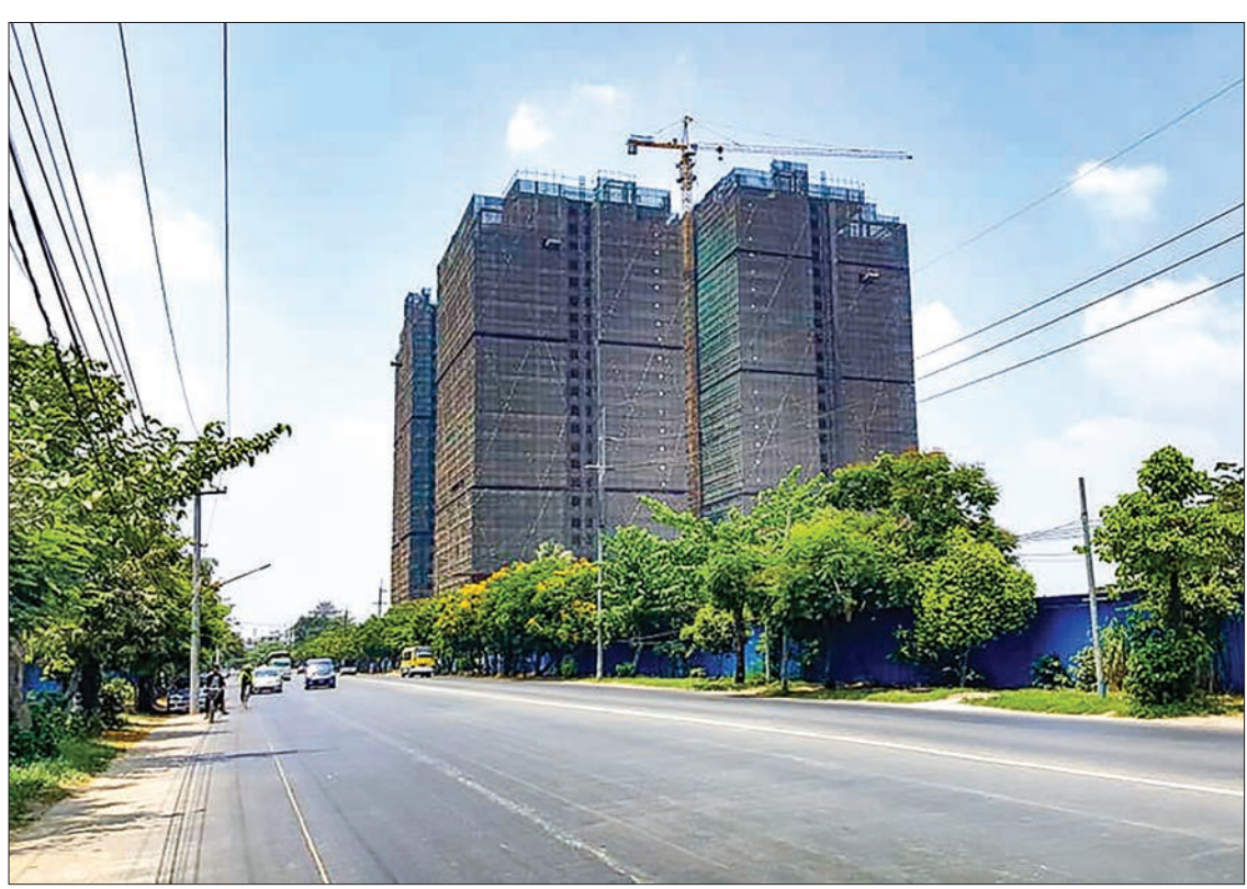
A building is under construction in Yangon.