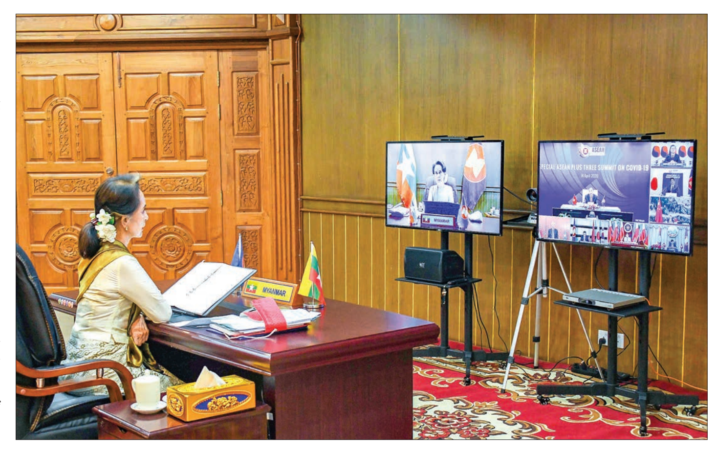
State Counsellor Daw Aung San Suu Kyi attends the Special ASEAN Summit on COVID-19 yesterday.

In the fight against the global pandemic, the State Counsellor also stressed the need to strengthen collaboration and collective action among Member States in fully operationalizing available resources and existing mechanism, strengthening preparedness and response capacities of individual health systems of Members States, fostering collective efforts to minimize the socio-economic impacts of COVID-19, facilitating smooth flow of vital medical supplies, essential commodities and services to support the health and well-being of our peoples, providing adequate supports and updated information