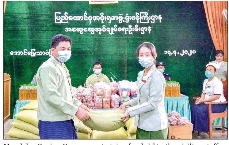
Mandalay Region Government giving food aid to the civilian staff and their families.

ment provided foodstuffs and their families, who are serv-