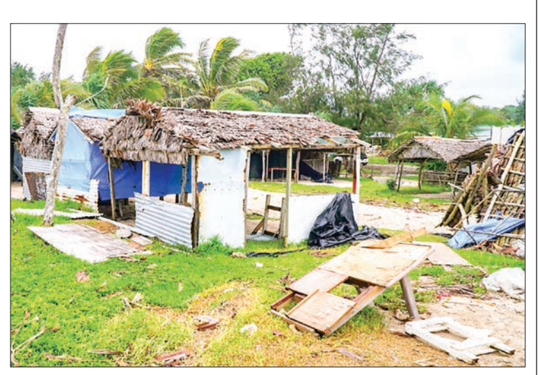
Tropical Cyclone Harold caused widespread damage in Vanuatu.

Harold is that houses have been blown to smithereens, there's nothing to pick up."