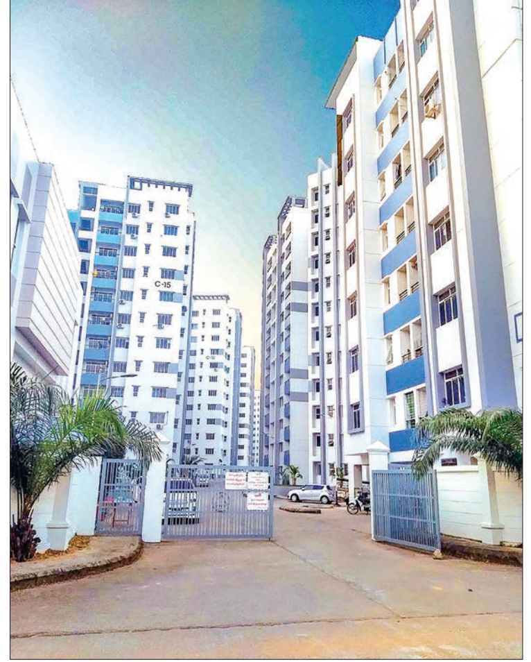
Photo shows mushrooming of high-rise buildings in Yangon City.

tion permits at YCDC through online. Those engineers and architects have been allowed to open their accounts in the system in order to apply for the permit. They must follow five steps as procedures of applications. With regard to the first step, the applicants must mention their profiles. The second step is to mention the facts about buildings. In respect of the third step, data from the first and second steps must be combined and attached to the applications. And, the data must be scrutinized and then it must be posted through online if all the facts are correct. The fifth step is related to the checking of office. If the relevant office approves the applications, the applicants must send payments," said Daw Khin Thet Lwin, Assistant Director cum in-charge of the construction works.