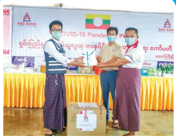
A local man accepts food aid from Shan State authorities.

So far, they have distributed to 57,249 households in Eastern District, 26,984 households in Western District, 111,149 households in Southern District, and 74,991 households in Northern District. —MNA