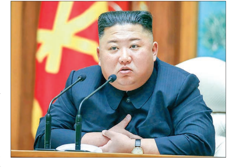
The latest test comes a day before North Korea marks the 108<sup>th</sup> anniversary of the birth of founder Kim Il Sung, grandfather of current leader Kim Jong Un.

Those missiles flew around 200 kilometres (125 miles) and were launched the week after two US aircraft carriers took part in naval manoeuvres in the Sea of