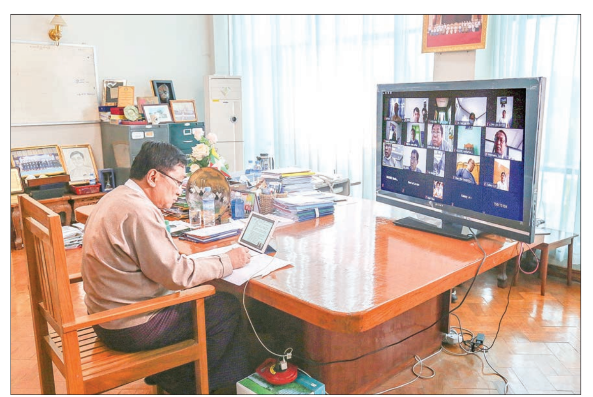
Union Minister Dr Win Myat Aye holds a video conference yesterday to coordinate the protection, containment and response to COVID-19 concerning IDP camps across the nation.

THE GLOBAL NEW LIGHT OF MYANMAR NATIONAL