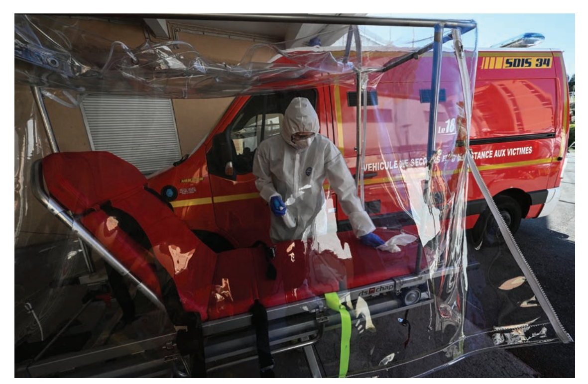
A firefighter disinfects a sarcophagus stretcher after transporting a patient to the Montpellier University Hospital which houses a COVID-19 test center on April 14, 2020 during the 29th day of a lockout in France aimed at curbing the spread of the COVID-19 pandemic caused by the new coronavirus.

The French government says its economy is expected to contract eight per cent this year, reflecting the impact of an extended lockdown. Its budget deficit was forecasted to go up to nine per cent of GDP and its debt pile to soar to 115 per cent of GDP.