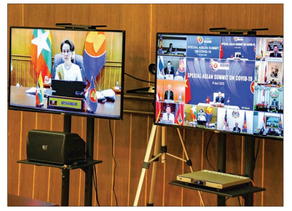
State Counsellor Daw Aung San Suu Kyi attends the Special ASEAN Summit on COVID-19 yesterday.

tate Counsellor and Chairperson of the National-Level Central Committee on Prevention, Control and Treatment of Coronavirus Disease 2019 (COVID-19) Daw Aung San Suu Kyi participated in the video conferences of the Special ASE-AN Summit on COVID-19 at 7:30 am and the Special ASEAN Plus