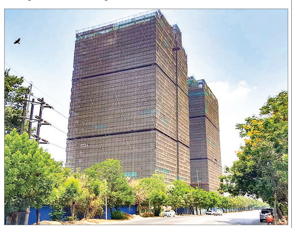
A building is under construction in Yangon.

Prudential Myanmar and Yoma Bank sign Memorandum of Understanding to establish exclusive partnership for distribution of life insurance products to the people of Myanmar