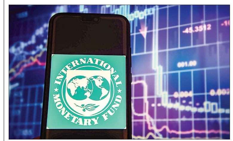
International monetary fund logo is seen in an Android.

Growth in trade of goods and services across the world was revised downward by nearly 14 points from the January projection to a drop of 11.0 per cent in 2020, but upgraded 4.7 points to an 8.4 per cent rise in 2021. — Kyodo News ■