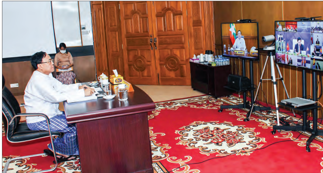
Union Minister for International Cooperation U Kyaw Tin participates in the video conference of the 25 th Meeting of the ASEAN Coordinating Council yesterday.

At the Meeting, the ASEAN Foreign Ministers briefed their national efforts in the fight against the spread of the COVID-19 and exchanged views on sharing information, best practices and policy adjustments, strengthening cooperation to contain the spread of the global pandemic, establishing the COVID-19 ASEAN Response Fund, providing appropriate assistance to ASEAN citizens affected by COVID-19 in each other's countries or in a third country and enhancing coordinated and collective actions to address the socio-economic impacts of COVID-19. The Ministers also discussed preparations for the Special ASEAN