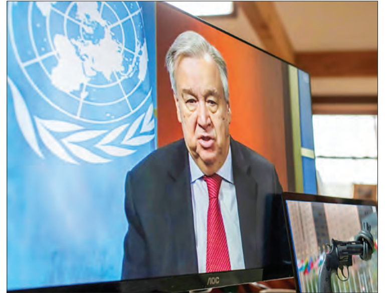
The meeting will be held as a video conference to maintain social distancing.

Efforts to convene a meeting have been stymied by the hospitalization of British Prime Minister Boris Johnson and Chinese reticence to participate without first setting a clear agenda. —AFP ■