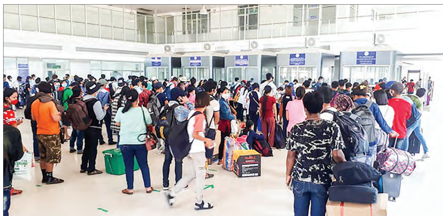
Myanmar migrant workers wait at the second Thai-Myanmar Friendship Bridge in Myawady for screening on 26 March, 2020.

If the returnee migrant workers do not have documents recognizing their skills, they could be advised to apply to the National Skills Standard Authority (NSSA) of the Ministry of Labour, Immigration and