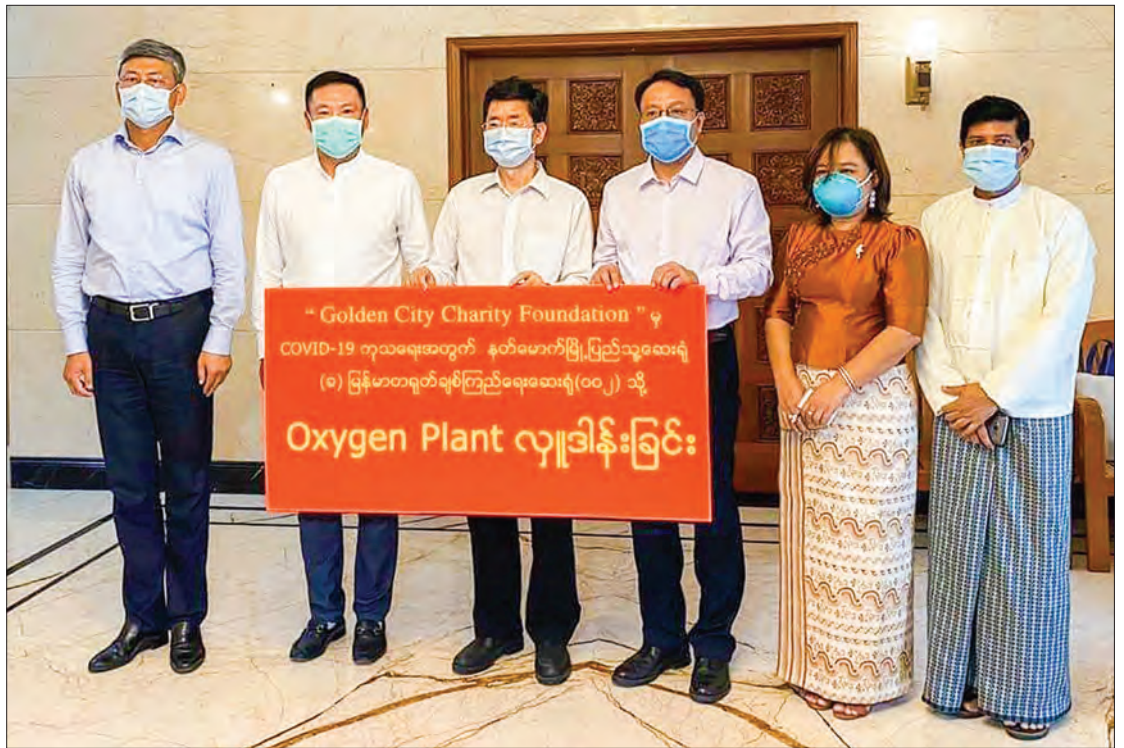
Executive committee members from Golden City Charity Foundation donate medical aids for COVID-19 control and prevention in Yangon yesterday.

Golden City Charity Foundation has donated protection equipment and disinfectants worth K3.5 million to ensure a safe environment within the Golden City project. The foundation is always supporting as much as