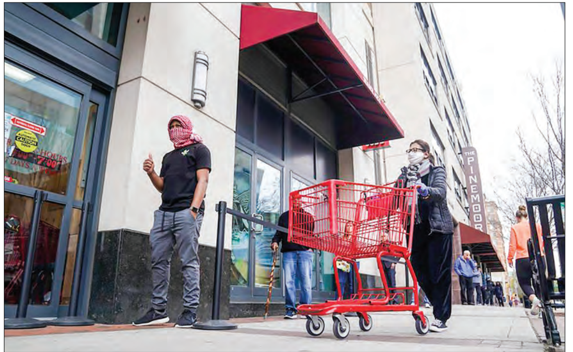
Shoppers with scarves and masks line up outside a supermarket in Arlington, Virginia, the United States, 4 April, 2020.

They noted that the main outbreak is in New York City. That city has a population density far greater than most other areas in the United States — a nation with endless, spacious suburbs and wide open spaces