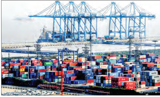
A view of Shanghai pilot free trade zone.