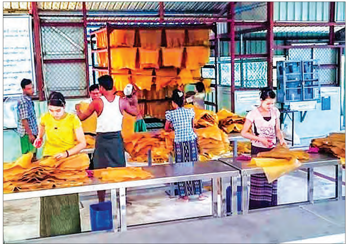
Workers working at a domestic rubber production in Yangon. FILE PHOTO

special rubber zones in the regions and states to produce value-added rubber and quality raw materials at the 15th regular meeting with private entrepreneurs, led by Vice President 1, which was held last year.