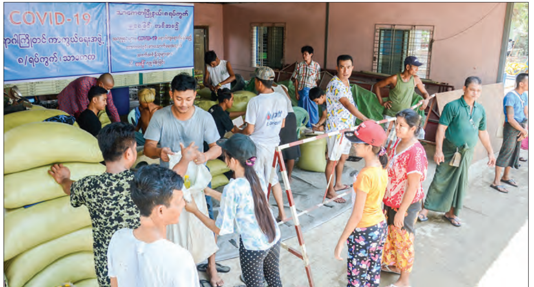
Private donors supply basic household food including rice and cooking oil to the local people with no regular income in Ward-8 in Thakayta Township yesterday. The aid reached to over 9,000 people from 2,000 households.