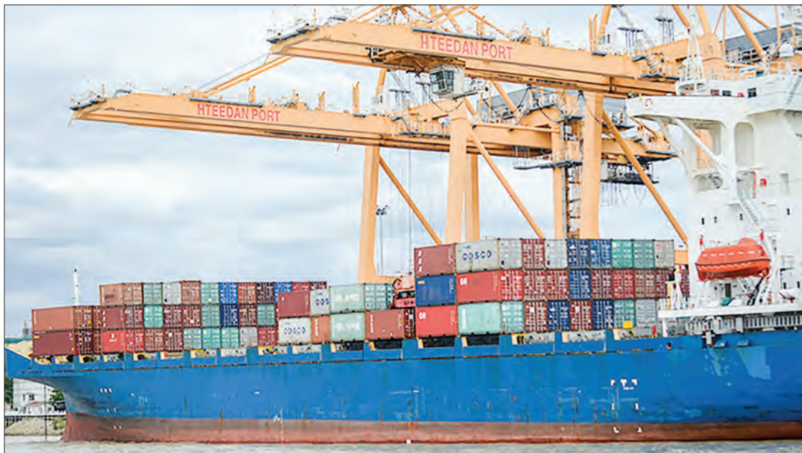
A container ship docking at a terminal in Botahtaung, Yangon.

Myanmar shipped 3.6 million tonnes of rice in the 2017-2018 fiscal year, which was a record in rice exports. The export volume plunged to 2.29 million metric tons, worth $691 million, in the 2018-2019FY.—Ko Khant (Translated by Ei Myat Mon)