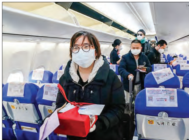
Passengers board flight MU2527 of China Eastern Airlines at the Tianhe International Airport in Wuhan, central China's Hubei Province, 8 April, 2020.

"When people come out, infections will probably rise. I'm really afraid of this," said "Ah Ping", a nickname.