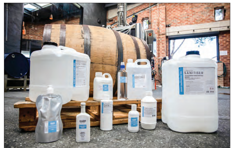
Undated photo of hand sanitizer made by Earp Distilling Co. in Newcastle.

Hundreds of police officers in Australia and New Zealand have been deployed to stop holidaymakers from reaching beaches, campsites and vacation homes