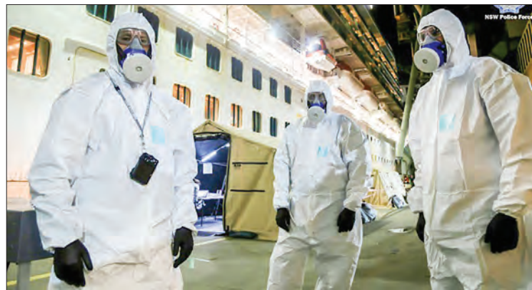
Police officers in protective gear prepare to board the coronavirus-stricken Ruby Princess cruise ship and seize its black box at Port Kembla, Australia.

used to be able to obtain observer status at the WHO's annual assembly, but diplomatic pressure from Beijing in recent years has pushed the island out of major international bodies.