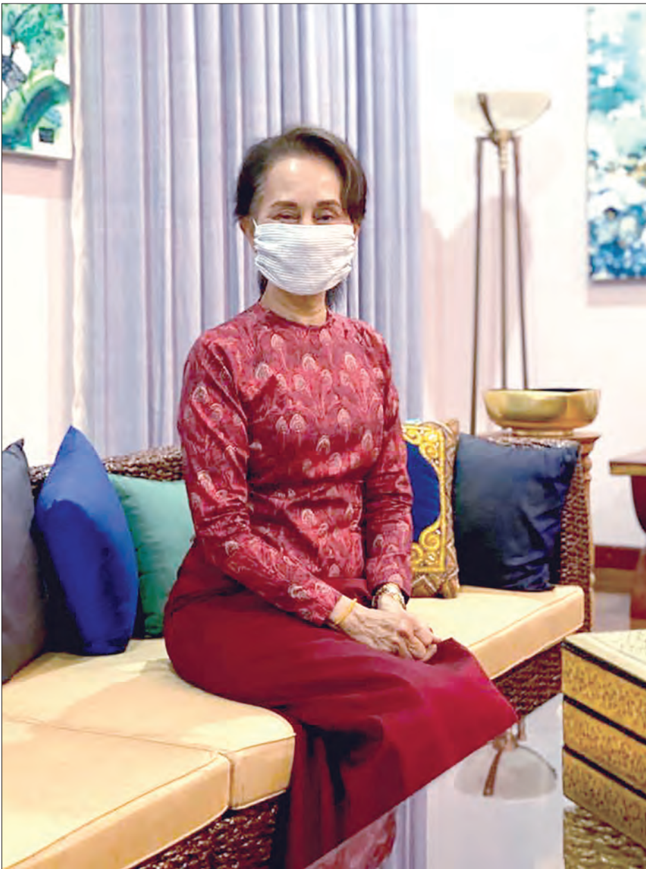
State Counsellor Daw Aung San Suu Kyi wearing a mask after making it herself at her home yesterday.