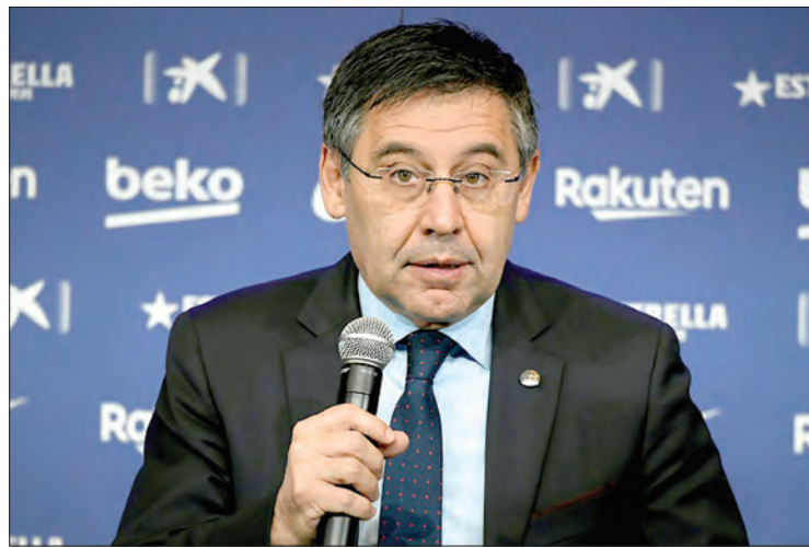
Josep Maria Bartomeu was elected Barcelona president in 2014.