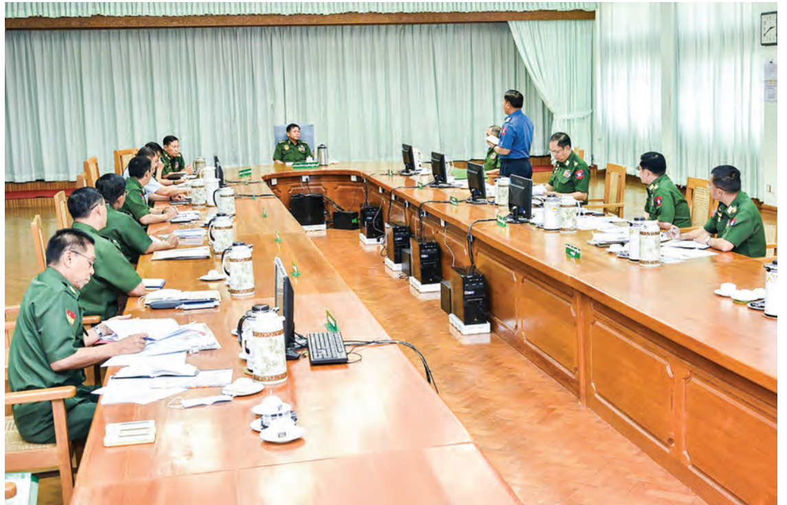
Senior General Min Aung Hlaing chairs the second coordination meeting to protect, treat and provide other necessary services to the public, Tatmadaw personnel and families regarding COVID-19.

The Senior General first delivered a speech. The meeting then discussed preparations to test people suspected of COVID-19, quarantined persons and accommodation arrangements, treating emergency patients and virus-positive patients in Tatmadaw hospital and other buildings, and acquiring necessary medical supplies. The Senior General replied to the discussion and delivered the closing speech.