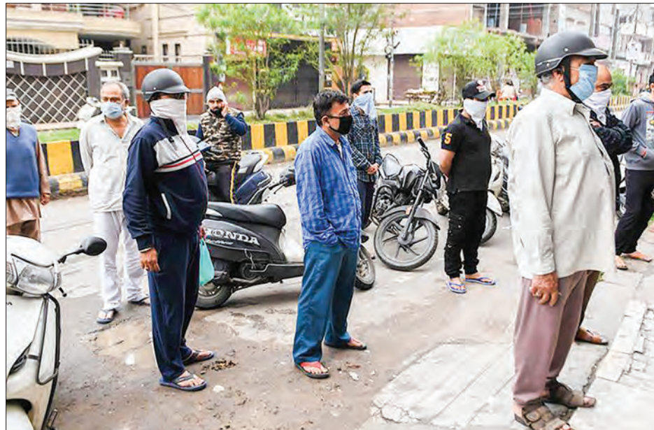
People wait for their turn to buy medicine outside a pharmacy during a government-imposed nationwide lockdown as a preventive measure against the COVID-19 coronavirus in Amritsar on 28 March, 2020.

British Investment Bank, Standard Chartered had slashed India's forecast to 2.7 per cent from 4.4 per cent earlier, while rating agencies Crisil and ICRA had revised it down to 5.2 per cent and 2 per cent respectively. —Xinhua