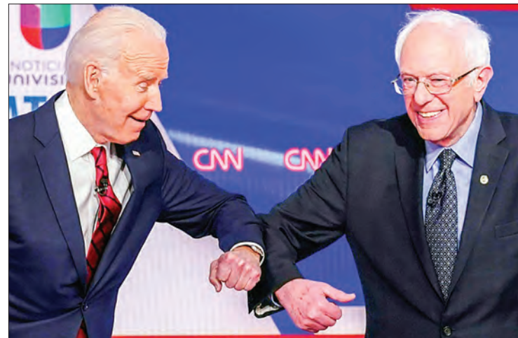
Democratic presidential hopefuls former US vice president Joe Biden (l) and Senator Bernie Sanders greeted each other with a safe elbow bump before the start of the 11th Democratic Party 2020 presidential debate on 15 March, 2020.

WASHINGTON — Leftist US Senator Bernie Sanders suspended his presidential campaign Wednesday, clearing the way for rival Joe Biden to secure the Democratic nomination and challenge Donald Trump in November.