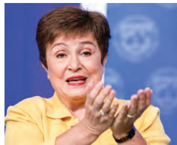
IMF Managing Director Kristalina Georgieva said the coronavirus will hit the global economy harder than anything since the Great Depression

The International Monetary Fund expects "global growth will turn sharply negative in 2020," with 170 of the fund's 180 members experiencing a decline in per capita income