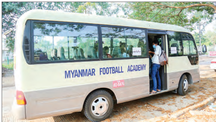
People going home after their quarantined period at Myanmar National Football Academy (Yangon) yesterday.