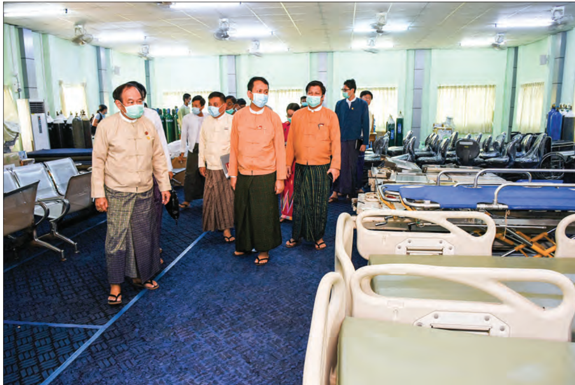
Union Minister Dr Myint Htwe, Yangon Region Chief Minister U Phyo Min Thein and officials observe the healthcare facility for treatment and quarantine of COVID-19 patients at the Central Institute of Civil Service (Lower Myanmar) in Phaunggyi yesterday.

Yangon Region Chief Minister U Phyo Min Thein also said the facility is scheduled to complete by 21 April with