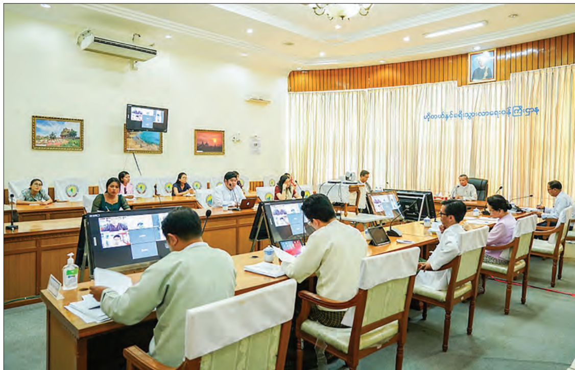
Union Minister for Hotels and Tourism U Ohn Maung holds the meeting with the team of LuxDev through video conference yesterday.

UNION Minister for Hotels and Tourism U Ohn Maung held a meeting with the team of LuxDev, the aid and development agency of the Luxembourg government, through video conference yesterday.