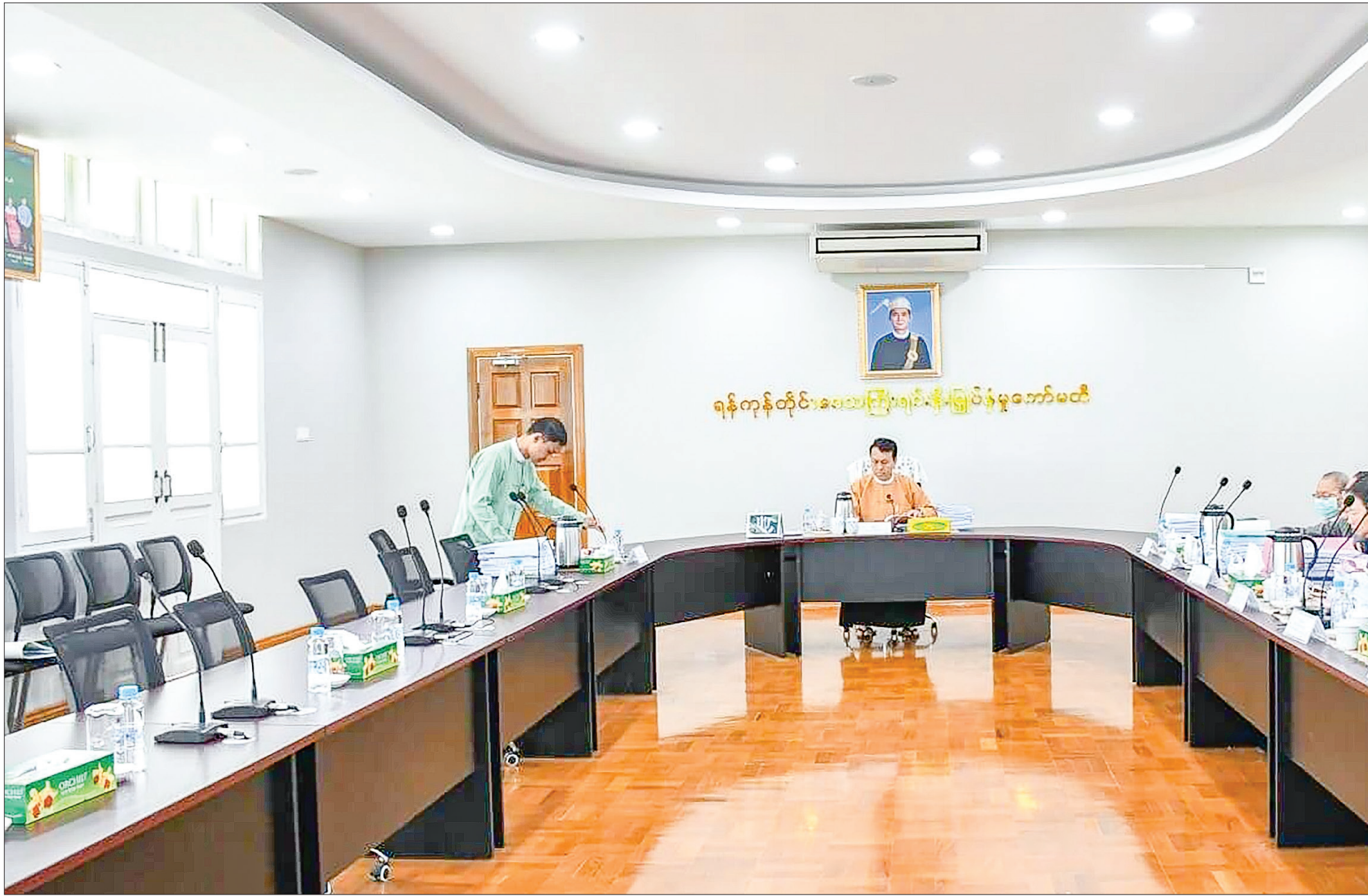
The Yangon Region Investment Committees meeting 5/2020, chaired by the Chairman of the Yangon Region Investment Committee U Phyo Min Thein, Chief Minister for the Yangon Region Government, held at 8:30 am on 13 th March 2020 at Yangon Region Investment Committee, Yangon and was attended, by Members of the Yangon Region Investment Committee. At the meeting, Yangon Region Investment Committee had already approved 10 Foreign Investment Businesses with the total capital amount of US$ 21.98 million from six countries in the manufacturing sector. Those approved 10 businesses are expected to create 7,334 local job opportunities.