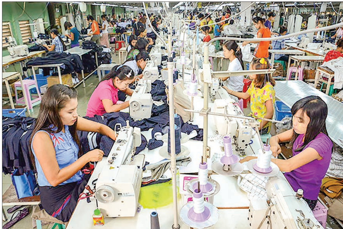
Textile workers sewing on production line at a garment factory in Hlinethaya Industrial Zone in Yangon.

At present, some CMP garment factories have shut down on the reason for the lack of raw materials due to the COVID-19 negative impacts, leaving thousands of workers unemployed. Even worse, some foreign en-