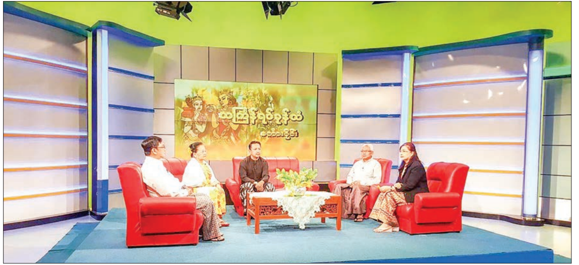
Thingyan talk is being shot at the MRTV, Yangon.

Academy Daw Swe Zin Htaik will be leading discussions while U Win Kyi of Sein Htay film production that pro-