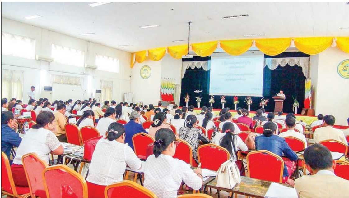
The opening ceremony of No.1/2019 Refresher Course for Assistant Directors in progress in Nay Pyi Taw.