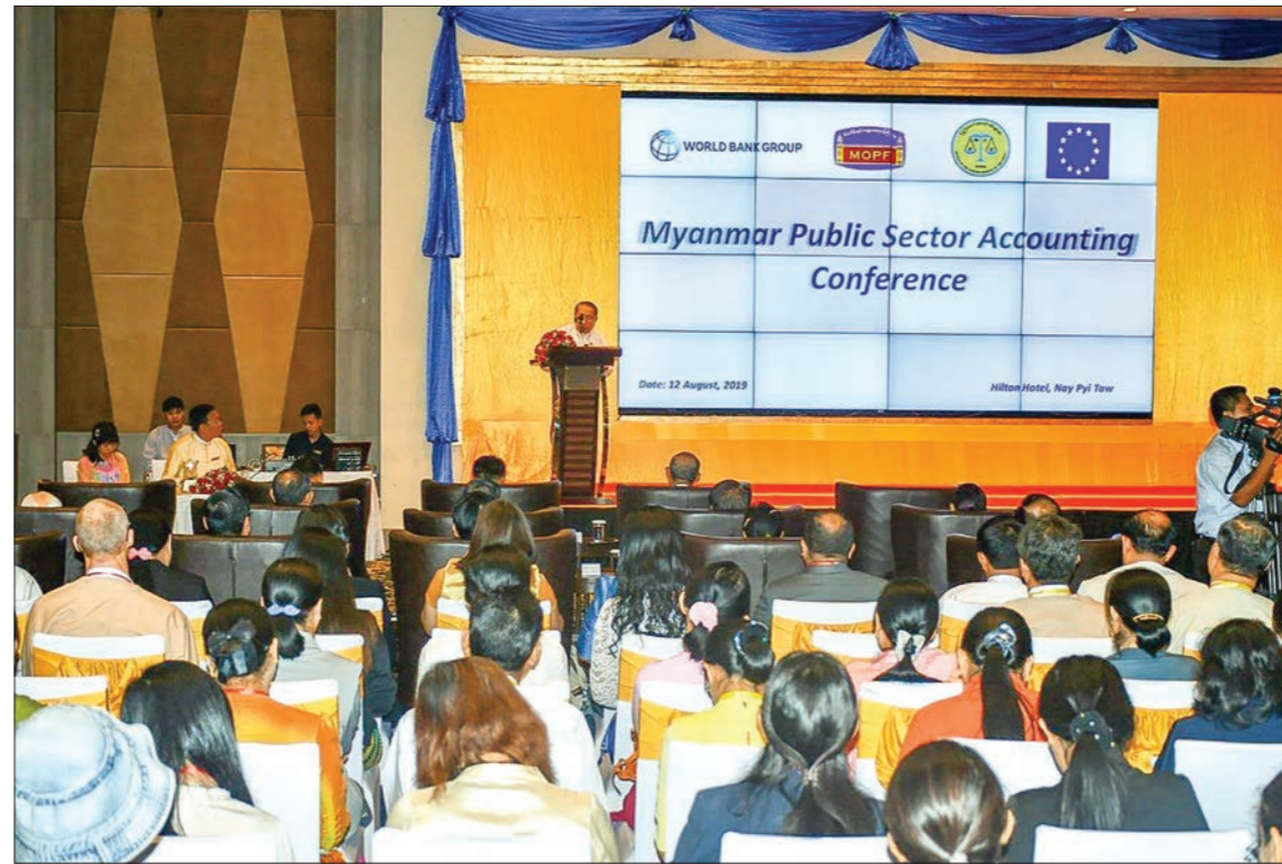
Union Auditor-General delivers an address at the Myanmar Public Sector Accounting Conference in Nay Pyi Taw on 12 August 2019.

State/regional auditors-general also submit reports concerning their state/regional budgets and funds to the local Hluttaw, in accord with Section 25-(a) and (d) of the Union Auditor-General Law.