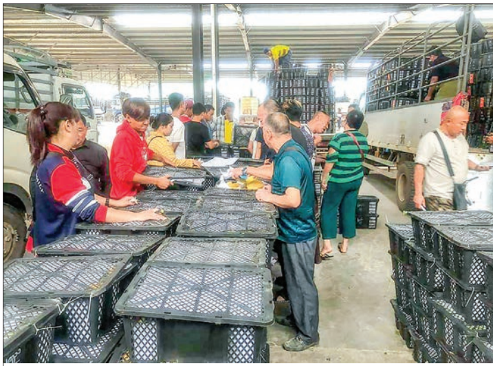
Mangoes market seen in Myanmar-China border.

"The price of mangoes has declined this year. All mango trees are blossoming but they do not bear the fruits because of the erratic weather condition. The local farmers are also really scared of the strong wind. Usually, the strong wind blows near the water festival. However, the mangoes are selling well," he added.