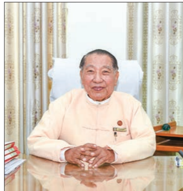
Union Auditor-General U Maw Than.