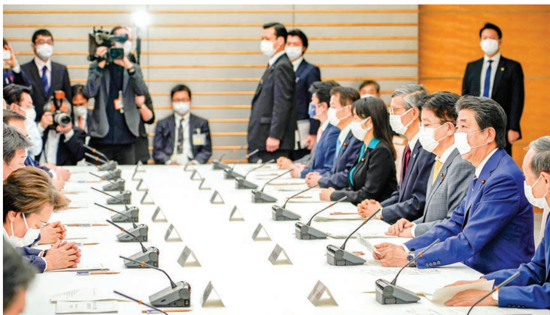
Japan's Prime Minister Shinzo Abe (2 nd r) speaks as he declares a state of emergency during a meeting of a task force against the COVID-19 coronavirus outbreak, at the prime minister's official residence in Tokyo on 7 April, 2020. Abe declared a month-long state of emergency in Tokyo and six other parts of the country over a spike in coronavirus cases.

On Wednesday the government will lift travel curbs on the