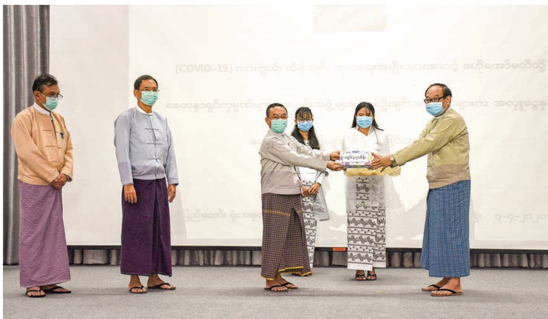
Union Minister Dr Myint Htwe receives the donations of cash and hospital equipment to the National-Level Central Committee on Prevention, Control and Treatment of Coronavirus Disease 2019 (COVID-19) yesterday.