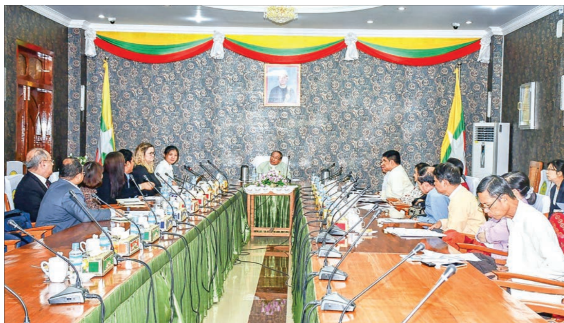
Union Auditor-General meeting with the delegates from ACCA, MICPA, and IFCA.