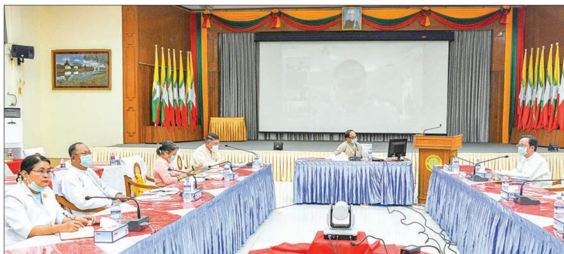
Union Minister Dr Myint Htwe attends a video conference with state/regional public health and medical services departments and various medical professionals yesterday.

The Union Minister said there are five important tasks to implement in this period: (a) proper management of quarantine sites, (b) raising health awareness with loudspeakers in townships, wards