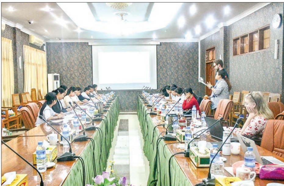
Experts from Norway conducting a training.