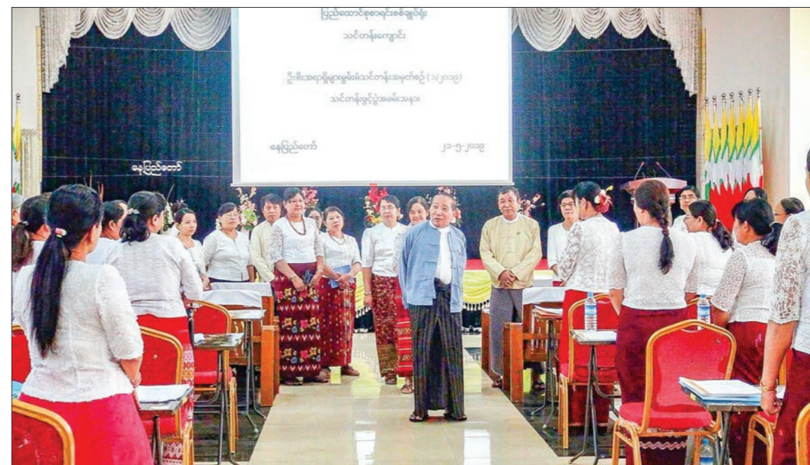
The opening ceremony of refresher course (1/2019) for heads of the staff in progress in Nay Pyi Taw.