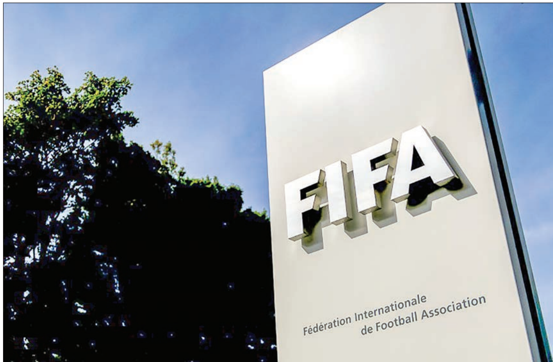
An indictment unsealed in New York on Monday detailed corruption allegations around the 2010 vote for 2018 and 2022 World Cups.

"Over a period of many years, the defendants and their co-conspirators corrupted the governance and business of international soccer with bribes and kickbacks, and engaged in criminal fraudulent schemes that caused significant harm to the sport of soccer.—AFP ■