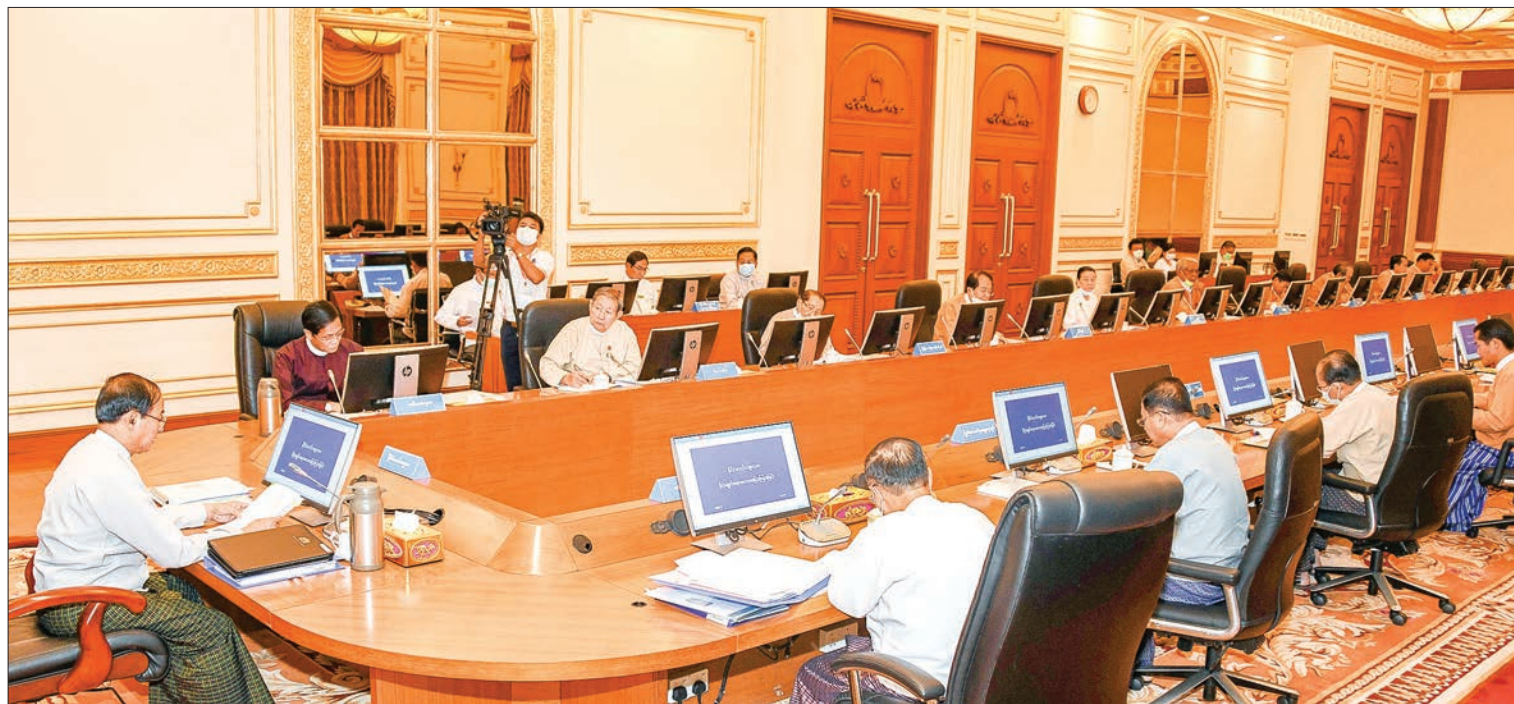
President U Win Myint attends the 1/2020 meeting of the Finance Commission in Nay Pyi Taw yesterday.

He also put emphasis on Directive No. 1/2017 of the Office of the President relating to the tender processes.