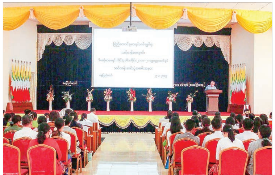
The closing ceremony of Diploma in Accountancy in progress in Nay Pyi Taw on 29 March 2019.