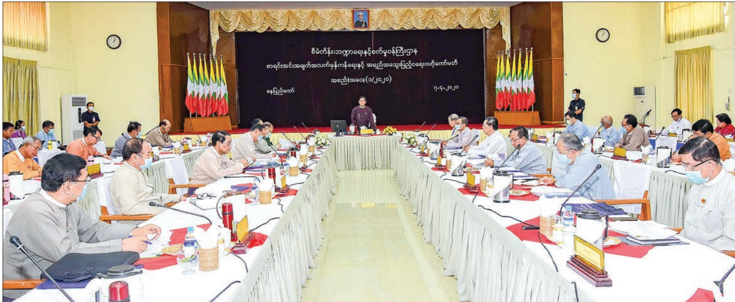
Vice President U Henry Van Thio addresses 1/2020 meeting of the Central Committee for Accurate and High Quality Statistics in Nay Pyi Taw yesterday.

THE Central Committee for Accurate and High Quality Statistics held its 10 th meeting and the first discussion in 2020 at the Ministry of Planning, Finance and Industry yesterday.