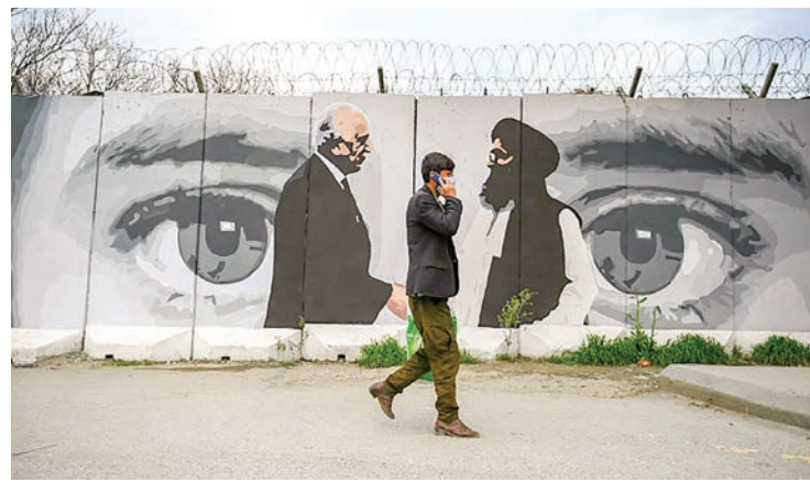
The Taliban's political spokesman has blamed the administration of Afghan President Ashraf Ghani for delaying the prisoner release.

"Therefore, our technical team will not participate in fruitless meetings with relevant sides