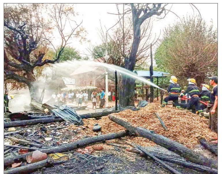
Firefighters seen extinguishing the fire.