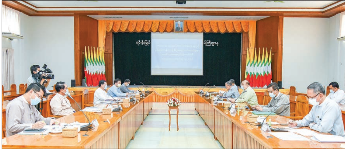
Union Minister U Thaung Tun attends the third meeting of the Working Committee to address the impact of COVID-19 on the country's economy yesterday.

THE third meeting of the Working Committee to address the Impact of COVID-19 on the country's economy was held at the Ministry of Investment and Foreign Economic Relations in Nay Pyi Taw yesterday morning.