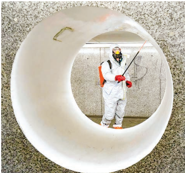
Markets responded favourably to news of a slowdown in some countries of new coronavirus cases.

And in the US epicentre New York, Governor Andrew Cuomo said that for the first time the growth rate there was flat, while on Tuesday, China — where