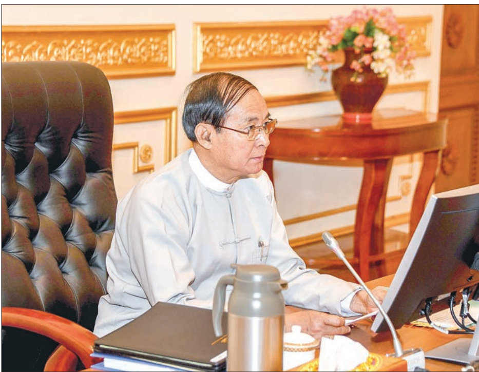
President U Win Myint delivers the speech at the 1/2020 meeting of the Finance Commission in Nay Pyi Taw yesterday.

T HE Finance Commission, chaired by President U Win Myint, discussed approval of supplementary budgets requested by the Union government and State/Regional governments for 2019-2020 fiscal year; and the submission of 2019-2020 Union Supplementary Budget Allocation Bill to the Pyidaungsu Hluttaw.