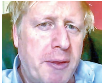
Boris Johnson has been in intensive care since Monday.

In a round of broadcast interviews, senior minister Michael Gove insisted the "work