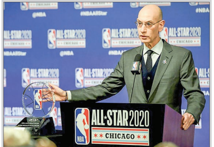
NBA Commissioner Adam Silver says he believes it will be at least May before the league can make any decision on resuming the 2019-20 season halted by the coronavirus pandemic.

The NBA was the first major US pro sports league to halt games, shutting down the season on the night of March 11 after Utah Jazz center Rudy Gobert became the first NBA player to test positive for the virus. The NBA regular season was set to end on April 15, with the playoffs due to start on April 18 heading toward the June NBA Finals. With continuing uncertainty over how the virus will continue to spread and when it might be contained Silver said no decision had been made as to whether to try to complete the regular season or possibly go straight to the playoffs.—AFP ■