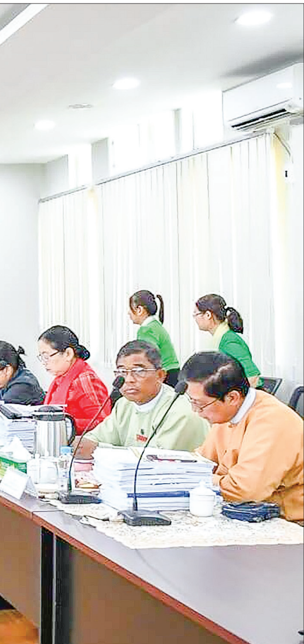
By Kyaw Htike Soe

including the Thilawa Special Economic Zone in Yangon Region that represents more than 50 per cent of the total industrial zones in the Southeast Asian country. Thilawa SEZ, Myanmar's first special economic zone is located on outskirts of Yangon City and had become fully operational since September 2015. The governments of Myanmar and Japan have agreed to jointly set up the special economic zone covering an area of approximately 2,400 hectares of land. A total of 81 factories in which around 40 businesses from Japan and 27 firms from Singapore have started commercial operations in Thilawa SEZ with an investment amount of US$ 1.92 billion. Japan topped the list of foreign investors in Thilawa SEZ, accounting for around 37 per cent of the overall investment, followed by Singapore and Thailand.