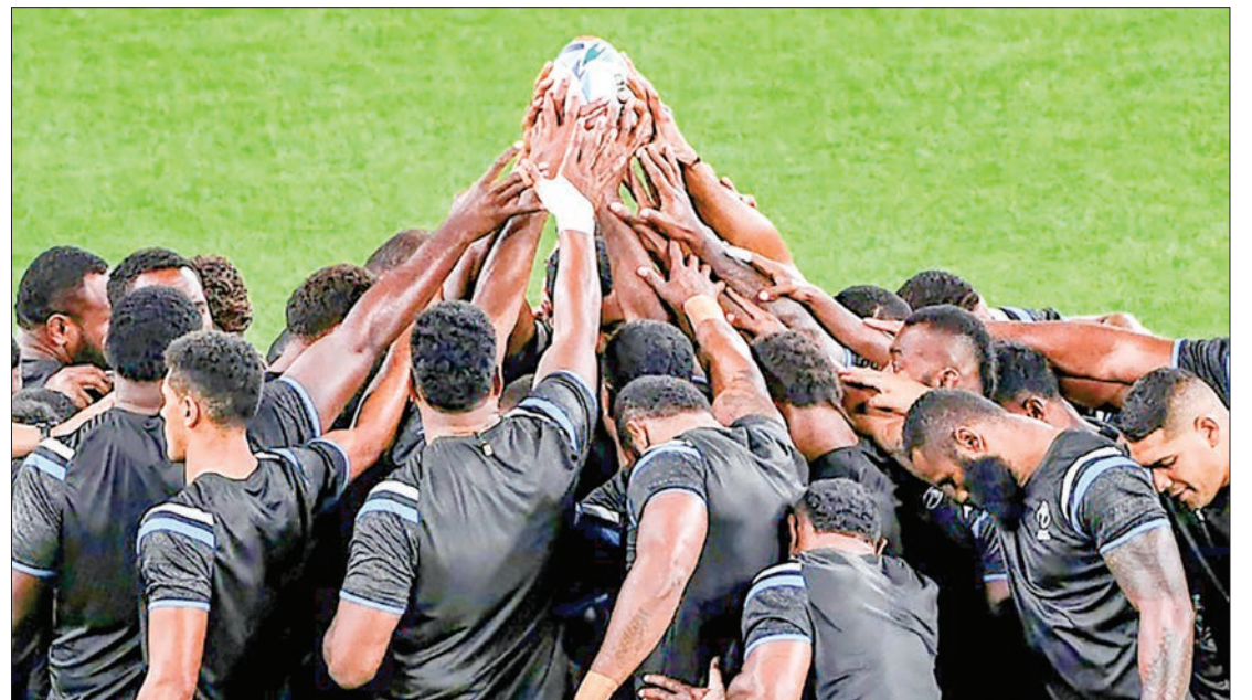
Fiji players and staff have agreed to 40 percent pay cuts as the union faces financial challenges due to the coronavirus.