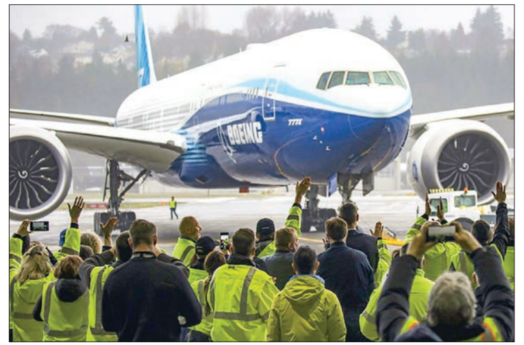
The coronavirus pandemic has forced aerospace giant Boeing to shut its factories in Washington state.