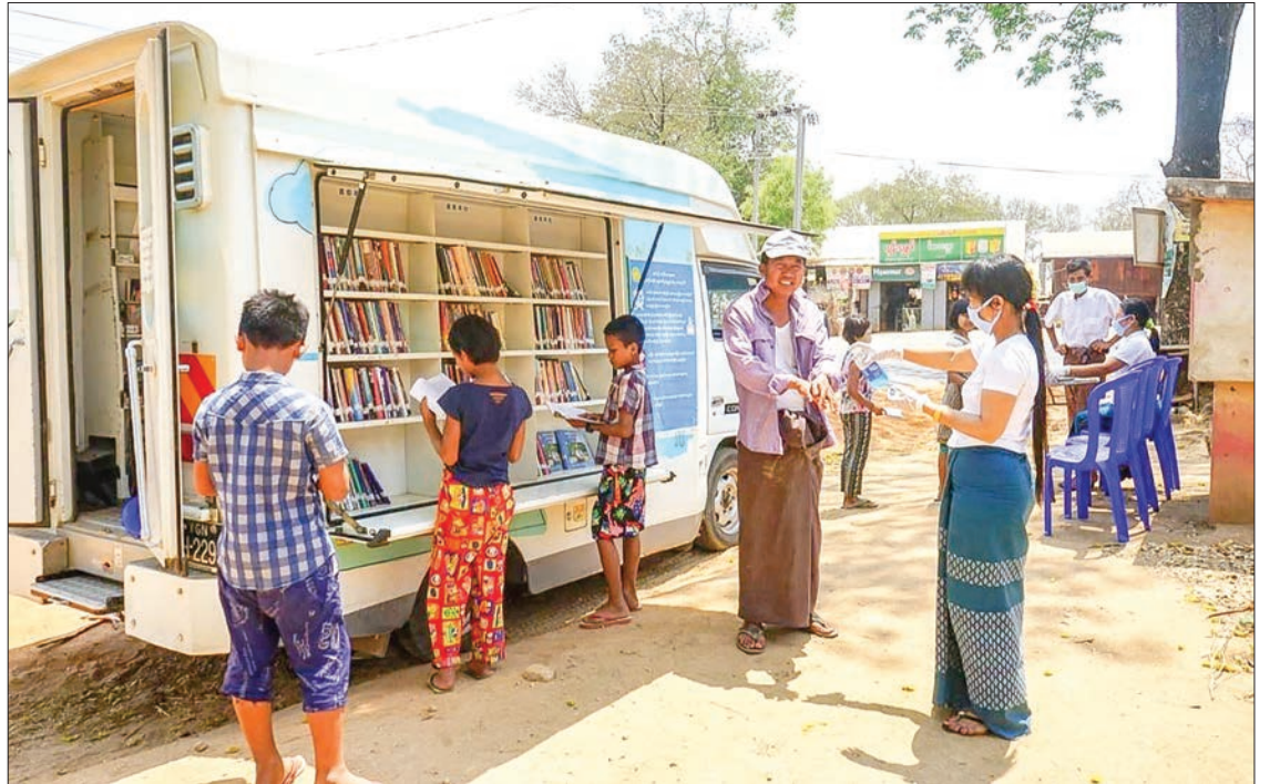
Officials demonstrate proper use of hand sanitizers, distribute pamphlets on COVID-19 and pass awareness on COVID-19 along with reading materials rental service from mobile libraries in Kwyel Min Kya Village, Natmauk Township.

These activities were carried out in Kwyel Min Kya and Sitar villages of Natmauk Township in Magway Region, in Myaing Kalay, Barket, Hlaing Kabar and Pinkyi villages, the silk weaving school, prosthetic factory, government offices and wards of Hpa-an Township in Kayin State, and Gon Min Kwin village of Pobbathiri Township in Nay Pyi Taw.