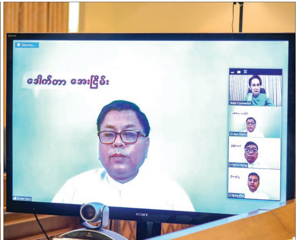
State Counsellor Daw Aung San Suu Kyi discusses with COVID-19 frontline healthcare workers from Bago Region.

S TATE Counsellor Daw Aung San Suu Kyi, Chairperson of the National-Level Central Committee on Prevention, Control and Treatment of Coronavirus Disease 2019 (COVID-19), held discussions with health workers and local authorities in Bago Region on their measures against the pandemic.