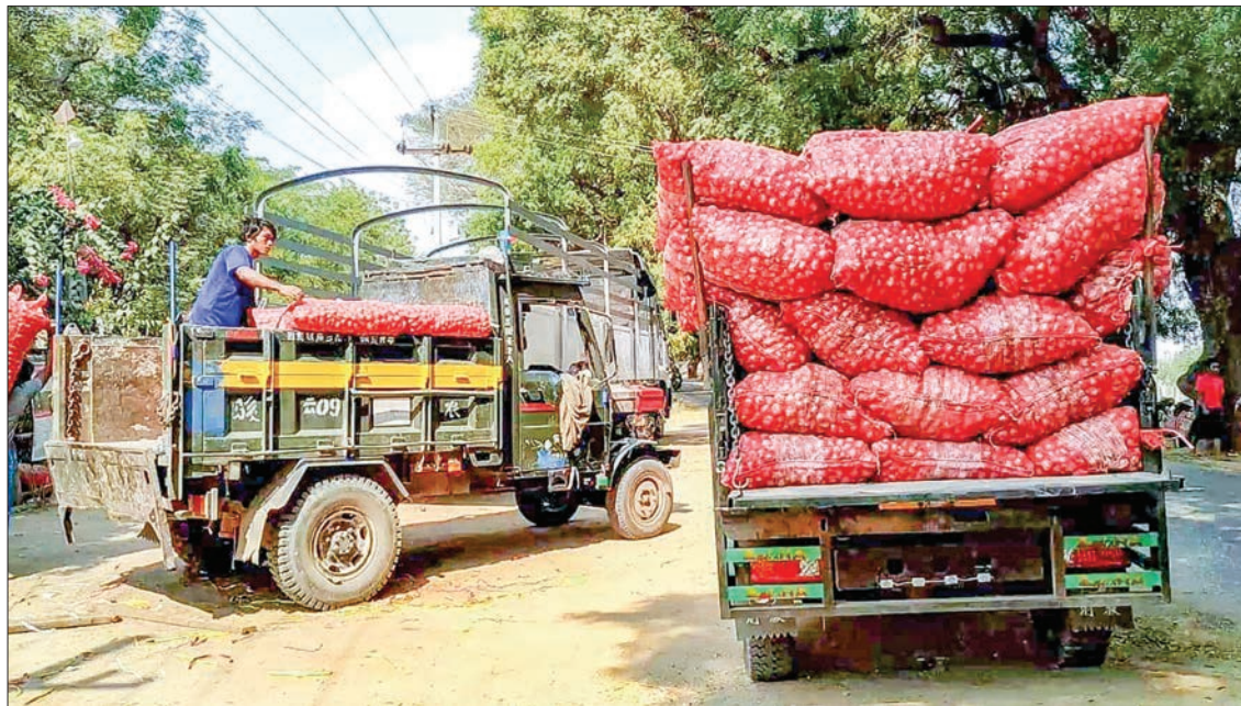
Trucks loaded of onions seen in Monywa.