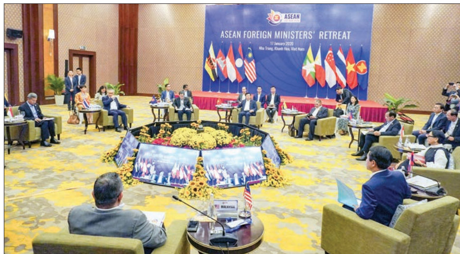
Foreign Ministers from members of the Association of Southeast Asian Nations meet in Vietnam’s Nha Trang on 17 January 2020.

Last month, Vietnam, which holds the rotating chairmanship of ASEAN this year, informed its fellow members that a leaders’ summit to be hosted by the country would be postponed from April to late June, a diplomatic source said.