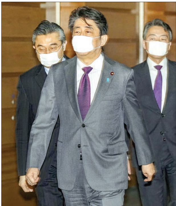
Japanese Prime Minister Shinzo Abe (c) leaves his office in Tokyo on 5 April 2020.