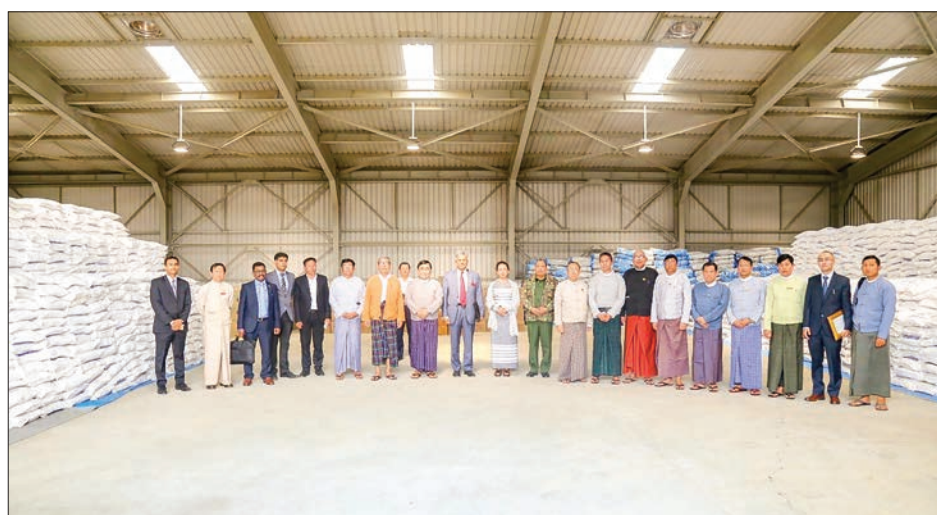
Union Minister Dr Win Myat Aye poses for a group photo at the ceremony to hand over the supplies donated by the Government of India at a port in Sittway on 21 January 2020.