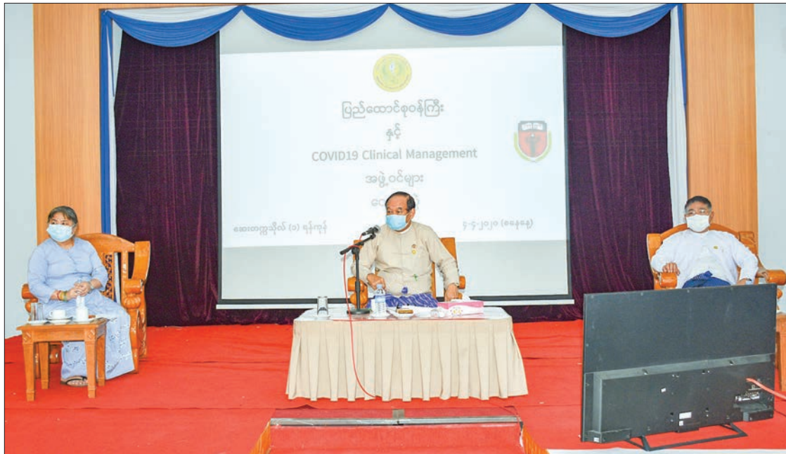
Union Minister Dr Myint Htwe attends the meeting with COVID-19 Clinical Management Team at the Medical Skill, Simulation and Research Centre at University of Medicine (1) in Yangon on 4 April.

The Union Minister expressed his appreciation for the