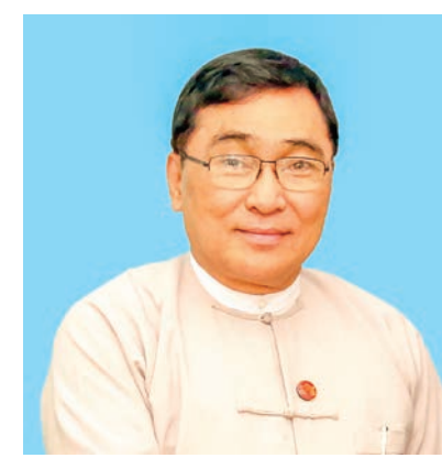
Union Minister Dr Win Myat Aye.

to Protection’. In Myanmar perspective, there is no ‘parentless children’, but there is only ‘bosom less children’. The State has opened up seven child care centers in the country. In the 4th year implementation tasks, with the donation and charity from the Child Protection Association, a Child Care Center with (100) kids capacity would be opened in Nay Pyi Taw. Single mothers would be taken care in one venue,” the Union Minister described.