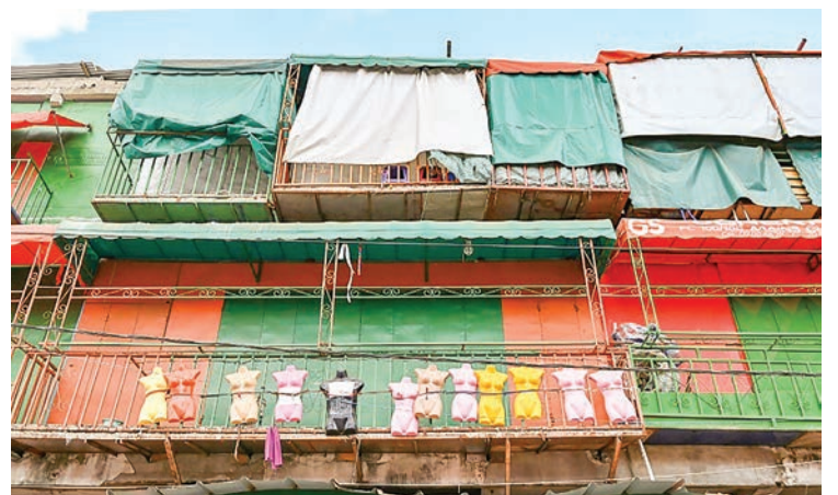
The authorities have already closed shops selling non-essential items as part of measures to limit the spread of the virus.

Nevertheless, the authorities are trying to increase their capacity to treat the outbreak. President Alassane Ouattara declared a state of emergency on 23 March. Abidjan has already been placed under quarantine, effectively cut off from the rest of the country, and a nationwide overnight curfew is in force. Schools, churches and non-essential shops have been closed and gatherings have been banned. — AFP ■