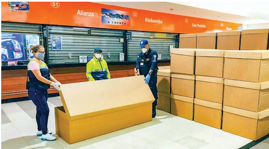
The cardboard coffins "will be a great help in providing a dignified burial for people who died during this health emergency," the Guayaquil mayor's office tweeted.