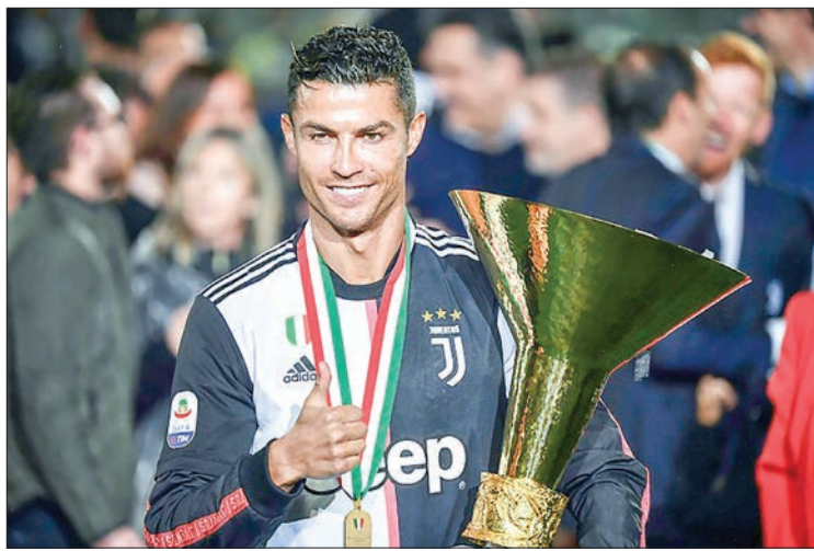
Cristiano Ronaldo’s Juventus won Serie A last year.

MILAN (Italy) — The head of the Italian footballers’ association (AIC) on Sunday urged football authorities in the country to strike a deal to safeguard lower league players, who risk losing their livelihoods due to the deadly coronavirus pandemic.