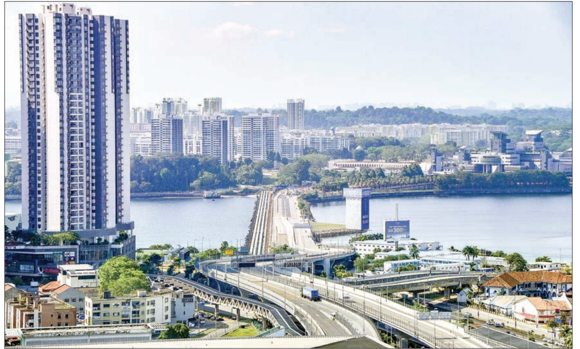
Photo taken from Malaysia's Johor Bahru shows almost empty roads near the border with Singapore on 18 March 2020, after Malaysia imposed a two-week nationwide lockdown to curb the spread of the new coronavirus.

But even if a deal is reached, there is scepticism that suggested cuts of 10 million barrels a day will be enough to help the oil market, owing to a collapse in demand caused by the pandemic. —AFP ■