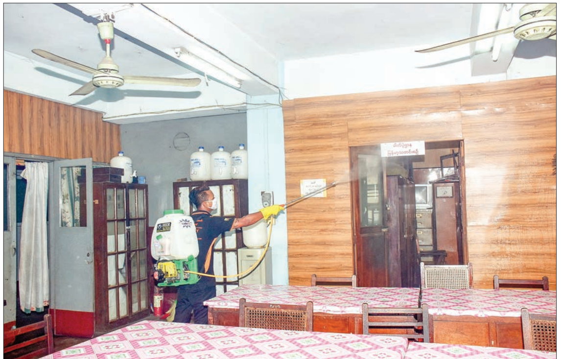
Volunteer from the Young Men Christian Association sprays disinfectants in the offices of the News and Periodicals Enterprise, Yangon, yesterday.