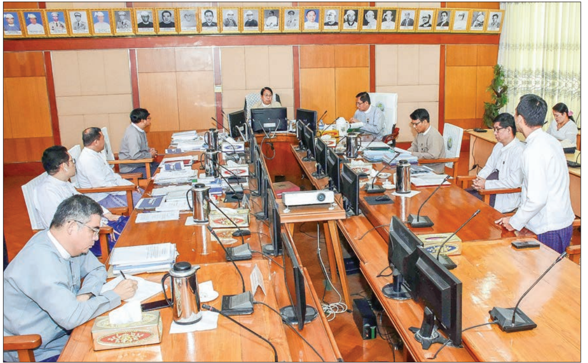
Union Minister Dr Pe Myint held the meeting with officials from ABC Content Solution Co Ltd (Mahar Mobile Application) in Nay Pyi Taw yesterday.

ABC Content Solution Co Ltd manages Mahar Channel, Mahar Mobile App, Piti Video, Mahar YouTube channel and Mahar Facebook Page. Mahar Mobile App is their latest venture and will have two thousand movies, including Myanmar films, free for viewing from 1 to 30 April. The company is issuing 3 million Promo Codes for this event. Type in 230320 in the Mahar Mobile App to obtain your free one-month pass.—MNA (Translated by Zaw Htet Oo)