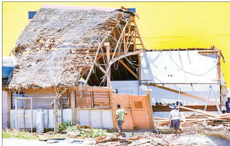
Cyclone Harold is strengthening and threatening Vanuatu, which is still recovering from the devastation unleashed by Cyclone Pam in 2015.

De Gaillande said Vanuatu's government could face a balancing act between helping cyclone-devastated communities and potentially importing the virus by allowing in international aid.—AFP ■ "We will need inter-