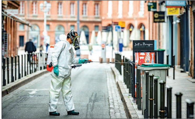
A municipal worker wearing protections spray disinfectant products in the street of Toulouse, southern France on 6 April, 2020, on the 21 st day of a strict nationwide confinement in France seeking to halt the spread of the COVID-19 infection caused by the novel coronavirus.

"If the declaration is made, the public and private sectors will combine forces and deal