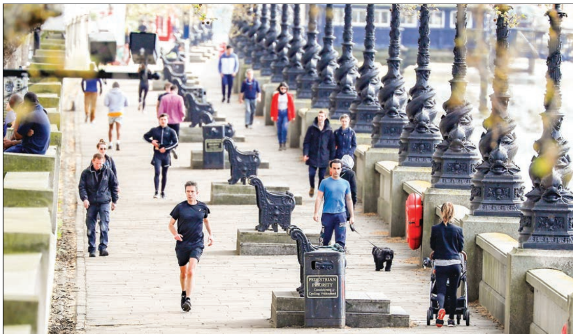
Pedestrians exercise along the embankment in central London as life in Britain continues during the nationwide lockdown to combat the novel coronavirus pandemic on 6 April 2020.