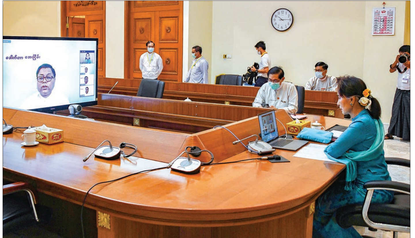
State Counsellor Daw Aung San Suu Kyi discusses with COVID-19 frontline healthcare workers from Bago Region.

Regarding the reduction of electricity bills, the State Counsellor said the rate of charges will be adjusted to avoid unfair losses among the stakeholders, including the state, the businesspersons and the people. She emphasized the role of public