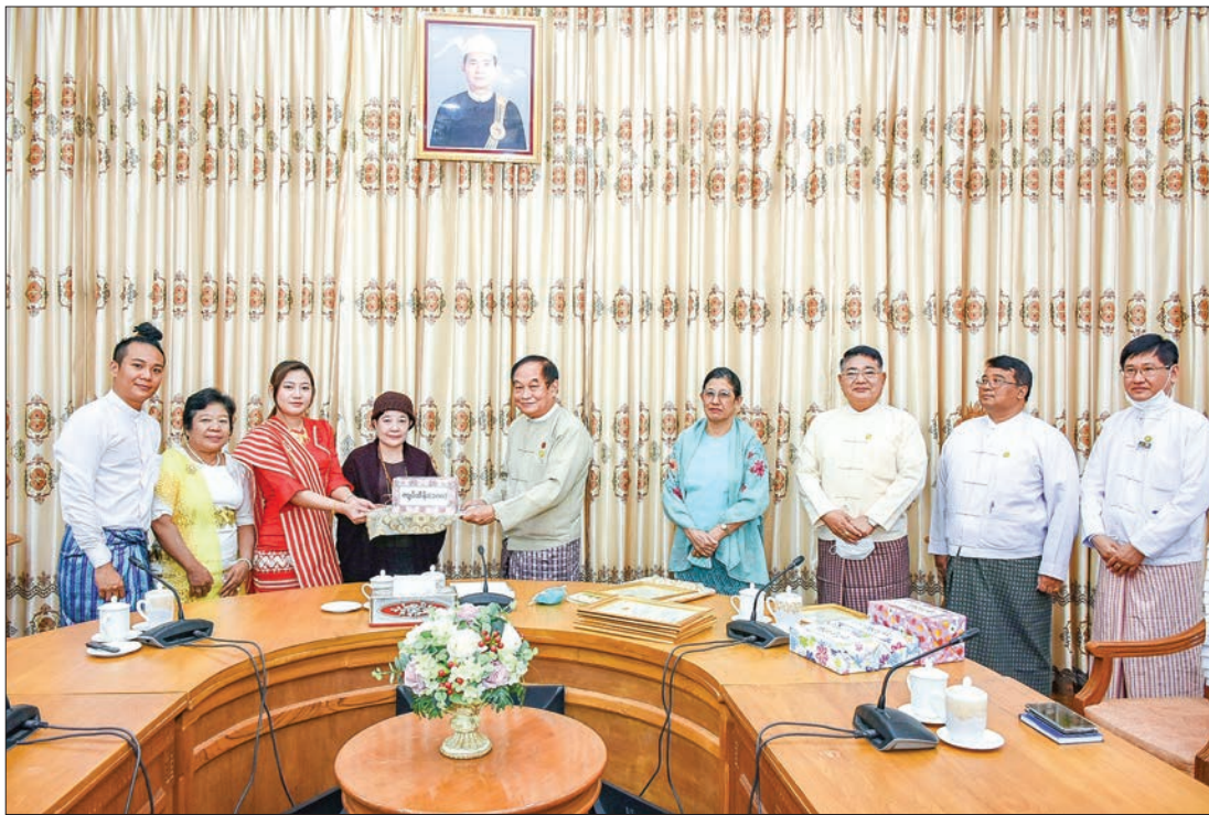
Union Minister for Health and Sports Dr Myint Htwe receives donations from well-wishers to the Department of Public Health for efficient uses in Nay Pyi Taw.

COMPANY, organization and individual donors donated financial assistance and hospital supplies to the National Central Committee on COVID-19 Prevention, Containment and Treatment in Nay Pyi Taw yesterday.