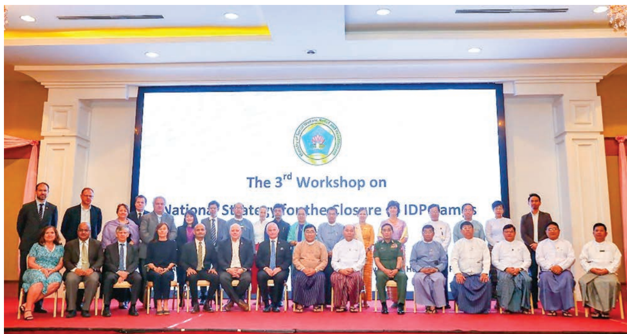
Union Minister Dr Win Myat Aye, and attendees pose for a group photo at the 3rd workshop on National Strategy for the Closure of IDP camps at the Horizon Lake View Resort Hotel in Nay Pyi Taw on 9 April 2019.

Ministry of Social Welfare, Relief and Resettlement is working with the power of the people: Union Minister Dr Win Myat Aye