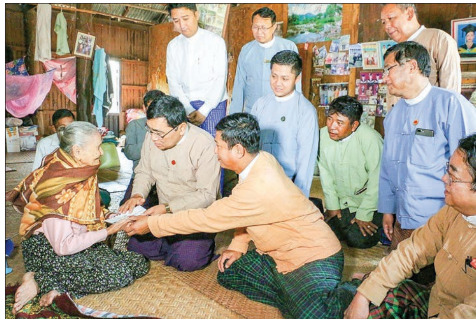
Union Minister Dr Win Myat Aye provides social pension of an elderly woman in Tatkon Village in Myothit Township, Magway Region on 9 December 2018.

National Standard Operation Procedure is in the process covering the receiving, the reintegration and the rehabilitation tasks for the victims of trafficked in persons. Standard norms have been drafted for adoption to prevent from being trafficking of the persons from the Internally Displaced People.