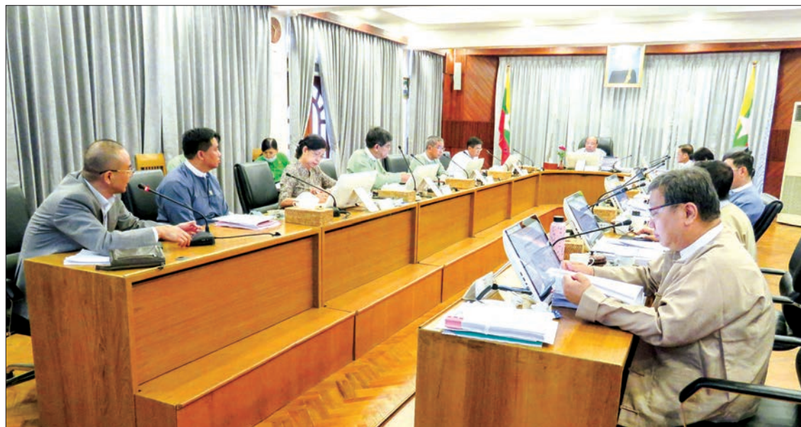
Union Minister U Thaung Tun attends the Myanmar Investment Commission meeting in Yangon yesterday.