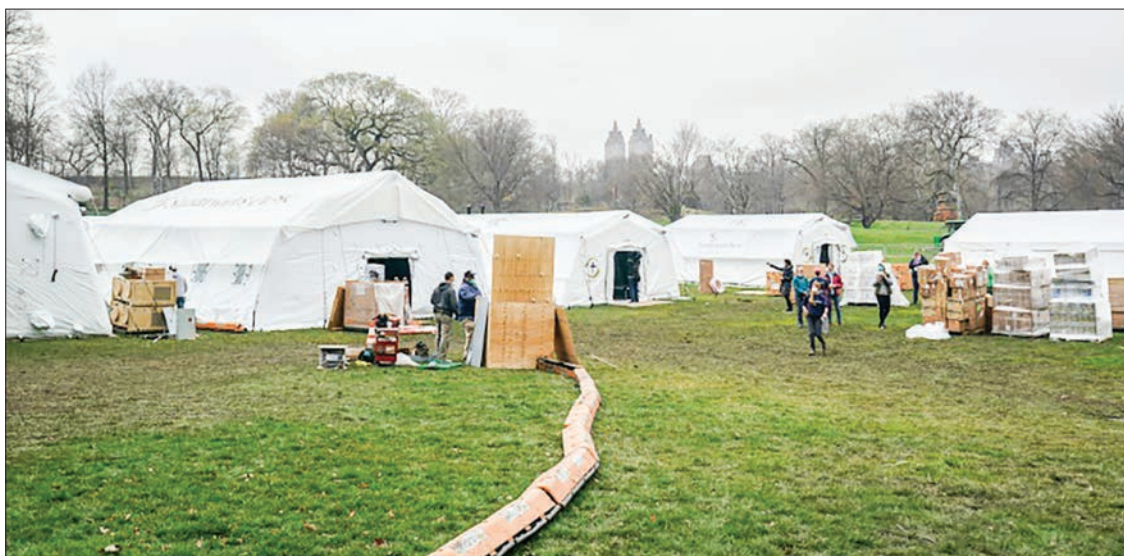
Volunteers from the International Christian relief organization Samaritan's Purse set up an Emergency Field Hospital for patients suffering from the coronavirus in Central Park on 30 March, 2020 in New York.

But Biden, who like most Americans remains hunkered down in his home, did stress how he has been offering his advice and proposing policies for weeks "for what I thought should be done." — AFP ■