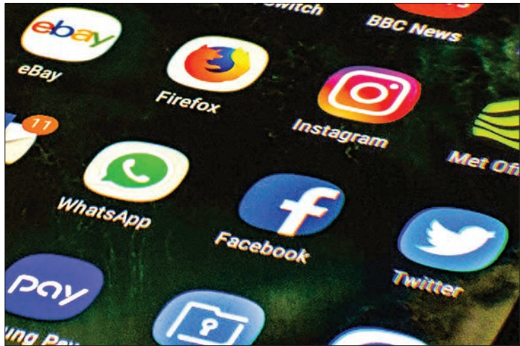
False information about the novel coronavirus poses a major, life-endangering problem for social media users.