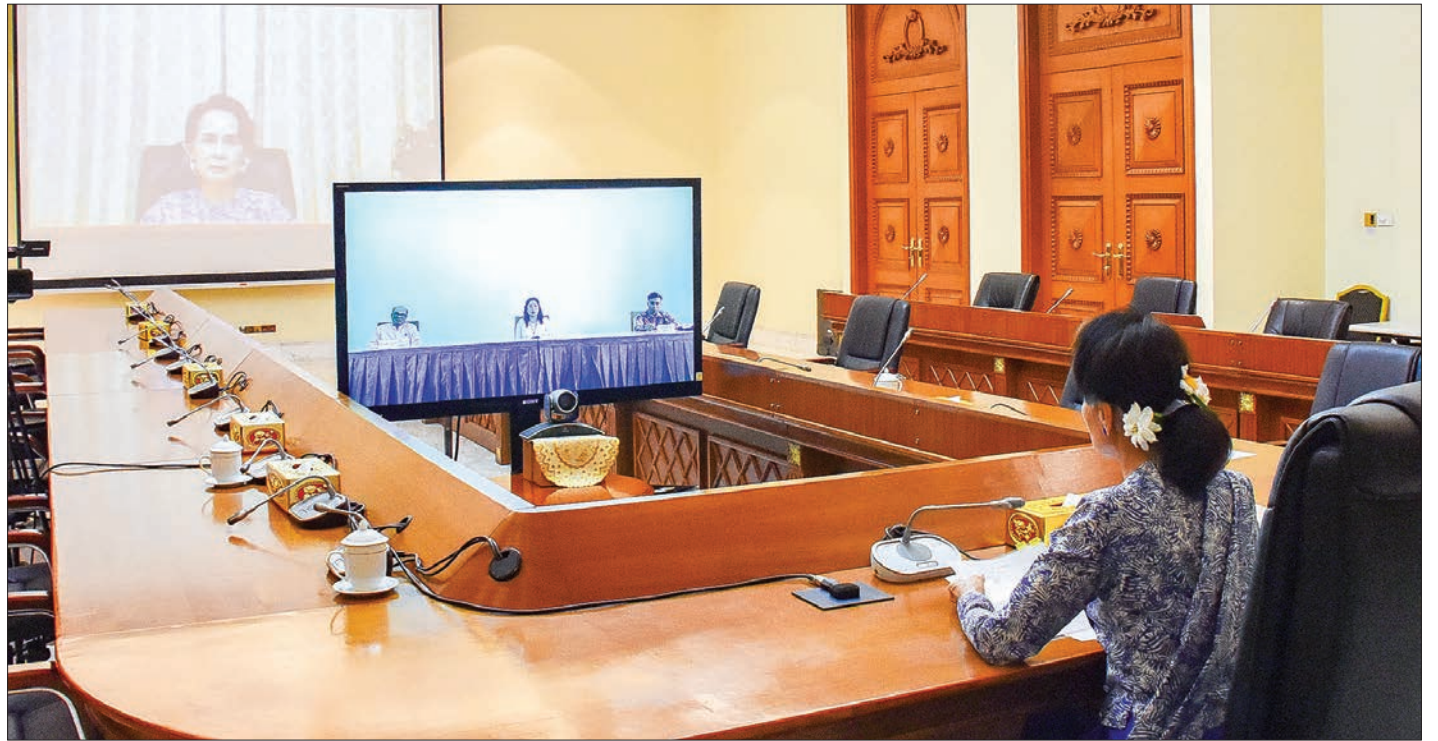
State Counsellor Daw Aung San Suu Kyi holds the video conference with COVID-19 frontline health care workers from Kayin State.

Afterwards, in her concluding remarks, the State Counsellor said that she was very happy to have the opportunity to have discussions in this manner. During this time of the COVID-19 pandemic, when the need was more for individuals to be closer at the mind level, there was