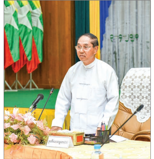
Vice President U Myint Swe delivers the speech at the meeting of the Coronavirus Disease 2019 Containment and Emergency Response Committee in Nay Pyi Taw yesterday.

T HE first coordination meeting of the Coronavirus Disease 2019 Containment and Emergency Response Committee was held at the Ministry of Home Affairs in Nay Pyi Taw yesterday.