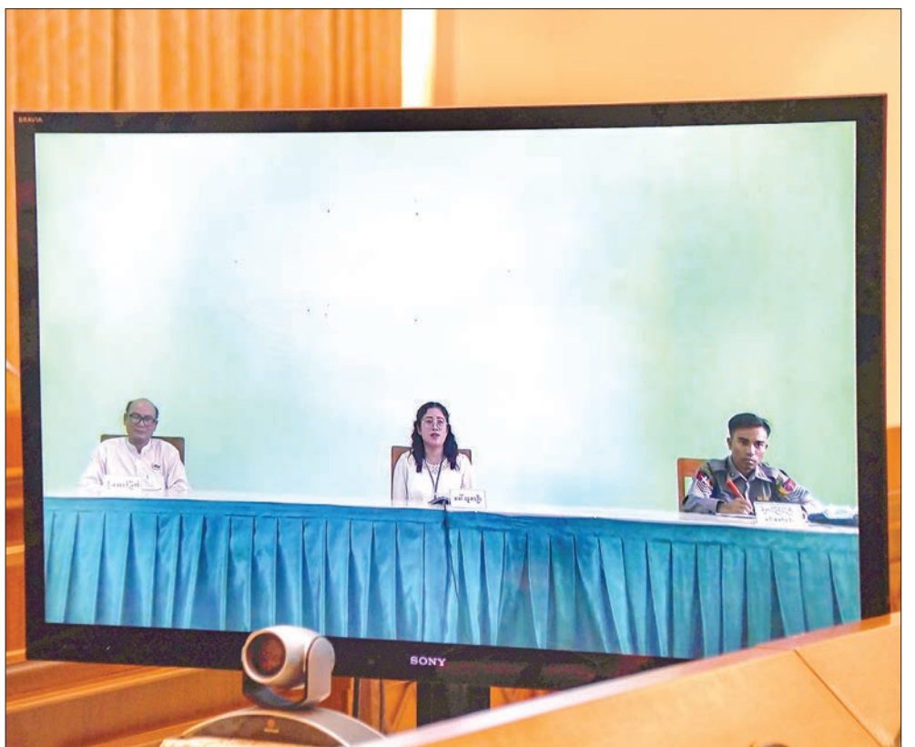
State Counsellor Daw Aung San Suu Kyi holds the video conference with COVID-19 frontline health care workers from Kayin State.

STATE Counsellor Daw Aung San Suu Kyi, Chairperson of the National Level Central Committee on Prevention, Control and Treatment of Coronavirus Disease