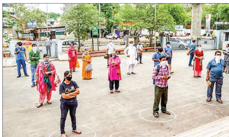
Customers stand on circles marked on the ground to maintain social distancing as they wait to enter the Reliance Mart mall during a government-imposed nationwide lockdown as a preventive measure against the COVID-19 coronavirus in Ahmedabad, India on 26 March, 2020.