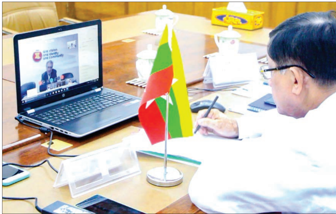
Deputy Minister U Maung Maung Win attends the ASEAN+3 Finance and Central Bank Vice Governors special teleconference yesterday.

DEPUTY Minister for Planning, Finance and Industry attended the ASEAN+3 Finance and Central Bank Vice Governors special teleconference yesterday.