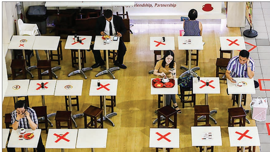
Social distancing markers are seen at a food outlet as authorities implement a social distancing measures to combat the spread of the COVID-19 pandemic on 2 April, 2020 in Singapore.

People are still allowed to go out to buy food at markets, or to get take-out from restaurants and other food outlets, Lee said, adding that they can also exercise in parks as long as they keep a safe distance from others. —Kyodo News ■