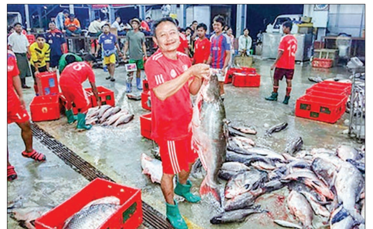
Workers collecting fishes at a fish market in Yangon.

580,000 tons in the 2018-2019FY, according to the Commerce Ministry.—Min Thit (Translated by Kyaw Zin Lin)