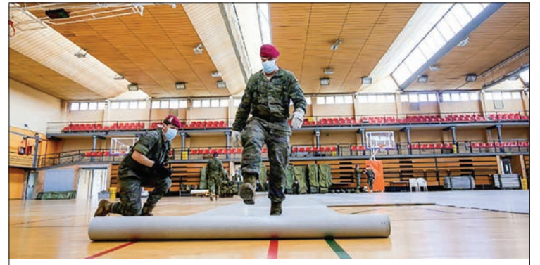
Spanish soldiers are setting up temporary shelters for homeless people in a country where more than 10,000 people have now died.