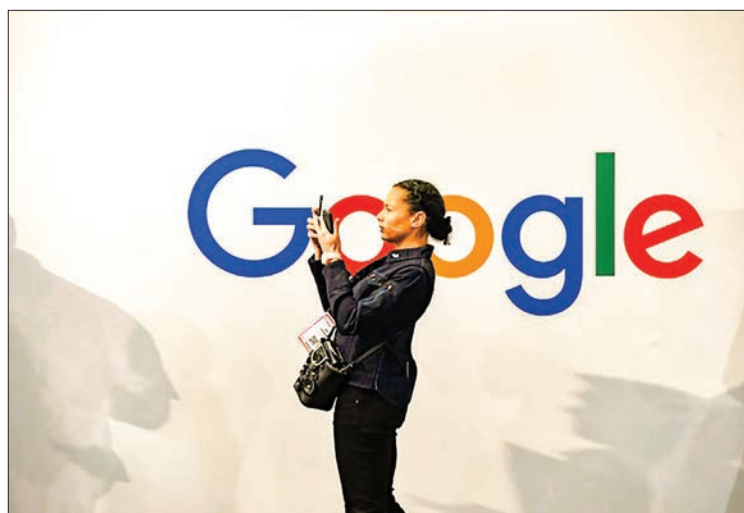
We know where you are.