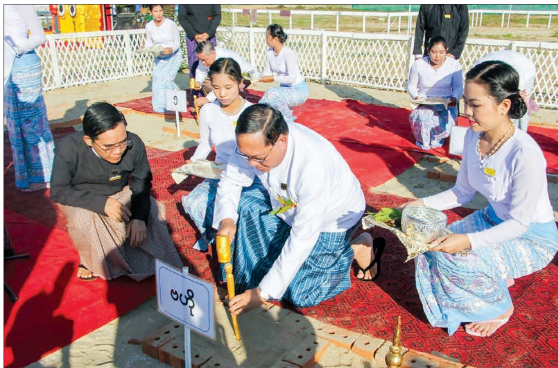
Union Chief Justice U Htun Htun Oo strikes the stake at the groundbreaking ceremony to build Judicial College of the Union Supreme Court in Nay Pyi Taw on 17 November 2019.

The system would be applied in the whole country beginning 2022.