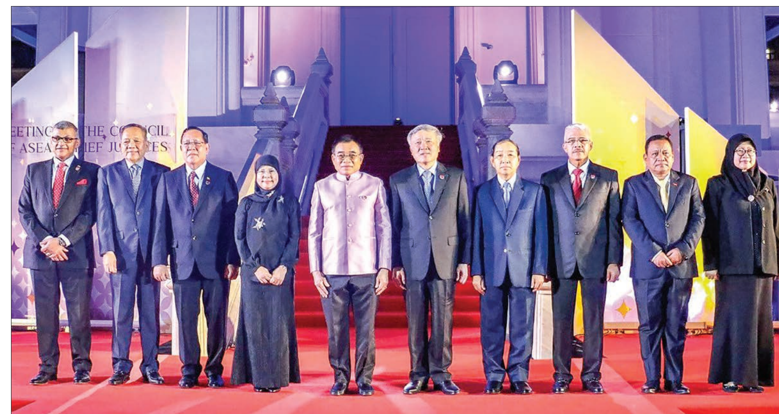
Union Chief Justice U Htun Htun Oo poses for a group photo with Chief Justices from other countries at the 7 th Council of ASEAN Chief Justices Meeting in Thailand on 23 November 2019.