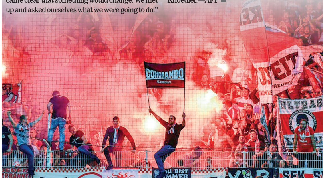
Stuttgart ultras are showing a flair for social work during the coronavirus lockdown.

"We are doing this for our city and our region. That is part of our self-understanding as ultras, that we are ready to help out where we can," said Knoedler.—AFP ■