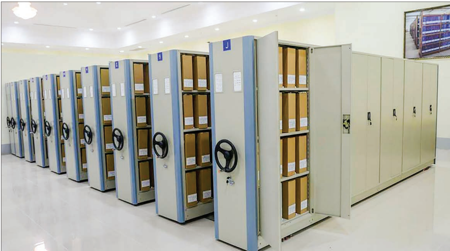
File cabinets in National Archives.