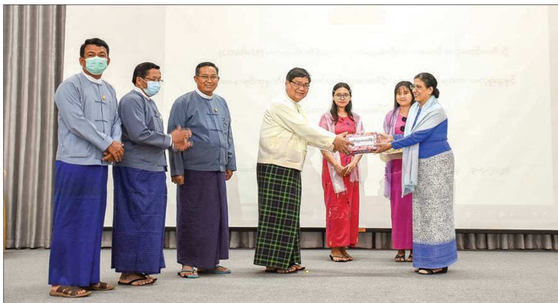
Deputy Minister Dr Mya Lay Sein receives the cash donation from the well-wishers for the National-Level Central Committee on Prevention, Control and Treatment of Coronavirus 2019 (COVID-19) Nay Pyi Taw yesterday.

THE National-Level Central Committee on Prevention, Control and Treatment of Coronavirus 2019 (COVID-19) welcomed donations of cash by well-wishers at the Ministry of Health and Sports in Nay Pyi Taw yesterday afternoon.