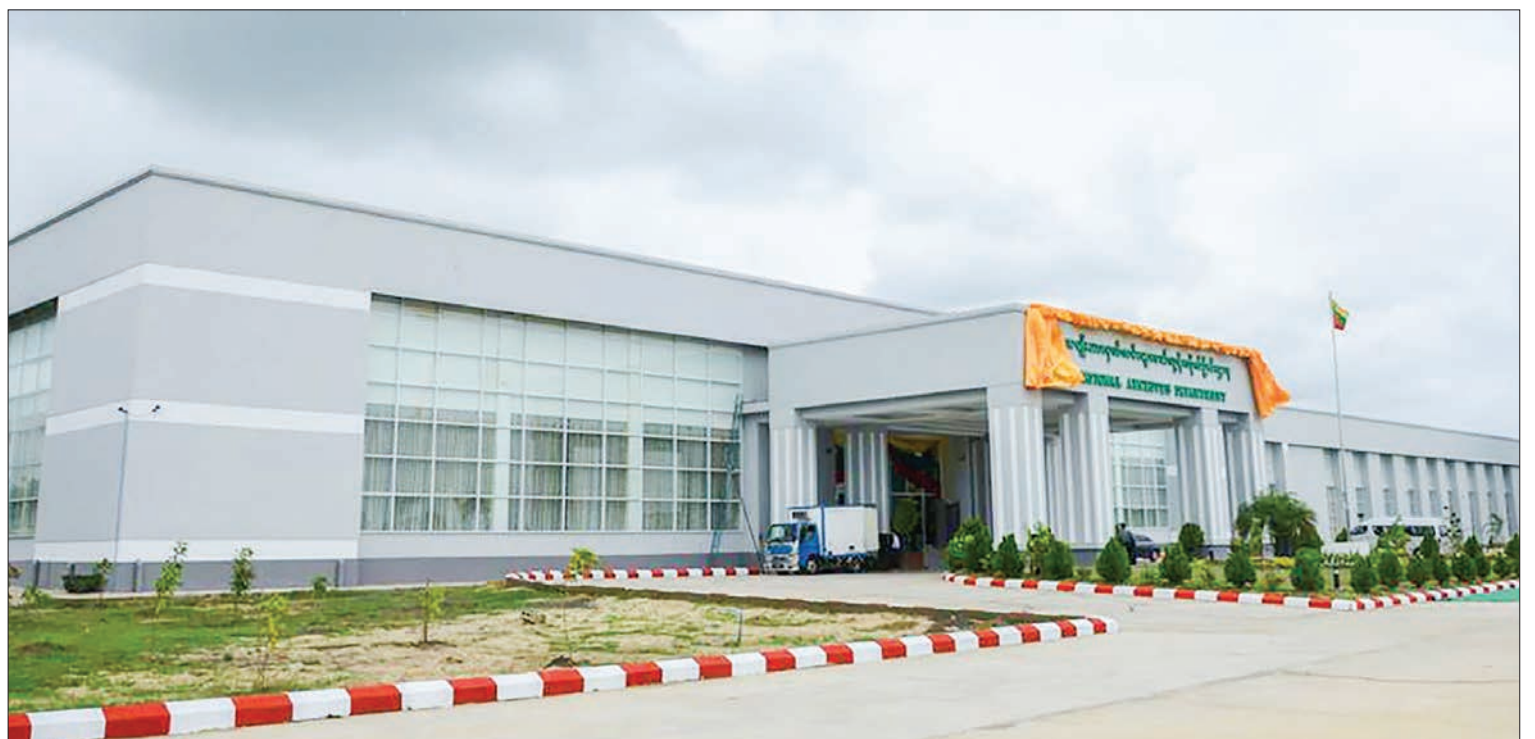
National Archives (Nay Pyi Taw).