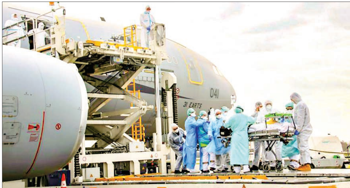
The six patients are in serious condition. Private ambulances brought them from the Moselle region to Findel airport, Luxembourg.

Tension has been brewing for weeks between the president known as the "Trump of the Tropics," who downplays COVID-19 as a "little flu," and the pediatric