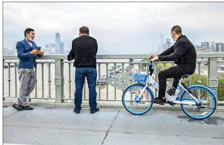
Men stand on a bridge over the Yangtze River in Wuhan on 30 March after travel restrictions into the city were eased following more than two months of lockdown.

"If we don't keep striving, what else in this world is worth striving for?" said Waiwai, owner of a small cafe which reopened Sunday but for take-out only