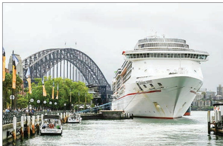
More than a dozen cruise ships are believed to be off Australia's coast, carrying around 15,000 crew and some experiencing outbreaks of coronavirus.

And the issue has become politically fraught, with local pundits dubbing the vessels "Death Ships" and one nervous state leader calling for the navy to intercept a cruise ship full of German tourists. — AFP ■