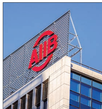
AIIB logo.

Proposed by China in 2013, the AIIB was launched in December 2015. Japan and the United States are the only Group of Seven industrial powers that have not joined the bank. —Kyodo News ■