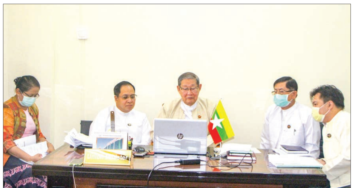
Union Minister U Soe Win attends a High-Level teleconference with ASEAN+3 member states, Mongolia, Timor-Leste, World Bank, IMF, ADB and AIIB in Nay Pyi Taw yesterday.

The meeting was attended by Deputy Ministers for Plan-