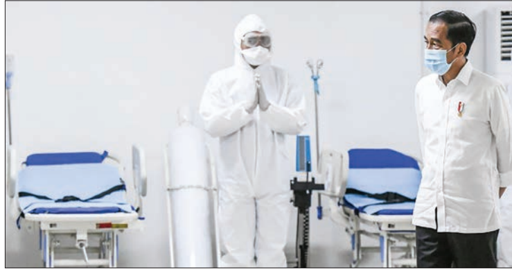
Indonesia's President Joko Widodo (2 nd r) examines a room while visiting the 2018 Asian Games athlete's village which has been converted into a hospital for COVID-19 coronavirus patients in Jakarta on 23 March, 2020.

The crisis has sent equity markets spinning as traders