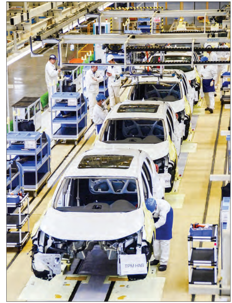
File photo taken on 12 April, 2019, shows Honda Motor Co.'s plant in Wuhan, China. The Japanese automaker said on 11 March, 2020, that it has resumed production at the factory, which was closed due to the spread of the new coronavirus.

Regular updates of credible information grant a brand voice legitimacy and authority, both of which come in handy when rumours and misinformation