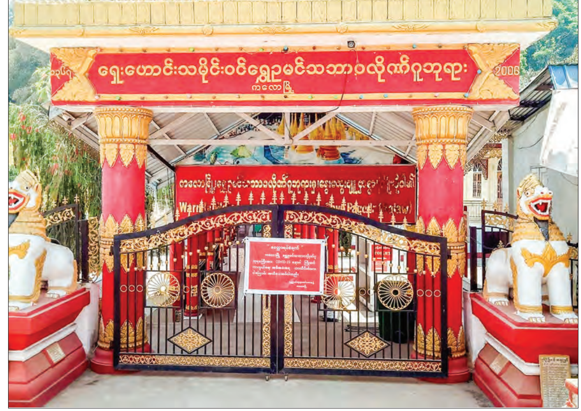
No visitors are allowed in Shwe Oo Min Natural Cave Pagoda amid COVID-19.

"The pagoda board of trustees has banned the visits to the Ohn Na Lone Mway Shin Stupa