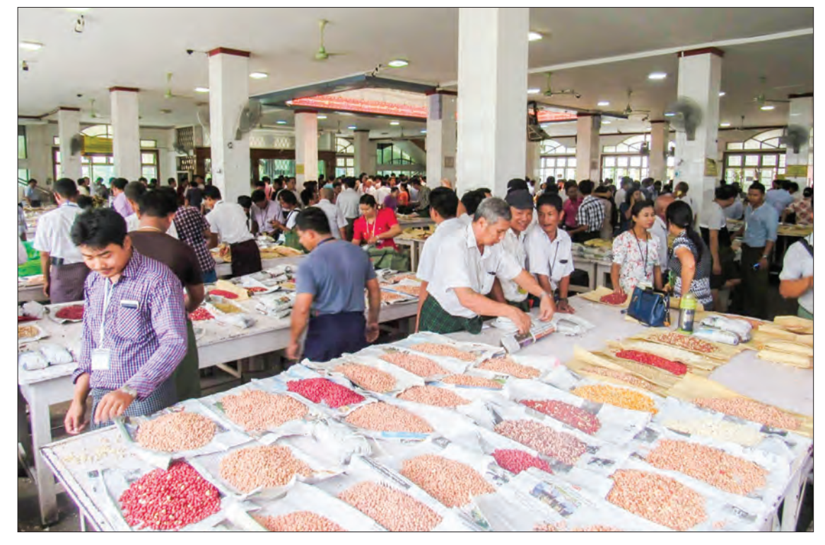
Myanmar's bean industry is showcasing beans and pulses.

"India notified import quota by end-March. Following