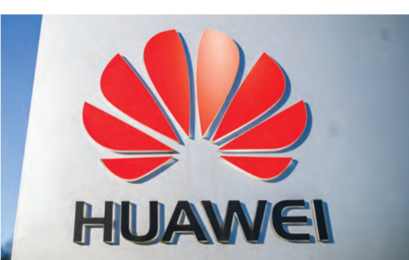
A photograph shows the logo of Chinese company Huawei at their main UK offices in Reading, west of London, on 28 January, 2020.

Huawei — the world's top supplier of telecom networking equipment and number-two smartphone