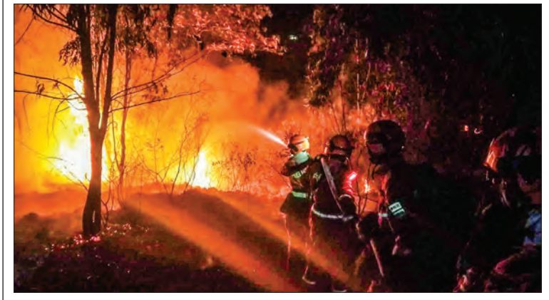
Firefighters battle a forest blaze in Xichang in China's southwestern Sichuan province early on 31 March, 2020. Eighteen firefighters and one forestry guide died while fighting a huge forest fire in southwestern China, the local government said on 31 March.

BEIJING (China) — Eighteen firefighters and one forestry guide died while fighting a huge forest fire in southwestern China, the local government said Tuesday.