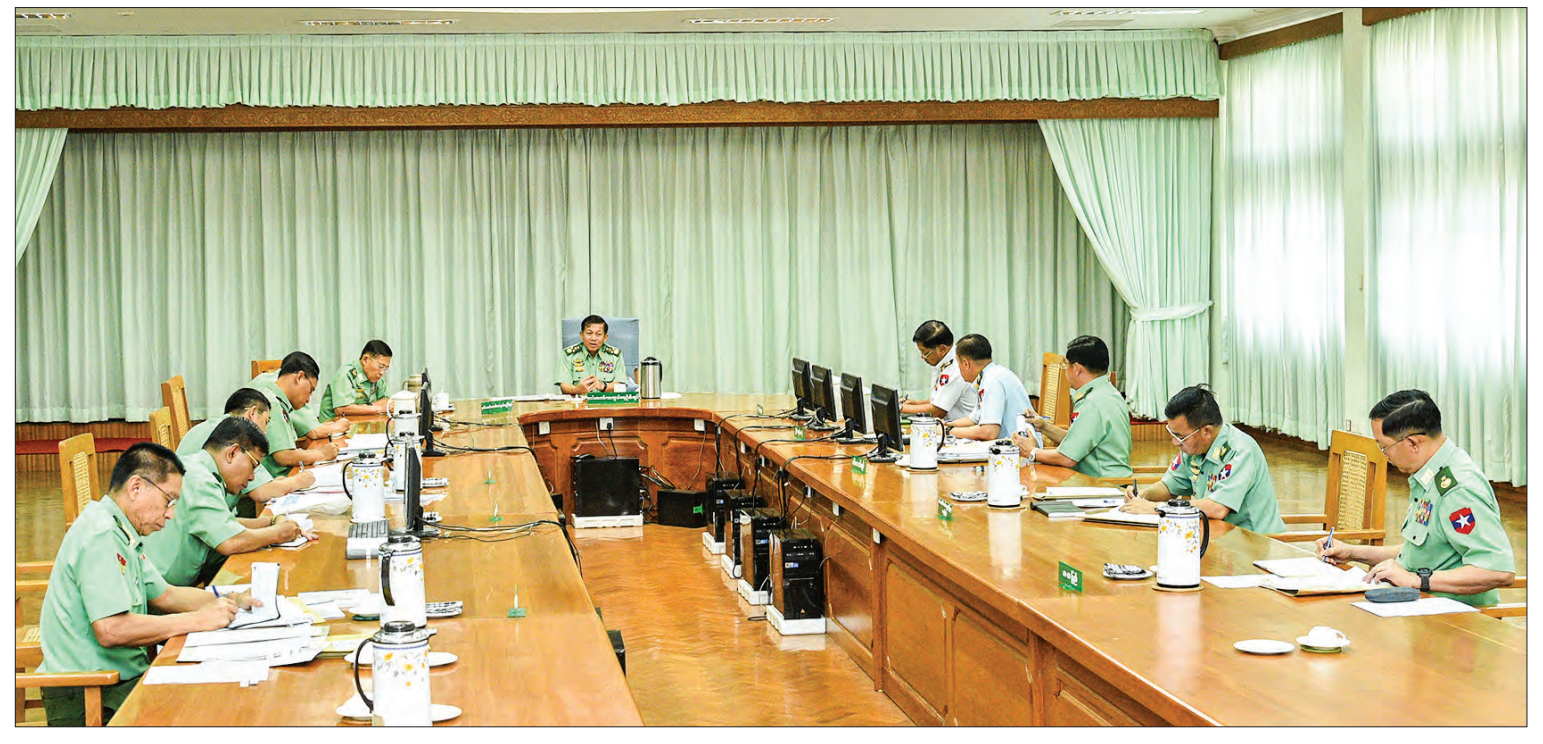
Senior General Min Aung Hlaing attends the coordination meeting to join nationwide measures against prevention and treatment of Covid-19 pandemic.

Some facilities of Defence Services could be used for quarantine centres for treatments and sheltering for the Coronavirus