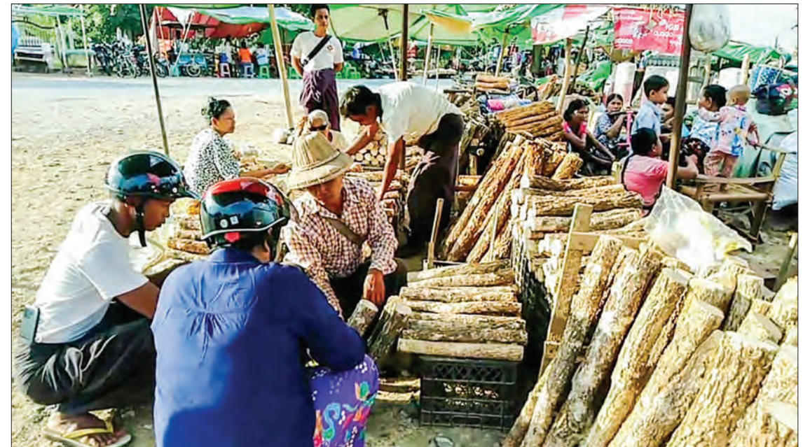
Myanmar Thanakha bark being sold in the market.

There are many intangible cultural heritages in Myanmar. But most are not yet listed in UNESCO. So, Myanmar will add the traditional Thanakha, which has been in use for more than 1,000 years and which remains up to these modern years. Myanmar Thanakha is found to meet the five norms. So, we have been attempting to nominate our Thanakha starting from January 2020 for being put on the UNESCO's World Heritage List. Myanmar will receive technical assistance from UN-ESCO for the preservation of Thanakha if it is listed.