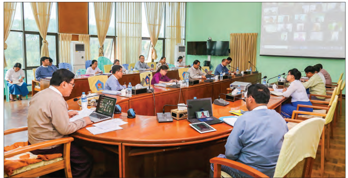
Union Minister Dr Win Myat Aye attends a meeting yesterday with departmental heads of his office, civil organizations and local NGOs in Nay Pyi Taw.

UNION Minister for Social Welfare, Relief and Resettlement Dr Win Myat Aye organized a meeting yesterday with departmental heads of his office, civil organizations and local NGOs to discuss the ministry's participation in containment and emergency responses to the Covid-19 cases.