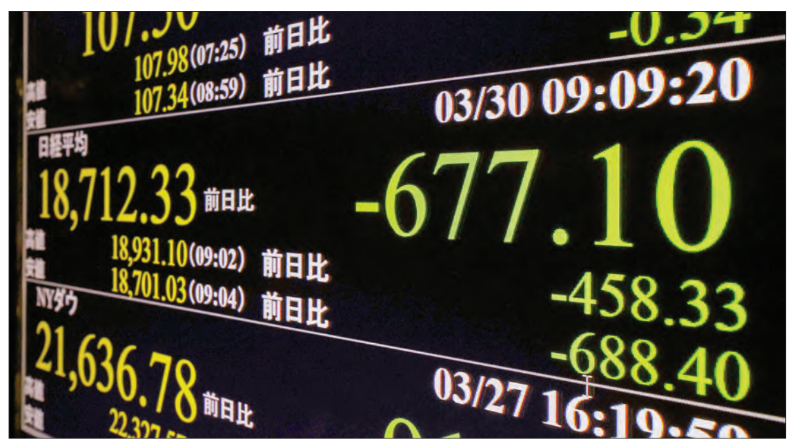
A screen photographed in Tokyo shows the Nikkei Stock Average plunging nearly 700 points on 30 March, 2020, amid growing fears over coronavirus infections.

role to play in preventing it from spreading further. One way that the illness has changed marketing involves the kinds of events that companies hold.