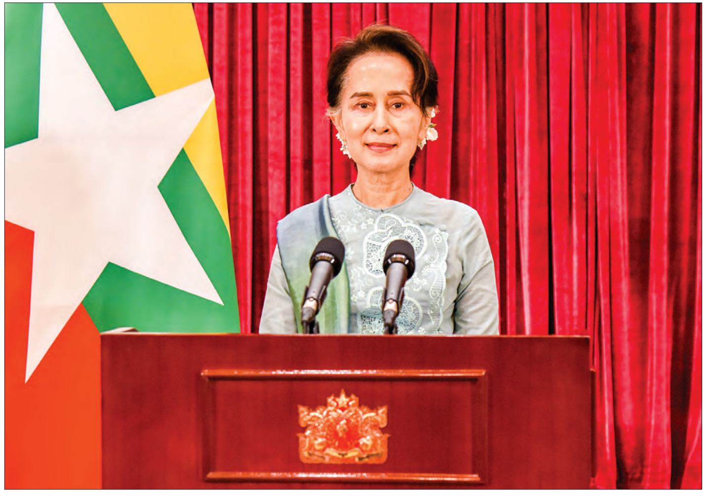
State Counsellor delivers the televised speech on Prevention, Control and Treatment of Coronavirus Disease 2019 (COVID-19).

The threat of COVID-19 is alarming because it spreads very fast. That is why a suspected case must be quarantined so that he or she could be separated from others and so that others would not get infected. Although COVID-19 came into the country from abroad, it can spread very quickly in large quantities as a result of contact among people. The most effective method of prevention and control is to avoid contacts. That is why you are advised to avoid going to crowded places, both indoors or outdoors. Gathering at home with relatives and friends and staying close to each other would be dangerous, just like mingling in the crowd outdoors. At this time, like in the saying "The farther, the better", please take care and protect your health and the health of