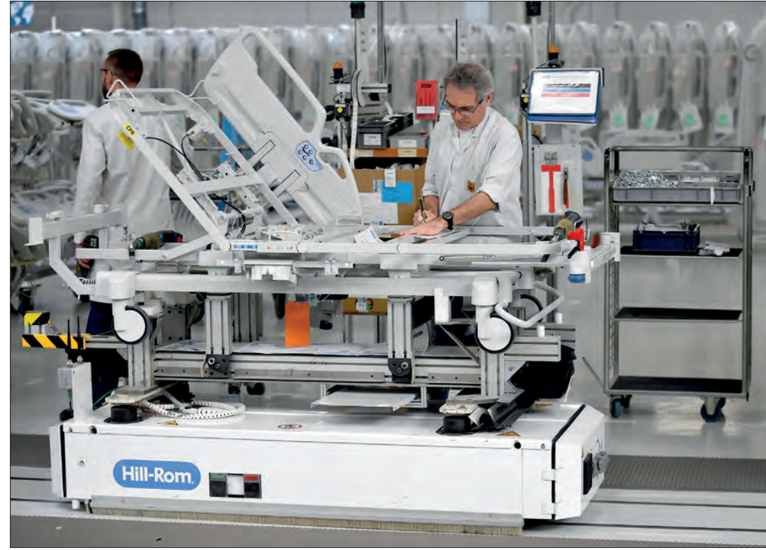
An employee of Hill Rom medical beds works in the plant in Pluvigner, western France on March 31, 2020, on the fifteen day of a lockdown in France to stop the spread of the epidemic COVID-19, caused by the novel coronavirus.

the virus that causes COVID-19 is mainly transmitted through contact with respiratory droplets rather than through the air. See previous answer on "How does COVID-19 spread?"