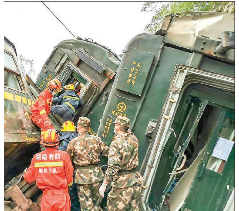
Rescuers work at the accident site after a train derailed at Yonghua Village of Yongxing County in Chenzhou City, central China’s Hunan Province, 30 March 2020.

CHANGSHA — One person was killed and 127 others injured after a train derailed in the city of Chenzhou in central China’s Hunan Province Monday, local authorities said.