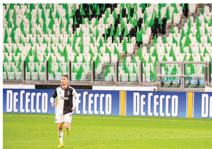
Juventus star Cristiano Ronaldo during the club's last match played behind closed doors in Turin against Inter Milan on 8 March.