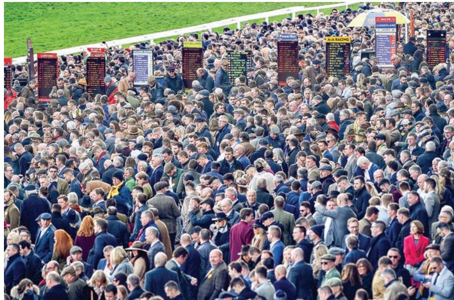
Racegoers attend the final day of the Cheltenham Festival horse racing meeting at Cheltenham Racecourse in Gloucestershire, south-west England, on 13 March 2020.

Italy's Mugello motorcycling circuit, which would have attracted 200,000 people for its MotoGP weekend on Sunday, may just have pulverised that figure with