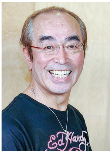
Comedian Ken Shimura.

“I don’t think he imagined he would die a death like this,” said a representative of his agency. “I am sure he was working hard with his sense of mission to deliver laughter to people.”