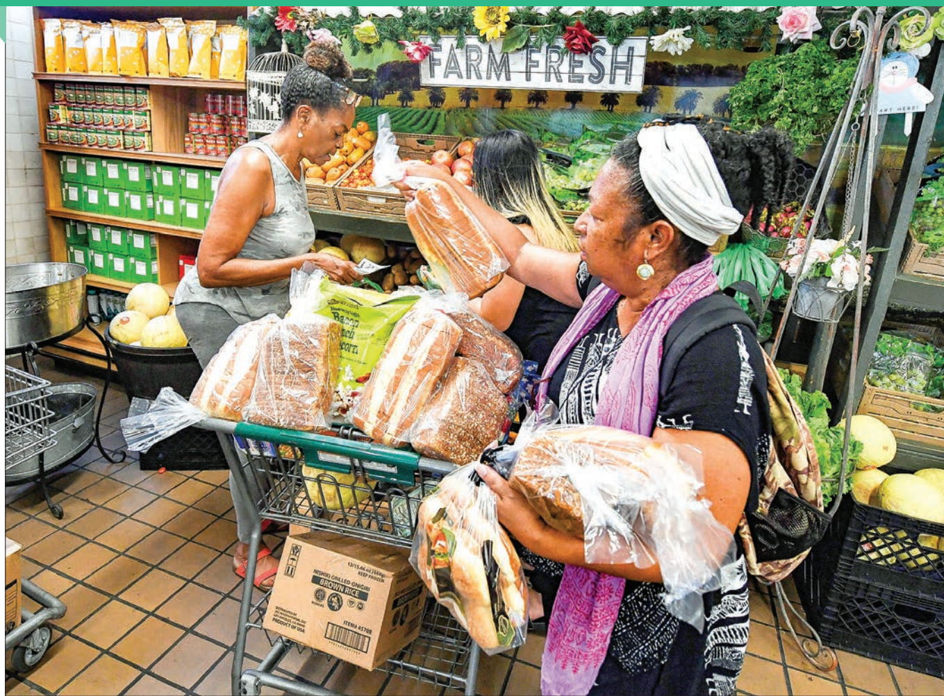
People on low-incomes and retirees choose food at the World Harvest Food Bank after the announcement that the Trump administration reportedly has plans to cut food stamps to more than three million people across the country, in Los Angeles, California on 24 July 2019.

NEW YORK (United States) — New York food banks have become inundated with newcomers deprived of income since the near-total halt of business in the United States’ economic capital.