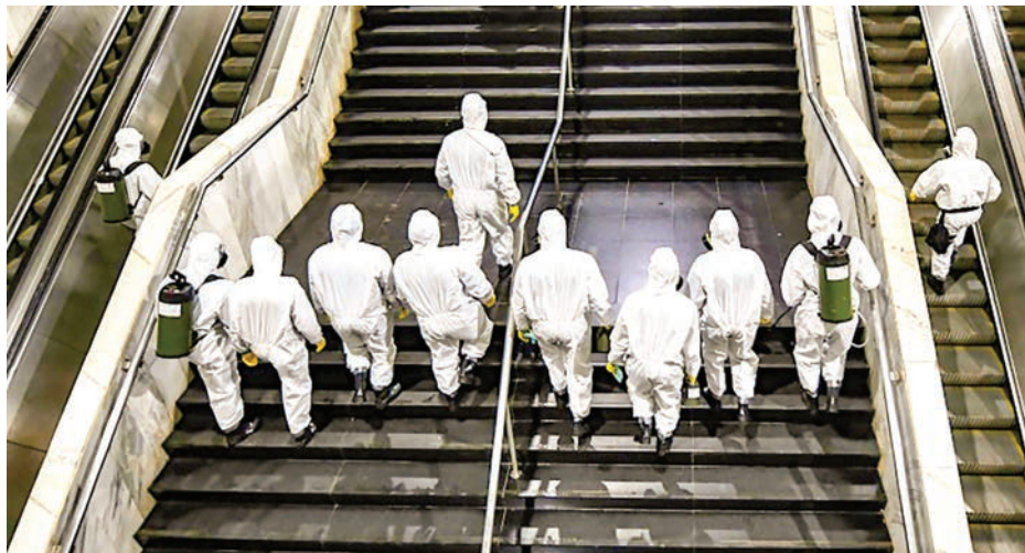
Brazilian soldiers disinfect the Subway Central Station in Brasilia on 29 March 2020.

In another video, the president calls for a "return