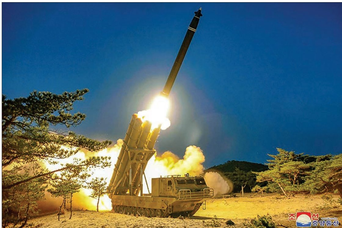
North Korea has carried out four such firings this month.

North Korea is under multiple sets of sanctions from the United Nations, United States and others over its banned weapons programmes. — AFP ■