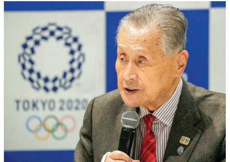
Yoshiro Mori, President of the Tokyo 2020 Olympic Games Organising Committee, faces an unprecedented challenge.

But given the ongoing pandemic and need for preparation time, the most likely plan would be for the Games to begin on July 23, 2021, public broadcaster NHK said over the weekend, citing sources within the organising panel.—AFP ■