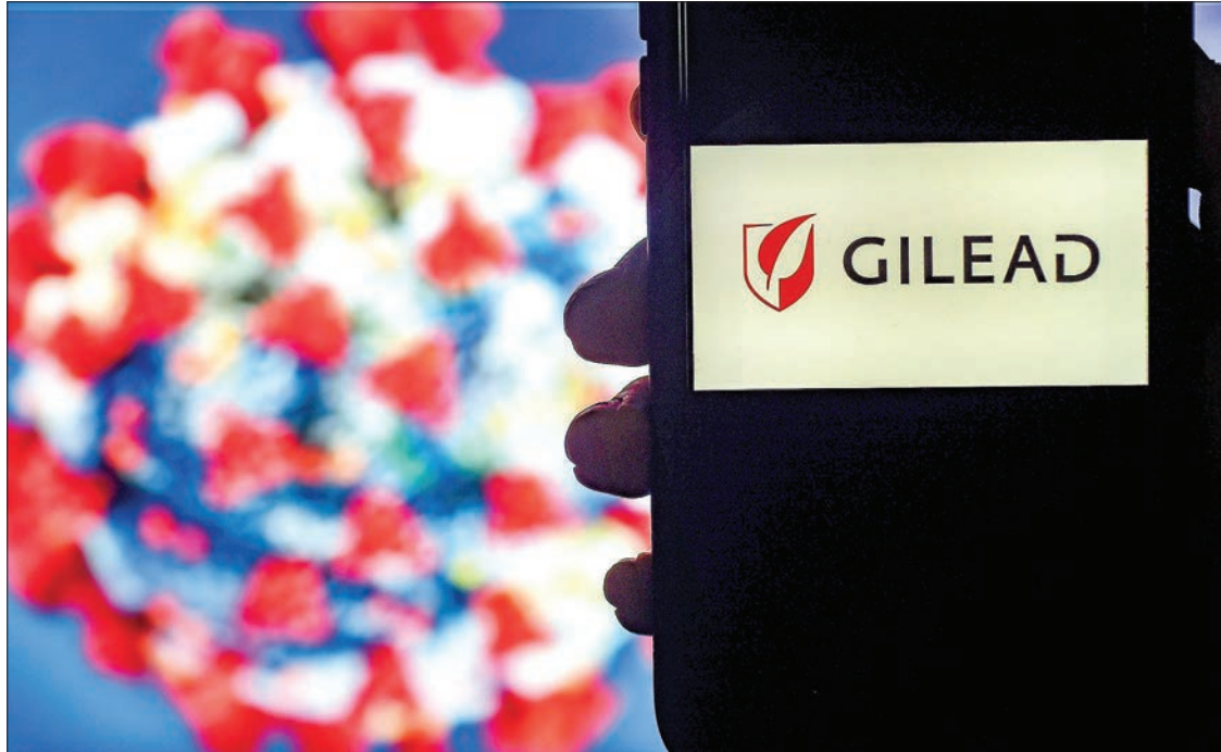
In this photo illustration a Gilead logo is displayed on a smartphone photographed on coronavirus COVID-19 illustration graphic background on 25 March 2020 in Arlington, Virginia.

cerned with Gilead's current approach to remdesivir, which may obscure access to this potentially critical treatment for COVID-19."