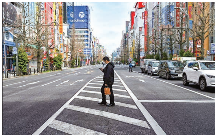
With billions of people around the world in lockdown for the foreseeable future, there are increasing worries about the impact on the global economy, which is already expected to fall into recession.

Governments and central banks have acted to shore up the global economy, pledging around $5 trillion in stimulus support, with China on Monday joining the party by lowering bank borrowing costs and pumping billions