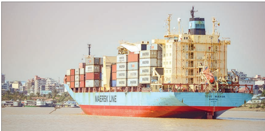
A cargo vessel is seen in the Yangon River.

The necessary guidelines for the online systems have been shown on the website. They can see their application status on-