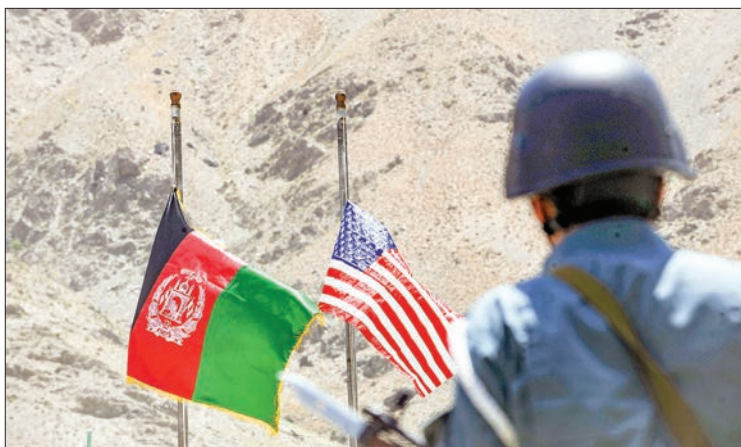
Afghan and US flags are raised as a policeman keeps watch during a ceremony to hand over security control in the rugged mountains of the Panjshir valley on 24 July 2011.

The talks were supposed to start in Oslo on March 10. Now it is unclear when they might begin. —AFP