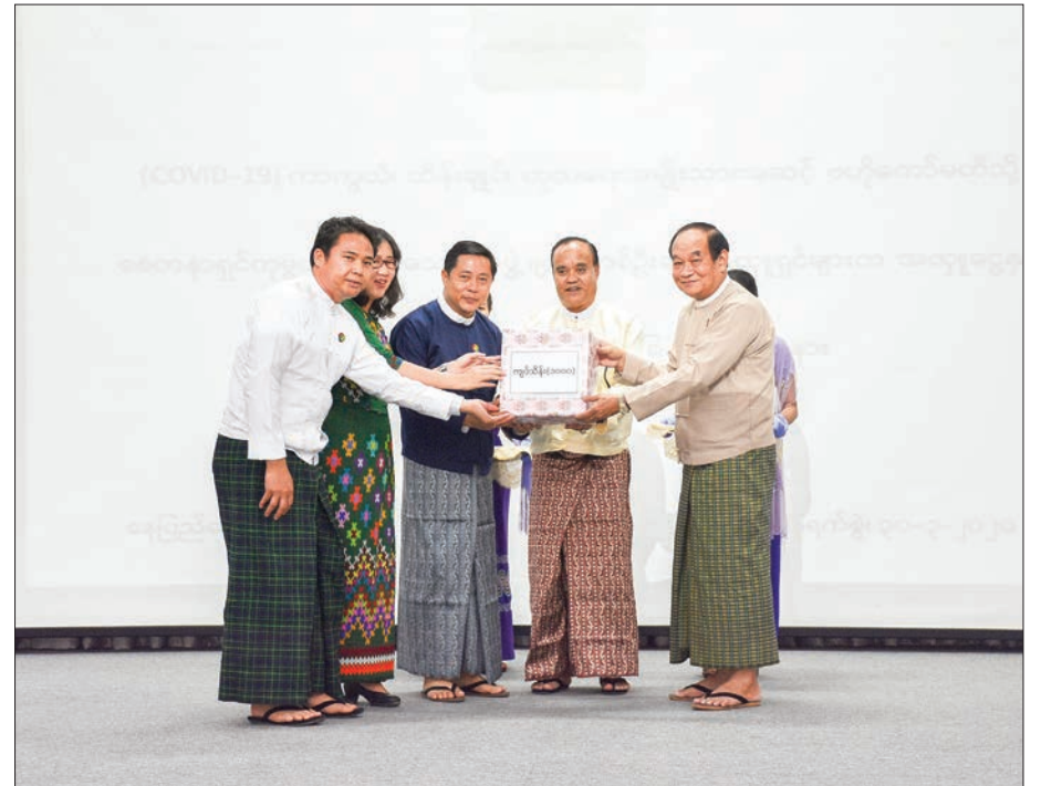
Union Minister Dr Myint Htwe receives the donation of well-wishers to the National-Level Central Committee for COVID-19 Prevention in Nay Pyi Taw yesterday.

THE National-Level Central Committee for COVID-19 Prevention, Control and Treatment have received cash and hospital equipment donated by business companies and individuals yesterday.