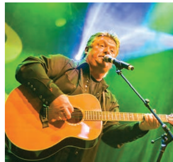
Country music star Joe Diffie has died at the age of 61 of coronavirus.

His death came just two days after he had announced that he had tested positive for the virus and was receiving medical care.