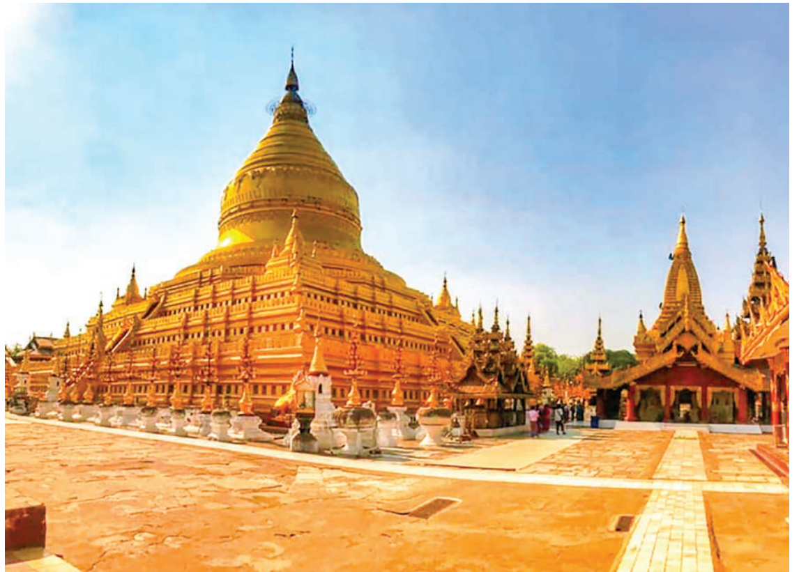
Pagodas, temples left empty in Bagan cultural heritage zone amid COVID-19. (FILE PHOTO)

NyaungU Committee on Prevention, Control, and Treatment of Covid-19 are strictly supervising the restaurants not to have seating customers. The pilgrimage is available only between 9 am to 4 pm and the pilgrims are registered on the data of the pagoda trustees' board.