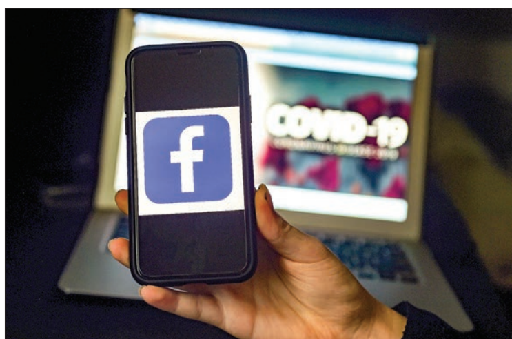
In this file photo the Facebook logo is displayed on a mobile phone screen photographed on coronavirus COVID-19 illustration graphic background on 25 March 2020 in Arlington, Virginia.

Facebook has also supported fact-checking operations with AFP and other media companies, including Reuters and the Associated Press, under which content rated false is downgraded in news feeds so that fewer people see it. — AFP