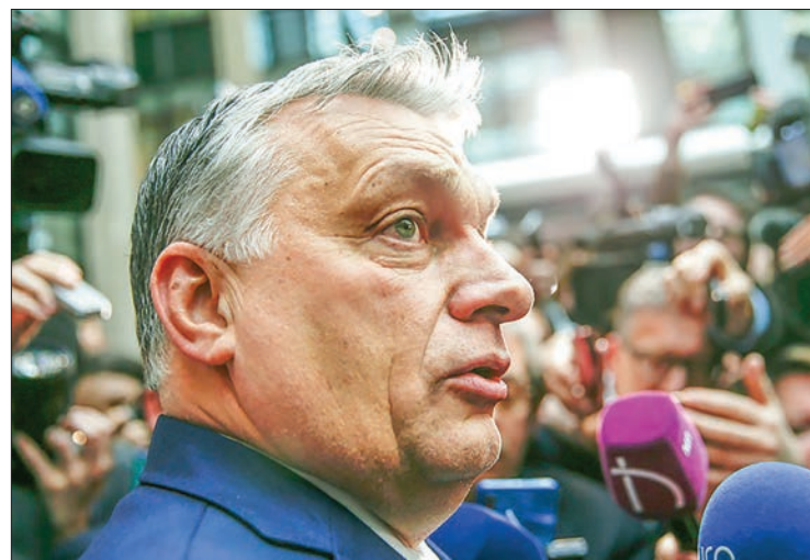
Orban's government proposed the bill to parliament to enable wide rule-by-decree powers.

of up to five years for anyone spreading "falsehoods" about the virus or the measures against it, stoking new worries for press freedom.