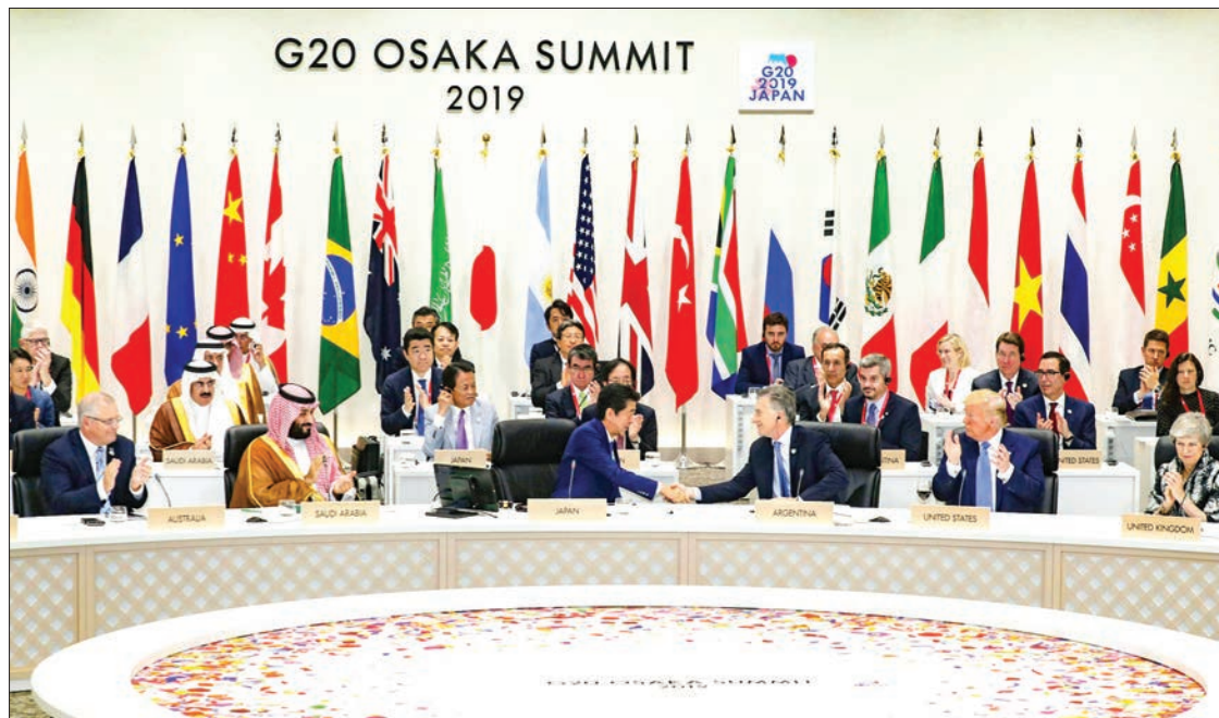
Group of 20 leaders meet in Osaka in June 2019.

TOKYO — Trade ministers from the Group of 20 major economies held an emergency teleconference Monday on the economic impact of the novel coronavirus.