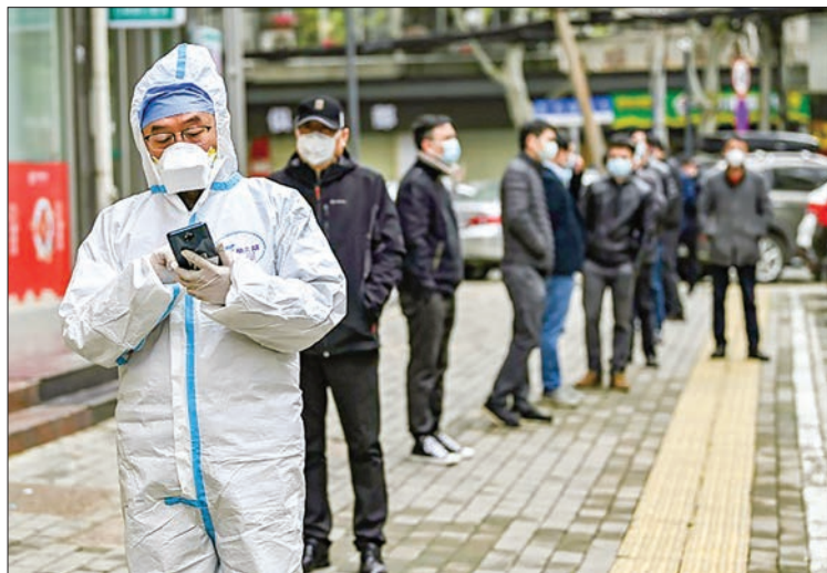
The global spread of the coronavirus has dampened hope of a quick recovery in export-dependent China, where the pandemic first erupted in December.

Effective loan rates should also be guided down, "maintaining reasonable and sufficient liquidity", officials added. Monday's move appears to have had little impact on market sentiment, with Shanghai's key stock index about one per cent lower in the afternoon.—AFP ■