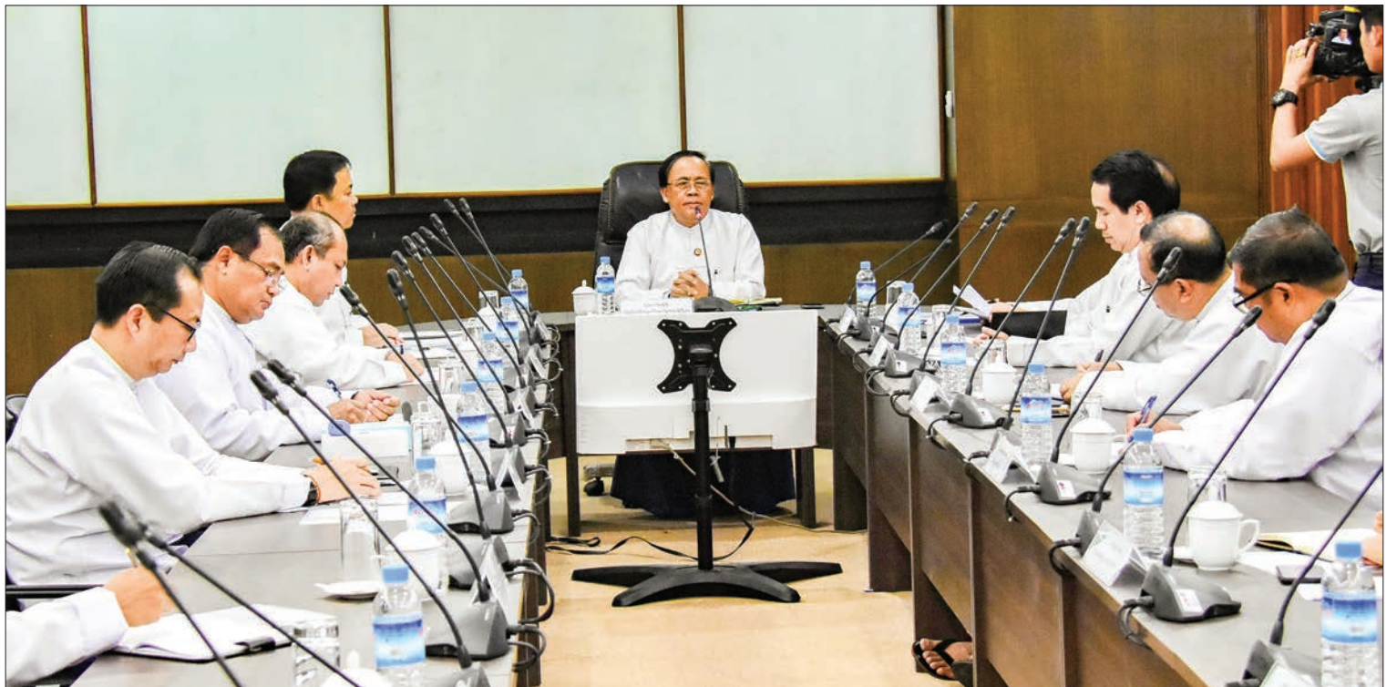
Union Minister U Kyaw Tin chairs the second meeting on working group's preparedness and response to COVID-19 in Nay Pyi Taw.

The Union Minister said they are implementing the central committee's directives and action plans in real time. He said they are issuing restrictions on people travelling from countries with COVID-19 outbreak, suspending issuing visas on arrival and E-visas, permitting entry of expatriates only with health certificate showing