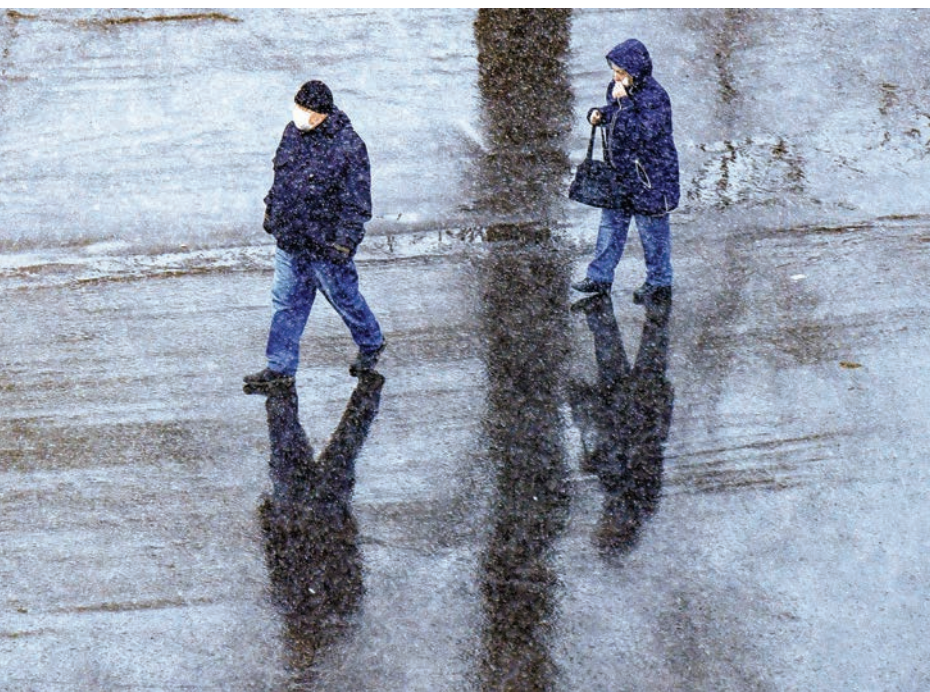
Two person wearing protective masks walk under a snowfall on the Moscow outskirts on March 30, 2020, as the city and its surrounding regions imposed lockdowns today, that were being followed by other Russian regions in a bid to slow the spread of the COVID-19