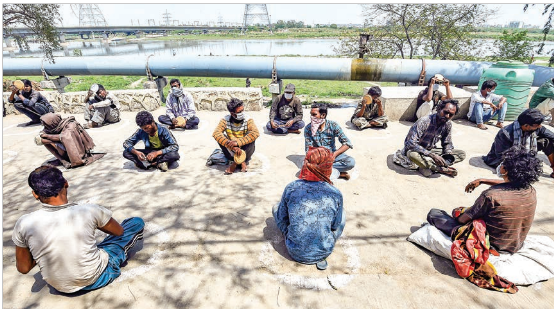
Homeless people sit in lines outside a shelter to get food during a government-imposed nationwide lockdown as a preventive measure against the COVID-19 novel coronavirus in New Delhi on March 30, 2020.

Around 90,000 people were transported in buses on Sunday from Ghaziabad outside Delhi, the Times of India reported. —AFP