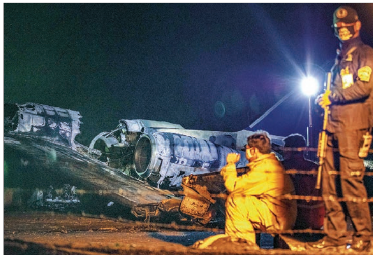
The wreckage of a medical evacuation charter plane headed for Tokyo's Haneda airport is seen on the runway of Ninoy Aquino International Airport in Manila 29 on March 2020. PHOTO: KYODO NEWS

According to aviation authorities and other sources, the plane appears to have run into a technical problem at the end of a runway while it was taxiing for take-off. After the incident, the runway was closed temporarily but reopened Monday morning. — Kyodo News