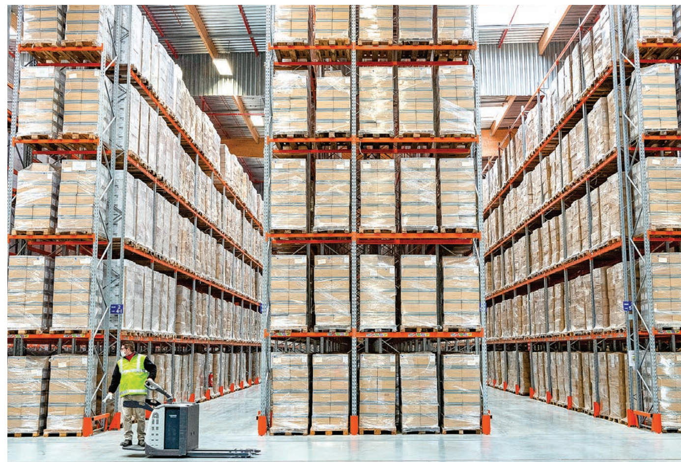
This handout photo taken and released on 30 March 2020, by the French Defence Audiovisual Communication and Production Unit (ECPAD) shows a worker next to cargo unloaded from a plane carrying 10 million face masks ordered by France from China, at the Paris-Vatry Airport in Bussy-Lettree, eastern France, during a strict lockdown in France aimed at curbing the spread of COVID-19 (novel coronavirus).

British airline EasyJet said on Monday it had grounded its entire fleet for an indefinite period.