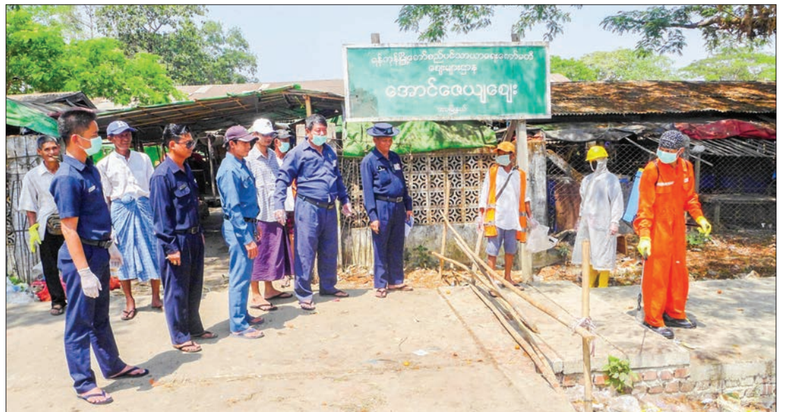
Officials spraying disinfectants near Aung Zeya market in Dala yesterday.

U Aung Lwin Oo said they are working hard to keep the markets open and regularly disinfect the markets and clean all trash from them. He said while the morning and night markets will remain open as normal, they will be closed on the upcoming Myanmar New Year's day and full moon day. He added that they