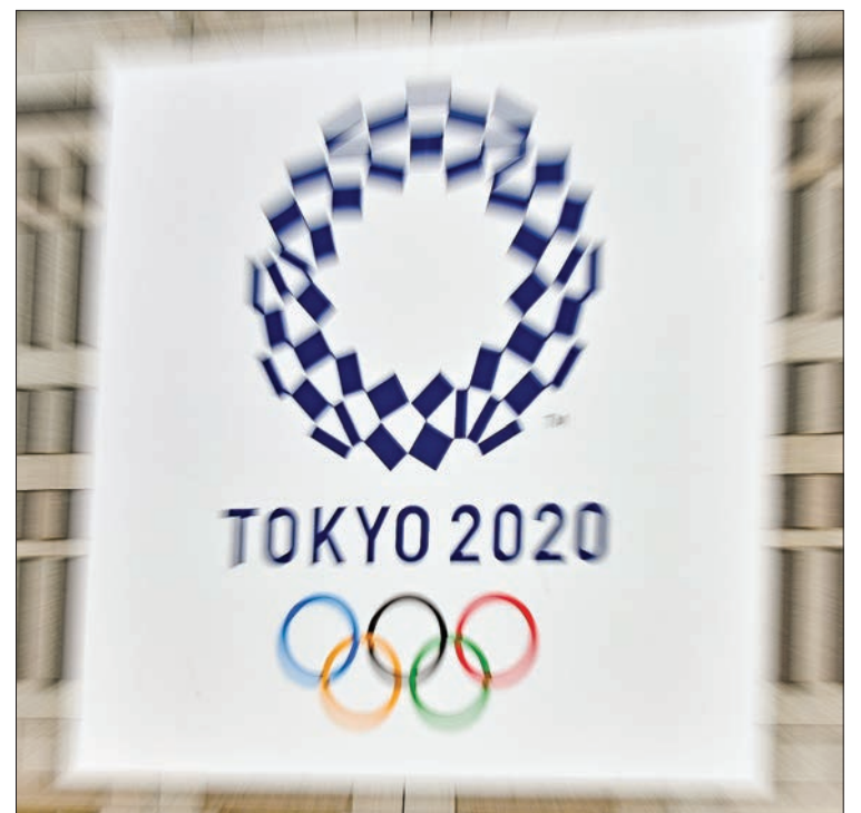
The Tokyo 2020 team is discussing possible dates with the International Olympic Committee, reports say.

Prime Minister Shinzo Abe said they would be held in around a year instead as a testament to humanity's victory over the pandemic. The decision had been seen to open options for Tokyo, with IOC chief Thomas Bach saying that "all the options are on the table" and rescheduling "is not restricted just to the summer months". —AFP ■