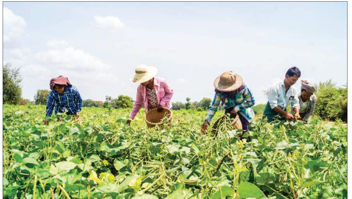
Farmers harvesting green peas in a farm in Magwe Region.