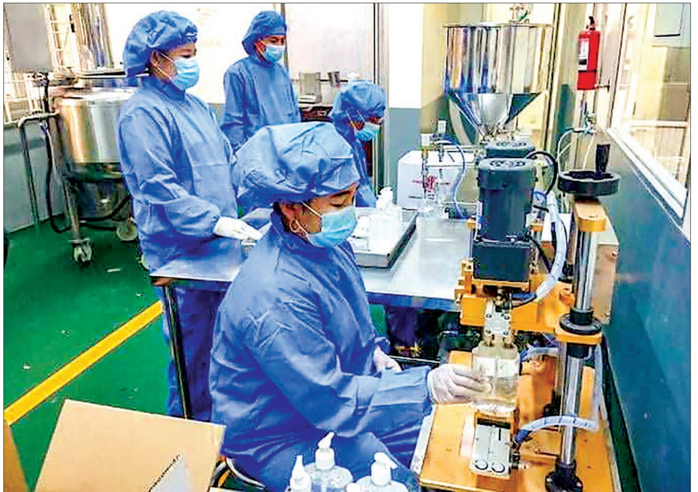
Workers producing hand sanitizer at the BPI factory in Yangon.

The presence of COVID-19 has caused imported and domestically produced hand sanitizers and ethanol to be completely purchased out of the market. —Min Thit (MNA) (Translated by Zaw Htet Oo)