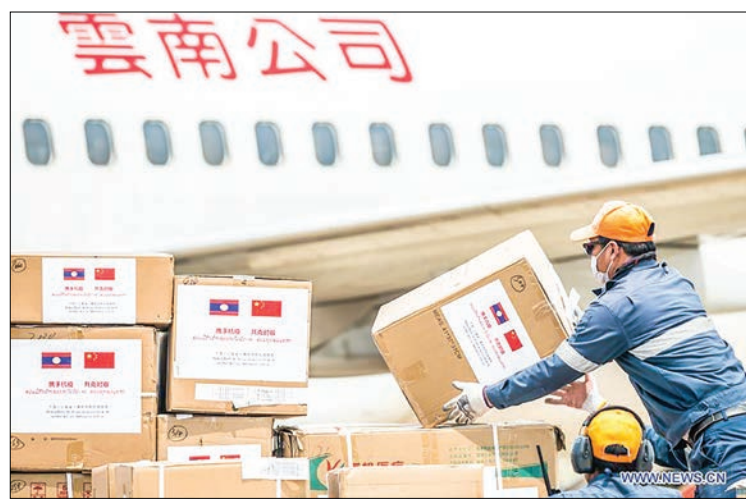
Airport staff unload medical materials donated by China to Laos from a chartered plane at the Wattay International Airport in Vientiane, Laos, March 29, 2020. A team of Chinese medical experts, along with medical materials, arrived in Lao capital Vientiane by a chartered plane Sunday morning to assist Laos to fight the COVID-19 pandemic.

The medical team, made up of top experts in China’s southwestern Yunnan Province, brought Chinese experiences and solutions to Laos’ epidemic prevention and control, said the Lao deputy prime minister, adding that the Lao government will coordinate and ensure all possible conveniences for the Chinese medical expert team.—Xinhua ■