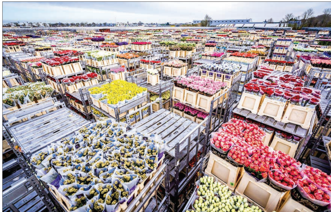
Flowers are stored prior to their destruction at a flower auction in Aalsmeer, Netherlands, on March 16, 2020. The Dutch horticultural sector is sounding the alarm about the effects of the coronavirus crisis. Because of the loss of demand, the auctions are struggling with low prices and the need to destroy the products.

Conte aired his grievances after the 27 EU leaders could not agree on an action plan during an argumentative six-hour video conference Thursday and gave their finance ministers two more weeks to forge a policy that could please Italy and Spain.