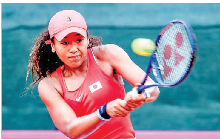
Japan's Osaka says she will be disappointed not to compete in the Tokyo Olympics this year but she supports the postponement.

WASHINGTON (United States) — Japanese star Naomi Osaka says she's disappointed not to compete at the Tokyo Olympics this year but supports the decision to postpone the event to 2021.