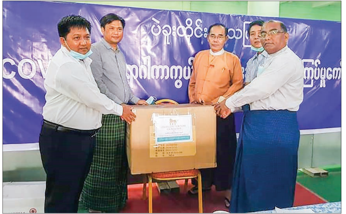
Well-wishers present the medical supplies to the regional committee on Prevention, Control, and Treatment of Coronavirus in Bago yesterday.

Bago Region Chief Minister U Win Thein and U Nyunt Shwe, head of the regional committee on prevention, control, and treatment of COVID-19 gave