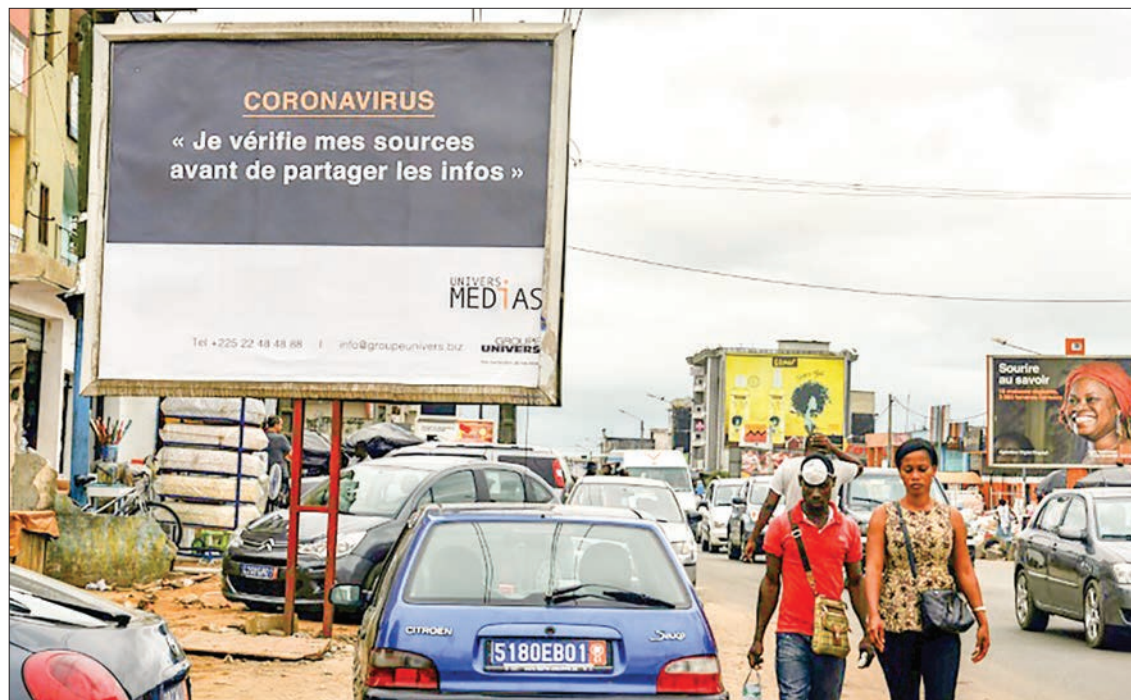
A sign in Abidjan reads ‘Coronavirus - I check my sources before sharing news’ to warn people against fake news and misinformation about the virus.

“There probably is a concern from social networking companies about accuracy warnings degrading the user experience, because you’re exposing users to content that they didn’t want to see. But I hope by talking about this more we’ll get them to take