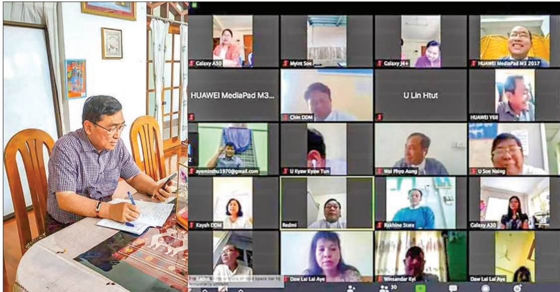
Union Minister Dr Win Myat Aye holds the video conferencing on COVID-19 yesterday.

UNION Minister for Social Welfare, Relief and Resettlement Dr Win Myat Aye led a coordination meeting on COVID-19 yesterday.