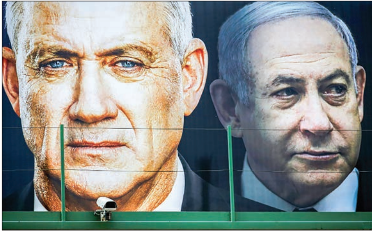
Former army chief Benny Gantz has agreed to join an 'emergency unity government' with Israeli Prime Minister Benjamin Netanyahu.

JERUSALEM— Israeli Prime Minister Benjamin Netanyahu and his erstwhile rival Benny Gantz on Sunday announced "significant progress" in talks toward forming an emergency unity government amid the novel coronavirus pandemic.