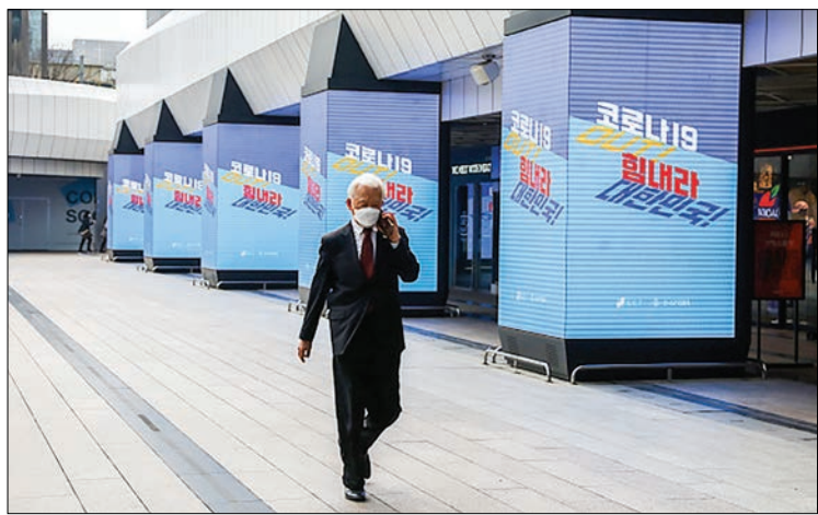
A huge screen displays “COVID-19 OUT and Cheer up Korea” on March 27, 2020 in Seoul, South Korea. South Korea has called for expanded public participation in social distancing, as the country witnesses a wave of community spread and imported infections leading to a resurgence in new cases of COVID-19. PHOTO: KYODO

The local health authorities on Sunday reported 105 new cases of the novel coronavirus in the 24 hours to the end of Saturday, bringing the national tally to 9,583.—Kyodo ■