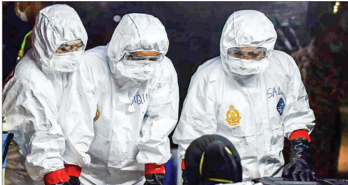
This handout photo from Malaysia’s Ministry of Health shows health workers wearing protective suits as the second batch of Malaysian nationals, evacuated from Wuhan, arrive at Kuala Lumpur International Airport.

Malaysia reported 150 new infection cases nationwide Sunday, raising the national tally to 2,470 cases, the highest number in Southeast Asia.—Kyodo ■