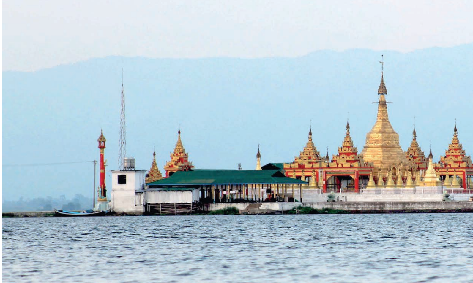
Indawgyi Pagoda situated in the middle of Indawgyi Lake is accessible by boat.

“Initially, the network has 10 members. It grew over time with 50 participants from different age