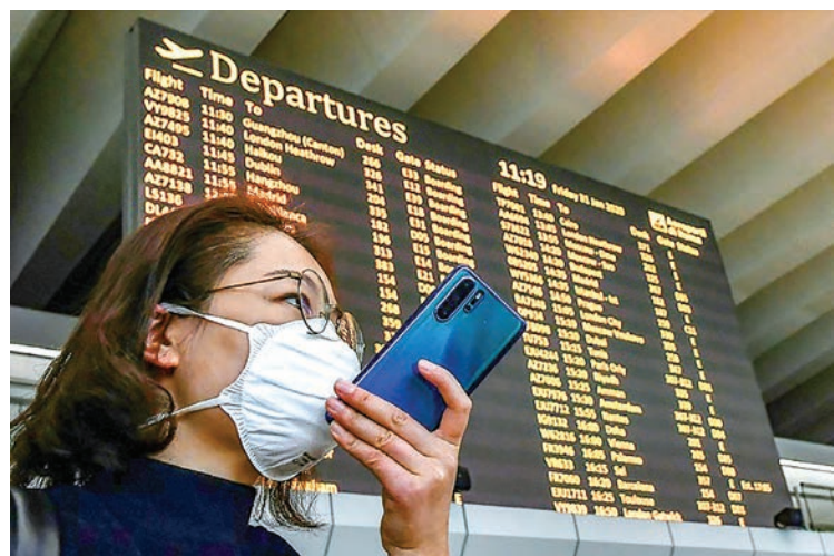
The coronavirus pandemic has led to the creation of apps and tracking systems using people’s smartphone location as part of the effort to limit contagion