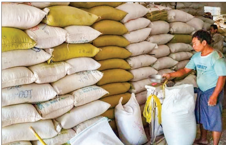
A man packaging a sack of chickpea in a warehouse in Mandalay.