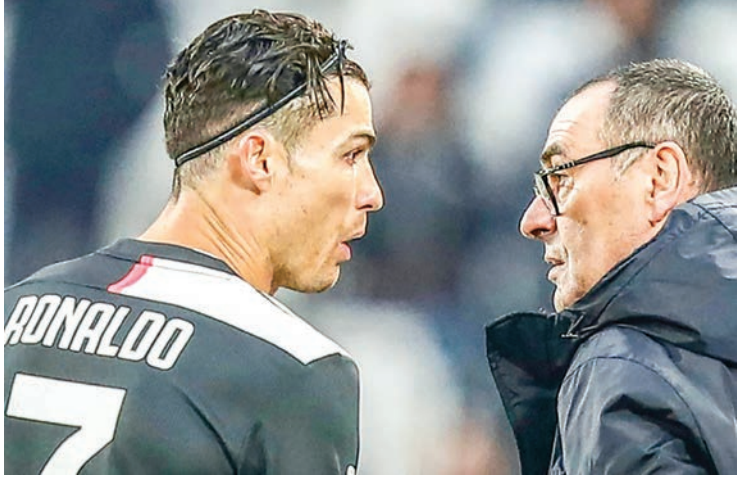
Juventus players and coach Sarri have agreed to take pay cuts.

MILAN (Italy) — Juventus on Saturday announced that they had cut their players' and coach Maurizio Sarri's salaries after all Italian sport