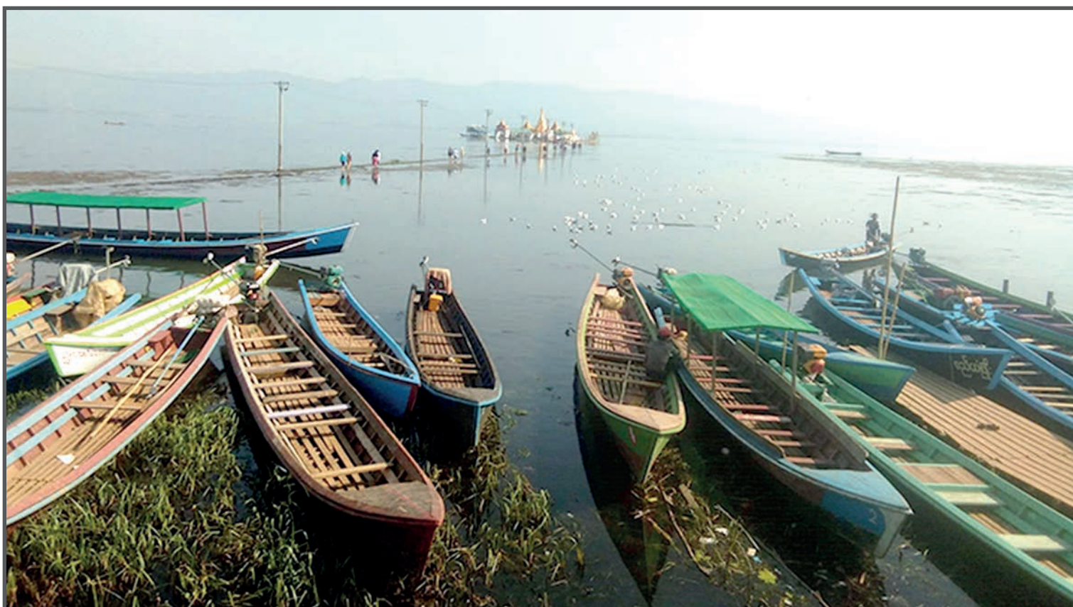
Indawgyilake is one of the tourist attractions in upper Myanmar.