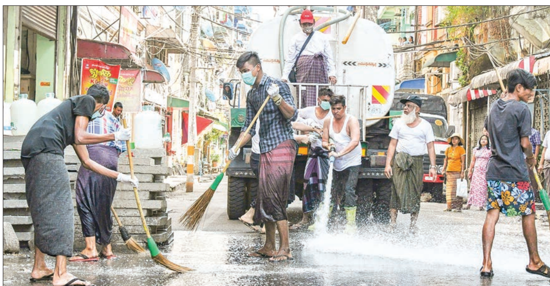
People disinfecting the street in Pabedan Township, Yangon yesterday.