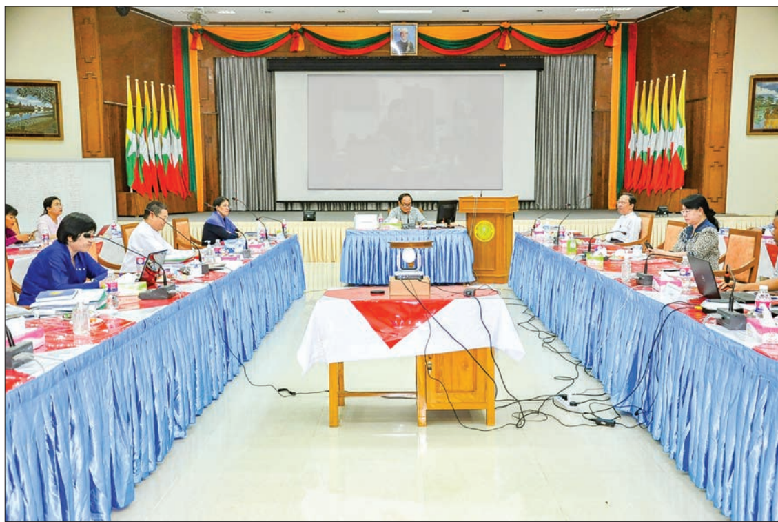
Union Minister Dr Myint Htwe attends the coordination meeting through video conferencing in Nay Pyi Taw yesterday.

The Union Minister stressed to list the restricted areas with the returnees from Thailand, participation of locals in community based facility quarantine programme and assistance of central level to the areas such as Kaying State, Mon State and