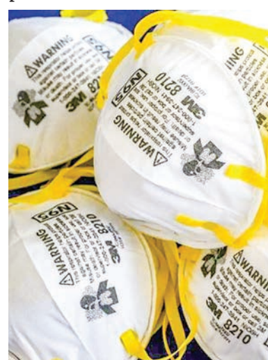
Saudi authorities have seized more than five million medical masks that were illegally stockpiled amid the coronavirus outbreak, state media reported on Sunday.

Pharmacies in the oil-rich kingdom have reported shortages of masks amid panic buying, as authorities warned against price hikes.