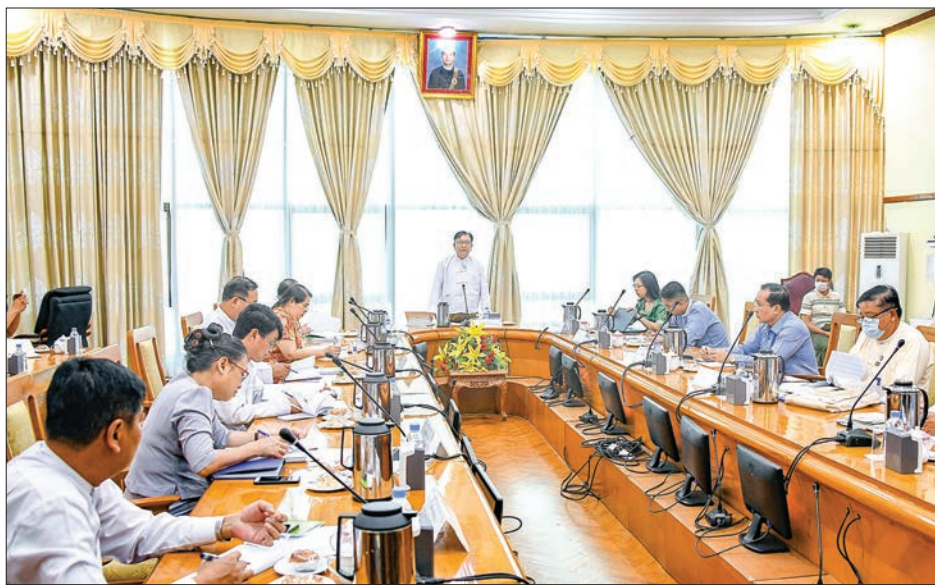
Permanent Secretary U Aung Soe addresses the meeting on controlling surge in prices of goods and commodities amid COVID-19.

OFFICIALS from state departments, trade bodies and merchant associations held talks to control surge in prices of goods and commodities amid Coronavirus Disease 2019 (Covid-19).