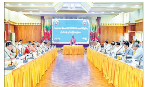
Rakhine State Chief Minister U Nyi Pu addresses the coordination meeting on COVID-19 in Sittway, Rakhine State yesterday.

A coordination meeting over prevention, control and treatment of Covid-19 was held at the meeting hall of Rakhine State government in Sittway yesterday.