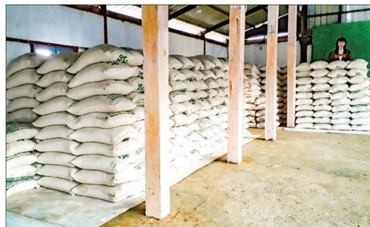
Rice bags sent from Chin State Government are seen in a depot in Tiddim.