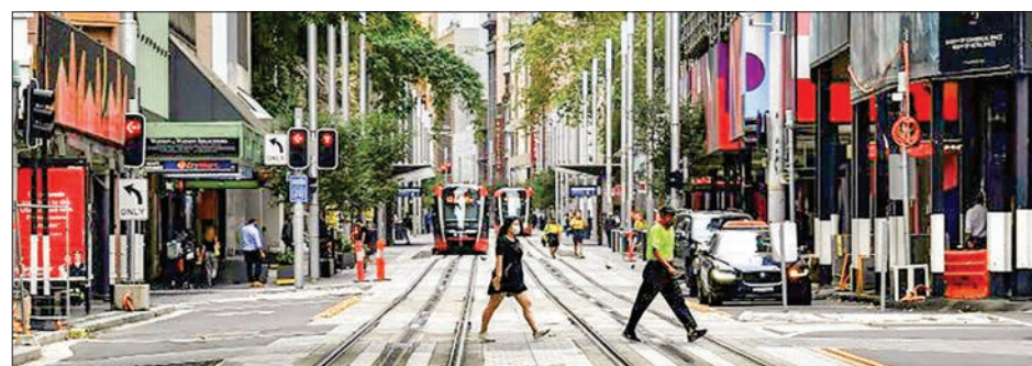
People cross a quiet road in central Sydney on March 25, 2020, as people stay away due to restrictions to stop the spread of the worldwide COVID-19 coronavirus outbreak.