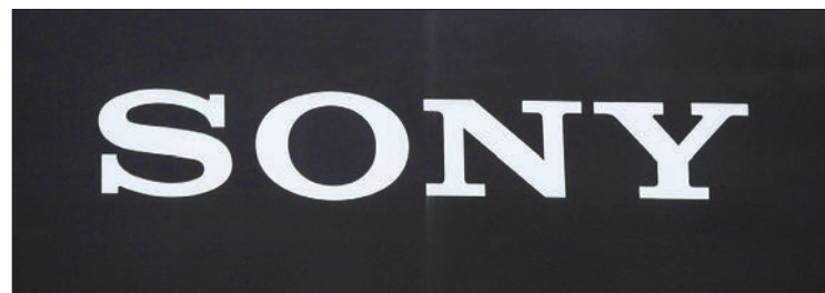
File photo taken 1 March, 2019, shows the logo of Japanese electronics and entertainment company Sony Corp. on its signboard in Tokyo’s Chuo Ward.

TOKYO — Sony Corp. said Friday it expects to fall short of its projected earnings in the current business year ending March as the economic impact of the coronavirus pandemic is large enough to wipe out the previously expected increase in sales and profit.