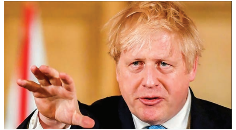
A Downing Street spokesperson said in a statement that Johnson, whose partner Carrie Symonds is pregnant, experienced mild symptoms on Thursday and was tested for COVID-19 on the personal advice of England’s chief medical officer.

Earlier this week Prince Charles, the eldest son and heir