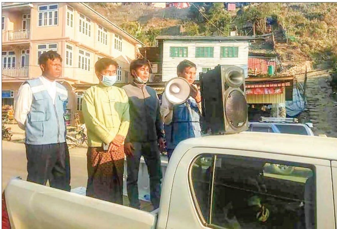
Officials alert public on COVID-19 in Haka, Chin State.