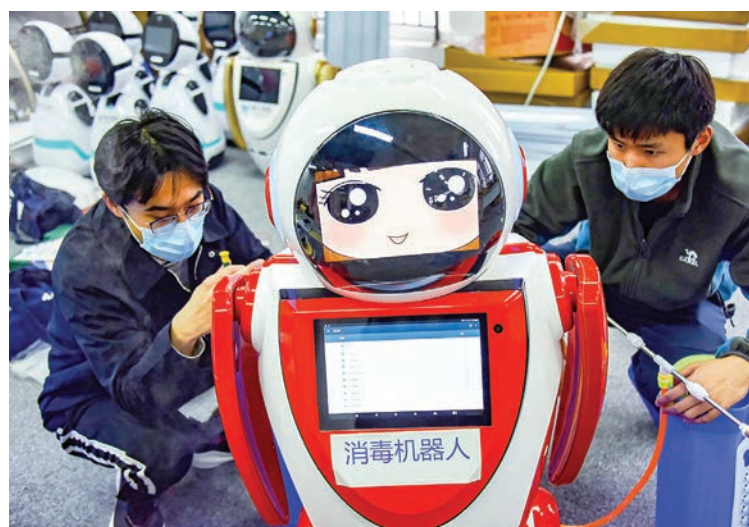
Technicians improve a first-generation disinfection robot in Qingdao, East China's Shandong province, on Feb 11, 2020.

R OBOTICS and automation could play an increasingly important role in combating infectious diseases such as COVID-19, according to an editorial published 25 March on Science Robotics.