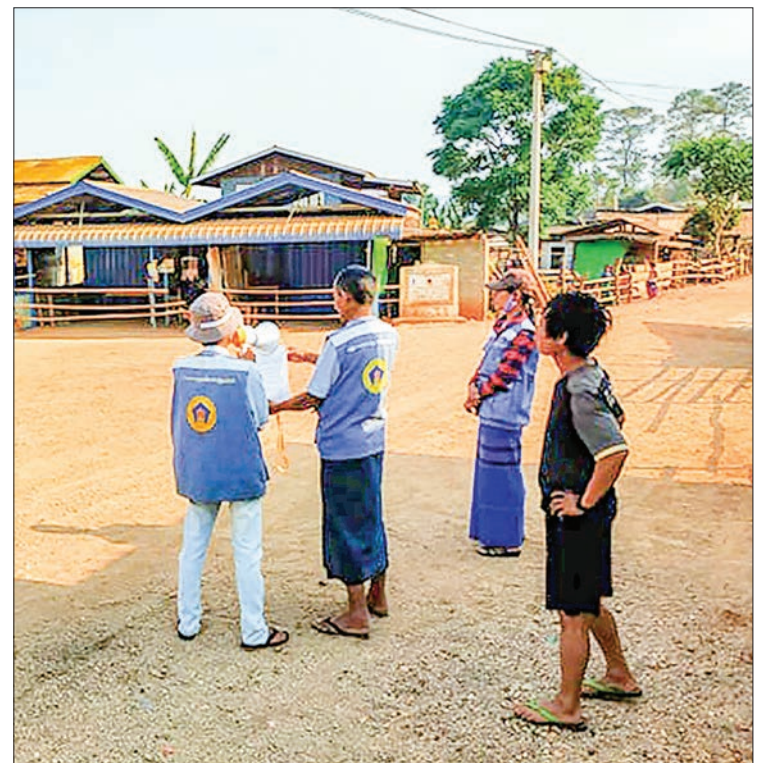
Officials alert public on COVID-19 in Dimawhso Kayah State.

OFFICIALS from the Union Government Office, General Administration Department, Ministry of Health and Sports, Ministry of Social Welfare, Relief and Resettlement and regional civil society organizations have collaborated to disseminate information and news of COVID-19 in Nay Pyi