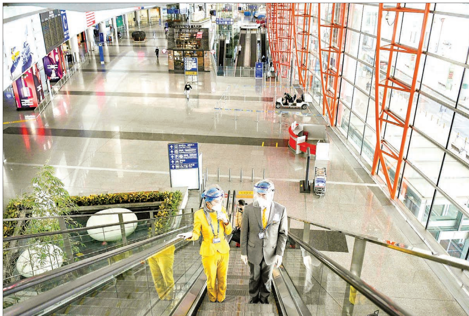
Beijing Capital International Airport workers wear face shields on March 27, 2020, amid the coronavirus pandemic.

Businesses in the greater Tokyo region prepared to shut their doors, at least for the weekend, after governor Yuriko Koike made