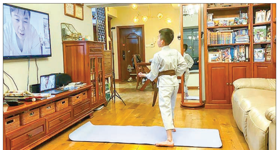
A child takes an online karate class at home during COVID-19 outbreak in Shanghai, China.

and stadiums, public pools, dance studios, and playgrounds means that many are not able to actively participate in individual or group sporting or physical activities.