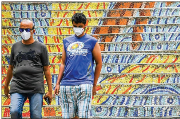
The central bank's steep rate cut is in line with similar measures adopted around the world as the virus hammers economies.

As manufacturing activity and consumption grinds to a halt under a lockdown, the Reserve Bank of India (RBI) said the benchmark repo rate — the level at which it lends to commercial banks — would be cut by 75 basis