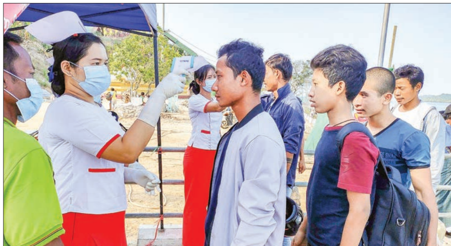
A nurse checking the body temperature of passengers at port bridges in Kyunsu Township.