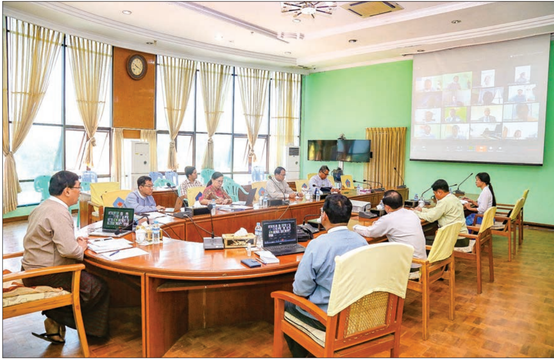
Union Minister Dr Win Myat Aye attends the video conferencing with UN humanitarian aid agencies in concerning preparations against COVID-19 for internally displaced persons (IDPs) in Nay Pyi Taw.

UNION Minister for Social Welfare, Relief and Resettlement Dr Win Myat Aye held a video conference with UN humanitarian aid agencies yesterday concerning preparations against COVID-19 for internally displaced persons (IDPs).