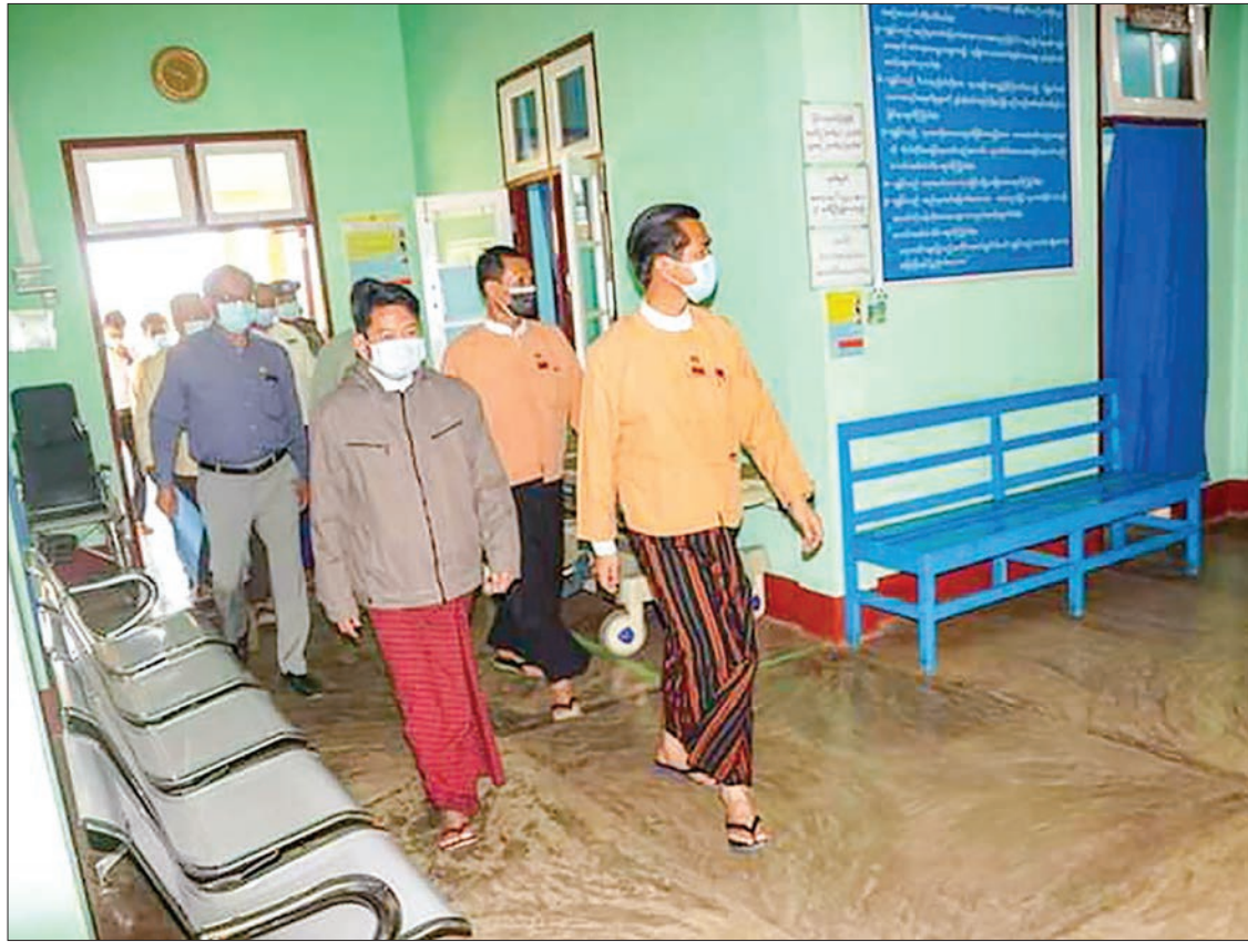
Kayah State Chief Minister L Phaung Sho inspects a health care facility in Kayah State.

THE Kayah State government has formed various task forces to monitor entry/exit checkpoints to cities and at borders to prevent the spread of COVID-19 into the state. The task forces also monitor border crossings for nationals returning through illegal means, and ensuring returnees go into facility quarantine for 14 days upon returning to their hometown.