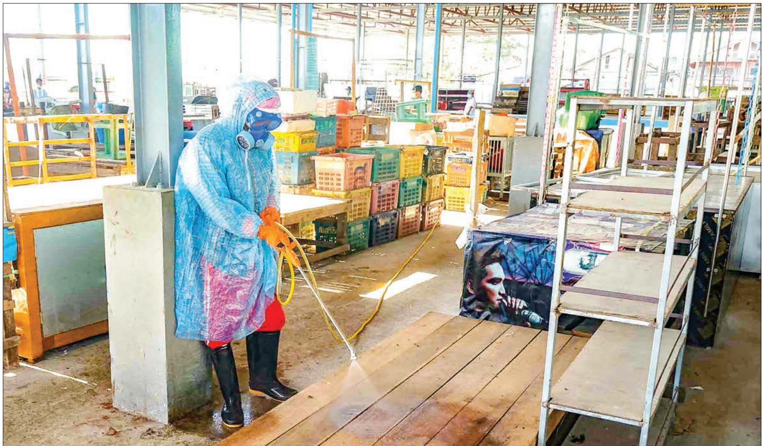
A health worker sprays disinfectant in a local market in Dawei in southern Myanmar yesterday.

As COVID-19 sweeps across the globe, Taninthayi Region's Kawthoung authorities are taking it as their national duty to prevent the spread of the virus throughout the entire nation. Officials in Kawthoung Town-