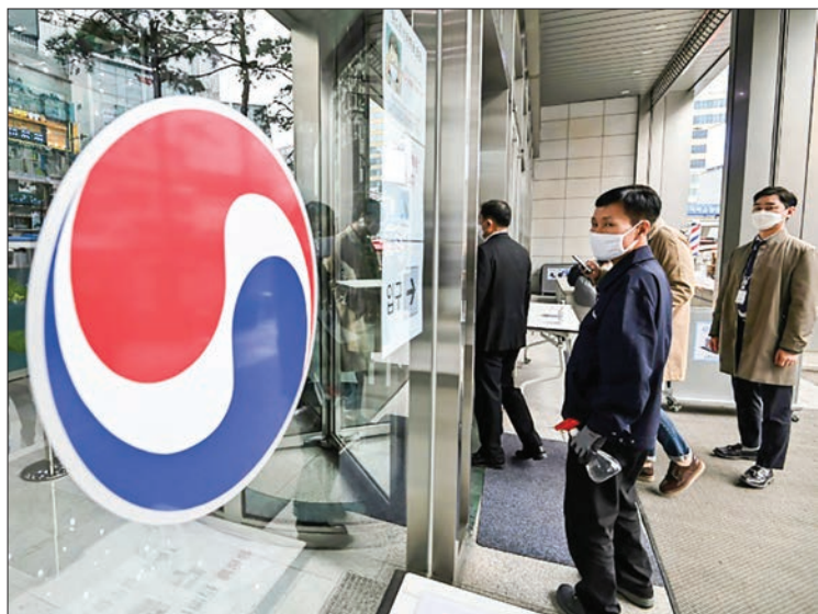
Hanjin-owned Korean Air is in the throes of a corporate crisis as the coronavirus pandemic shatters the airline sector.

Energy (MNRE), Government of India vide its office memorandum dated 20 March, 2020, has inter-alia directed SECI, NTPC or other concerned renewable energy implementing agencies of MNRE (Implementing Agencies) to treat delay on account of disruption of the supply chains due to spread of coronavirus in China or any other country as Force Majeure and to grant appropriate time-extension in Scheduled Commissioning Date (SCOD) of the IPP projects as per Force Majeure Clause in the respective IPPs contracts, based on supporting evidence/documents produced by IPPs.—ANI ■