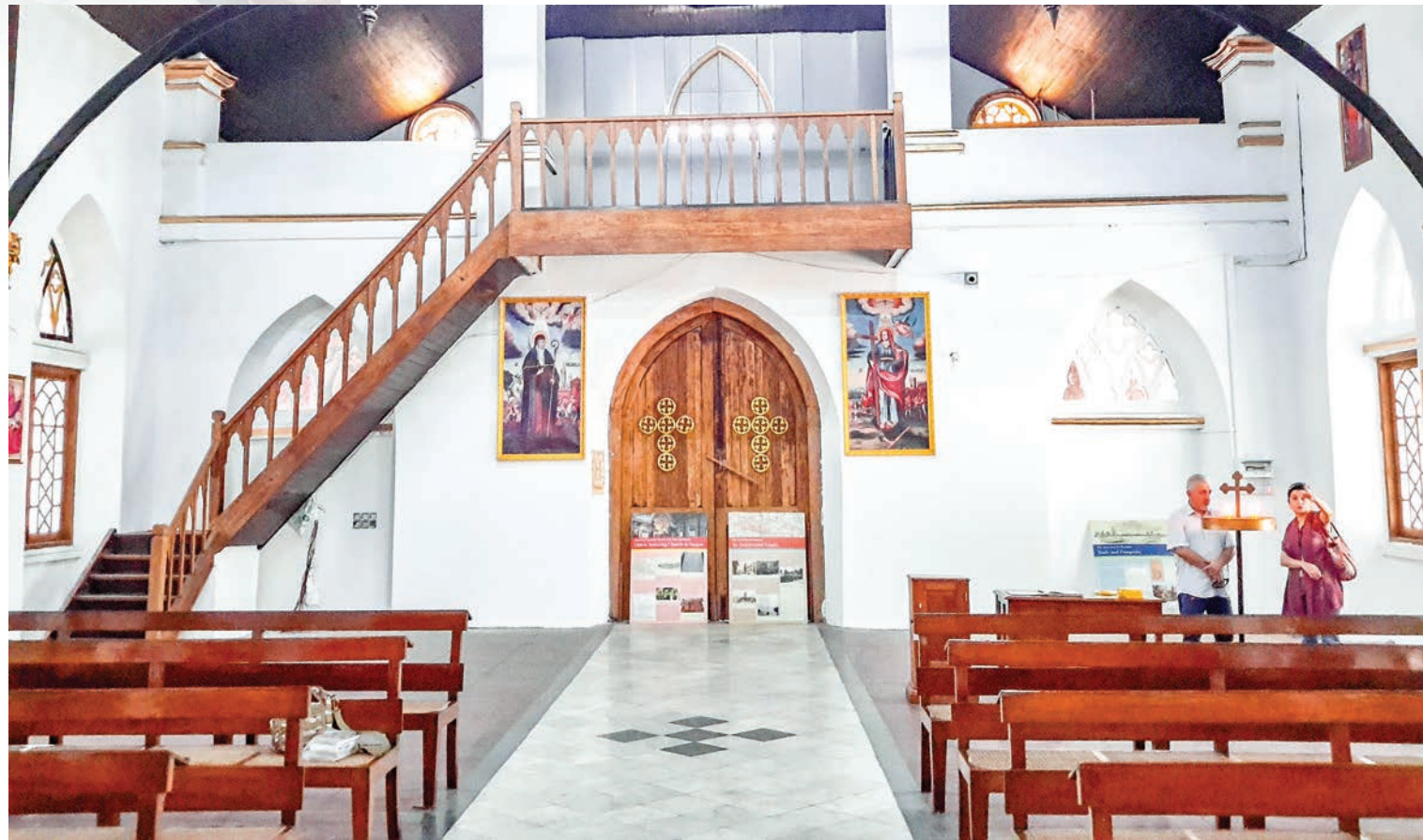
Interior of Armenian Apostolic Orthodox Church in Yangon.