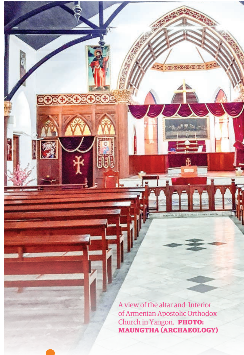
A view of the altar and Interior of Armenian Apostolic Orthodox Church in Yangon.

The Armenian cemetery where bodies of Armenians in Yangon were cremated was located near Jew Cemetery, Islam Cemetery and Christian Cemetery nearby Yangon Railway Station from 1874 to 1980. Now, the cemeteries did not exist there.