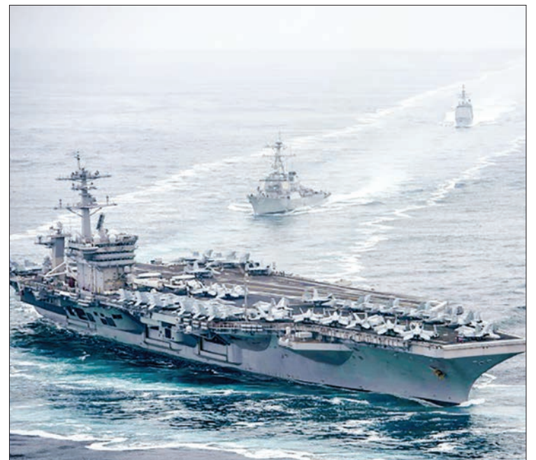
The USS Theodore Roosevelt aircraft carrier has more than 5,000 personnel on board

The Hawaii-based Indo-Pacific Command also said Thursday a joint US-Philippines-Australia exercise involving thousands of troops in the Philippines had been canceled over coronavirus fears.— AFP ■