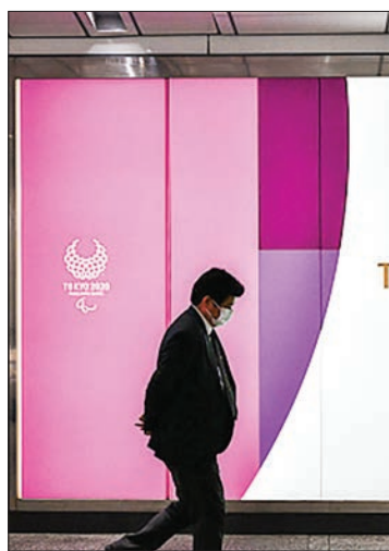
A man walks past an advert for the Tokyo 2020 Olympics on 25 March, 2020 in Tokyo, Japan.

Thomas Bach held a conference call with the 33 international sports federations to discuss options, before further consultations with other bodies such as athletes' representative groups, sponsors and broadcasters.