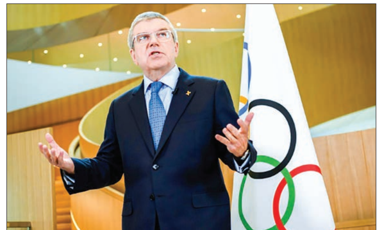
International Olympic Committee (IOC) President Thomas Bach.

Outside Europe, most top leagues have been affected, with the start of the J-League delayed, Major League Soccer in the United States and China's top-flight Super League put on hold. —AFP ■