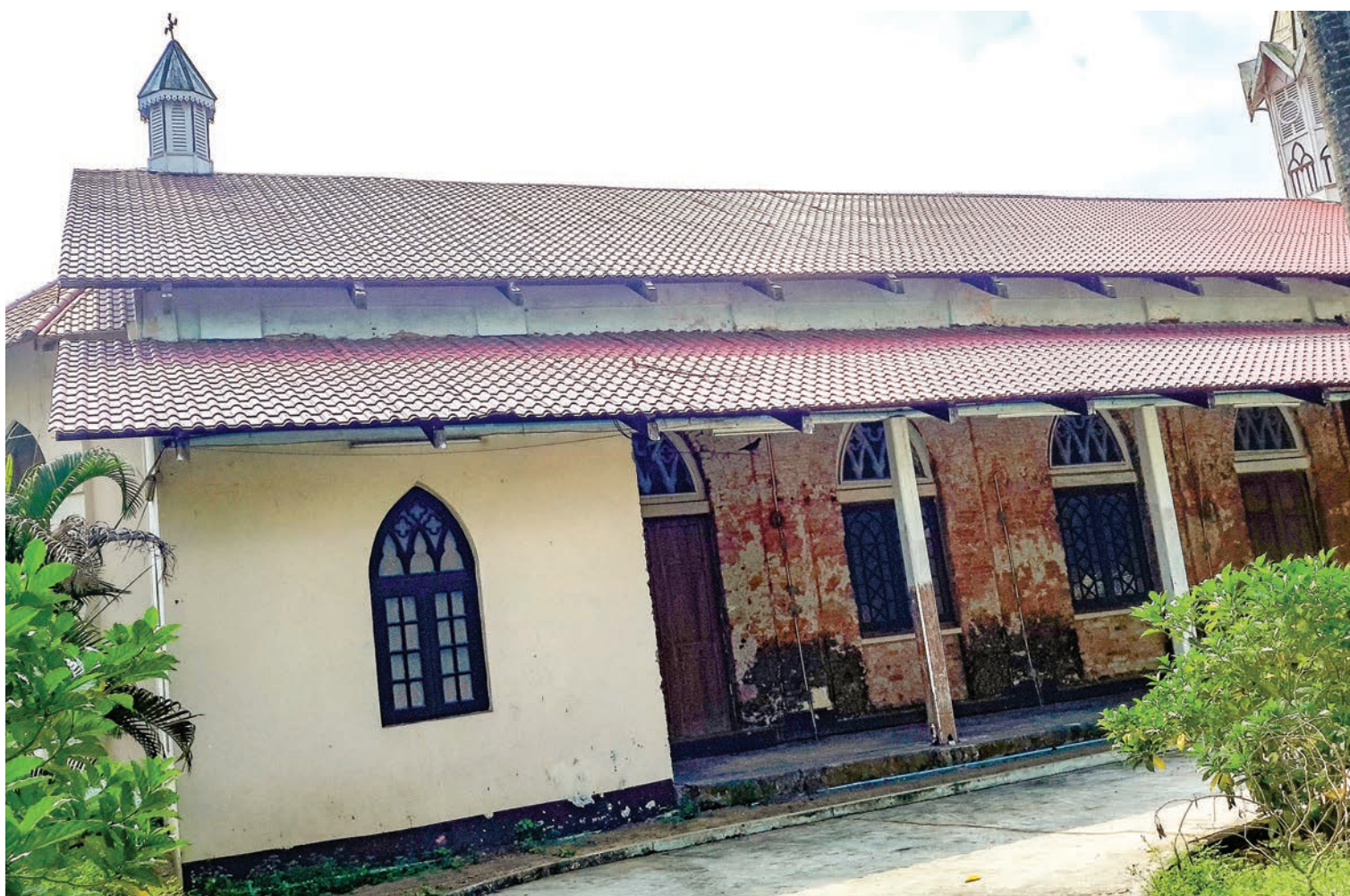
Armenian Apostolic Orthodox Church in Yangon.