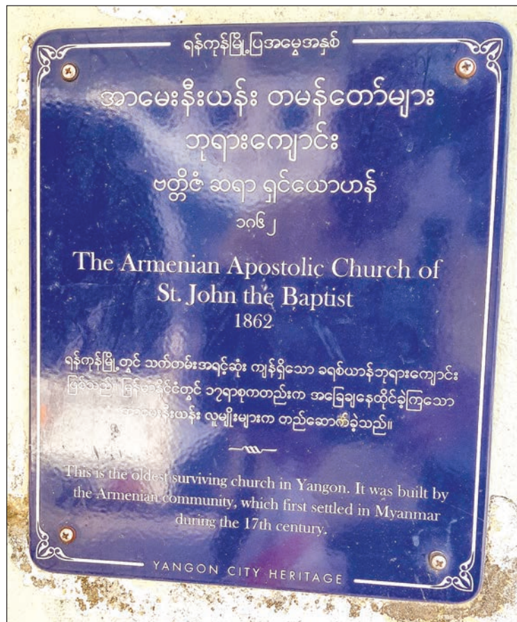
A commemorative Blue Plaque was installed outside Yangon's oldest surviving church, the Armenian Apostolic Church of St John the Baptist on 1 October, 2014.

Church of the St. John the Baptist, 1862 in both Myanmar and