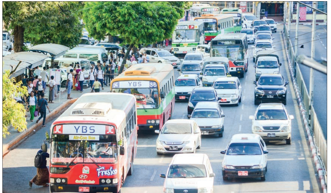
YBS buses seen in downtown Yangon . PHOE KHWAR

Currently, YRTA is cooperating with YBS companies to prevent the Covid-19 pandemic according to the guidelines and instructions issued by the Ministry of Health and Sports. YBS companies are operating their buses daily as usual mainly for