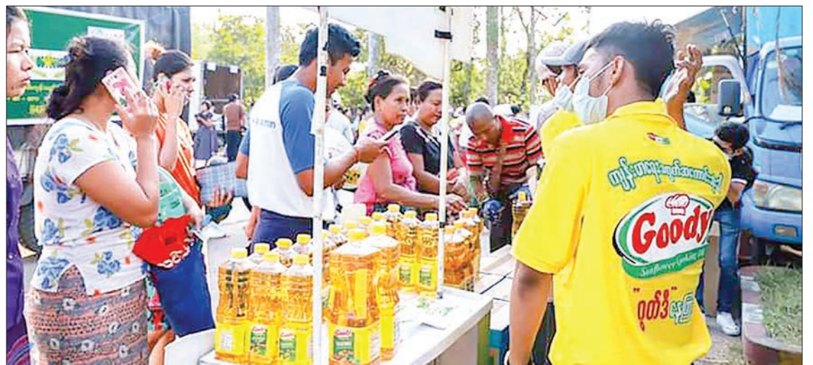
People purchasing cooking oil at a stall set up by an oil supplier company yesterday.

adequate supply of basic foodstuffs in the local market and control the price increase amid Covid-19 negative impacts, said a statement released by the Union of Myanmar Federation of Chambers of Commerce and Industry.—Ko Htet (Translated by TTN)