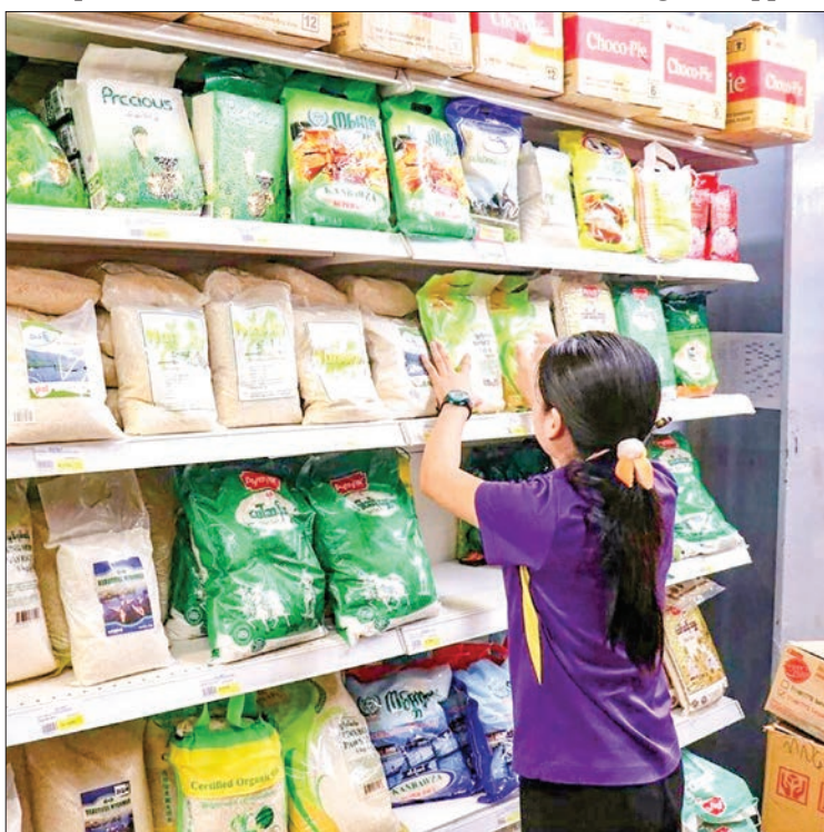
An employee shopping foodstuff in a City Mart Store.