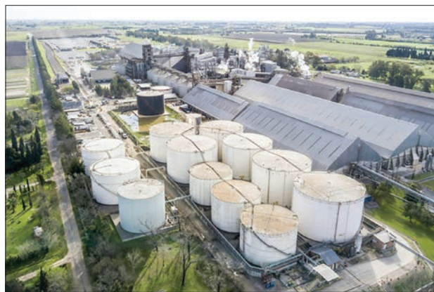
More of these needed.

LONDON — Global oil storage capacity is under intense pressure because of booming output from Saudi Arabia and the United States while the coronavirus outbreak slams the world economy and crude demand.