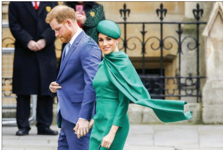
Britain’s Prince Harry, Duke of Sussex, (l) and Meghan, Duchess of Sussex arrive to attend the annual Commonwealth Service at Westminster Abbey in London on 09 March, 2020.

Sussex will formally step back from royal duties on 31 March.