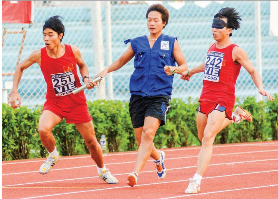
A Vietnam Para-athlete with his teammate competes during the 4x100 metre final during the 3 rd Association of Southeast Asian Nations (ASEAN) Para Games in Manila 19 December 2005.

Participating athletes have a variety of disabilities ranging from spastic, cerebral palsy, mobility disabilities, visual disabilities, amputated to intellectual disabilities. The ASEAN Para Games is under the regulation