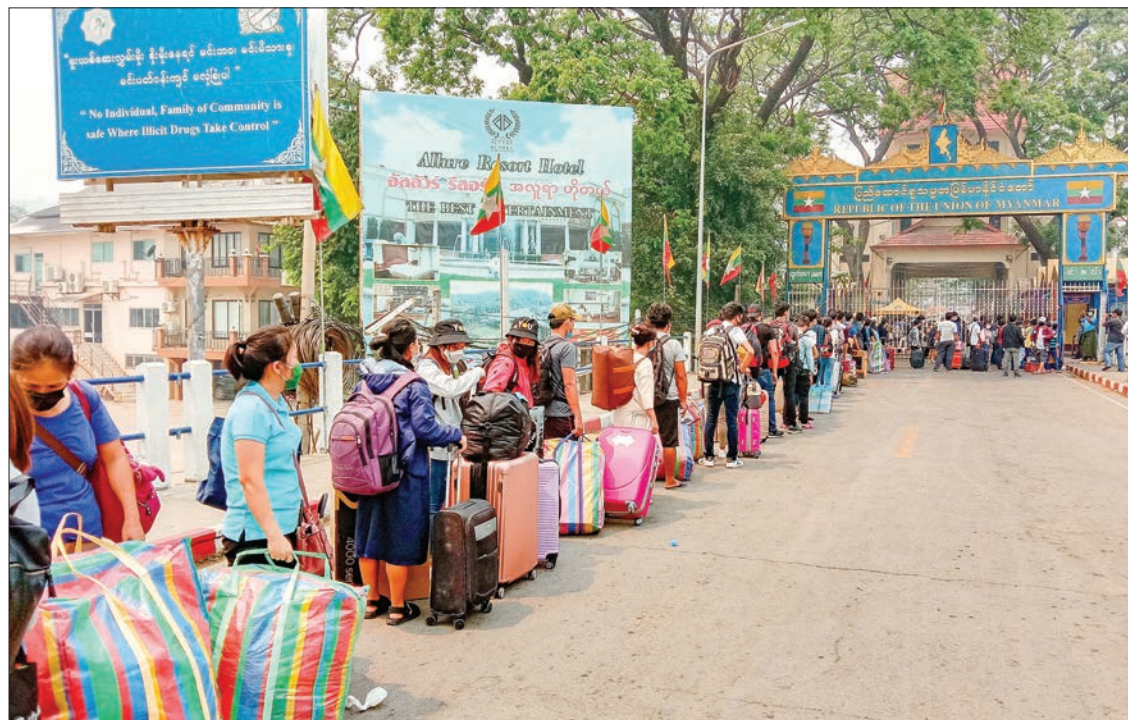
Myanmar migrant workers returning from Thailand queue at Myanmar-Thai Friendship Bridge 1 in Tachilek, Shan State on 27 March.