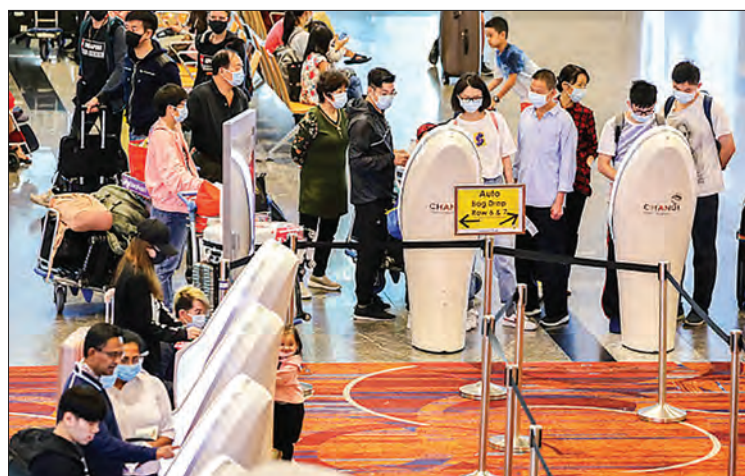
Travellers are seen wearing a protective mask at a self check-in kiosk at Changi Airport on 30 January, 2020 in Singapore.

The unlimited liquidity supply was aimed to help stabilize financial markets and minimize the negative effect from the COVID-19 outbreak, while supporting the government's fiscal stimulus package, the BOK noted.—Xinhua ■