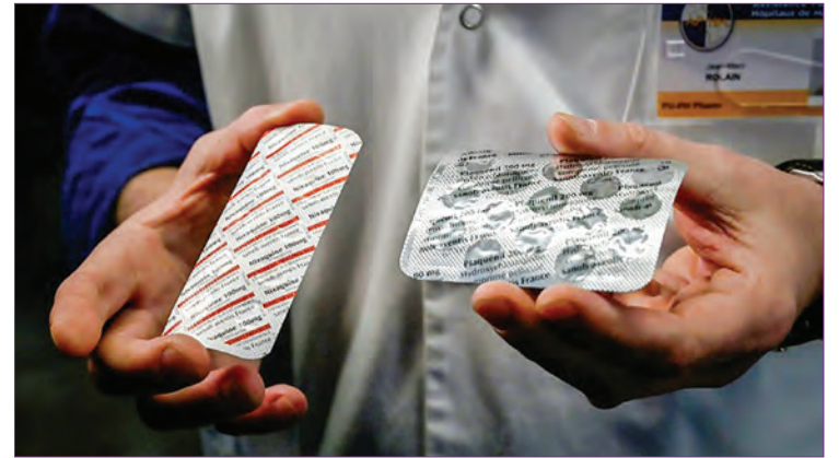
Medical staff at the IHU Mediterranee Infection Institute in Marseille, France show packets of chloroquine and hydroxychloroquine.

several hypothetical transmission rates, the models showed a huge variation in the possible numbers of people who have caught the deadly virus in Britain and Italy but exhibited no serious symptoms, and so would not be candidates for testing. — AFP ■