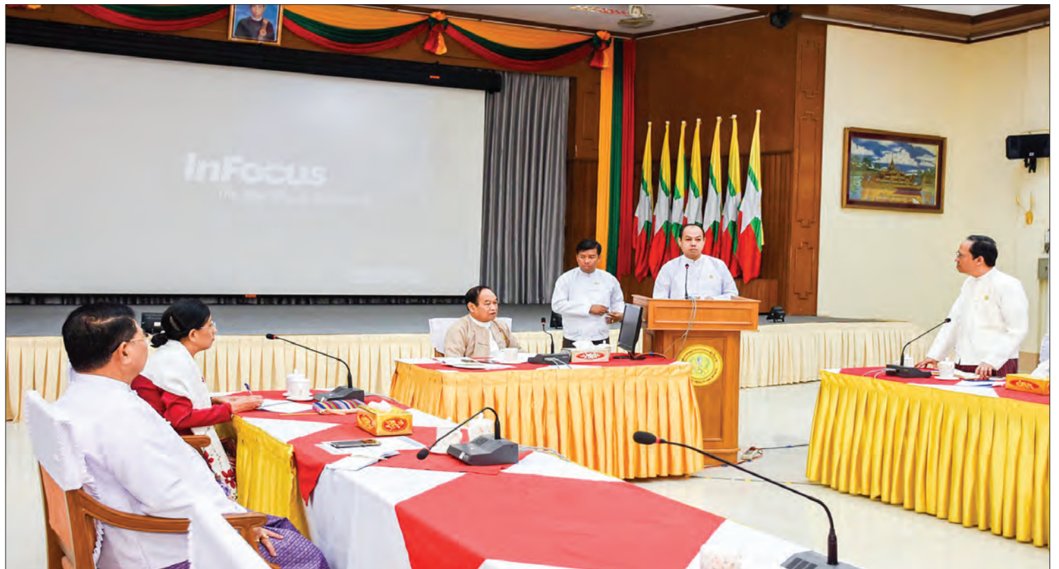
Union Minister Dr Myint Htwe attends the coordination meeting on preparedness and response to Coronavirus Disease (COVID-19) held yesterday.

He said thousands of Myanmar migrant workers from Thailand returning home in groups is a dangerous scenario as it can help spread COVID-19. He said state/regional medical officials must place containment strategies in place with that fact in mind.