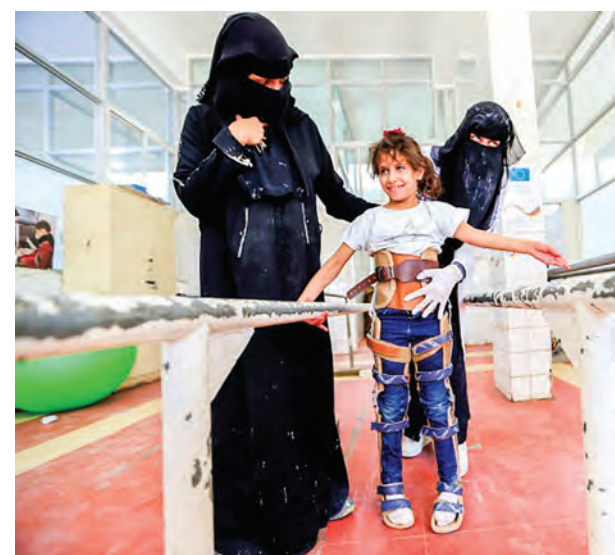
Save the Children said more than 7,522 youngsters have been killed or maimed over the past five years in the Yemen conflict.

“The government of Yemen welcomes the call of the UN chief... for a ceasefire in the face of coronavirus, and to de-escalate acts of violence in the entire country,” it said in a statement.—AFP ■