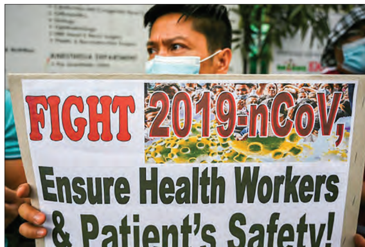
A health worker wearing a face mask holds a placard during a protest in front of a government hospital in Manila.

sociation said Thursday a ninth doctor had died of the virus, and that health workers were not getting enough protection.