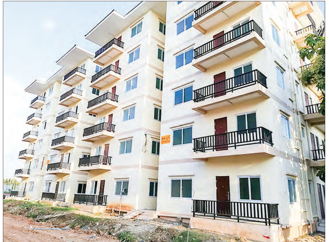
About 2,000 affordable apartments to sell in Mandalay Region.

MCDC will sell over 500 flats this time. Those who have won