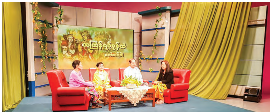
'Thingyan Yin Khone Than' talk-show is being shot at the MRTV, Yangon.