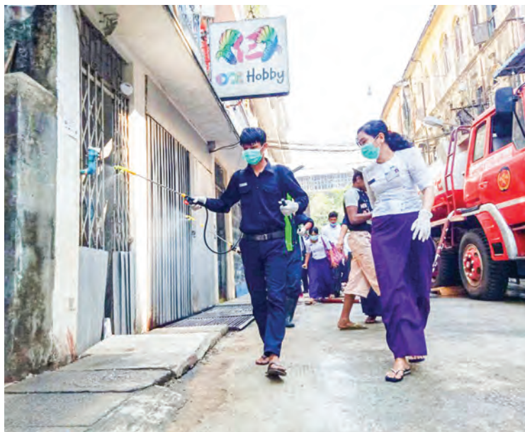
Healthcare workers spray disinfectant in Latha Township.

As Latha is one of the busy townships in Yangon, the spraying of disinfectants will continue in other parts of the township.—MNA