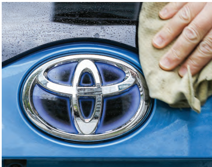
A Toyota Motor Corp. logo on a Prius PHV is polished on 9 May, 2018, at a Toyopet dealership for the automaker's vehicles in Tokyo's Shibaura area.

The Japanese automaker halted output in the US factory last Monday to prevent workers from being infected with the coronavirus and adjust production due to falling demand for its vehicles. — Kyodo News ■