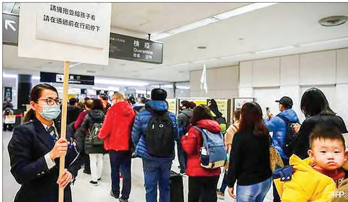
FILE: Passengers who arrived on one of the last flights from the Chinese city of Wuhan walk through a health screening station at Narita airport in Chiba prefecture, outside Tokyo, Japan.

Speaking at a meeting of the newly created national headquarters on the coronavirus response, Abe also said Japan will begin asking visitors and its nationals arriving from some countries in Southeast Asia, the Middle East and Africa to self-quarantine for