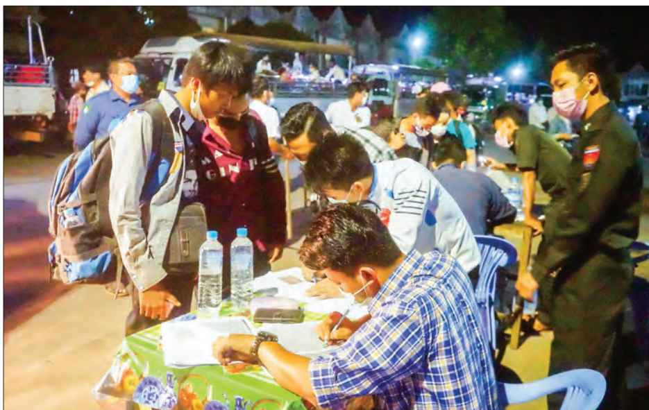
Myanmar migrant workers make registration as they return from Thailand.