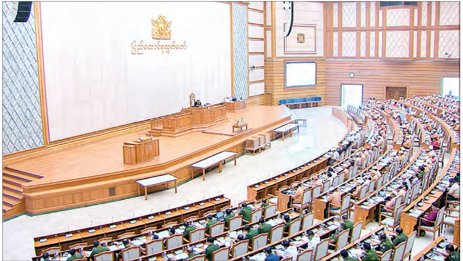
Pyidaungsu Hluttaw convenes its 29 th day meeting of 15 th regular session in Nay Pyi Taw yesterday.

The Speaker also announced the bill will be processed in line with the rules and regulations of Pyidaungsu Hluttaw.