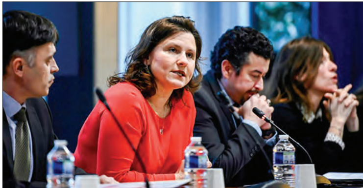
French Sports Minister Roxana Maracineanu raises notion of Tour de France spectator ban.

PARIS — French sports minister Roxana Maracineanu says this year’s Tour de France could be staged without spectators in a bid to combat the coronavirus pandemic.