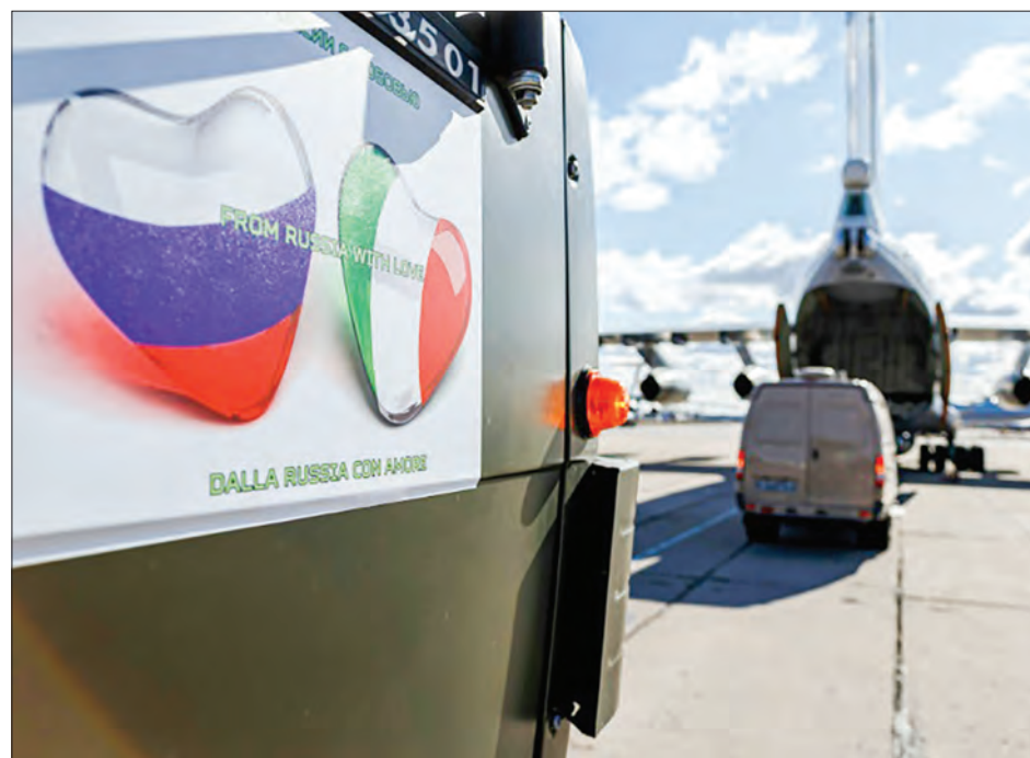
The Russian aid comes at a crucial time for Italy, which has warm ties with Moscow and has supported lifting sanctions against it.

“First of all it’s humane, secondly it hints that (anti-Russia) sanctions are inappropriate.” —AFP ■