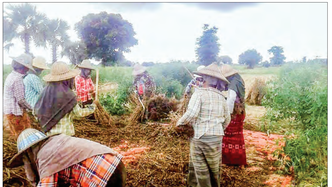
Farmers harvest sesame in Magway.

THE growing demand for black sesame, which is grown with Good Agricultural Practice (GAP), from Japan and China has driven the price up in the domestic market, according to Mandalay Commodity Depot.