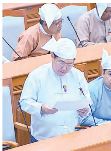
Deputy Minister U Khin Maung Win.