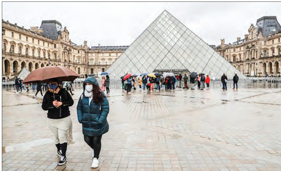
The economic impact of coronavirus on French businesses has prompted the Finance Ministry to create a dedicated crisis unit.

The global lockdown -- which also took in India’s huge population this week -- tightened further Thursday as Russia announced it was grounding