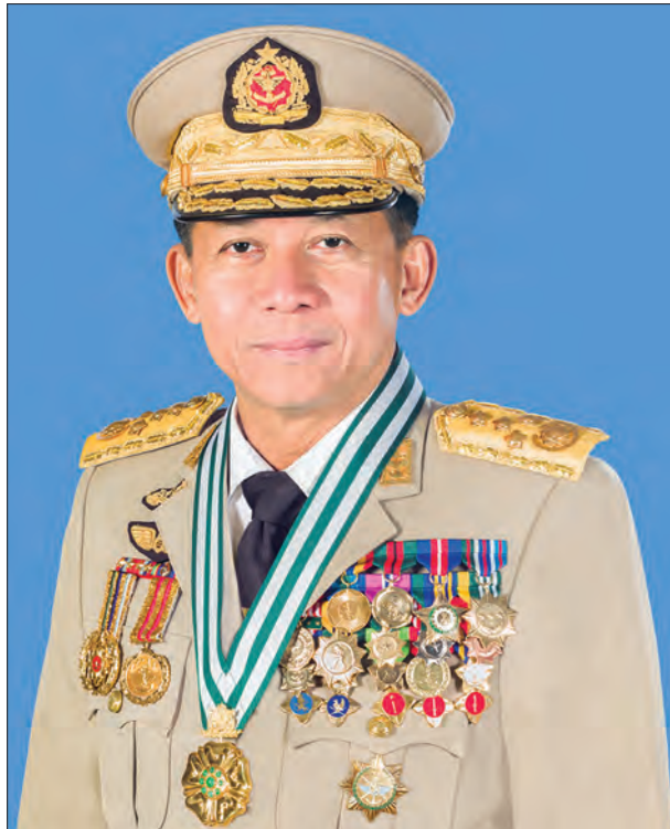
Senior General Min Aung Hlaing.

The main causes for losing the country's independence were the lack of unity and a powerful modern armed force. Due to this lesson given by history, the young thirty patriotic comrades led by Bogyoke Aung San acquired modern military skills with much sacrifice, daring and strenuous efforts. They began to stage an anti-fascist revolution together with the people on 27 March 1945, till independence was achieved. This day was initially designated as the "Resistance Day", and beginning from 1995 it was renamed "Armed Forces Day" with deep meaning, and on 27 March 2020, we have reached the 75 th Diamond Jubilee Anniversary. During this Diamond Jubilee period which was not traversed with ease and comfort, the Tatmadaw completed this long arduous and hazardous journey through the sacrifice of life, body, blood and sweat. All these sacrifices were made by all those who sacrificed with only one objective for the State and the People: Independence and perpetuation of Sovereignty, Non-disintegration of the