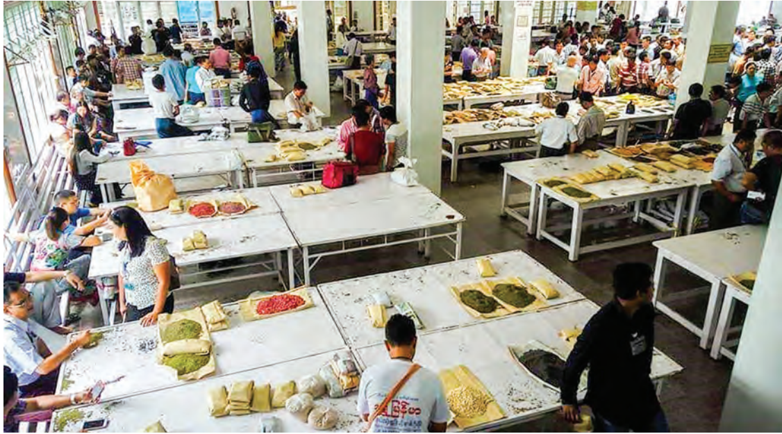
Beans merchants evaluate the quality of beans at Mandalay depots.

The spread of COVID-19 across the globe has caused Myanmar's crop sales to come to an almost