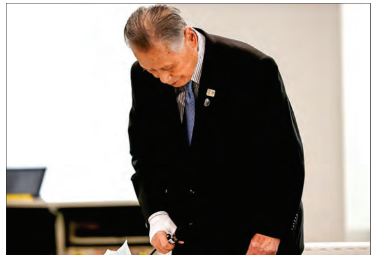
Tokyo 2020 president Yoshiro Mori said the challenge was unprecedented.

“Sometimes you need to go back to the drawing board,” he said. The Olympics have never faced this much disruption in peacetime, and the decision to delay the event has creat-