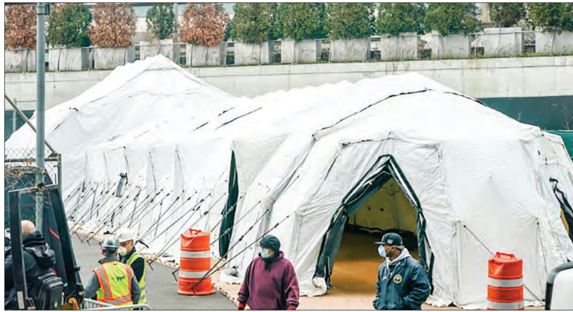
Workers building a makeshift morgue outside of Bellevue Hospital in New York.

Governments and central banks around the world have been unleashing unprecedented measures to battle the fallout from the pandemic, with US Senate leaders agreeing on a $2 trillion deal for the hard-hit American economy.—AFP ■