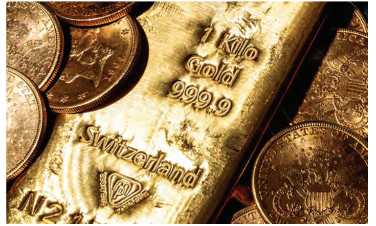
Online retailer JM Bullion has warned customers to expect delivery delays of more than 15 days owing to "extreme order volumes".