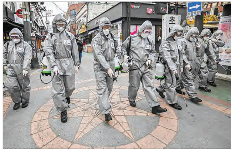
South Korean soldiers in protective gear spraying disinfectant in Seoul 25 March to help prevent the spread of the coronavirus. South Korea has the most cases of infections outside mainland China, weakening consumption and prompting the Bank of Korea to issue a warning about possible economic contraction in the first quarter.

The government will earmark S$15.1 billion to support Singaporean workers under a "jobs support scheme." For sectors most battered by the crisis, such as the airline and tourism industries, the support for wages can be as high as 75 per cent.—Kyodo news