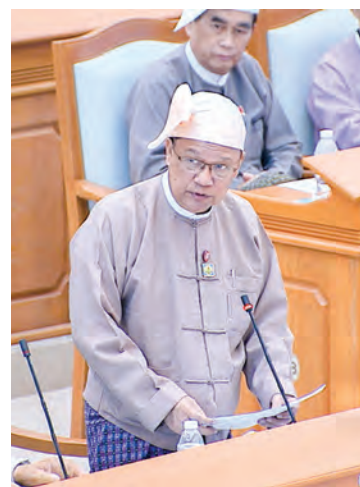
Union Minister U Thant Sin Maung.