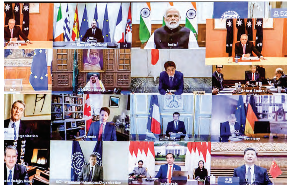
Leaders of the G20 major economies are holding an online summit on March 26, in a bid to fend off a coronavirus-triggered recession, after criticism the group has been slow to address the crisis.

The pandemic should never be taken as an excuse to disassemble global supply chains, or run each country's economy wall-