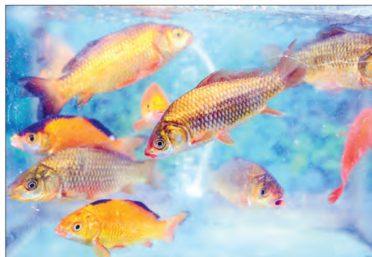
A man in the US died after taking a form of chloroquine used to clean fish tanks in the mistaken belief it would protect against the coronavirus.

But this has not put some people off. An Australian man who said he regularly buys the concoction told AFP it had "sold out in my town ... but before the virus, I could always get some".—AFP ■