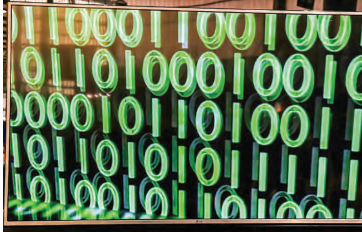
Are we going to overload?

Germany's DE-CIX internet exchange, which is one of the