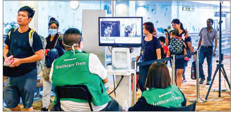
FILE: Travellers arriving at Changi Airport on 16 March, 2020. Of the 23 new Covid-19 cases announced on 17 March by the Ministry of Health, 17 are imported.

It provides some $500 billion in grants and loans to small businesses and core industries, including as much as $50 billion for strained airlines and their employees.—AFP ■