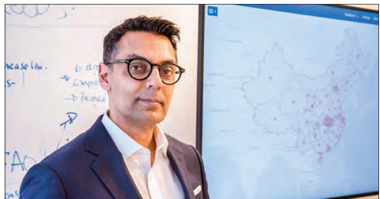
Khan, founder and chief executive of Toronto-based BlueDot, said AI is helping in the containment phase with systems that used 'anonymized' smartphone location data to track the progression of the disease and find hotspots, and to determine if people are following 'social distancing' guidelines.

Japan's announcement of stronger measures to fight the pandemic comes as cases in Tokyo have surged in recent days, with Gov. Yuriko Koike asking residents to stay at home this weekend to prevent an "explosive rise."—Kyodo News ■