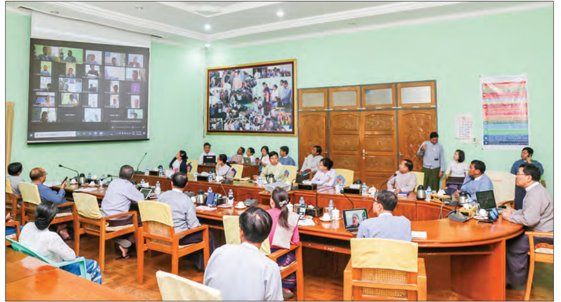
Union Minister Dr Win Myat Aye holds the video conferencing with officials of the ministry in regions and states over prevention of the spread of Coronavirus Disease 2019 (COVID-19) yesterday.

ees are obliged to articulate the Natural Disaster Law to the people to ensure that people do not break the law.