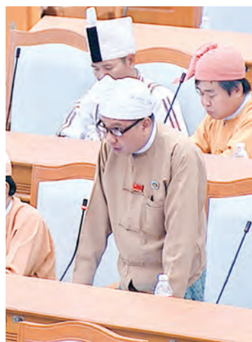
MP Dr Myat Nyana Soe.