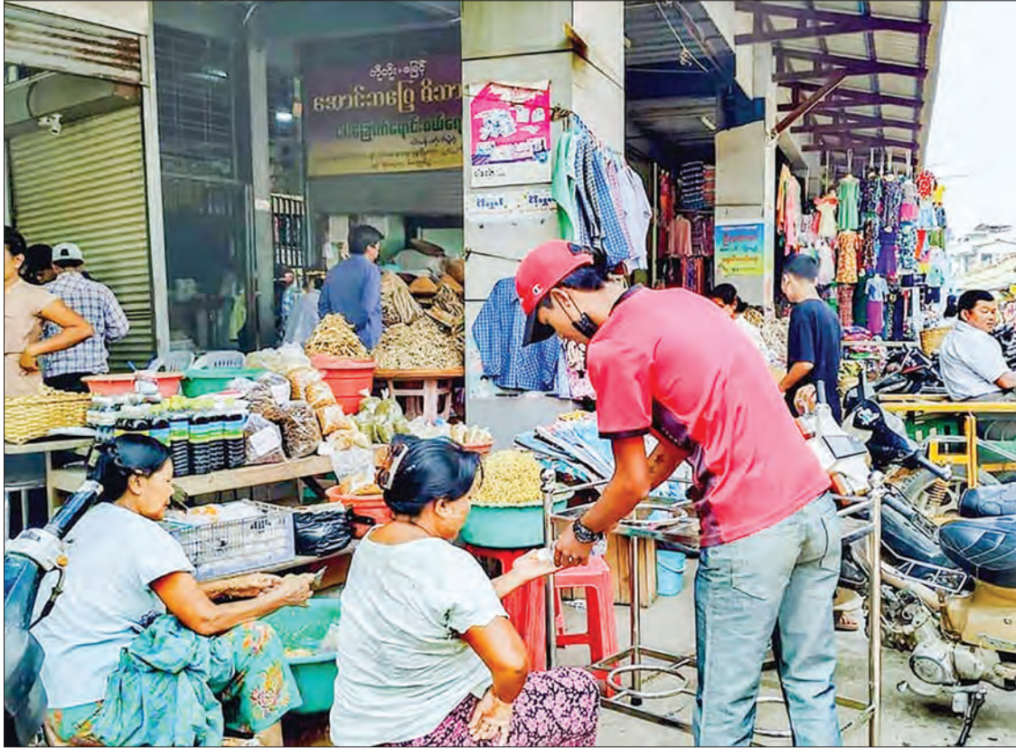
A football fan of Sagaing United FC gives hand sanitizer to a woman in the Chindwin Yadana Market in Monywa yesterday.

THE football fans of Myanmar National League donated cash, and hand gel yesterday in some townships, according to the league's social media.