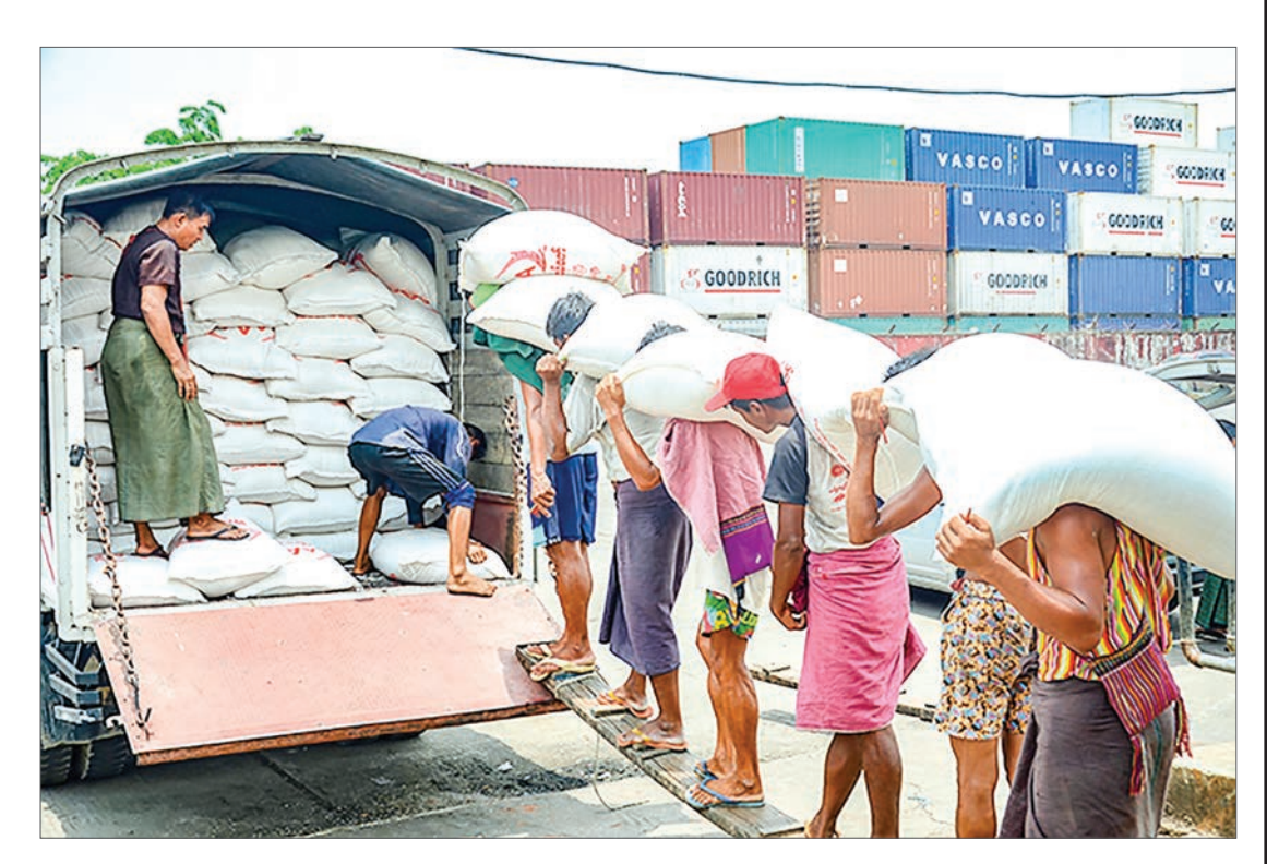
Workers carrying sacks of rice at the Botahtaung Jetty in Yangon.