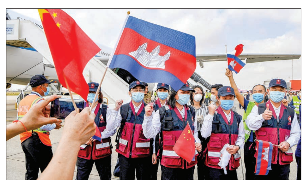
Chinese medical experts on the COVID-19 novel coronavirus are greeted upon their arrival at Phnom Penh International Airport on 23 March, 2020. Chinese medical experts on the COVID-19 novel coronavirus arrived in Cambodia on 23 March to help local authorities deal with the virus.