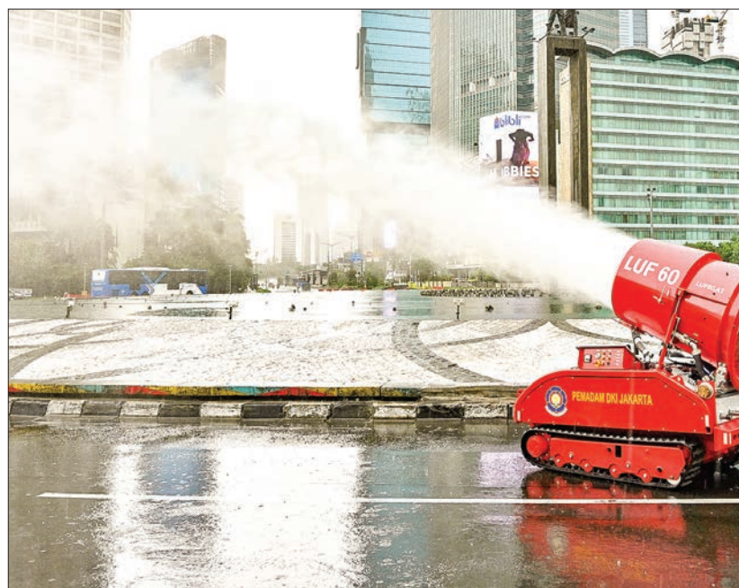
Members of Indonesian fire fighter spray disinfectant at the Hotel Indonesia roundabout in Jakarta on 22 March, 2020.