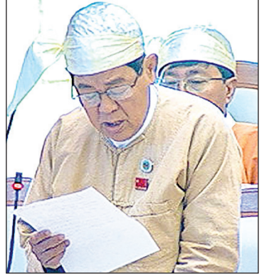
MP U Aung Thaik

Deputy Minister for Health and Sports Dr Mya Lay Sein