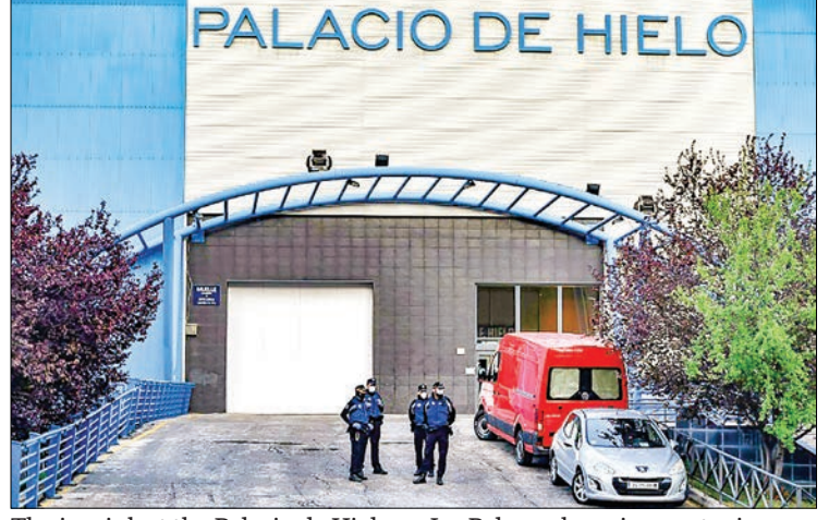
The ice rink at the Palacio de Hielo, or Ice Palace, shopping centre in Madrid was made into a morgue to deal with a surge in deaths in the capital.

According to the data compiled by the Indian Council of Medical Research (ICMR), the total number of the infection-related death toll in the country rose to nine on Tuesday, while the total number of active cases has reached 482. — ANI