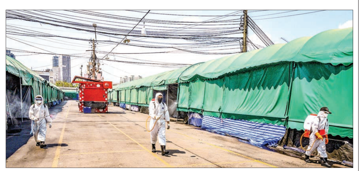
Workers in protective suits spray disinfectant, as a preventive measure against the spread of COVID-19 novel coronavirus, along the alleys of Chatuchak market in Bangkok on 23 March, 2020.

slashing growth even further. At the moment, we expect the impact of COVID-19 to be high, but short-lived and cushioned by countries' efforts to boost domestic demand."