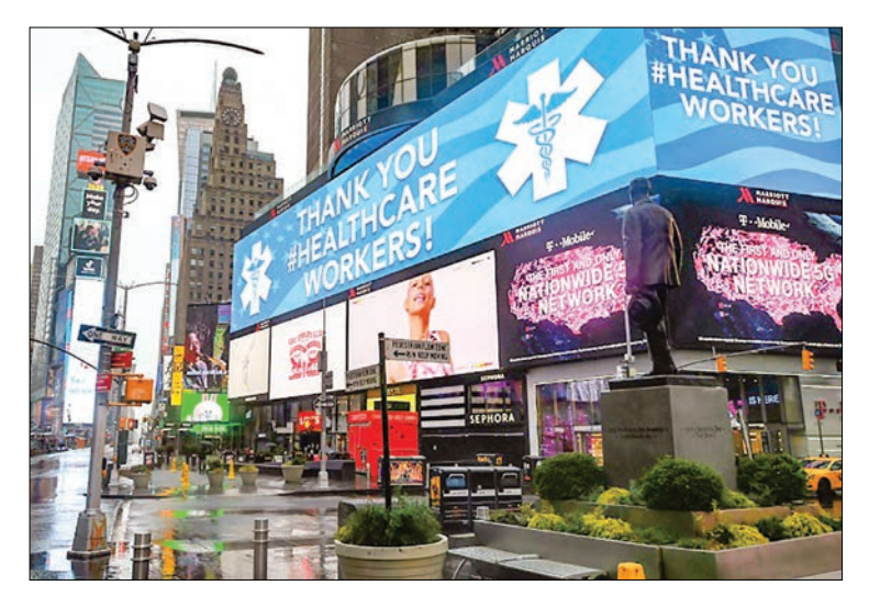
While most of the planet goes into lockdown, traders gave a massive thumbs up to the US central bank's pledge to essentially print cash.

It lost almost four per cent against the Australian dollar, three per cent against the New Zealand dollar and more than