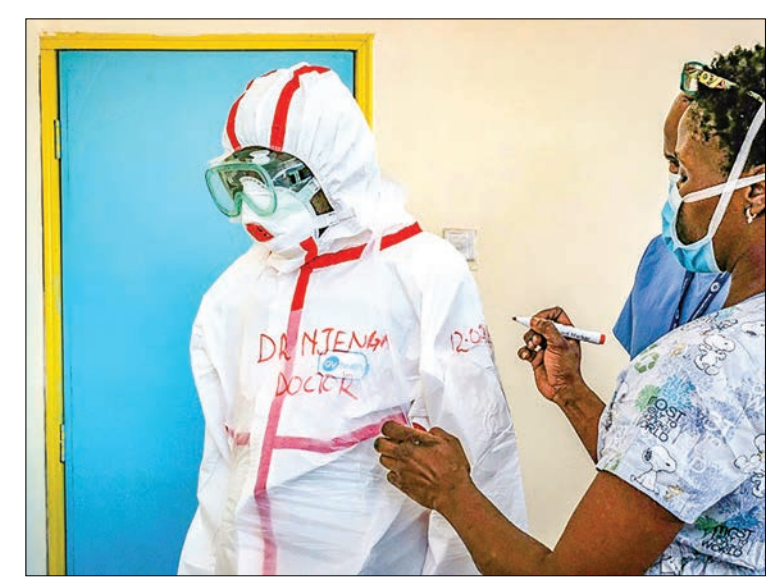
Protection: A doctor gets suited up for visiting a quarantine ward at Kenyatta National Hospital in Nairobi.

care units that "are operational at any given time".