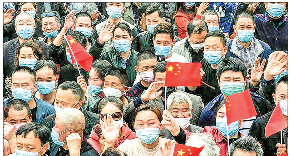
This photo taken on 23 March 2020 shows residents cheering as members of a medical assistance team from Chongqing depart after helping with the COVID-19 coronavirus recovery effort in Yunmeng county, in Xiaogan city in China's central Hubei province.

today," a female doctor surnamed Wu told AFP.