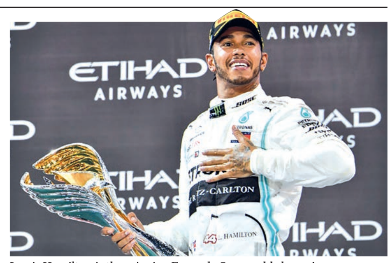
Lewis Hamilton is the reigning Formula One world champion.