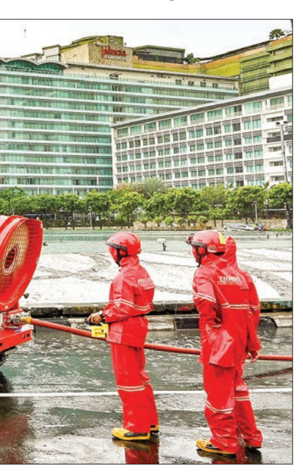
ed sectors heavily in Q1 2020. Additionally, Singapore's service exports will likely see a sharp

According to the report COVID-19 outbreak has caused Singapore to close its borders to visitors coming through China, Iran, northern Italy and South Korea, affecting tourism-relat-