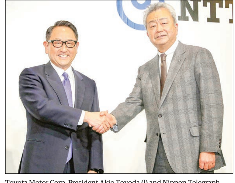
Toyota Motor Corp. President Akio Toyoda (l) and Nippon Telegraph and Telephone Corp. President Jun Sawada shake hands following a press conference in Tokyo on 24 March, 2020.

NTT also said it will launch an internet-led smart city project at an NTT-related block in Shinagawa area in Tokyo's Mi-