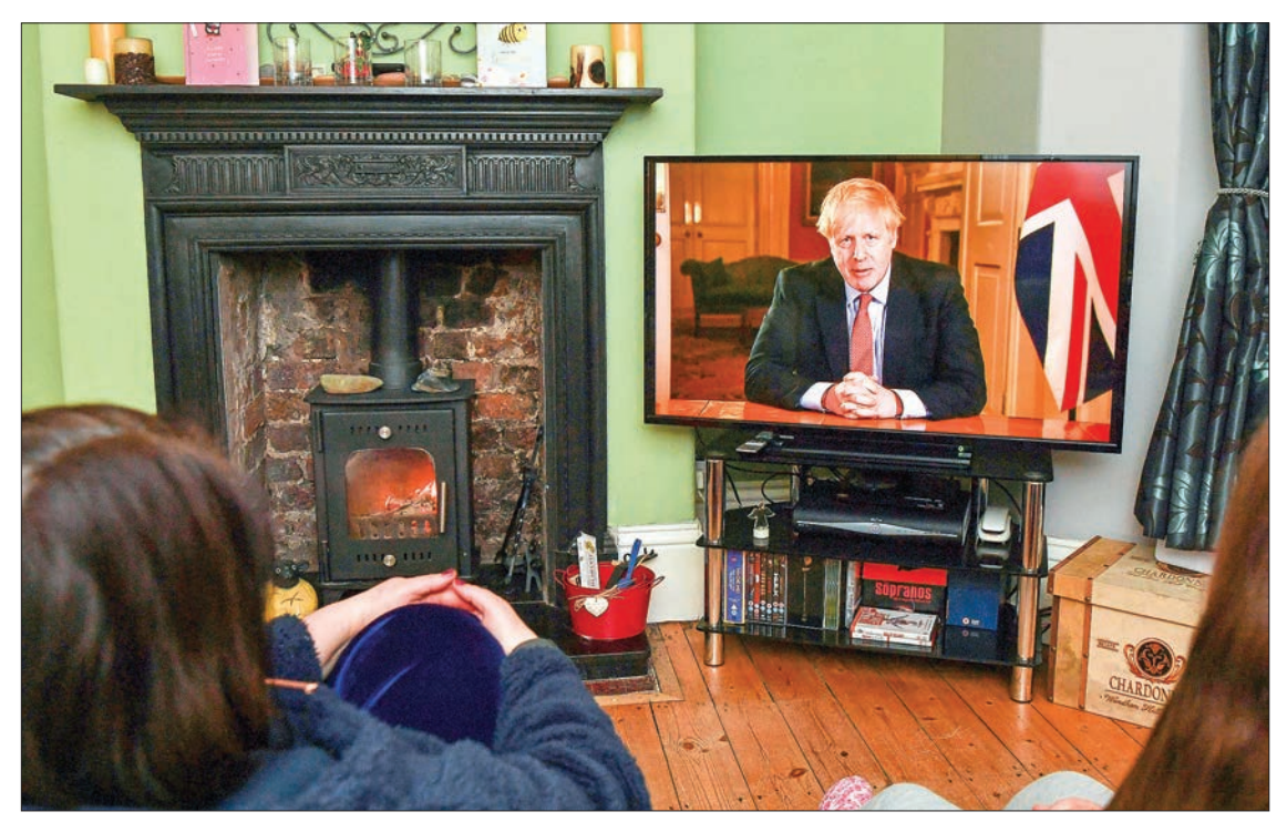
Members of a family listen as Britain's Prime Minister Boris Johnson makes a televised address to the nation from inside 10 Downing Street in London, with the latest instructions to stay at home to help contain the Covid-19 pandemic, from a house in Liverpool, north west England on 23 March 2020.

.LONDON (United Kingdom)— Britain's leaders on Tuesday urged people to respect an unprecedented countrywide lockdown, saying that following advice to stay at home would stop people dying of coronavirus.