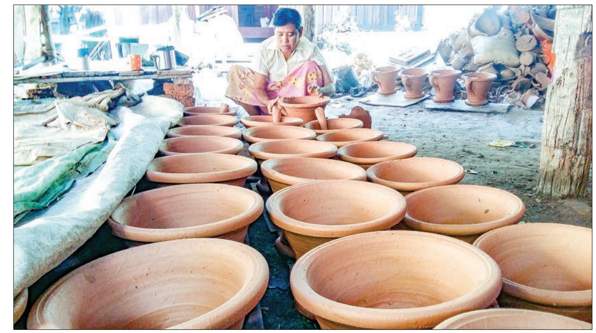
A glazed earthenware workplace is seen in Pathein.

"The glazed earthenware businesses are almost vanishing because people are using plastic products like plastic baskets, boxes, and containers instead. They are lighter, easy to move, no need to worry for breaking and more water capacity. So, people aren't using glazed earthenware now. There are little or no glazed earthenware craftsperson nowadays. However, people like to use glazed earthenware mortars although some are made of iron