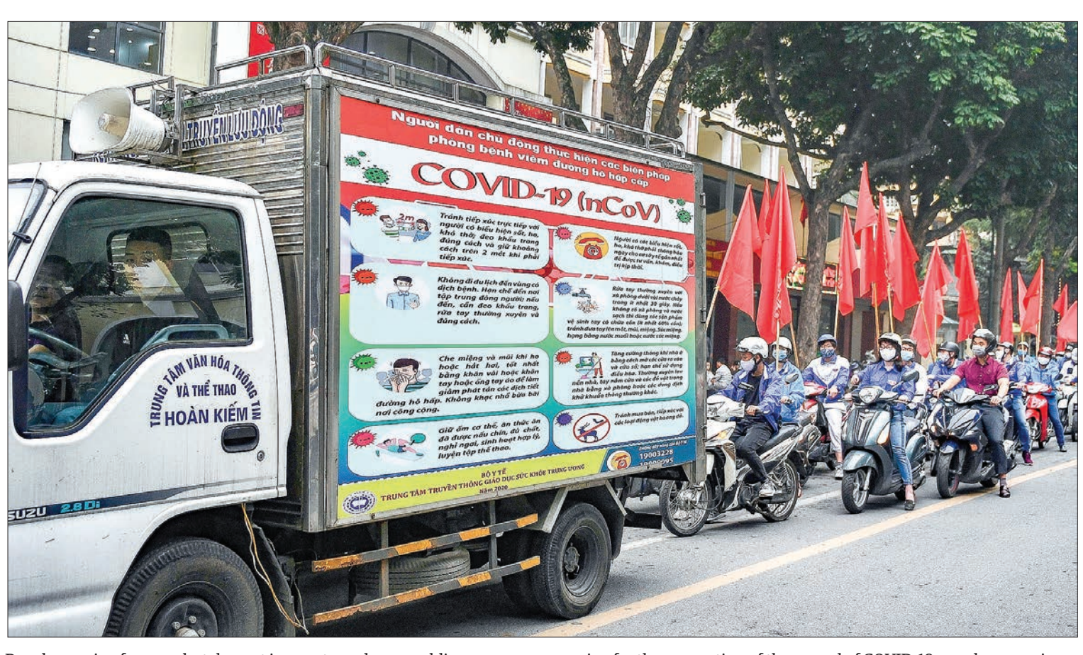
People wearing face masks take part in a motorcade as a public awareness campaign for the prevention of the spread of COVID-19 novel coronavirus in Hanoi Viet Nam on 23 March, 2020.

However, impacts on tourism and supply chains are expected to be short-lived. The US-China Phase One trade deal and a recovery in the global electronics cycle in the second half of