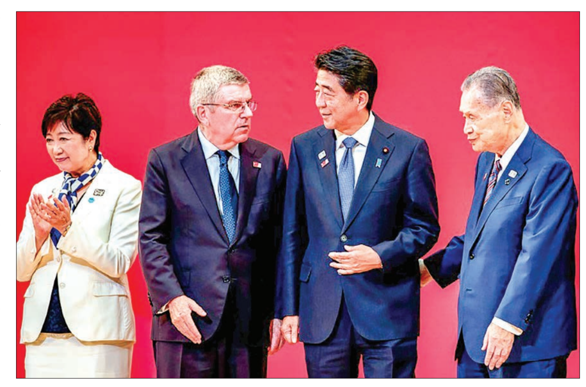
(L-R) Tokyo governor Yuriko Koike, IOC president Thomas Bach, Japanese Prime Minister Shinzo Abe and organising committee chief Yoshiro Mori have been under pressure to postpone the Tokyo Olympics.

"The leaders agreed that the Olympic Games in Tokyo could