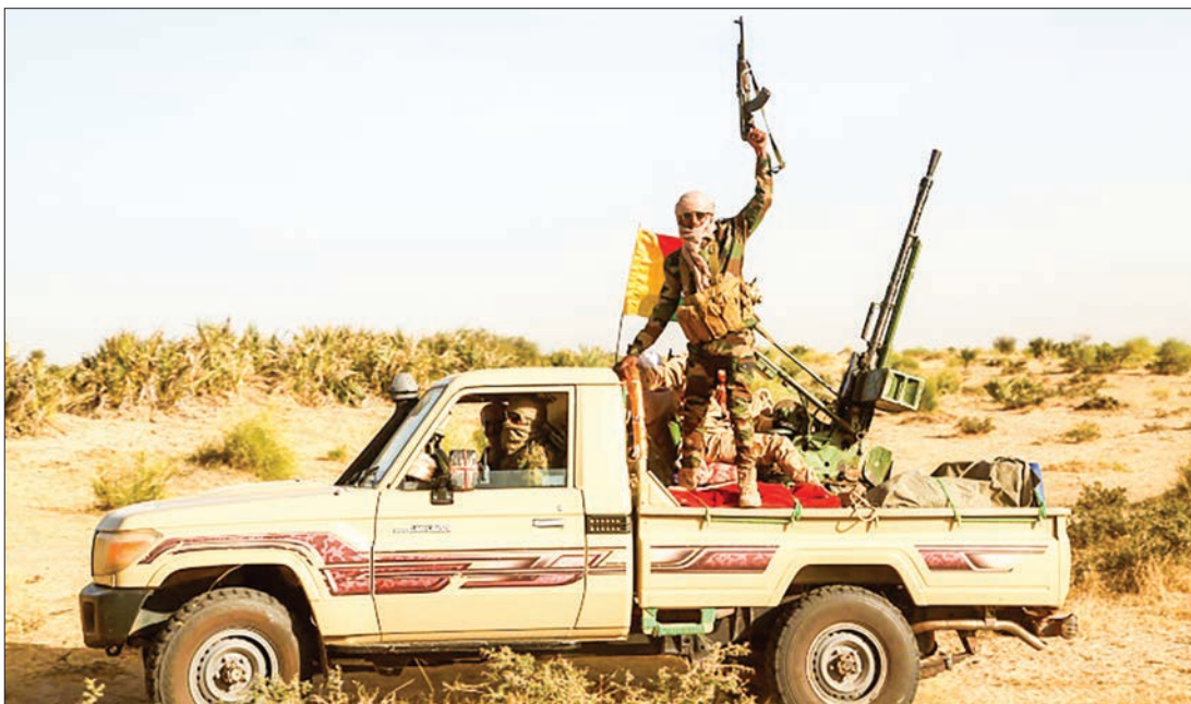
Malian fighters patrolling on the border with Mauritania on January 22, 2020.

Others such as Zoom, used mainly for remote working, and Google Hangouts, Skype and Rave have also seen upticks. —AFP