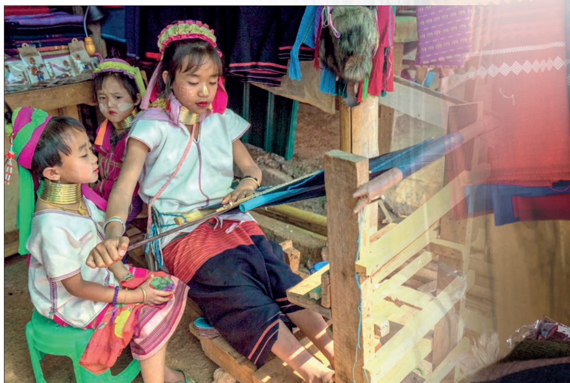
Travellers often pay visit to Panpet Village where Kayan (Padaung) ethnic people reside. Currently, the entrance to the village is crowded with hustle and bustle of shoppers and sellers.