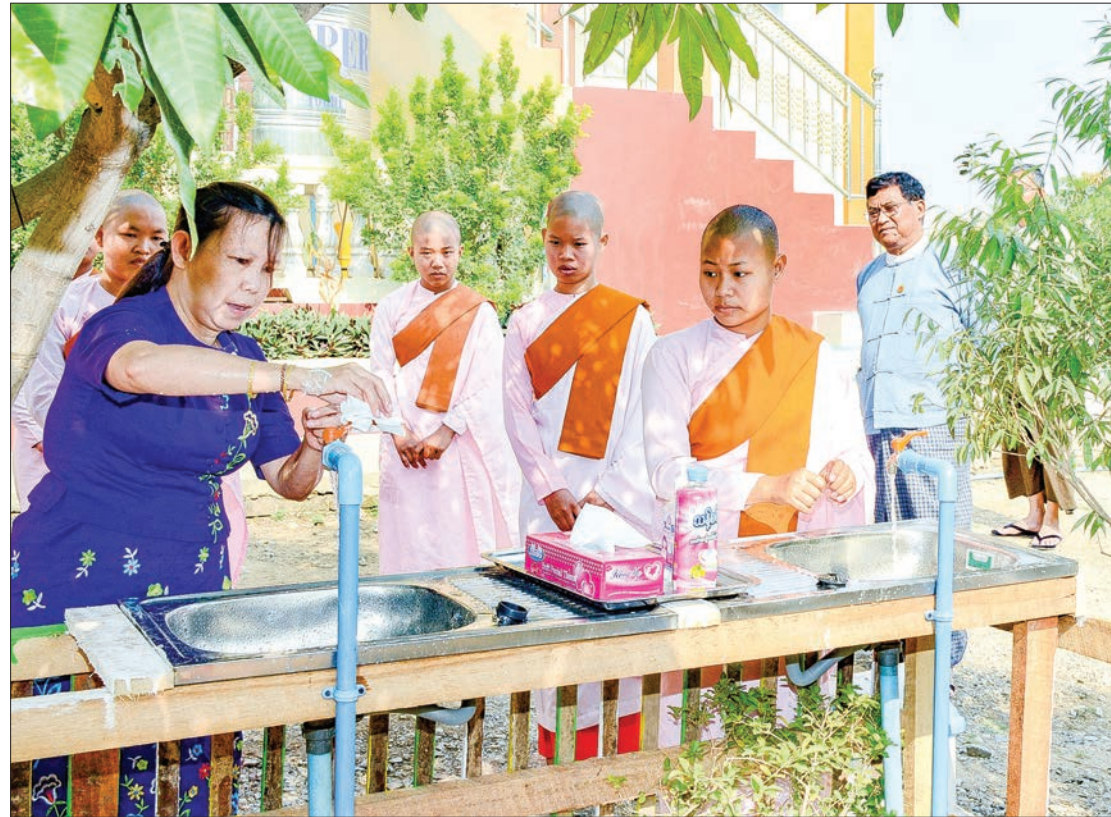
Deputy Minister U Soe Aung visits the awareness campaign for COVID-19 at the philanthropic centre in Nay Pyi Taw yesterday.

DEPUTY Minister for Social Welfare, Relief and Resettlement U Soe Aung led an