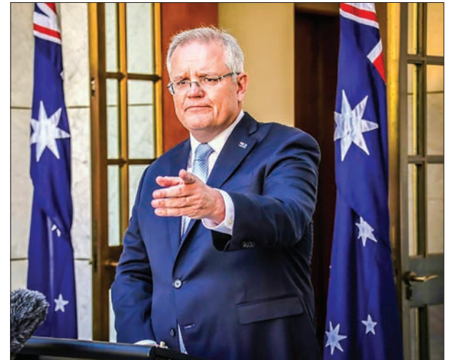
Prime Minister Scott Morrison said the government was also ‘moving immediately’ to recommend against non-essential travel.

Prime Minister Scott Morrison said the government was also “moving immediately” to recommend against non-essential travel, warning further measures were imminent to deal with localised outbreaks.—AFP ■