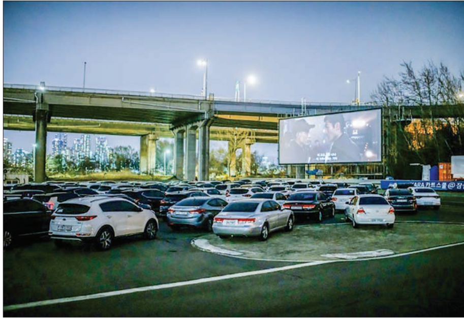
People can park their cars in front of a large outdoor screen.

SEOUL — A long queue of cars forms in front of a drive-in cinema in Seoul, as South Koreans look for safer spaces to enjoy a movie without the risk of contracting the coronavirus raging across the world.