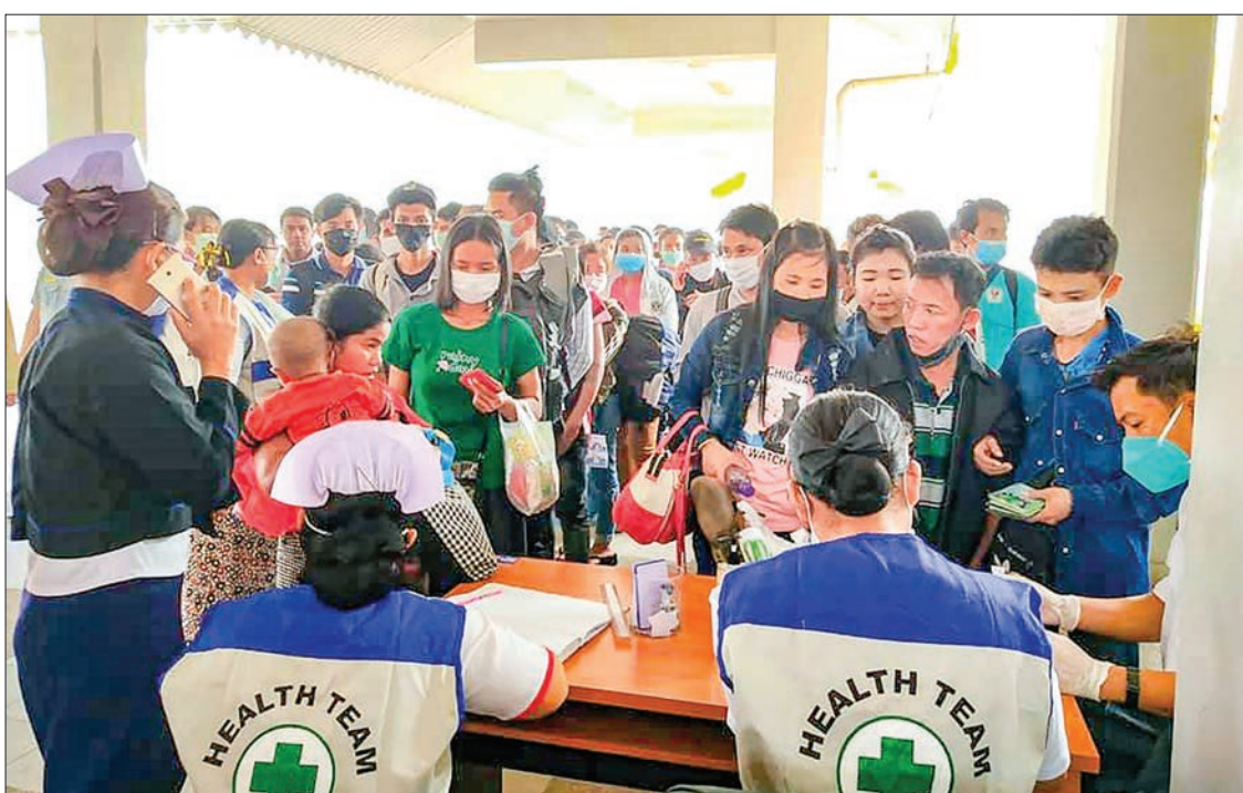
Health Team providing health care to people at the Myawady-Thai border gate.