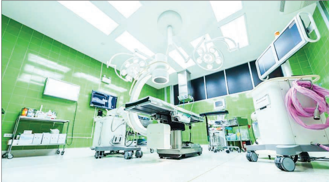
FILE: Health Minister Olivier Veran said that as far as he knew the man – who died on Saturday – was the “first hospital doctor to be hit”.

PARIS — France on Sunday reported its first death of a hospital doctor from coronavirus.