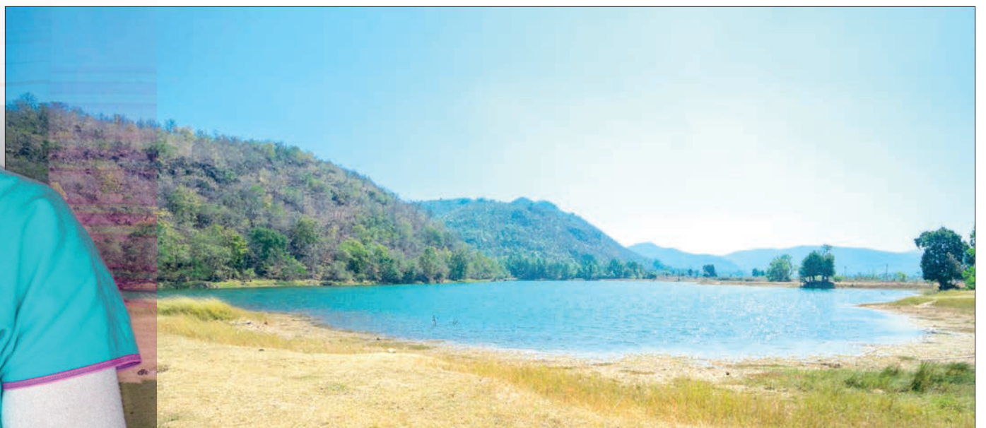
In the legendary story, Dwe Mei Naw and her six sisters played water at the lake at the foot of the hill daily. Prince Thudanu arrested Dwe Mei Naw by rope and then both married. Seven series lakes might be the ones involved in the story.

nates from the underground river of Htiparunu Tunnel. The statues of Roman Catholic Christians are kept in a cave. Travellers can pay visit to the spring in Koingan Village of Saungsula Village-tract, along the road from the junction of Nawngpale Village.