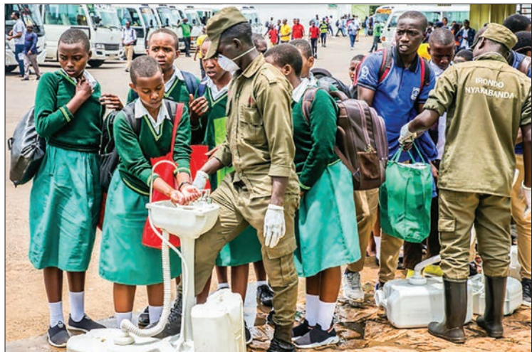
Secondary school students in Rwanda wash their hands at temporary hand washing point before they return home after authorities closed all boarding schools.

Anyone arriving in Rwanda will be subject to a 14-day quarantine at designated locations.—AFP