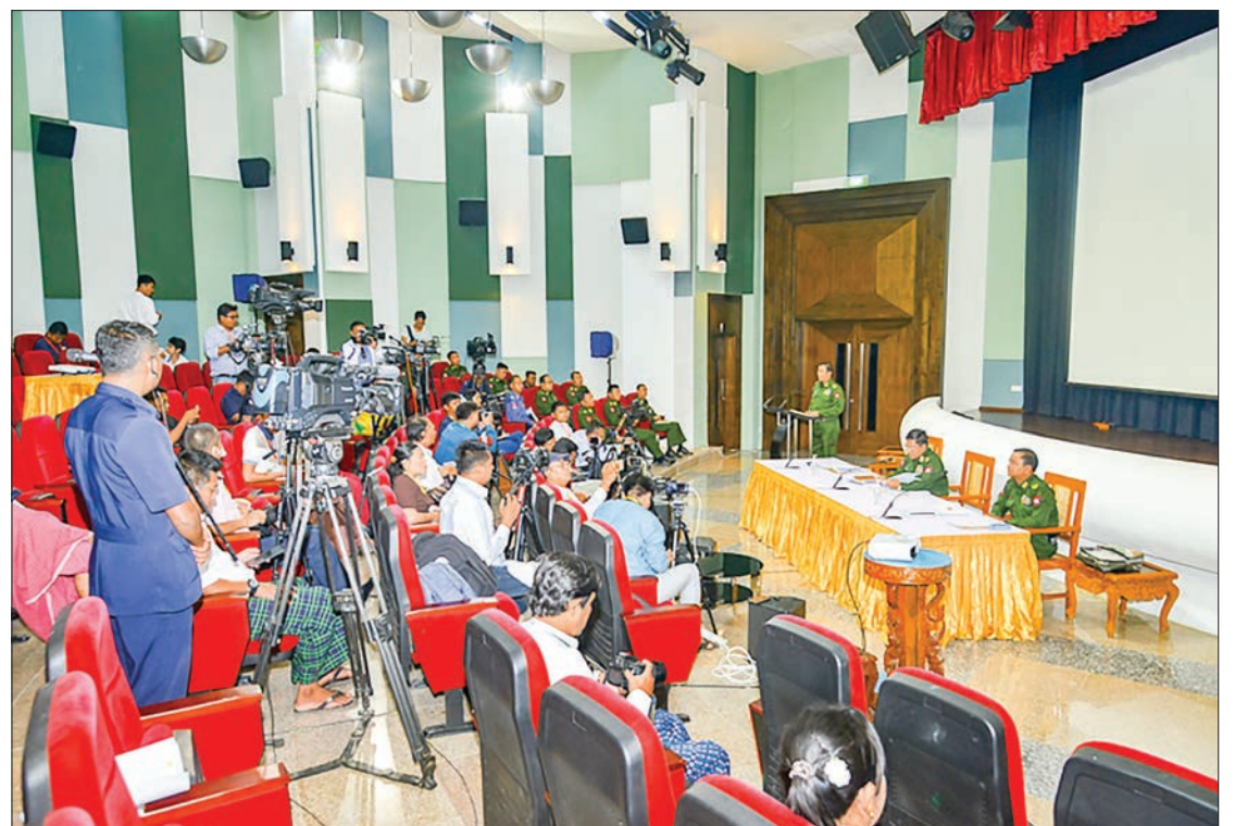
Tatmadaw True News Team holds the press conference in Nay Pyi Taw yesterday.