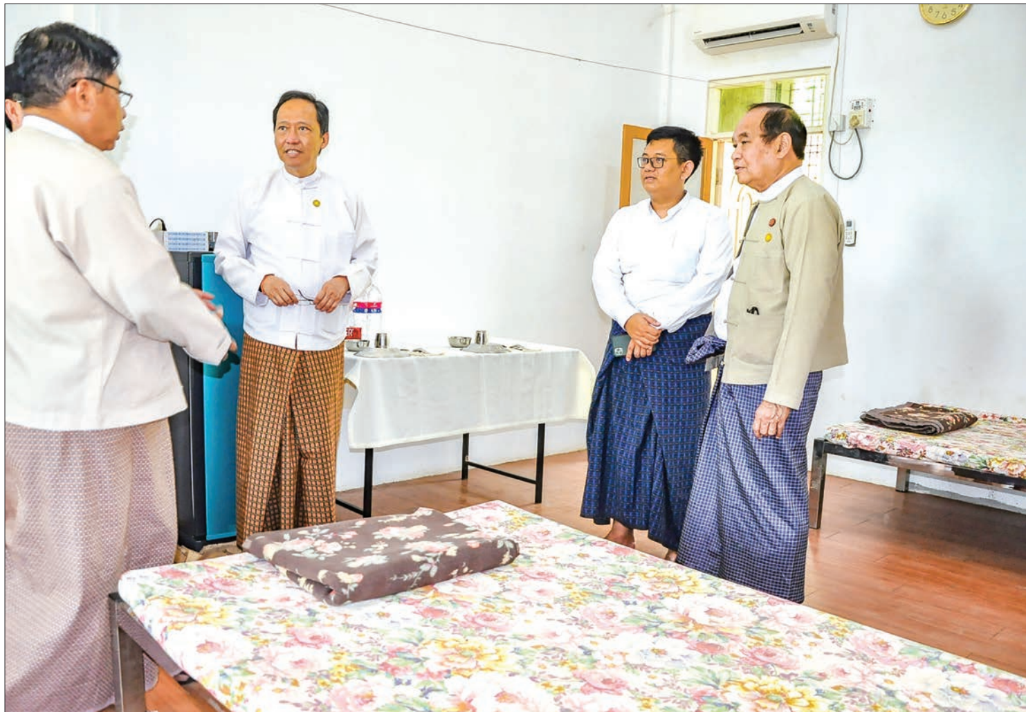
Union Minister Dr Myint Htwe visits the Dhammaduta Jetavana Monastery in Hmawbi Township, Yangon, which has allowed its facilities to be used as a quarantine site.

T HE Dhammaduta Jetavana Monastery in Hmawbi Township, Yangon, has allowed its facilities to be used as a quarantine site.