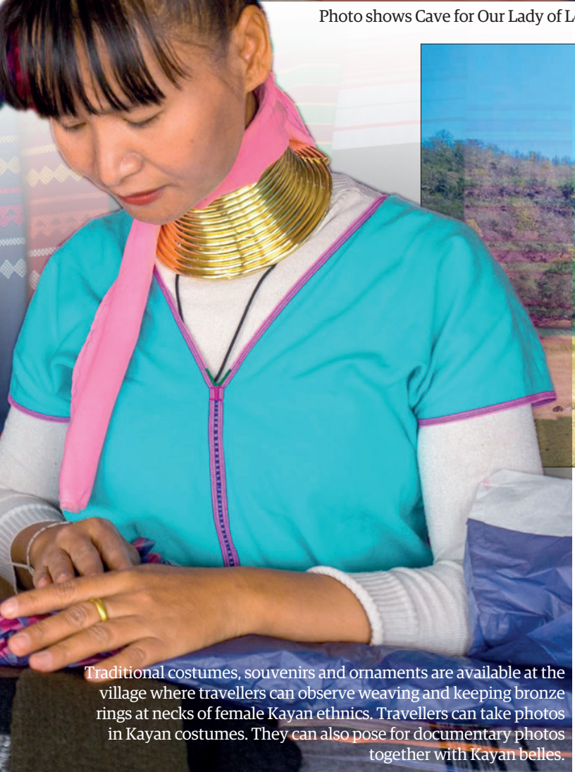
Traditional costumes, souvenirs and ornaments are available at the village where travellers can observe weaving and keeping bronze rings at necks of female Kayan ethnics. Travellers can take photos in Kayan costumes. They can also pose for documentary photos together with Kayan belles.