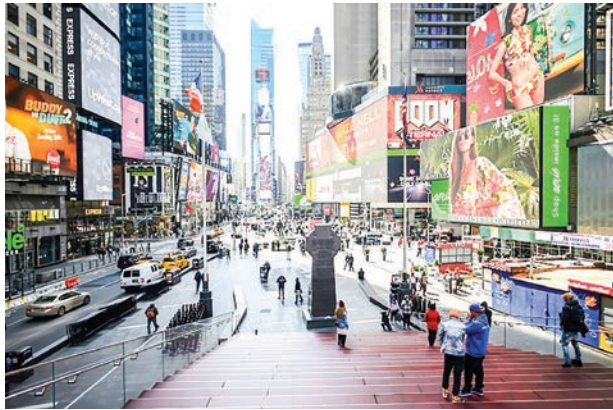
Few people are seen at Times Square in Manhattan on March 16, 2020 in New York City.

But so have others like hotels and much of the entertainment sector, paralyzed as millions of Americans simply stay home out of fear — or under orders — over infection with coronavirus.—AFP