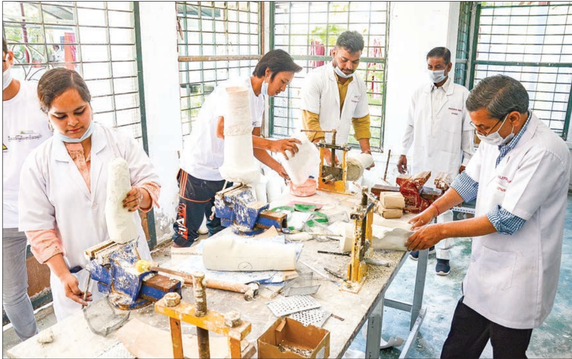
The Jaipur Foot Artificial Limb Fitment Camp being organized in Yangon. The camp started on 19 March and ends on 10 April.

THE Embassy of India in Yangon in collaboration with Bhagwan Mahaveer Viklang Sahayata Samiti (BMVSS), Jaipur, India and U Nu Daw Mya