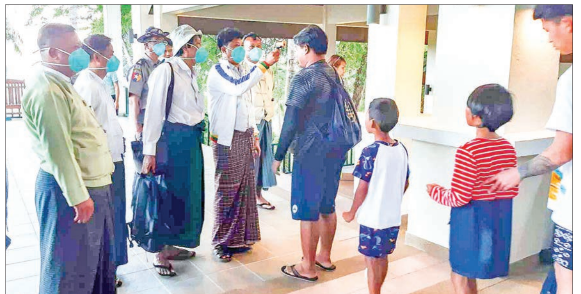
Officials check the body temperature of local people in Kawthoung to prevent from COVID-19 outbreak in Myanmar.