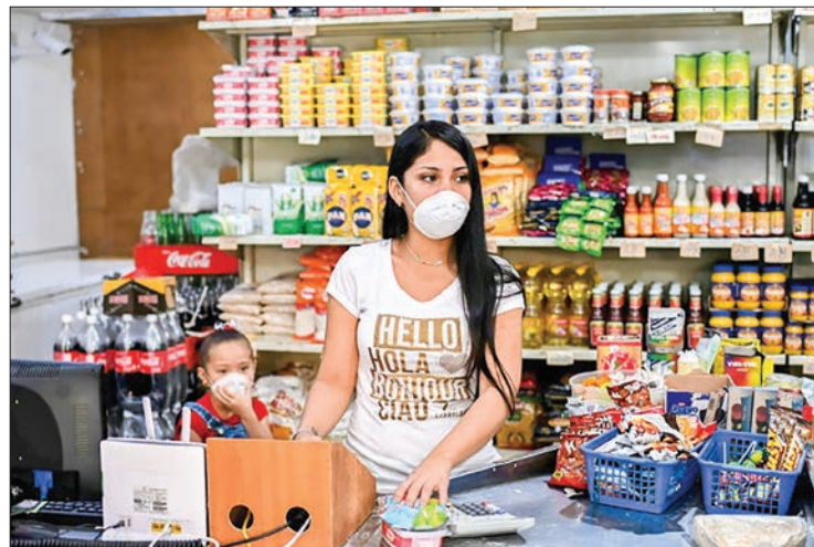
Before the coronavirus outbreak Venezuelans were already suffering from a lack of necessary medical supplies due to a severe economic crisis.

She also serves them a citric herbal tea. "You must drink it," she orders. In this remote