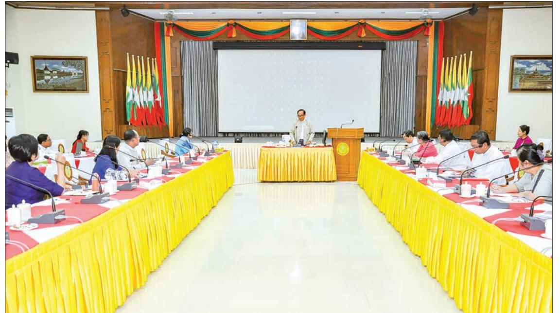
Union Minister Dr Myint Htwe addresses the coordination meeting 30/2020 of the pandemic prevention central committee in Nay Pyi Taw yesterday.