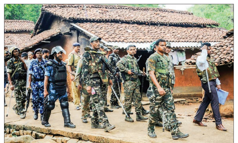
There are large numbers of Indian troops fighting Maoist rebels in central India. PHOTO: AFP

Thousands have been killed in the fighting. — AFP