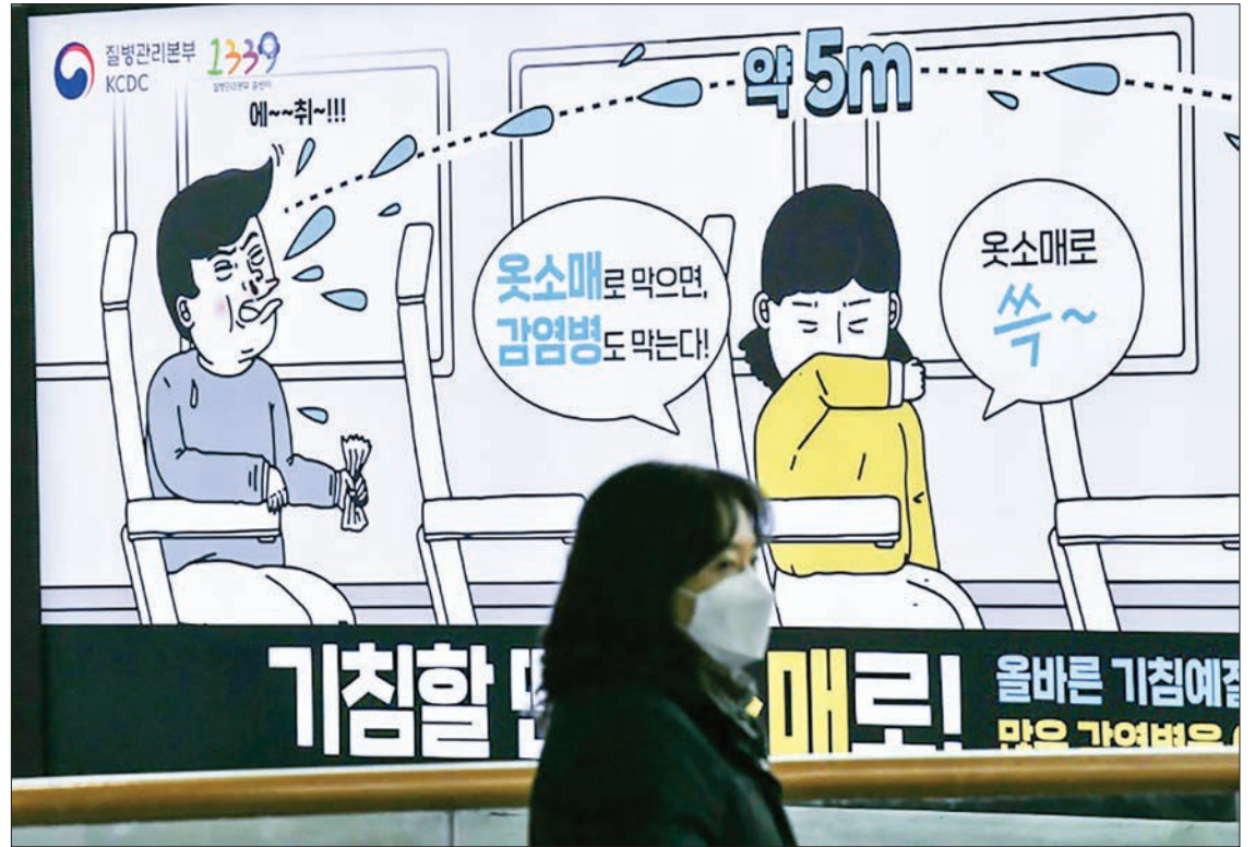
South Korea has been hard hit by the virus.

to foreigners and non-residents, Australia has told citizens to cancel their domestic travel plans too as the number of cases topped 1,300.