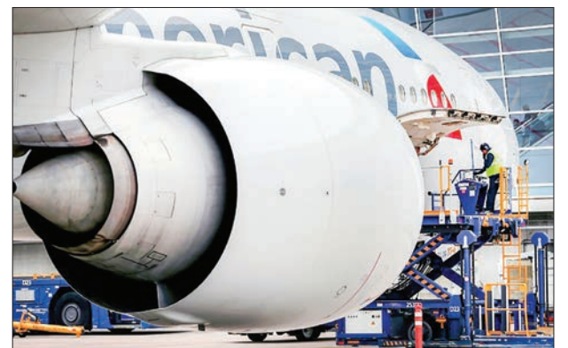
The pandemic has had a devastating effect on air transport in the United States and elsewhere, as several countries have imposed far-reaching travel bans.

The signatories appeared to be trying, in part, to counter recent negative publicity over reports that in recent years the airlines, while taking in billions in profits, used stock buybacks and other measures to reward shareholders rather than putting money into workers' salaries or a rainy-day fund.—AFP ■