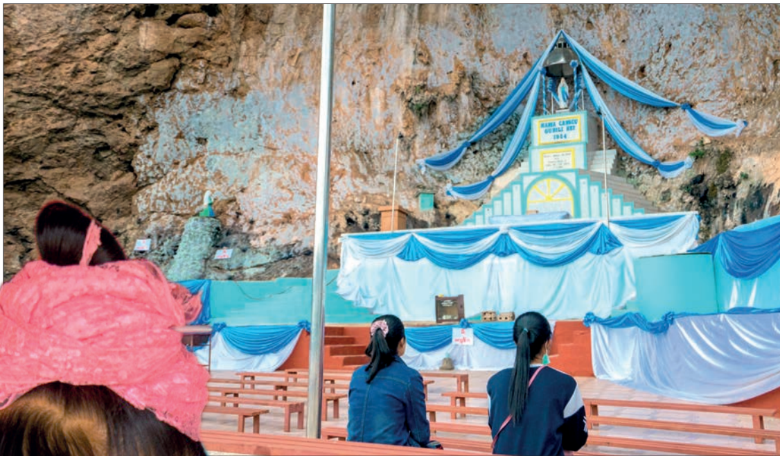
Photo shows Cave for Our Lady of Lourdes on the road to Koingan spring.

In my view, Kayah State will have larger number of travellers as of 2020. It is because local travellers are willing to make trips to new areas while globetrotters wish to wonder around many new sites in addition to Bagan, Inlay and Ngapali of Myanmar. That is why Kayah State becomes a favorite one of all travellers. Hence, now is an opportune time