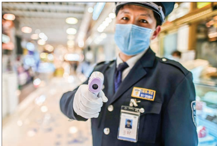
The study in China -- its first clinical trial for a COVID-19 vaccine -- involves a sample of 108 people.

As the COVID-19 pandemic rages and governments step up protection measures, pharmaceutical companies and re-