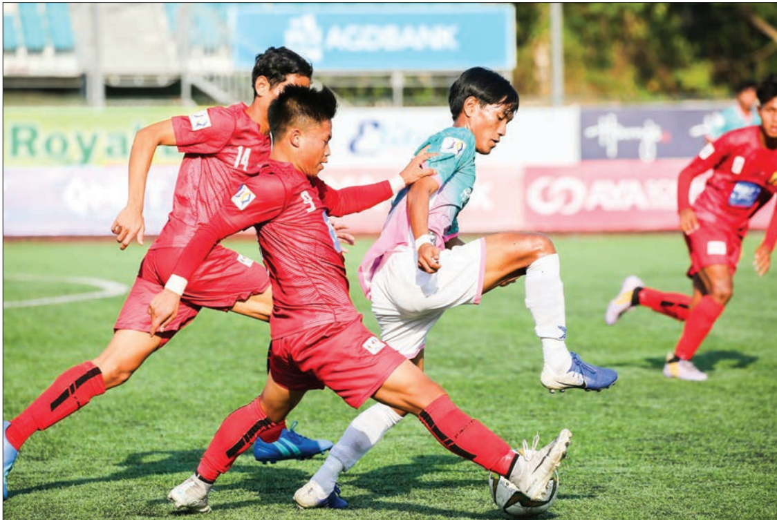
Players from Shan United (red) vie for the ball with a player from Yangon United (green) during their yesterday's MNL U-21 match at the Yangon United Sports Complex.