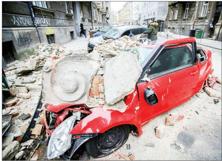
'The last thing we need with the coronavirus'.

ZAGREB — A 5.3-magnitude earthquake tore down chunks of buildings in Zagreb and left a teenager in critical condition on Sunday, state media reported, as authorities warned residents not