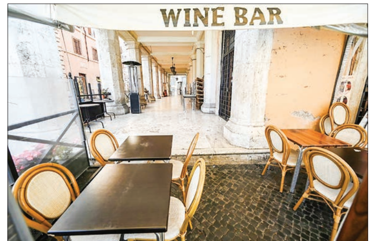
A closed restaurant and wine bar is pictured on Piazza Navona in Rome on March 12, 2020, as Italy shut all stores except for pharmacies and food shops in a desperate bid to halt the spread of a coronavirus.

LOS ANGELES — Coronavirus lockdown or not, Amaya Howard plans to unwind after a hard day’s work by sharing a few glasses of wine with her friends.