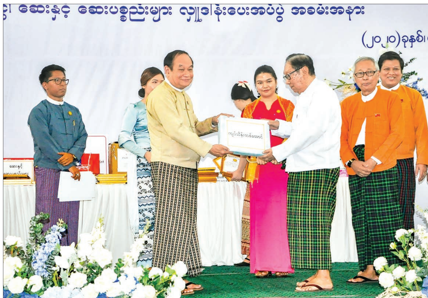
Union Minister Dr Myint Htwe receives the cash donation for Central Committee on Prevention, Control and Treatment of 2019 Novel Coronavirus and the Ministry of Health and Sports yesterday.

UNION Minister for Health and Sports Dr Myint Htwe attended the ceremony to donate cash, medical equipment and medicines to Central Committee on Prevention, Control and Treatment of 2019 Novel