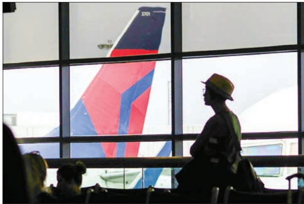
Delta Air Lines has taken out a $2.6 billion loan and put some of its airlines up as collateral.

Amid the spreading economic carnage, Bastian said there are now 13,000 employees who have taken voluntary unpaid leave, and “we could use more.”