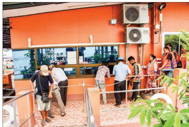
Officials conducting the immigration processes at the Kawthoung-Ranong port border.