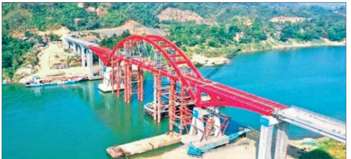
The Kaladan River crossing bridge in Chin State's Paletwa Township is set to open to traffic soon.