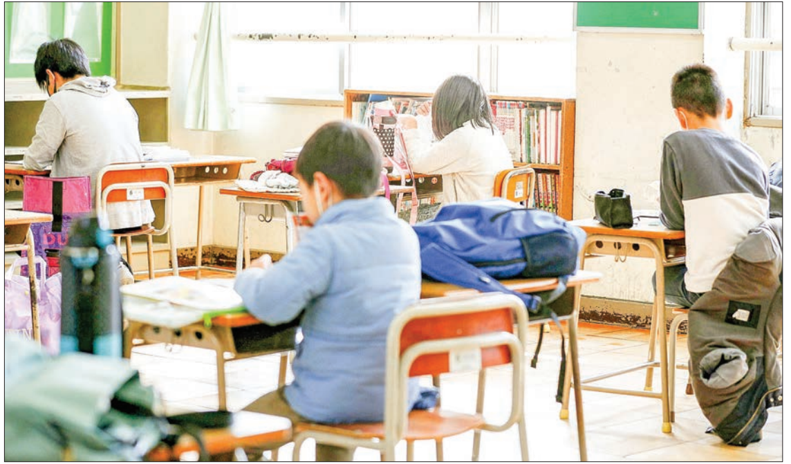
A closed elementary school in Nagoya provides an open classroom for students for self study.

Some lawmakers and officials were advocating a possi-