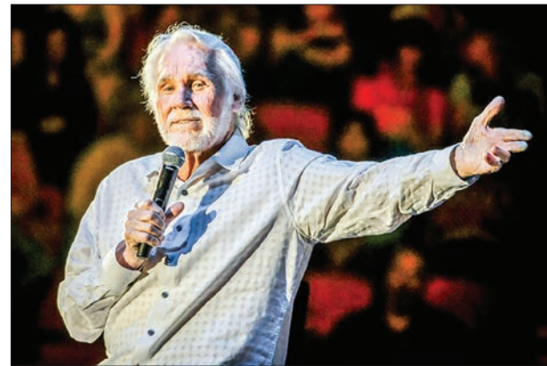
A three-time Grammy winner, Kenny Rogers was known for a string of hits including ‘The Gambler,’ ‘Lucille’ and ‘Islands in the Stream’.

“There’s story songs that have social significance, or they’re ballads that say what every man would like to say and every woman would like to hear.” — AFP ■