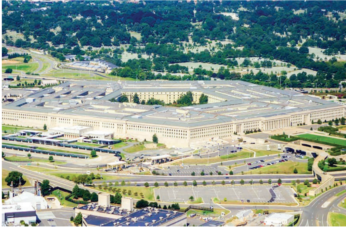
The Pentagon says it has successfully tested an unarmed prototype of a hypersonic missile.

They can travel much faster than current nuclear-capable ballistic and cruise missiles at low altitudes, can switch direction in flight and do not follow a predictable arc like conventional missiles, making them much