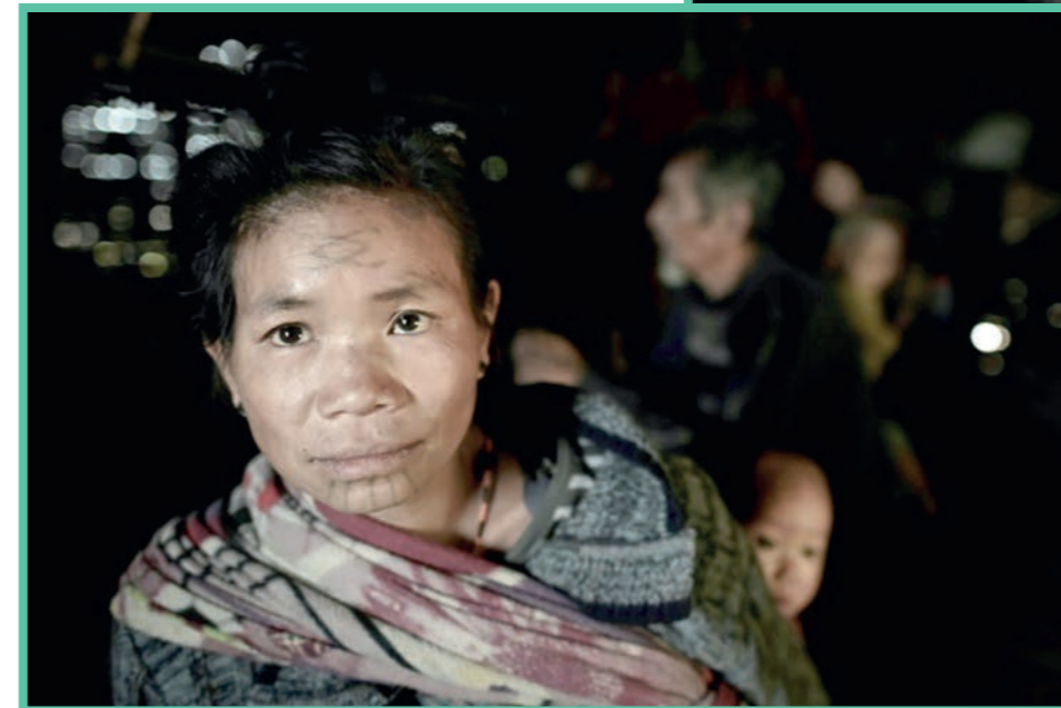
Few among the Naga in Myanmar's far north seem to lament the passing of a tattooing tradition that will soon be lost forever.

anmar, their villages so remote Christianity only made inroads here in the 1970s. The Konyak village of Longwa actually straddles the border, set on a high ridge commanding a view of both countries and is the seat of the tribe's king, whose house symbolically lies directly on the frontier. Only a handful of the village's former headhunting warriors remain, sporting formidable tattoos that cover much