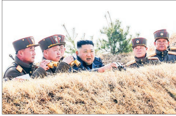
North Korea has not reported a single case of the new coronavirus, but there is widespread speculation that the pathogen has reached the isolated nation.

There has been widespread speculation, however, that the virus has reached the isolated nation, and health experts have warned that it could devastate the country given its weak medical infrastructure and widespread malnutrition.