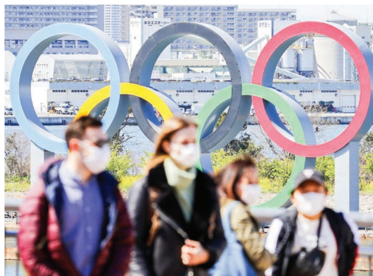
People wearing masks are seen near the Olympic rings in Tokyo's Daiba waterfront area on 20 March 2020. PHOTO: KYODO NEWS

"Our athletes are under tremendous pressure, stress and anxiety, and their mental health and wellness should be among the highest priorities," Hinchey wrote. — Kyodo News