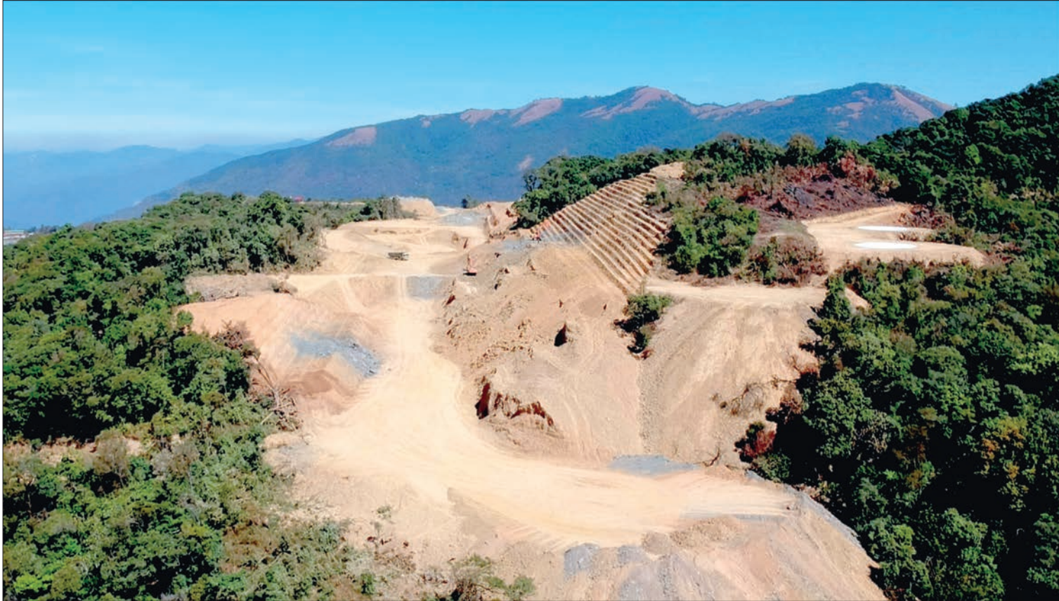
Loilenpi airport project is nearly 45 per cent completed and is expected to be operational in May this year.

NGO named Health and Hope (Myanmar), according to the local government. The runway of the airport will be 2600 ft in length and 100 ft in width, and it is expected to be operational in May this year. Once completed, the MAF will offer airport operation services with a maximum of three small aircrafts.