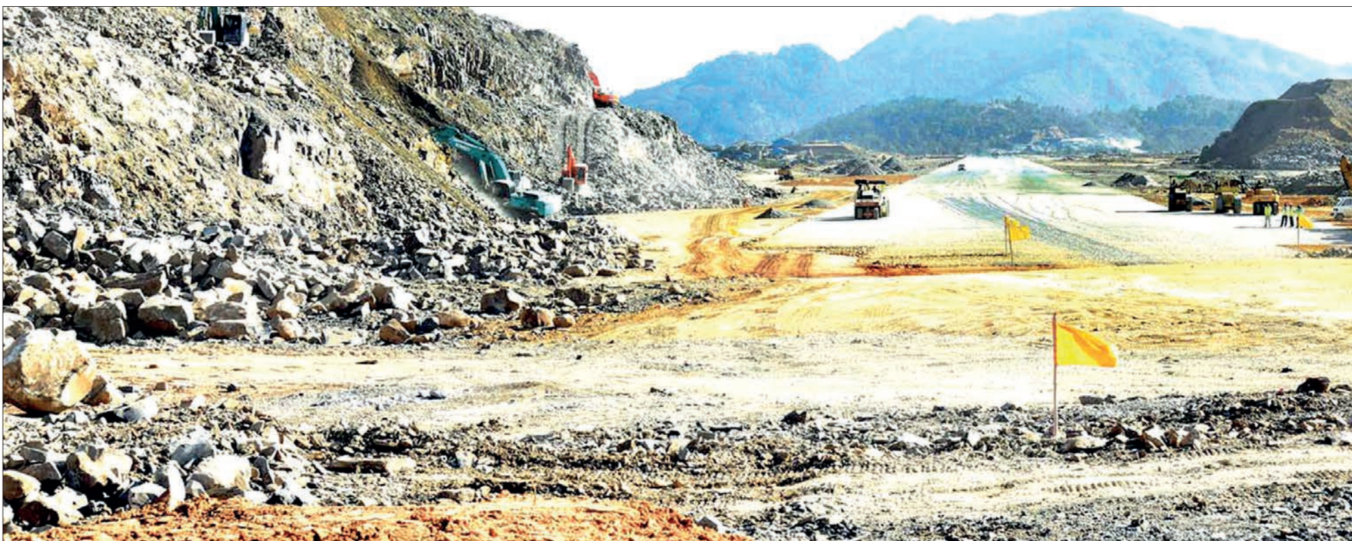
Construction of the Surbung Airport in Falam Township, Chin State.