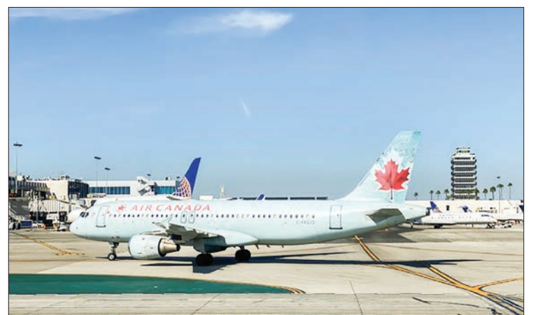
Air Canada attributes the layoffs to the “rapid evolution” of the coronavirus pandemic and the reduction in service it has caused.

Air Canada confirmed it has begun discussions with its unions on temporary layoffs, but did not say how many of its employees would be affected.