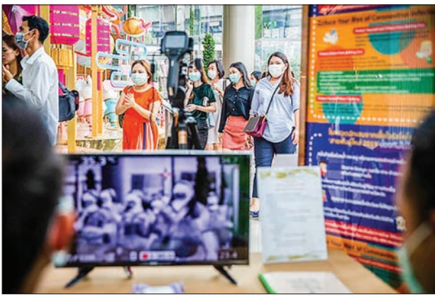
Thai officials conduct temperature screenings at Siam Paragon Mall on 4 February 2020 in Bangkok.