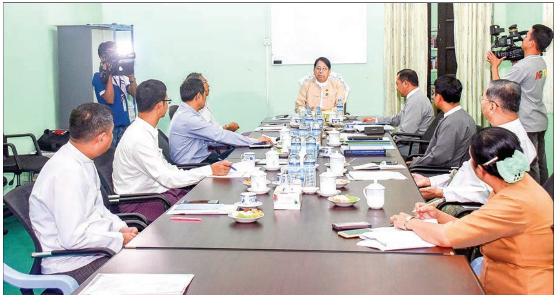
Union Minister Dr Pe Myint addresses the work coordination meeting of Centre for Myanmar Affairs Studies in Yangon yesterday.