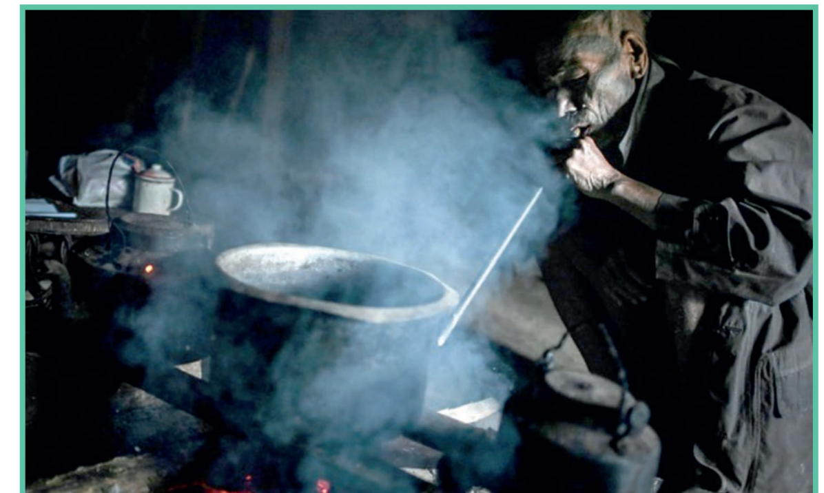
The Naga live in one of the poorest corners of Myanmar, where many must walk for days to reach the nearest town.