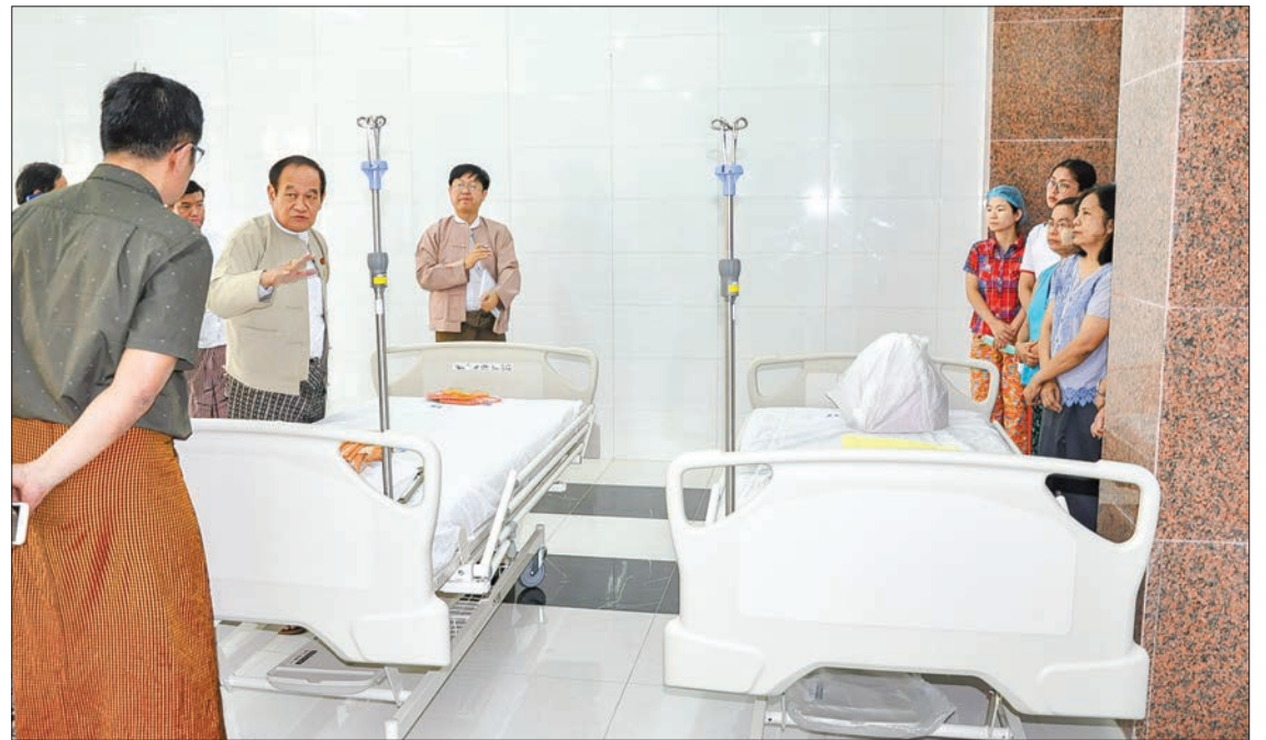
Union Minister Dr Myint Htwe inspects the South Okkalapa Women and Children's Hospital in Yangon yesterday.

Forty-three donors presented Ks 425.6 million to the Central Committee on Prevention, Con-