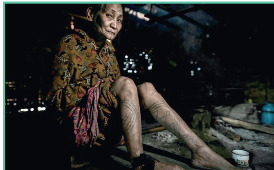
The Naga tribes in Myanmar's far north would use a thorn to drive tree sap under the warrior's skin to ink a permanent reminder of his headhunting prowess -- and his family would often follow suit.