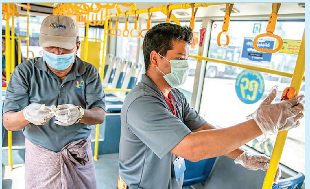
Workers disinfect a bus, amid concerns of the COVID-19 coronavirus, in Yangon on March 19, 2020.

The country also shares a 1,600-km border with India, which has over 270 confirmed cases.—Kyodo News