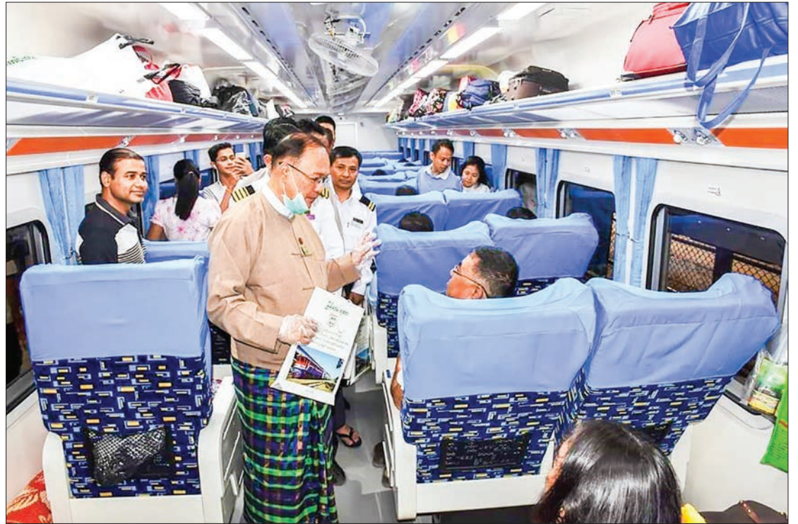
Union Minister U Thant Sin Maung greets with the passengers on the Mandalay-Myitkyina air suspension train yesterday.

According to the schedule, the 31 Up train leaves Mandalay at 1 pm and arrives in Myitkyina at 7 am the next day. The 32 Down train leaves Myitkyina at 1:30 pm, and arrives in Mandalay