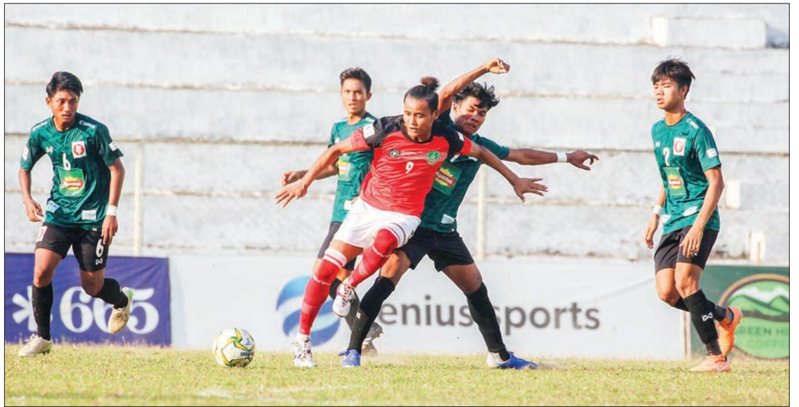
A player from Myawady FC (red) dribbles the ball past Junior Lion players during yesterday's MNL II match at Padonmar Stadium in Yangon.