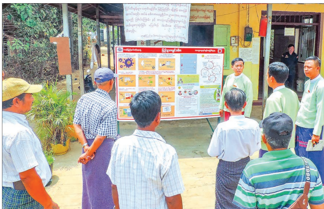
The COVID-19 awareness billboard being installed at the General Administration Office of Kayin State.