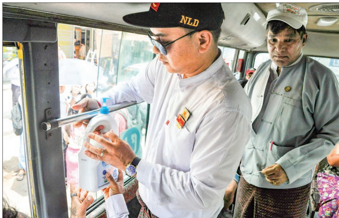
A Hluttaw representative fixes a hand sanitizer bottles for public inside a Yangon City Bus.