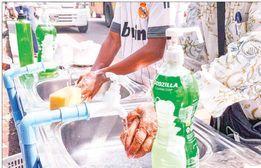
People washing their hands with sanitizer near the Sanpya Market Bus Stop to prevent from COVID-19 disease.