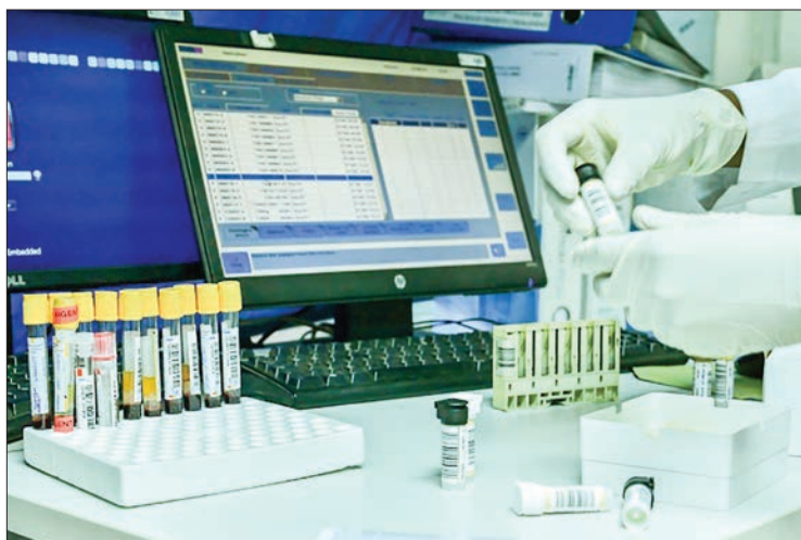
The World Anti-Doping Agency has issued guidelines aimed at maintaining anti-doping efforts safely through the coronavirus pandemic.

WADA’s latest guidelines advise anti-doping organizations to make sure that sample collectors are free from any symptoms of illness. Collectors should also ask athletes if they have any symptoms or if they or anyone at the collection site are in the groups thought to be at heightened risk