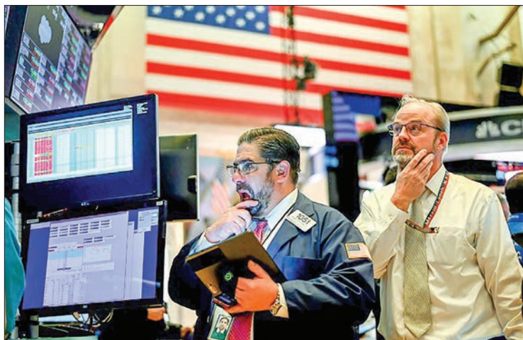
The market swings in recent weeks have been bewildering for traders and investors.

"The damage is not likely to pass in a month or two," FHN Financial said in a note. "Increasingly, it appears there will be a sharp drop in global activity, followed by a period of significant weakness lasting at least two quarters, followed by a partial recovery.—AFP ■