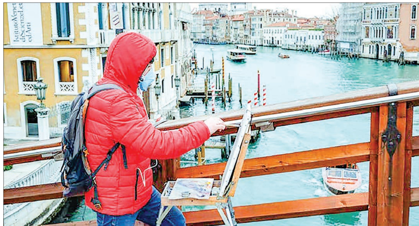
A man wearing a protective mask paint on Accademia bridge in Venice.

This is not the first time that the world is hit by such outbreaks of pandemic proportions. There were many in the past that were several times worse than the present one. By writing thus, I am not trying to let the people ignore the threats of this deadly virus. However, we should be rational in our views and not to be blindly led by exaggerated and dramatized media reports to become panic-stricken. Some foreign media aired video footages of people scrambling to buy food stuffs at shopping malls and groceries and the rows of empty shelves to lead the people to believe that foods are out of stock. However, in reality in such melee the staffs at those shopping