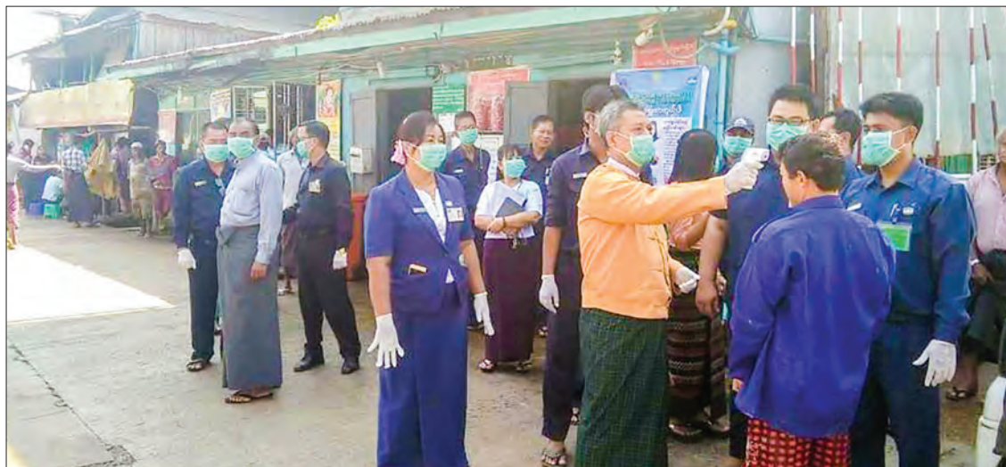
Officials measuring body temperatures of the local people in Yangon.

THE Yangon City Development Committee will not order to shut its markets in the city amid concerns over Covid-19 pandemic.