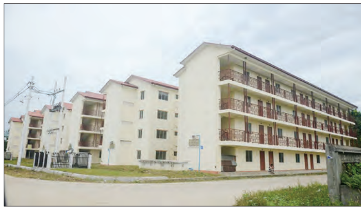
Low-cost apartment buildings in Dagon Seikkan Township.

For the 2019-2020 fiscal year, the standard land price per square foot in Yangon's townships has been reduced by 10 per cent compared to the