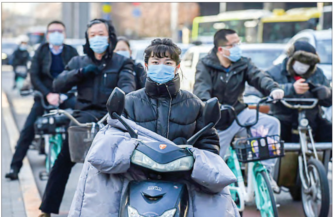
Life has slowly started to return to normal in parts of China, with people back at work, factories up and running, and schools in some regions resuming.

On 10 March, President Xi Jinping visited Wuhan for the first time since the outbreak began and declared that the spread of the disease was “basically curbed”.