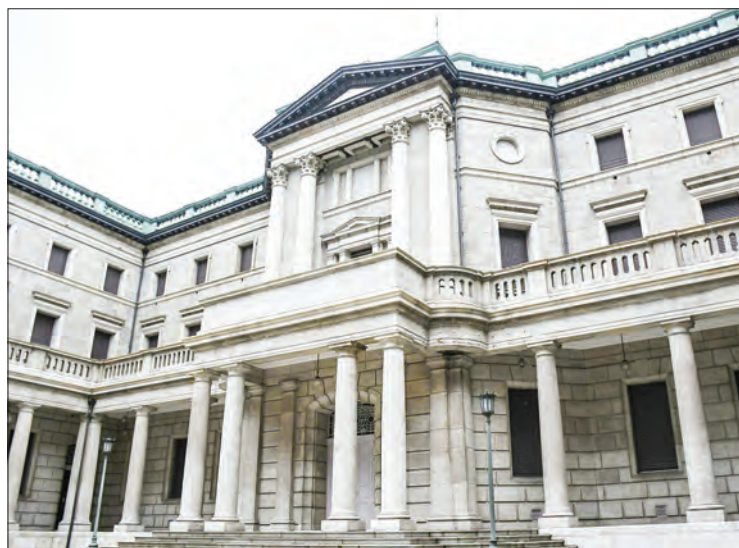
Photo taken 16 July, 2019, shows the Bank of Japan building after the completion of construction to beef up its earthquake resistance.