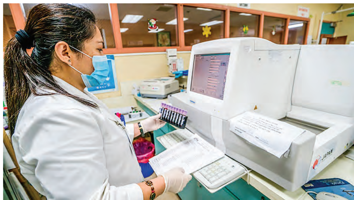
Most developing Asian economies are already responding to the COVID-19 outbreak in various ways. Many governments have mobilized inter-agency task forces and other coordinating mechanisms to ensure a harmonized response.

The initial package includes approximately $3.6 billion in sovereign operations for a range of responses to the health and economic consequences of the pandemic, and $1.6 billion in nonsovereign operations for micro, small, and medium-sized enterprises, and firms directly impacted. ADB will also mobilize about $1 billion in