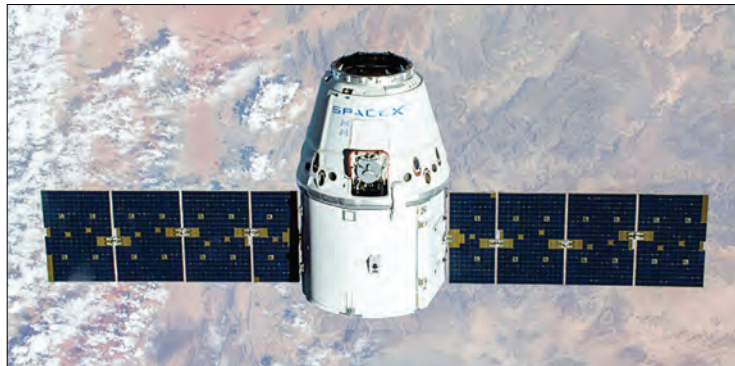
SpaceX Dragon has made several resupply trips to the International Space Station but May's launch will be the first crewed mission.

In March, Musk's Crew Dragon capsule made a round trip to the ISS, which is in orbit more than 250 miles (400 kilometers) above Earth, with a mannequin on board, before returning to the Atlantic after six days in space.