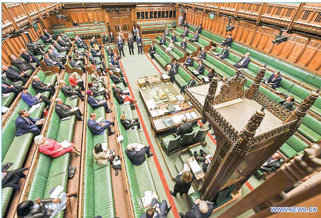
British Prime Minister Boris Johnson (Front) attends the Prime Minister's Questions at the House of Commons in London, Britain, on 18 March, 2020. British Prime Minister indicated Wednesday night that he is sticking to the timetable that will see Britain and European Union (EU) end the Brexit transition period at the end of this year.

His response came after trade talks between the two sides were put on hold because of the coronavirus outbreak. That fueled speculation that with Europe in the grip of a pandemic, Britain may have to seek extending its links to Brussels beyond 31 December.—Xinhua ■