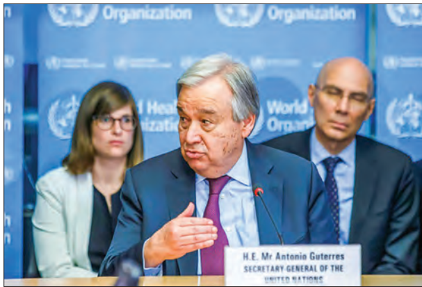
UN Secretary-General Antonio Guterres (pictured February 2020) said that “global solidarity is not only a moral imperative, it is in everyone’s interests”.

“We need to immediately move away from a situation where each country is undertaking its own health strategies to one that ensures, in full transparency, a coordinat-