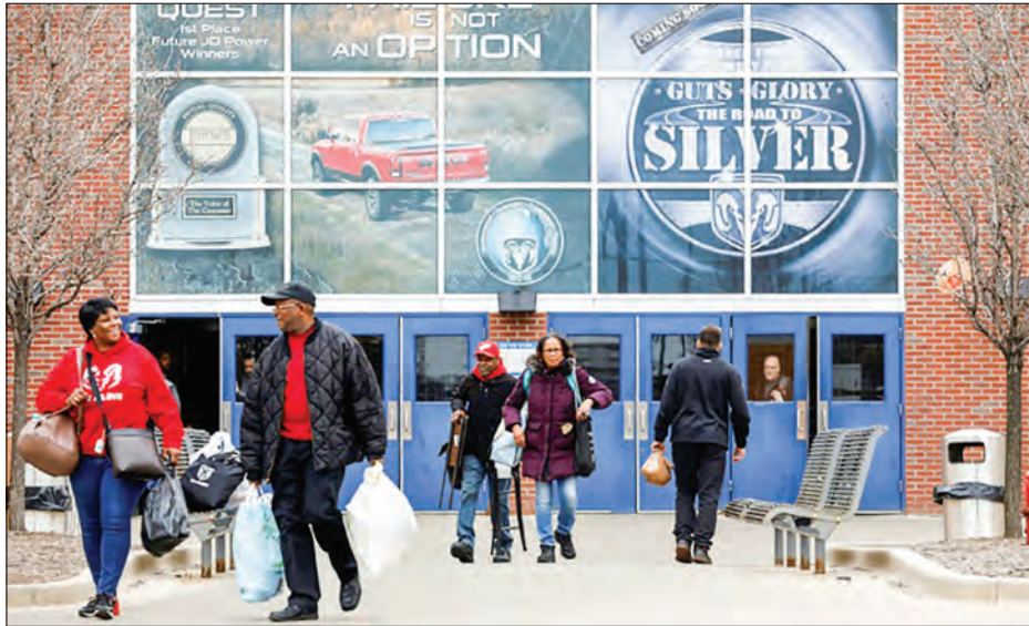
Workers leave FCA Chrysler Warren Truck Assembly after the three Detroit automakers agreed to UAW demands to shut down all North America plants as a precaution against coronavirus.

car makers — General Motors, Fiat Chrysler and Ford — will temporarily halt operations throughout North America through the end of the month, the companies said in conjunction with the auto workers union.