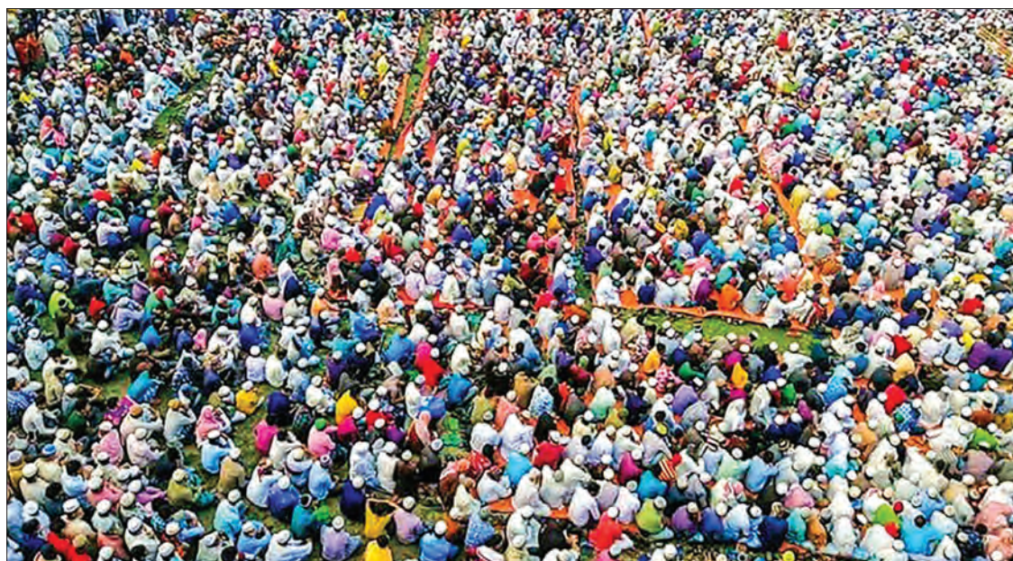
Police said some 10,000 Muslims gathered in an open field in Raipur town in southern Bangladesh to pray “healing verses” from the Koran to rid the country of the deadly novel coronavirus.

Photos of the gathering was widely shared on social media, with commenters slamming the massive rally. Authorities have already shut schools and asked locals to avoid large gatherings in an effort to halt the spread of the disease. —AFP ■