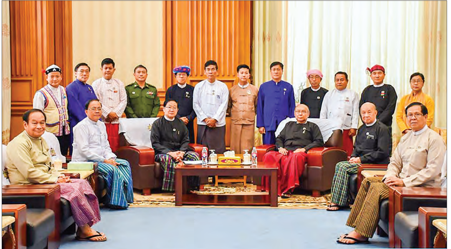
Pyithu Hluttaw Speaker U T Khun Myat, Amyotha Hluttaw Speaker Mahn Win Khaing Than and dignitaries have the documentary photo taken at the donation ceremony for COVID-19 in Nay Pyi Taw yesterday.

The Central Committee secretaries, Union Minister for International Cooperation U