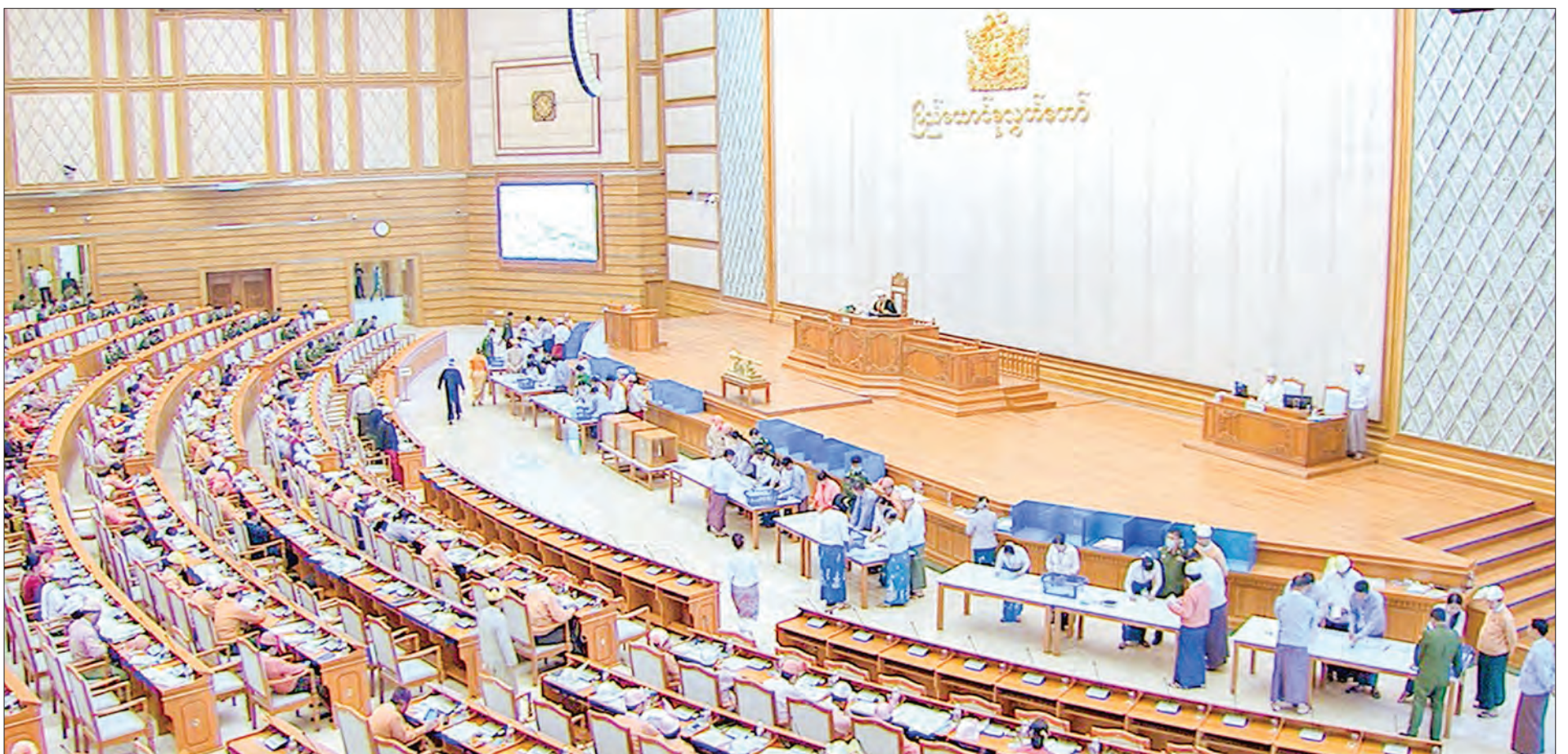
Pyidaungsu Hluttaw convenes its 26 th day meeting of 15 th regular session in Nay Pyi Taw yesterday.

T HE Pyidaungsu Hluttaw continued voting on proposals for constitutional amendment, took records on approval of bylaws of ethnic rights protection and court file copy, and discussed taking loan and grant of International Development Association of the World Bank yesterday.