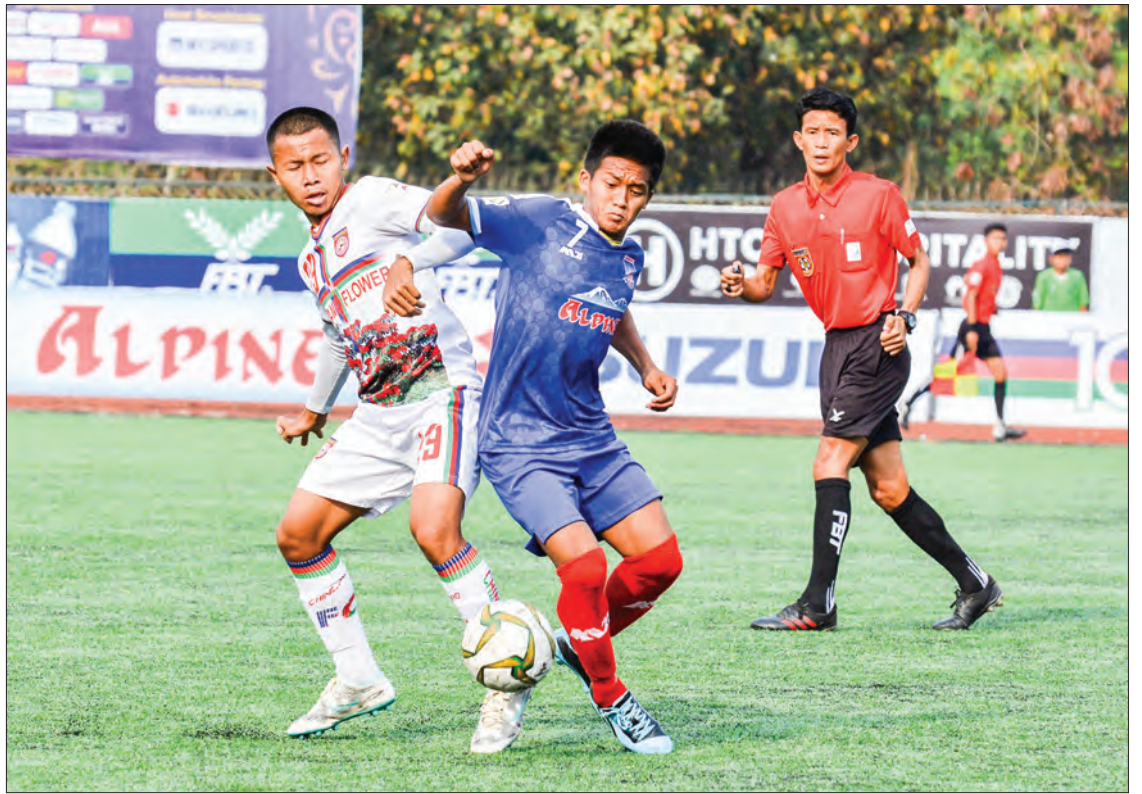
Players of Yadanarbon U-19 (blue) and Chinland (white) scabble for the ball during their MNL U-19 match at Yangon United Sports Complex yesterday.

Yadanarbon did not reduce their tempo and were eager for more goals to get their fourth or final goal at 54 minutes. Kaung