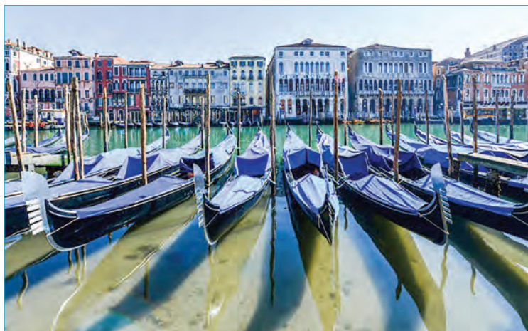
Gondolas sit empty in Venice's Grand Canal with Italy in lockdown to confront the dire impact of new coronavirus which, in one day, killed 475 more people in the country.

Trump announced the deployment of military hospital ships while, in Europe, German