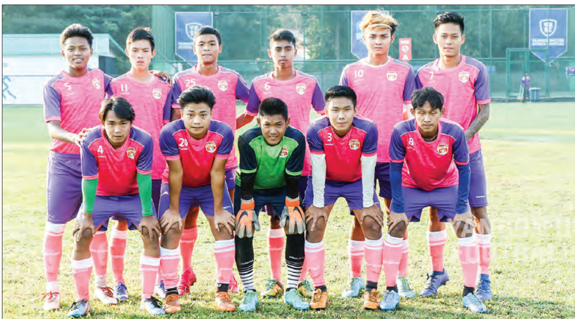
Ayeyawady United U-21 squad seen at the YUSC Stadium.

Owing to the matriculations exam being held across Myanmar this month, the fixture of University FC and Magwe U-21 FC was shifted to 8 April, according to the organizers of the