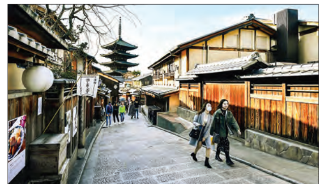
Few tourists are seen on a street in historic Kyoto in western Japan on 3 March, 2020, amid the spread of the new coronavirus.