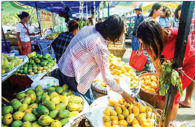
A shopkeeper selling mangoes in a bazaar in Mandalay.

“They have entered into contracts to buy the mangoes that will yield in May. They will purchase around 1,200 tons of Seintalone mangoes. It’s a piece of good news and good opportunities for the mango growers. They will establish a factory in