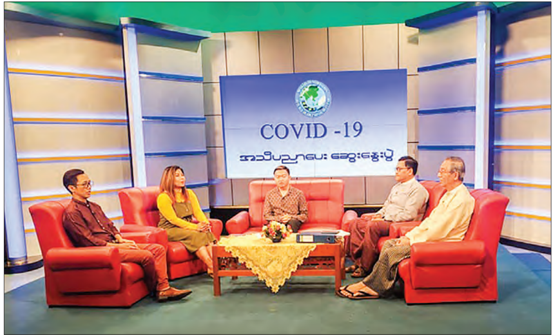
Celebrities hold talks on education at the MRTV's studio in Yangon yesterday.