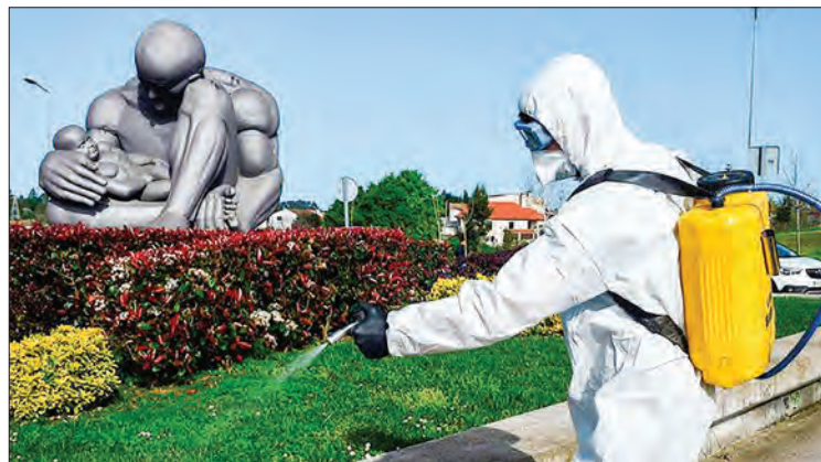
FILE: A member of the Military Emergencies Unit (UME) carries out a general disinfection outside the Alvaro Cunqueiro hospital in Vigo, on 18 March, 2020.

The Governing Council will terminate net asset purchases under PEPP once it judges that the coronavirus crisis phase is over, but in any case not before the end of the year, according to the ECB.— Xinhua ■