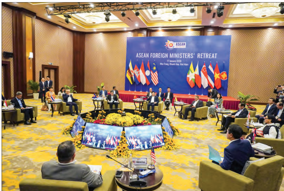
Foreign Ministers from members of the Association of Southeast Asian Nations meet in Vietnam’s Nha Trang on Jan. 17, 2020.

A special U.S.-ASEAN summit originally sched-