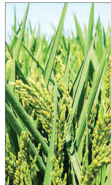
CRISPR-Cas9 is known for recognizing short DNA sequences and making cuts in the genome while CRISPR-Cas12a recognizes different DNA sequences.

Through tests on rice, the researchers screened the best DNA-cutting protein for genome editing, repression and activation.—Xinhua ■