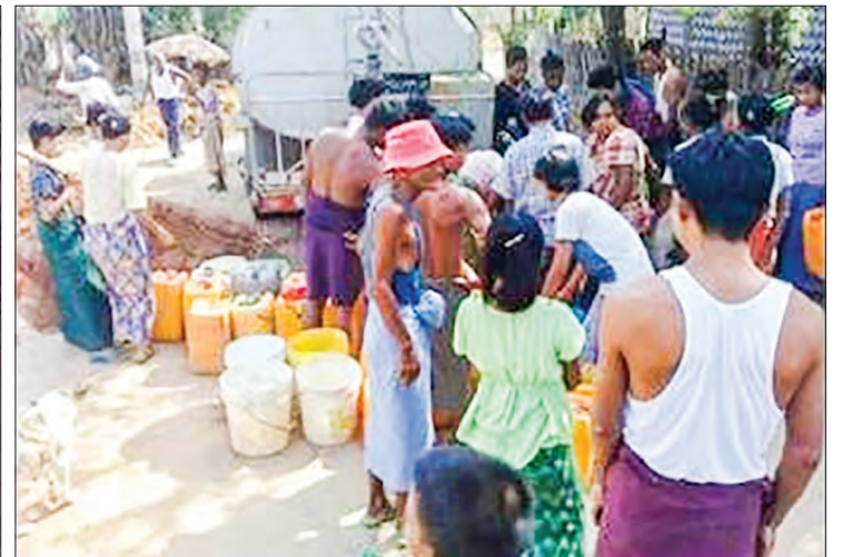
Local people collecting their drinking water from the water boxer truck in Mandalay Region.

TO prevent insufficient supply of drinking water in summer, Mandalay Rural Development Department MRDD is planning to provide drinking water, spending K 24 million for 51 villages in 13 townships in Mandalay Region.