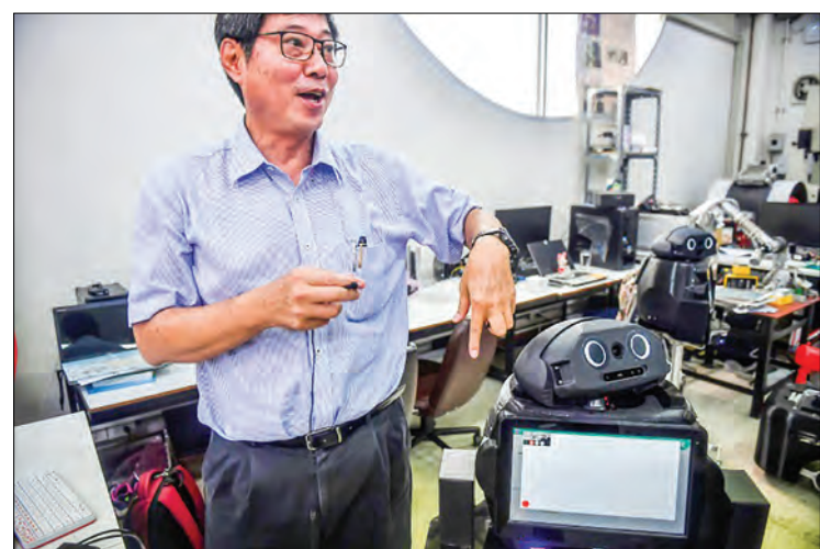
Viboon's engineering team is racing to build more "ninjas" for another 10 hospitals around the country. PHOTO:AFP

Officials have so far stopped short of imposing the full lockdowns seen in other countries in a bid to contain damage to Thailand's crucial tourism sector.— AFP ■