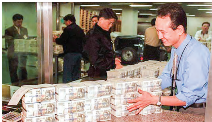
FILE: The cap for the Seoul branches of foreign banks will be lifted from the currency 200 per cent to 250 per cent.