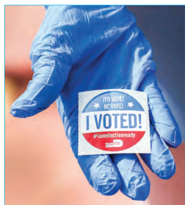
A voter wearing a glove holds an 'I Voted!' sticker after casting her ballot in the Florida primary.

WASHINGTON — Bernie Sanders was talking to advisers on Wednesday as pressure mounted on the leftist Vermont senator to end his White House campaign following a drubbing by Joe Biden in the latest Democratic primaries.