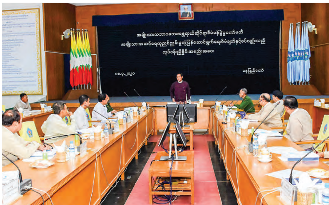
Vice President U Henry Van Thio addresses the meeting to discuss the National Contingency Plan for Marine Pollution in Nay Pyi Taw yesterday.

“water pollution” as a contamination caused by petroleum, its products, cooking oils and toxic chemicals leaked from vessels, offshore drillings and oil pipelines.