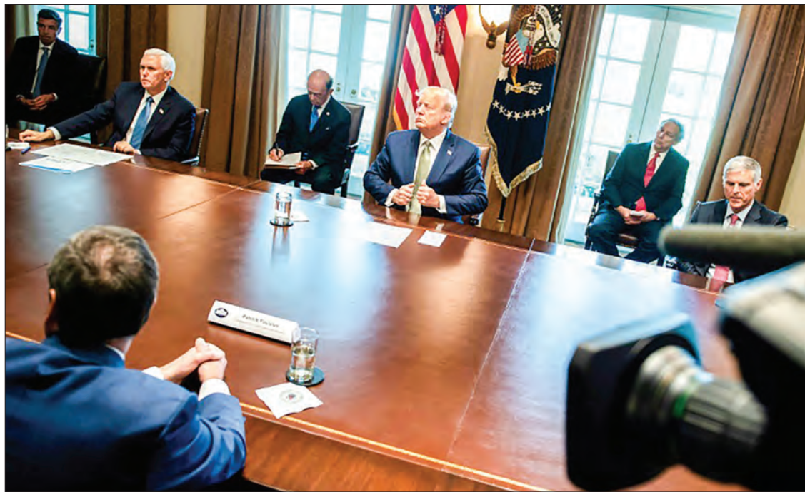
US President Donald Trump (c), meeting with hotel and tourism executives, has called for bipartisan support to rush out immediate cash payments to American families.

Speaking on Capitol Hill, Mnuchin said the package could surpass $1 trillion, in addition to $300 billion in deferred tax payments, making it among the largest federal emergency plans ever and far surpassing assistance during the 2008 global financial meltdown. The package would include up to $500 billion in direct payments and up to $500 billion for small businesses, according to media reports, as well as the full $50 billion the airline industry has requested. Mnuchin said that, for airlines, “this is worse than 9/11,” with travel virtually