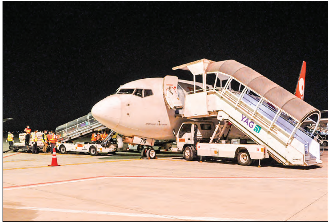
A cargo plane loaded with raw materials from China for garment factories in Myanmar landed Yangon International Airport on 17 March.

“We can consider the preparedness in investment in terms of tax relief, exemption, and business permits. Even the world’s economy is affected for the time being. If the government reconsider the taxation, it is a part of preparedness. If the business that does not need to rely on raw materials, yet on the agriculture and lo-