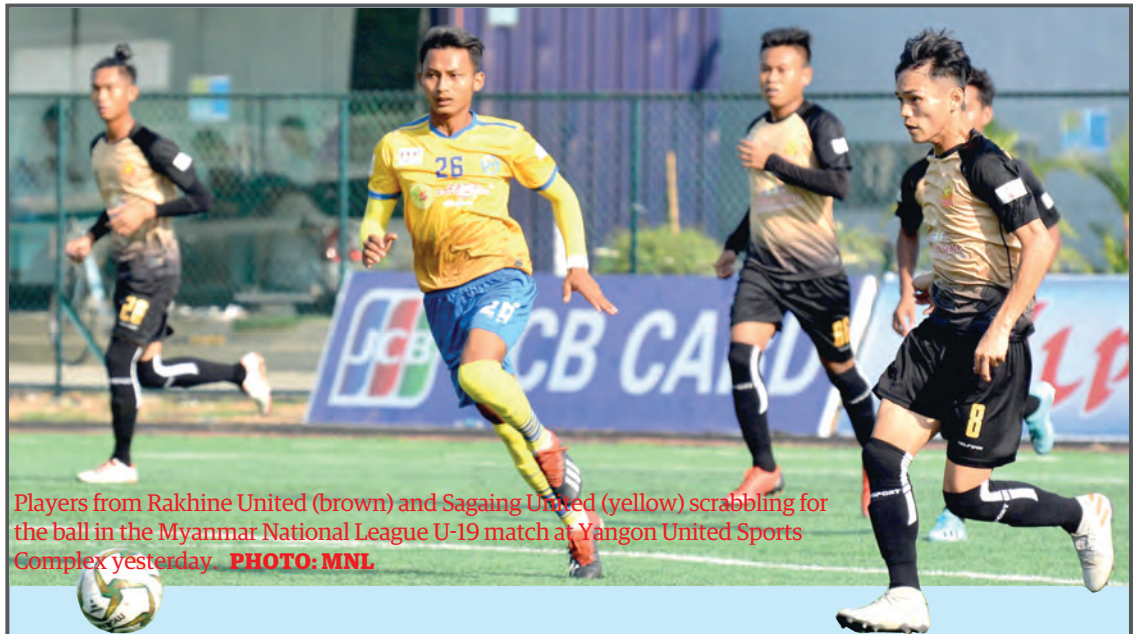
Players from Rakhine United (brown) and Sagaing United (yellow) scrabbling for the ball in the Myanmar National League U-19 match at Yangon United Sports Complex yesterday.

“We need to show that we can be different ... and treat each other with more respect in the future.”—AFP ■