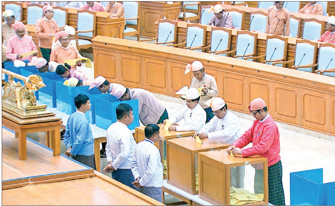
Hluttaw Representatives voting for constitutional amendment during the 25 th -day meeting of the Second Pyidaungsu Hluttaw's 15th regular session being held in Nay Pyi Taw yesterday.

per cent, the grace period is 10 years and the repayment period is 30 years. After the grace period, repayment needs to be every six months. U Thant Sin Maung said the upgrade would reduce the duration on the Yangon-Mandalay railway from 14 hours to less than 8 hours.