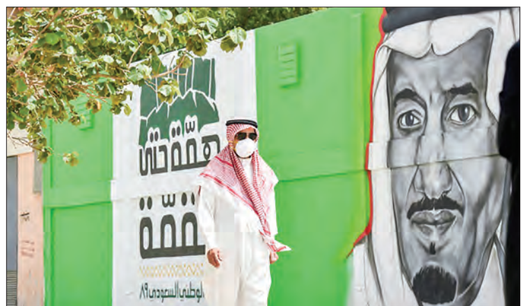
Saudi Arabia’s economy is bracing for the worst amid the coronavirus pandemic and tumbling oil prices.

the government deficit, Mnuchin told reporters “this is not the time to worry about it.”—AFP ■