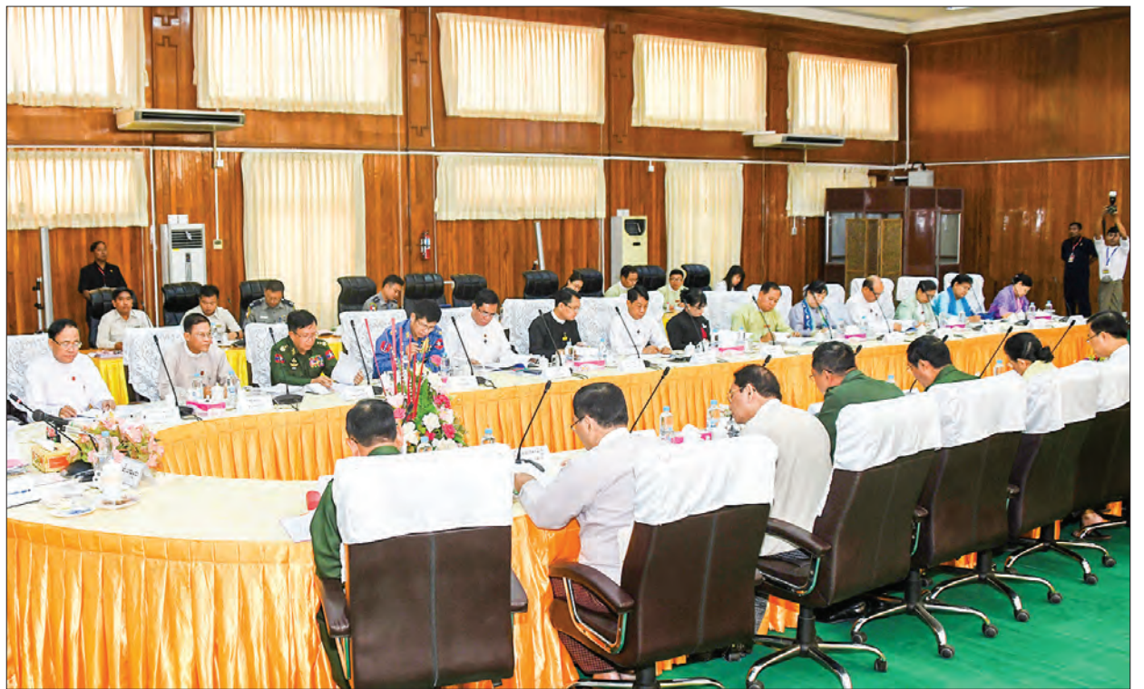
Vice President U Myint Swe addresses the third coordination meeting of national-level committee for implementing recommendations of Universal Periodic Review in Nay Pyi Taw yesterday.

T HE national-level committee for implementing recommendations of the Universal Periodic Review (UPR) held its third coordination meeting at the Ministry of Home Affairs in Nay Pyi Taw yesterday.