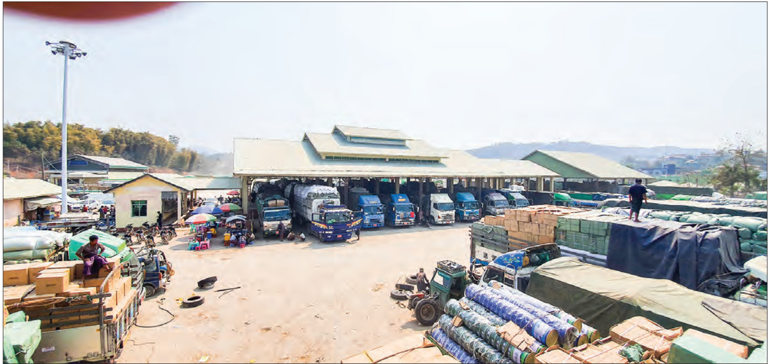
Trucks are parking at the 105 th mile border trade zone.

The current value of imported raw materials has also reached to US$2.93 million from $1.14 million in the past.—MNA