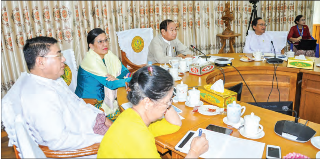
Union Minister Dr Myint Htwe addresses the meeting to discuss the prevention and control measures against the COVID-19.

THE Ministry of Health and Sports will use US$ 10.7 million international funds for prevention and control measures against the COVID-19.