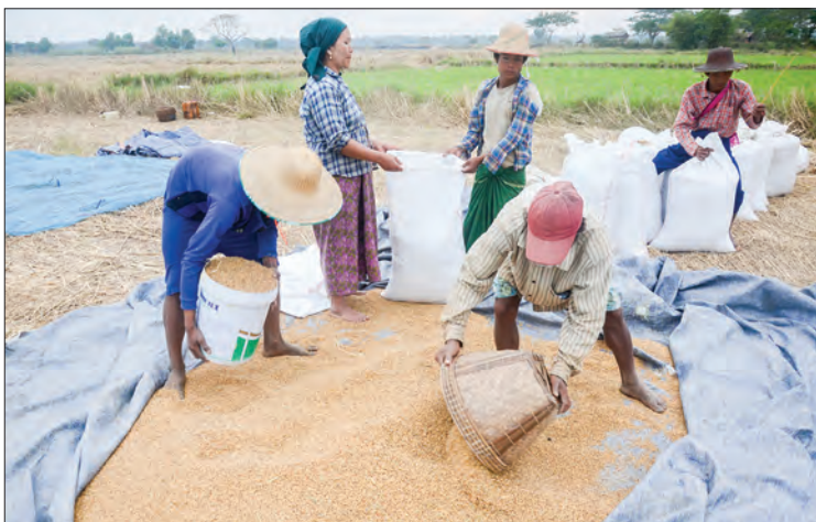
Farmers bagging paddy in a field in Ayeyawady Region.

THE Myanmar Rice Federation (MRF) is giving priority to controlling rice price manipulation and stabilizing local rice market, according to the federation's President U Ye Min Aung.