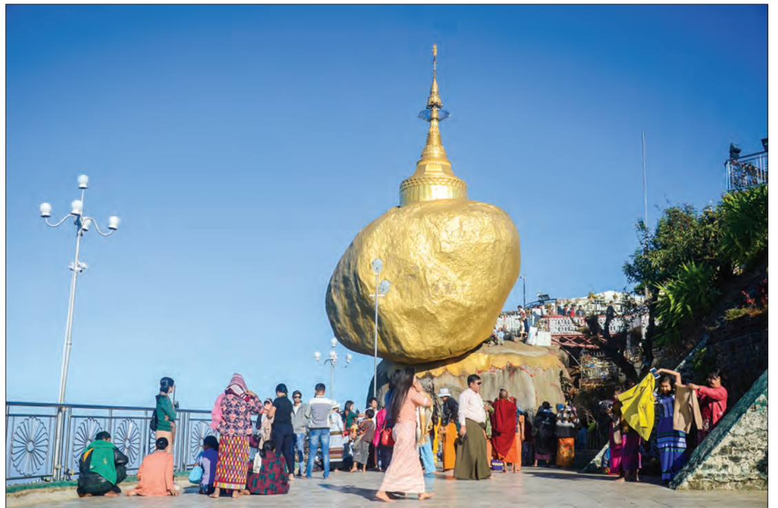
Pilgrims seen at Kyaikhtiyo Pagoda, the most famous pagoda in Mon State.

the top of Mount Kyaikhtiyo, said the shops on the mountain were preparing to close since the number of visitors dramatically decreased yesterday. She also estimated that the number of visitors yesterday was less than 300.