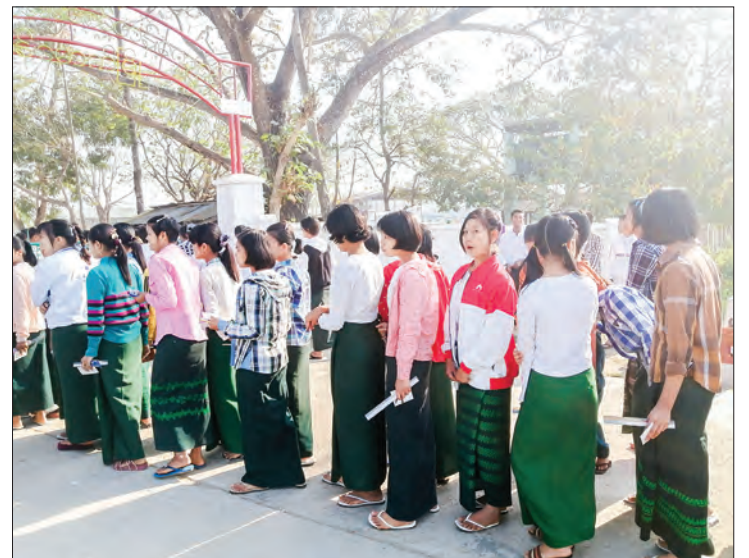
Matric students wait in queue to enter their exam centre in Bamauk, Sagaing Region.