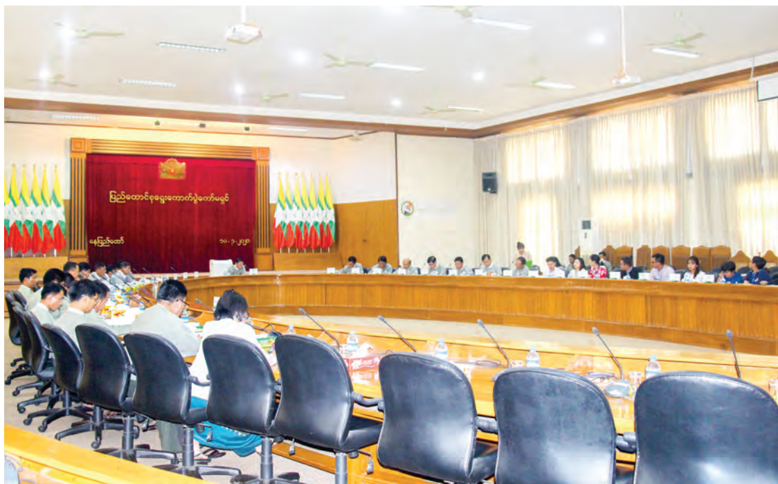
Union Election Commission Chairman U Hla Thein receives the delegates from Electoral Reform Coordination Body-ERCB's member eight civil society organizations in Nay Pyi Taw yesterday.

CHAIRMAN of the Union Election Commission (UEC) U Hla Thein received delegates from Electoral Reform Coordination Body-ERCB's member eight civil society organizations at his office in Nay Pyi Taw yesterday.