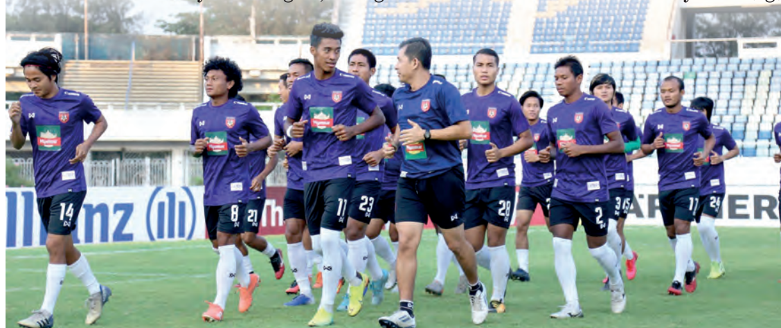
Myanmar National Football Team seen on their training session at the Thuwunna Stadium.

Though Myanmar National squad was scheduled to participate in the FIFA World Cup and AFC Asian Cup qualification, the matches have been postponed amid Covid-19 crisis, according to the instructions and announcements released by FIFA and Asian Football Confederation. —Lynn Thit (Tgi)