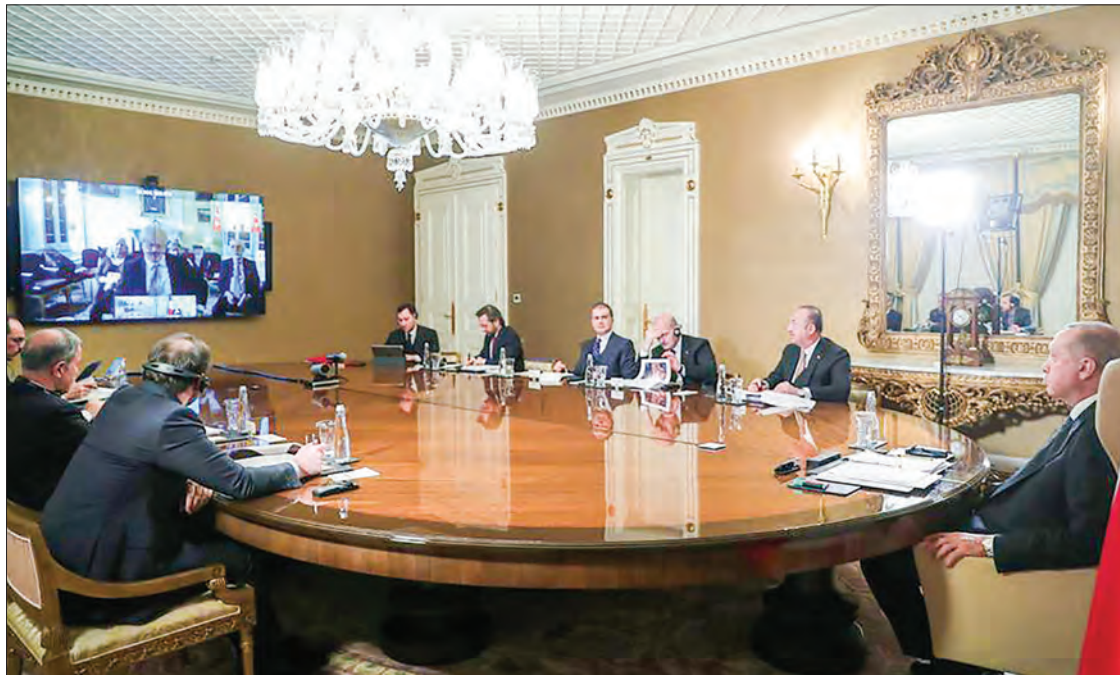
Turkish President Recep Tayyip Erdogan (1 st R) attends a televised meeting with leaders of Germany, France and Britain, in Ankara, Turkey, 17 March, 2020. The leaders of Turkey, Germany, France, and Britain discussed issues, including the latest situation in Syria's northern province of Idlib and the COVID-19 outbreak, at a televised meeting on Tuesday.

Thousands of illegal immigrants flocked to Turkey's