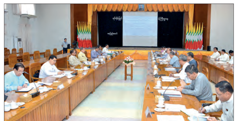
The second meeting of the Working Committee to address the impact of COVID-19 on the country's economy being held in Nay Pyi Taw yesterday.

U Ohn Maung, Union Minister for Hotels and Tourism and Deputy Ministers U Set Aung, U Bharat Singh, U Tin Latt and U Zaw Min Win, Chairman of the Union of Myanmar Federation of Chambers of Commerce and Industry (UMFCCI) also attended the meeting as guests. The Working Committee discussed measures required to address the negative impacts of COVID-19 on the country's economy, including the setting up of COVID-19 FUND from which loans could be dispersed to affected CMP enterprises and SMEs at a minimal interest rate.—MNA