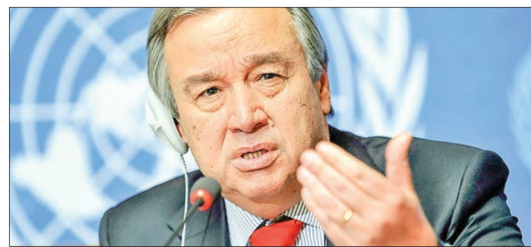
United Nations Secretary-General António Guterres.

THE upheaval caused by the coronavirus – COVID-19 – is all around us. And I know many are anxious, worried and confused. That's absolutely natural.