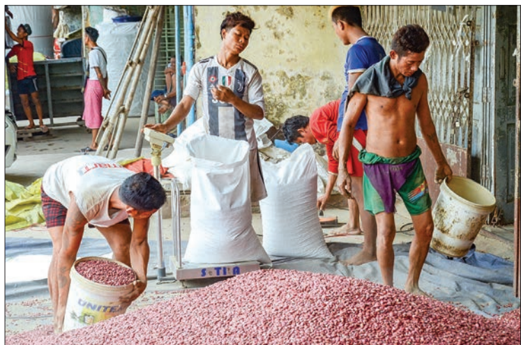
Workers weighing the beans in bags on a weighing scale.