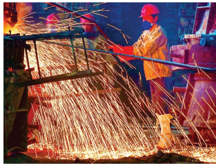
The virus outbreak saw Chinese industrial production contract in January-February for the first time in 30 years, putting huge pressure on the world's number two economy.