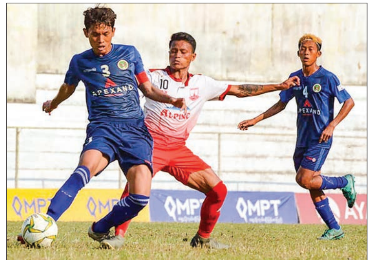
Players of Yadanarbon FC and Chin United FC vie for the ball in the Week-10 match of MPT Myanmar National League Youth (U-21) 2020 at the Padonmar Stadium in Yangon yesterday.

All of the matches will be played at 4:00 pm on respective dates. — Kyaw Khin ■