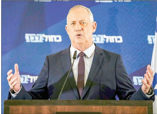
Israel's ex-military chief Benny Gantz won recommendations on Sunday from a thin majority of lawmakers to form a coalition government after almost a year of political paralysis in Israel.

"It is possible that forming a government quickly will require interim arrangements for the coming months", Rivlin said Monday.