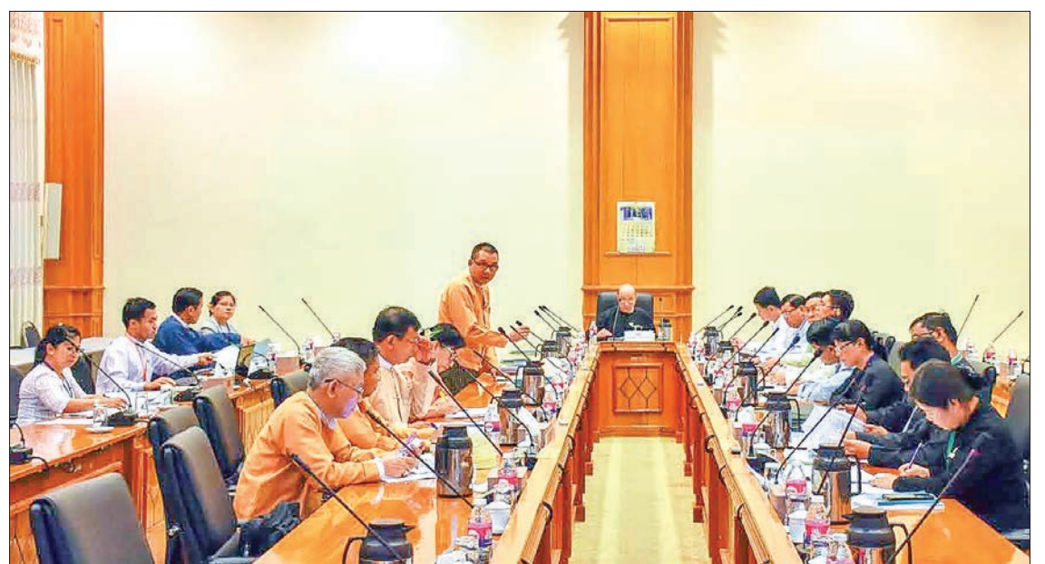
Pyidaungsu Hluttaw Joint Bill Committee holds the meeting in Nay Pyi Taw yesterday.