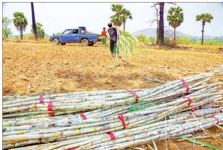
Farmers loading car with sugarcane.

Myanmar produced about 450,000 tons of sugar on 440,000 acres of sugarcane plantations in the 2014-2015 fiscal year, over 390,000 tons on 390,000 acres in