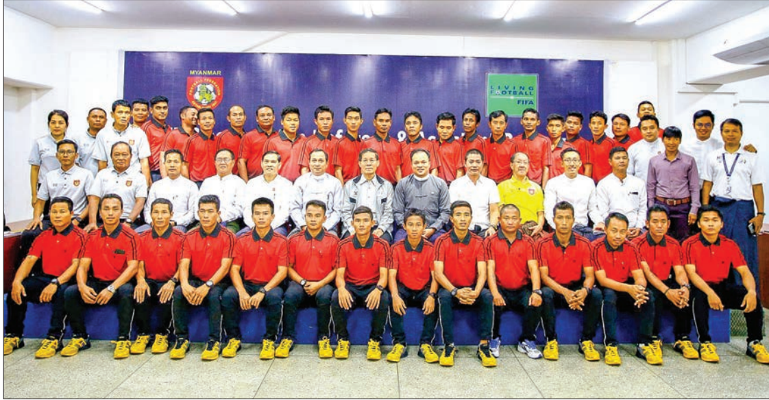
MFF officials, referee supervisors, referees and assistant referees pose for a group photo at the closing ceremony of the MFF Class-2 Men Referees and Assistant Referees Workshop for 2020 Football Season at Thuwunna Football Stadium in Yangon yesterday.

THE closing ceremony of the MFF Class-2 Men Referees and Assistant Referees Workshop for 2020 Football Season was held at the press conference hall of the Thuwunna Football Stadium in Yangon yesterday.