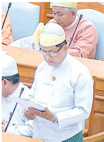
Deputy Minister for Planning, Finance and Industry U Maung Maung Win.