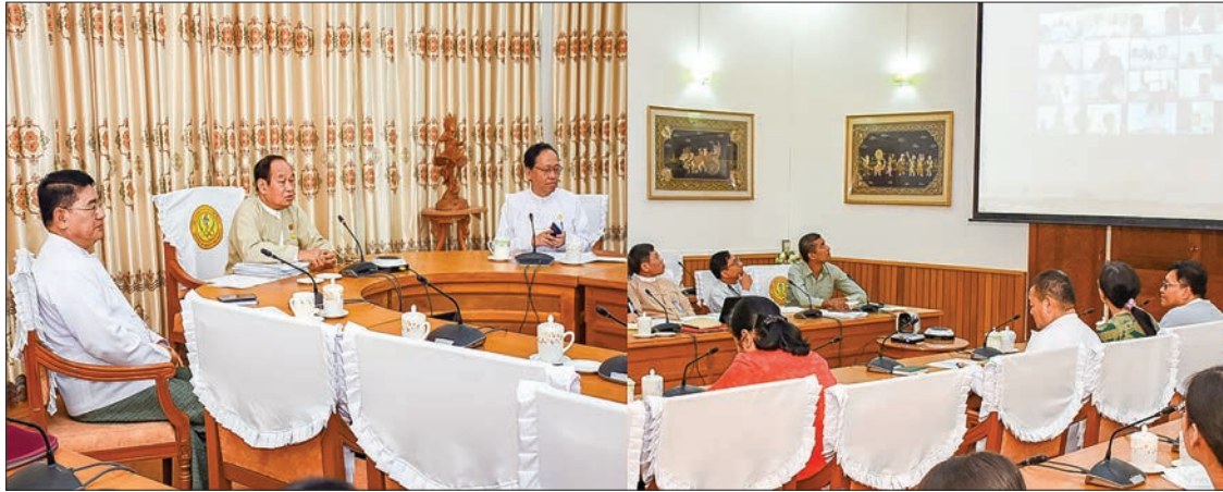
Union Minister for Health and Sports Dr Myint Htwe presides over COVID-19 daily meeting (35/2020).

THE daily executive-level coordination meeting on COVID-19 held meeting (35/2020) through video conferencing yesterday.