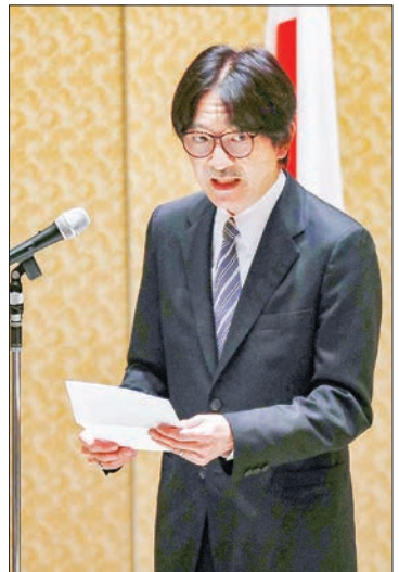
Japanese Crown Prince Fumihito speaks at an awards ceremony for the 16th Japan Society for the Promotion of Science Prize and Japan Academy Medal in Tokyo on 18 February 2020.

It had already been decided to reduce the number of court banquets to two in a single day from three over two days, as at the previous ascension event, even before concerns over the coronavirus outbreak spiked. The reduction was intended to cut costs and reduce burdens on participating imperial family members. The 54-year-old prince became first in line after his elder brother Emperor Naruhito ascended the Chrysanthemum Throne on 1 May, 2019, a day after the abdication of former Emperor Akihito, the first Japanese monarch to