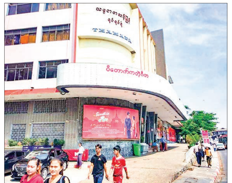
Thamada Cinema in Yangon.

At present, Myanmar's neighbouring China and Thailand are rushing to contain the spread of the virus, with the confirmed cases. Similarly, the COVID-19 cases in South Korea, Italy and Iran have surged and the death toll is increasing. So far, Myanmar has not found any COVID-19 case yet. As precaution measures, people are asked