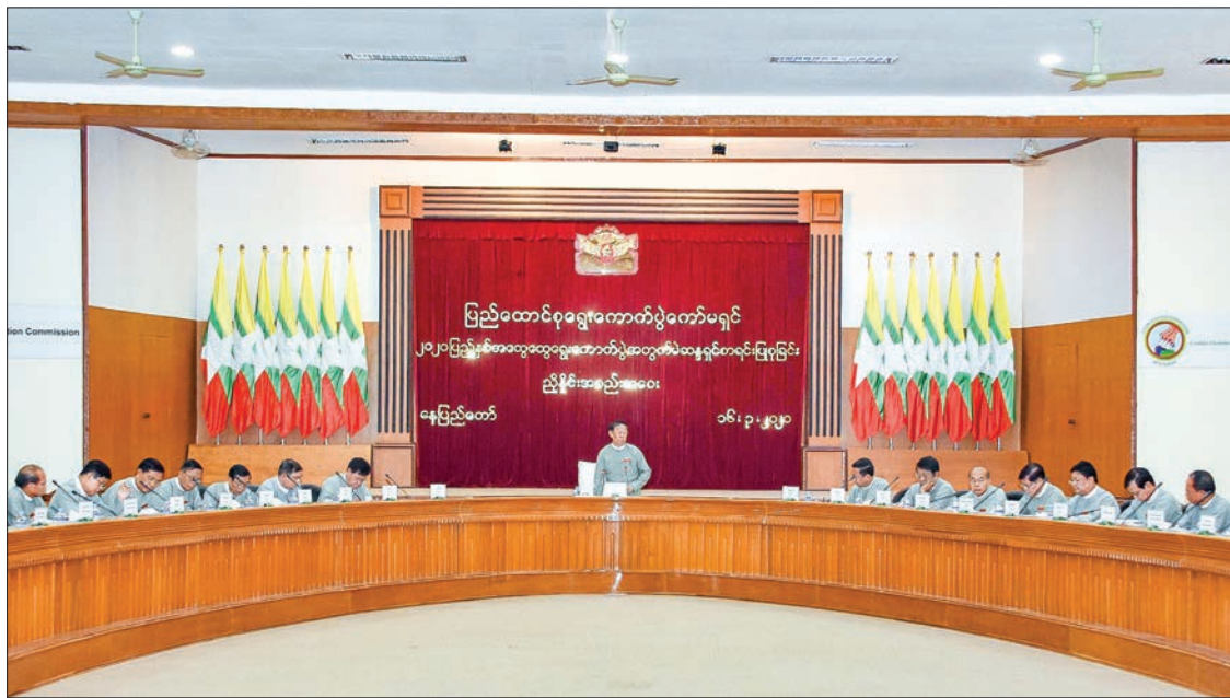
Union Election Commission Chairperson U Hla Thein addresses the meeting on voter-lists compilation in Nay Pyi Taw yesterday.

UNION ELECTION Commission met with its sub-commissions from regions, states, and Union council area yesterday to discuss preparations for successful holding of the 2020 General Election as it has completed the voter-lists compilation process in 2019.