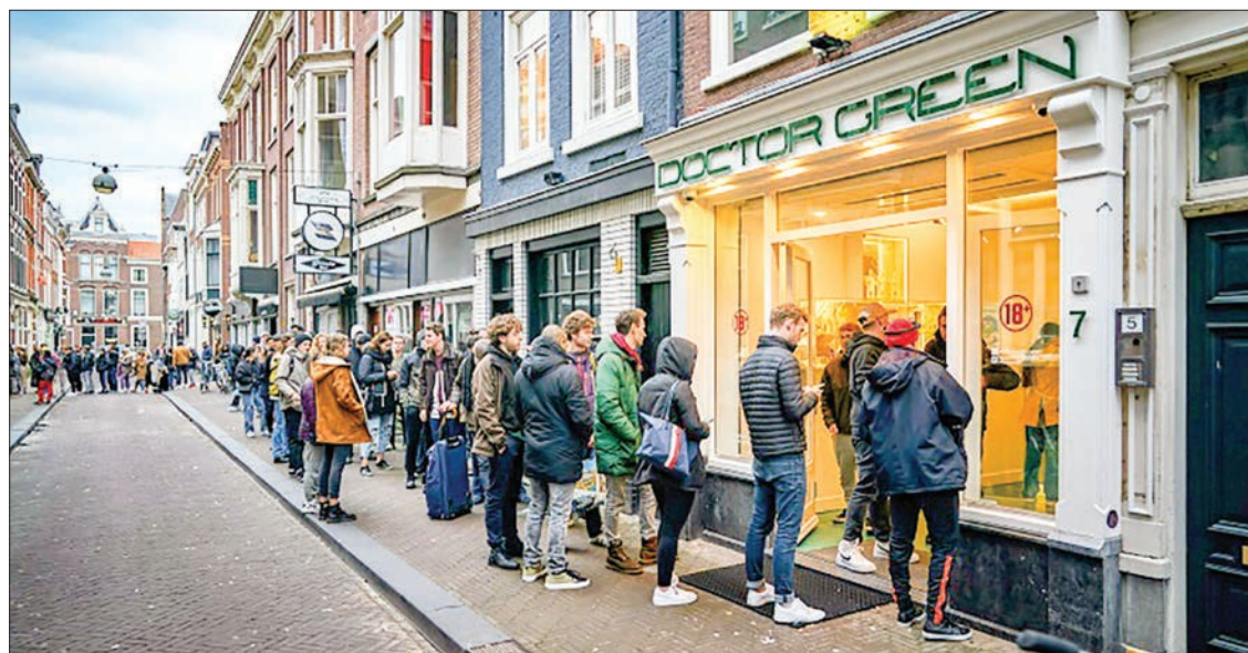
People queue outside cannabis cafe in The Hague on Sunday.

and education ministers gave a televised press conference announcing the closure of many businesses, along with all Dutch schools. Similar scenes were reported around the country, with pictures on social media of long queues outside coffee shops in the capital Amsterdam and the historic university city of Utrecht. Whereas days earlier it was supermarkets besieged with people trying to hoard toilet paper and pasta, the sudden announcement of the coffee shop closure meant there were new priorities.— AFP ■