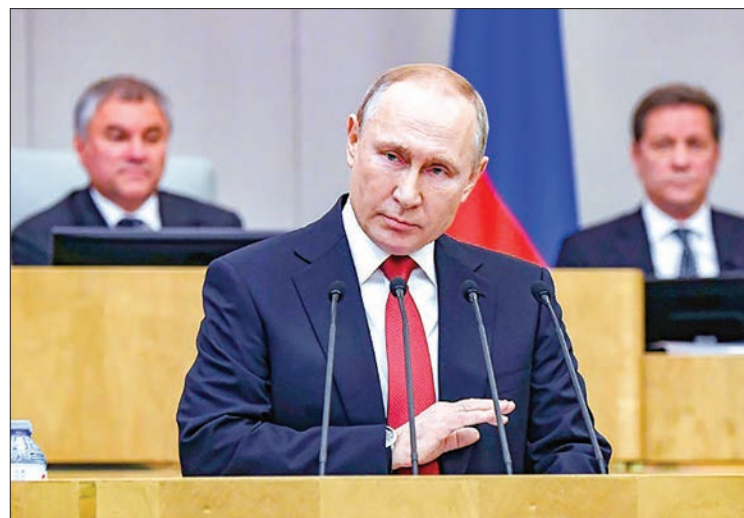
Until recently, Putin had repeatedly denied he had any intention of remaining in power.

Opposition supporters have demonstrated in recent days in a series of one-person picket protests, the only kind allowed in Russia without previous per-