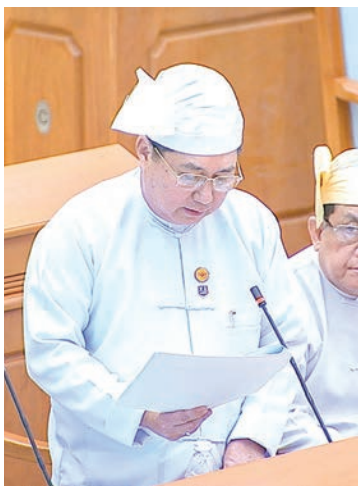
Deputy Minister for Electricity and Energy U Khin Maung Win.