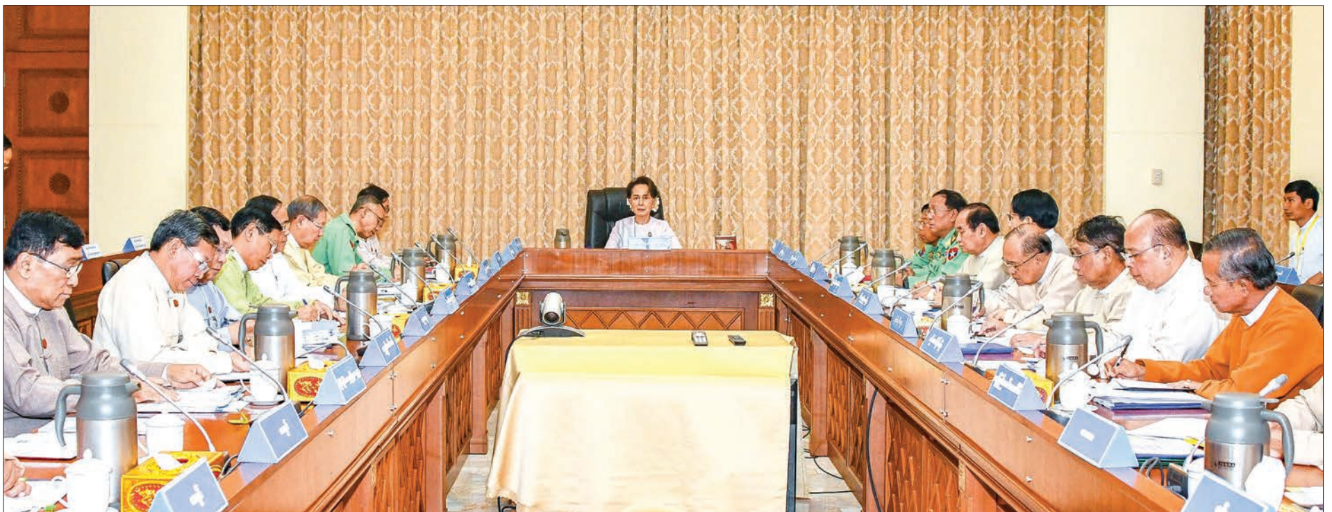
State Counsellor Daw Aung San Suu Kyi addresses the Central Committee for COVID-19 Prevention, Control and Treatment in Nay Pyi Taw yesterday.