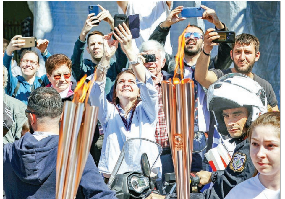
People watch the first leg of the Tokyo Olympic torch relay in Olympia, Greece, on 12 March 2020.

The relay's departure ceremony is also expected to be held behind closed doors at the J-Village soccer training