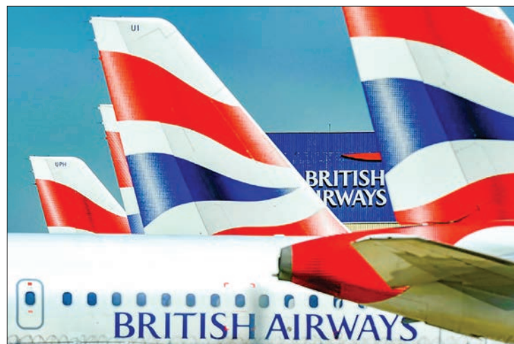
Airlines are axing flights and shares are plummeting.