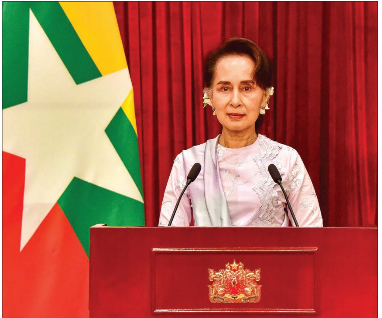
State Counsellor Daw Aung San Suu Kyi delivers the televised message to public yesterday.

"With respect to health, people are the key to follow the health ministry's guidelines and to avoid public gatherings. People are the key to prevent rumours and misinformation in the wake of the COVID-19. People are the key to avoid panic-buying and stockpiling the goods. There have been no confirmed