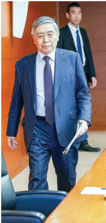
Bank of Japan Governor Haruhiko Kuroda holds a press conference in Tokyo on 16 March 2020, after a one-day policy meeting. The central bank decided to expand its asset-buying program to stabilize financial markets.

With the ETF buying, introduced in 2010 as part of a wider asset purchase program, the BOJ has stepped into the market when stock prices fall sharply. Under Kuroda, it raised the annual pur-