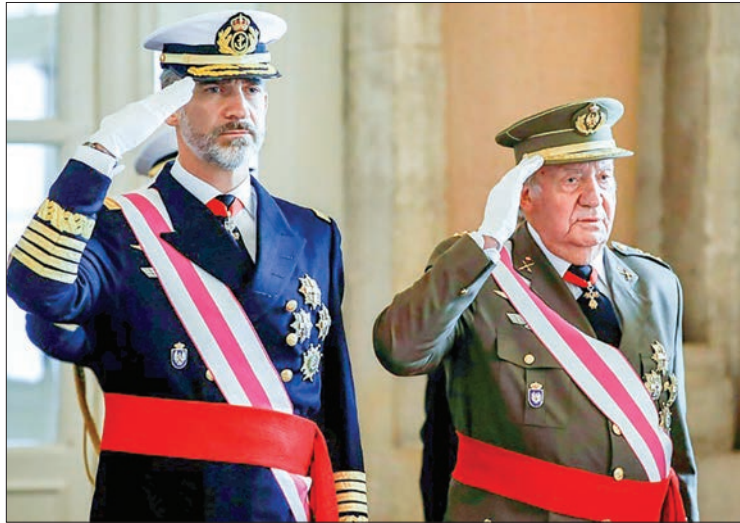
Juan Carlos handed over power to his son, Felipe in 2014.

A later report in Britain's Daily Telegraph said that 52-year-old King Felipe was also a beneficiary of the fund, which it said had been set up when Juan Carlos was still on the throne.