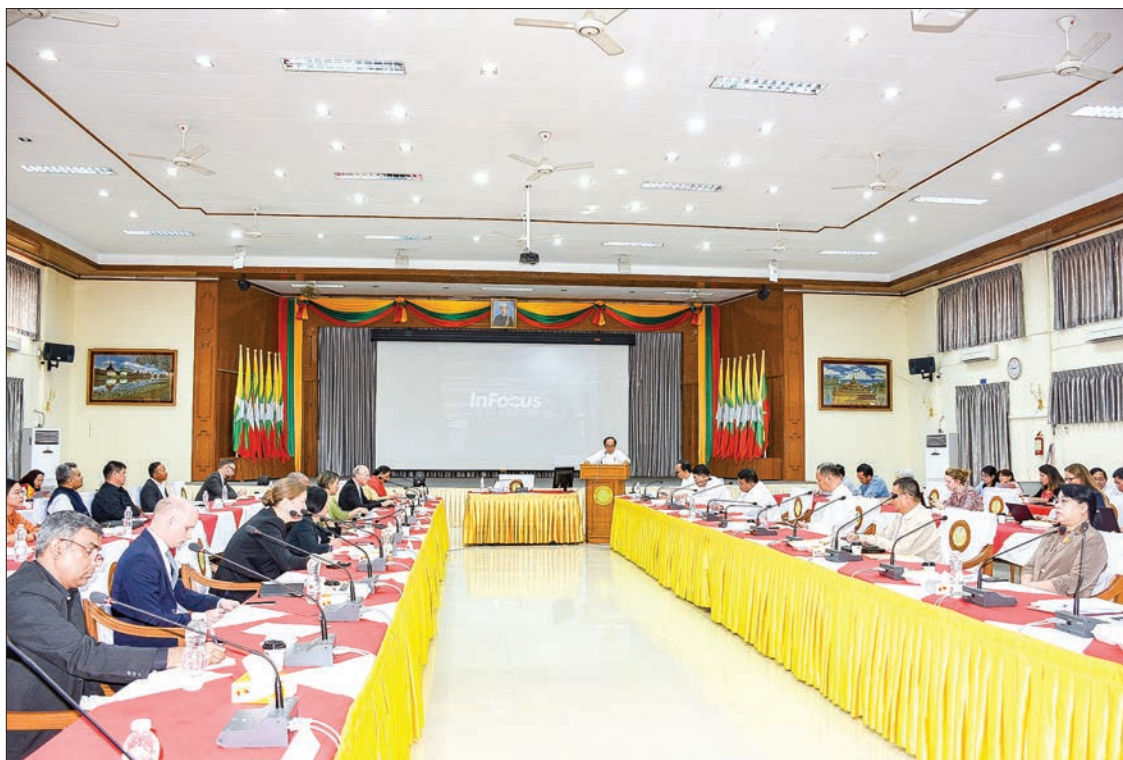
Union Minister Dr Myint Htwe delivers the speech at the meeting on building partnership and increasing participation from affiliated organizations against COVID-19 yesterday.

The Union Minister said although there are no confirmed cases in Myanmar yet, the arrival of an infected person can quickly spread the virus across the coun-