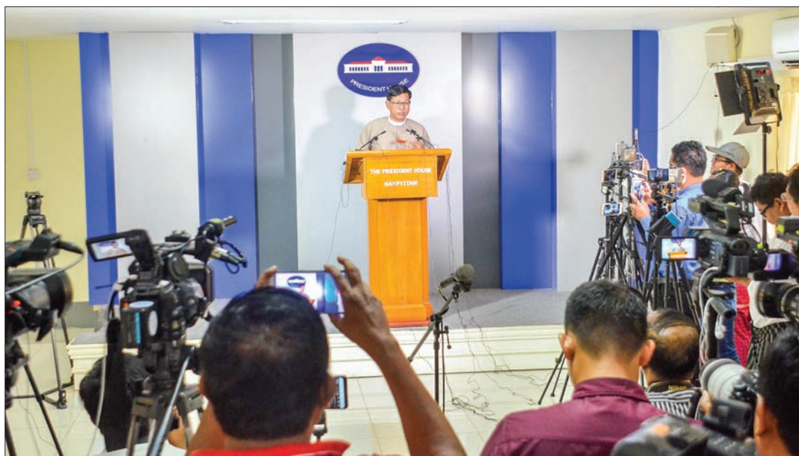
Director-General U Zaw Htay explains the preparations for COVID-19 at the press conference in the Presidential Palace in Nay Pyi Taw yesterday.

Going back to COVID-19, the Director-General said the decision on whether to close movie theaters in the current situation is up to the state/regional governments to choose. The President's Office has issued directives, and the state/regional governments and ministries will make decisions accordingly.—MNA (Translated by Zaw Htet Oo)