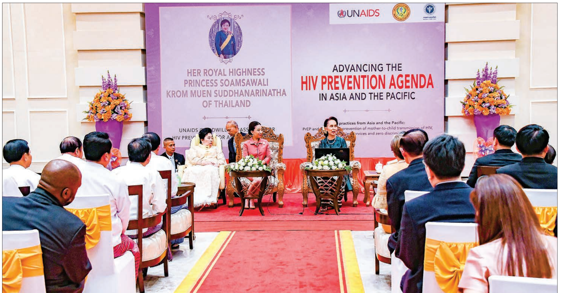
State Counsellor Daw Aung San Suu Kyi attends Advancing HIV Prevention Agenda event in Nay Pyi Taw yesterday.

S TATE Counsellor Daw Aung San Suu Kyi delivered a speech at the event of Advancing HIV Prevention between