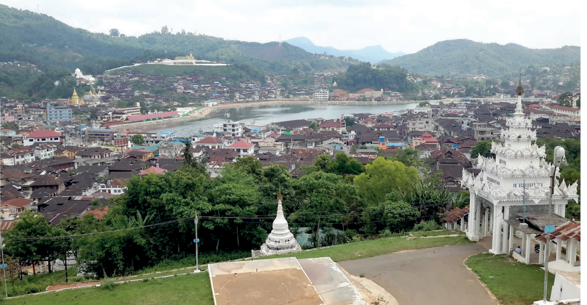
Panoramic scenery of Mogok town viewing from a hilltop pagoda.