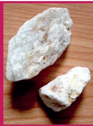
Crystal lime stones