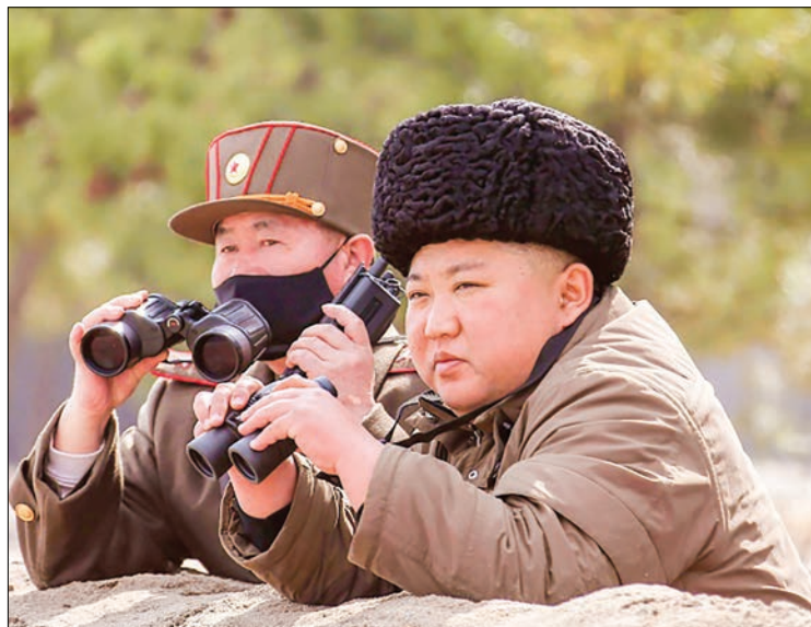
North Korean leader Kim Jong Un has been pictured on multiple occasions without a coronavirus mask.

In December, Kim stated it was time to take offensive measures to ensure the country’s sovereignty and security and threatened to soon unveil a new strategic weapon. — ANI ■