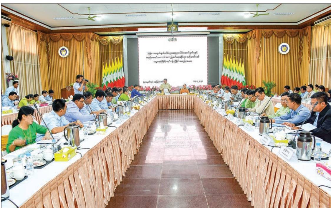
The fifth coordination meeting of the central committee on establishing Myanmar-China Border Economic Cooperation Zone being held in Nay Pyi Taw yesterday.

THE central committee on establishing Myanmar-China Border Economic Cooperation Zone held its fifth coordination meeting at the Ministry of Commerce in Nay Pyi Taw yesterday.