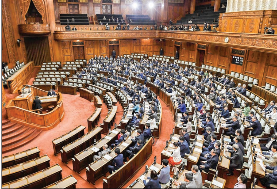
Japan's parliament enacts a time-limited legal change during a House of Councillors plenary session in Tokyo on 13 March, 2020, enabling Prime Minister Shinzo Abe, if he deems it necessary, to declare a state of emergency to cope with the spread of the new coronavirus.

which originated in China, has led to cancellations of many events and slower activity in society with consumers increasingly reluc-