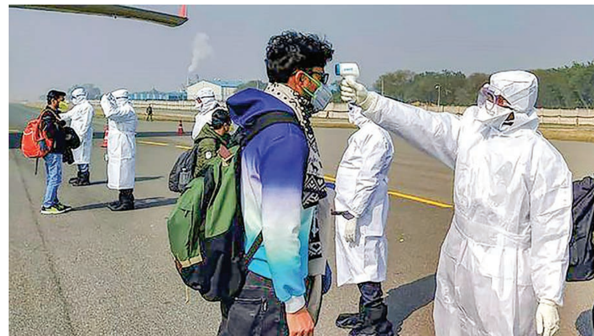
Passengers travelling to India from Italy and South Korea will have to present a certificate of having tested negative for coronavirus.

The decision was made a day after the Greek leg of the relay