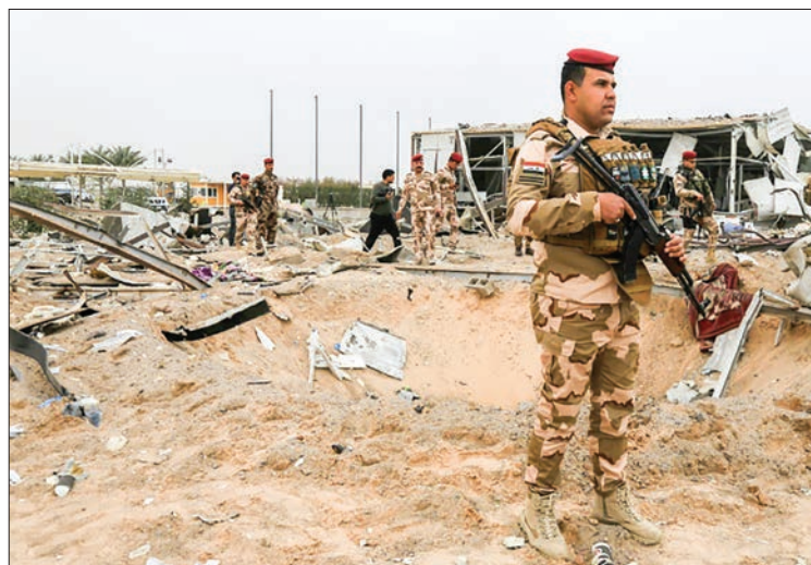
The Iraqi military condemned the US strikes as a violation of national sovereignty that would lead only to more instability.