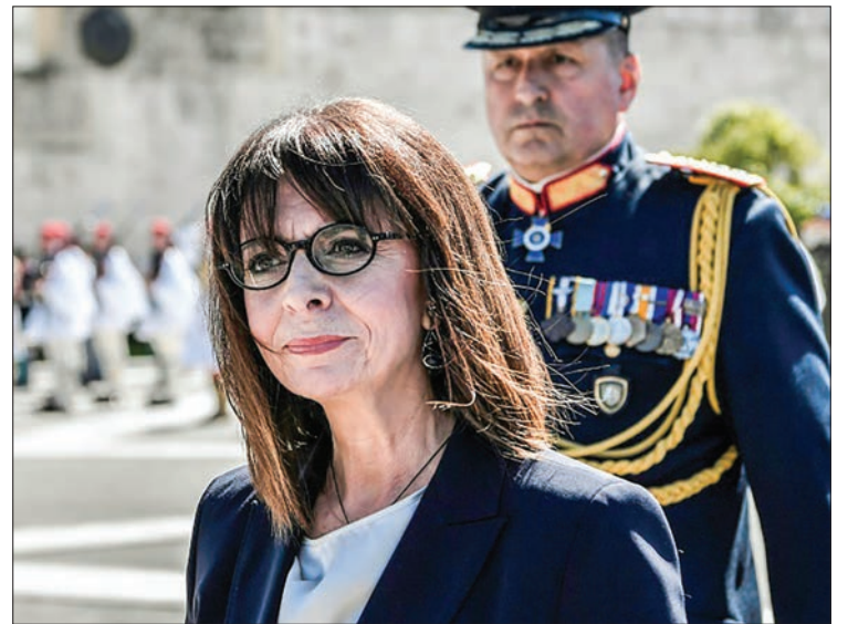
Greece's first woman President Katerina Sakellariopoulou vows to defend borders and rights but warns also of the need to tame the coronavirus crisis.

She placed a wreath at the Tomb of the Unknown Soldier — Greece's foremost military monument — before heading to the presidential mansion for a handover ceremony with outgoing president Prokoptis Pavlopoulos.— AFP ■