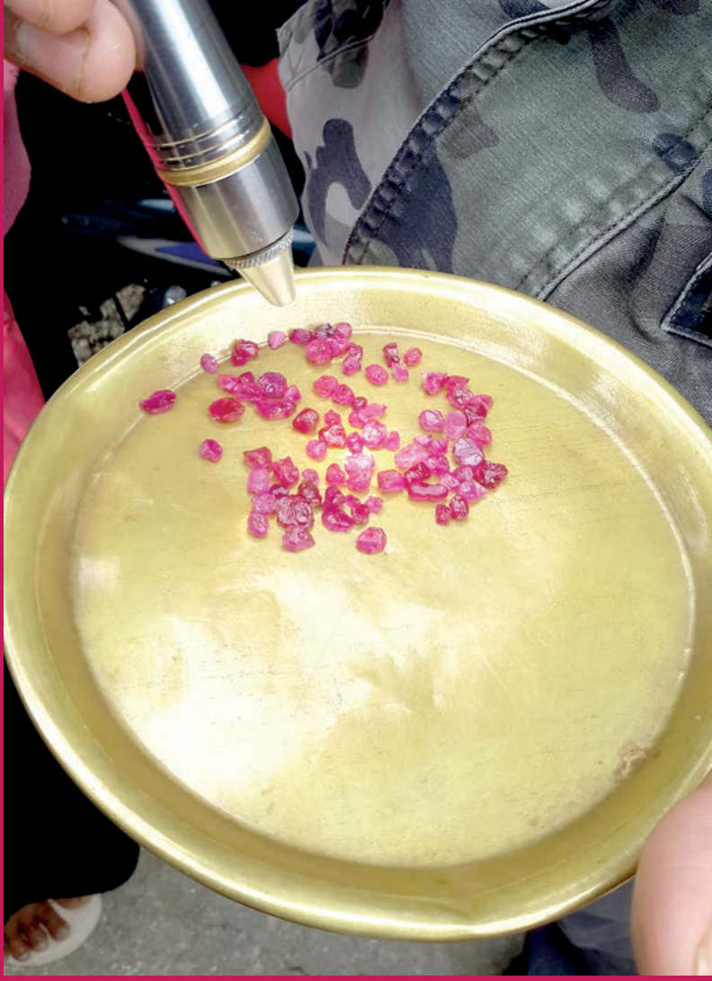
Gems trader doing assessment of gems stones by using the flash light.

Ruby and sapphire are same in ingredients. Ruby is red and sapphire, blue.