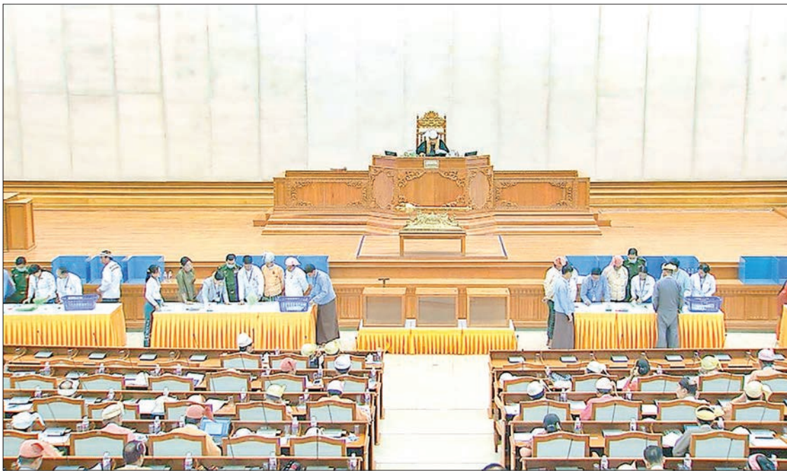
Hluttaw representatives continues voting for constitutional amendment during 22 nd -day meeting of the Second Pyidaungsu Hluttaw's 15 th regular session yesterday.

HLUTTAW representatives continued the voting process on the constitutional amendment during the 22 nd -day meeting of the Second Pyidaungsu Hluttaw's 15 th regular session yesterday.