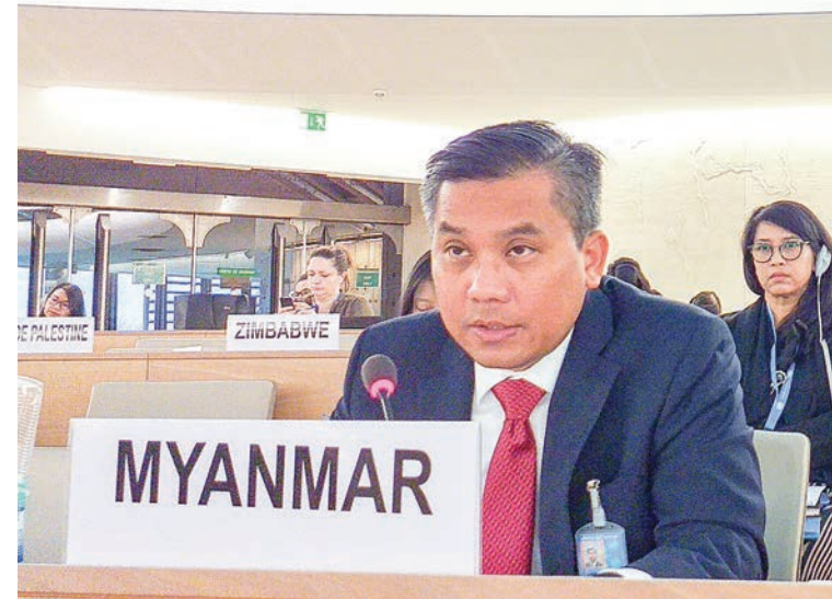
Permanent Representative of Myanmar U Kyaw Moe Tun.

Speaking of the upcoming General Elections in later part of 2020, he informed the Council that measures have been taken in preparation of the elections, including cooperation with relevant stakeholders to tackle fake news and hate speech online and