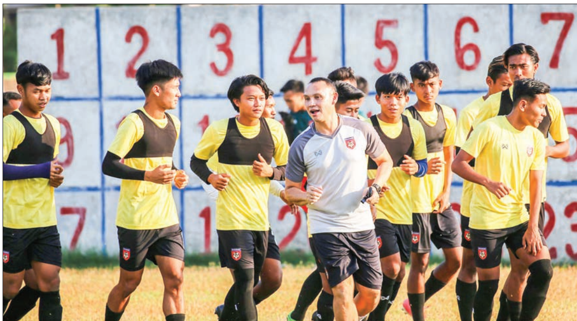
The Myanmar U-21 football team train at the Youth Training Centre of the Thuwunna Stadium in Yangon.

Team Myanmar won the bronze medal at the men's football competition of the 2019 South East Asian Games. —Lynn Thit (Tgi) ■