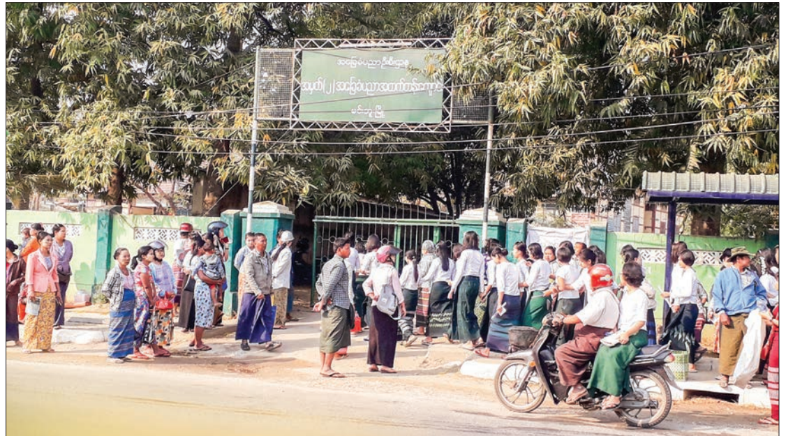
Students arrive at No 2 Basic Education High School, Minbu Township yesterday to sit for the matriculation exam.