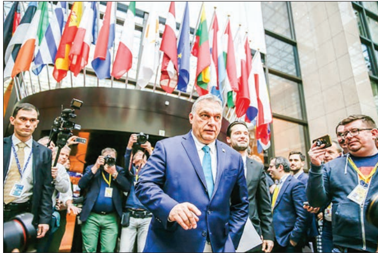
Prime Minister Viktor Orbán said Friday that foreigners and migration are to blame for the appearance and spread of coronavirus in Hungary.

sages posted on its Facebook page the government has warned Iranians of detention and deportation if they don't cooperate with disease control authorities.