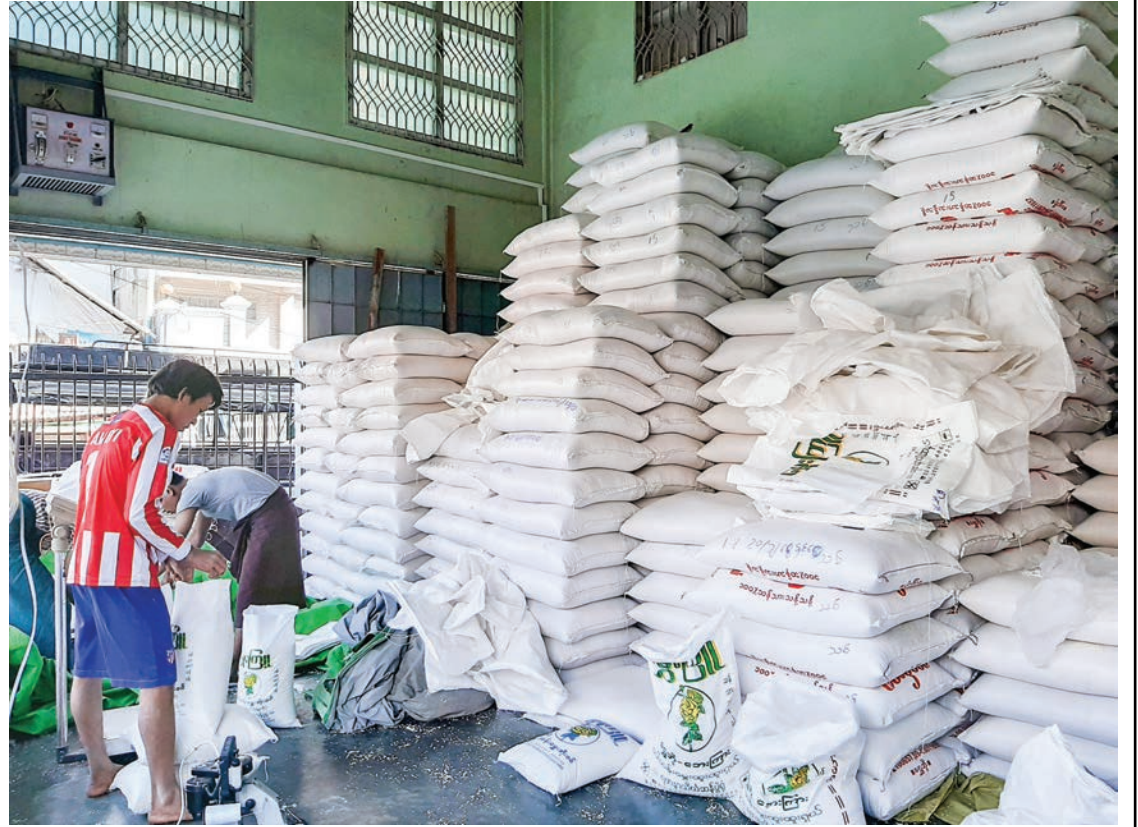
Workers packaging sacks of rice at a warehouse in Yangon.