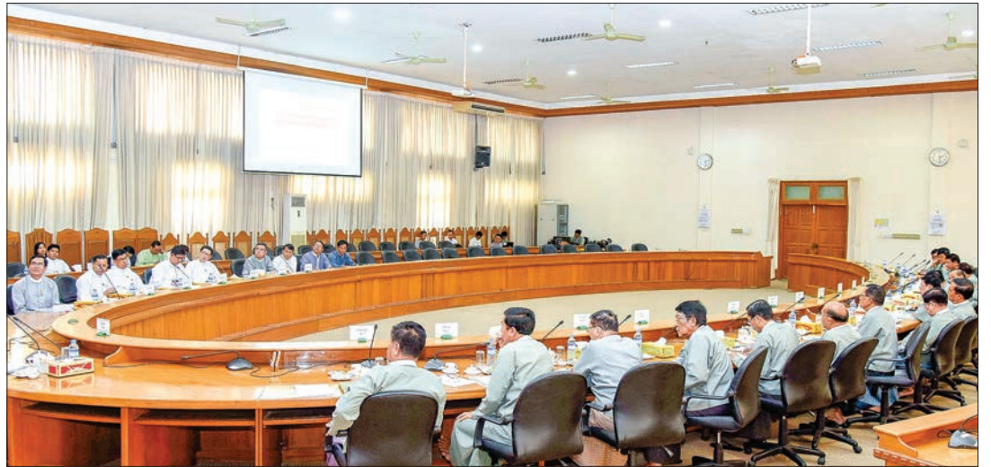
Union Election Commission Chairperson U Hla Thein addresses the meeting on clarifying work agenda for general elections in Nay Pyi Taw yesterday.

THE Union Election Commission led by its Chairperson U Hla Thein and officials with the commission and the Ministry of Information led by Union Minister Dr Pe Myint, Deputy Minister U Aung Hla Tun and officials with the ministry met at the UEC office in Nay Pyi Taw yesterday.