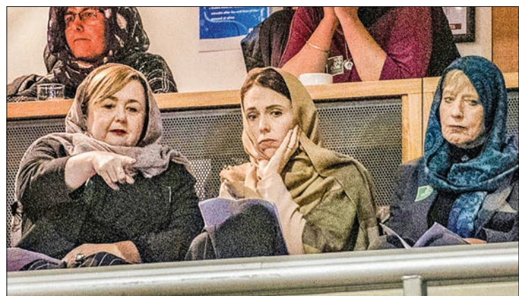
Jacinda Ardern was widely praised for her compassion towards the Muslim community after a lone gunman attacked two mosques last year.

Ardern said the March 15 attacks “fundamentally changed” New Zealand, she hoped for the better. ■