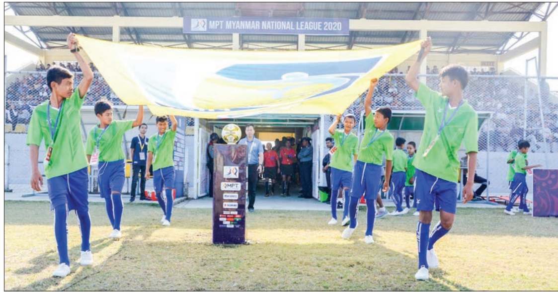
Boys bring out the football flag before a Myanmar National League 2020 match.

The Myanmar Football Federation is connecting with the FIFA and Asian Football Confederation to officially release detailed facts and fixtures of