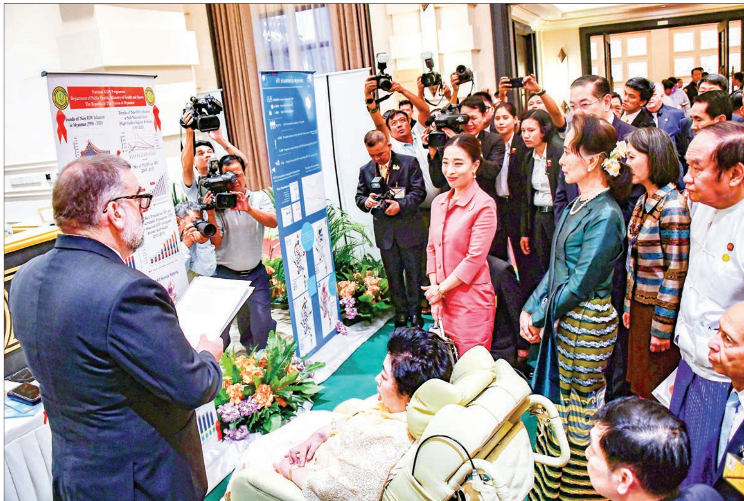
State Counsellor Daw Aung San Suu Kyi, Royal Princess Soamsawali Krom Muen Suddhanarinatha and Royal Princess Bajrakitiyabha observe the booth on HIV prevention programme of community-based organizations in Nay Pyi Taw yesterday.

Antiretroviral therapy medications are helping to control the spread of HIV, allowing many to live long and fruitful lives.