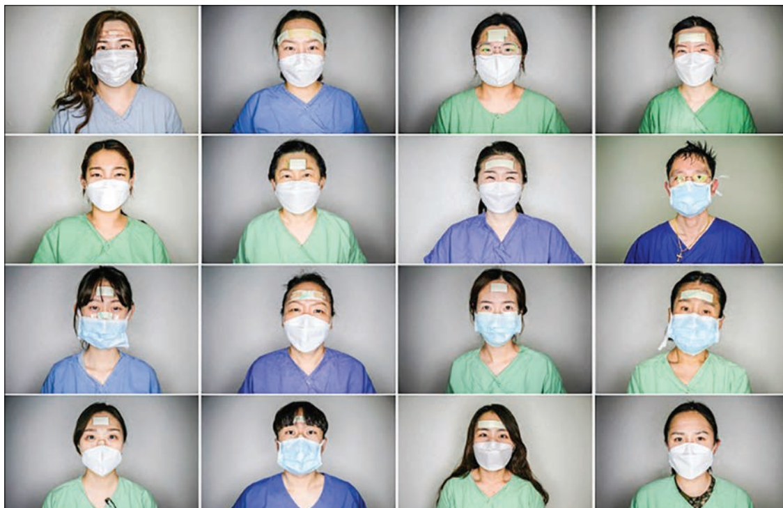
The pads, plasters and tape protect the nurses’ faces from painful sores that can develop as they tend to coronavirus patients for hours on end.

whole nation is behind you,” read one, from a well-wisher who sent thermometers and snacks.— AFP ■