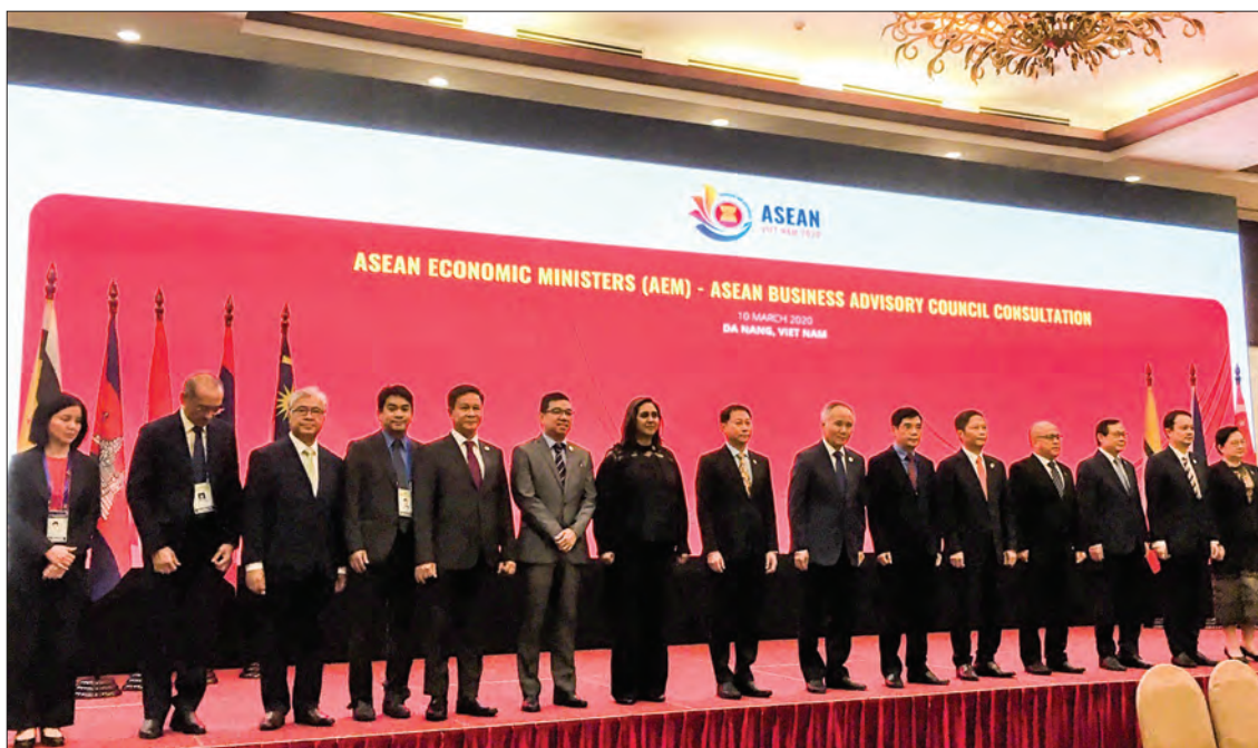
Deputy Minister U Aung Htoo attends the 26th ASEAN Economic Ministers Retreat Meeting in Danang, Viet Nam.

In addition, the Ministers agreed to take a collective course of action to mitigate the economic impact of COVID-19 on the ASEAN region, particularly supply chains, trade, financial market and tourism.—MNA