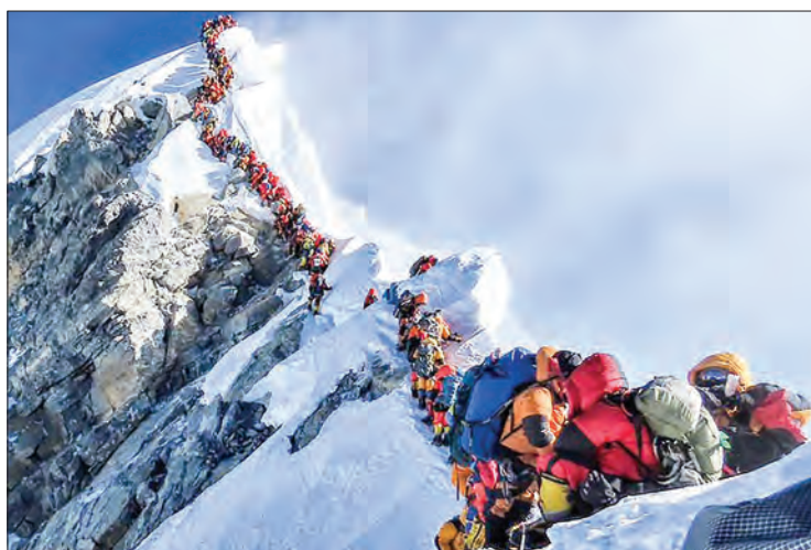
This handout photo taken on 22 May, 2019 and released by climber Nirmal Purja’s Project Possible expedition shows heavy traffic of mountain climbers lining up to stand at the summit of Mount Everest. PHOTO: AFP

The Chinese authorities “have informed us that the mountain will close from the north side,” Lukas Furtenbach of Austria-based Furtenbach Adventures told AFP.