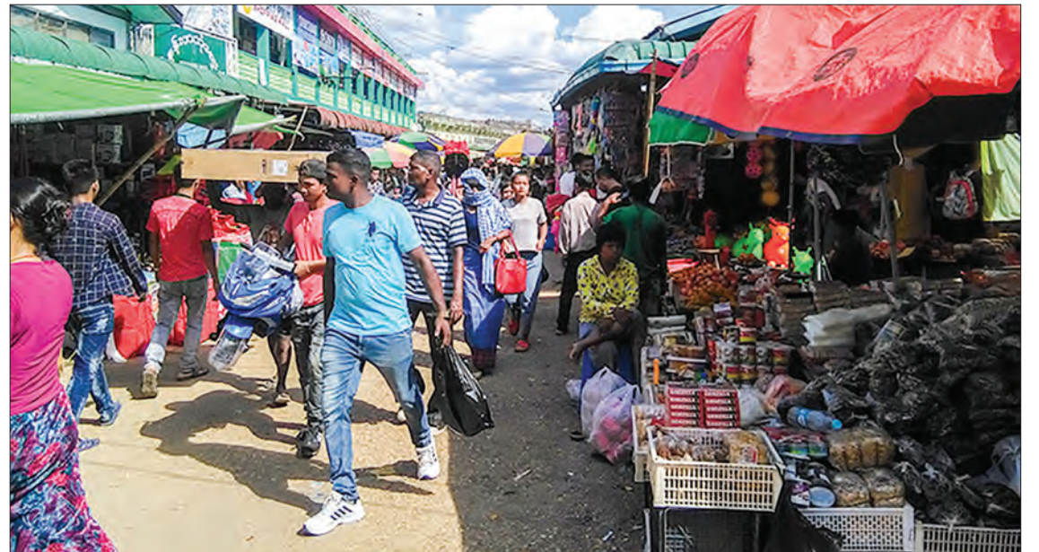
Namphalong Market in India-Myanmar border near Moreh in the Tengnoupal district of the Indian State of Manipur. The legalized border trade with Myanmar came to a grinding halt from Tuesday as the Manipur government closed both the international gates I and II at Moreh.

In the five months since October, the India-Myanmar trade plunged to $65 million from $76.8 million recorded in the year-ago period, according to data released by the Ministry of Commerce.