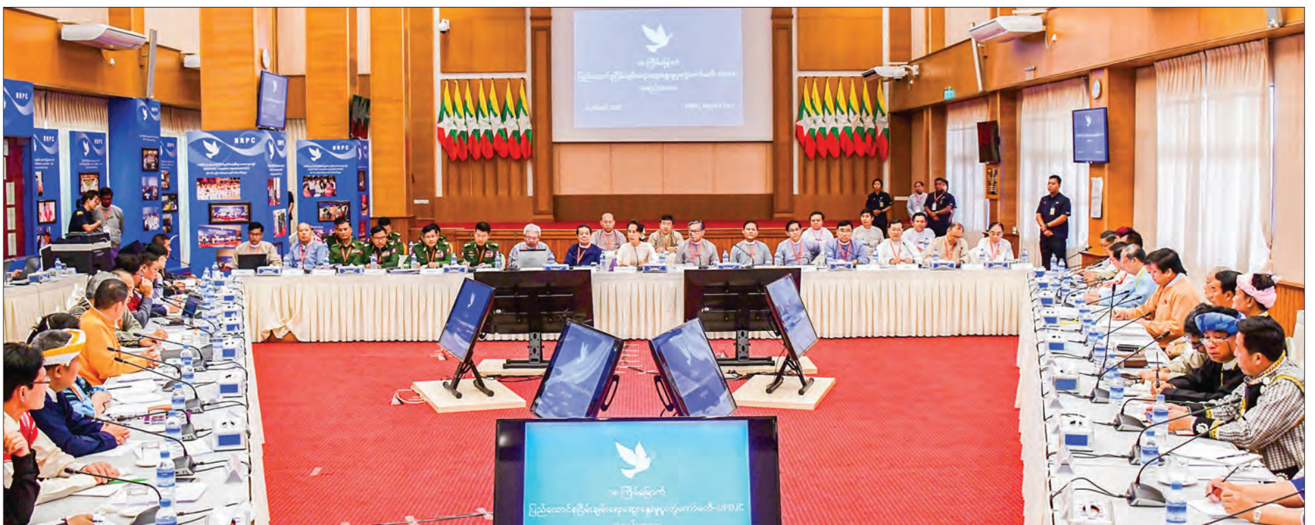
State Counsellor Daw Aung San Suu Kyi addresses the 18 th edition of the Union Peace Dialogue Joint Committee Meeting in Nay Pyi Taw yesterday.

S TATE Counsellor Daw Aung San Suu Kyi, in her capacity as Chairperson of the Union Peace Dialogue Joint Committee, delivered a speech to the 18 th meeting of the committee held at the National Reconciliation and Peace Centre in Nay Pyi Taw yesterday morning.