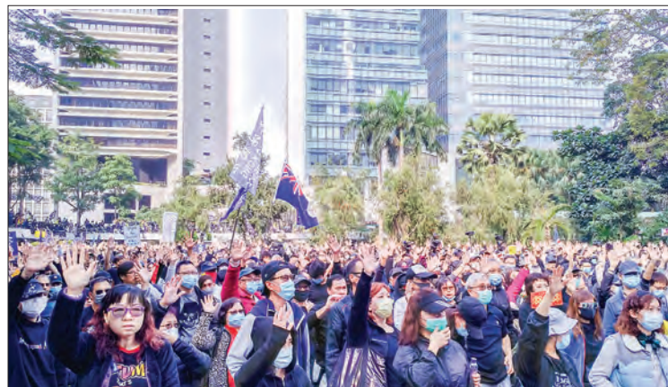
Thousands of protesters rally in Hong Kong in January 2020.

HONG KONG — Hong Kong and China on Thursday dismissed an annual human rights report by the US State Department that highlighted police brutality and arbitrary arrests during months-long anti-government demonstrations in the former British colony.