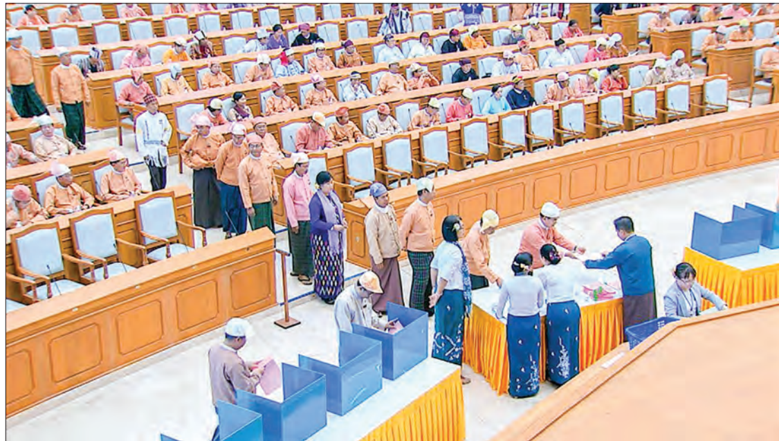
Pyidaungsu Hluttaw representatives voting on amendments to the 2008 Constitution.

provision failed to pass the 75 per cent of votes required for the amendments, with 414 votes for paragraph (a) of Section 412, 414 votes for paragraph (b) of Section