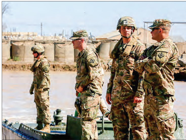
US troops supervise a training session at the Taji camp, north of Baghdad — the site of the Wednesday night rocket attack.

called for "maximum restraint on all sides". "These ongoing attacks are a clear and substantial threat to the country, and the risk of rogue action by armed groups remains a constant concern," it said. "The last thing Iraq needs is to serve as an arena for vendettas and external battles."