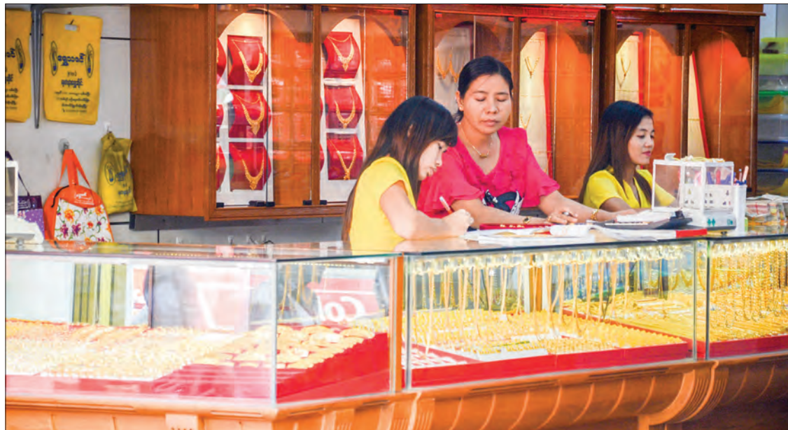
Gold jewellery displayed at a shop in downtown Yangon.