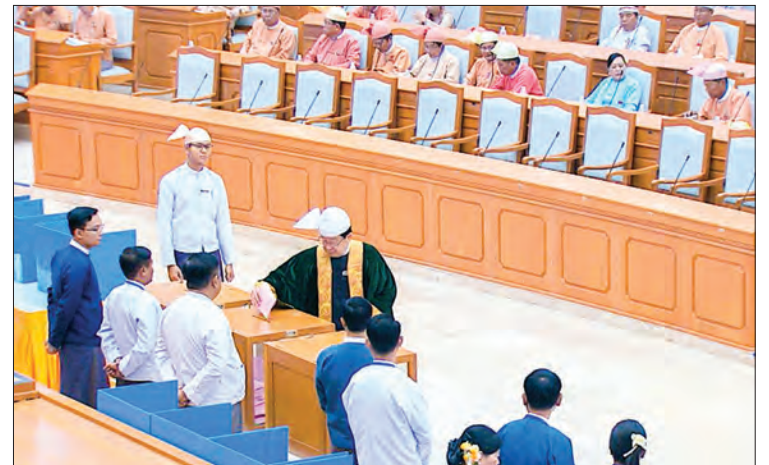
Pyidaungsu Hluttaw Speaker voting on amendments to the 2008 Constitution.

412, 414 votes for Section 413, 417 votes for Section 418, 417 votes for paragraph (a) of Section 418, 416 votes for paragraph (b) of Section 418, 415 votes for Section 419, 416 votes for Section 420, 410 votes for Section 421, 417 votes for paragraph (a) of Section 421, 417 votes for paragraph (b) of Section 421 respectively.