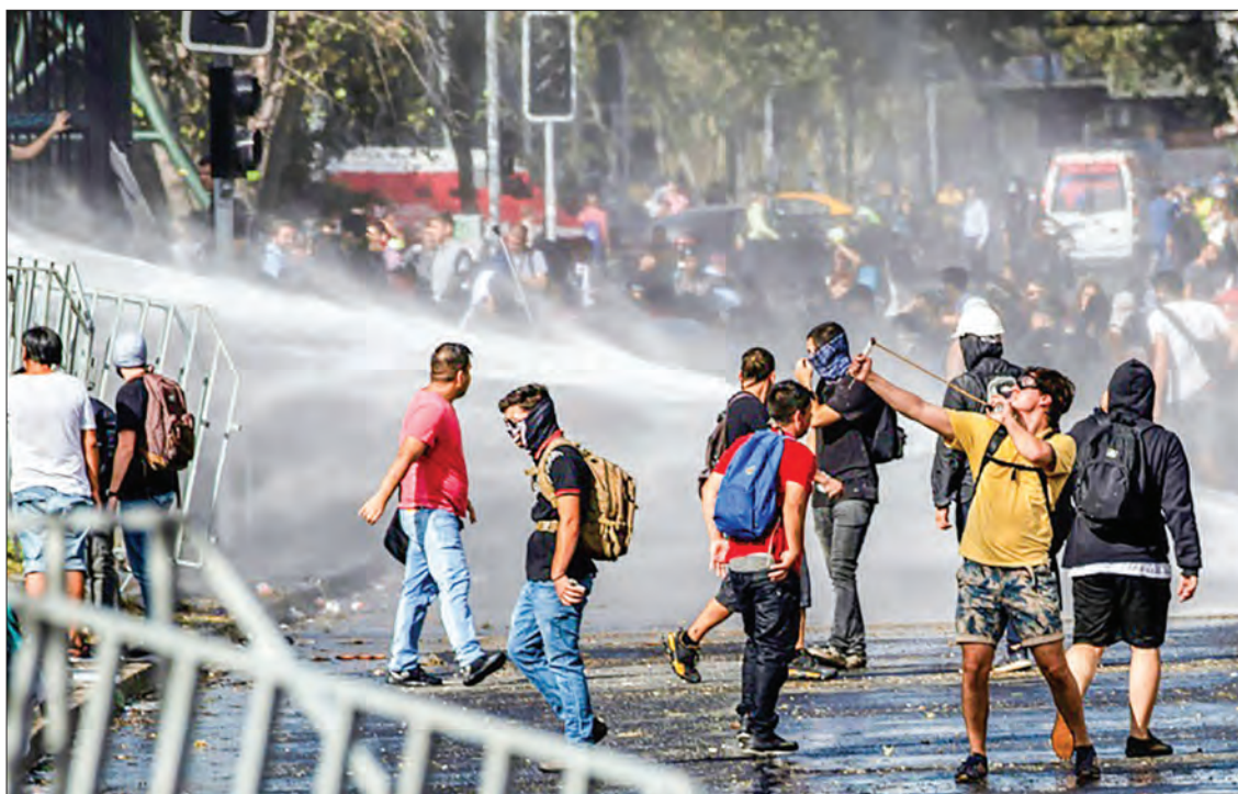
The protests coincided with the 30th anniversary of Chile's return to democracy after Augusto Pinochet's 1973-1990 dictatorship.

The most serious of Wednesday's disturbances occurred outside the landmark National Institute school in the center of Santiago, just a few blocks from the presidential palace, where police fired tear gas and water cannon to disperse stone-throwing students.