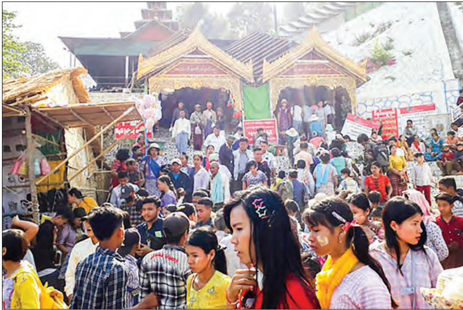
Mann Shwe Settaw Pagoda packed with visitors yesterday.

MAGWAY Region government issued an order for closure of ongoing Mann Shwe Settaw pagoda festival to alleviate concerns about the coronavirus in the country.