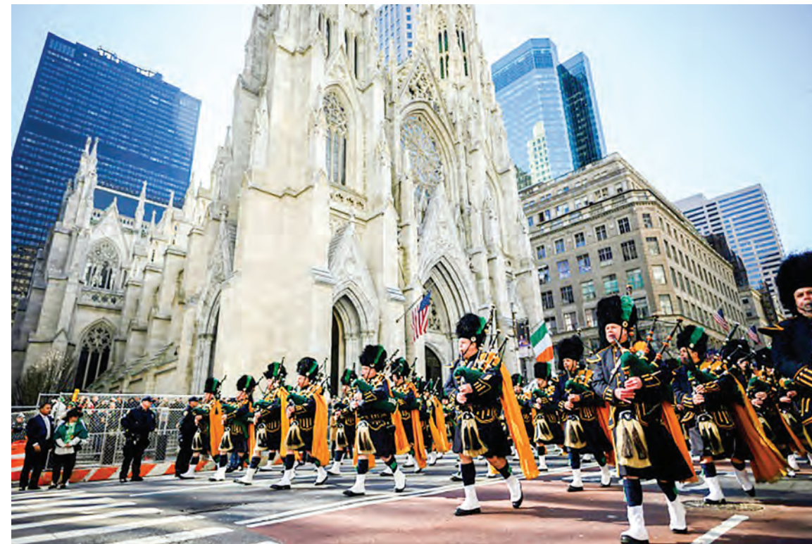
New York City postpones St. Patrick's Day Parade for the first time in its 258-year history.

jump this week in cases, including people who recently attended events with Senate lawmakers and government officials, potentially exposing them.