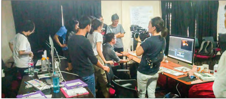
The crew members of NHK Television channel taking a documentary film at Yangon Film School.

JAPANESE state-owned NHK television channel is taking documentary film in Yangon for its World Channel.