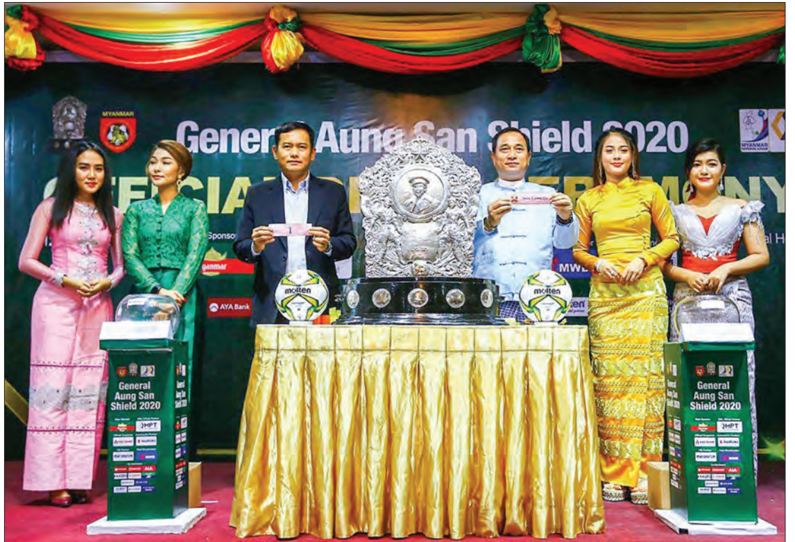
The drawing ceremony for the General Aung San Shield 2020 was held yesterday in Yangon.

Defending champions of the Myanmar National League, Shan United, 1 st runners up Ayeyawady United, and defending champions of the General Aung San Shield, Yangon United, will participate in the tourney from the quarterfinal stage, according to the Myanmar National League.—Lynn Thit (Tgi) ■