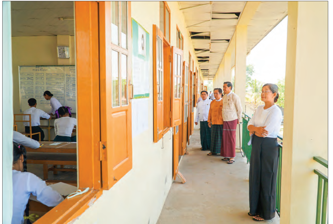
Union Minister Dr Myo Thein Gyi observes students sitting for the matriculation examination at a matriculation exam centre in Mon State yesterday.