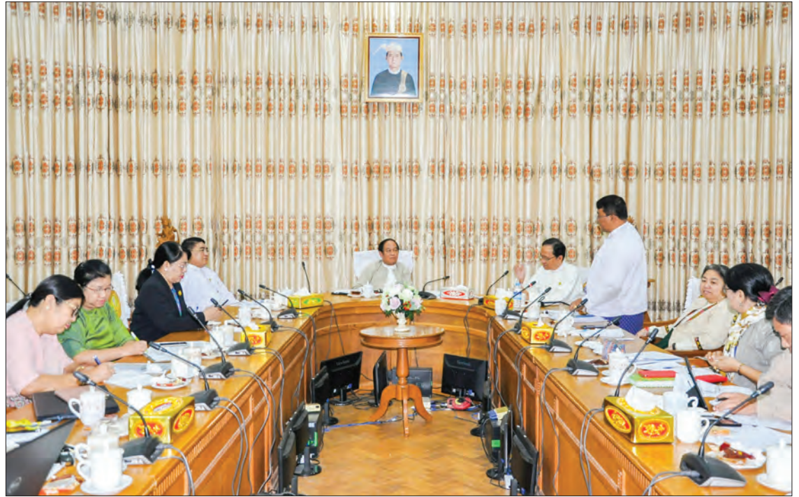
Union Minister Dr Myint Htwe attends the coordination meeting on prevention of COVID-19 with the target of zero case and no death yesterday.

At the meeting, officials discussed control measures at regions and states, preparations at the hospitals, and surveillance