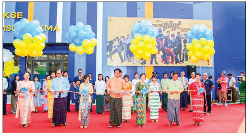
Officials opening the new theatres of Paradiso Cinemas Co.,Ltd in Kyaukse yesterday.