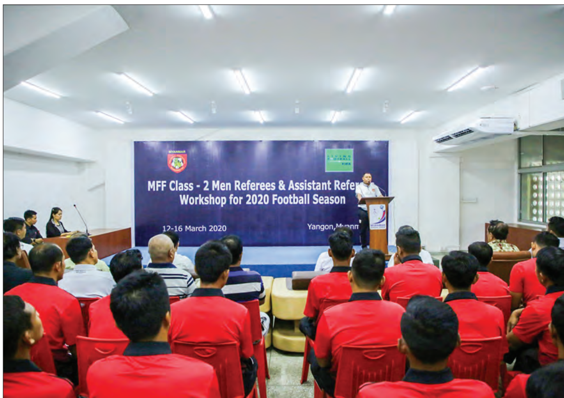
MFF Class-2 Men Referees and Assistant Referees Workshop for the 2020 Football Season was held yesterday in Yangon.