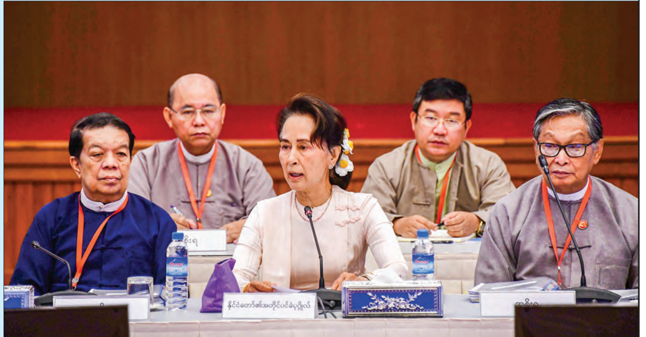
State Counsellor and Chairperson of UPDJC Daw Aung San Suu Kyi delivers the speech at the 18 th UPDJC meeting.

In today's UPDJC meeting, reforms shall be made on the Framework for Political Dialogue, as well as on the related ToR and SOP. Since, based on the reforms