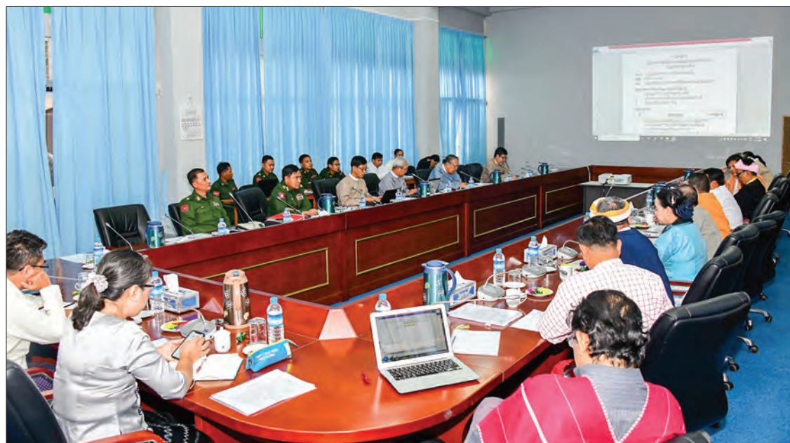
The 26 th meeting of the Union Peace Dialogue Joint Committee Secretariat being convened in Nay Pyi Taw yesterday.