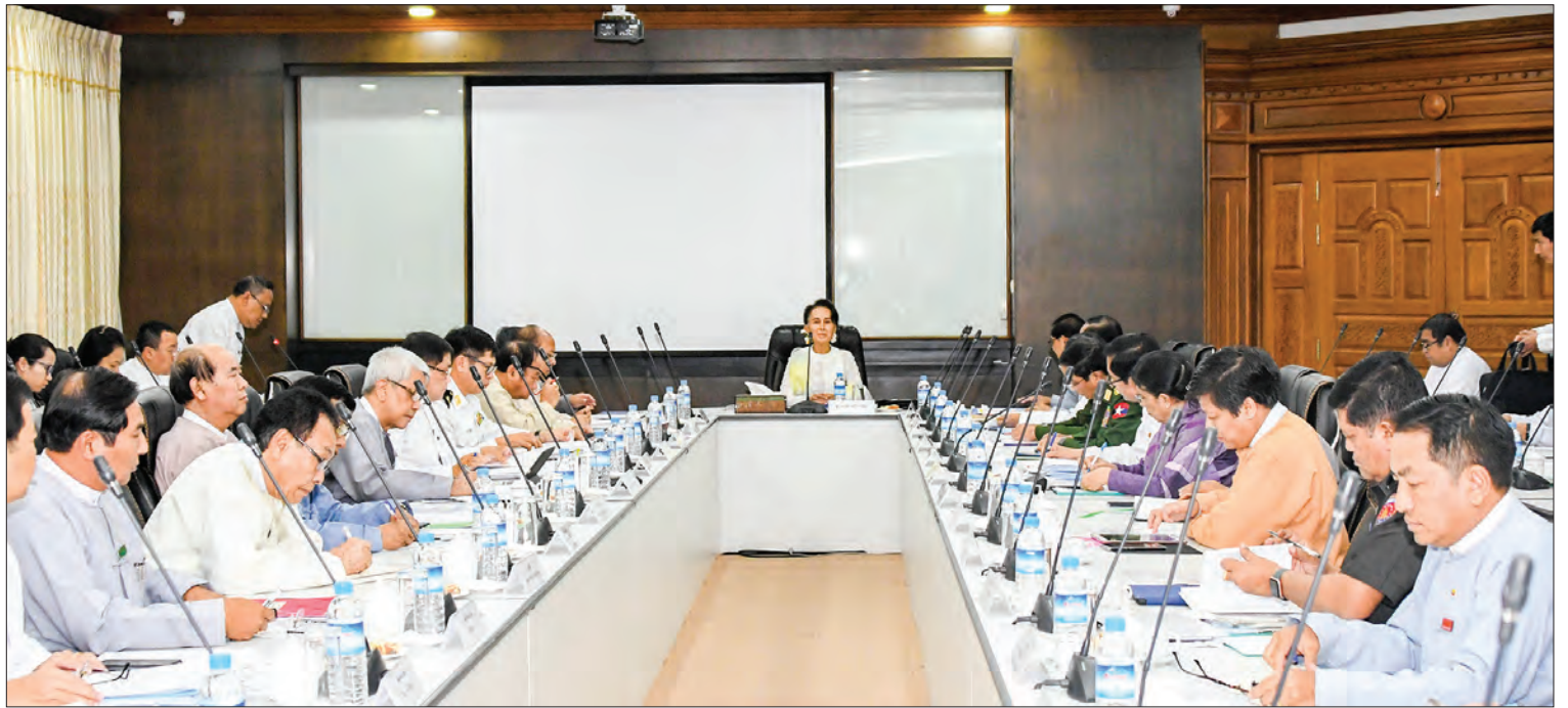
State Counsellor Daw Aung San Suu Kyi delivers the speech at the emergency meeting on COVID-19 yesterday in Nay Pyi Taw.

Next, the representatives at the meeting discussed their respective tasks in containing and monitoring COVID-19, plans