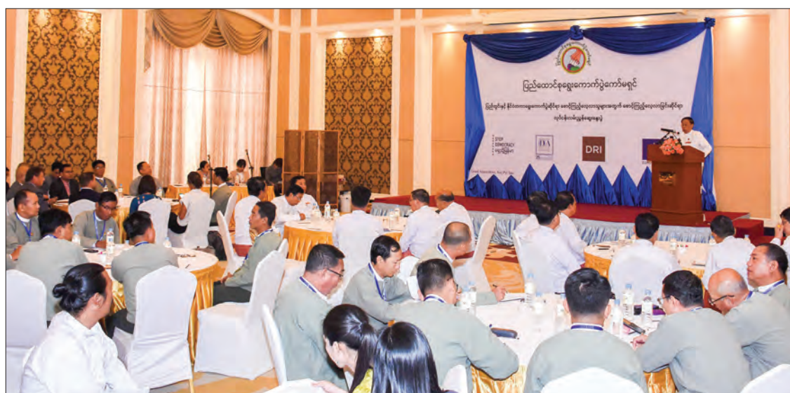
Union Election Commission Chairman U Hla Thein delivers the speech at the Election Observer Workshop in Nay Pyi Taw yesterday.