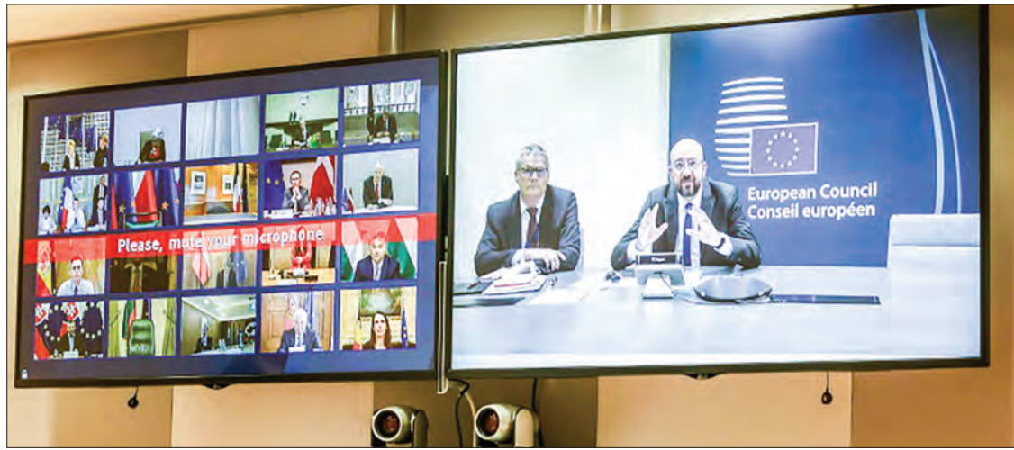
European Commission and European Council presidents Ursula von der Leyen and Charles Michel discussed with other senior officials the continent's response to the coronavirus in a conference call, urging cooperation to combat a global crisis.

BRUSSELS — European officials reacted with surprise and anger Thursday after US President Donald Trump imposed a trans-Atlantic travel ban they fear will wound economies already reeling from the coronavirus pandemic.