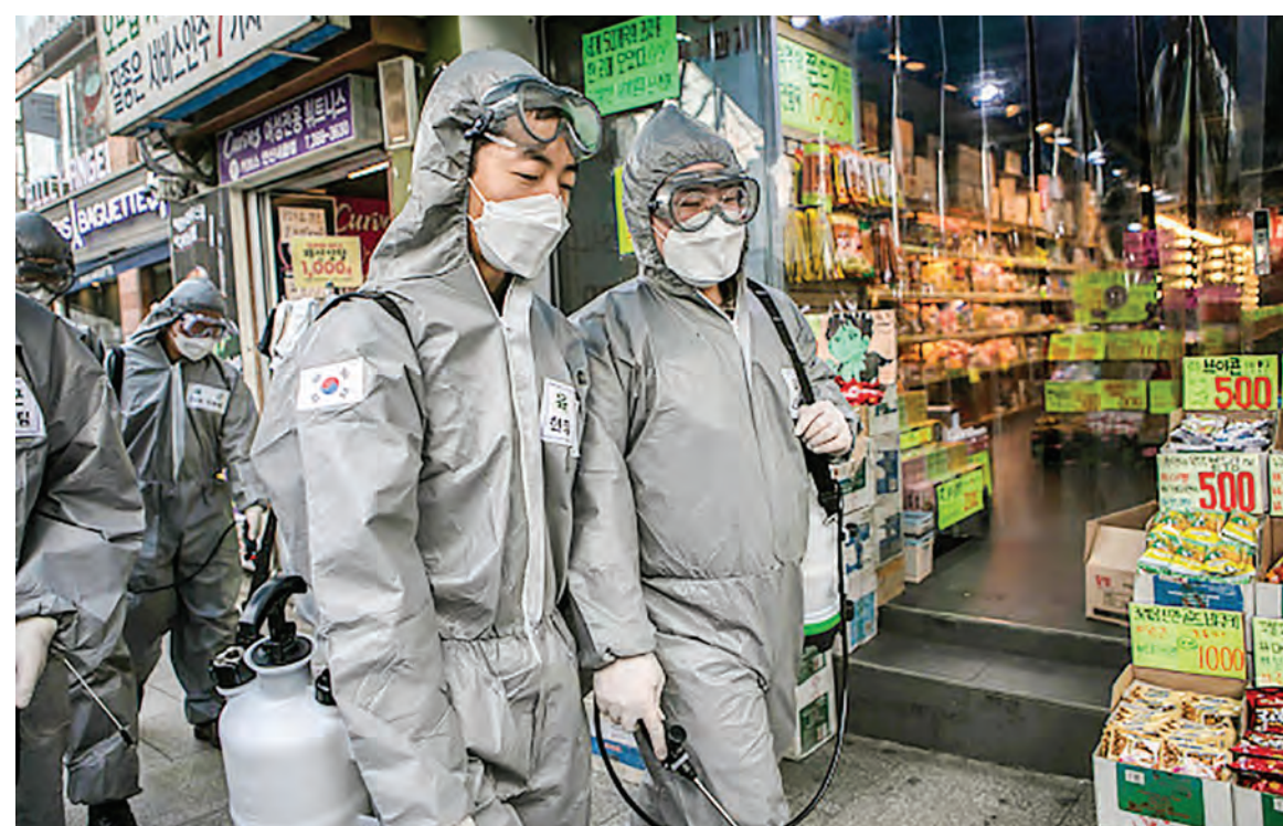
Korean soldiers spray disinfectant as a precaution against the coronavirus on a shopping street in Seoul, South Korea, last week.

REFERENCES WHO; Xinhua, AFP; Kyodo News Updates