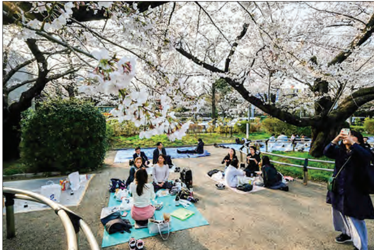
It is a Japanese tradition to eat and drink under the cherry trees.

“I think taking hanami away from the Japanese is like taking away hugs from Italians,” she said.