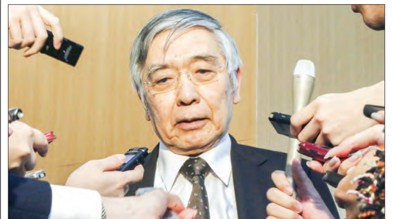
Bank of Japan Governor Haruhiko Kuroda attends a parliament committee session in Tokyo on 10 March, 2020.

However, the spread of the epidemic took a heavy toll on consumer spending recently, as many businesses such as department stores, already hit by a consumption tax hike to 10 per cent from 8 per cent on 1 October, suffered a steep sales fall for the fourth consecutive month through February. Japan's recent ban on entry of South Korean and Chinese travelers is likely to deal an even more severe blow to tourism and retail industries among others through March. —Kyodo News ■