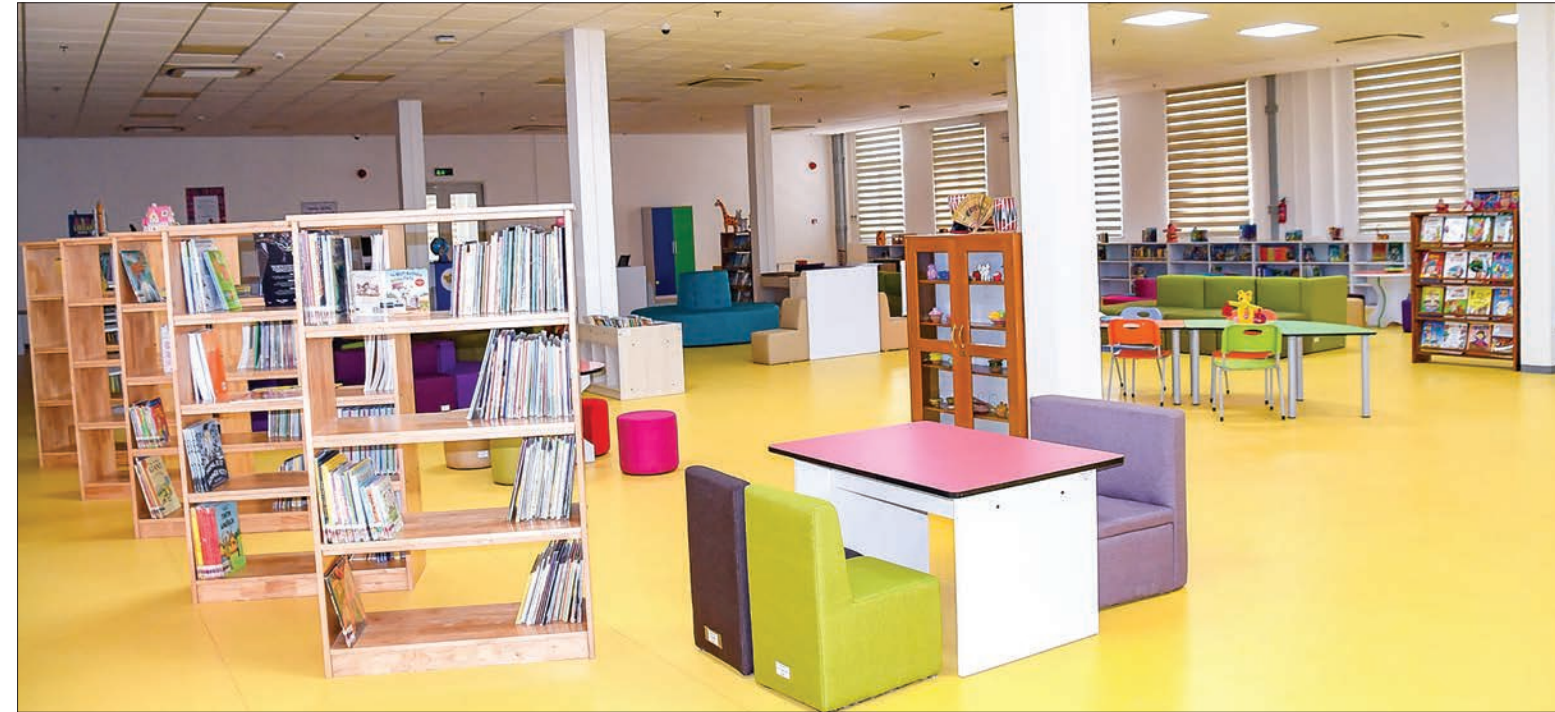
The children's corner at the National Library (Yangon).

"Being one hundred years old building with Yangon Heritage Trust Classification, it has not taken up lightly to change into an instant library. With the evaluation