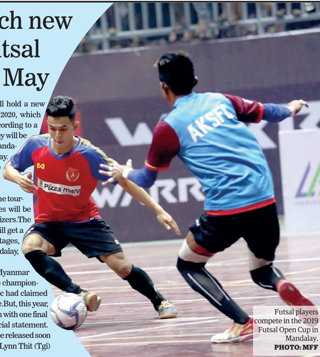
Futsal players compete in the 2019 Futsal Open Cup in Mandalay.