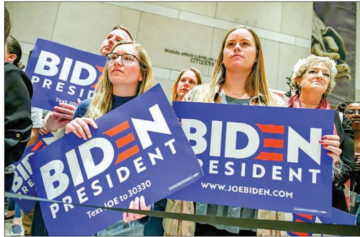
Supporters of Democratic presidential hopeful Joe Biden at the National Constitution Center in Philadelphia, Pennsylvania.

His win in Michigan, the Midwestern industrial state which could be a key battleground in November, was a major setback for Sanders, who narrowly beat Hillary Clinton there four years