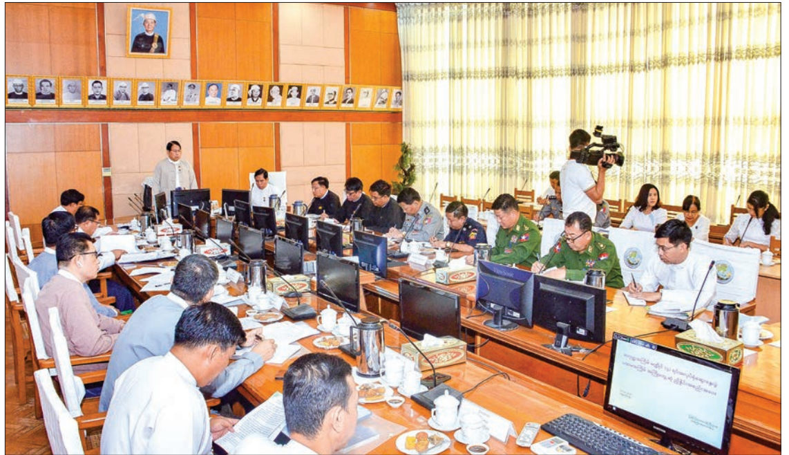
Union Minister Dr Pe Myint addresses the meeting with representatives from the four pillars of democracy in Nay Pyi Taw yesterday.