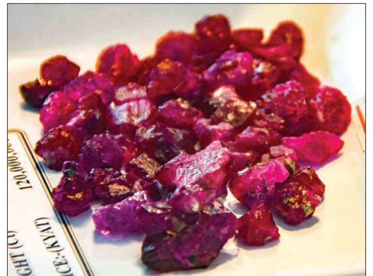
Mineral exports show an increase of over US$1 billion compared with the same period last year.