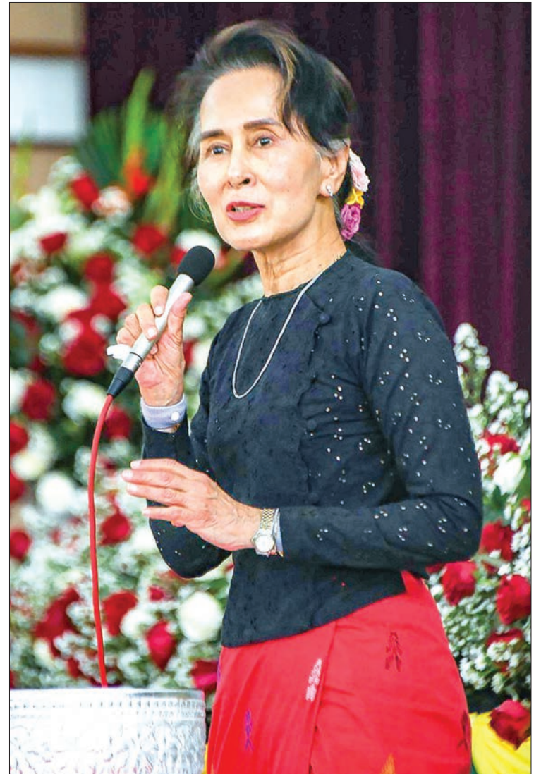
State Counsellor Daw Aung San Suu Kyi speaks at the meeting with local people in Shwebo.

“We need to understand one another. Understanding enables us comfortable with each other. I've learned it. Discipline in one place is not the same as in another one when we meet