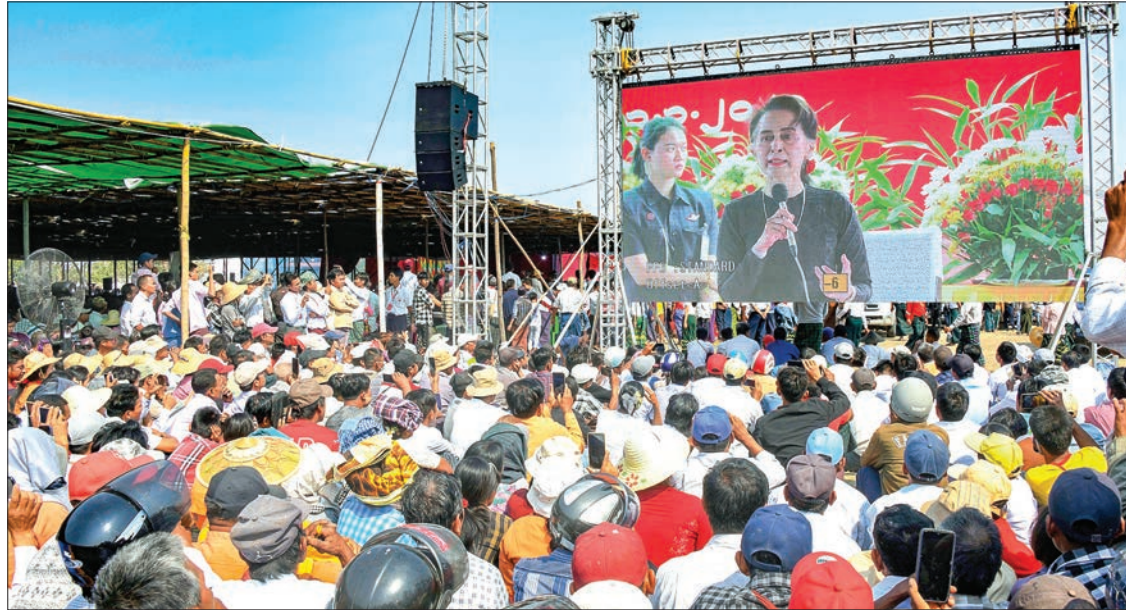
Local people gather outside the main meeting hall listening to the speech delivered by State Counsellor Daw Aung San Suu Kyi on the LED screen in Dabayin yesterday.

I would recall what my father said during the post-war period, before Myanmar regained her independence. Because our country had suffered severely during the wartimes, if we want to keep abreast with the other countries, we must set ourselves running while the other countries are walking. Now we have the same situation. Our country has been included among the least developed nations in Southeast Asia. So if we want to catch up with the world, we must set ourselves running. If, however, we walk as the others do, we'd be lagging behind. For example, we want to upgrade our education so we have made great efforts. Within these four years, our universities