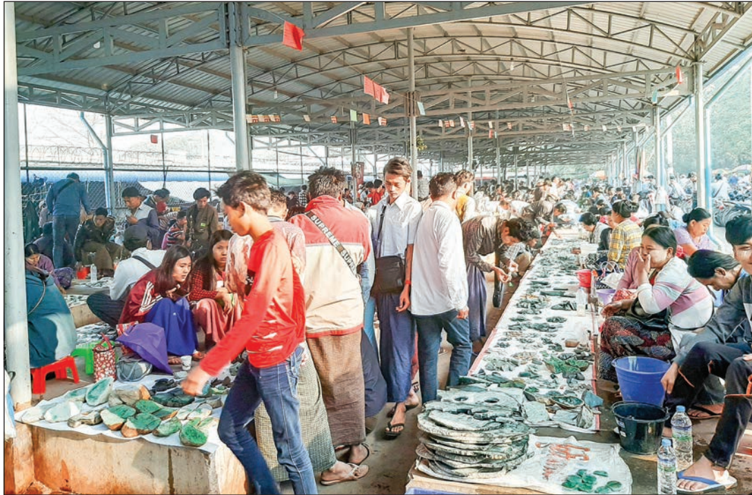
The Jade Trading Centre in Mandalay packed with traders.

JEWELLERY traders from the Gems Trading Centre in Mahaungmye Township in Mandalay are concerned over cooling trade on account of COVID-19, according to the Gems Trading Executive Committee.