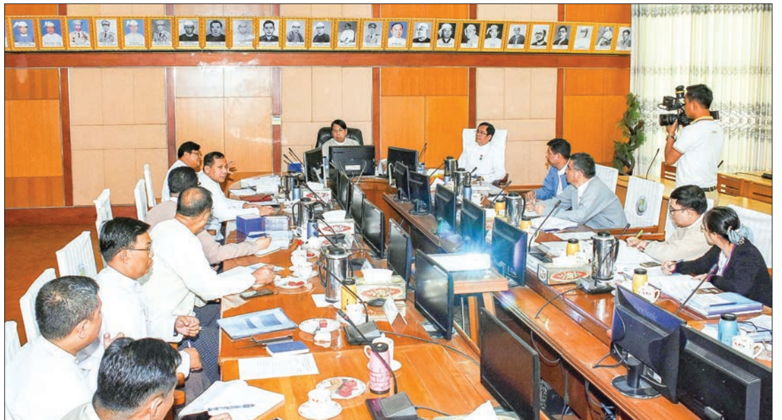
Union Minister Dr Pe Myint addresses the meeting to organize voter education programme at the Ministry of Information.

Deputy Minister for Information U Aung Hla Tun then pro-