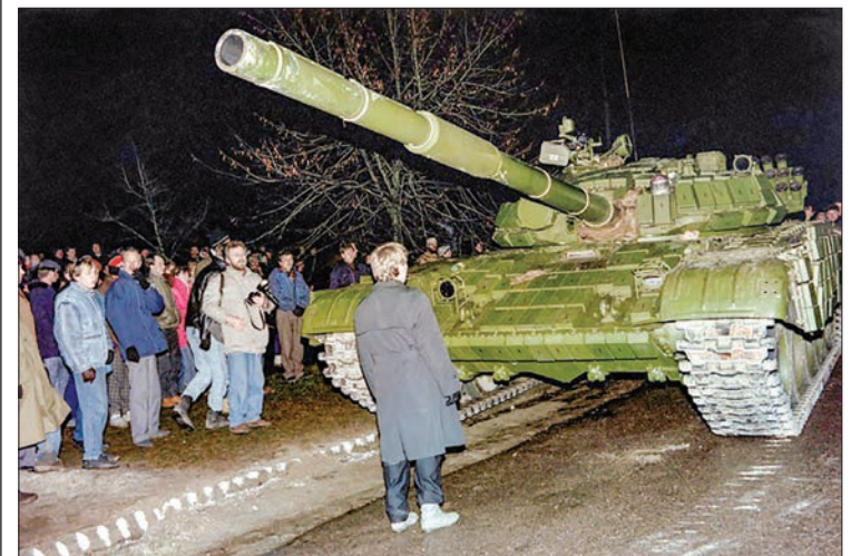
Lithuania is still looking to heal the trauma of the Soviet years which culminated in the killing of 14 civilians by the Soviet military in January 1991.

But the Baltic nation of 2.8 million people struggles with some of Europe's highest rates of suicide, alcoholism and emigration.—AFP ■