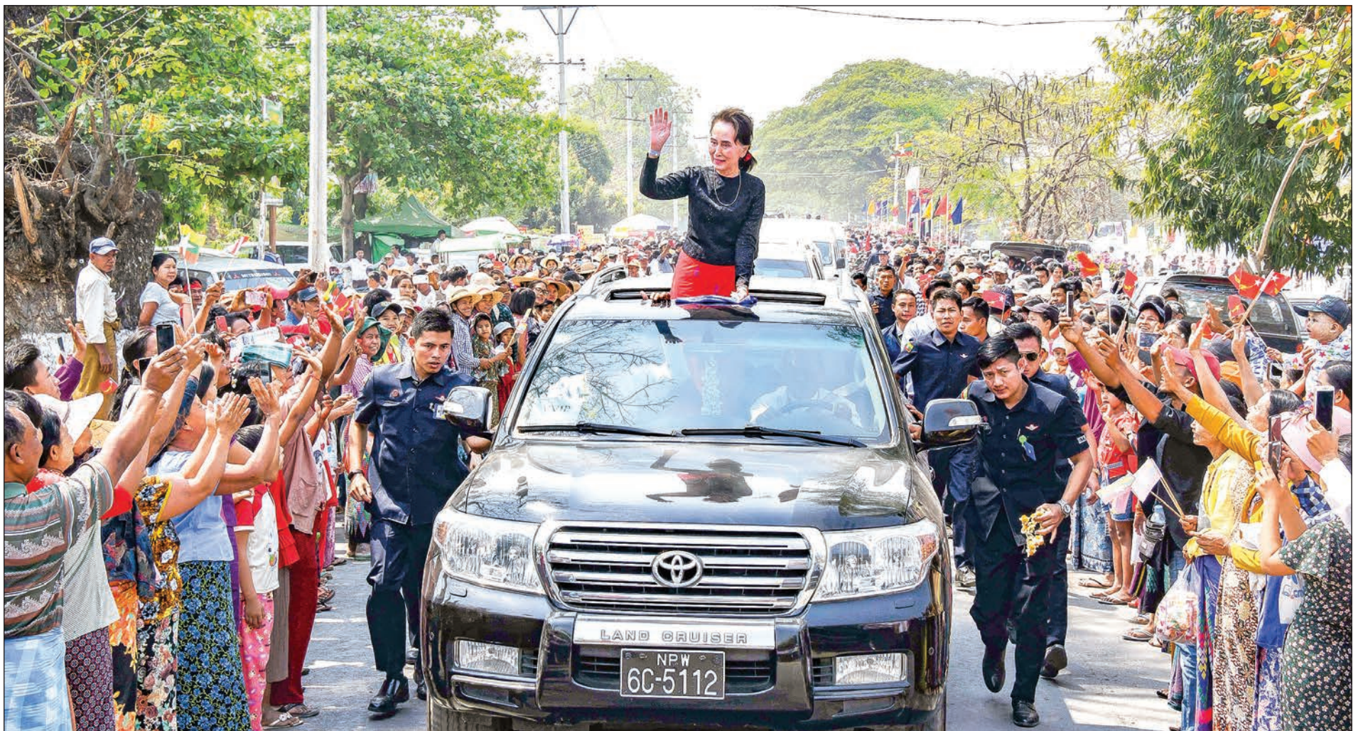
State Counsellor Daw Aung San Suu Kyi is welcomed by local people in Dabayin, yesterday.

S TATE Counsellor Daw Aung San Suu Kyi, in her capacity as the Chairperson of the Central Committee for Development of Border Areas and National Races, held meetings with locals in Dabayin and Shwebo townships of Sagaing Region yesterday.