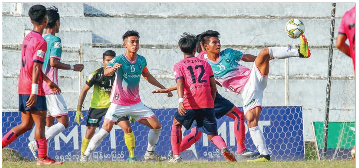
A player from the Yangon United U-21 team tries to score a goal against the Sagaing United U-21 team yesterday at the Padonmar Stadium in Yangon.

YANGON United trounced Sagaing United by five goals in the U-21 Myanmar National League 2020 yesterday at the Padonmar Stadium in Yangon.