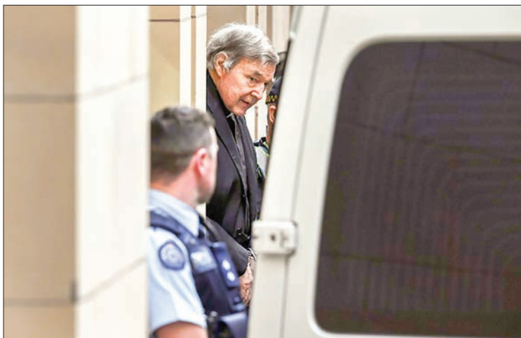
Australian Cardinal George Pell leaving court during an earlier hearing. He was not present for the latest appeal.