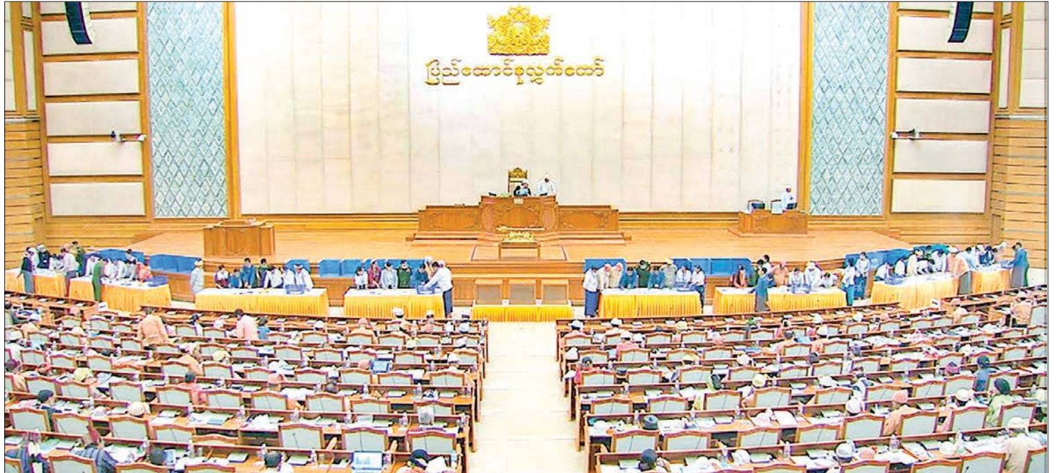
Pyidaungsu Hluttaw convenes its 20 th day meeting of 15 th regular session yesterday.

Moreover, proposals for amendment of paragraph (d) of Section 59 won 415 supporting votes, 393 votes for paragraph (f) of Section 59, 412 votes for paragraph (b) of Section 109, 412 votes for paragraph (b) of Sec-