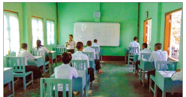
Students sitting for the matric exam in Insein Prison yesterday.

Insein Prison began organizing for inmates to take the matriculation examination in 2014