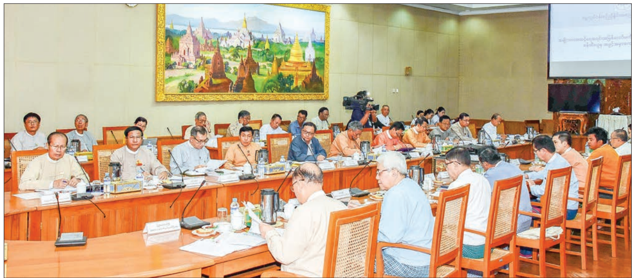
Vice President U Henry Van Thio addresses NWRC first coordination meeting in Nay Pyi Taw yesterday.

VICE President U Henry Van Thio, in his capacity as Chairman of the National Water Resources Committee (NWRC), addressed the committee's first coordination meeting of the year at Nay Pyi Taw yesterday.