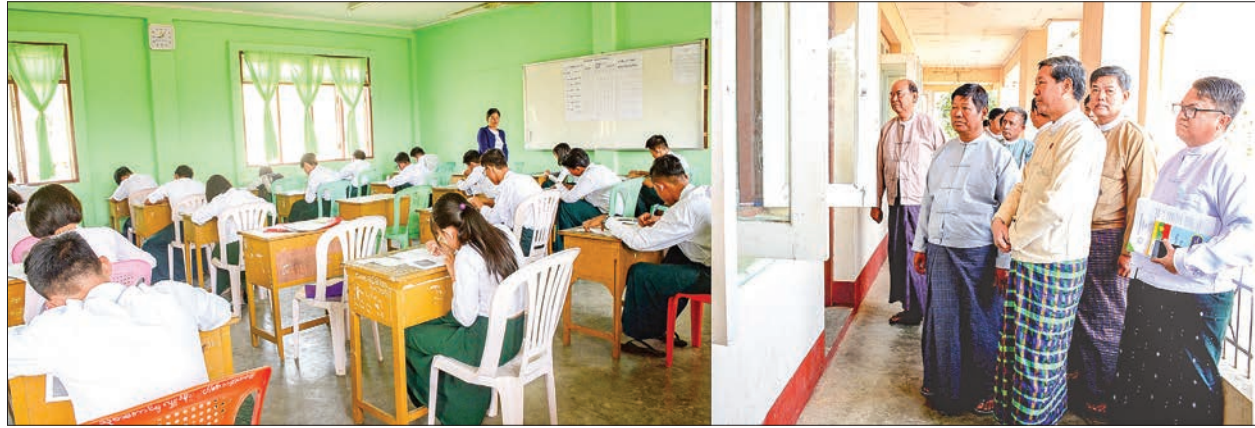
Union Minister Dr Myo Thein Gyi and officials observe students sitting for the examination in Nay Pyi Taw yesterday.

UNION Minister for Education Dr Myo Thein Gyi visited the matriculation exam centre at No.6 Basic Education High School in Zabuthiri Township on the first day of the exam for Myanmar subject yesterday. Together with Deputy Minister U Win Maw Tun and Nay Pyi Taw Council Member U Tin Tun made necessary instructions on successfully organizing of the exam.