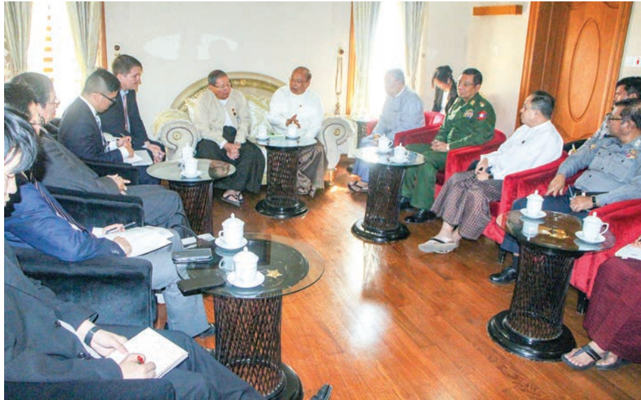
Union Minister U Soe Win, Union Minister U Thaung Tun and officials hold talks with the delegation of Asia/Pacific Group on Money Laundering led by Director Mr David Shannon in Nay Pyi Taw yesterday.

UNION MINISTER for Planning, Finance and Industry U Soe Win, Union Minister for Investment and Foreign Economic Relations U Thaung Tun, Governor of Central Bank of Myanmar U Kyaw Kyaw Maung, Deputy Minister for Home Affairs Maj-Gen