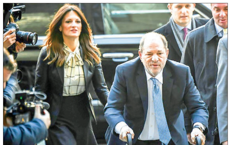
Harvey Weinstein was convicted of rape and sexual assault by a New York jury.

York judge Wednesday, two weeks after he was convicted of rape and sexual assault.