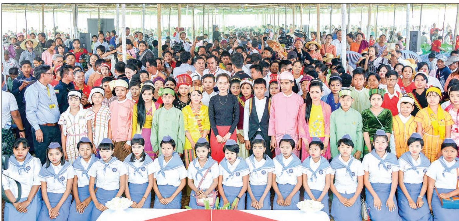
State Counsellor Daw Aung San Suu Kyi poses for the documentary photo with children at the meeting with locals in Dabayin.

To sum up, I realize, therefore, that our public gatherings like this truly reflect the changes taking place in our country. We always welcome the matters, related to the needs of our country, that you forward to us. I would like you to come up with the questions, as well as proposals, that are not self-centred, not directed to personal interests, but regionally oriented, for the sake of local needs, for the sake of the interests of our community, for the sake of national needs.