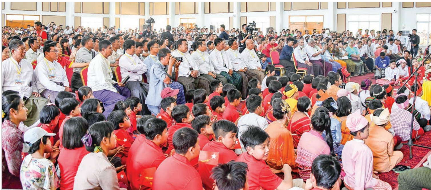
Local people in Shwebo attend the meeting with State Counsellor Daw Aung San Suu Kyi yesterday.

Dabayin are quite eloquent. This has its advantages but I urge you to also consider keeping things short and to the point. This will allow other people more opportunities as well. If you spend ten minutes for yourself, then it will end in about five people losing their two to three minutes to talk. You need to consider this.”