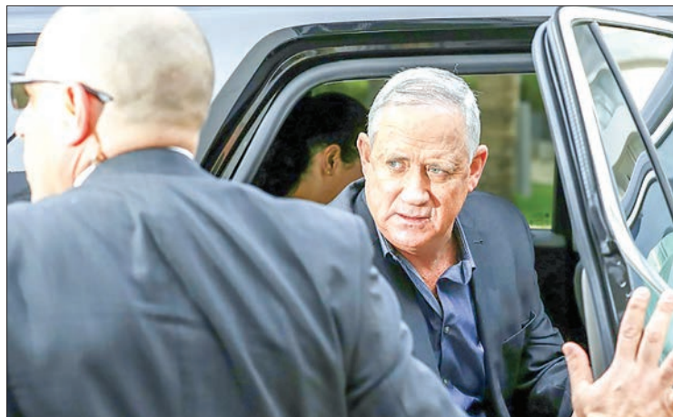
Prime Minister Benjamin Netanyahu's challenger Benny Gantz had previously received no protection from Israel's Shin Beth security agency.

But Gantz does not officially have that title as the country