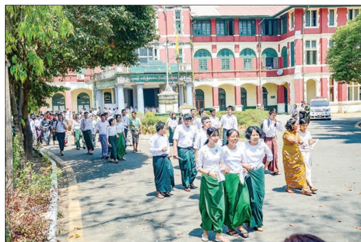
School children are seen in Yangon after the first day of the Matriculation Exam yesterday.