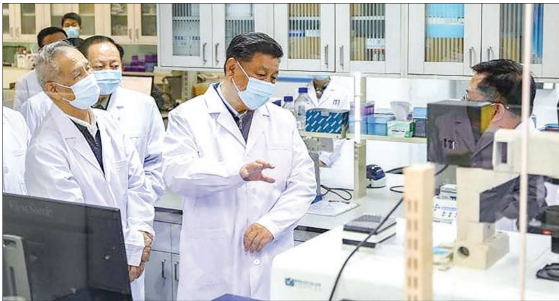
Chinese President Xi Jinping, centre, wearing a protective face mask, talks to a medical staff member during his visit to the Academy of Military Medical Sciences in Beijing. As the rest of the world grapples with a burgeoning virus outbreak, China's ruling Communist Party has turned to its propaganda playbook to portray its leader as firmly in charge, leading an army of health workers in a "people's war" against the disease.