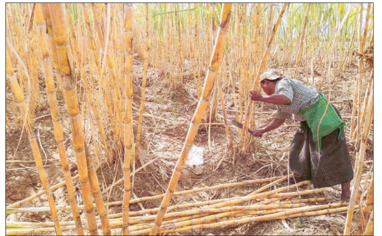
A farmer harvesting sugarcane in Myingyan Township.