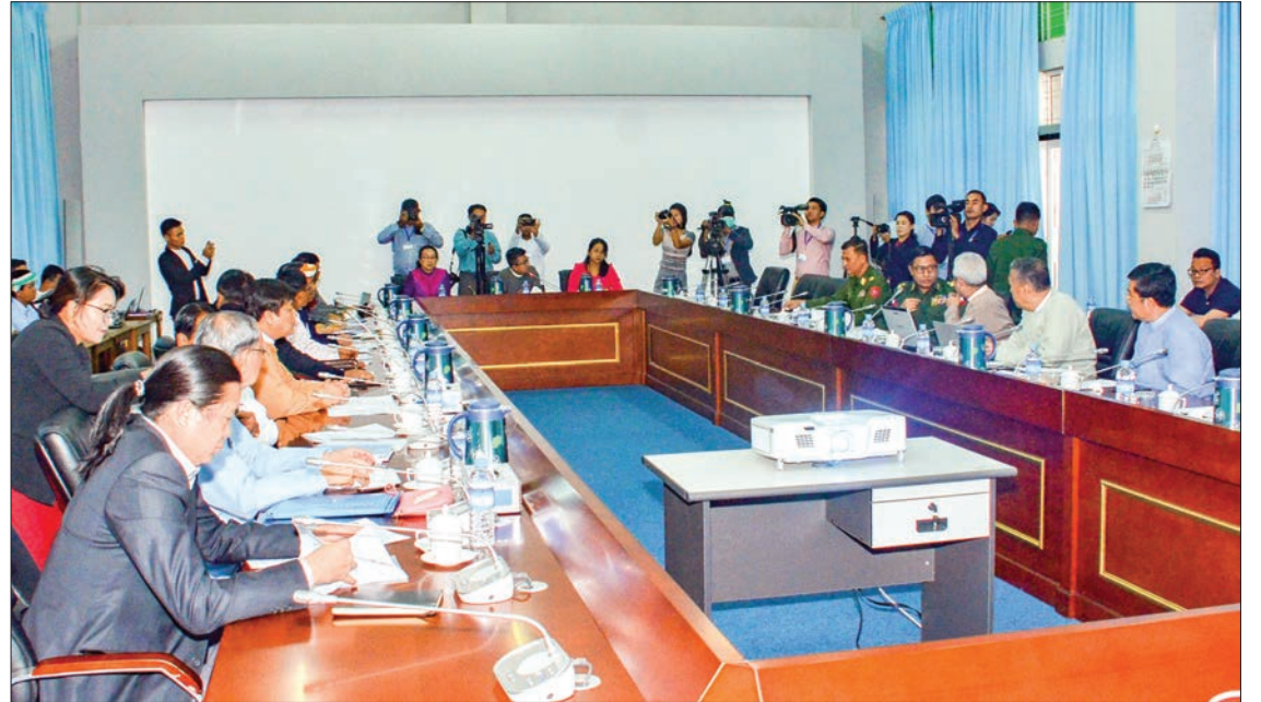
Secretaries of Union Peace Dialogue Joint Committee (UPDJC) hold 25 th meeting at the National Reconciliation and Peace Centre in Nay Pyi Taw yesterday.

They discussed matters related to substitutions of members and secretaries of UPDJC, resolutions of 8 th JICM meeting, political dia-