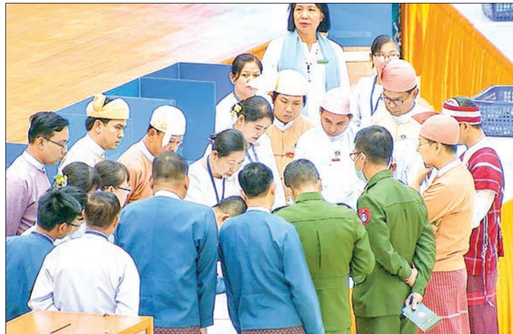
MPs observe counting votes on amending provisions of the 2008 Constitution.

for annulment of paragraph (c) of Section 20, paragraph (a) of Section 26, Section 39, paragraph (b) and (c) of Section 40 failed to pass 75 per cent supporting votes.