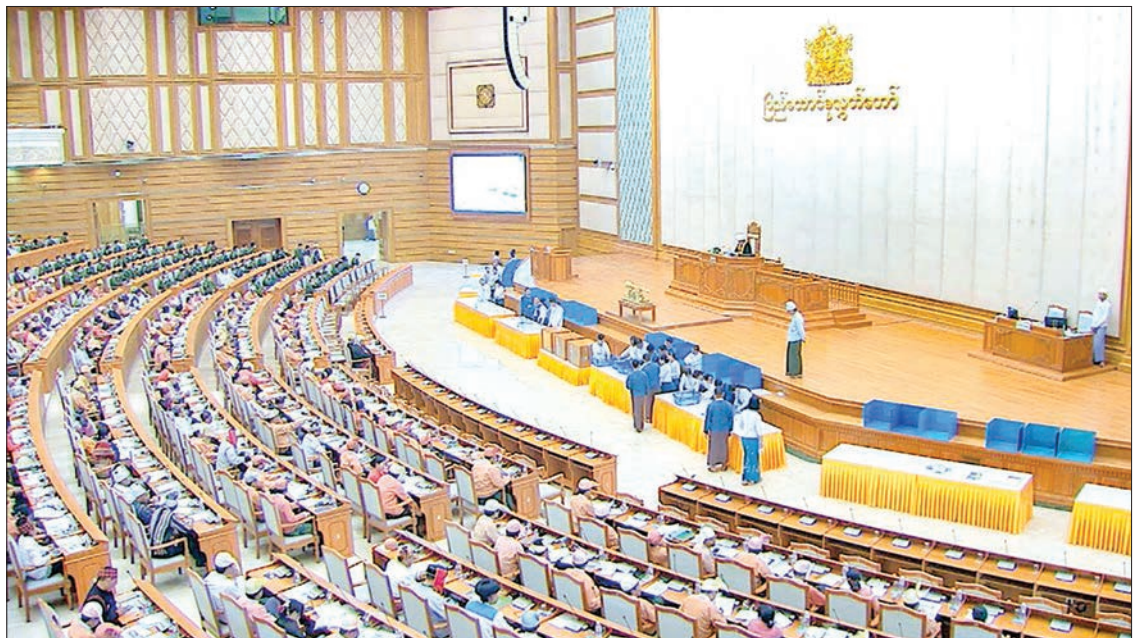
Pyidaungsu Hluttaw convenes its 19 th day meeting of 15 th regular session yesterday.

Proposals for amendment to Section 5 in relation to paragraph (a) of Section 436, paragraph (d) of Section 6, paragraph (f) of Section 6, Section 7, Section 8, Section 14; proposals