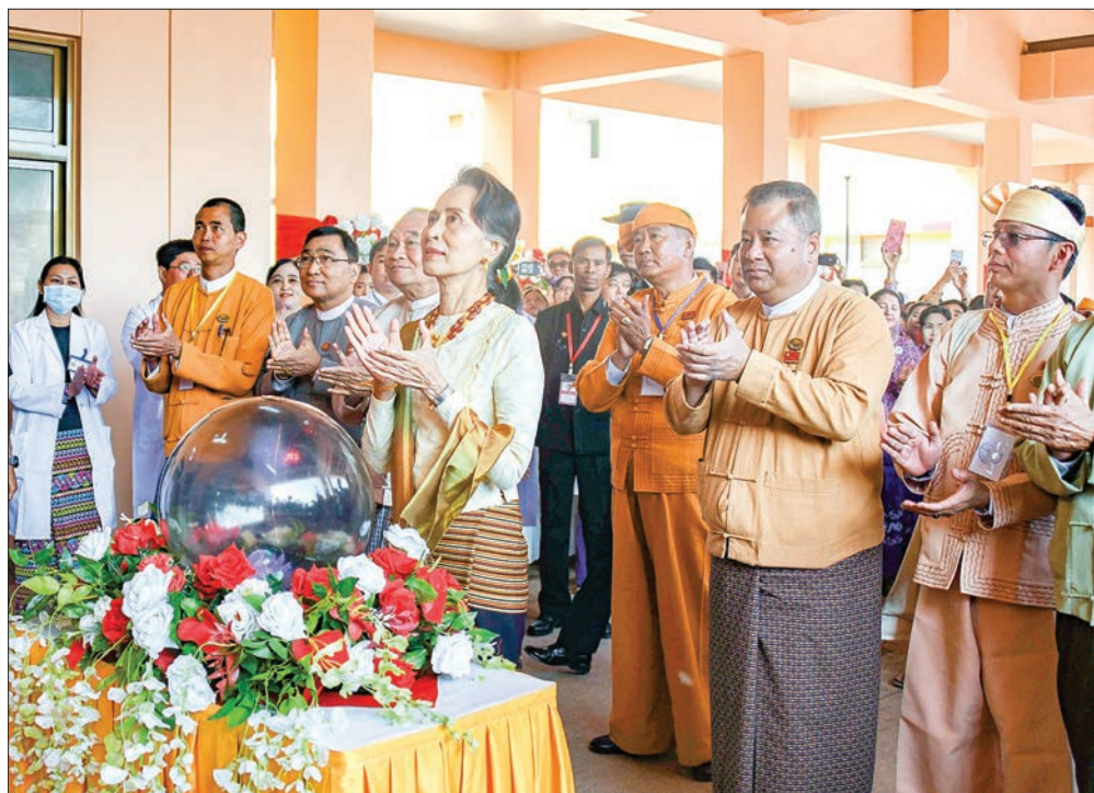
State Counsellor Daw Aung San Suu Kyi unveils the upgraded phase of Lashio General Hospital yesterday.