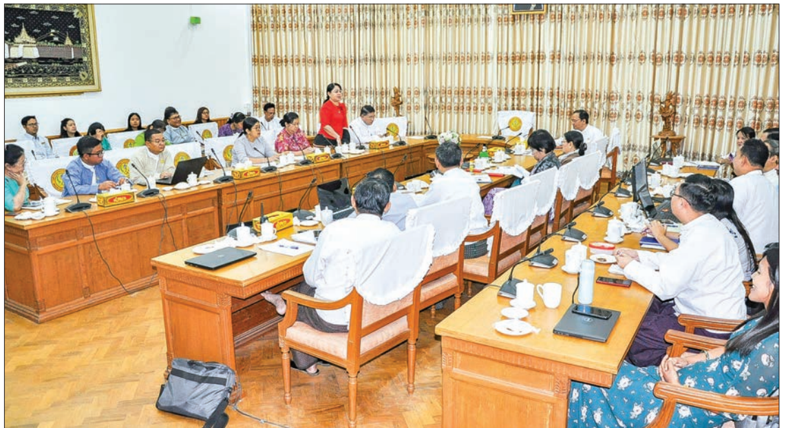
The daily meeting of the Ministry of Health and Sports is in progress at its office in Nay Pyi Taw yesterday.