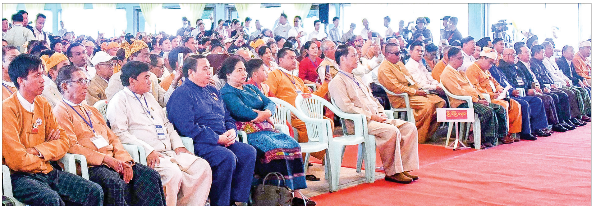
State Counsellor Daw Aung San Suu Kyi meeting with local people in Lashio, Shan State, yesterday.