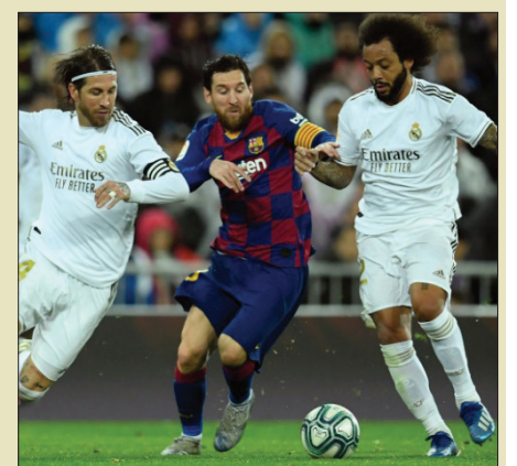
Barcelona and Real Madrid will play their next two games in La Liga behind closed doors.

La Liga said fixtures in Spain's top two tiers will go ahead in front of empty stands for the next fortnight following a decision that sporting events in the country at state and international level should be played without fans to limit the spread of the virus.