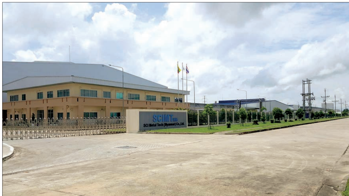
SCI Metall Tech Myanmar Co., Ltd. at the Thilawa Special Economic (SEZ).