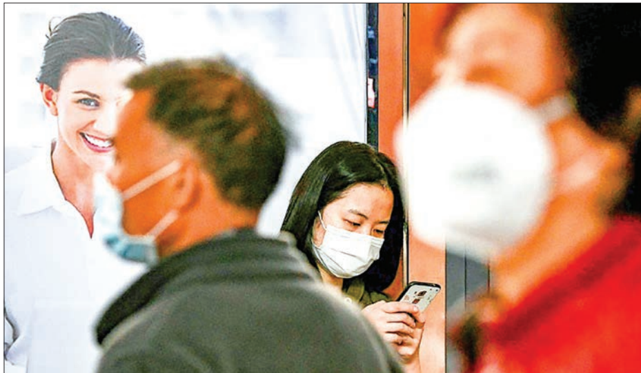
China reported the lowest daily number of new cases since reporting began in late January.

The World Health Organization warned there was a “very real” threat of a pandemic but its chief Tedros Adhanom Ghebreyesus said the planet was “not at the mercy” of the illness, which has so far killed more than 4,000 people.