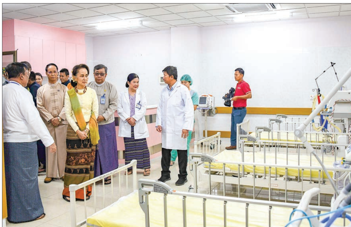
State Counsellor Daw Aung San Suu Kyi inspects the Lashio General Hospital.