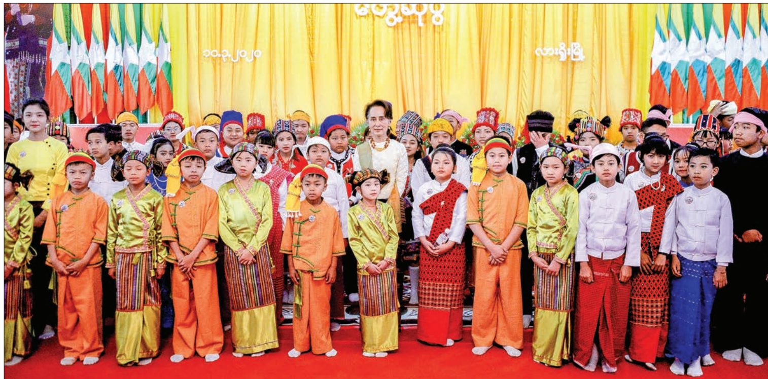
State Counsellor Daw Aung San Suu Kyi poses for group photo together with children in Lashio.

Ours is the government of the people that stands on the