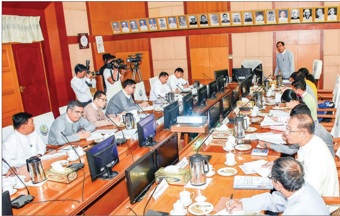
Chairman of the Central Committee for Drug Abuse Control's Public Awareness Committee, and Deputy Minister for Information U Aung Hla Tun delivers the speech at the coordination meeting at the Ministry of Information in Nay Pyi Taw yesterday.

U Ye Naing, Secretary of the Public Awareness Committee