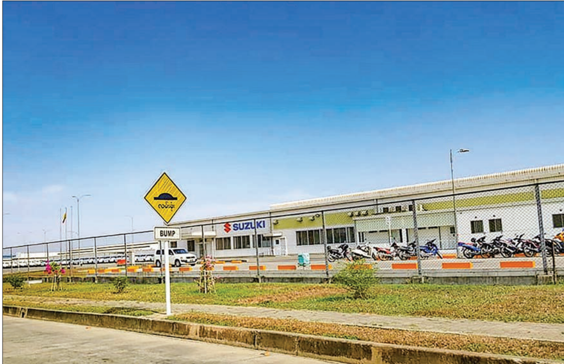
Suzuki Thilawa Motor Co Ltd plant at the Thilawa Special Economic Zone- A on the outskirts of Yangon.