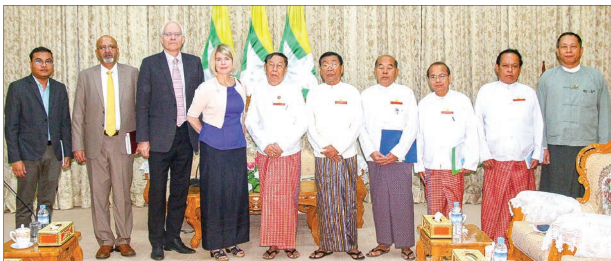
Union Election Commission meeting with the delegation from International Institute for Democracy and Electoral Assistance.