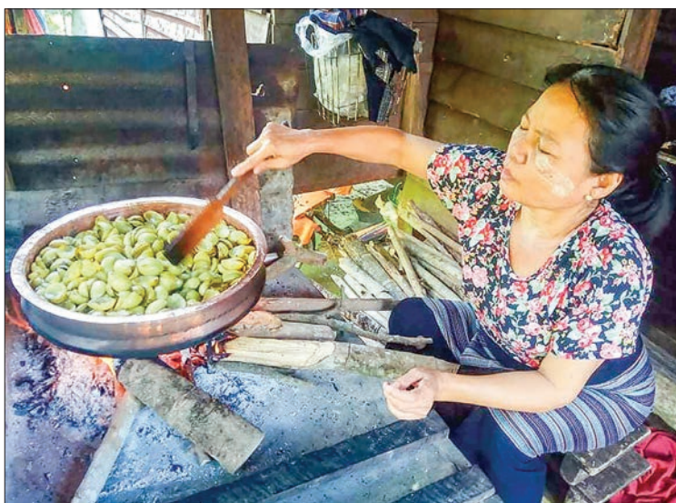
A woman cooks halved marian in the pan to make jam.

"This year, plum mango yield has been rather high, allowing plum mango jam-makers to purchase a large volume of the fruits. There are two kinds of fruit used to make plum mango jam, which have different prices. The estimated price of plum mango is K5,000 per basket. We sell them to plum mango traders and they sell them back to jam-makers. The price of plum mango jam is K10,000 per viss in the market. So, local growers are making plum mango jam whenever they have free time. To make