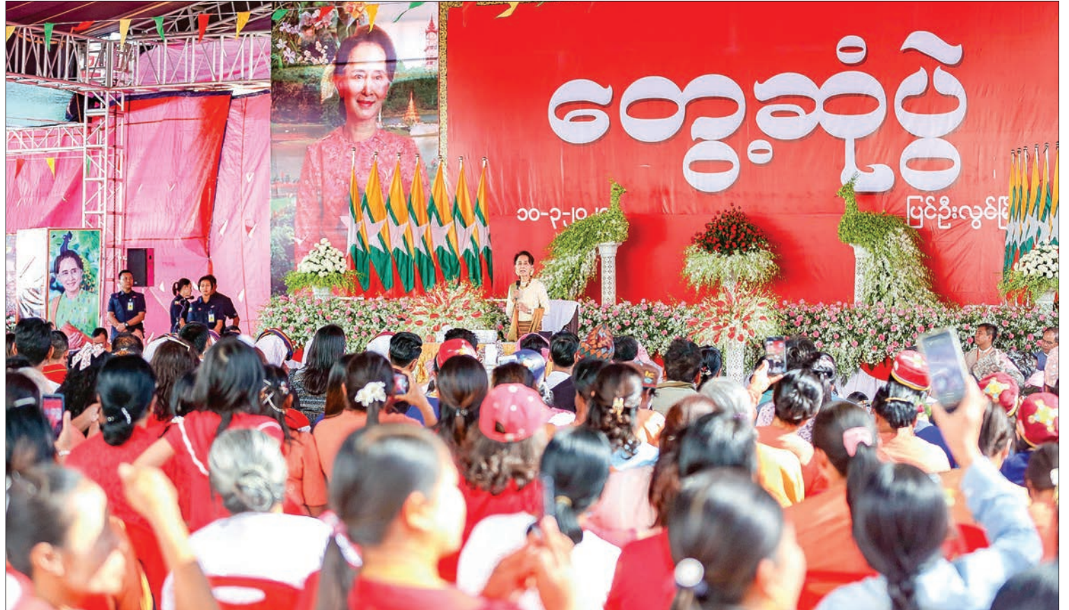
State Counsellor Daw Aung San Suu Kyi speaks at the public meeting in PyinOoLwin.

People also requested for improvement of transport sector which is fundamental to the development of the country. A good transportation is required