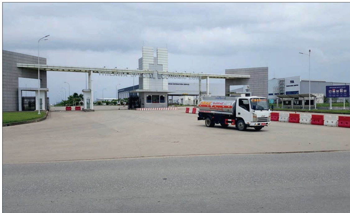
The No. 1 entrance gate of Thilawa Special Economic Zone (SEZ).

of Japanese ODA loans. Once completed, the new facility will facilitate better flows of goods to Thilawa SEZ. In addition, commodities produced in Thilawa SEZ can be transported to different townships in Yangon Region in a rapid manner. Given its strategic location, Thilawa SEZ offers great opportunities