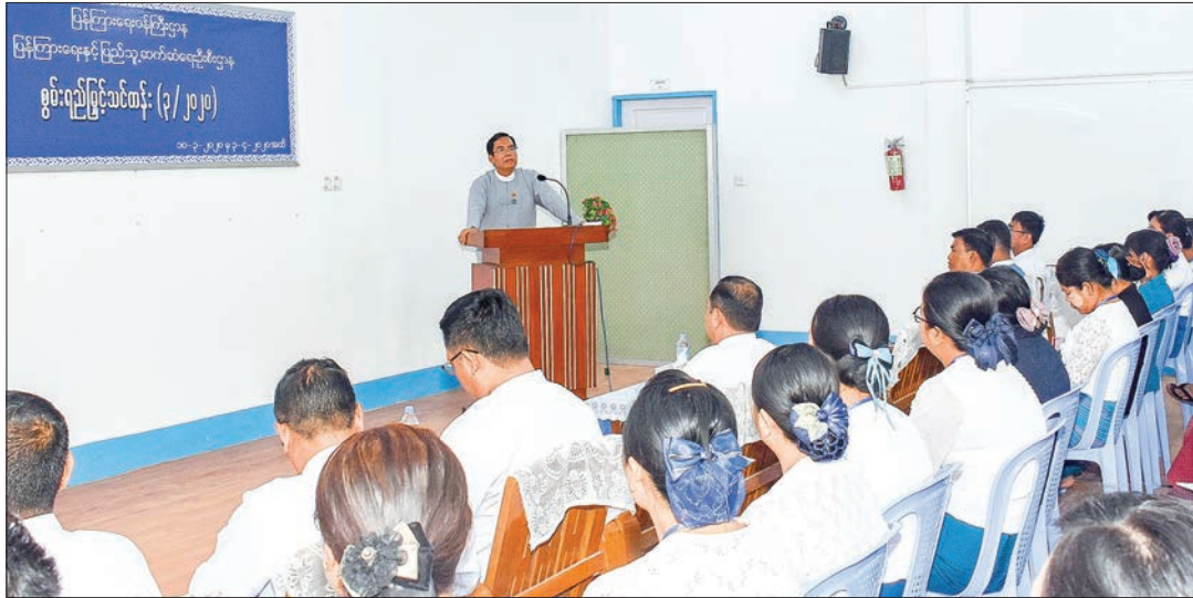
Deputy Minister for Information U Aung Hla Tun delivers the speech at the ceremony to open capacity-building course of IPRD in Nay Pyi Taw yesterday.

DEPUTY Minister for Information U Aung Hla Tun delivered a speech at the opening ceremony of capacity-building training course (3/2020) conducted by the Information and Public Relations Department at its office in Nay Pyi Taw yesterday morning.