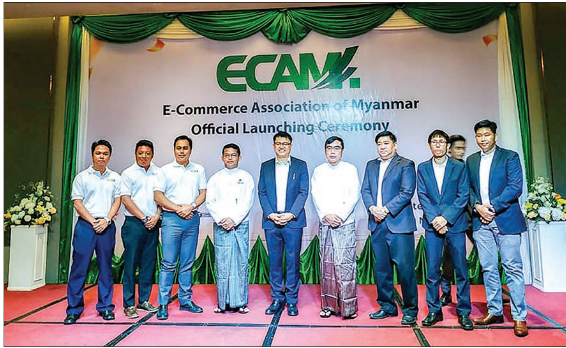
Attendees pose for a group photo at the official launching ceremony of E-Commerce Association of Myanmar (ECAM) at the Novotel Hotel on Pyay Road in Yangon yesterday.

ECAM will give priority to industrialization, contribute to