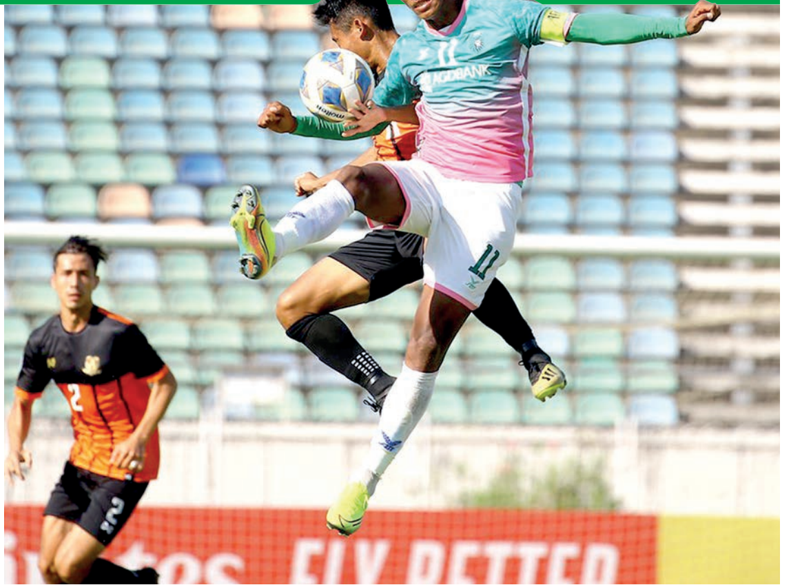
Players of Yangon United FC and Singaporean club Hougang United vie for the ball at the Thuwunna Stadium in Yangon on 10 March.