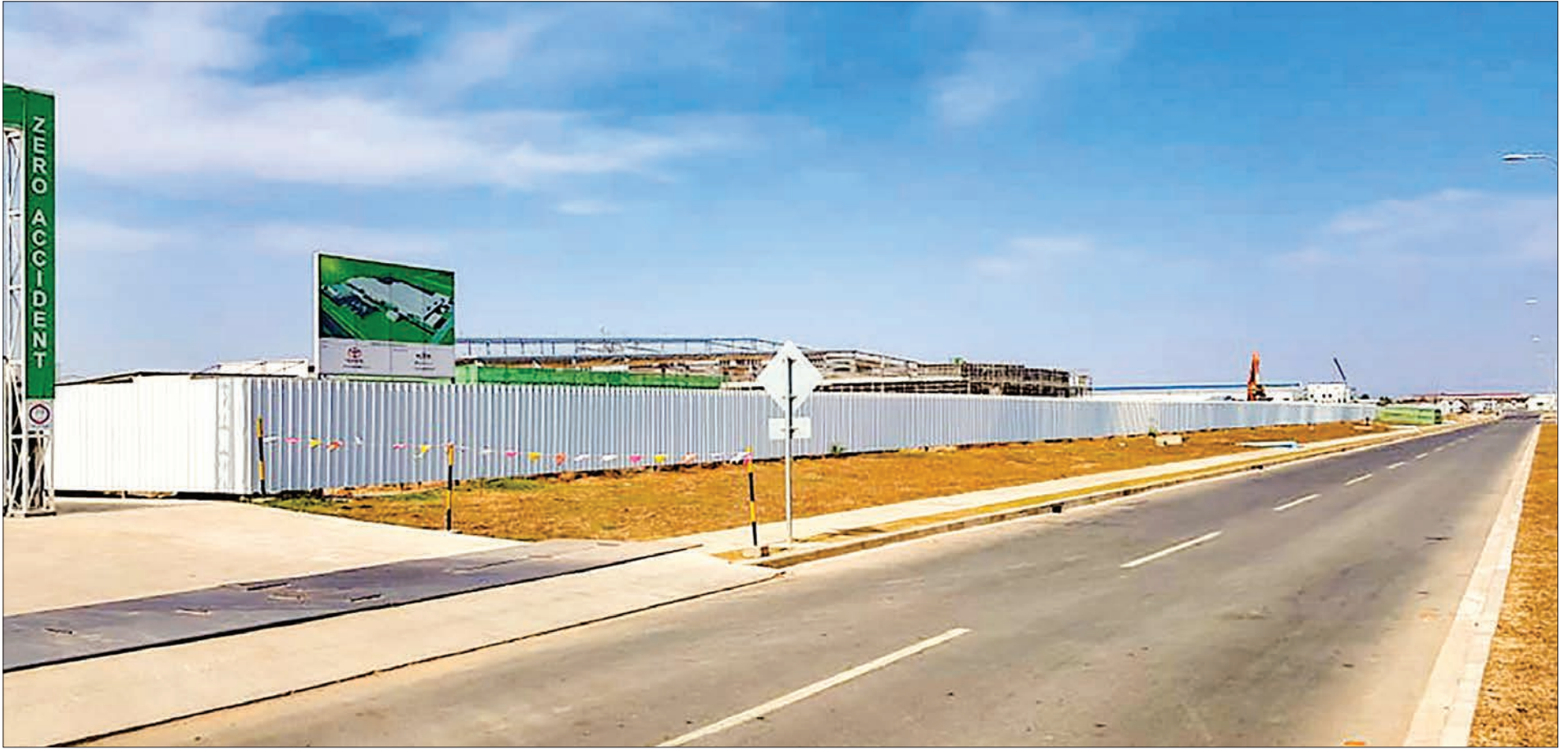
TOYOTA plant under construction in Thilawa Special Economic Zone - B.