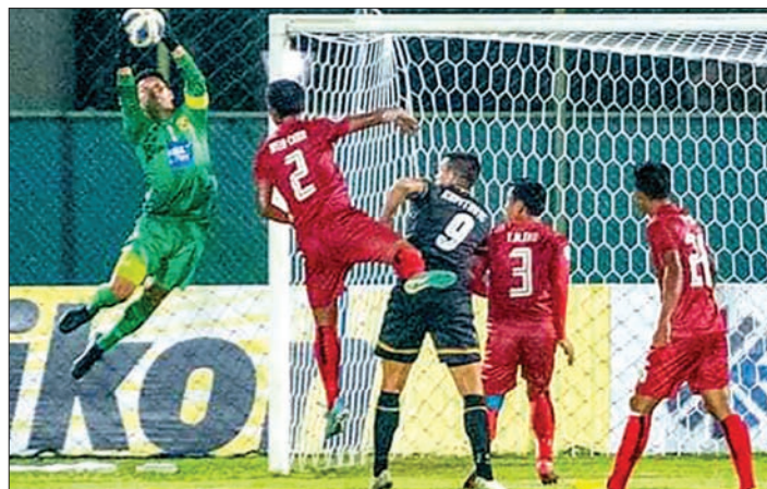
Players of Shan United (red) and Tampines Rovers (black) vie for the ball near the goal of Tampines Rovers club at the Jurong West Stadium in Singapore.