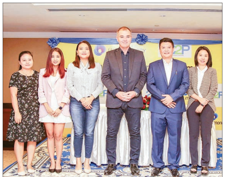
Officials pose for documentary photo after signing ceremony.

Wave Money is a pioneer in driving digital financial inclusion in Myanmar and continuing its expansion to support consumers and businesses. To date, there are over 17 million people in Myanmar using Wave Money's secure and reliable platform for remittances, utility payments, airtime purchase or top-ups, and various digital payments. —GNLM