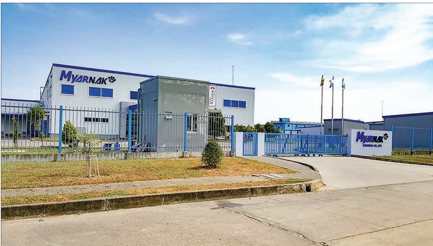
Myarnak Company Limited at the Thilawa Special Economic Zone - A.

The Thanlyan-Thilawa SEZ tarred road is 5 miles and 4 furlongs long, 46 ft wide and has drainage system on each side of the road. The Bago River crossing bridge (Thanlyan Bridge No-3) is under construction with the Official Development Assistance (ODA) loans from Japan. The new bridge measuring 1,982 meters in length is being built in three phases by spending some US$ 300 million