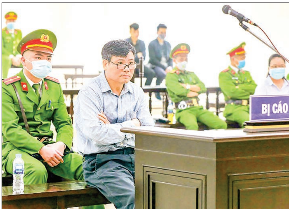
Vietnamese blogger Truong DuyNhat was a regular contributor to Radio Free Asia and a critic of the government.

RSF ranked Vietnam 176th on its 2019 World