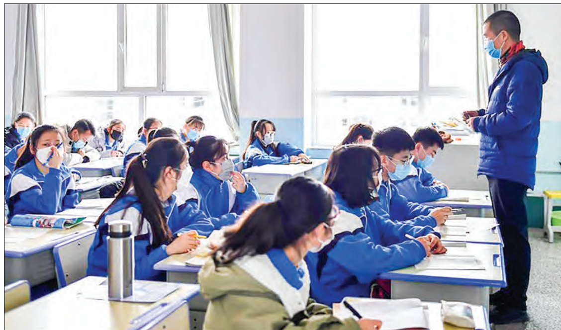
A teacher introduces the knowledge of epidemic prevention and control at Haidong No. 2 High School in Haidong City, northwest China’s Qinghai Province, on 9 March 2020.

The emergency response of Qinghai was lowered from the third level to the fourth level, the lowest in a four-tier response system, on 6 March. — Xinhua ■