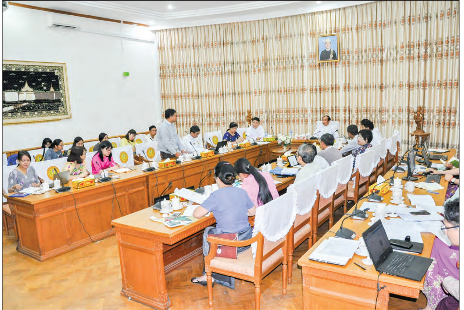
Union Minister Dr Myint Htwe hears reports at the coordination meeting yesterday afternoon on prevention of COVID-19.

Elder people and patients with chronic diseases