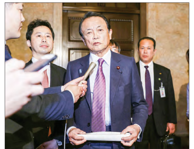
Japanese Finance Minister Taro Aso speaks to reporters in Tokyo on 9 March 2020.

The comment came as speculation grew in the foreign exchange market that Japanese authorities could move to stem the yen's sharp appreciation. A stronger yen undermines the price competitiveness of Japan-made products overseas and reduces profits earned abroad when repatriated.