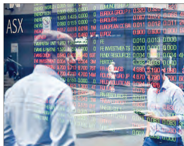
Australian stocks saw their worst day since the financial crisis.

"Markets were at breaking point before Saudi Arabia's decision to launch an oil price war, but this latest development