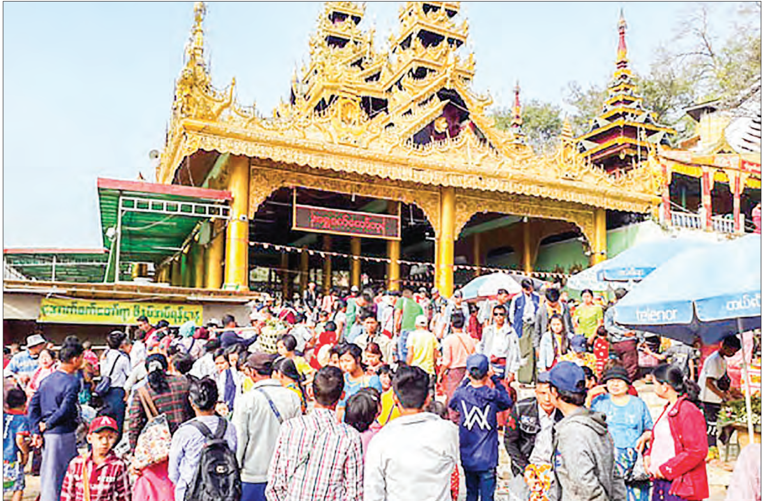
Mann Shwe Settaw Pagoda is crowded with people yesterday.

DEVOTEES, locals, and civil service personnel gathered around the Mann Shwe Settaw Pagoda festival on the Full Moon Day of Tabaung and during holidays.