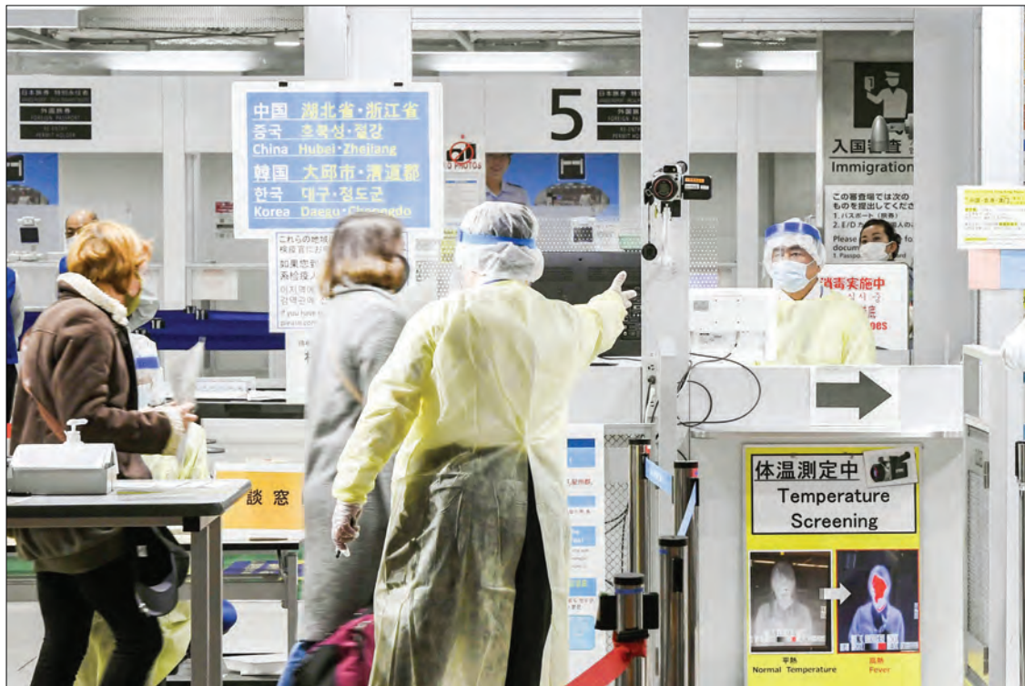
A quarantine officer (foreground) directs passengers arriving from South Korea through quarantine counters at Narita airport on 9 March 2020.