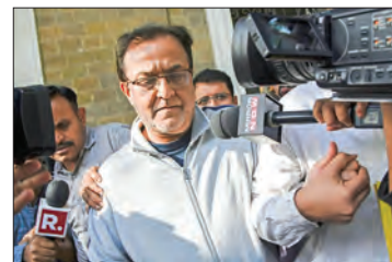
Rana Kapoor, the founder of India's Yes Bank, is pictured after his arrest in Mumbai.

MUMBAI (India) — The founder of India's Yes Bank was arrested on allegations of money laundering Sunday, amid efforts to formulate a rescue plan for the country's fourth-largest private lender.