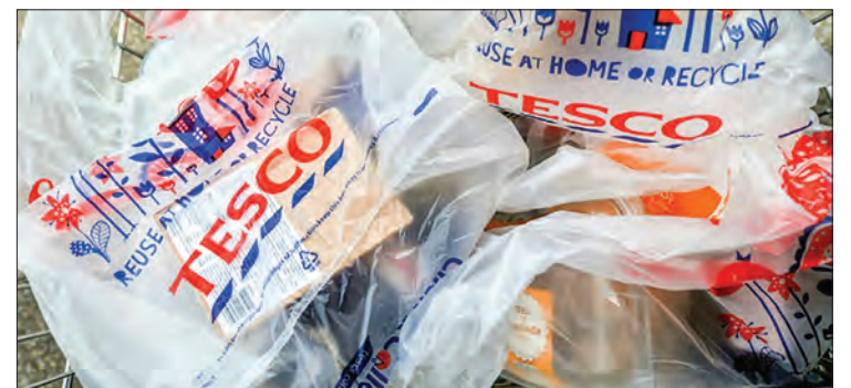
Britain’s biggest retailer Tesco is to sell its businesses in Thailand and Malaysia to Thai conglomerate CP Group.

The move was unanimously agreed by the Tesco board, but remains conditional on shareholder and regulatory approvals. The deal is set to complete in the second half of this year. The announcement comes as Dave Lewis prepares to step down in 2020, having overseen a major overhaul at Tesco during his five years at the helm, axing thousands of jobs as part of a massive cost-cutting programme.— AFP