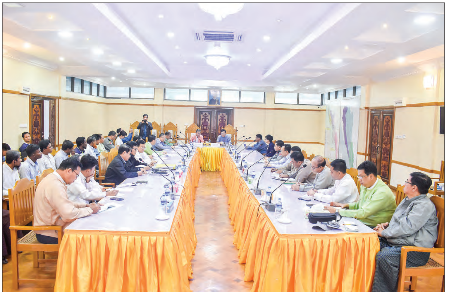
Union Minister Dr Win Myat Aye holds the meeting with Rakhine authorities and communities over implementation of recommendations by ICOE.

In his opening remark, the Union Minister explained the tasks of his office for implementing recommendations of ICOE in the areas of social cohesion; providing necessary assistance in collaboration with international donors to Rakhine, Muslim and other ethnic minorities who were displaced by the 2017 conflict; accelerating its implementation of the 'National Strategy on Resettlement of Internally Displaced Persons (IDPs) and Closure of IDP Camps, resulting in the successful reintegration of the IDP's into society; re-examining the processes involved in the issuance of the National Verification Card (NVC) and its consequences through effective implementation and coordination of the ministries; ensuring equitable access to the delivery of education, health and all other essential services; removing