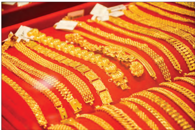
Gold jewellery displayed at a shop in downtown Yangon.