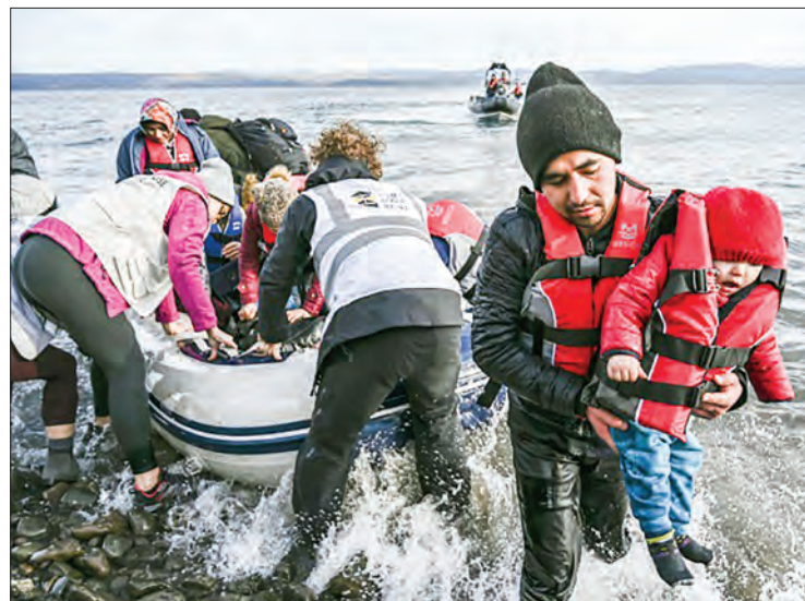
NGO members help refugees to disembark from a dinghy as it lands ashore the Greek island of Lesbos.

On Friday, Erdogan ordered the Turkish coastguard to prevent risky Aegean sea crossings after more than 1,700 migrants landed on Lesbos and four other Aegean islands from Turkey over the past week. The coastguard however said Turkey’s policy of allowing migrants and refugees to leave by land was untouched, and the instruction only affected sea crossings.—AFP ■