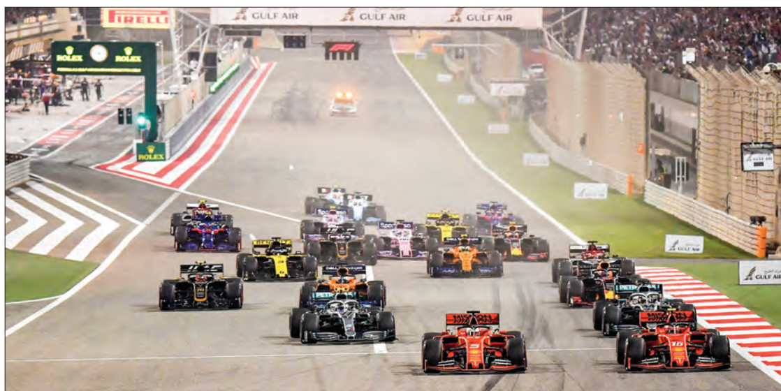
In this file photo taken on 31 March 2019, drivers steer their cars after the start of the Formula One Bahrain Grand Prix at the Sakhir circuit in the desert south of the Bahraini capital Manama.

He said the only Ferrari people not arriving from Italy were drivers Sebastian Vettel and Charles Leclerc, who were heading from Switzerland and France respectively.— AFP ■