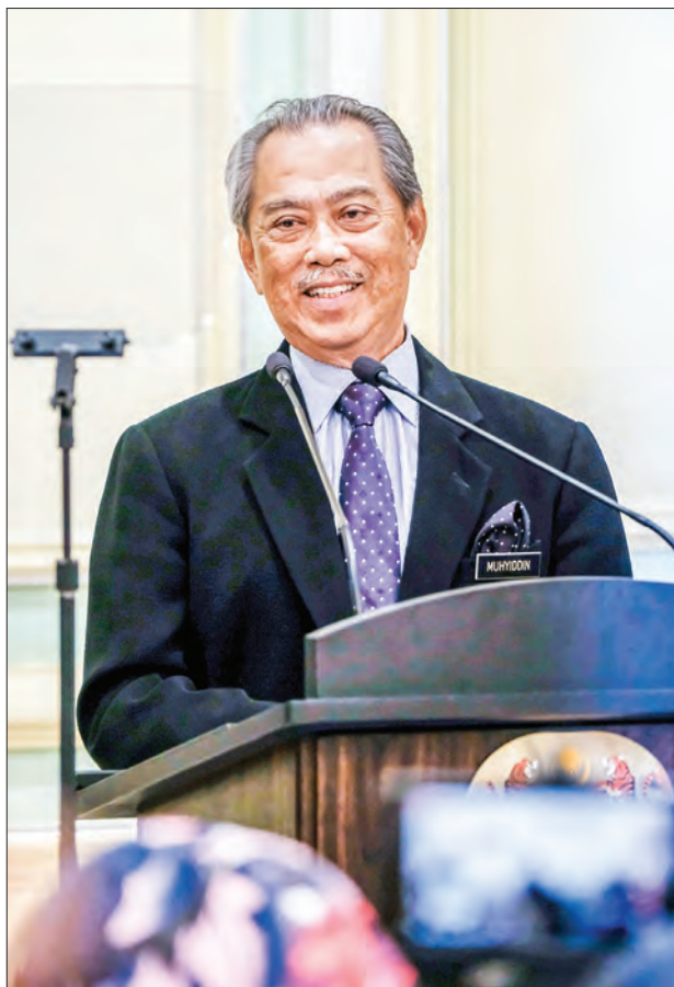
Malaysia's new prime minister Muhyiddin Yassin.

KUALA LUMPUR—Malaysia's new prime minister, Muhyiddin Yassin appointed his Cabinet on Monday, tapping a banker to be finance minister while rewarding politicians helped him wrestle the reins of government from Mahathir Mohamad, including figures from the scandal-tainted United Malays National Organization.