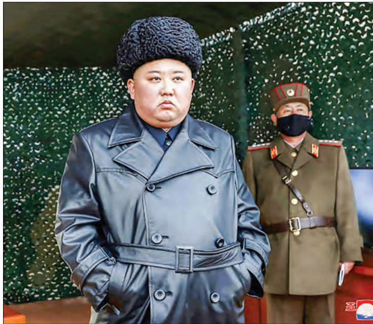
Kim Jong Un oversaw a Korean People’s Army ‘long-range artillery’ drill at an undisclosed location.

Three projectiles fired successfully from a single Transporter Erector Launcher (TEL) would be “a new milestone” for the North’s short-range ballistic missile programme, tweeted