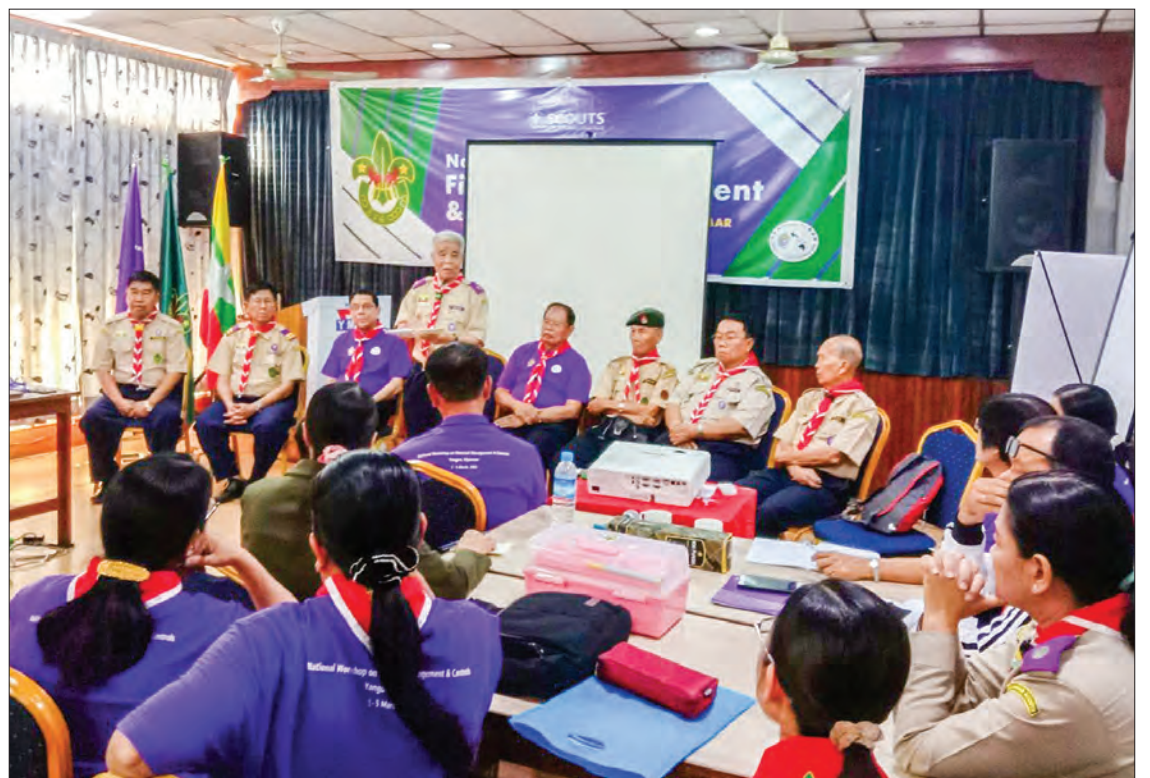
Myanmar Scout Association holds the meeting over its work plans.