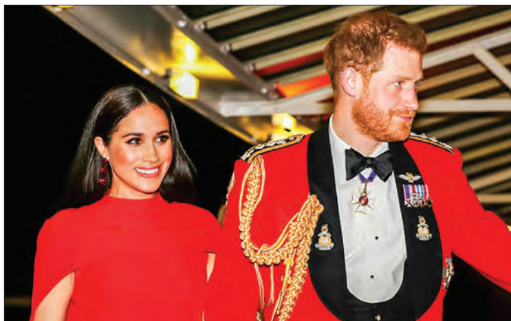
Prince Harry and wife Meghan, Duchess of Sussex, will join other royals members Monday at a Commonwealth Day ceremony at Westminster Abbey, their last official appearance before stepping back from their roles at the end of March.

LONDON (United Kingdom) — Prince Harry and his wife Meghan will make their last official appearance as senior royals on Monday, joining Queen Elizabeth II for an event in London before they set off on their own.