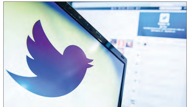
Twitter has started implementing a new policy that clearly labels manipulated content.

The footage was later retweeted by Trump and had been viewed nearly six million