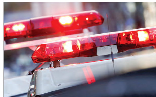
File photo taken on 12 April 2019, in Tokyo shows red lights of police cars.

Yoshiya Tateyama, a 56-year-old Canadian national hailing from Japan's southwestern prefecture