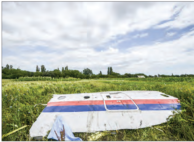
Most passengers on the doomed flight were Dutch.