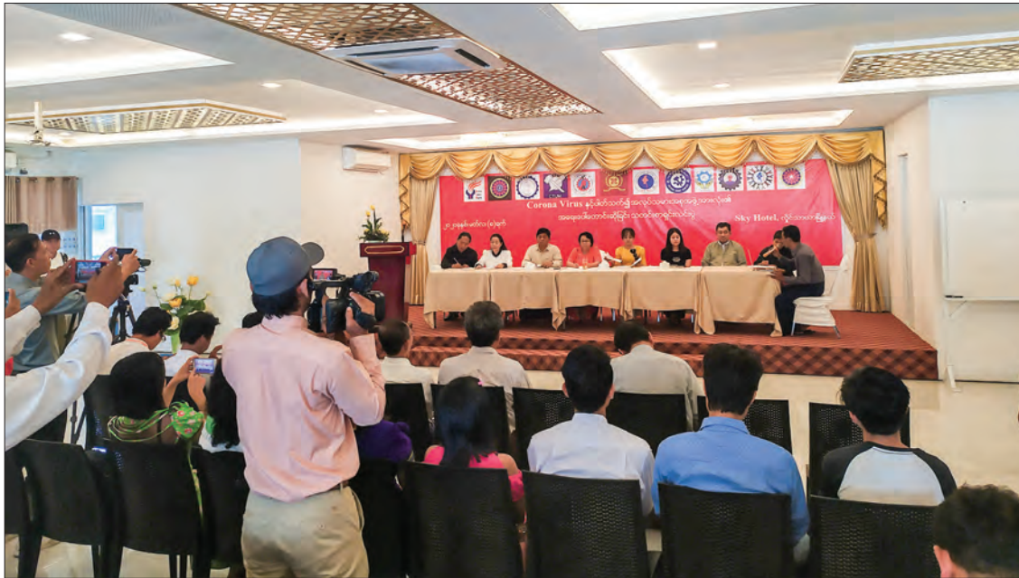
Labour organizations hold press Conference on factories closure after COVID-19 outbreak at the Sky Hotel in Hlinethaya, Yangon yesterday.

The 12 workers' groups answered questions at the press conference. They called for the formation of an inspection group to look into the shortage of raw materials, and asked the authorities to govern volatile commodity prices, authorize the inspection group, and provide guidelines on preparations for a possible virus outbreak.