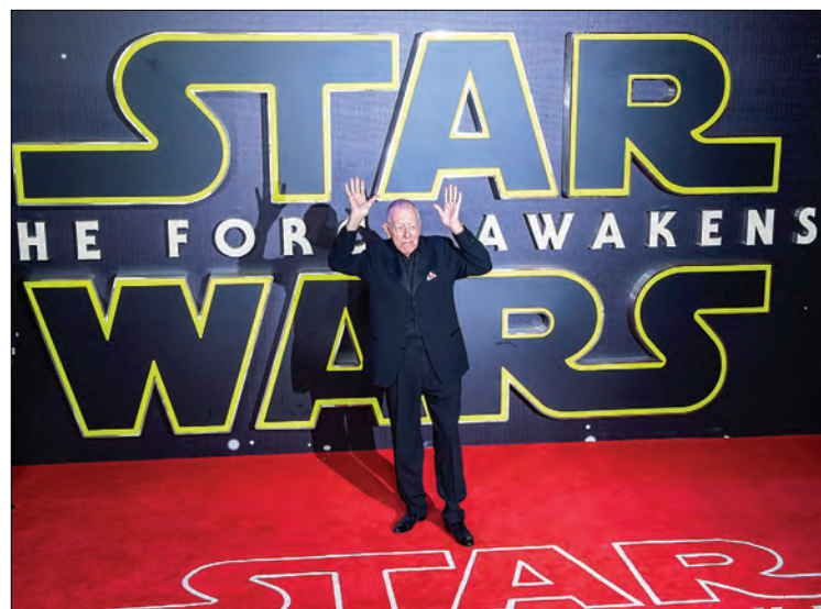
In the file photo, Swedish actor Max von Sydow poses for a photo at the opening of the European Premiere of “Star Wars: The Force Awakens” in central London on 16 December 2015.