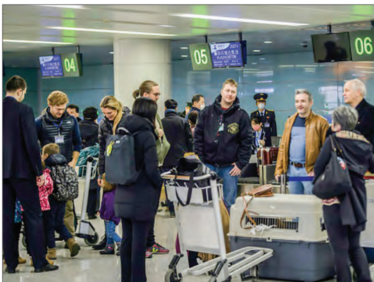
Foreign diplomats, embassy staff and their families check-in for a flight to Vladivostok at Pyongyang International Airport.

The number of coronavirus cases has risen worldwide to more than 100,000 across 100 nations and territories, with around 3,800 dead. —AFP ■