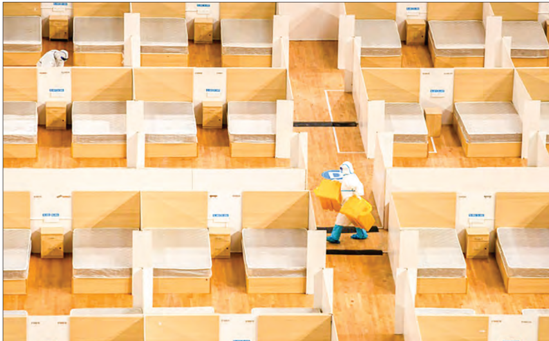
A staff member removes waste after the final patients were discharged from a temporary hospital set up to treat people with the COVID-19 coronavirus in a sports stadium in Wuhan.

On Monday, all the new cases in the province were in the capital city Wuhan, where the