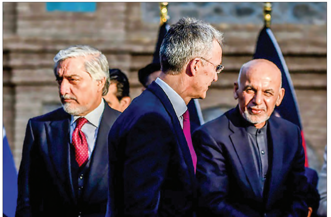
Many Afghans are left despairing for their country's future over the game of thrones between Abdullah Abdullah (L) and President Ashraf Ghani (R), pictured with NATO Secretary General Jens Stoltenberg.