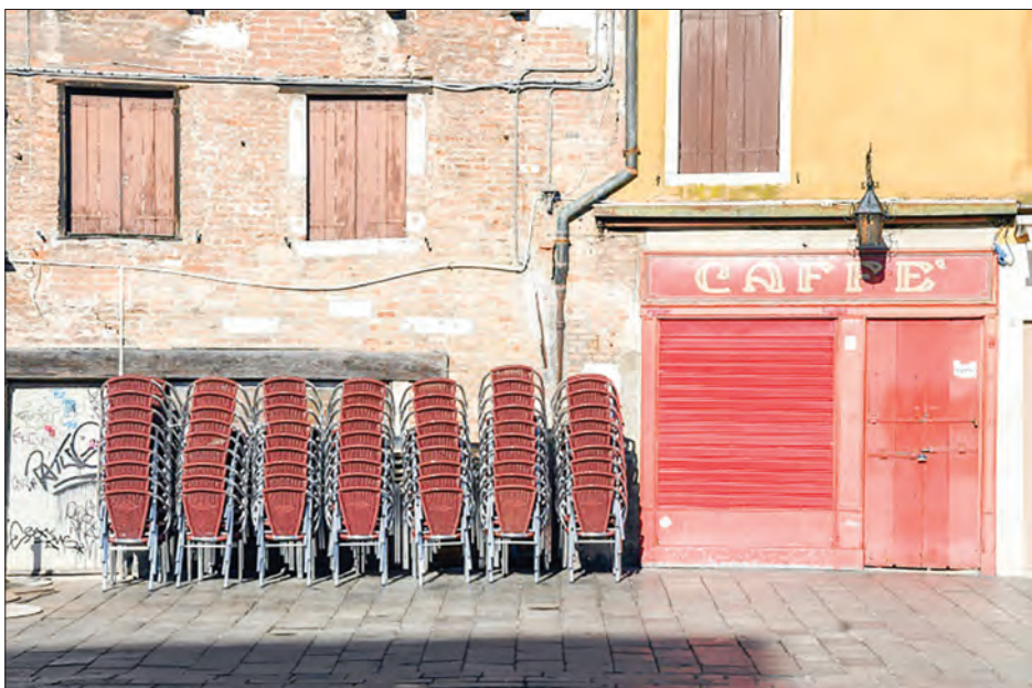
A closed bar in Venice, as large parts of northern Italy go into lockdown to prevent the spread of the virus.

"I have decided to remain at my home in Texas this week, until a full 14 days have passed," he wrote on Facebook, adding he had no symptoms. —AFP ■