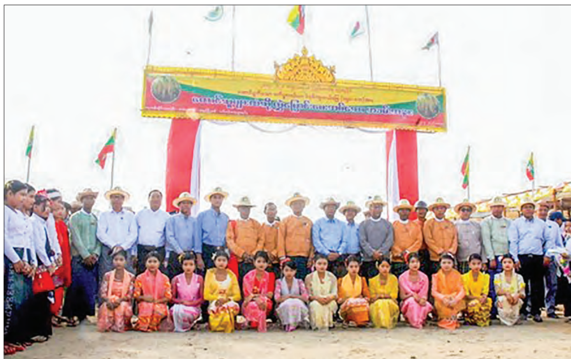
Deputy Minister U Hla Kyaw, officials, and attendees pose for a group photo at the ceremony to hand over 150-acre farmlands to farmers for development of mechanized agriculture in Pettan village of Zalun township, Hinthada District, Ayeyawady Region on 7 March.

the local farmers from Tayokyoe and Tingote villages in Pettan village-tract. They have developed 150-acre mechanized farming. This event is to hand over it to the farmers. The State is supporting them and they also need to col-