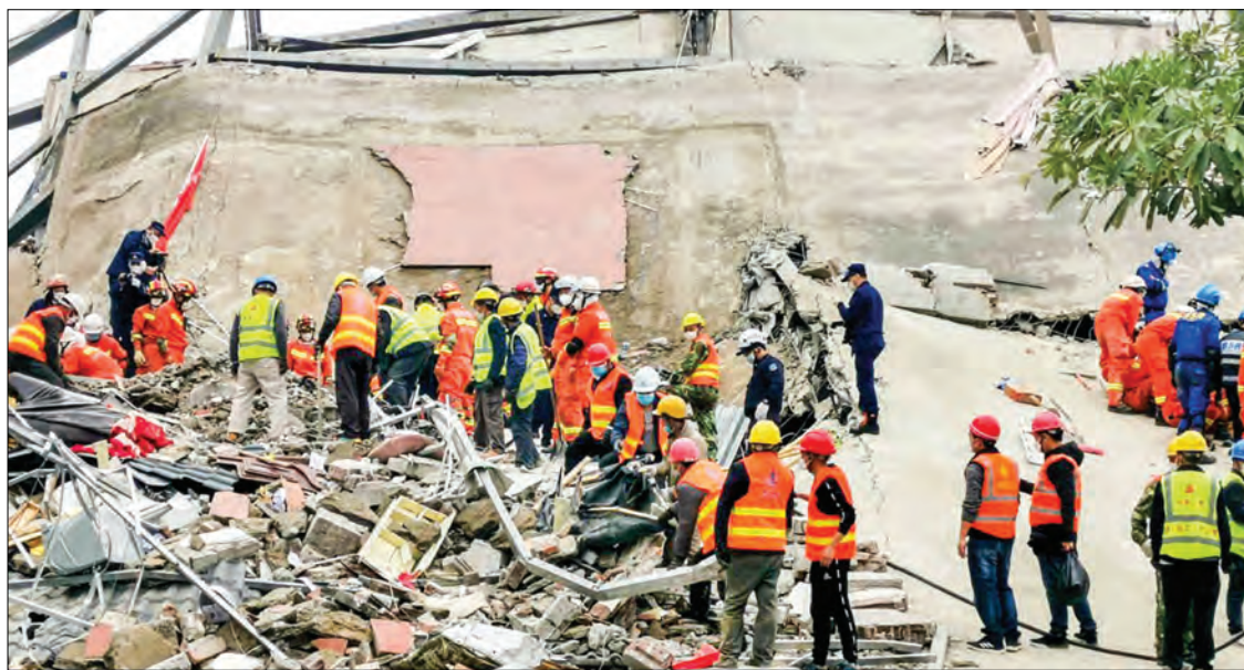
Supplied photo shows the collapsed Xinja Express Hotel in Quanzhou in southeastern China's Fujian Province.

HONG KONG — Ten people have been confirmed killed in the collapse of a hotel used as a coronavirus quarantine facility in southeastern China's Fujian Province, local media reported Sunday. A total of 48 people have been rescued and 23 others remain trapped in the rubble of the Xinja Express Hotel in the coastal city of Quanzhou, the official Xinhua News Agency reported.