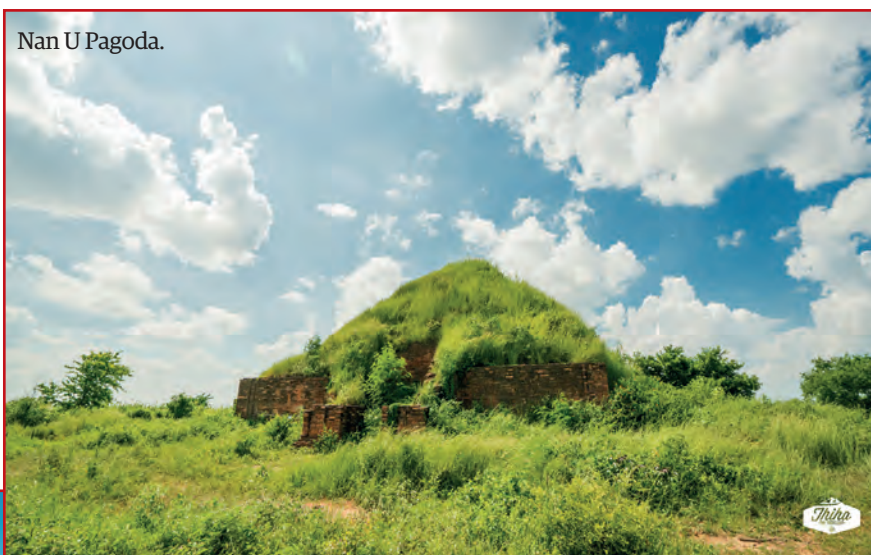
Nan U Pagoda.