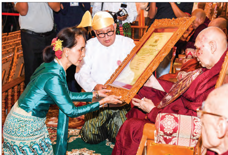
State Counsellor Daw Aung San Suu Kyi presents the title of Abhidhaja Maharattha Guru to the leading monk of Pan Ngwe Yon monastery in Madauk, Nyaunglebin.

RELIGIOUS titles were presented to honour the Buddhist monks, nuns and lay devotees for 2020 on the Full Moon Day of Tabaung yesterday at the Sasana Maha Beikman in Uppatasanti Pagoda compound, Nay Pyi Taw. President U Win Myint and First Lady Daw Cho Cho, and State Counsellor Daw Aung San Suu Kyi led the congregation to present honorary titles and offertories.