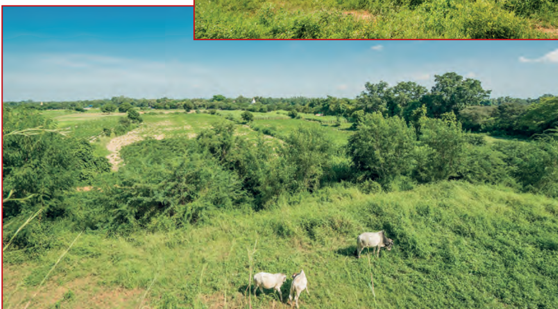
Landscape of Pinya Sakar-in village.

gan. These were double caves. The stone plaques found in the cave mentioned that King Uzzana donated land plots for three great caves.