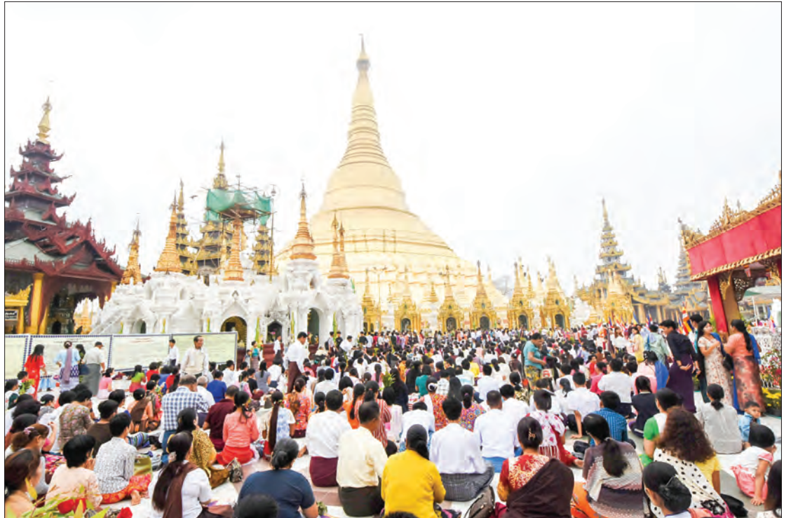
The ceremony to mark 2608 th anniversary Tabaung Festival of Shwedagon pagoda being held on the Full Moon Day of Tabaung yesterday.

During the merit-sharing ceremony, a senior monk delivered the nine moral precepts to congregation. After the offertories have been donated to the monks, the Buddhist devotees shared the merits. On the Full Moon Day of Tabaung, pilgrims flocked to the significant pagodas in Yangon and other areas of the country for merit-makings.—MNA