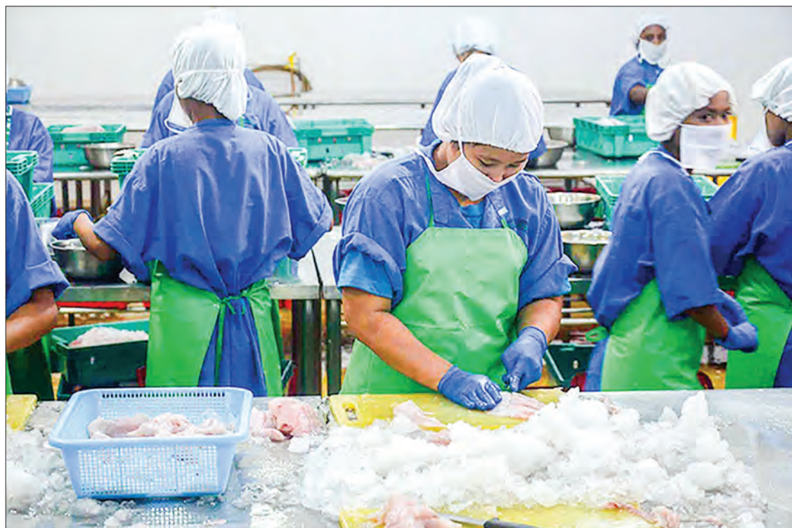
Workers work at a fish processing factory in Yangon.