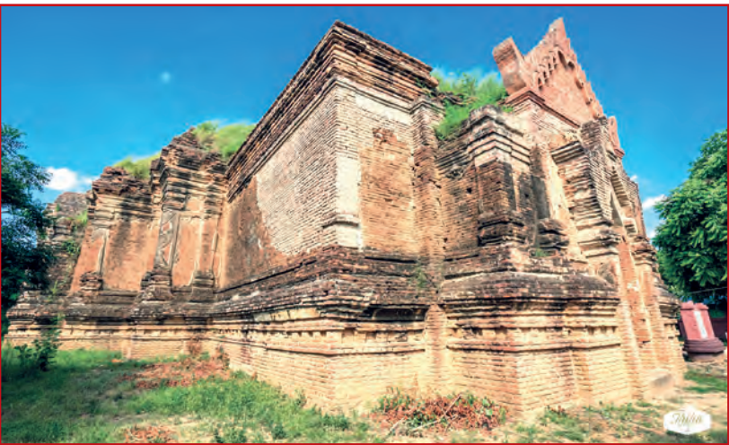
One of the three great caves in Pinya.

I faced difficulties to search the royal palace site. I asked the village administer at his residence for location of the royal palace site. Thanks to him, I found the royal palace site after walking along a fur-long route beside a dragon fruit farm, north of three great caves. Firstly, I found a mound of a collapsed pagoda. Then, I saw a post bearing a directive to the royal palace site. The archaeologist team recorded an inscription on the post, mentioning that the two-month excavation was conducted at the royal palace site in 1994. It was reported that the royal palace area was on more than 120,000 square feet of land. Many buildings of the royal palace were connected with Samok building and Sanu building in accord with the tradition of ancient Myanmar kings. That was why the royal palace might be formed with more than 10 buildings but all the buildings were burnt down.