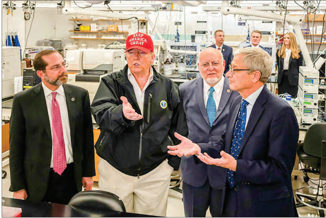
US President Donald Trump insisted during a visit to the Centers for Disease Control and Prevention the risk of having many people in close proximity “doesn’t bother me at all”.

Trump’s remarks came as the number of cases confirmed across the United States leapt past 400, with 19 deaths confirmed so far, mainly in the west coast state of Washington.