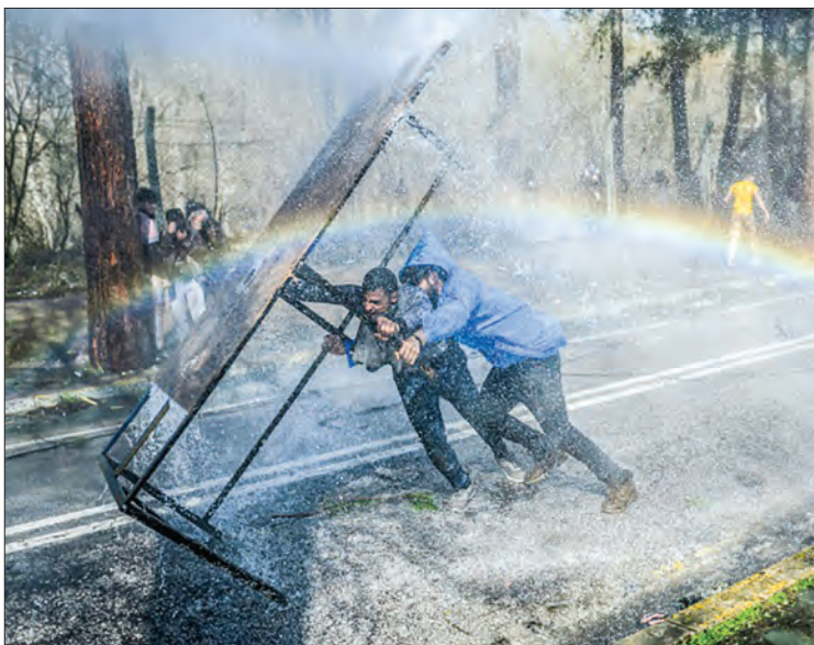
Struggling to deal with a new wave of arrivals, Greece, says it proved its humanitarian credentials during the 2015 migrant crisis, and now blames Turkey for encouraging migrants to leave for the European Union.

Athens sees Ankara’s decision to open the exit gates as “a political weapon,” whose result was to see some 13,000 people congregate inside 48 hours on the border post at Kastanies.—AFP