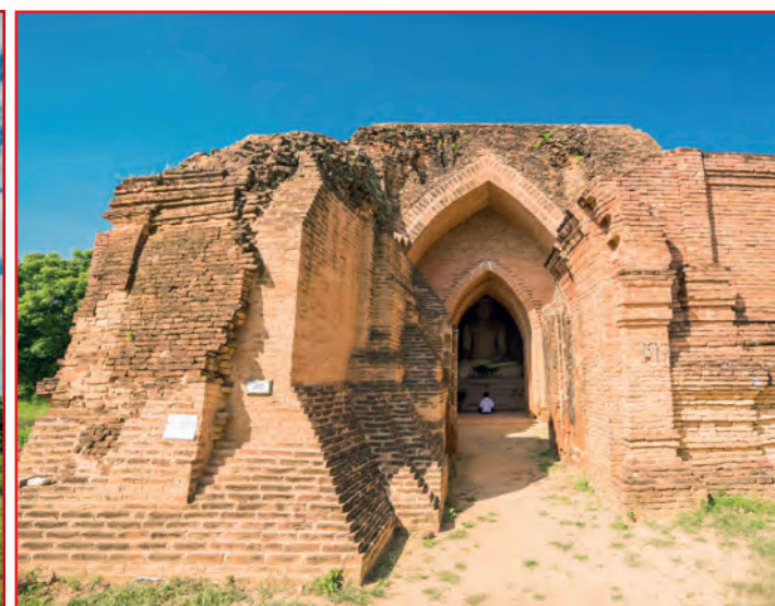
One of the ancient caves.