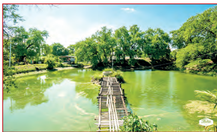
Lake in Sakar-in village.

mar's dry regions. It is sure that if tourist destinations and domestic industries can be exposed in nearby villages, Pinya will have attractiveness to local travellers and globetrotters.