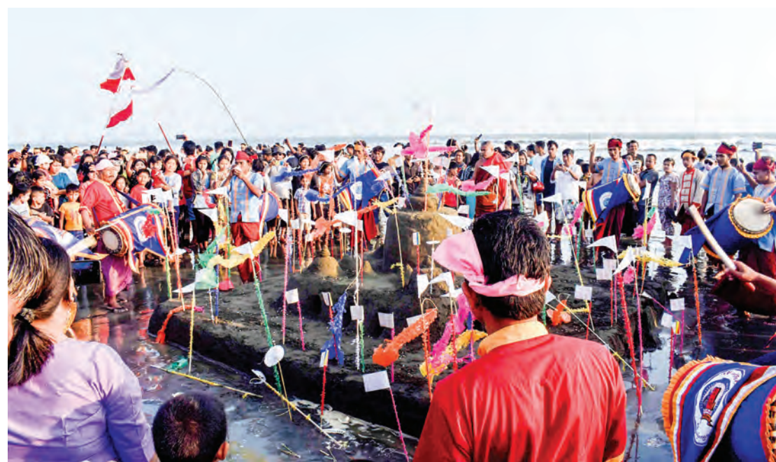
Rakhine ethnic people hold the traditional sand pagoda on the Ngapali beach yesterday.

(Mandalay Sub-printing House) (Translated by Aung Khin)