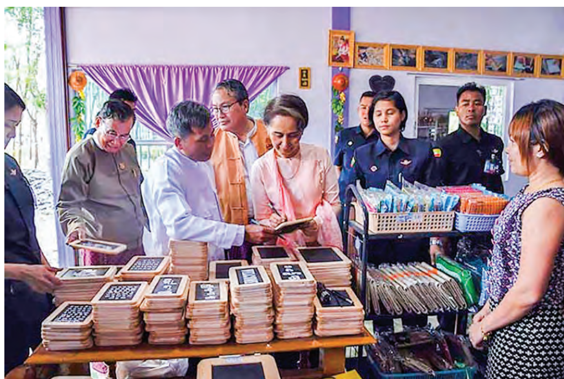
State Counsellor Daw Aung San Suu Kyi visits a shop selling slate tablets during her visit to Ywalut Village, Chaungzon Township in Mon State on 4 April, 2019.