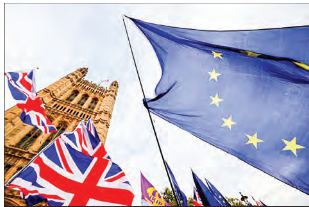
Britain unveils its first post-Brexit budget, promising increased public service spending and an end to a decade of austerity.

LONDON — Britain unveils its first post-Brexit budget on Wednesday, with Prime Minister Boris Johnson expected to press ahead with major spending on infrastructure while also addressing the fallout from the coronavirus outbreak.