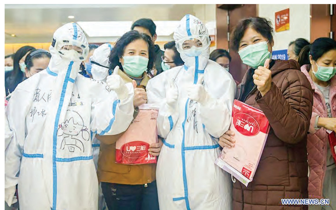
Patients and medical workers pose for a group photo during an event celebrating the International Women's Day in a makeshift hospital in Wuchang District of Wuhan, central China's Hubei Province, March 8, 2020.

Japan is scrambling to contain COVID-19, the disease caused by the new coronavirus months before the Tokyo Olympics and