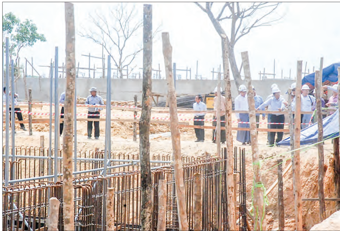
Deputy Minister U Hla Kyaw and officials inspecting the preparations for prevention of flood and other rural development programmes on 6 March.

He also looked into construction of rural road in Kandaungtyi