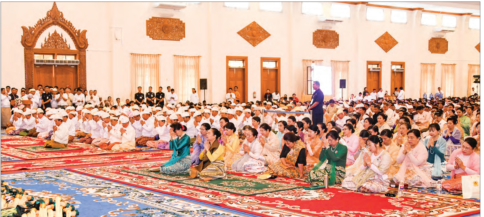
The congregation led by President U Win Myint and State Counsellor Daw Aung San Suu Kyi attend the ceremony to confer religious titles on the outstanding Sayadaws, nuns and lay persons in Nay Pyi Taw yesterday.