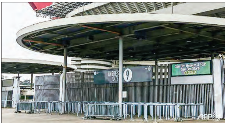
Serie A was set to play its matches behind closed doors until Apr 3 before Spadafora's demand.

On Wednesday, the league was ordered to play matches behind closed doors until April 3 as part of broader measures imposed nationwide to limit crowds and fight the spread of the COVID-19 disease.—AFP ■