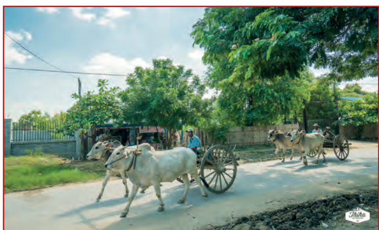
Traditional lifestyle of Sakar-in village.