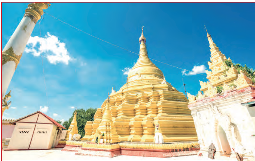
Yadana Myasikhon Pagoda.