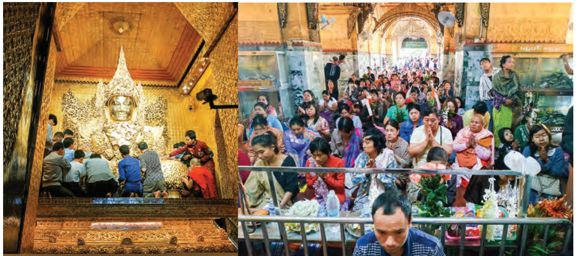
People paying homage to the Maha Muni Buddha Image in Mandalay on the Full Moon Day of Tabaung yesterday.

and temples were filled with the visitors for their meritorious deeds, including ritual chanting and meditation.—Tin Maung