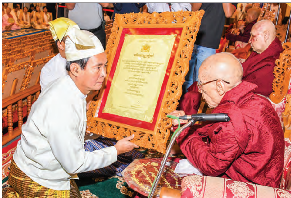
President U Win Myint presents the title of Abhidhaja Maharattha Guru to the presiding monk of Chaungdawn monastery in Myingyan.