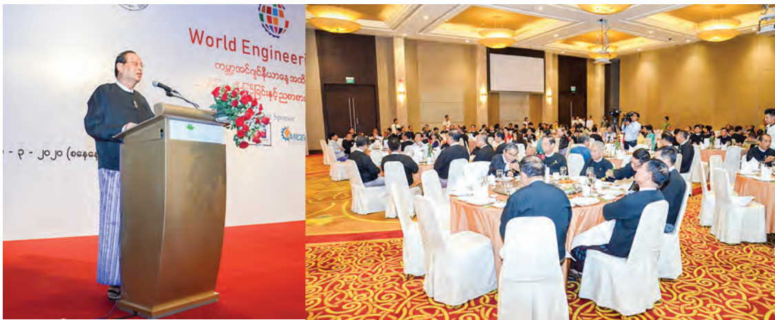
Union Minister for Electricity and Energy U Win Khaing delivers the speech at the awarding ceremony to mark World Engineering Day for Sustainable Development at the Thingaha Hotel in Nay Pyi Taw yesterday.

FEDERATION of Myanmar Engineering Societies and Myanmar Engineering Council jointly organized an awarding event to mark World Engineering Day for Sustainable Development at the Thingaha Hotel in Nay Pyi Taw yesterday.