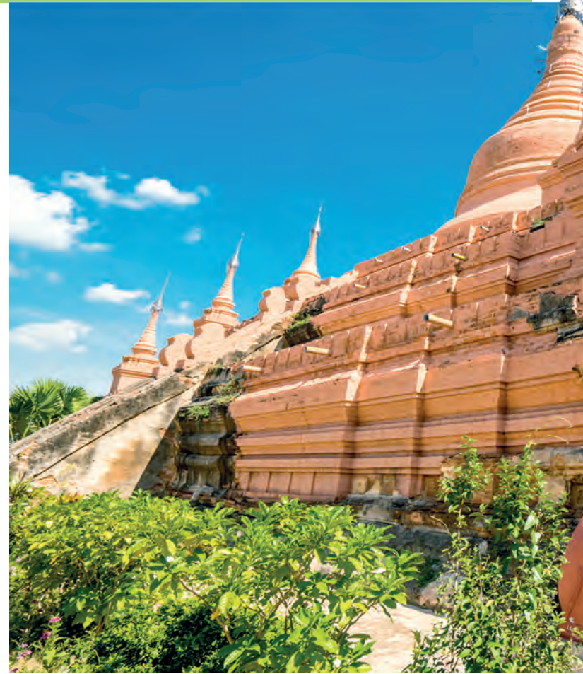
Pinya Aungsikhon Pagoda.

The main aim on my trip to Pinya was to visit three great caves located in west of TadaU-Kyaukse road but these caves meant caves for Buddha images. Anyone does not exactly know who built these caves but locals said the southern cave was built by King Thihathu. Works of images were in mostly similar to those of Ba-