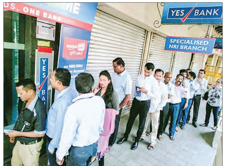
Yes Bank customers queue up outside the Fort branch on Friday morning.

Yes Bank’s exposure to the shadow banking sector is particularly large and it has been struggling for some time to raise fresh capital to free itself of a mountain of bad loans in order to quell worries about its viability.— AFP ■