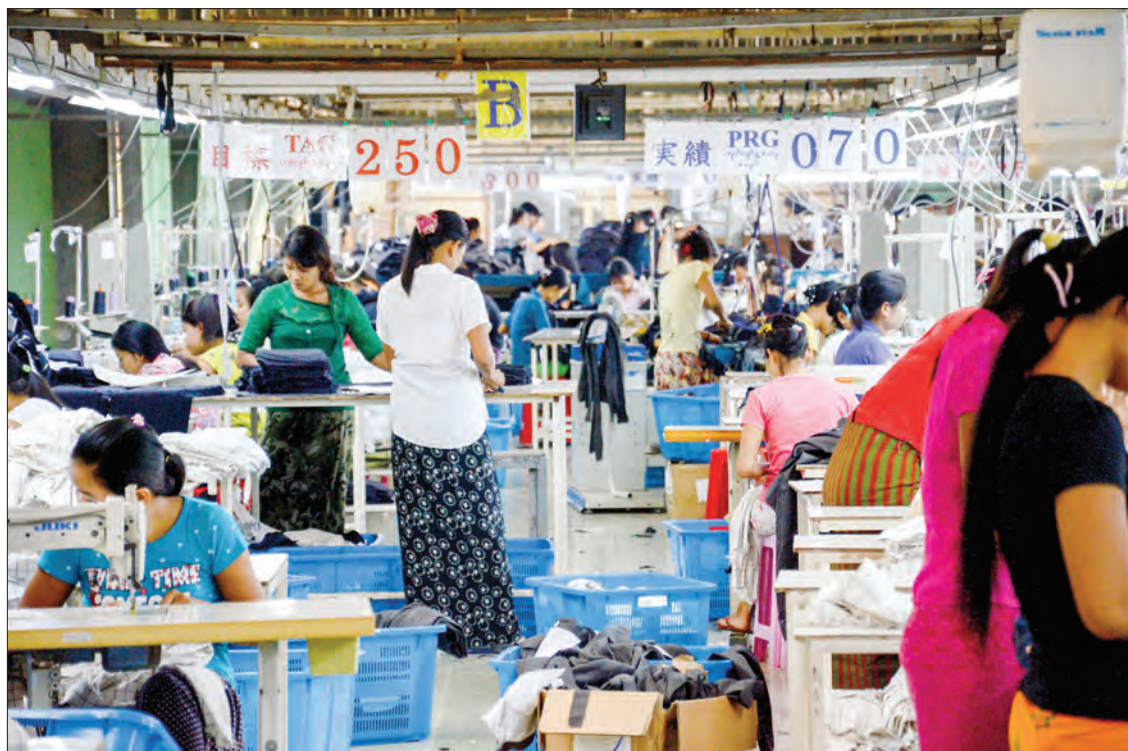
Employees work at the production line of a large garment factory in Yangon.

GARMENT factories that have closed down citing lack of raw materials because of COVID-19 need to be scrutinized to check whether they are really short of raw material supply, said U Maung Maung, chairman of the Confederation of Trade Unions of Myanmar (CTUM).