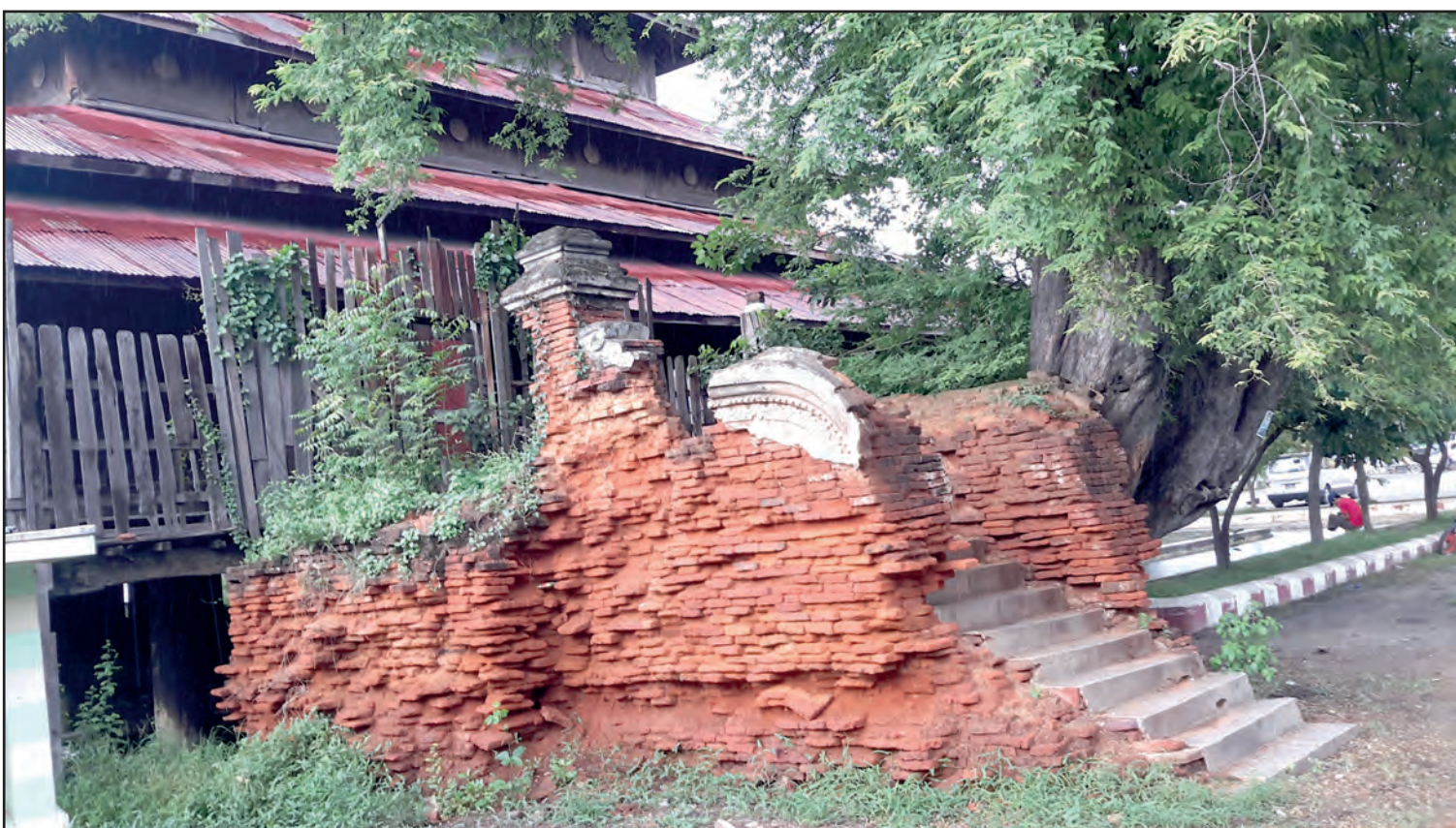
Damaged brick ladder of Maha Minhtin Monastery.

numbers of monasteries have been in the city up to now. Golden Palace and Shweinpin monasteries are under preservation of the government. Although the majority of monasteries were built in Myanmar architectural works, some monasteries such as Thakawun and Yaw Atwinwun monasteries were built in mixed architectural works of European and Myanmar styles.