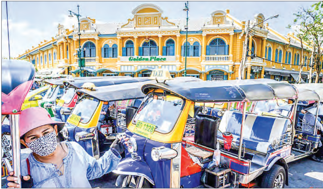
The Tourism Authority of Thailand has confirmed the country could see a loss of six million visitors in 2020.