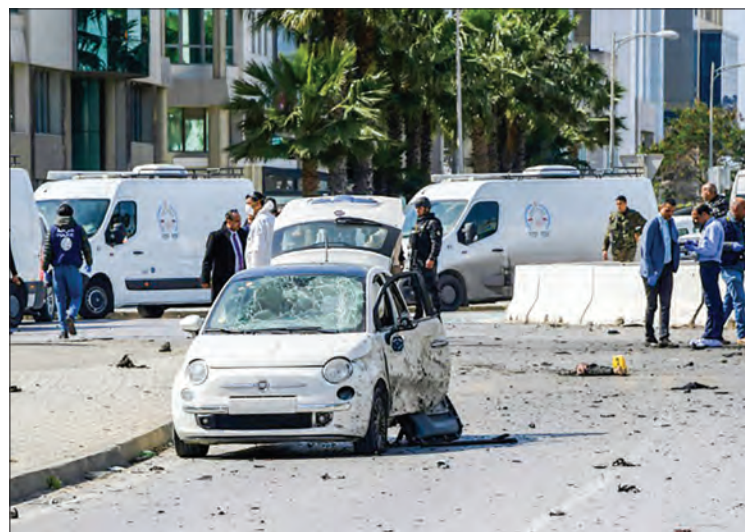
Police and forensic experts gather at the scene of an explosion near the US embassy in Tunis.

While the security situation has significantly improved since a series of deadly attacks in 2015, Tunisia has maintained a state of emergency for four years and assaults against security forces have persisted.—AFP ■