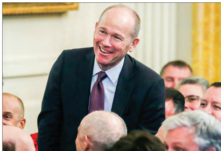
Boeing Chief Executive David Calhoun blamed his predecessor for the crisis over the 737 MAX, which remains grounded after two deadly crashes.

On 23 December, Boeing named Calhoun as CEO, finally ousting Muilenburg entirely, and saying the company needed to “restore confidence” and “repair relationships with regulators, customers and all other stakeholders.”— AFP ■