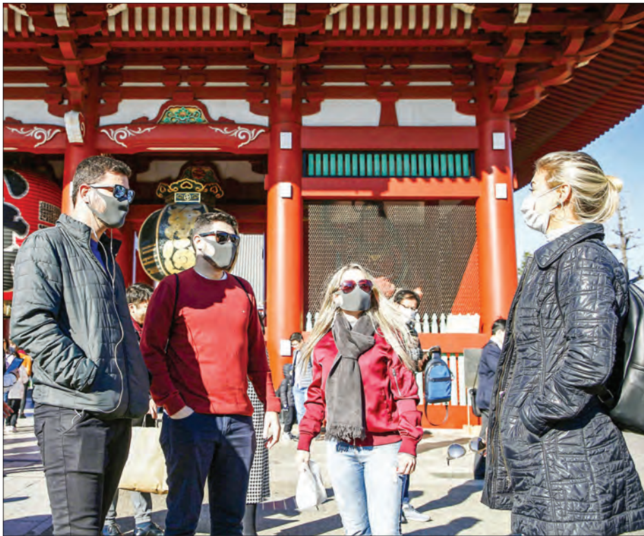
Foreign tourists wear masks in Tokyo’s Asakusa district on Feb. 1, 2020, amid the spreading coronavirus.

TOKYO — Japan will temporarily nullify 2.8 million visas held by Chinese and 17,000 held by South Koreans to prevent the new coronavirus from spread-