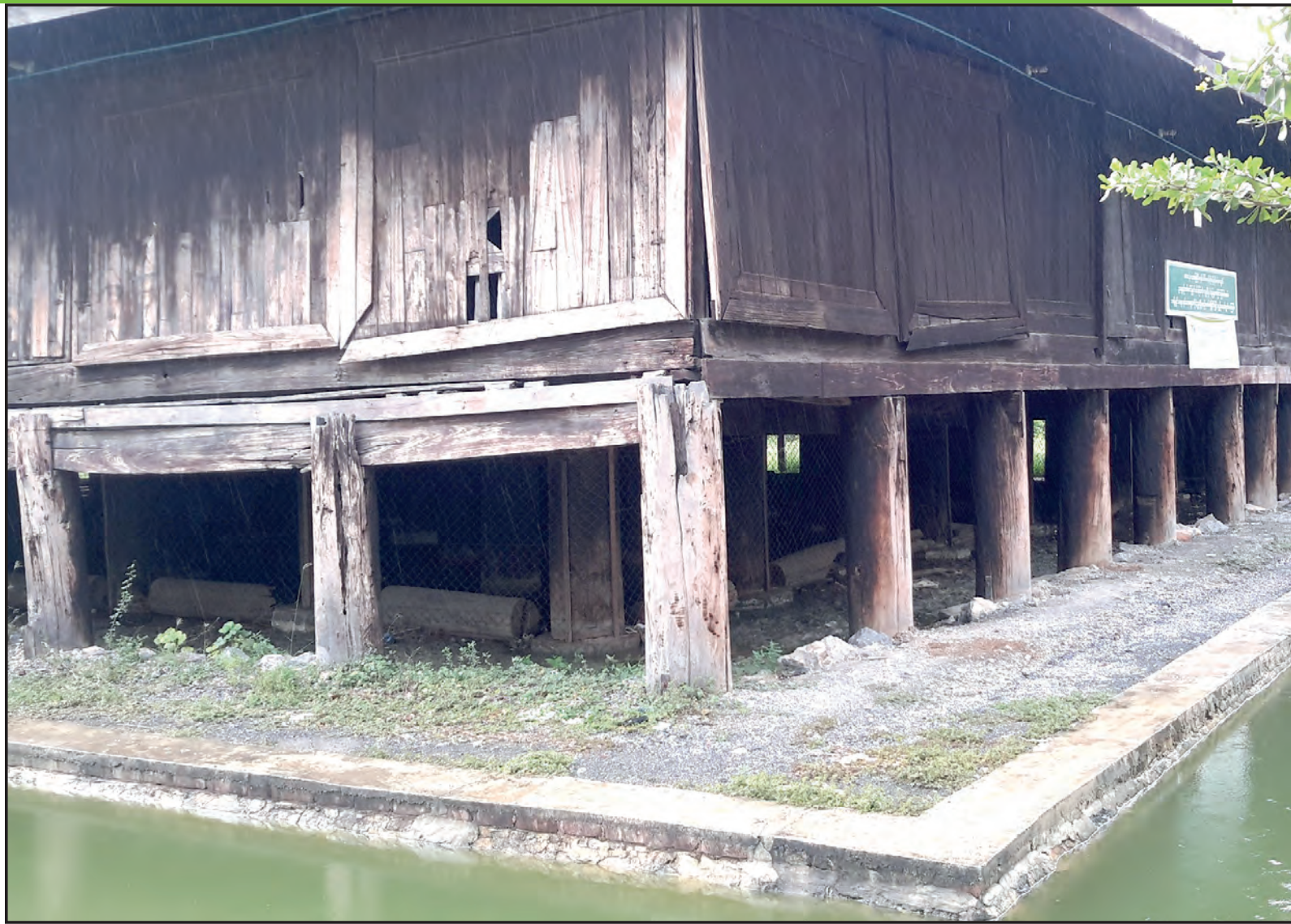
Maha Minhtin Monastery.

The Great History of Konbaung Dynasty stated kings in Konbaung era namely Alaungmintayar U Aungzeya, Naungdawgyi, Myaydu, Bardon, Sagaing, Thayawady, Bagan, Mindon and Thibaw built monasteries. King Mindon and King Thibaw in Yadanabon era constructed 55 monasteries in Mandalay. King Mindon allotted monasteries in eastern, western, southern and northern wards of Mandalay but some