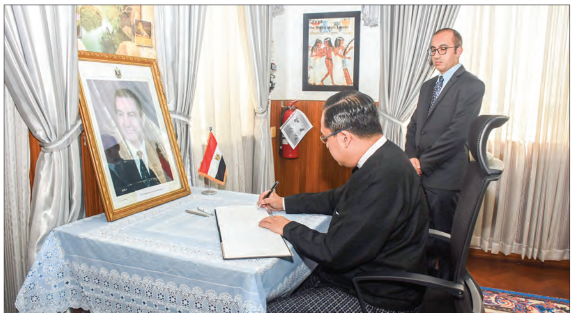
Deputy Minister U Set Aung signing the book of condolences for late Mr Muhammad Hosni El Sayed Mubarak, former President of Egypt yesterday.