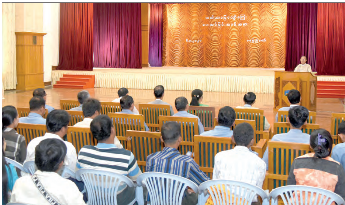
Nay Pyi Taw Council Chairman Mayor Dr Myo Aung delivers the speech at the ceremony to give compensation for confiscated land to farmers in Nay Pyi Taw yesterday.

NAY PYI TAW Council distributed land compensation amounting to K130.488 million to 42 farmers from Pobbathiri, Dekkhinathiri and Ottarathiri townships in Nay Pyi Taw yesterday.