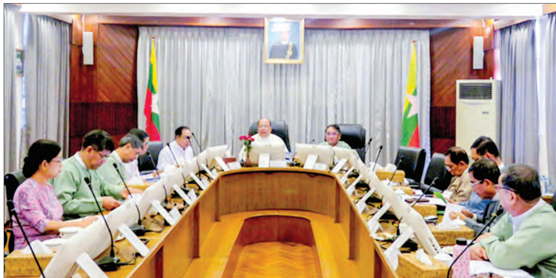
Union Minister U Thaung Tun addresses the coordination meeting of Myanmar Investment Commission in Yangon yesterday.

By the end of January, the countries with the largest investments in Myanmar were Singapore, the People's Republic of China, and Thailand. The top investment sector was oil and gas, which accounted for 26.70 per cent of the permitted foreign investment, followed by the power sector (26.45 per cent), and the manufacturing sector (14.03 per cent). — MNA