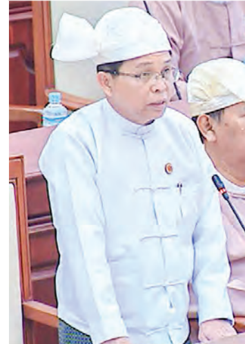
Deputy Minister U Myint Kyaing.

Similarly, Deputy Minister for Labour, Immigration and Population U Myint Kyaing replied the questions on implementation of the National Complaints