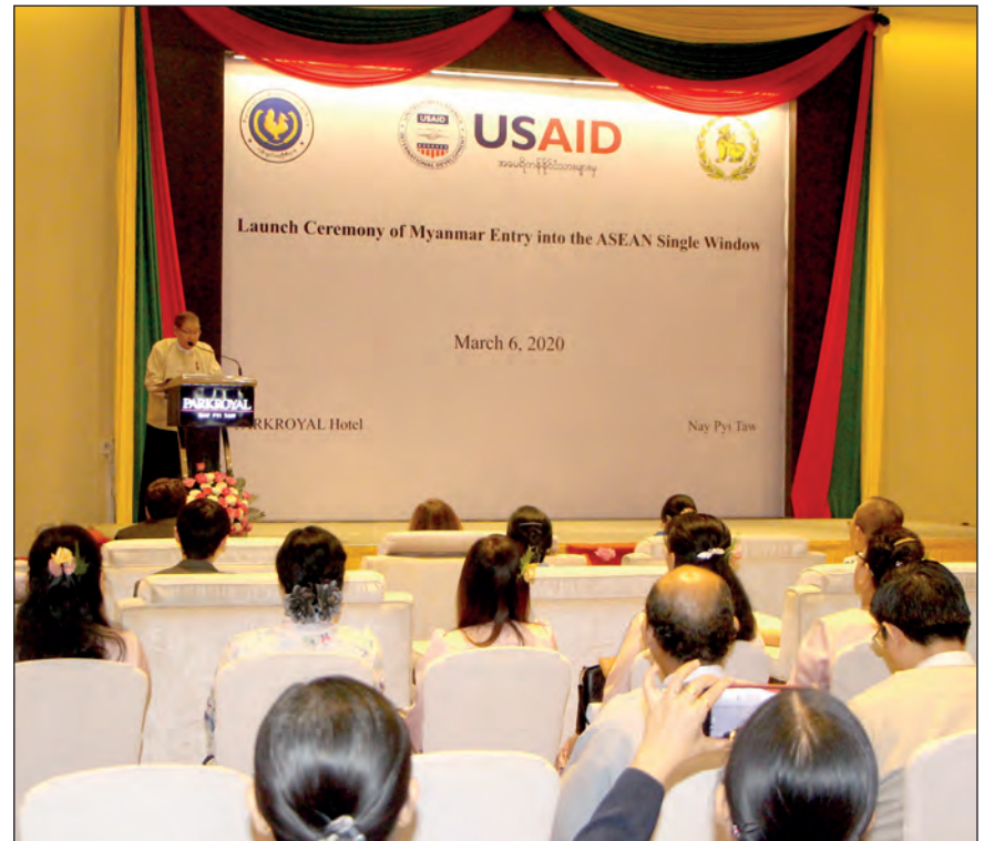
Union Minister U Soe Win delivers the speech at the Launch Ceremony of Myanmar Entry into the ASEAN Single Window in Nay Pyi Taw yesterday.

According to the ASEAN agreements, Myanmar might exchange electronically ATIGA Form D within the region. The main reason is to reduce paper works. Myanmar exporters and importers will be able to access and complete Form D more easily, which will lead to reduced time and cost as well as dramatic improvement in the accuracy and speed in processing through the ASEAN Single Window and it will also help increase transparency and more efficiency. Myanmar became the 8 th country of the ASEAN block for ASEAN Single Window Live Operation on 9 th December. As a second step, the ministry would take measures for exchange of ACDD and e-SPS based on AITGA e-Form D.—MNA (Translated by Kyaw Zin Lin)