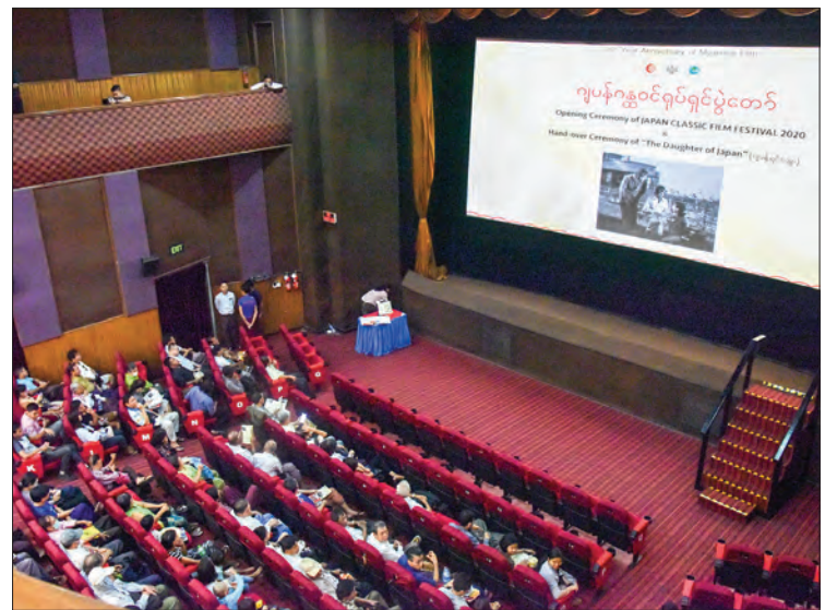
Officials and movie fans attending the opening ceremony of the Japan Classic Film Festival 2020 yesterday.

anese Embassy and Agency for Cultural Affairs, the Japan Classic Film Festival will be held for three days till 8 March.