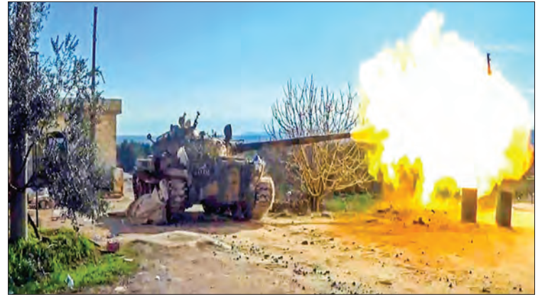
The Syrian government's attempt to take Idlib has forced close to a million civilians to flee their homes.

Meanwhile, Putin said that Russia did not always agree with its Turkish partners, but hoped the deal will serve as a good basis for ending the fighting in the Idlib de-escalation zone, put an end to the suffering of the civilian