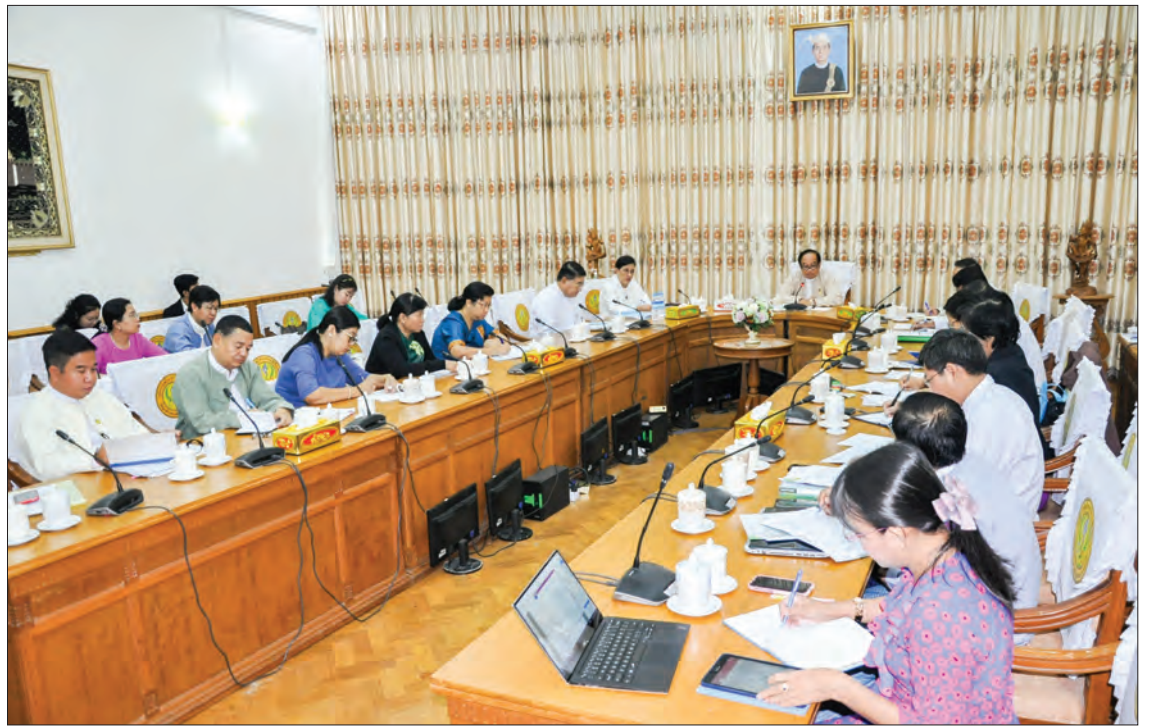
Union Minister Dr Myint Htwe addresses the central-level coordination meeting on COVID-19 yesterday.

of COVID-19 has slowly risen to 3.5 per cent, but Myanmar has made necessary preparations to contain the spread of the disease. He said the public need to be made continually aware that people with diabetes, chronic illnesses or the elderly should be swiftly sent to the hospital on signs of designated symptoms.