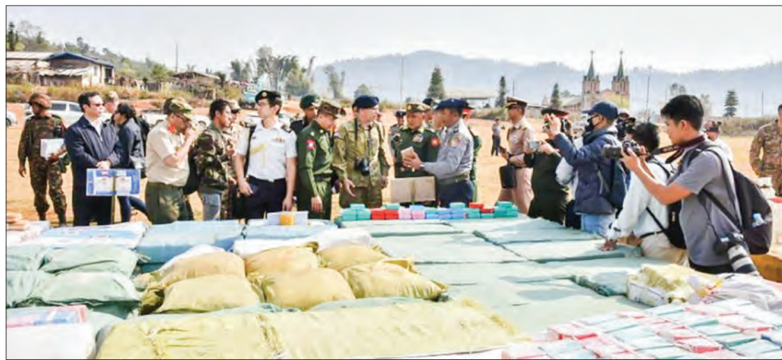
Military attaches and journalists observing the seized drugs in Kutkai yesterday.

SECURITY forces seized narcotic drugs and drugs-related materials worth over K 93 billion from 28 February to 4 March in northern Shan State, according to the Commander-in-Chief of Defence Services Office.