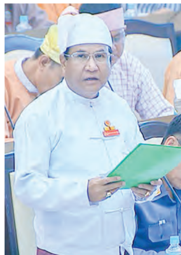
Deputy Minister U Tin Myint.

Deputy Minister for Construction, Dr Kyaw Lin, replied that there are five roads networking the village-tracts, and from among them, the 9-mile Loilem-Fartalan road has 5 miles left for expansion but the concerned village and township administration committee and Hluttaw representatives have not submitted any relevant docu-