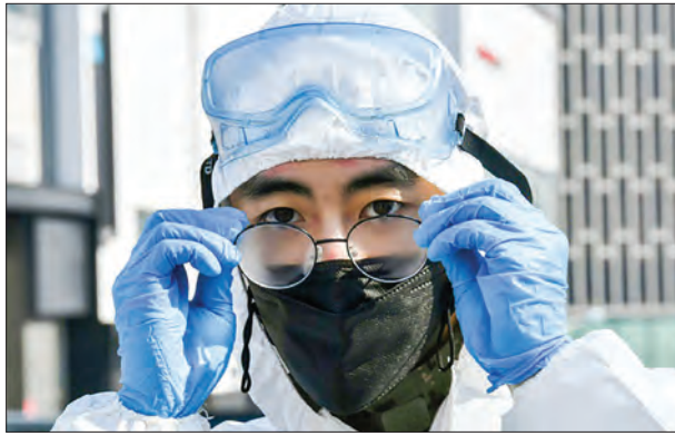
Some countries could flirt with recession this year as Asia-Pacific growth is hammered by the coronavirus outbreak.

S&P said it expected the region to grow 4.0 percent this year as supply