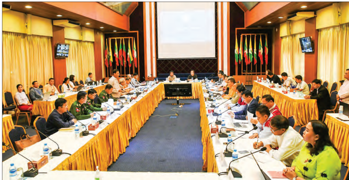
Government and ethnic armed organizations signed the Nationwide Ceasefire Agreement-NCA (NCA-S EAO) hold the work coordination meeting in Yangon yesterday.