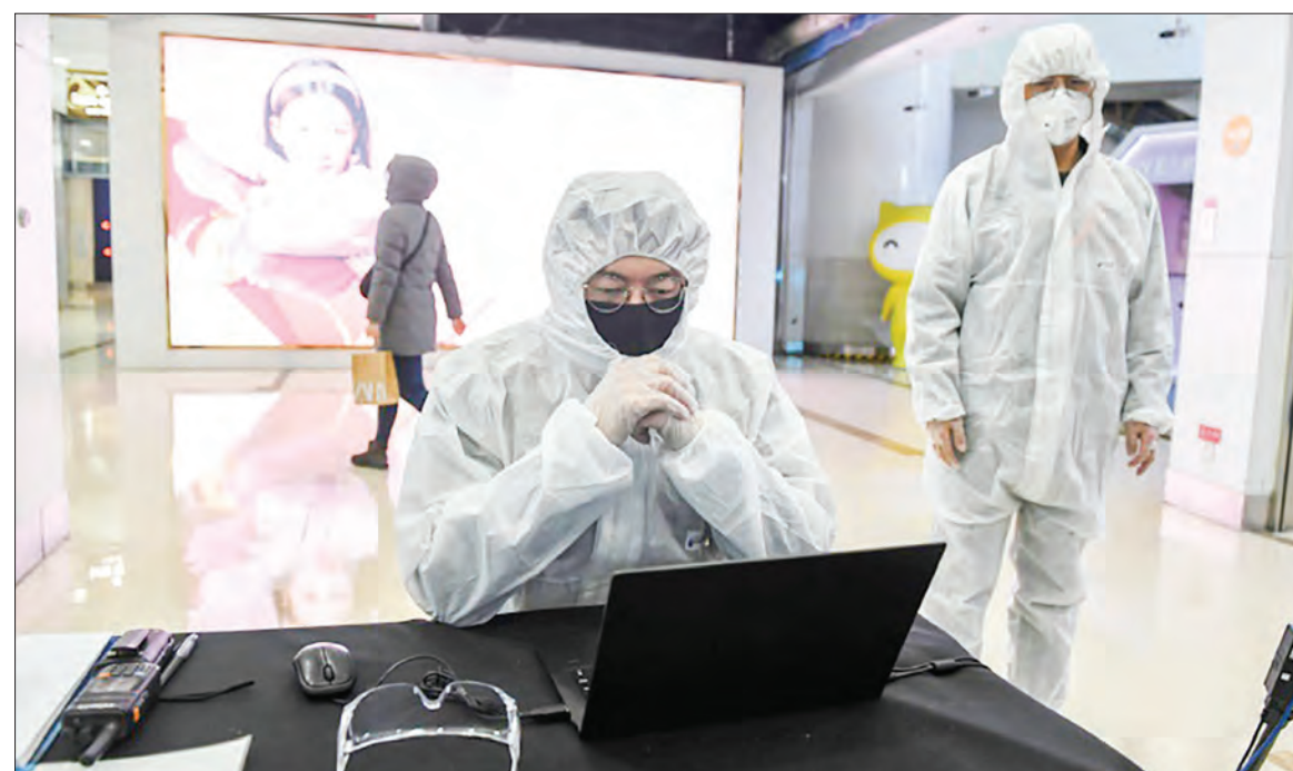
Fear of the economic impact of the virus has governments and markets on edge.

In a moderate scenario, where precautionary behaviors and restrictions such as travel bans start easing 3 months after the outbreak intensified and restrictions were imposed in late January, global losses could reach $156 billion, or 0.2% of global GDP. The People's Republic of China (PRC) would account for $103 billion of those losses—or 0.8% of its GDP. The rest of developing Asia would lose $22 billion,