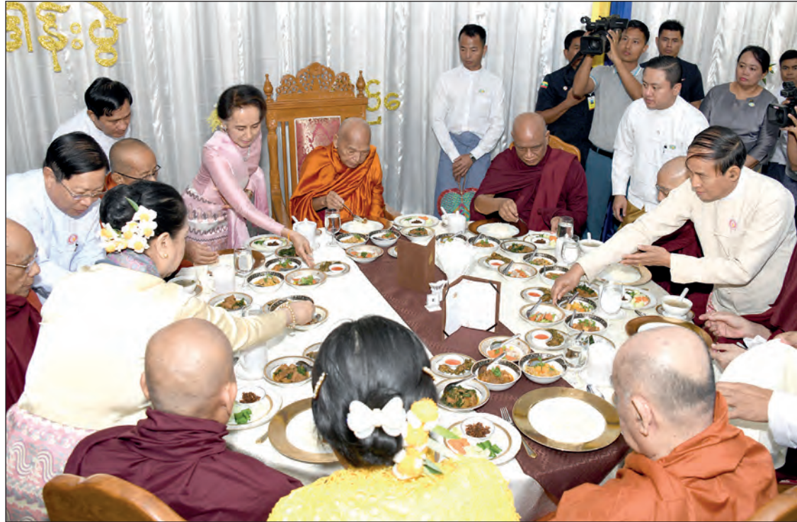
President U Win Myint, First Lady Daw Cho Cho and State Counsellor Daw Aung San Suu Kyi offering the revered prenoon meals to the Venerable Sayadaws.

The State Counsellor also submitted the offertories to State Sangha Maha Nayaka