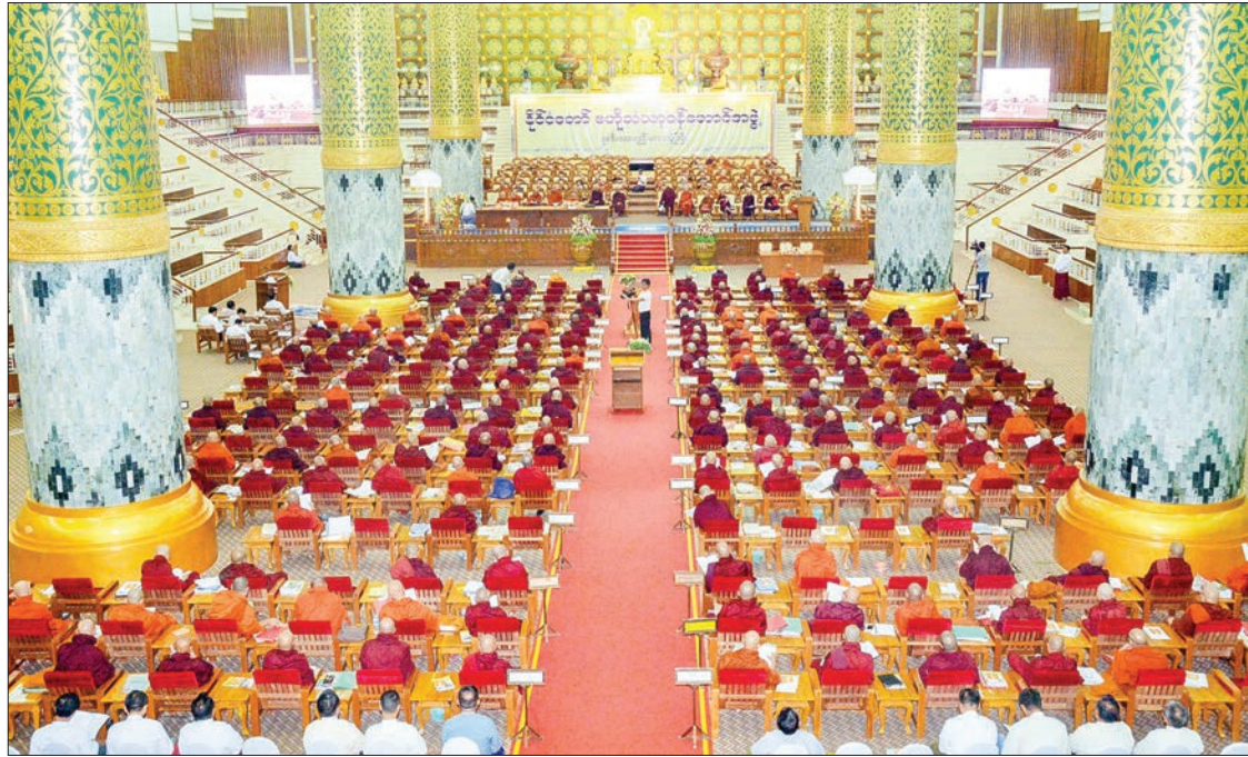
The first day of the second regular meeting of the 8 th State Central Working Committee of Sangha is in progress at the Maha Pasana Cave in the precinct of Kaba Aye Pagoda in Yangon yesterday.

members of Sangha to promote practicing the monastic rules among Sangha community for