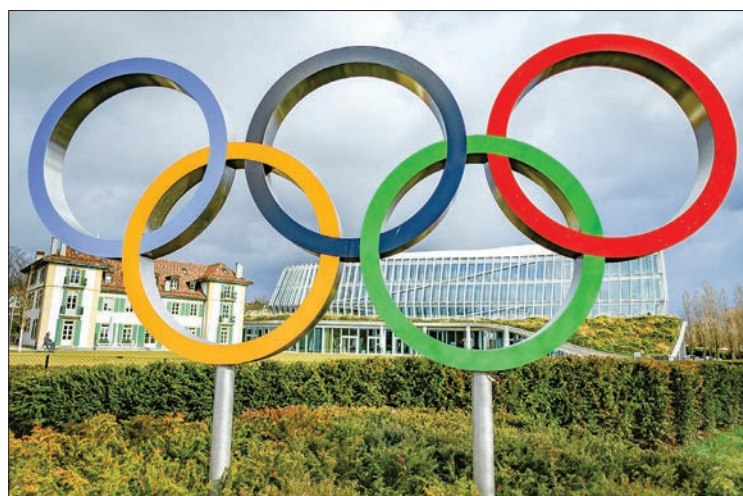
A picture taken on 26 February 2020 shows the Olympics rings next to the IOC headquarters in Lausanne.

TOKYO (Japan)—Tokyo risks losing the Olympics if they're postponed later than this year over the new coronavirus, a government minister said on Tuesday, adding that May looks like the deadline for the decision.