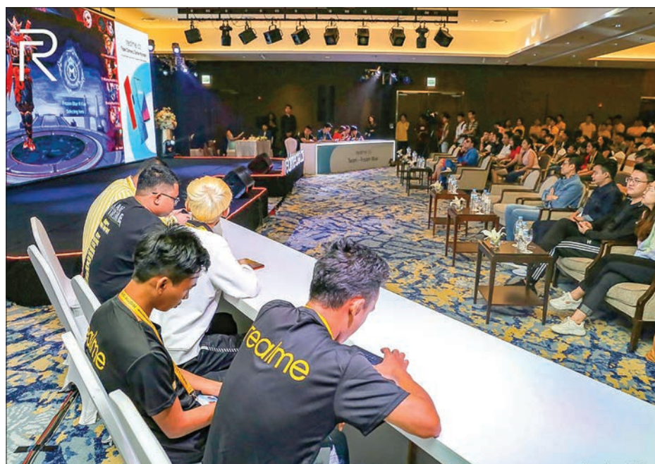
The launching ceremony of the realme C3 in progress.

The 4CM super macro lens will give more details when users shoot tiny ob-