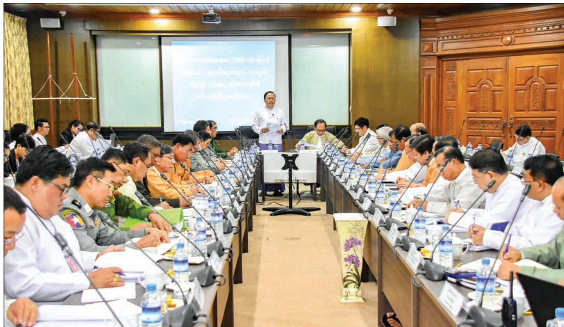
Union Minister U Kyaw Tin delivers the speech at the second coordination meeting of the COVID-19 response committee in Nay Pyi Taw.

Officials at the meeting also discussed the control measures of their agencies with awareness