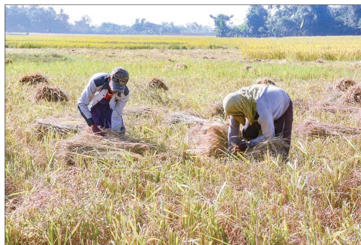
Farmers harvesting paddy in thier farm in Maungtaw Township.

Saya San resorted to his reputation as a "Medicine Man" promising the peasants and farmers immortality if they joined in the uprising against the British. He had the men tattooed with the mythical Galon (Garuda) bird so that they would conquer the enemy who was depicted to be the Naga (Serpent) in the mythical combat of the two where the Galon emerges as the victor. Hence the followers of Saya San came to be known as the "Galon Tat" (The Galon