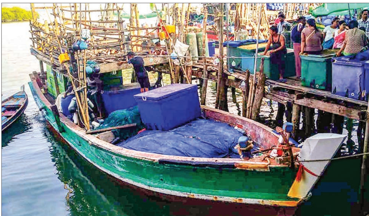
The illegal fishing boat caught by the Myanmar Navy.

of the endangered species in the Myanmar's waters. — Kyaw Soe (Kawthoung) ■ (Translated by TTN)