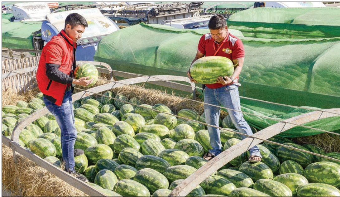
Merchants are evaluating the quality of watermelons on a lorry at the Muse 105 th Mile border trade zone.