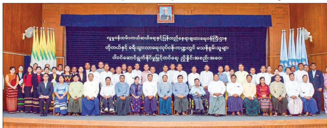
Union Minister Dr Win Myat Aye, officials and participants of the meeting on promoting the inclusion of people living with disabilities (PLWD) in the hotels and travel sector.