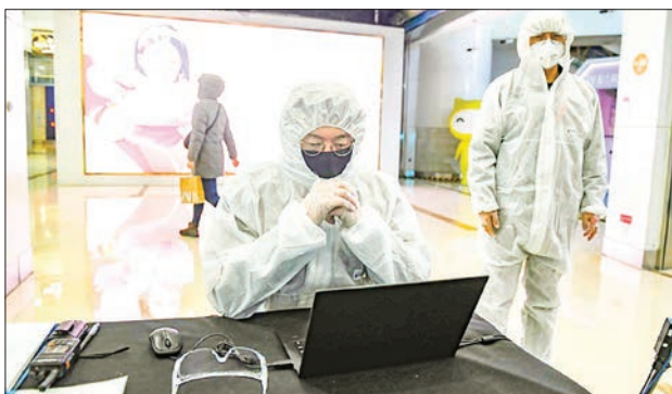
Fear of the economic impact of the virus has governments and markets on edge.

In addition to scrambling to respond to the outbreak which has now killed more than 3,100 people and infected over 90,000