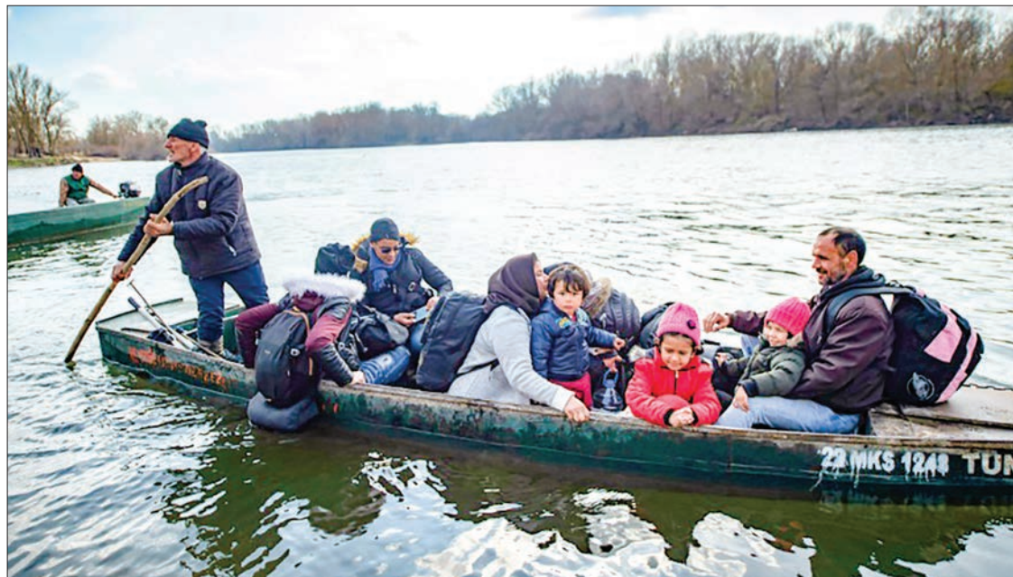
Migrants say they are being dispersed along the narrow Evros river that separates Greece and Turkey.

Erdogan claims "millions" of refugees could soon be heading from Turkey into Europe, but this is widely seen as a bid to pressure EU leaders into supporting his military offensive in Syria. Turkey already hosts some four million refugees and faces another huge influx from Syria where the regime, backed by Russian air power, is pressing a violent offensive to retake the last rebel-held province of Idlib. — AFP ■