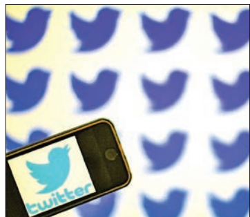
Twitter has told staff around the world to work from home if possible to help stop the spread of the deadly coronavirus.