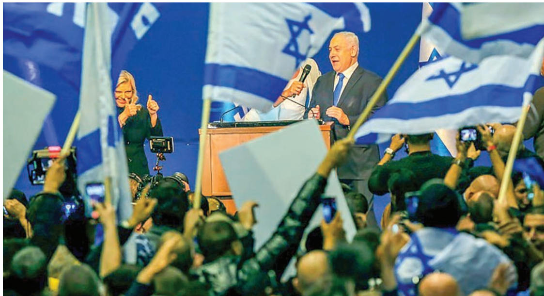
Israeli Prime Minister Benjamin Netanyahu hailed the election as a 'giant' success.

That would mark the party's best-ever result under Netanyahu, Israel's longest-serving