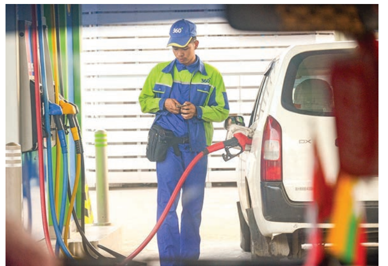
A man refilling the car with fuel at a filling station in Yangon.