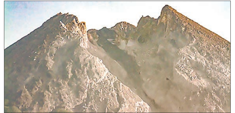
Mt. Merapi as pictured from Kalitengah Lor village in Yogyakarta, Indonesia, in August 2019.

JAKARTA — An international airport on Indonesia's Java Island was forced to close temporarily Tuesday after a volcano erupted and spewed volcanic ash almost 11 kilometers into the sky, local authorities said.