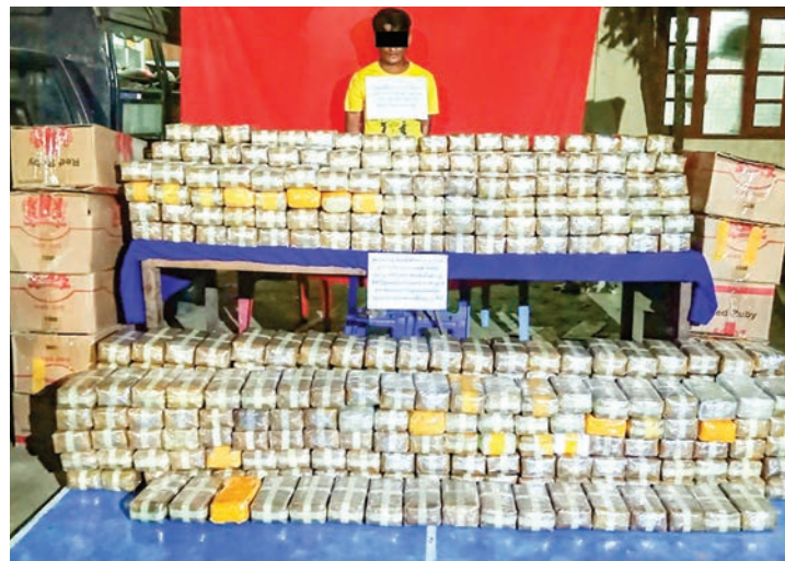
A suspect Dularmane seen together with stimulant tablets in Maungtaw.