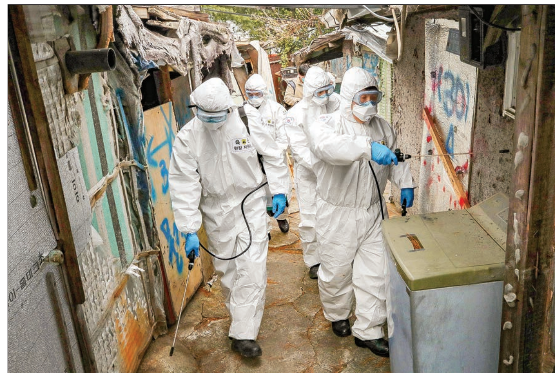
South Korean soldiers wearing protective gear spray disinfectant as part of preventive measures against the spread of the COVID-19 coronavirus, at Guryong village in Seoul on March 3, 2020.

Hong Kong postpones its Vinexpo trade fair from May to July.