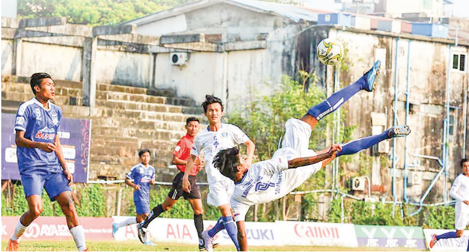
Players of Yandarbon FC (blue), and Southern Myanmar FC (white) vie for the ball during their match in Week-8 of of the MPT Myanmar National League Youth (U-19) 2020 at the Padonmar Stadium in Yangon on 3 March.

MFF Youth defeated Kachin United FC 5-1 in the Week-8 of the MPT Myanmar National League Youth (U-19) 2020 at Padonmar Stadium in Yangon yesterday.