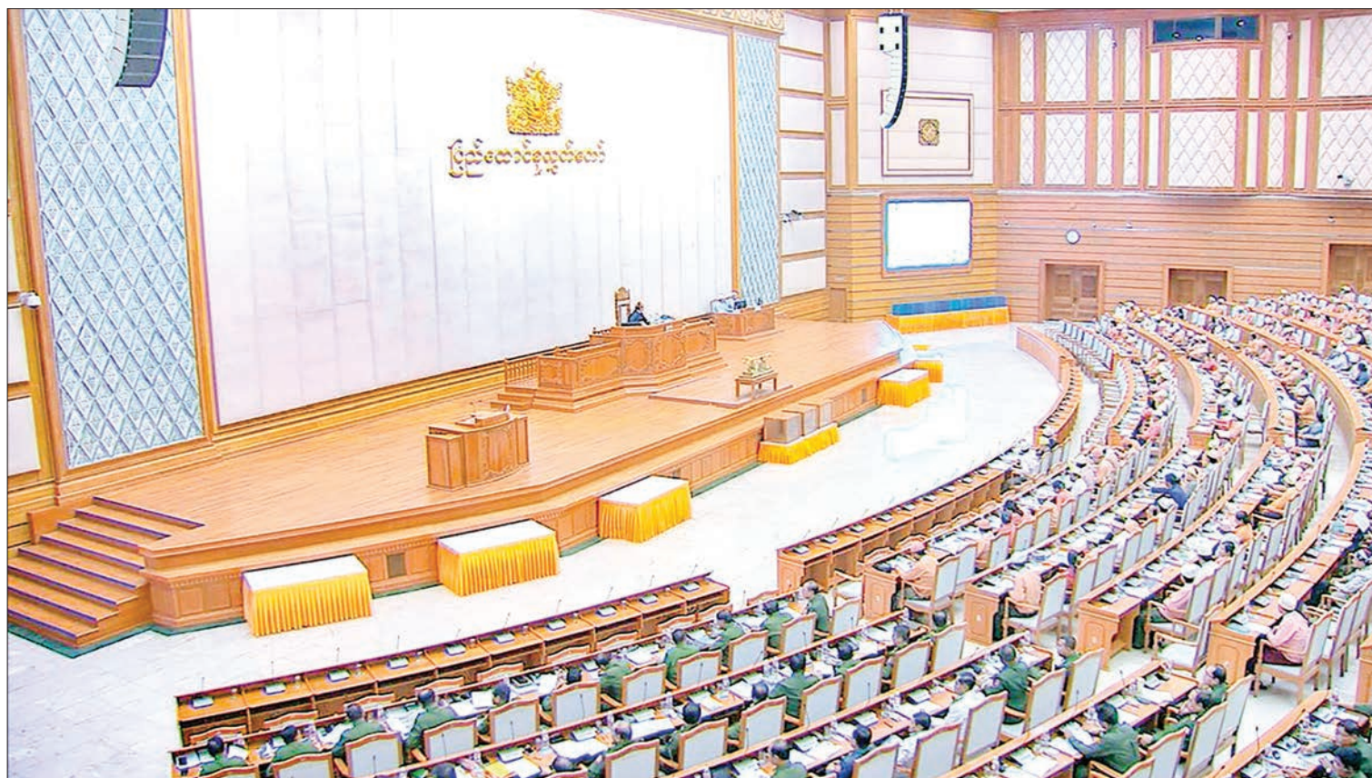
Pyidaungsu Hluttaw is being convened in Nay Pyi Taw yesterday.

He added the provision is fair to both the Hluttaw rep-