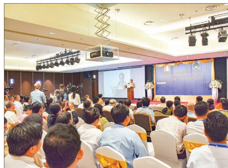
Union Minister Dr Myint Htwe delivers the speech at the workshop on developing effective strategies for safety of food sold inside and outside the markets.

A workshop on developing effective strategies for safety of food sold inside and outside the markets was held in Yangon on 2 March.