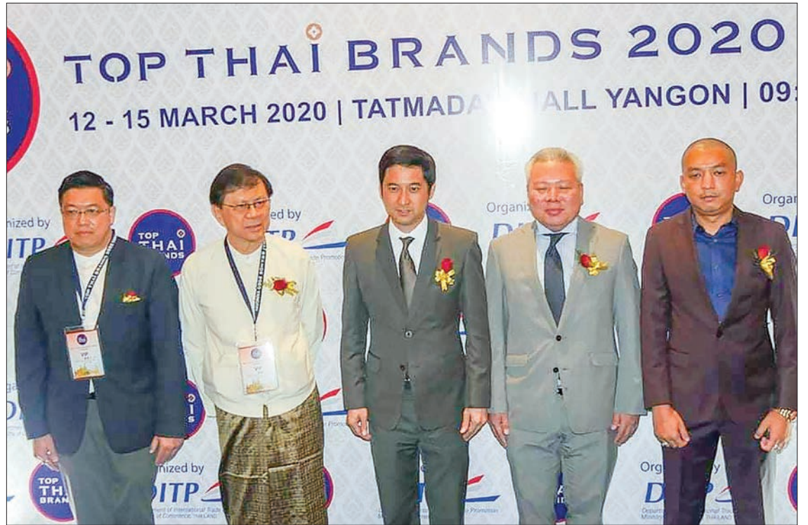
The Top Thai Brands Expo is scheduled to be held from 12 to 15 March at the Tatmadaw Hall in Yangon.

In addition, the expo will feature a Thai Food Market and lucky draws, with prizes