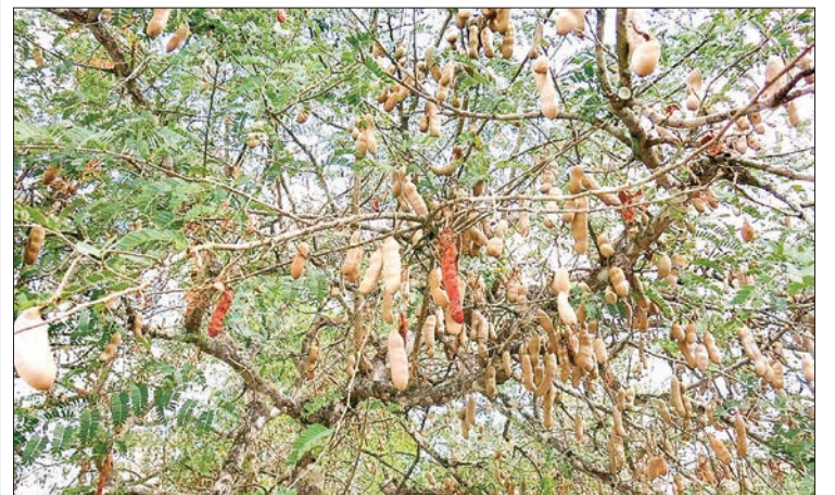
A tamarind tree with fruits is seen in Mandalay.

TAMARINDS grown in Myanmar are fetching a high price in the Mandalay market on account of a drop in yield during harvest time this year coupled with a rise in demand from Bangladesh.