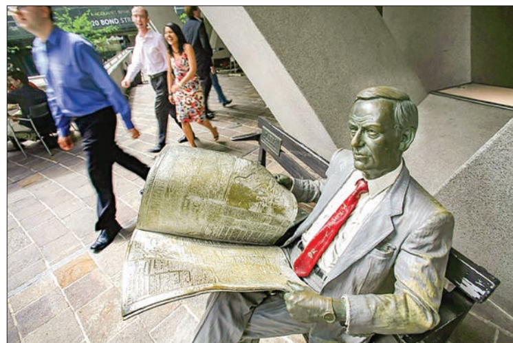
Staff at Australian Associated Press' headquarters were told a drop-off in subscribers in the face of free online content meant the company was "no longer viable".

"All news outlets have relied on AAP's network of local and international journalists to provide stories from areas where their own correspondents couldn't go, from the courts to parliament and