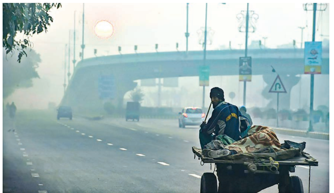
Researchers say the health impacts of air pollution from the burning of fossil fuels is significantly underestimated by authorities.

The worst-hit region is Asia, where average lifespan is cut 4.1 years in China, 3.9 years in India, and 3.8 years in Pakistan. In some parts of these countries, toxic air takes an even steeper toll, other research has shown. — AFP ■