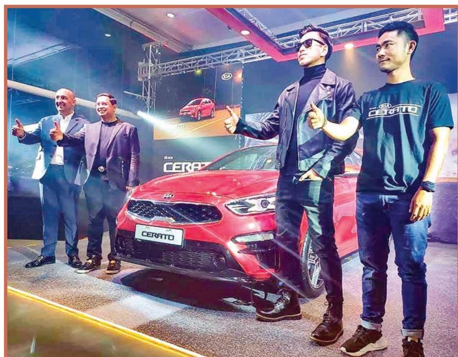
The all-new Kia Cerato sedan on show at the Yangon International Motor Show.

This is Kia’s third-generation Cerato which has been a huge success around the world. Whilst this latest generation retains its sporty and youthful image, it has evolved to a more sophisticated appearance thanks to a number of sleek and dynamic styling cues inspired by the Stinger Gran Turismo. It is learnt from the press release.—GNLM