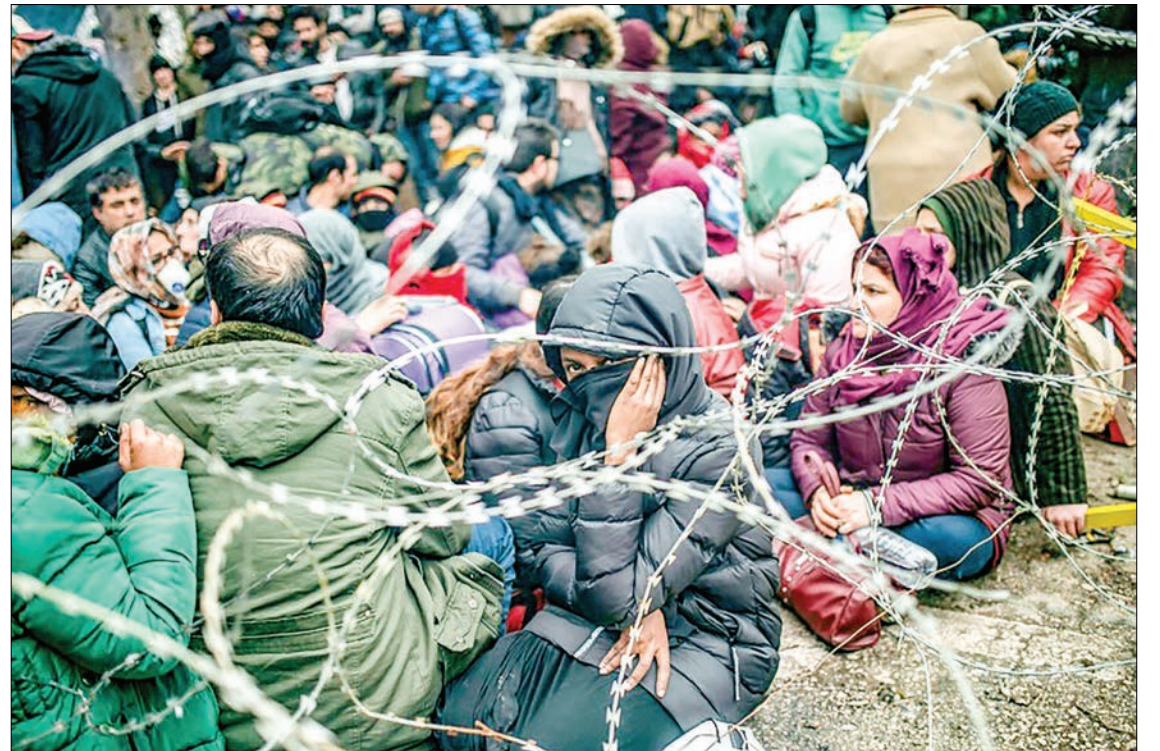
Some 13,000 migrants massed at Turkey's border with Greece over the weekend.

Erdogan further ramped up the pressure late on Monday, saying he had turned down an EU offer of one billion euros (£1.1 billion) in extra aid for migrants, adding to a six-billion-euro deal agreed in 2016. "We don't want this money," Erdogan said at a news conference without specifying