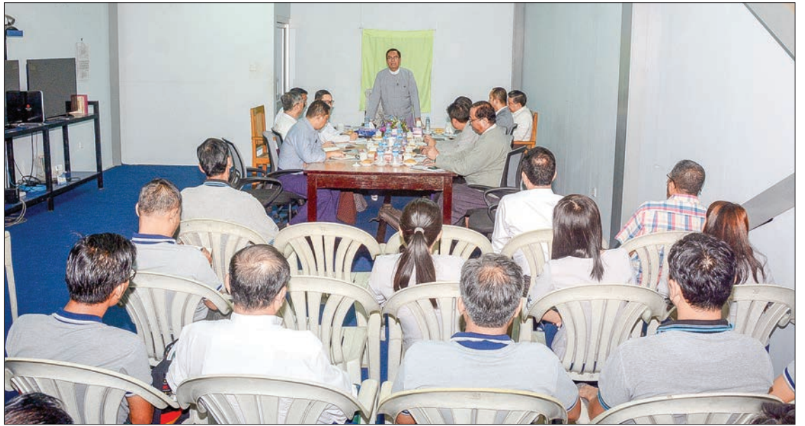
U Aung Hla Tun, Deputy Minister for Information, is seen making opening remarks at the meeting with the editorial team of the Global New Light of Myanmar in Yangon on 2 March.