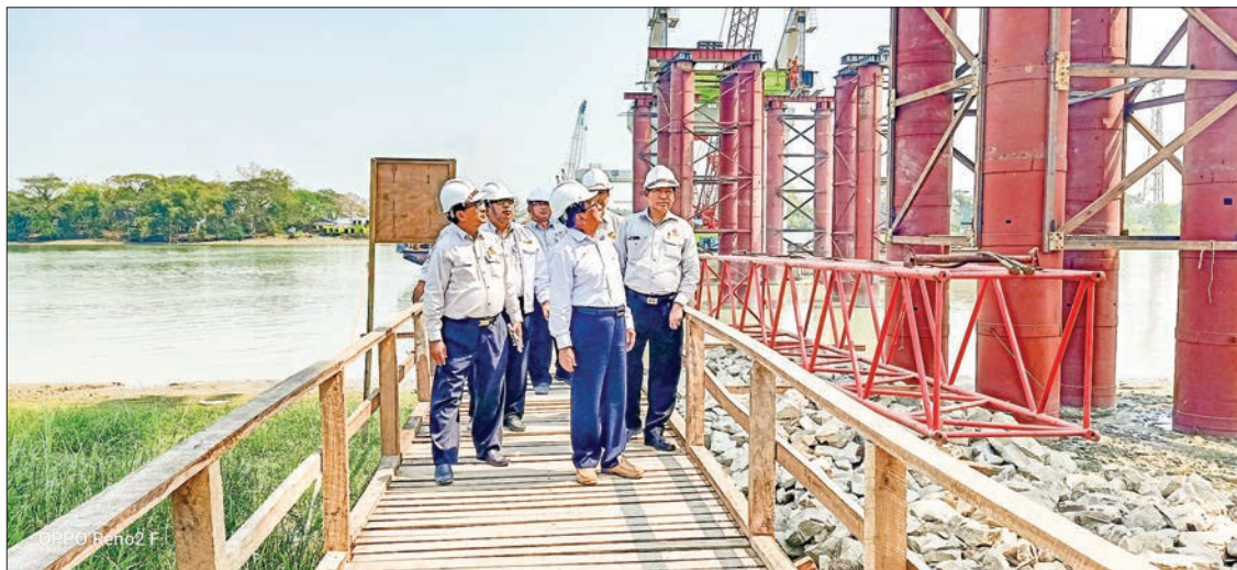
Union Minister for Construction U Han Zaw inspects the construction site of a bridge in Ayeyawady Region.