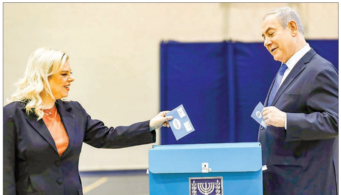
Israeli Prime Minister Benjamin Netanyahu voted with his wife Sara, urging people to go to the polls despite coronavirus fears.

"I honestly think they are losers, Blue and White. But there is nothing else to vote for for people with my opinions," the 27-year-old math student said in Jerusalem.—AFP ■