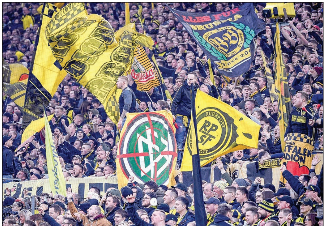
Dortmund's supporter hold on a banner of DFB with a crosshair during the German first division Bundesliga football match Borussia Dortmund v SC Freiburg on 29 February 2020 in Dortmund. PHOTO: AFP

Offensive banners critical of Hopp have found their way into the stands in several fan blocks in recent weeks, including depictions of Hopp's face in crosshairs while also calling him a "son of a bitch".— AFP ■