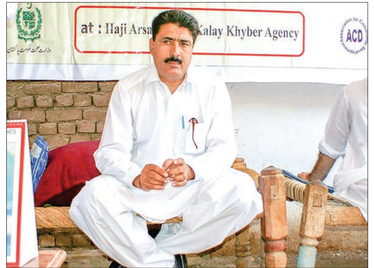
Pakistani surgeon Shakeel Afridi, pictured in 2010, has been languishing behind bars for years since helping US agents track and kill Osama bin Laden in 2011.