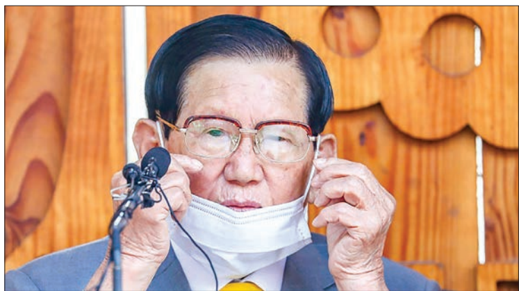
Seoul city authorities have filed a murder complaint against Shincheonji leader Lee Man-hee for failing to cooperate in containing the epidemic.

SEOUL (South Korea) — The elderly leader of a secretive South Korean sect linked to more than half the country's 4,000-plus coronavirus cases knelt before the cameras Monday to apologise for the spread of the disease.