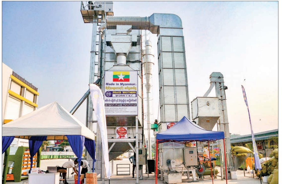
A crop dryer is seen at the Myanmar International Agriculture Machinery Expo at Fortune Plaza in Thaketa Township, Yangon, on 2 March 2020.

Changing from a traditional mode of agriculture into an industrial form requires innovation to promote the agricultural sector of the nation. The crop drying machine is the first of its kind to be produced in Myanmar.