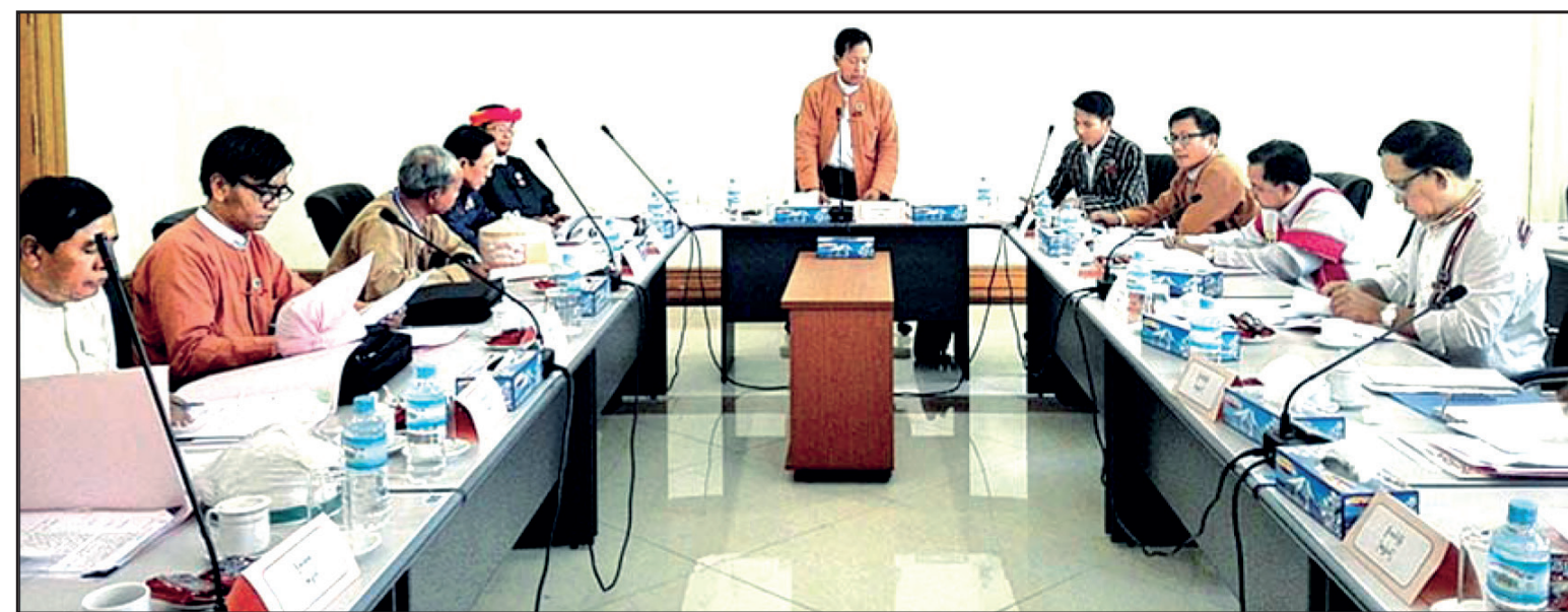
The Citizens Fundamental Right, Democracy and Human Rights Committee of Amyotha Hluttaw holds a coordination meeting.