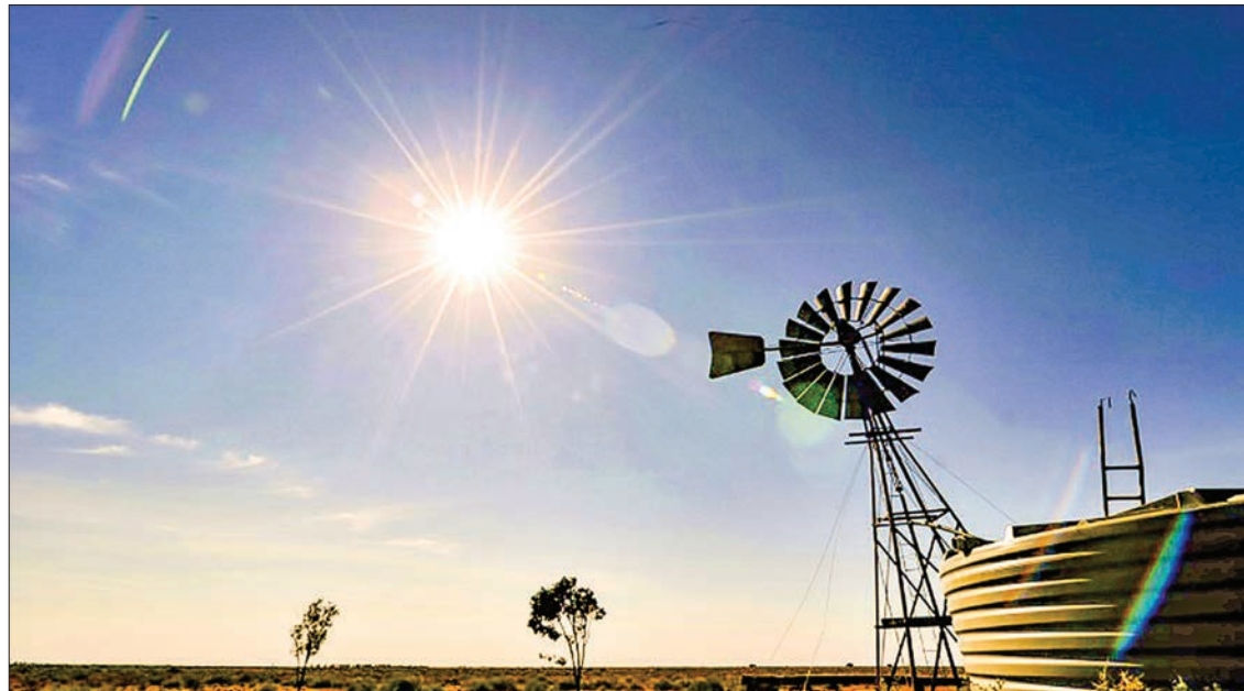
The Australia Institute said large swathes of the country were experiencing an additional 31 days of summer temperatures each year compared to the 1950s.

Australia’s latest summer heralded a devastating bushfire