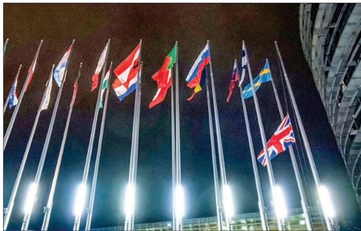
Negotiating positions in Britain and the EU are far apart.