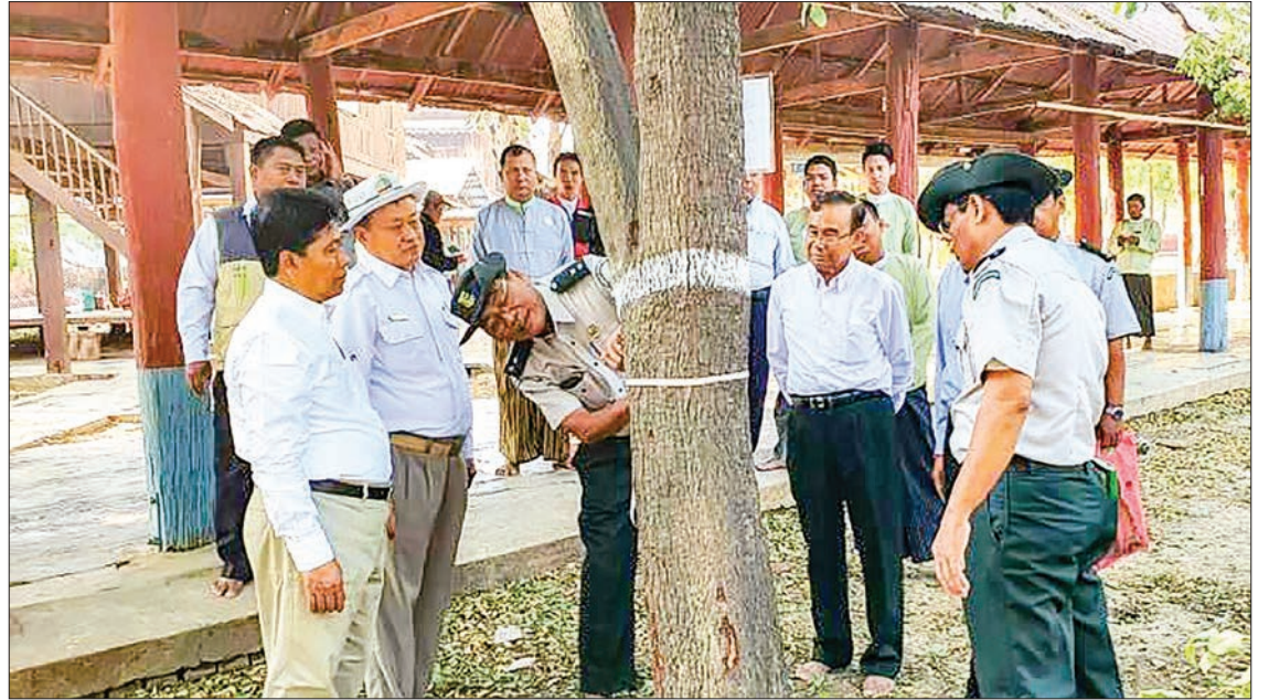
Union Minister for Natural Resources and Environmental Conservation U Ohn Win observes the measuring of a tree at the Shwesettaw Wildlife Sanctuary in Magway.

The Union Minister then instructed on providing quality service to visitors, avoiding danger on elephant rides and displays, displaying do's and don'ts in Myanmar and English languages, recording entry to domestic and foreign visitors,