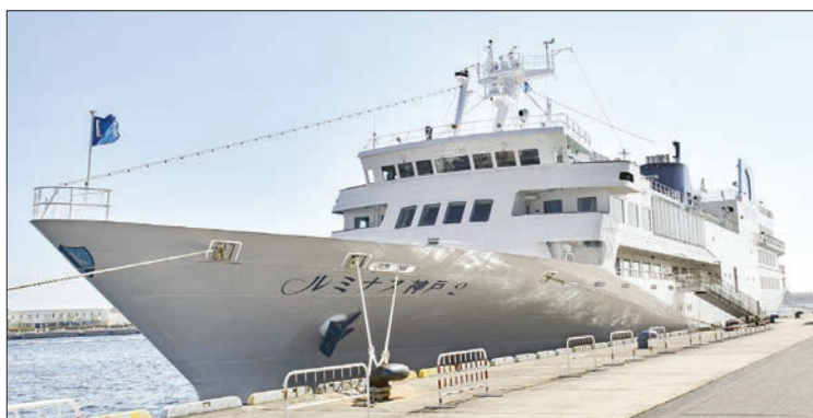
Luminous Kobe 2, one of the largest restaurant cruise ships in Japan, is pictured in Kobe on 2 March 2020.

France, which has 130 confirmed cases and two deaths from COVID-19, has said it would ban gatherings of 5,000 people or more, closing schools and cancelling religious services in some of the hardest-hit zones. Sunday's half-marathon in Paris was cancelled. — AFP ■