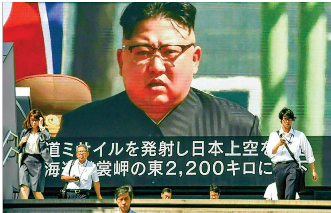
North Korea's leader Kim Jong Un recently declared that Pyongyang no longer considered itself bound by its moratoriums on nuclear and intercontinental ballistic missile tests.

At a party meeting at the end of that month, Kim declared that Pyongyang no longer considered itself bound by its moratoriums on nuclear and intercontinental ballistic missile tests, and threat-