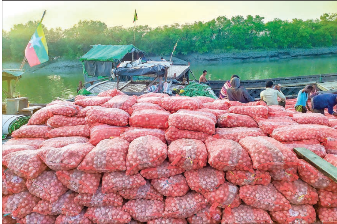
Myanmar’s onions are primarily shipped to markets in China and Bangladesh.

In the 2019-2020 financial year, Myanmar’s exports onion to Bangladesh through Maungtau gate stood at 1,175 tons, with an estimated value of $69,660, in October; 1,074 tons, worth $1,133,000, in November; 761 tons, worth $1.02 million, in December; 1,102 tons, worth $1.03 million in January; and 1,613 tons, worth $1.33 million, in February. Between 1 October 2019 and