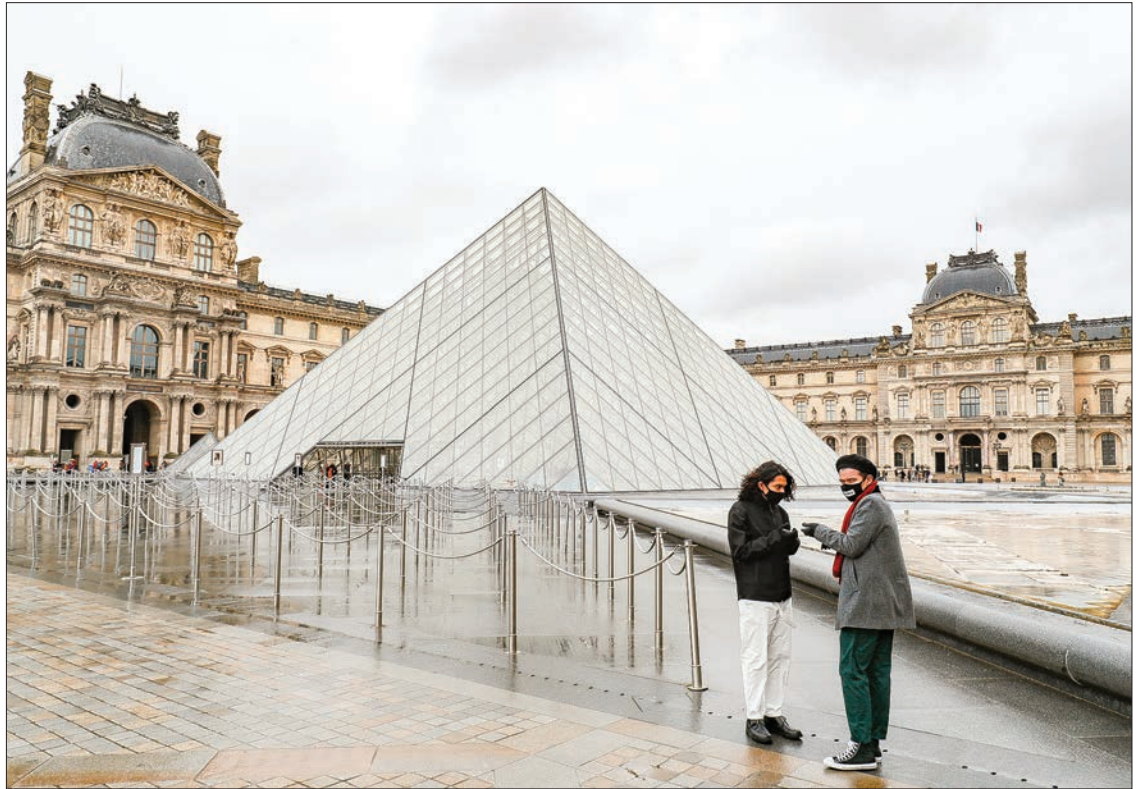
Two men stand in the deserted court yard outside the closed Pyramid, the main entrance to the Louvre museum which was once a royal residence, located in central in Paris on 2 March 2020.

The new coronavirus, which causes the disease officially known as COVID-19, has dealt a blow to the tourism sector across Japan, particularly since China, where the virus originated, banned all group travel to other nations in late January. The Japanese government's request last Wednesday to cancel or postpone big events for two weeks to curb the spread of the virus has also led to closures of theme parks, stadiums and other venues that attract mass gatherings, while more people are opting to stay indoors. — Kyodo News