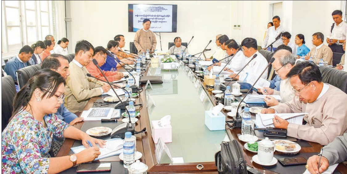
Union Minister for Religious Affairs and Culture Thura U Aung Ko speaks at the coordination meeting on organizing the ceremony to open the National Library in Yangon.

A coordination meeting to organize the opening ceremony of National Library was held yesterday afternoon at its new building in Yangon. Officials discussed prepara-