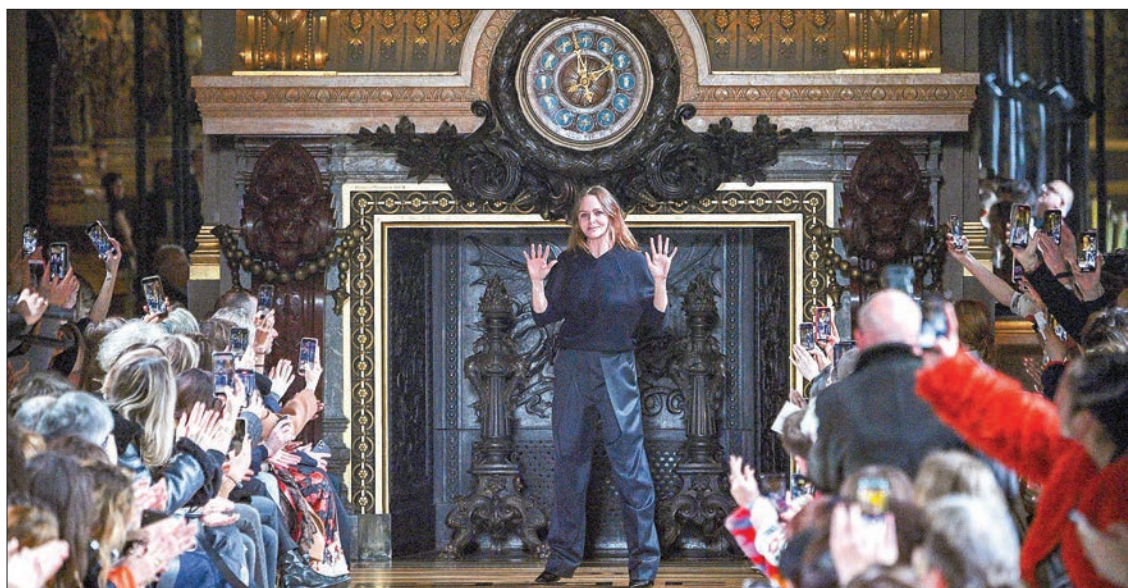
British fashion designer Stella McCartney acknowledges the audience at the end of the Women’s Fall-Winter 2020-2021 Ready-to-Wear collection fashion show in Paris, on 2 March 2020.

LVMH “saw the quality of products I was making and they compared it to the quality being made by all the other brands that are killing millions of animals and the environment, and they said, ‘Hey this looks the same,’” McCartney said.—AFP ■