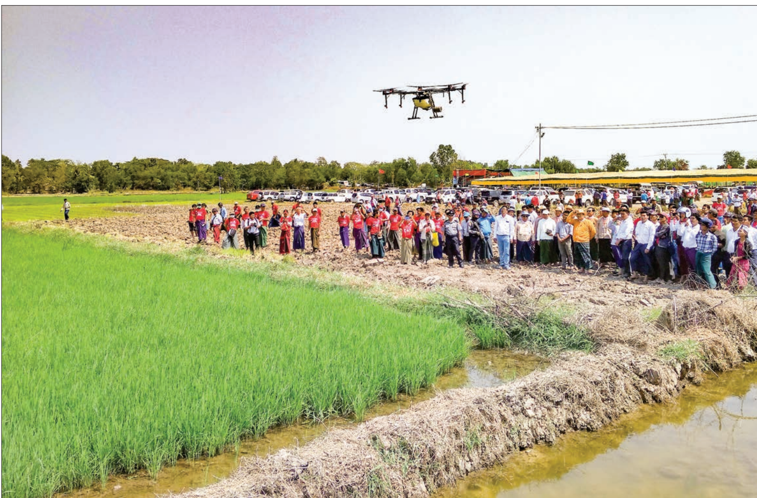
Ayeyawady Region Chief Minister U Hla Moe Aung and locals observe using drone in spraying pesticide over rice plantation.

P EASANTS Day 2020 was commemorated at Wardu Village-tract, Kangyidaung Township, Patheingyi District, Ayeyawady Region yesterday morning.