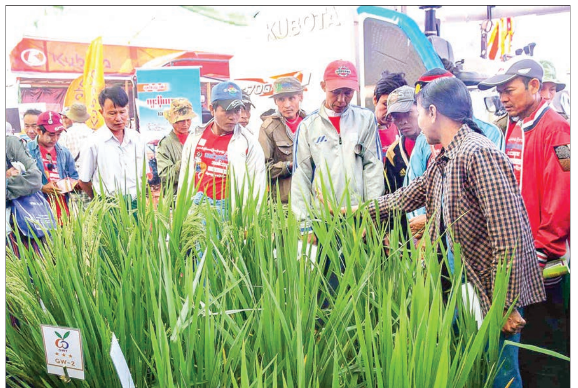
Locals observe the model paddy plantation at the celebration of Peasants Day 2020 in Wardu Village-tract of Ayeyawady Region.