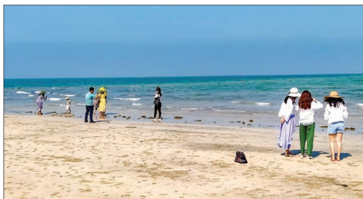
Visitors taking photo at the Shwe Thaung Yan Beach.

MORE travellers headed to Shwe Thaung Yan beach in Patheingyi District, Ayeyawady Region, from the Chaungtha beach on overnight trips or day journeys during the public holidays.