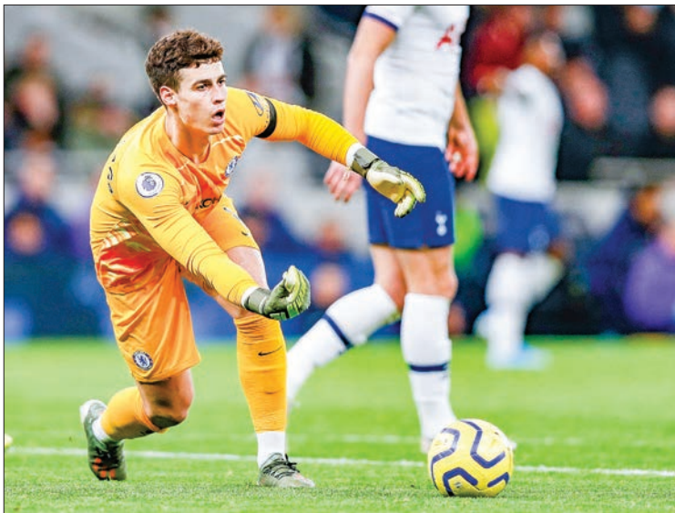
Chelsea's Spanish goalkeeper Kepa Arrizabalaga rolls the ball out during the English Premier League football match between Tottenham Hotspur and Chelsea at Tottenham Hotspur Stadium in London, on 22 December 2019.