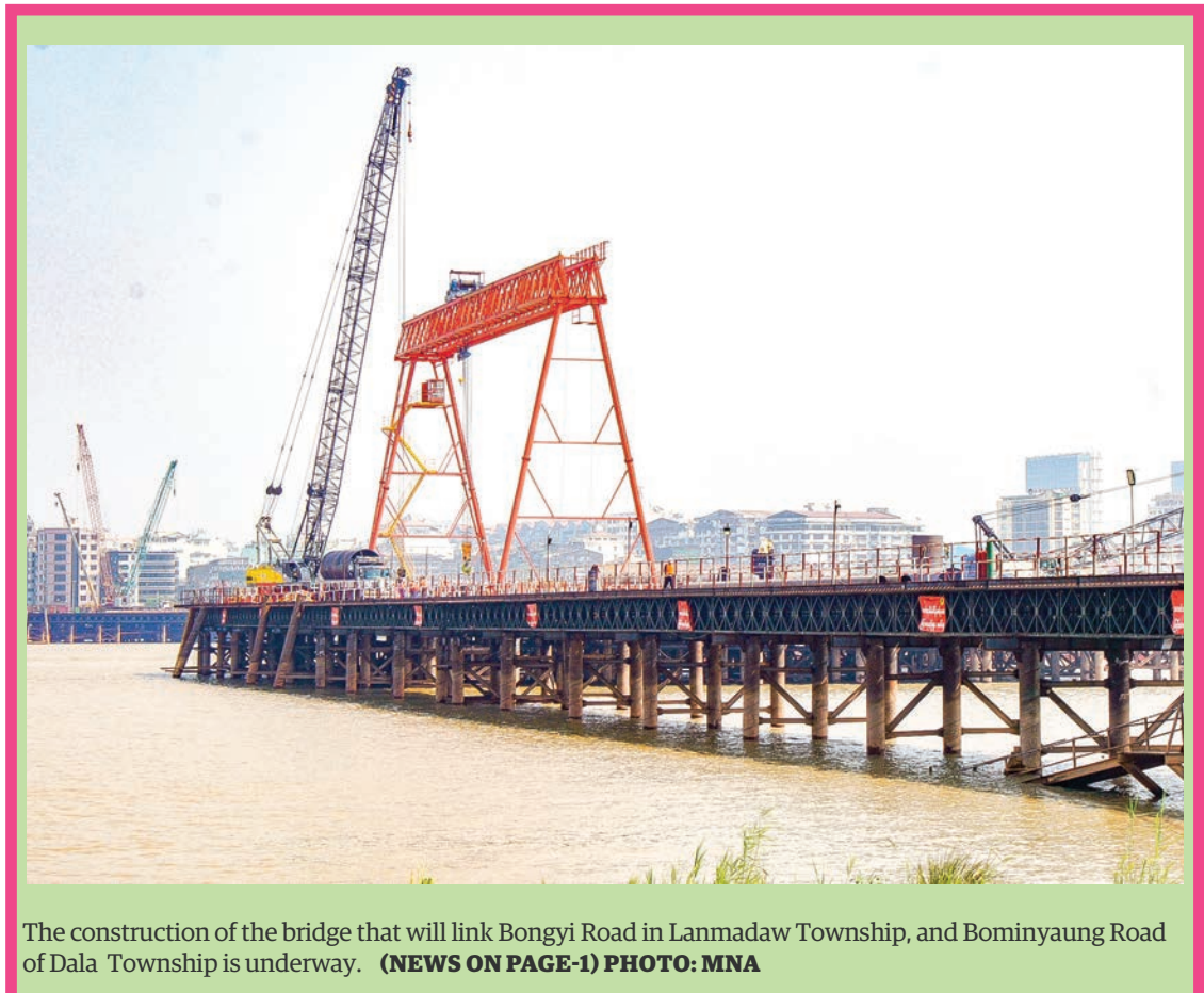
The construction of the bridge that will link Bongyi Road in Lanmadaw Township, and Bominyaung Road of Dala Township is underway. (NEWS ON PAGE-1)