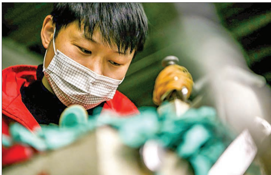
Coronavirus could push world economic growth into reverse.