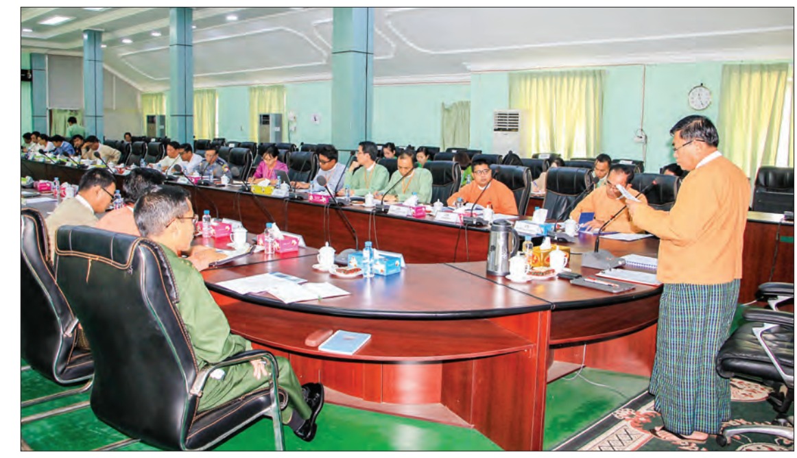
Bago Region Chief Minister U Win Thein holds a coordination meeting to organize Bago Region Investment Fair 2020 in Bago on 26 February.

The event aims to showcase business opportunities, highlight the region's investment potential, promote for-