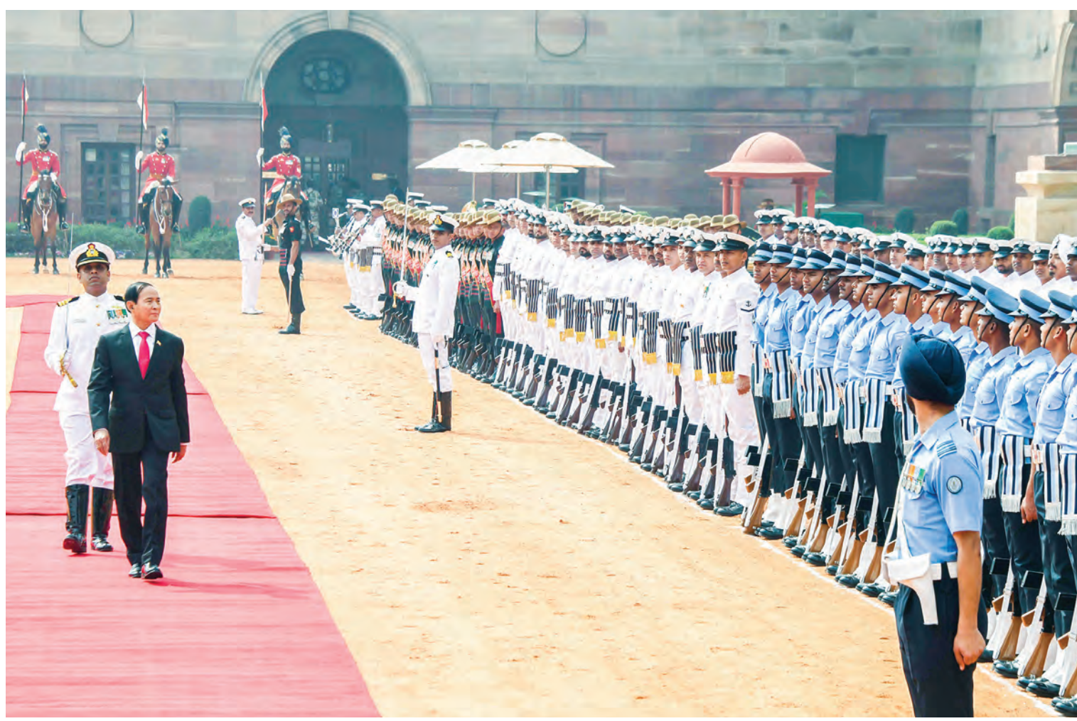
President U Win Myint inspects the Guard of Honour at the welcoming ceremony in New Delhi, the capital of India, yesterday.

promised to take priority on the request.