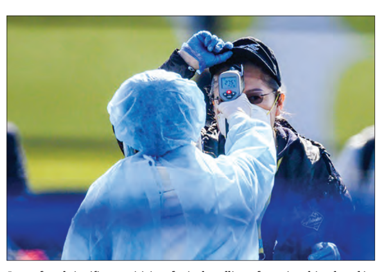
Japan faced significant criticism for its handling of a cruise ship placed in quarantine after a former passenger contracted the virus.

But Ohmagari, who helps advise the government, defended measures, including requesting — but not ordering — the