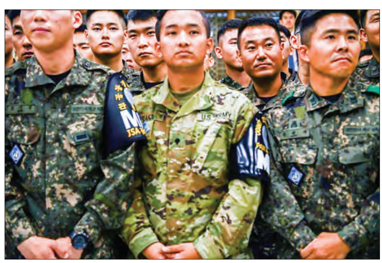
In a photo taken on 30 June, 2019, US and South Korean military personnel are seen during a visit by US President Donald Trump and South Korean President Moon Jae-in at the Joint Security Area.

Of the new cases, 422 were in the southeastern city of Daegu, at the center of the rapid transmission of the pneumonia-causing virus. Most cases confirmed in Daegu are linked to a branch of a minor Christian sect known as Shincheonji Church of Jesus.