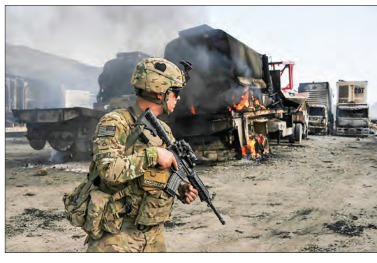
The Afghan conflict has become the longest war the US has ever fought.

While the deal's contents have not been publicly disclosed, it is expected to see the Pentagon begin pulling troops from Afghanistan, where between 12,000-13,000 are currently based.