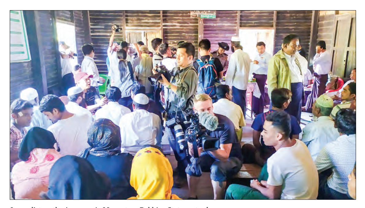
Journalists gathering news in Maungtaw, Rakhine State yesterday.