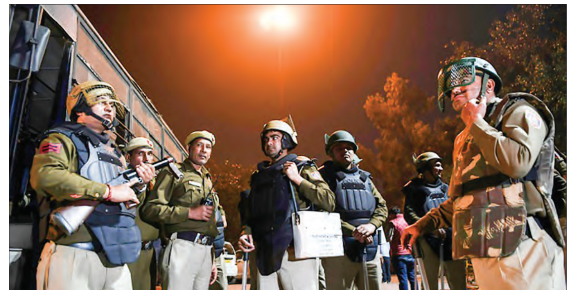
Police stand guard following clashes between supporters and opponents of a new citizenship law in New Delhi.

of violence over Prime Minister Narendra Modi's citizenship law, which triggered months of demonstrations that turned deadly in December: