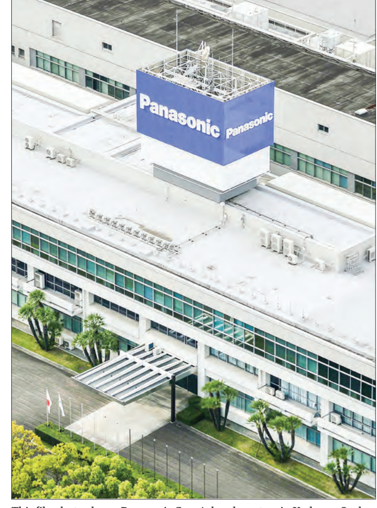
This file photo shows Panasonic Corp.'s headquarters in Kadoma, Osaka Prefecture.

"The decision to transit away from US solar manufacturing in Buffalo aligns with our global solar strategy, our efforts to optimize development and production, and supports Tesla's long-term plans to continue and expand its operations," Panasonic said. Panasonic's EV battery business for Tesla achieved profitability in the October to December period after suffering a series of losses resulting from the huge initial investment.—Kyodo News