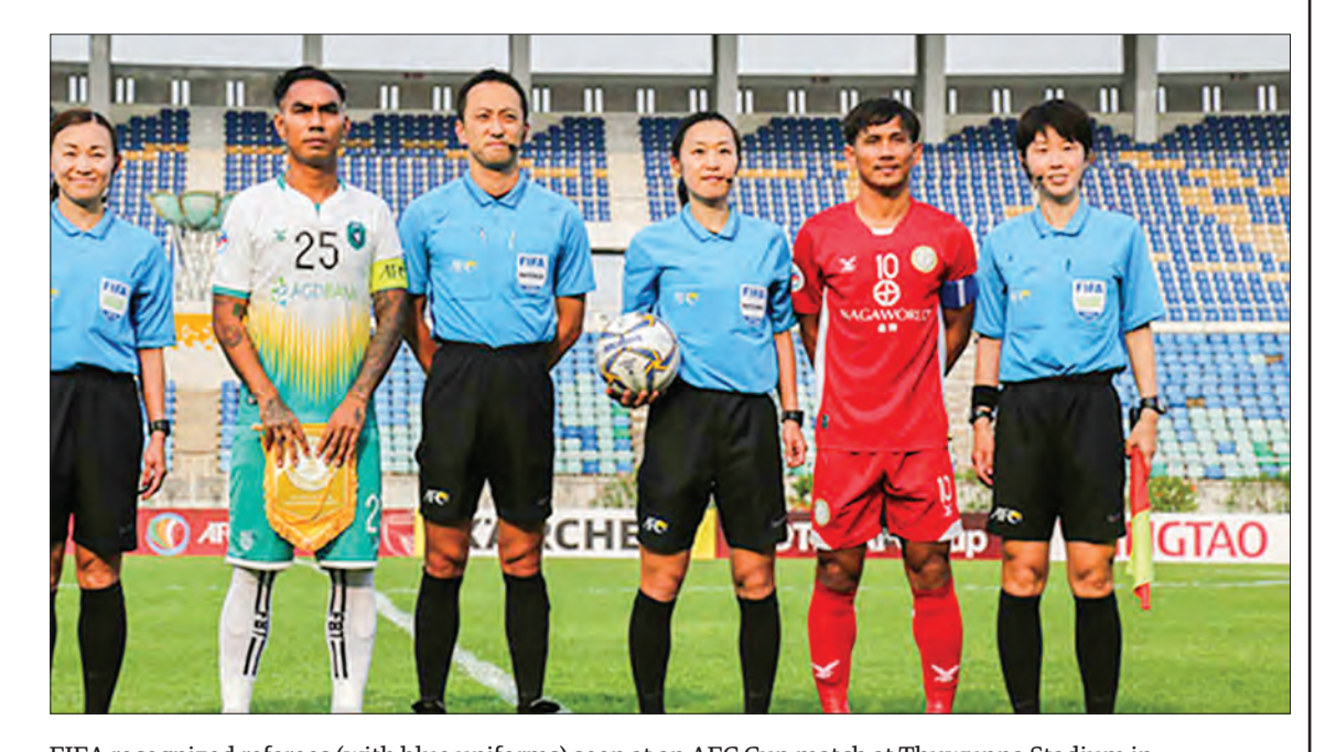
FIFA recognized referees (with blue uniforms) seen at an AFC Cup match at Thuwunna Stadium in Yangon.

A referee training course designed for youths will be conducted at the Thuwunna Stadium in Yangon from 24 to 30 March, according to the Myanmar Football Federation.