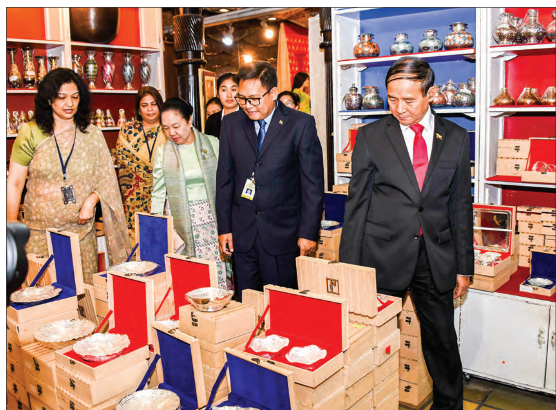
President U Win Myint and First Lady Daw Cho Cho visit souvenir shop at the Central Cottage Industries Emporium in New Delhi, India yesterday.