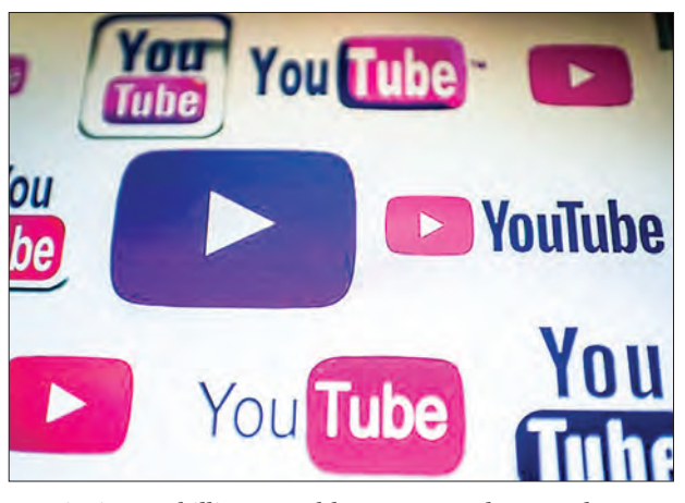
Despite its two billion monthly users, Google-owned YouTube "remains a private forum, not a public forum subject to judicial scrutiny under the First Amendment," according to a US court ruling.

C on servative non-profit PragerU had argued that Google unlawfully limited access to