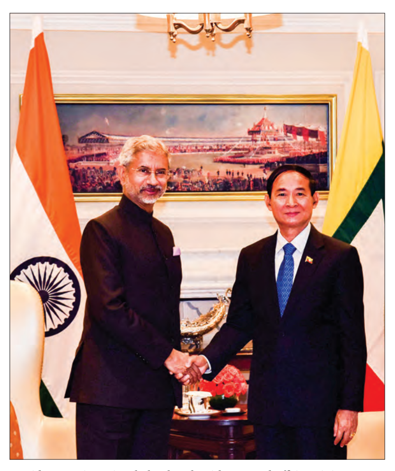
President U Win Myint shakes hands with External Affairs Minister (EAM) Dr S Jaishankar in New Delhi, India yesterday.

A total of 10 MoUs included cooperation for prevention of illegal trades of timber, protecting wildlife, development programmes in Rakhine State, cooperation in medical researches, telecommunications, petroleum products, prevention of trafficking in persons and rehabilitation works.