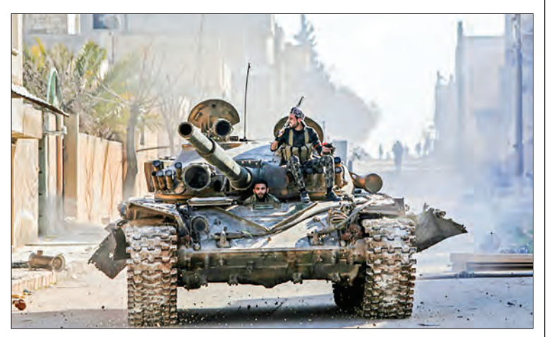
A rebel tank patrols the streets of Saraqeb, reduced to a ghost town abandoned by its residents after weeks of fighting. PHOTO: AFP

The Britain-based Syrian Observatory for Human Rights said that the air strikes were carried out by government ally Russia, which has come under heavy Western criticism for the high civilian death toll from its bombing campaign. State media accused the "terrorists" of launching car bombings and other suicide attacks against government forces attempting to retake the town. — AFP