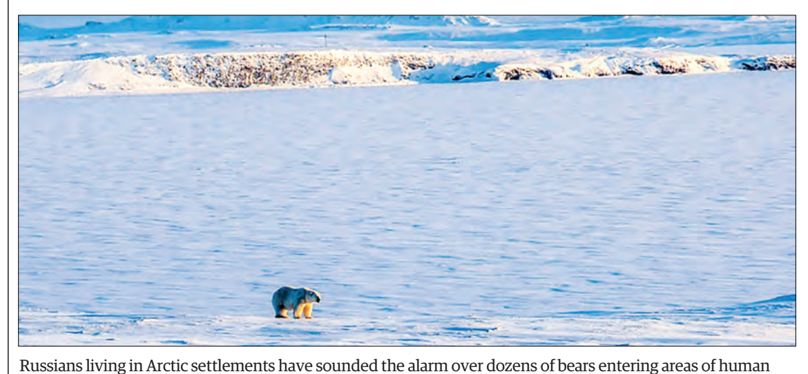
habitation, particularly to raid rubbish dumps for food. PHOTO: AFP

"The Gulf of Ob was always a hunting ground for the polar bear. Now it has broken ice all year round," he said, linking this to active gas extraction on the huge Yamal peninsula that borders the Gulf of Ob, and the launch of an Arctic LNG plant.— AFP