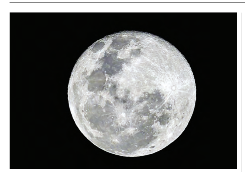
Earth has captured a 'mini moon' but it not likely to be in orbit for long.