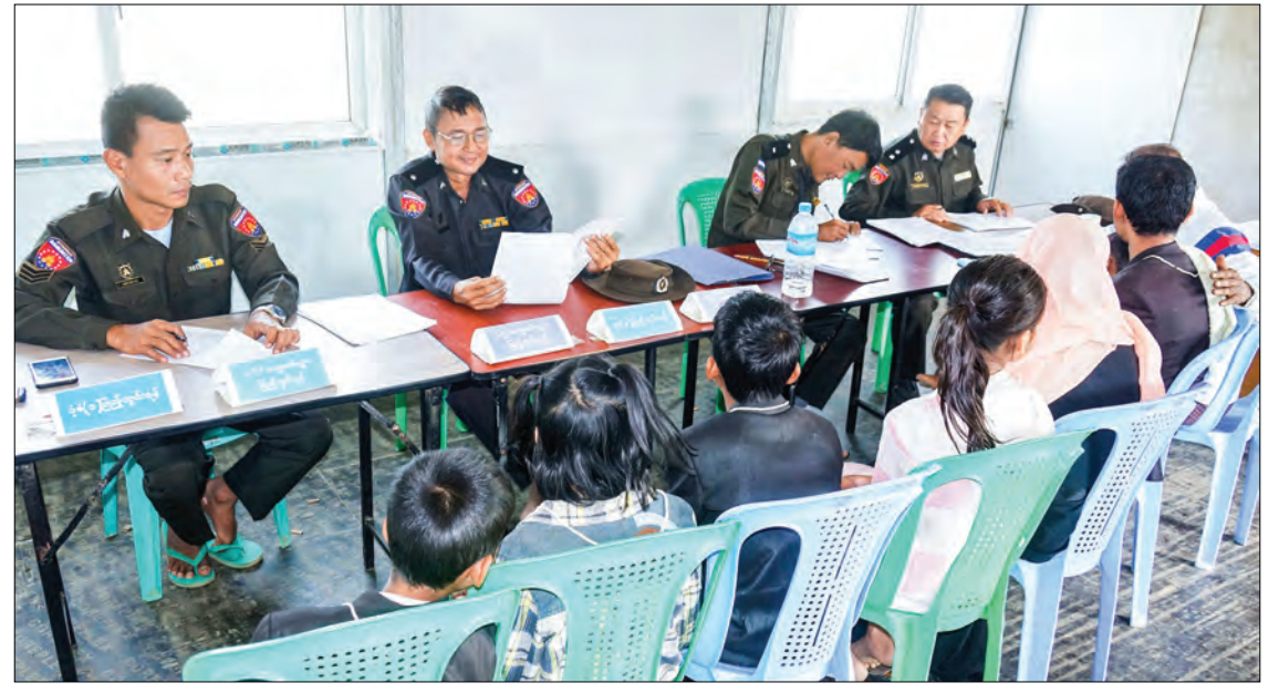
Immigration officials conducting national verification process to the voluntary returnees at the Nga Khu Ya Reception Centre in Maungtaw Township, Rakhine State .