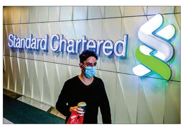
Standard Chartered bank warned income growth will be lower in 2020 because of the coronavirus.

HONG KONG — Standard Chartered said Thursday its pre-tax profit rose to $4.2 billion last year but warned growth for 2020 would likely be dented by the coronavirus outbreak.