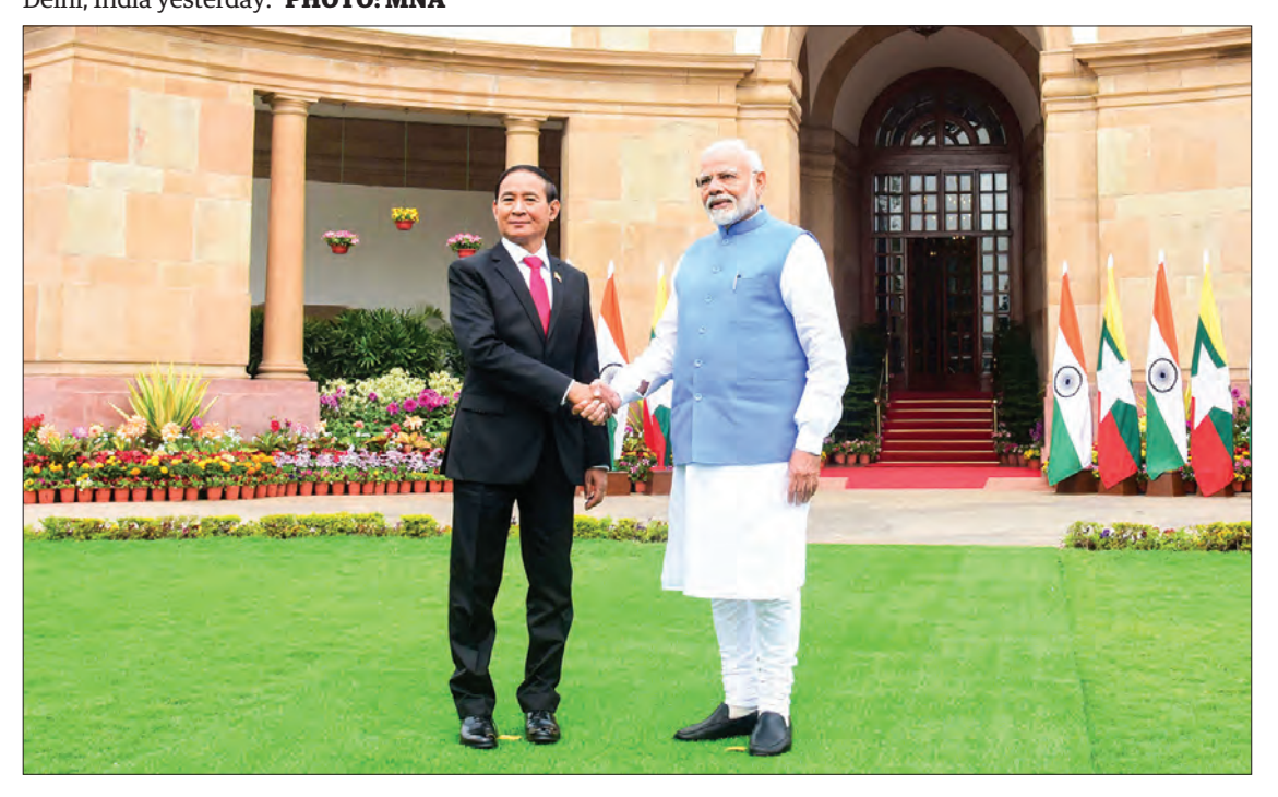
President U Win Myint shakes hands with Indian Prime Minister Shri Narendra Modi in New Delhi, India yesterday.