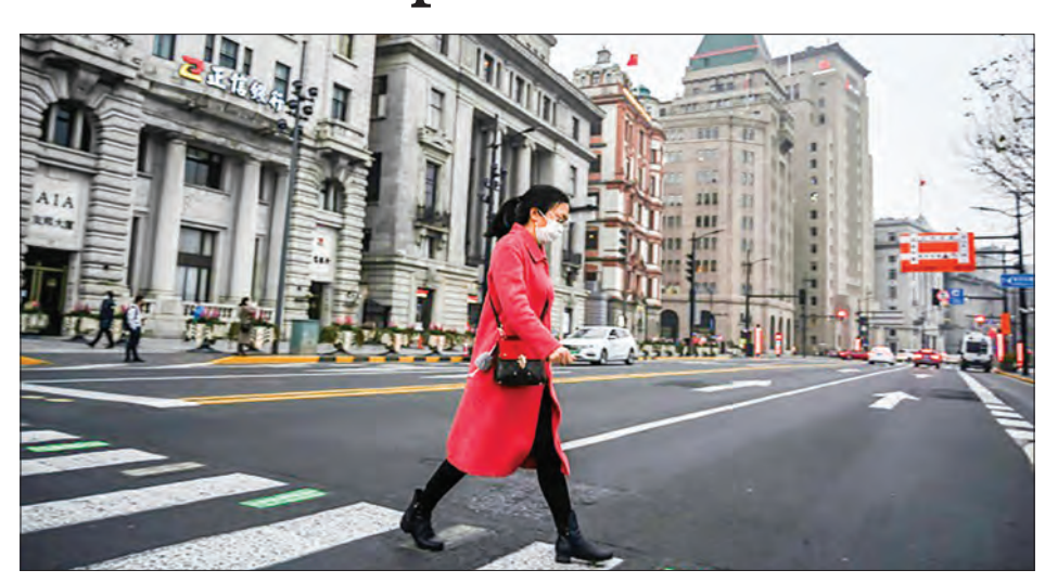
Foreign firms in China have seen a drop in demand due to the virus as well as logistics disruptions with millions of people under quarantine or urged to stay indoors.

BEIJING — Foreign firms in virus-hit China are expecting large drops in revenue, especially for the first half of the year, with some planning to lower their business targets, said trade associations on Thursday.