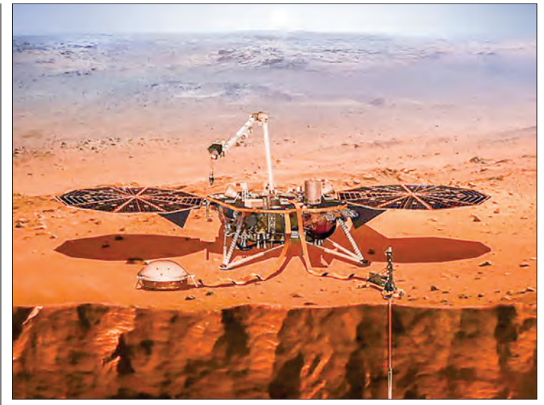
This handout file illustration obtained on 27 April, 2018 shows NASA's Interior Exploration using Seismic Investigations, Geodesy and Heat Transport (InSight).