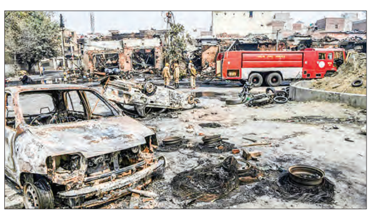
ed Mobs were armed with swords, guns and acid.

A video circulated on social media and verified by AFP showed men ripping off the muezzin's loudspeaker on top of the mosque's minaret and installing a Hindu religious flag.—AFP