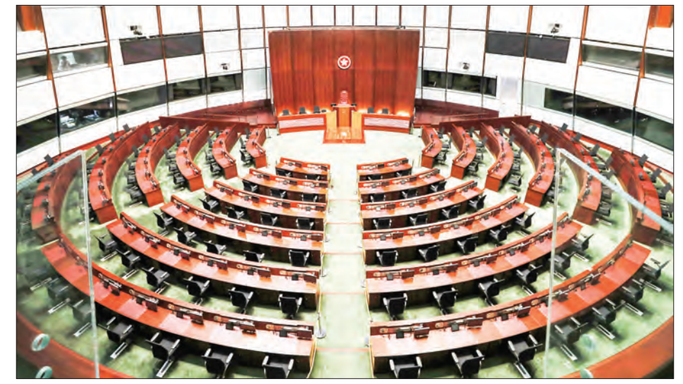
Photo taken 8 October, 2019, shows the chamber of Hong Kong's legislature that underwent repair work after it was occupied on July 1 by protesters opposed to an extradition bill.

with such a budget can we help our community and local enterprises ride out their difficulties." On top of HK$30 billion earmarked for job-saving and economy-boosting measures, a HK$30 billion anti-epidemic fund will ease the financial