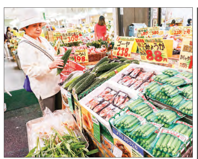
A customer looks at vegetables in a supermarket in Tokyo on 16 July, 2019.