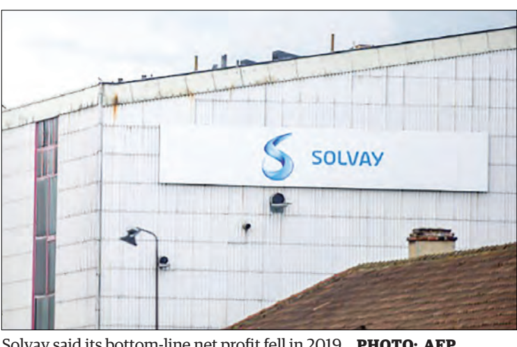
Solvay said its bottom-line net profit fell in 2019.

And the group warned of challenges in the months to come. Results for the first three months of 2020 were "expected to be down by high single digit as a combined result of the 737MAX