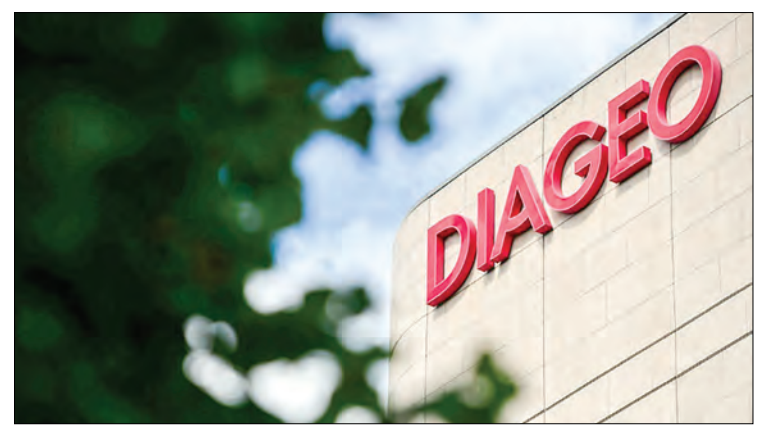
Diageo sees the coronavirus hitting its sales this year. PHOTO: AFP

throughout the group's final quarper cent overall.— AFP