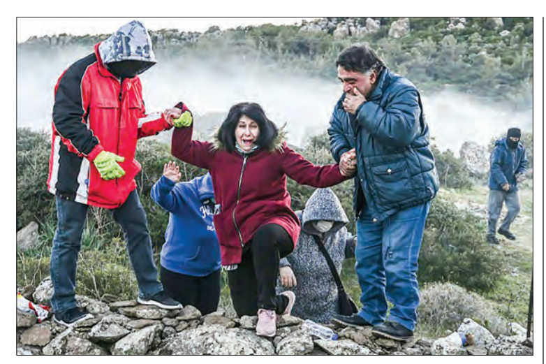
Riot police used tear gas and flash grenades on the protesters.

A diplomat who asked no to be named told AFP that no timetable had been fixed for solving the dispute, adding "we are still far from a result". "We all want to save the JCPOA (Joint Comprehensive Plan of Action, as the deal is known) so that the inspectors can continue their work in Iran," the diplomat said, referring to the inspections by the International Atomic Energy Agency (IAEA). The Vienna-based UN nuclear agency has been tasked with monitoring the deal's implementation and issues regular reports, the latest of which is expected within days. Western diplomats believe Iran is highly unlikely to heed calls to come back into full compliance without substantial concessions in return — such as an end to US sanctions or Europe taking measures to offset their economic impact.—AFP ■