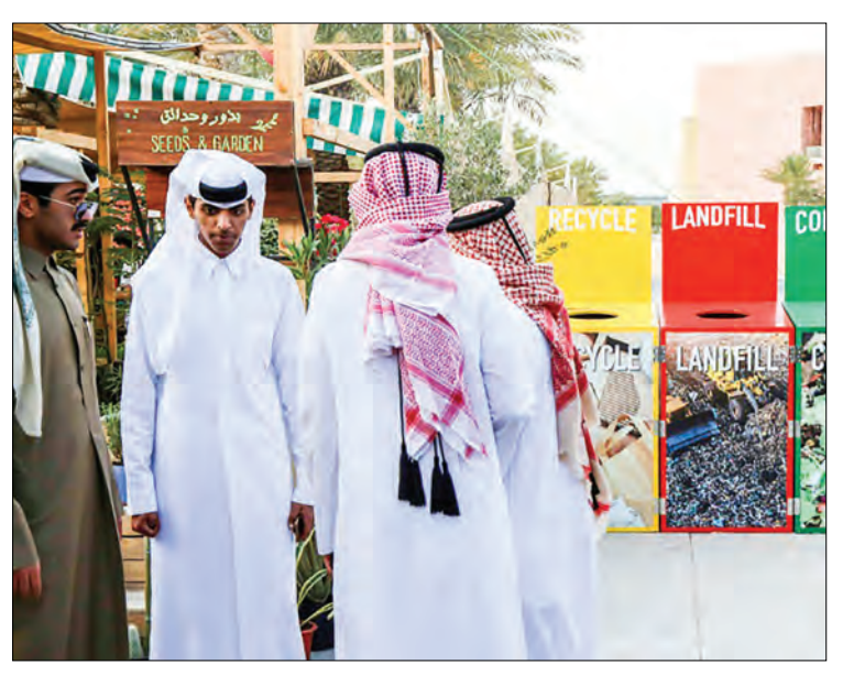
The Torba Farmer's Market in the Qatari capital is encouraging people to sort their waste. PHOTO: AFP

Single-use plastic bottles are entirely banned in favour of water stations that provide free rehydration to visitors and their canine friends.— AFP