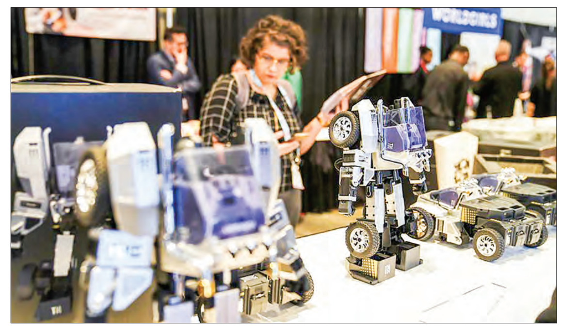
T9 miniature robots are on display at the 2020 Toy Fair New York held in New York, the United States, 25 February, 2020. Robosen Robotics (Shenzhen) Co., a Chinese tech startup, made its debut at the annual Toy Fair in New York City, aiming to bring innovative gadgets to overseas consumers.

The 2020 Toy Fair New York, a four-day event starting Saturday, has drawn more than 1,000 exhibitors from around the world to showcase some 150,000 toys, games and youth entertainment products. Inaugurated in 1903, the exhibition takes place each February as a trade-only event. —Xinhua