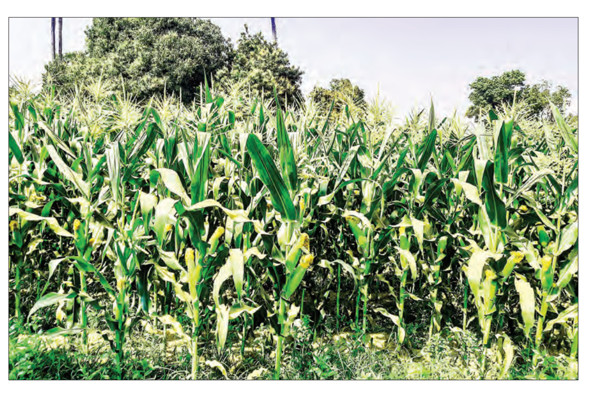
Thriving maize in Pwintphyu Township, Magway Region.

Corn farmers from Nyaungpinwine Village, Pwintbyu Township, use underground water for cultivation. They grow kitchen crops and vegetables commercially. — Ye Win Naing (NyaungU)