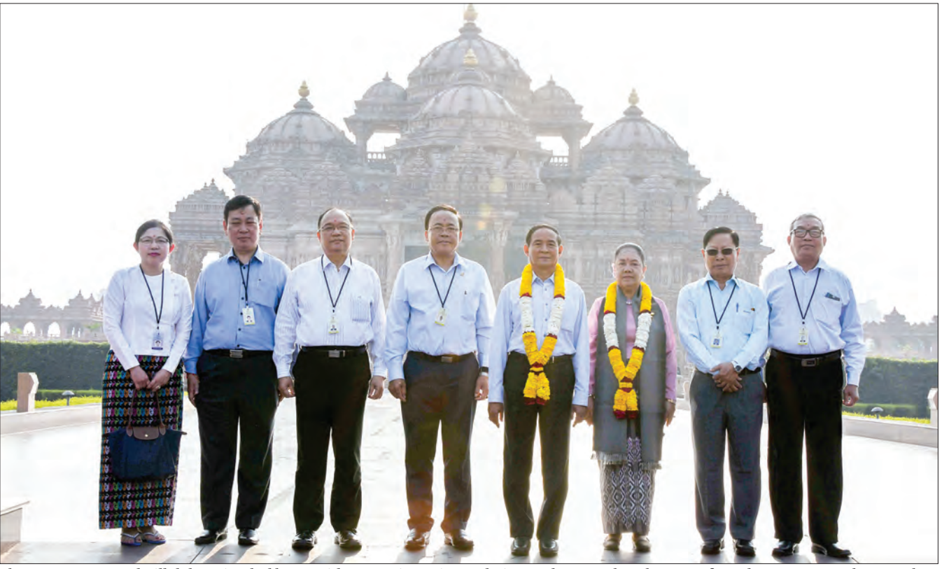
The Myanmar Goodwill delegation led by President U Win Myint and First Lady Daw Cho Cho pose for a documentary photo at the Akshardham Hindu Temple in New Delhi, India yesterday.