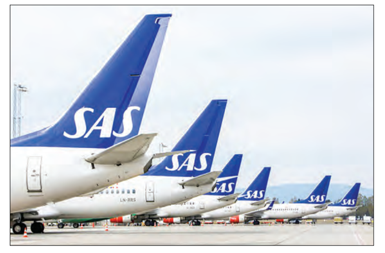
SAS says the economic outlook for the airline sector is "uncertain".