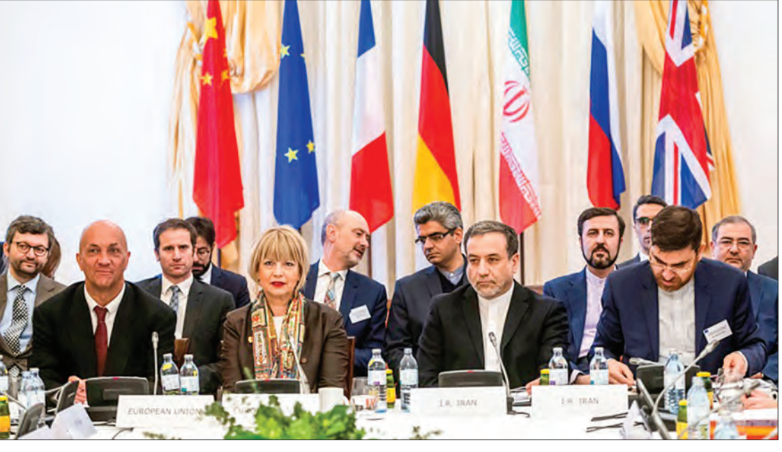
A diplomat who asked no to be named told AFP that no timetable had been fixed for solving the dispute, adding 'we are still far from a result'.

In its last announcement in early January, Tehran said it would no longer observe limits