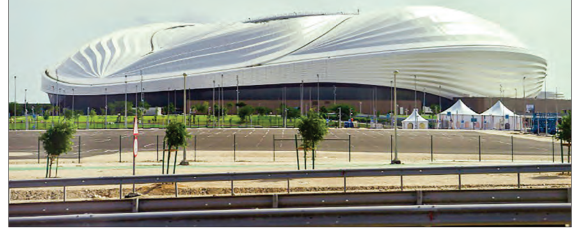
Qatar has parlayed gas riches into a regional reputation for diplomatic efforts -- as well as a controversial 2022 World Cup bid victory.

But if it all goes to plan, when the embargo hits the 1,000-day mark on Saturday, Qatar's emir, Sheikh Tamim bin Hamad Al-Thani, will be riding high on the success of the mediation efforts, at a time when he is shoring up alliances and forging new ones. —AFP