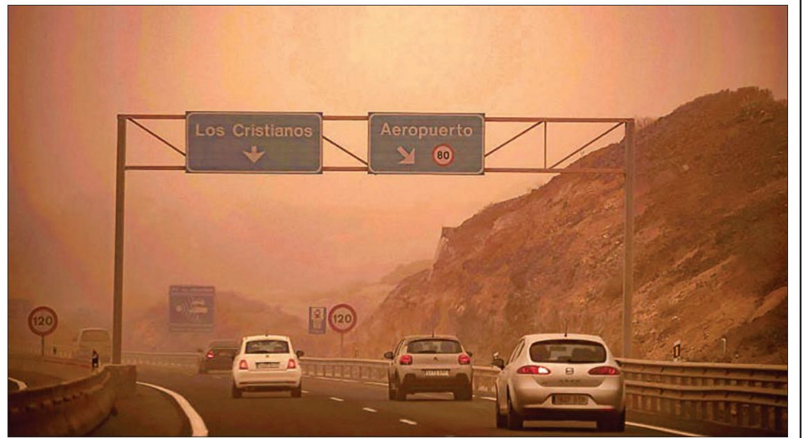
Cars drive on the TF-1 highway during a sandstorm in Santa Cruz de Tenerife, Spain, on February 23, 2020; airports on Spain's Canary Islands were closed after strong winds carrying red sand from the Sahara shrouded the tourist hotspot. PHOTO: AFP

Strong winds also prevented water-dropping aircraft from putting out fires near Tasarte village in southwest Gran Canaria, which have scorched around 300 hectares of land and forced 500 people to be evacuated, as well as in the neighbouring island of Tenerife.—AFP