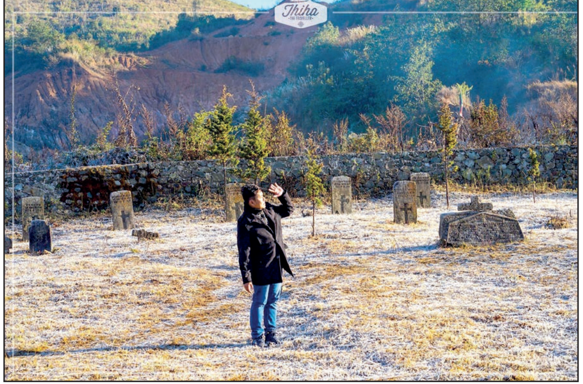
War Cemetery of British soldiers seen in Bernard Village.