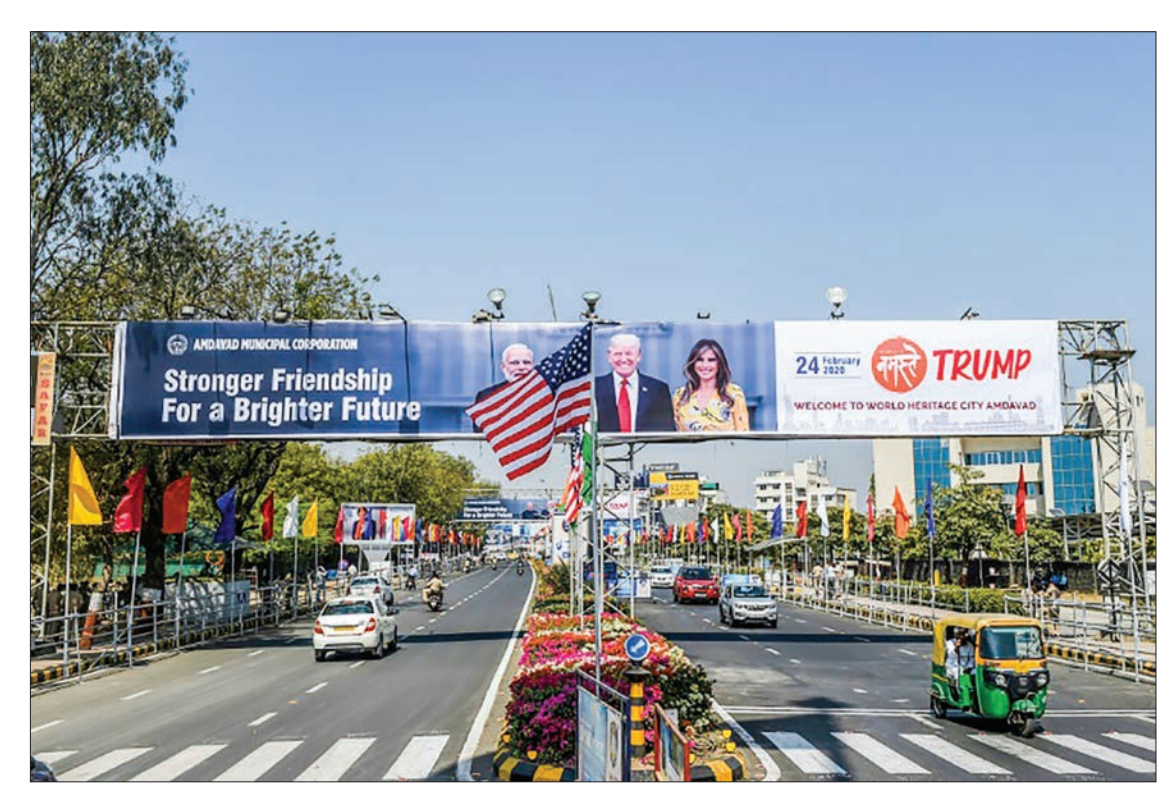
Scores of banners and hoardings with pictures of Donald Trump and Indian Prime Minister Narendra Modi have been put up across Ahmedabad in western India.

The route will be lined with thousands of people -- well short of the 6-10 million Trump says he has been told will attend -- as