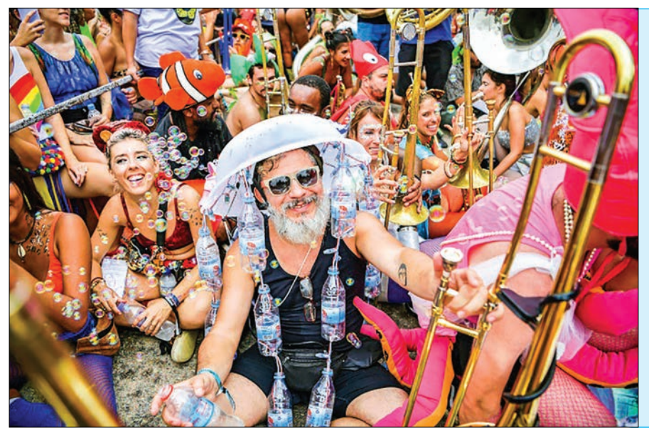
The Amigos da Onca street party heats up Rio de Janeiro ahead of the city's famous carnival parades.

The most successful school in the history of the contest, Portela, will pay tribute to Brazil's indigenous Tupinamba people, who lived in Rio de Janeiro before the Portuguese colonizers arrived.—AFP