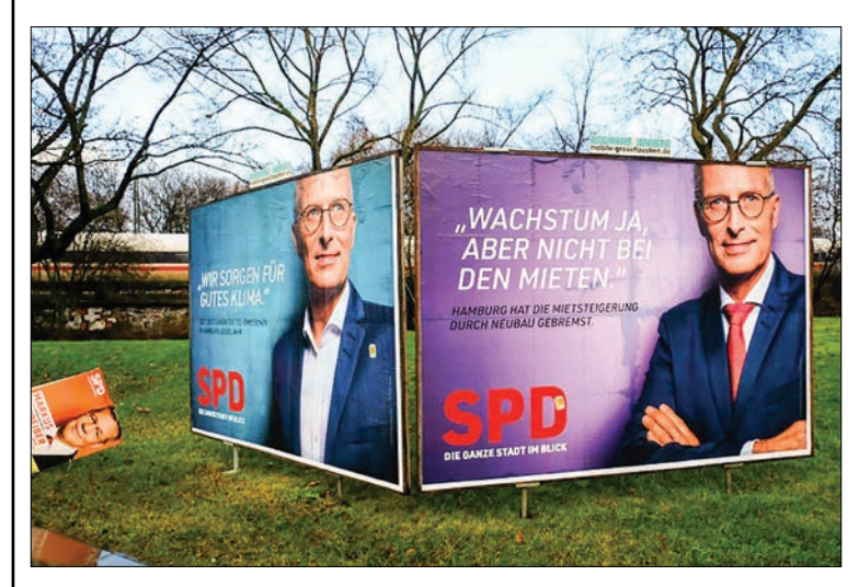
The lead candidate for the centre-left SPD, Peter Tschentscher, is currently Hamburg's mayor.

In part, the centre left has done so by adopting policies with a distinctly "green" feel, including a proposal to convert a massive coal power plant to natural gas so as to slash greenhouse emissions.—AFP