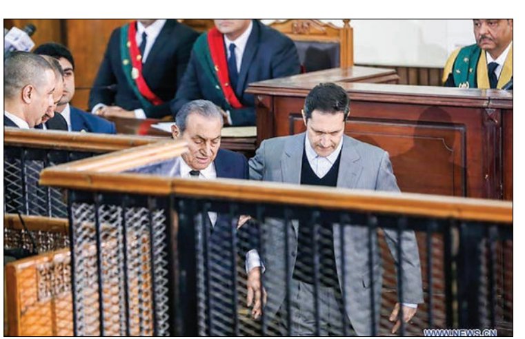
File photo taken on Dec. 26, 2018 shows Alaa Mubarak ( 2^{nd} R) and his father, ousted Egyptian president Mohamed Hosni Mubarak (C), in a court in Cairo, Egypt.

the Cairo Criminal Court acquitted Alaa and Gamal, and others, in the case known in the media as "manipulating the stock exchange." The defendants faced charges of violating the rules of Egypt's stock exchange market and the Central Bank of Egypt.