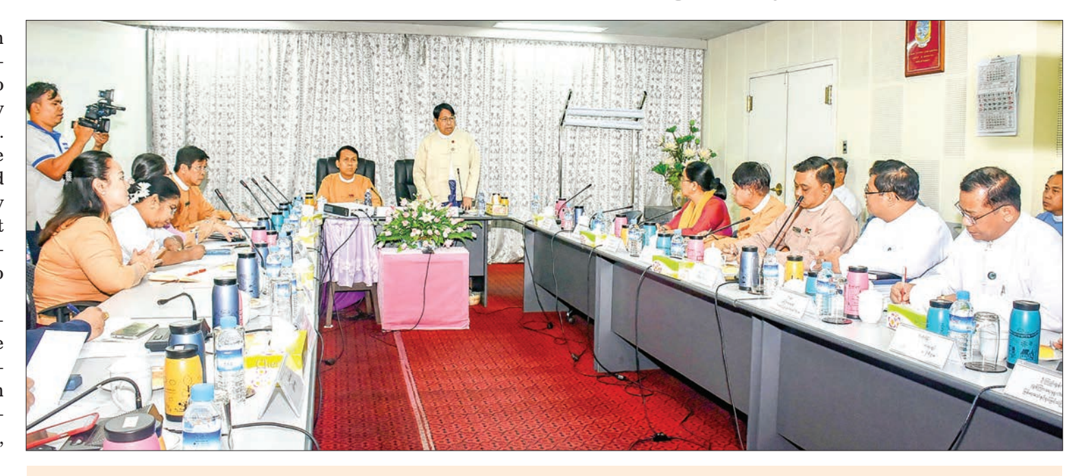
Union Minister Dr Pe Myint addresses the meeting to launch a broadcast media City Channel in Yangon yesterday.

He also remarked the City Channel would become an ef-