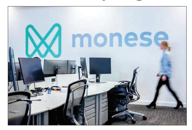
Monese is a British digital app-based bank that attracts urban millennials and has spread to 31 European countries with two million customers in only five years.

BRITAIN — Among Britain's digital app-based banks that are attracting moneyed urban millennials is Monese, which also courts customers neglected by the country's established lenders.