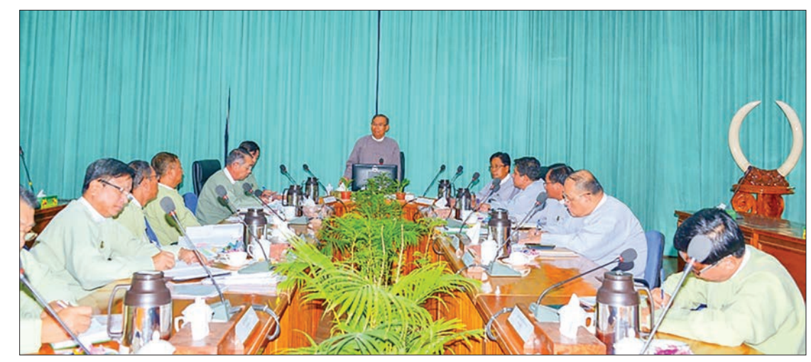
Union Minister U Ohn Win addresses the coordination meeting for conserving the watershed areas around Inle Lake in Shan State yesterday.

Speaking at the meeting, the Union minister stressed the need for the first 10-year project. which is planned from the 2020-2021 fiscal year to the 2029-2030 fiscal year, to link with existing environmental conservation