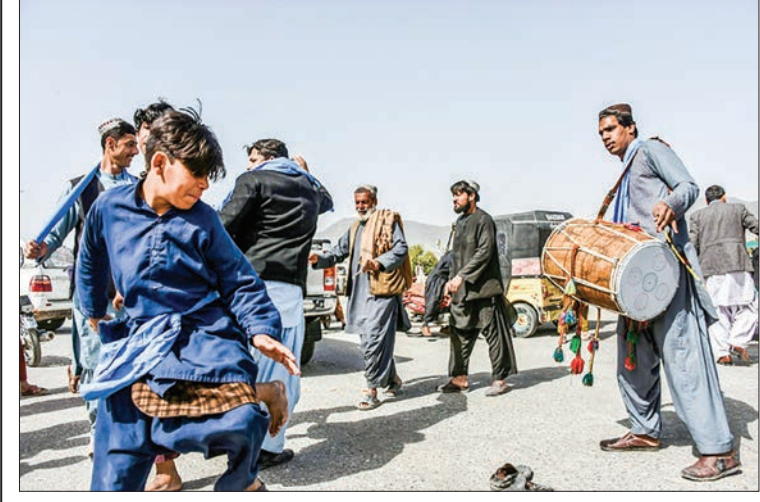
Afghans dance as they celebrate the first day of a "reduction in violence" agreement between the Taliban, US and Afghan forces in Kandahar.

Two separate officials with knowledge of the country's telecoms industry in northern Afghanistan also confirmed that mobile networks were being restored in insurgent-hit are-