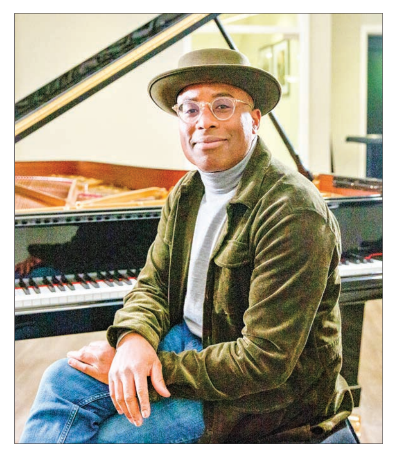
British pianist and composer Alexis Ffrench poses for a photograph after giving an interview at Steinway & Sons in London on 19 February 2020.

"I think my duty is to change the narrative." —AFP