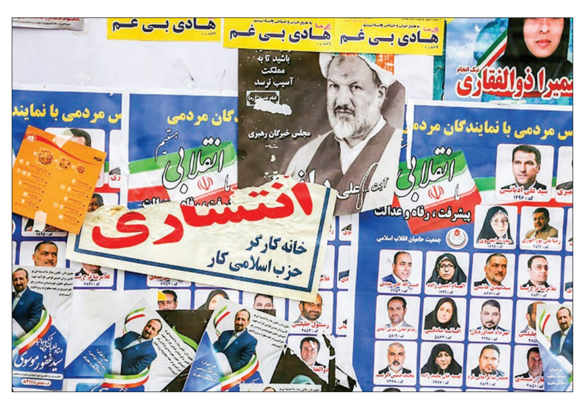
Iranians voted in a parliamentary election on Friday, two days after the announcement of an outbreak of the new coronavirus in the country.

A low turnout had already been expected after a conservative-dominated electoral watch-