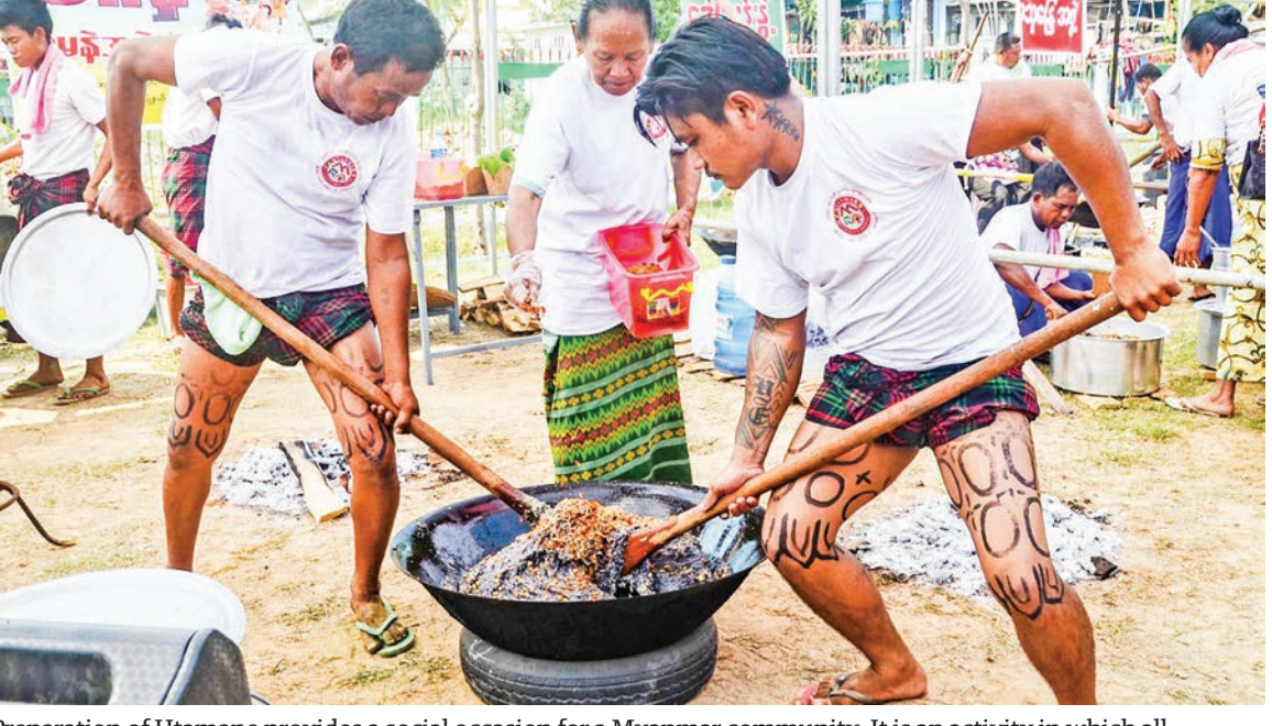
Preparation of Htamane provides a social occasion for a Myanmar community. It is an activity in which all nvolved. Men are making Htamane in the festive activity in Mandalay.

There are many old saying such as nar ye yo tay Tabodwe (နာရည်ယိုရွဲ တပို့တွဲ) we have runny nose in Tabodwe, ze win byet pyay February, wild plum ripe open and Htamane tyoe pyay Tabodwe (ထမနဲထိုးပွဲ တပို့တွဲ). In Myanmar Delicacy called Htamane is concocted. We made concocting Htamane or delicacy. Myanmar traditional medicine men recommend eating Htamane or Myan-