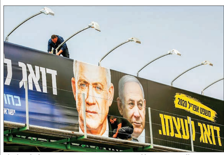
The head of one community organisation said he was not willing to cut services because "some crazy members of the Knesset" were incapable of forming a government.

JERUSALEM — Israel's grinding political deadlock has squeezed funding for programmes helping troubled youths, disadvantaged communities and the disabled, forcing state-backed social organisations to rely on crowd-funding