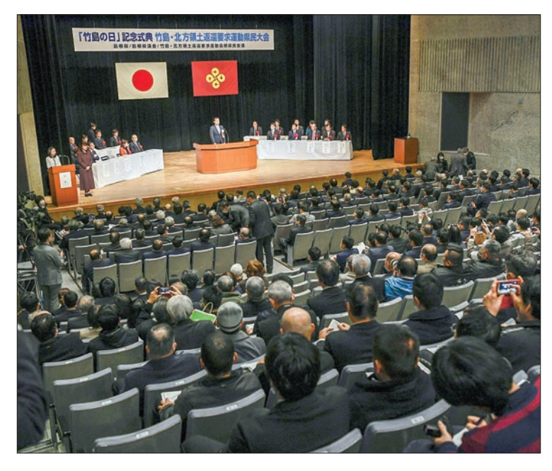
A ceremony to mark Shimane Prefecture-designated "Takeshima Day" is held in Matsue, western Japan, on Feb. 22, 2020.

Saturday its claim to a pair of South Korea-controlled islets at an annual ceremony amid lingering tensions between the two countries over wartime issues.