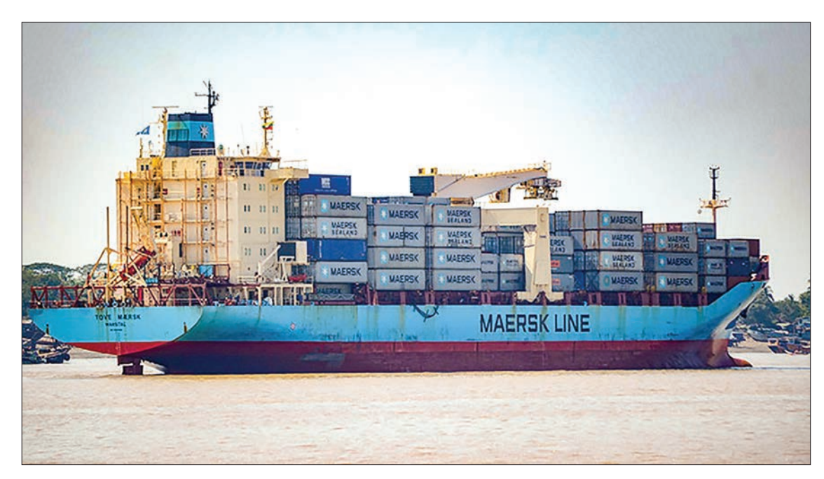
A container ship crossing the Yangon River.

The government is trying to cut the trade deficit by screening luxury import items and boosting exports. Myanmar's trade deficit was pegged at $1.14 billion in the 2018-2019 fiscal year, $1.3 billion in the last mini-budget period (April-September, 2018), $3.9 billion in the 2017-2018FY, $5.3