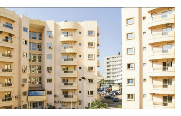
Housing boom: New apartment blocks are being built in Dakar, but spiralling rents make living there a distant dream for many.

The tenants above and below him have both left, says the 64-year-old electrician, from a faux-leather armchair in his threadbare