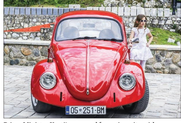
Prime Minister Kurti's proposal for reciprocity with Serbia would mean for example a ban on Serbian license plates in Kosovo, as Kosovar plates are prohibited in Serbia.

Kurti, who took office in early February, is backed by most of 1.8 million inhabitants of the former Serbian