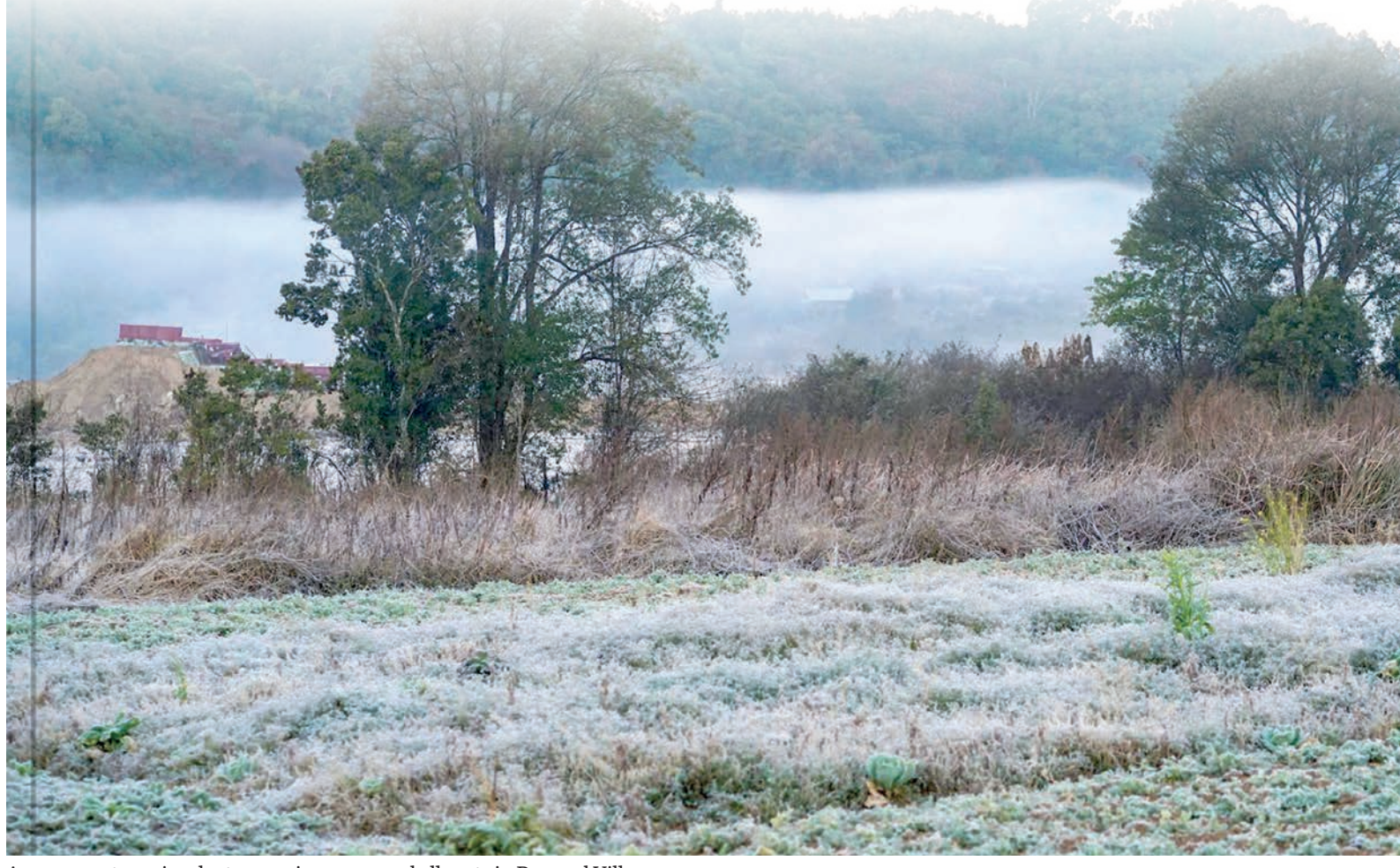
A scene captures icy dusts covering crops and all parts in Bernard Village.

Villagers look like Chinese. Their clothes and behaviors are similar to that of Chinese. They are honesty and frank. When I