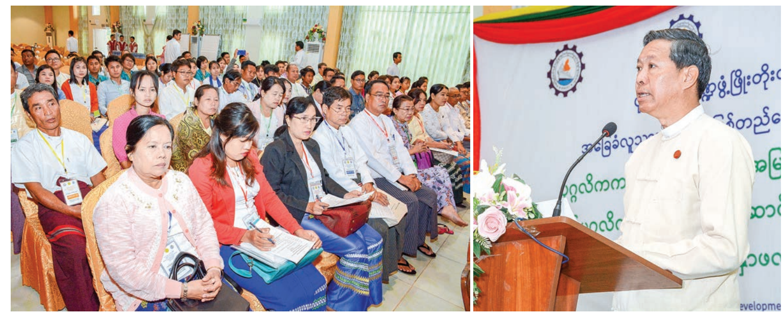
Union Minister Dr Myo Thein Gyi delivers the speech at the seminar held to develop coordination programmes between the government and private sectors for human resource development.

He also talked on the National Education Strategic Plan (2016-2021) of the Ministry of Education, ordinary