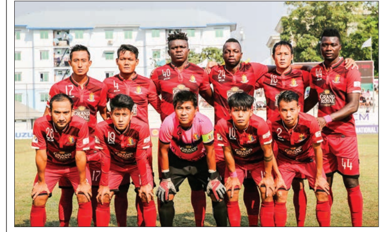
Hantharwady United F.C. players pose for a group photo before an earlier MNL match against Sagaing United.