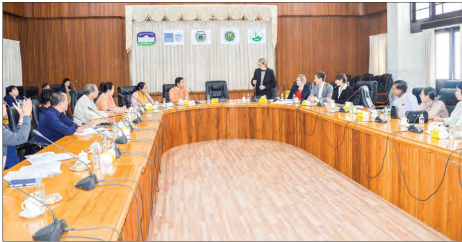
2 nd Workshop for Multiple Risks Management in Extreme Events held in Yangon.

“We are making efforts to be safe from increased risks of rapid and slow onset natural disasters and live in sustainable, inclusive, low carbon, climate resilient towns.” We are also