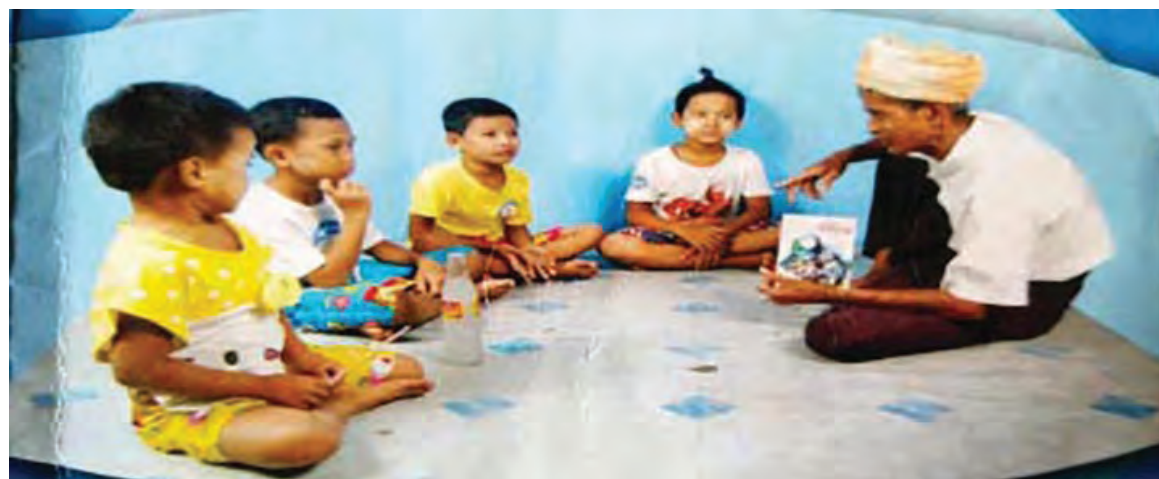
Grandfather telling stories to the children.

As for ordinary readers, they may not easily appreciate the remarks made by the scholars. However, as for those who have knowledge of children's literature, they may easily detect the essence of storytelling which is the source of children's litera-