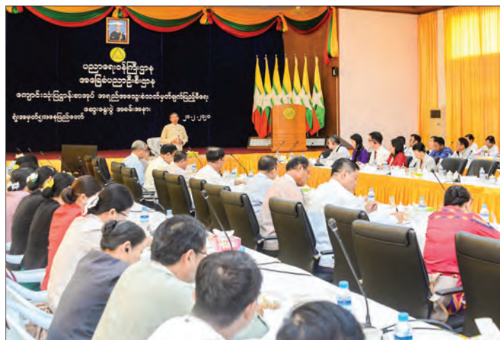
Union Minister Dr Myo Thein Gyi delivers the speech at the Education Ministry meeting in Nay Pyi Taw yesterday.