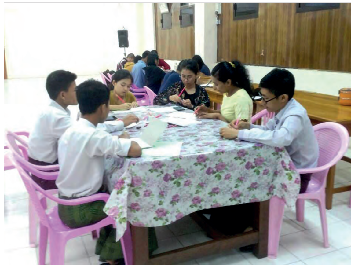
Storytelling workshop organized by Third Story Project held in downtown Yangon on 17 February.

Children love to listen to tales or stories told by their parents. When they grow up, they surely will tell their children the tales they themselves heard from their parents.