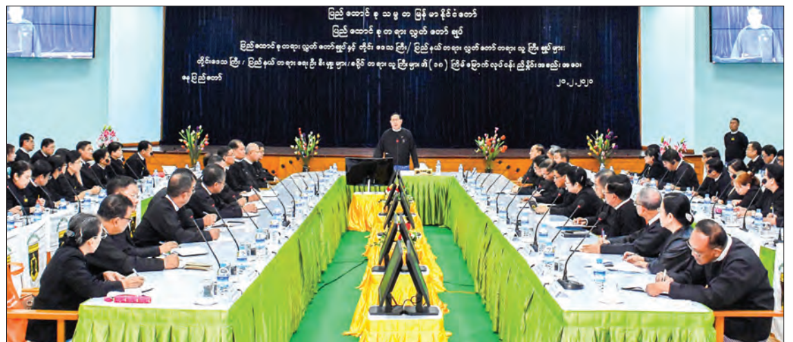
Union Chief Justice U Htun Htun Oo addresses 18 th coordination meeting of Union Supreme Court and states/regions High Courts at the meeting hall of Union Supreme Court in Nay Pyi Taw yesterday.

The Court-led Mediation Pilot Programme is being undertaken for the civil cases and the momentum of its good results should be maintained. If court performance, accessibility to court, and accountability are improved there will be increasing numbers of people relying on the judicial sector. Timely measures should be carried out to manage and prevent, in accord with the procedures, the losses and damages of the confiscated goods and exhibits. The Supreme Court of the Union shall enhance the judicial cooperation with regional judicial institutions for cross-border civil and commercial cases under its judicial reform programme in