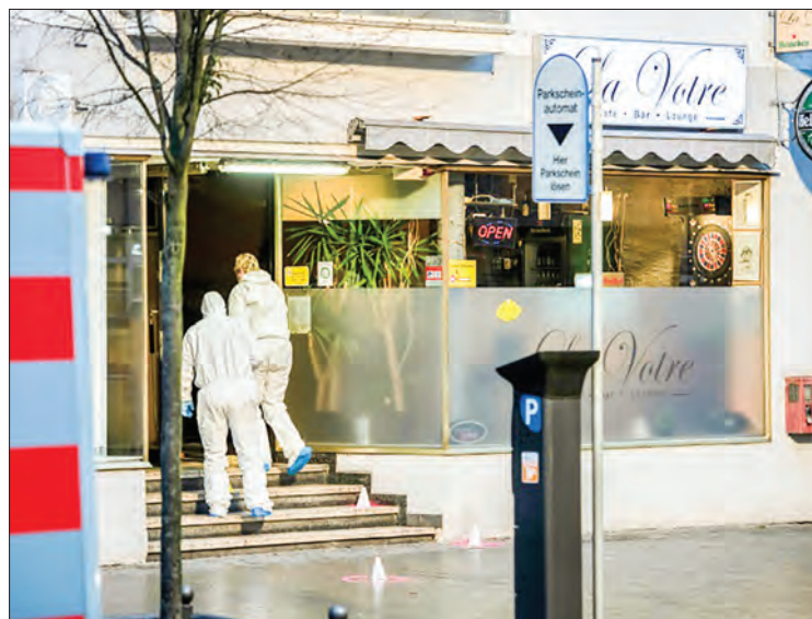
The attacks occurred at two bars in Hanau, near Frankfurt, where police quickly fanned out and police helicopters roamed the sky in the search for those responsible for the bloodshed.

The potential for further mass displacement and even more catastrophic human suffering "is apparent," as an increasing number of people are hemmed into an ever-shrinking space, said the envoy while elaborating on the deteriorating situation in the country.— Xinhua ■