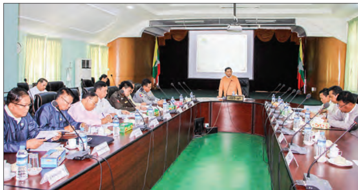
Bago Chief Minister U Win Thein addresses the coordination meeting on hotels and tourism development at the Bago regional government office on 19 February.