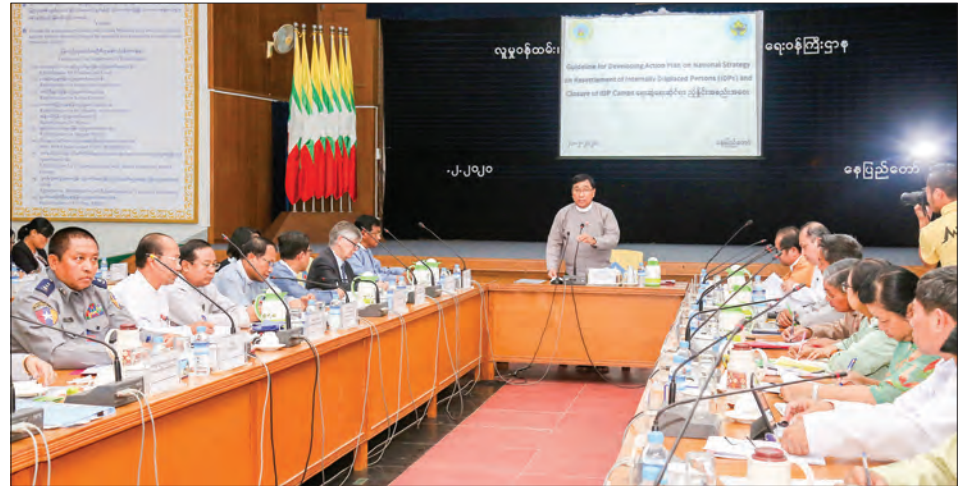
Union Minister Dr Win Myat Aye addresses the coordination meeting to draft a guideline for developing action plan on National Strategy on Resettlement of Internally Displaced Persons (IDPs) and closure of IDP camps.

The Union Minister first gave a speech, where he said the IDP camps were set up in response to conflicts in Myanmar and there are 128 camps in Kachin, Kayin, Shan and Rakhine states. He said the camps are temporary and it is the government's duty to resettle the camp inhabitants. He said this is why the national strategy for that purpose was published in November 2019 and the contents explained to states with IDP camps. The Union Minister said there should be action plans and guidelines to assist in selection of priority IDP camps for resettlement and to address the educational, healthcare and employment needs of the people