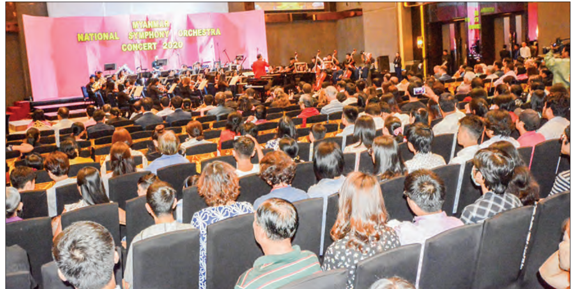
The Myanmar National Symphony Orchestra and Japanese musicians perform the audiences at the Novotel Hotel in Yangon.