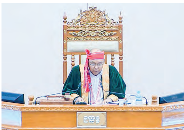
Amyotha Hluttaw Speaker Mahn Win Khaing Than.

The figures have shown that each station needs to fill 4,200 vehicles in average each day,