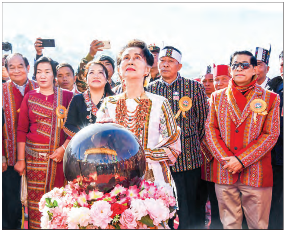
State Counsellor Daw Aung San Suu Kyi unveils the signboard of 72 nd Chin National Day in Thantlang Township in Chin State, yesterday.

S TATE COUNSELLOR Daw Aung San Suu Kyi, in her capacity as the Chairperson of the Central Committee for Development of Border Areas and National Races, gave a congratulatory speech at the celebrations of 72 nd Chin National Day, which was held in Thantlang Township.