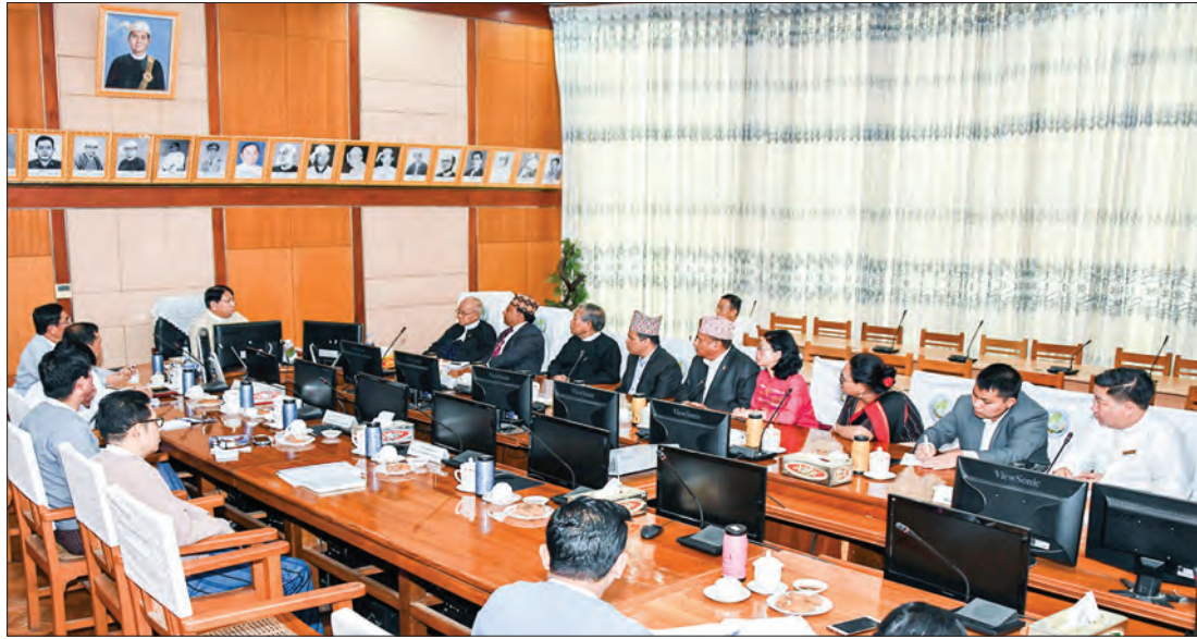
Union Minister Dr Pe Myint meets with Nepalese media delegation led by Mr Kishor Shrestha, Chairman of the Press Council of Nepal, in Nay Pyi Taw yesterday.

UNION Minister for Information Dr Pe Myint met with a Nepalese media delegation led by Mr Kishor Shrestha, Chairman of the Press Council of Nepal at his office in Nay Pyi Taw yesterday.