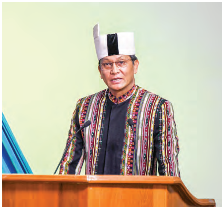
Vice President U Henry Van Thio delivers the opening speech at the 72 nd Chin National Day celebration in Pynmana, Nay Pyi Taw Council Area, yesterday.

VICE President U Henry Van Thio delivered a speech on the occasion of the 72nd Chin National Day celebration held at the Mingalabyuha Sasana Beikman in Pynmana Township, Nay Pyi Taw Council yesterday evening.