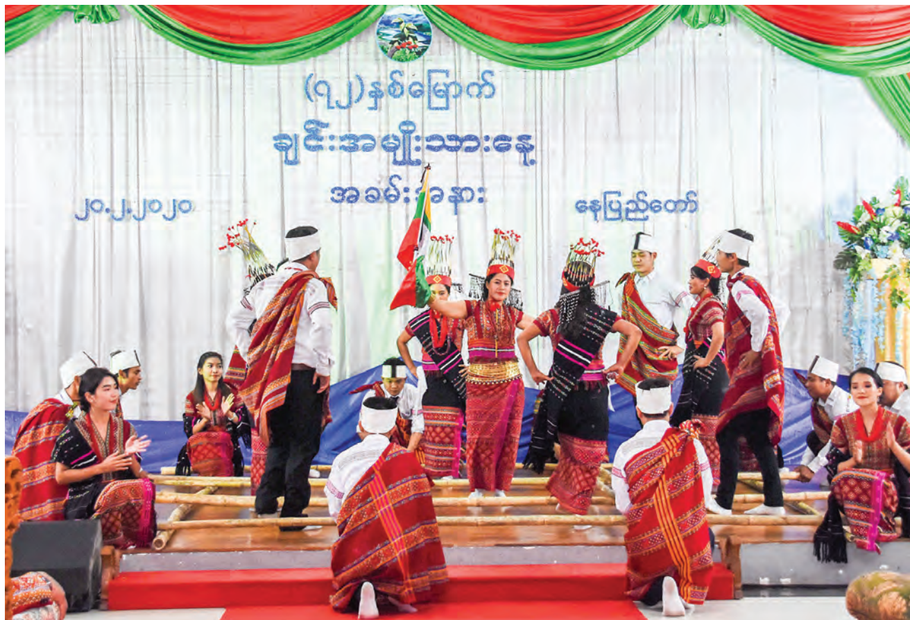
Chin dance troupe performing traditional dance on stage, during the ceremony marking the 72nd Chin National Day in Nay Pyi Taw.