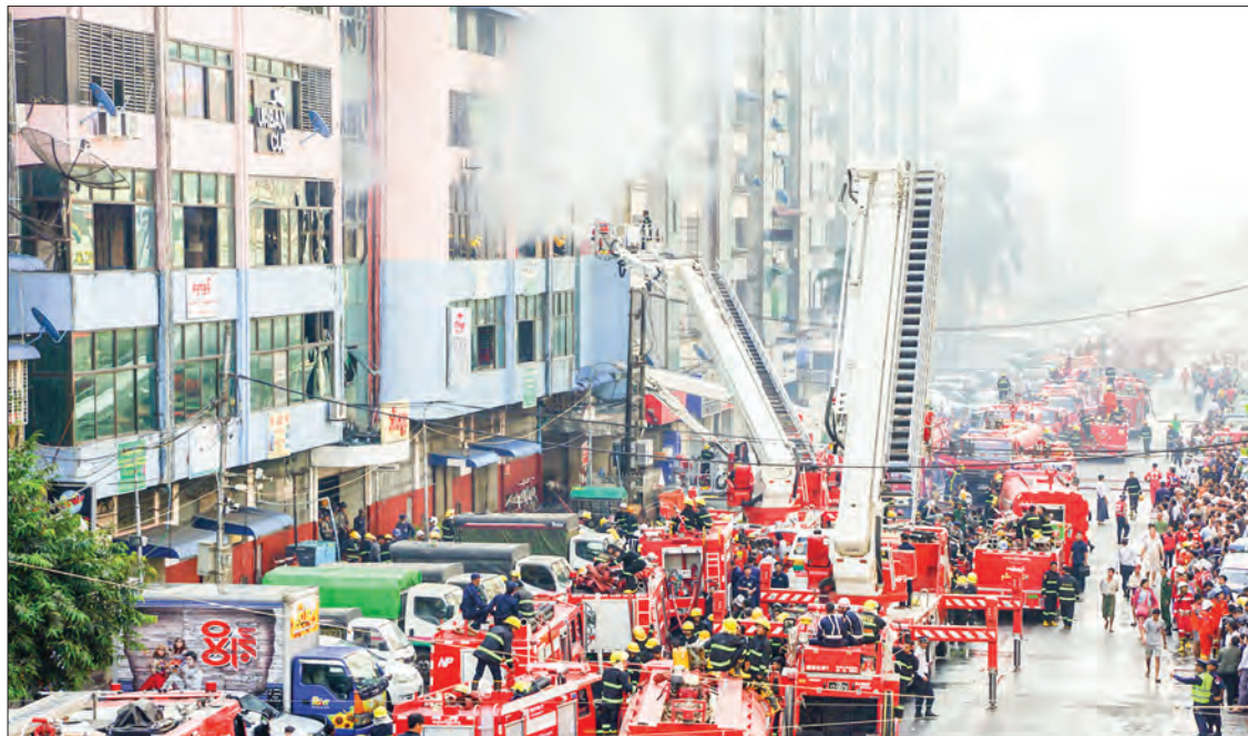
Firefighters putting out fires at Than Zay building in Yangon's Latha Township.

While an initial report says the fire was caused by an electrical short circuit, officials are looking for other causes and the extent of the damage. The building has been temporarily closed and undergoing inspection for structural integrity.—MNA (Translated by Zaw Htet Oo)