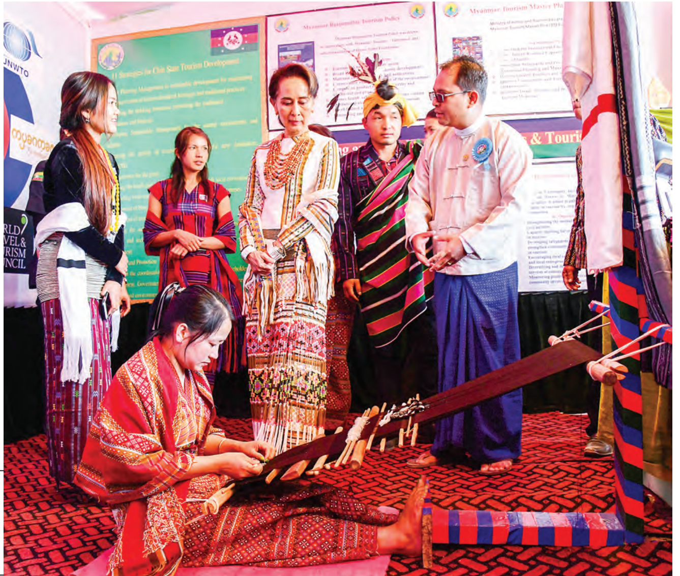
State Counsellor Daw Aung San Suu Kyi observes traditional hand weaving of textiles at the 72 nd Chin National Day celebration in Thantlang in Chin State yesterday.