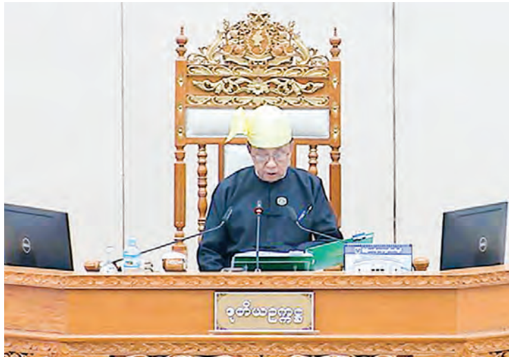
Pyithu Hluttaw Deputy Speaker U Tun Tun Hein.