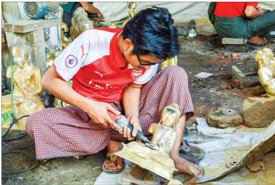
A man making bronze Buddha statue in Amarapura Township, Mandalay Region.