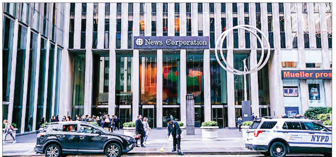
The News Corporation building on 6th Avenue, New York, home to Fox News, the New York Post and The Wall Street Journal. China on 19 February, ordered three reporters from The Wall Street Journal to leave the country.

responsible countries understand that a free press reports facts and expresses opinions." —Kyodo News ■