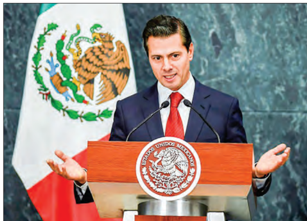
Enrique Pena Nieto is being investigated over graft allegations at Mexican oil firm Pemex.

The ex-leader could be charged as the investigation continued, according to the official quoted in the newspaper's Wednesday report.