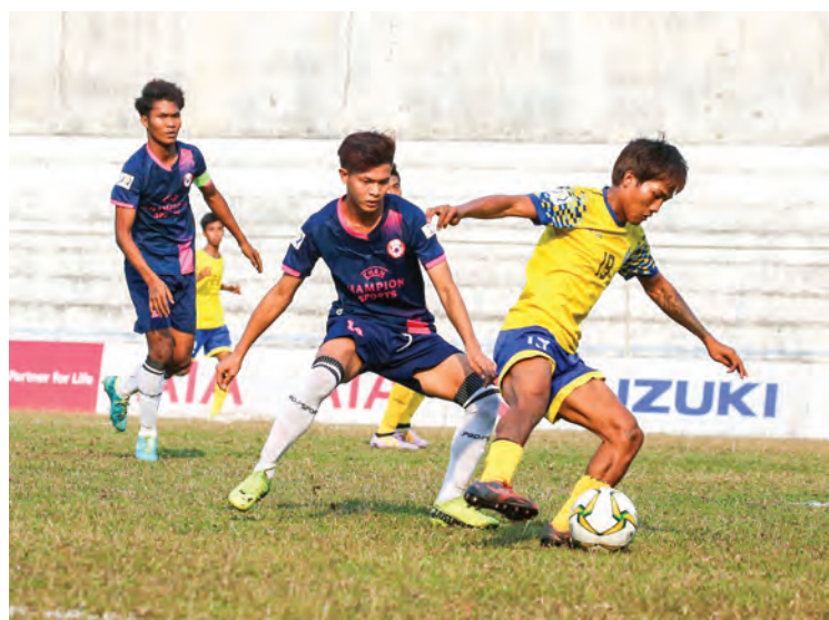
A Silver Stars FC player (yellow) tries to block the ball during a Myanmar National League II match against Yaw Myay FC, held yesterday at the Padonmar Stadium in Yangon.