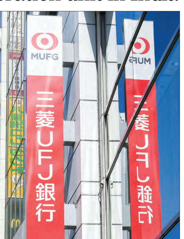
Photo taken on 21 February, 2019, shows a sign for MUFG Bank in Tokyo.

By utilizing the world's largest digital workforce in India, the bank aims to build a more sustainable and efficient system operation platform, the statement said. -Kyodo News