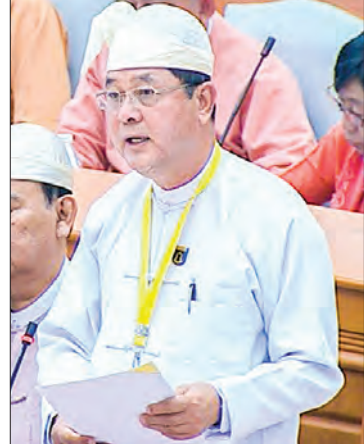
Judge of Union Supreme Court U Thar Htay.

The Speaker also announced to put the report, discussions of MPs and explanations of commission and the ministry on the record.