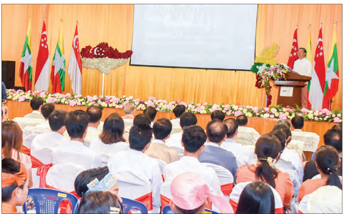
Union Minister Dr Myo Thein Gyi delivers the opening address at the handover ceremony of the Singapore-Myanmar Vocational Training Institute in Yangon yesterday.

So far: a total of 3.060 students who had finished their high school education already completed the SMVTI's courses on industrial