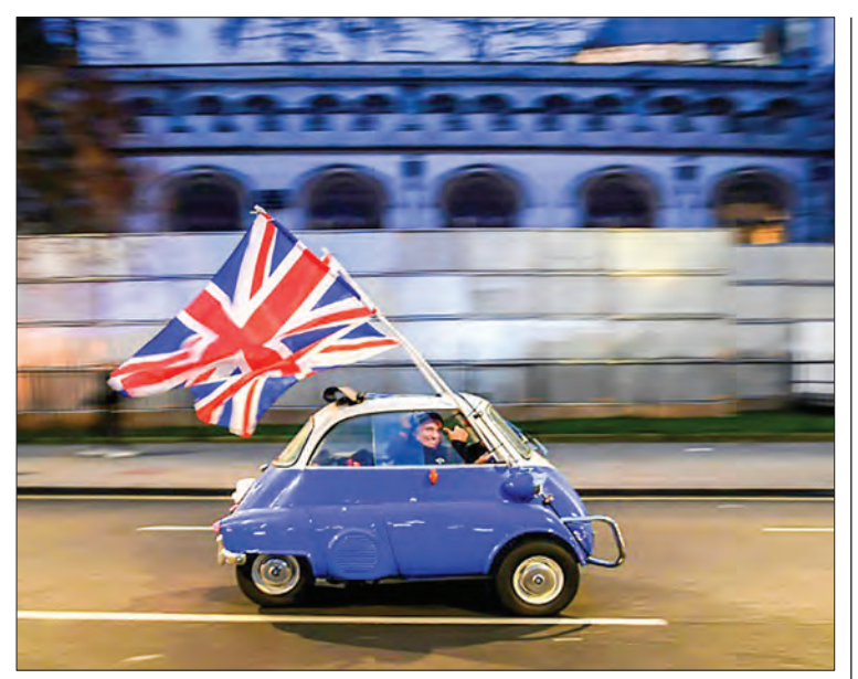
London's aim is to "reduce overall migration numbers", a key demand of Brexit supporters.