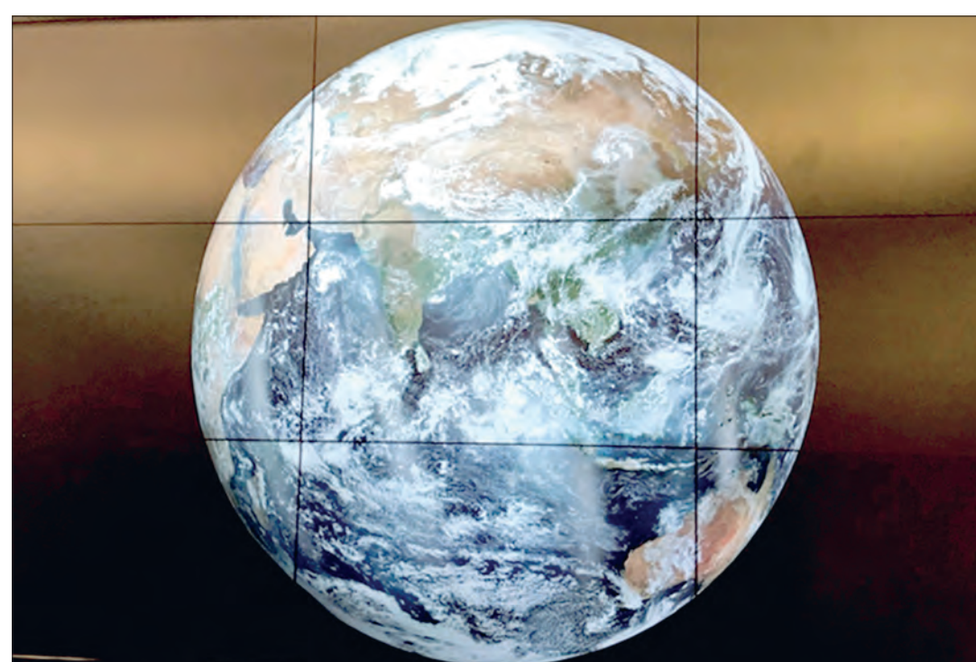
The Planet Earth.

Many different sciences are used to learn about the Earth; however, Hobart M. King classified the four basic areas of Earth science study such as geology, meteorology, oceanography, and astronomy. A brief explanation of