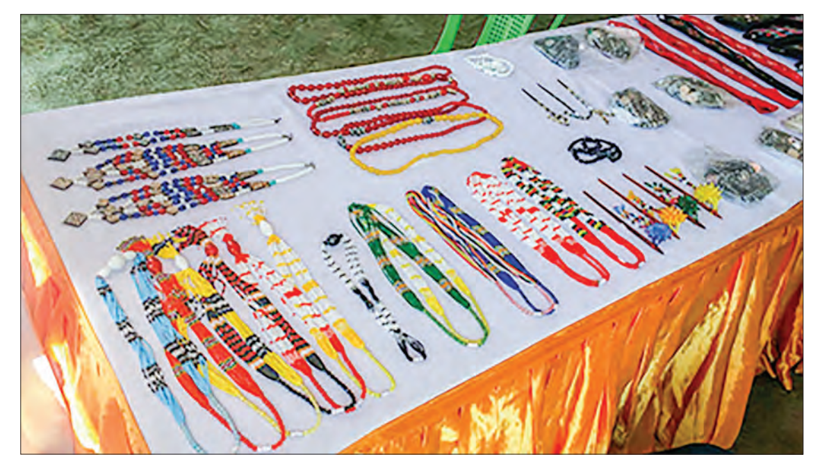
Chin traditional handicrafts put on display at a shop in Thantlang Town, Chin State.

WITH the 72<sup>nd</sup> Chin National Day drawing near, Chin traditional costumes, souvenirs, and gifts are selling well, said traditional costume sellers from Thantlang Town of Chin State.