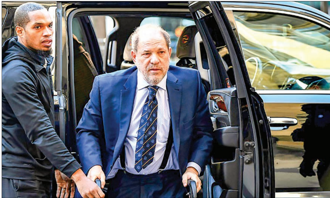
Harvey Weinstein faces life in prison if convicted of predatory sexual assault charges in New York.

She stressed that prosecutors had failed to present any forensic evidence or eyewitness accounts. The prosecution’s case rests on whether the jury believes the six women, including actress Annabella Sciorra of “The Sopranos,” who testified that Weinstein had sexually assaulted them. — AFP ■