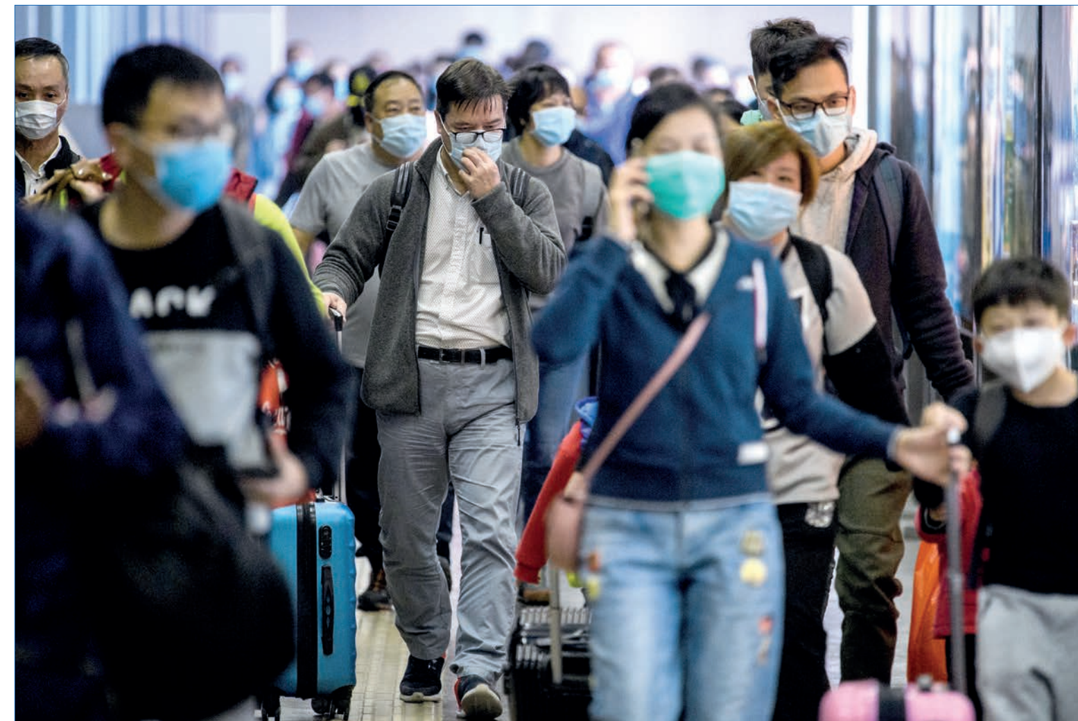
Passengers wear protective face masks as they arrive from Shenzhen to Hong Kong at Lo Wu MTR station, hours before the closing of the Lo Wu border crossing in Hong Kong, on February 3, 2020.

From 1780 to 1870 there was development of Mechanical Engineering and that was the age of industry 1.0. Industry 2.0 is the age of Electrical Engineering development and it was from 1870-1969. From 1969-2000 there was Electronic Engineering development and that age was known as