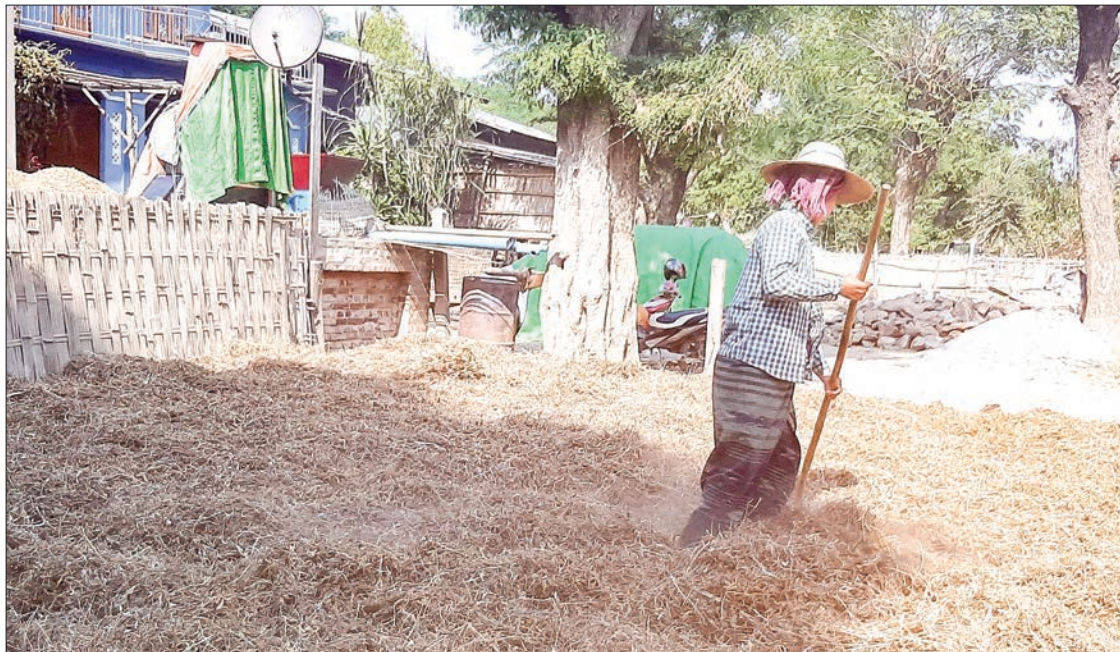
Local farmers are unhappy with the falling prices of fermented soya bean in Ngazun Township in Myingyan District.

“Last year, fermented soya beans yielded 20 baskets per acre. But, this year, the yield is only 15 baskets per acre. The village floods twice a year. This year, we were waiting for the water to inundate the village as usual. But, that didn’t happen and we had to plant crops using machines. However, some plants dried up and died. So, the yield of fermented soya beans declined. Besides, the price of fermented soya beans has also dropped to K51,000 per bag from K60,000 per bag. Local growers are unhappy with the decline in the price of fermented soya beans,” said U Aung Lwin, a grower from Hta Naung Gone