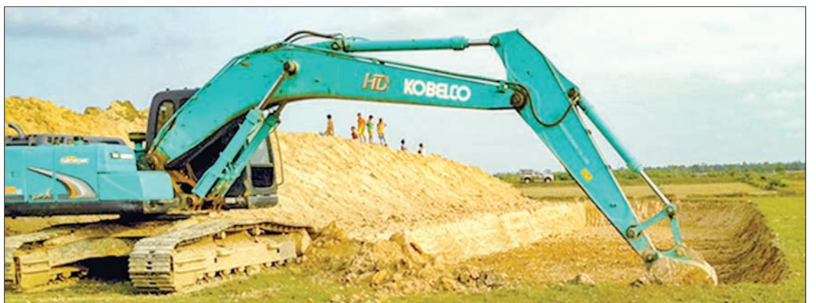
A fish pond is being dug with the use of heavy machinery in Maungtaw Township, Rakhine State.