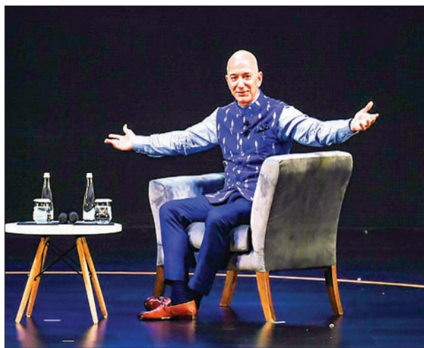
Amazon boss Jeff Bezos has announced he is committing $10 billion to a new fund to fight climate change.

Last September, he said Amazon would pledge to become carbon neutral by 2040 and vowed that the company would order