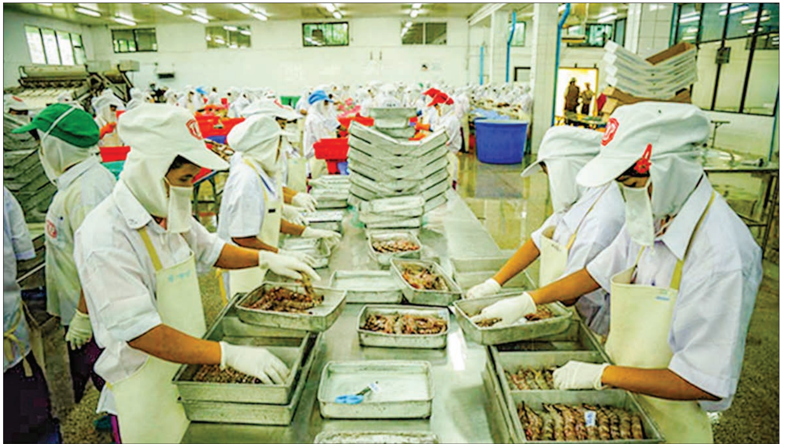
Workers prepare prawns in a cold storage facility in Sittway, Rakhine State.

Special economic zone projects to be established in Rakhine State are expected to become a major resource that can boost economic growth, create job opportunities and bring new hopes for local people. It will also encourage an investment chain for small and medium-sized enterprises in Rakhine State. Real estate, infrastructure, education, healthcare services, electricity generation and distribution, garment and textile industry, fishery, forestry, livestock breeding and agriculture sectors are among the promising businesses for investors at home and abroad who want to inject their money into development projects in Rakhine State. Entrepreneurs and developers have been invited to invest in construction of roads, airports, industrial zones, new towns, and beach resort projects as well hotels and tourism industry in Rakhine State. Rakhine State has many investment opportunities and is an area rich in natural re-