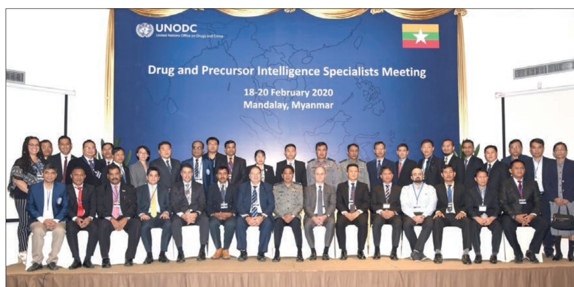
Participants pose for a photo at the Drug and Precursor Intelligence Specialists meeting in Mandalay.