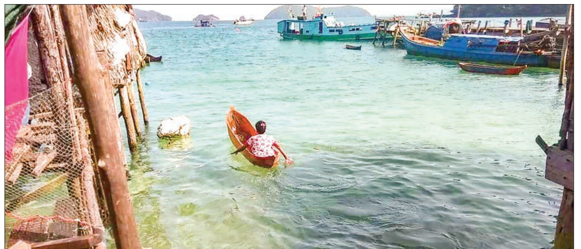
A fishing boat on the Salon Island in Taninthayi Region.

They are mostly seen in 10 islands of Myeik and Kawthoung districts. They have health dispensaries and health staff only in four villages of Bokpyin, Zardatgyi island, Kawthoung, and Kyunsu townships, out of 10. Even more dispensaries and health staff are being requested for the remaining areas but Salon people are facing very difficult situation when they have emergency cases. Both land and sea routes are hard to carry patients to where they can receive medical treat-