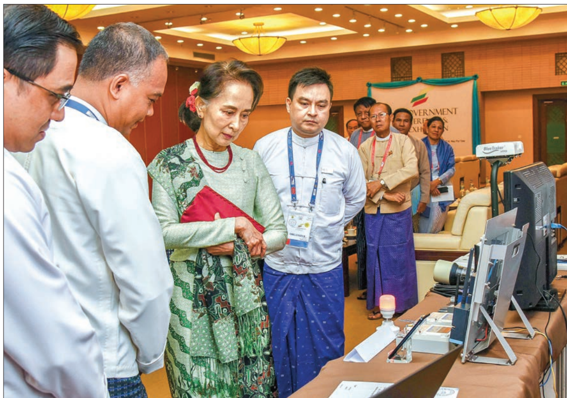
State Counsellor Daw Aung San Suu Kyi looks around the booths displayed at the 4 th e-Government Conference & ICT Exhibition in Nay Pyi Taw yesterday.