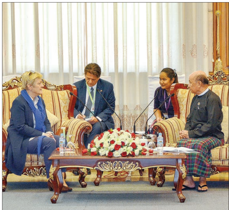
Pyithu Hluttaw Deputy Speaker U Tun Tun Hein meets with Chair Mrs Renate Kunast of the German-ASEAN Parliamentary Friendship Group in Nay Pyi Taw yesterday.

DEPUTY Speaker U Tun Tun Hein of the Pyithu Hluttaw received Chair Mrs Renate Kunast of the German-ASEAN Parliamentary Friendship Group at the Hluttaw Guest Hall in Nay Pyi Taw yesterday morning.