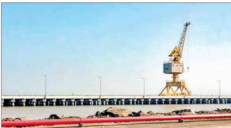
Sittway Port is part of the Kaladan Multi-Modal Transit Transport Project in Rakhine State.

Thirty agreements were signed at the fair. Of them, 27 are Expressions of Interest, two are project proposals, and one is a B-to-B MoU. The energy sector saw the huge foreign investments in Rakhine State while the hotels and tourism sector topped the list of Myanmar citizen investments. The Myanmar Investment Commission (MIC) recently held a meeting in Yangon and approved six projects in the power sector, other sector, manufacturing sector and hotel sector including power generation from a Combined Cycle Gas Turbine Power Plant, Sup-