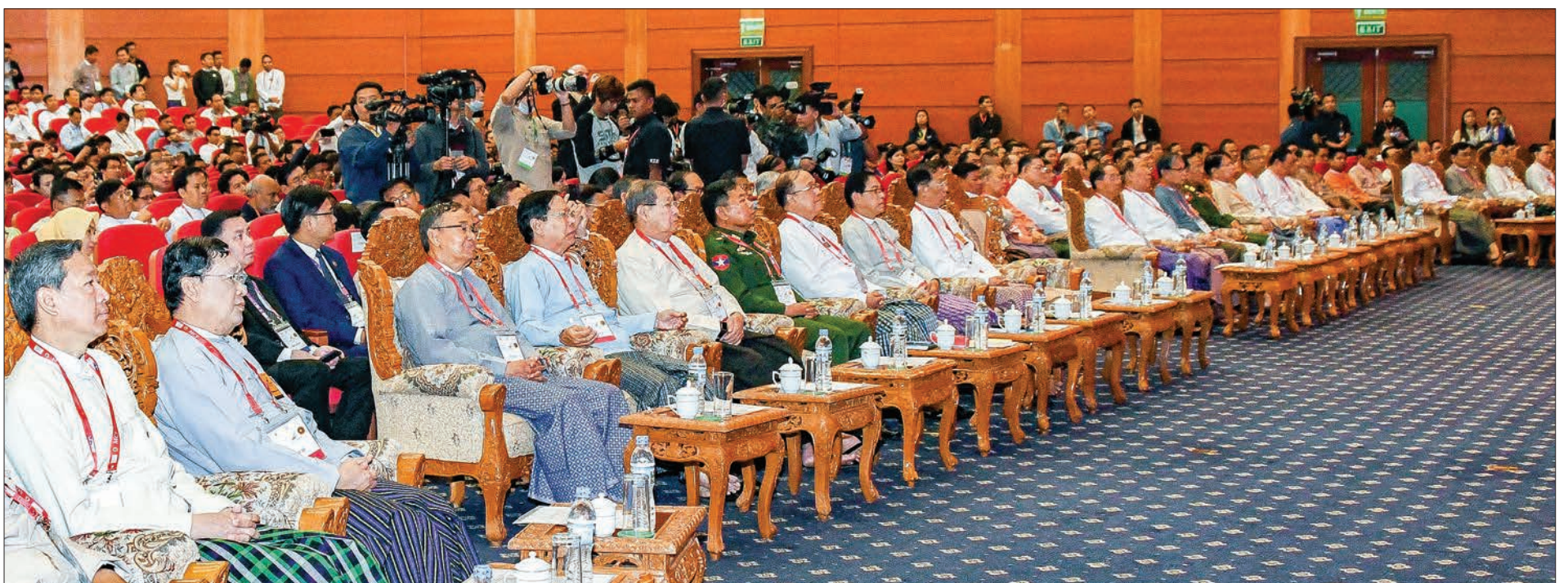
State Counsellor Daw Aung San Suu Kyi delivers the speech at the 4 th e-Government Conference & ICT Exhibition in Nay Pyi Taw yesterday.