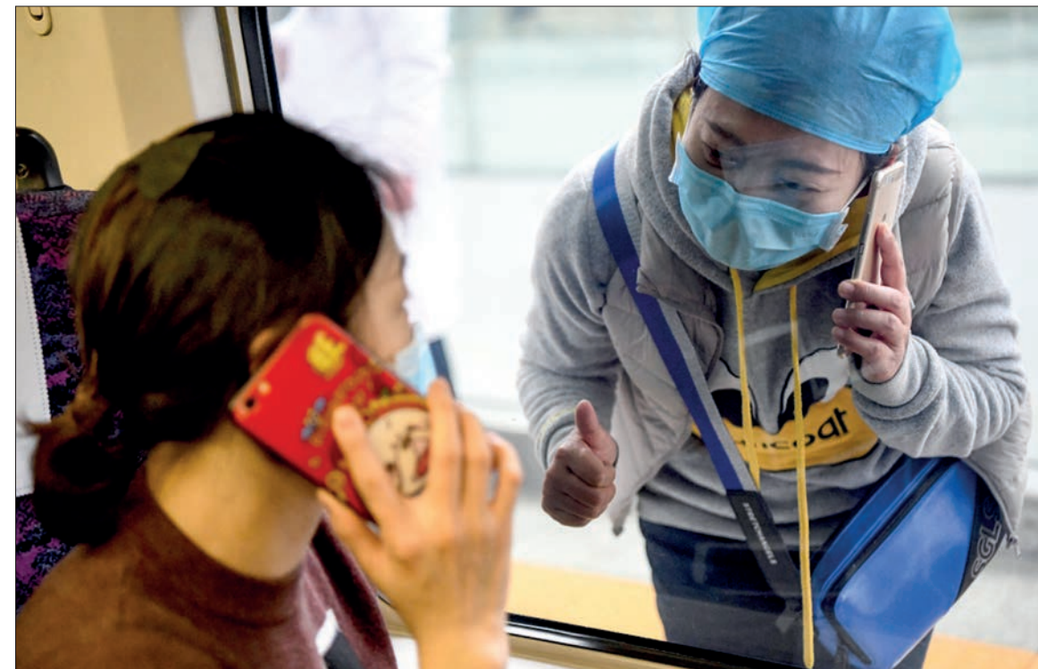
This photo taken on February 13, 2020 shows a medical staff member (L) talking on her phone as she leaves for Wuhan from Nanchang, China's central Jiangxi province. The death toll from the COVID-19 coronavirus epidemic neared 1,400 on February 14.

net video call and can reduce the infectious rate. One of many latest trends in HR field is developing remote staff. For instance a staff surgeon of a hospital is essential