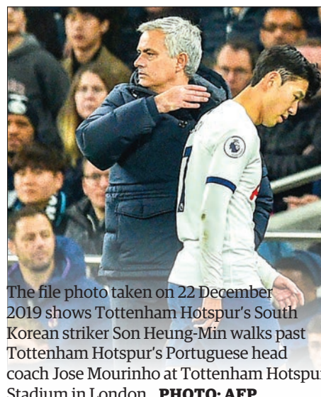
The file photo taken on 22 December 2019 shows Tottenham Hotspur's South Korean striker Son Heung-min walks past Tottenham Hotspur's Portuguese head coach Jose Mourinho at Tottenham Hotspur Stadium in London.

torn hamstring — as the club enters a crucial period. Midfielder Moussa Sissoko is another long-term casualty. Spurs host German side RB Leipzig in a Champions League Last 16 first leg match on Wednesday and play Chelsea in a match that could prove pivotal in the dog-fight for the fourth and final Champions League spot. "You know I like analogies," said Mourinho, who took over after Mauricio Pochettino was sacked in late November last year. "Sometimes I do good ones and sometimes silly ones. This time I do this." — AFP