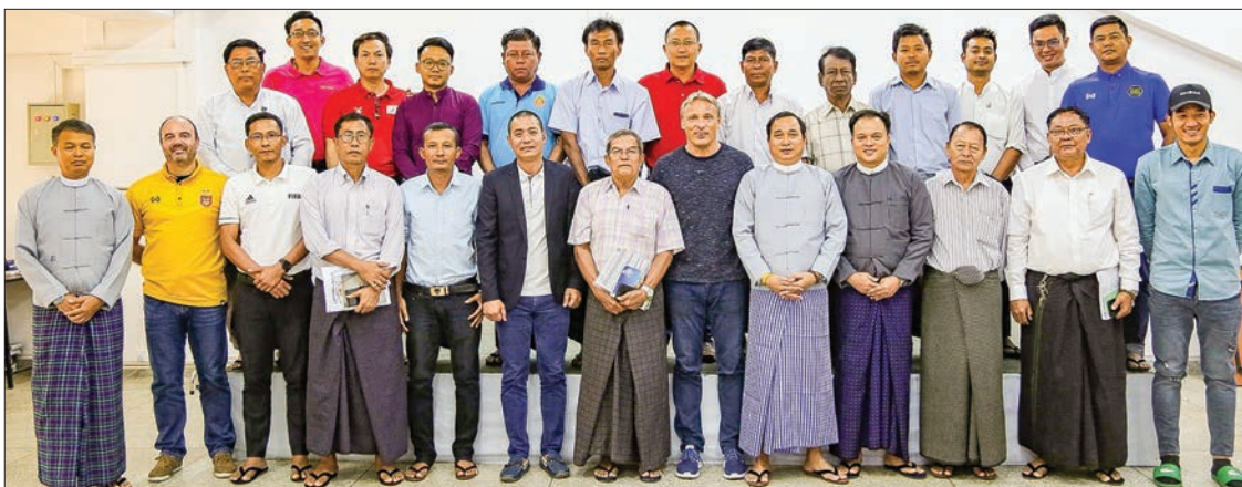
Officials from Myanmar Football Federation, Myanmar National League (MNL), the clubs from the MNL and MySports pose for a group photo at the meeting in Thuwunna Stadium in Yangon yesterday.

SOME matches from Week-10 and Week-11 of the MPT Myanmar National League 2020 would be rescheduled to help the Myanmar national football team prepare for the 2020 World Cup Qualifiers in March. The matches will be held a few days late,