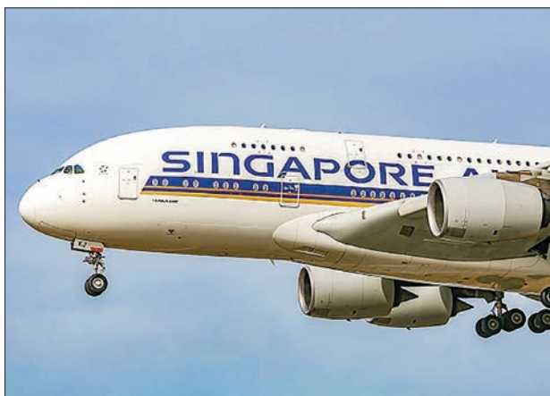
Singapore Airlines Airbus A380, specifically A380-841 aircraft as seen on final approach landing at New York JFK, John F. Kennedy International Airport on 14 November 2019.

include those between Singapore and some cities in the United States, Europe, Japan, South Korea and Taiwan and Southeast Asia.