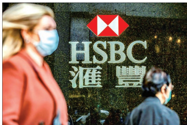
HSBC has been trying to lower costs as it faces a multitude of uncertainties caused by the grinding US-China trade war, Britain’s departure from the European Union and now the deadly new coronavirus in China.

Many of the cutbacks will be in the European and US investment banking sectors, while units in more profitable Asia and the Middle East would be bolstered. — AFP ■