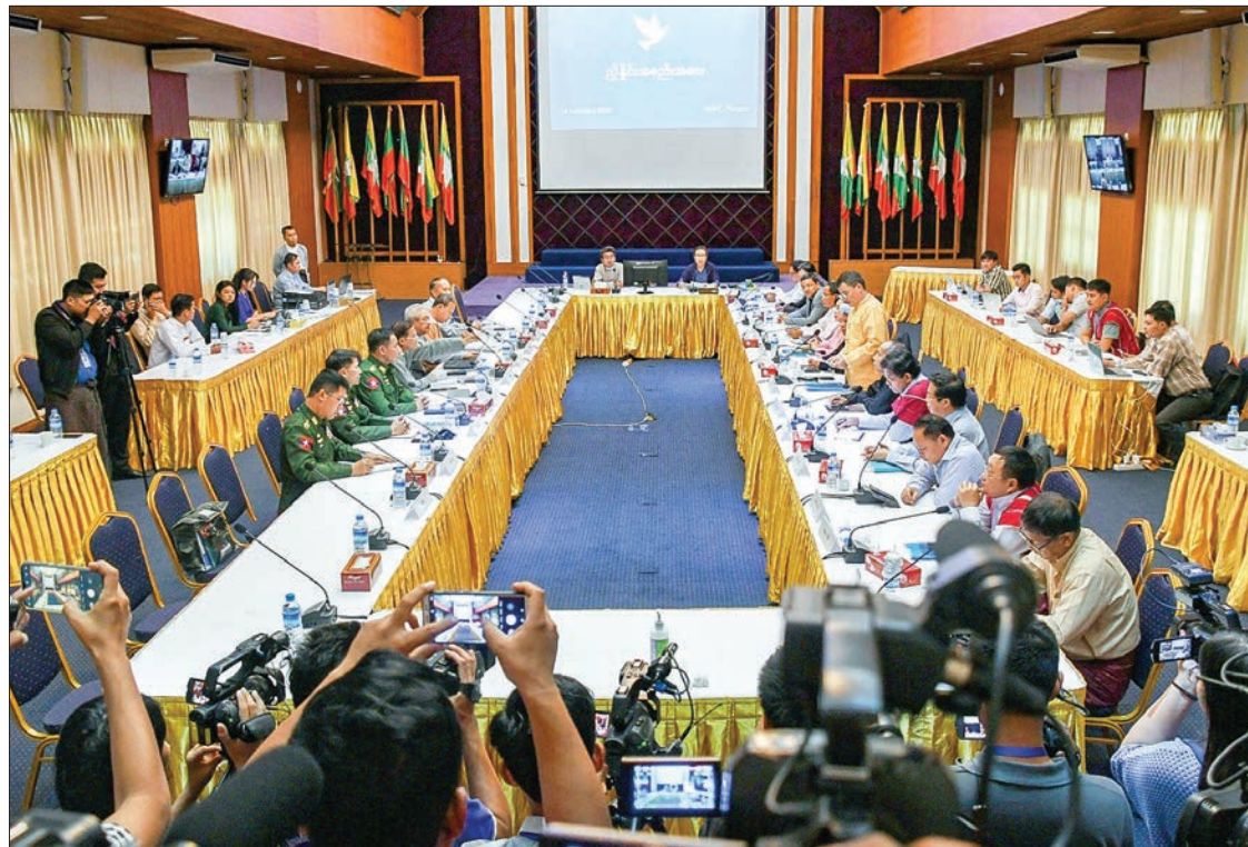
Government officials and representatives of ethnic armed organizations attend the meeting in Yangon yesterday.

The meeting successfully discussed preparations for holding public consultation and the