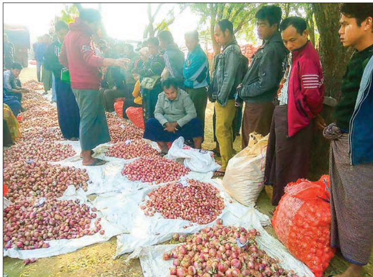
Photo shows onion being sold in the market.

The local farmers grow onion plants near creeks and in the farms after harvesting monsoon crops.—Soe Lin Naing (IPRD) (Translated by Aung Khin)