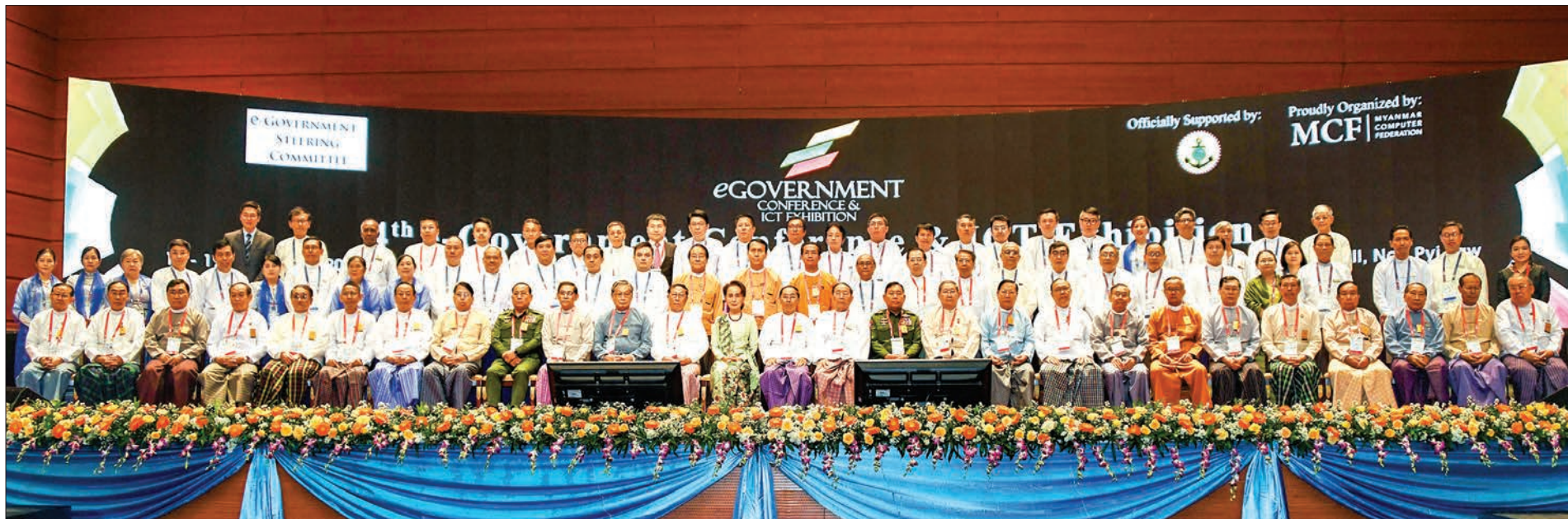
State Counsellor Daw Aung San Suu Kyi poses for a group photo together with attendees at the 4 th e-Government Conference & ICT Exhibition in Nay Pyi Taw yesterday.