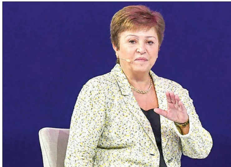
International Monetary Fund managing director Kristalina Georgieva at the Global Women’s Forum in Dubai.

“It is too early to say because we don’t yet quite know what is