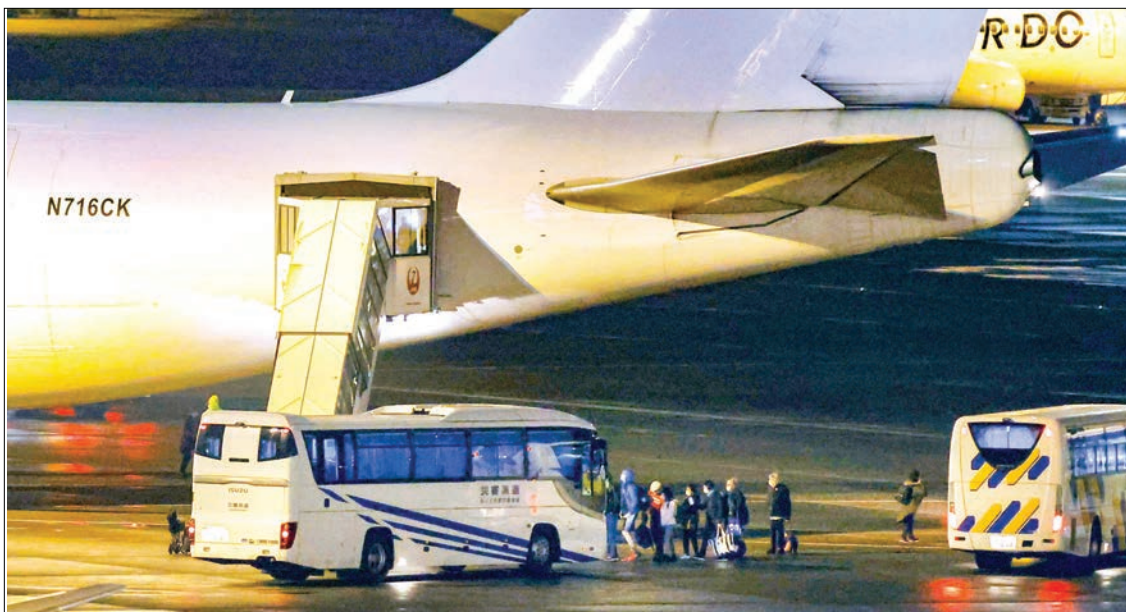
People who evacuated from the coronavirus-hit Diamond Princess cruise ship docked in Yokohama board a US government-chartered plane at Tokyo’s Haneda Airport.

In a separate case in Sagami-hara near Tokyo, a nurse was also found to have been diagnosed with the respiratory disease, now officially named COVID-19. She had taken care of a woman in her 80s who last week became the country’s first confirmed fatality from the infection.—Kyodo News ■