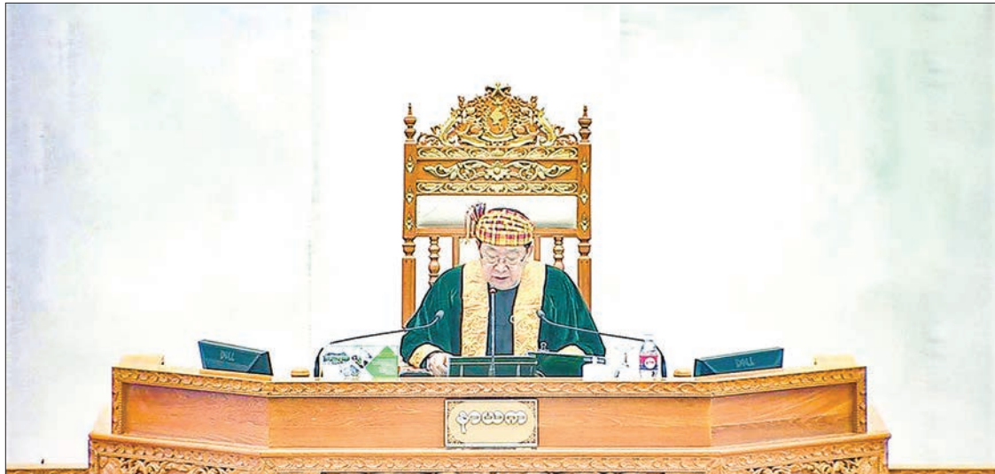
The 15 th regular session of Second Pyidaungsu Hluttaw holds its 9 th day meeting in Nay Pyi Taw yesterday.