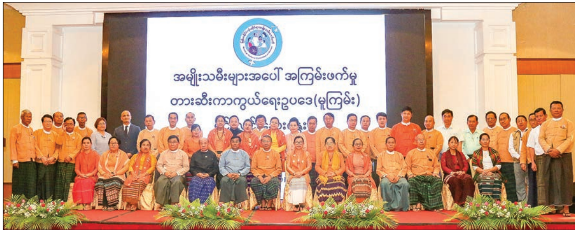
Pyidaungsu Hluttaw Deputy Speaker U Tun Tun Hein, Union Minister Dr Win Myat Aye and Hluttaw representatives pose for a photograph at the ceremony in Nay Pyi Taw yesterday.

THE Ministry of Social Welfare, Relief and Resettlement introduced its draft law for Protection and Prevention of Violence Against Women to the Hluttaw representatives at Horizon Lake View Hotel in Nay Pyi Taw yes-