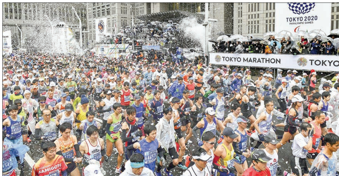
The annual Tokyo Marathon kicks off in front of the Tokyo metropolitan government building in Shinjuku ward on 3 March 2019.

The chaos caused by the coronavirus outbreak has already resulted in a host of sporting events being canceled or rescheduled in China and Japan, but 2020 Games head Yoshiro Mori said last Thursday canceling the Olympics "has not been considered." The coronavirus emerged in the Chinese city of Wuhan in December. The virus had killed more than 1,700 people in China and infected more than 70,000 people as of Monday. — Kyodo News ■