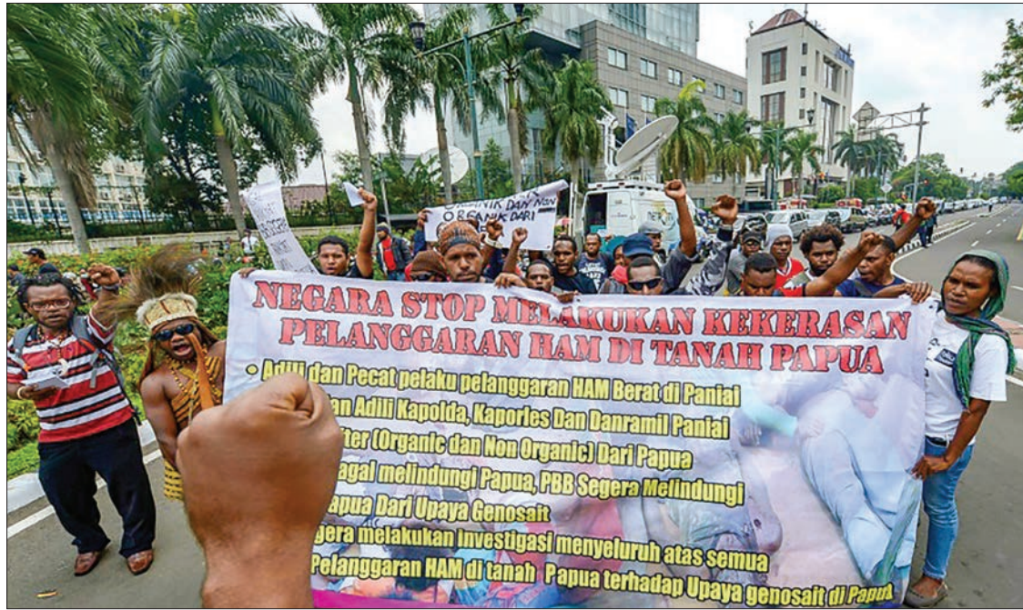
Activists in Jakarta protest against the 2014 shootings of four teenagers in Indonesia's insurgency-racked Papua province.

The probe was hampered by long delays due to attempts by unnamed individuals to hide evidence, the human rights com-