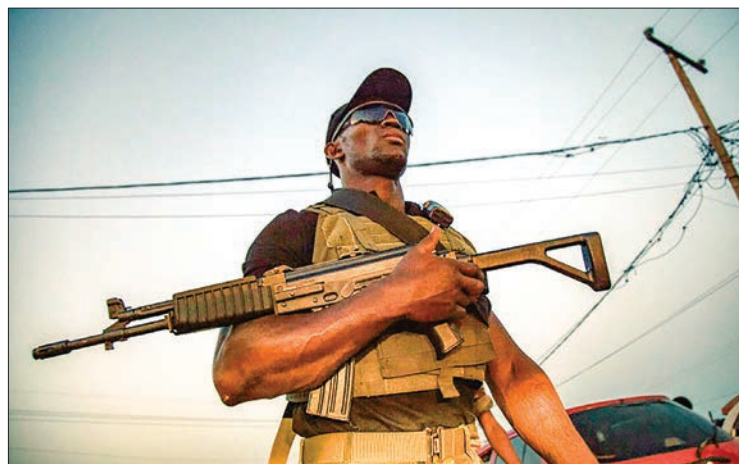
The Cameroon government has been battling armed separatists in English-speaking regions since October 2017.