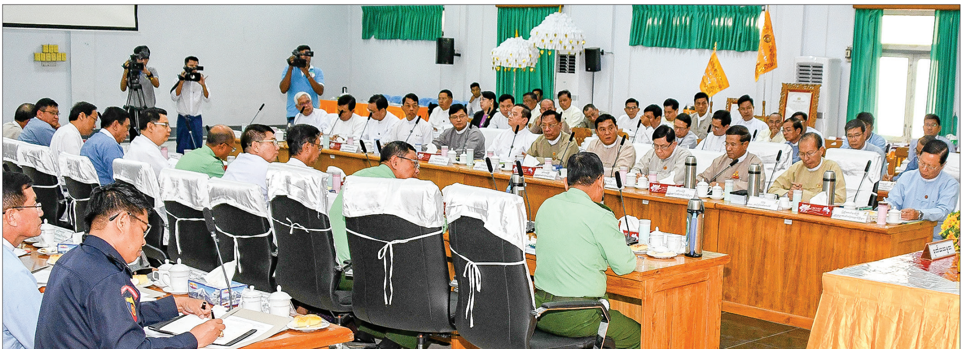
Vice President U Myint Swe delivers the speech at the meeting on holding the ceremony to award religious titles and alms-offering ceremony in Nay Pyi Taw.