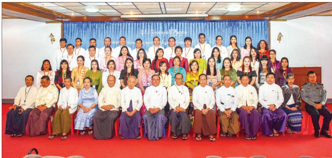
Union Minister U Kyaw Tin and attendees pose for a group photo at the certificate awarding ceremony for Enhanced Diplomatic Skills training course (6/2020).

Present on the occasion were retired Myanmar Ambassadors, Directors-General and responsible officials of the departments under the Ministry of Foreign Affairs and the Ministry of International Co-