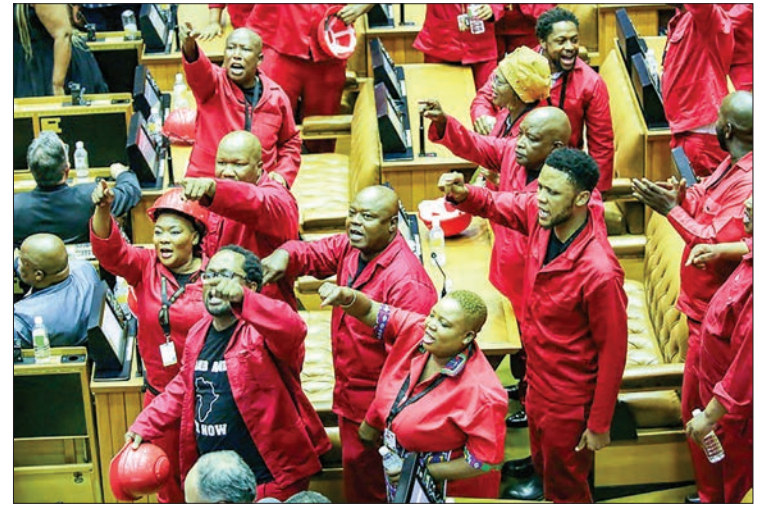
President Cyril Ramaphosa was forced to delay his annual State of the Union address after MPs of the far-left Economic Freedom Fighters staged a rowdy protest, demanding De Klerk be ejected from parliament.

A foundation set up by the revered anti-apartheid fighter, Archbishop Desmond Tutu, said it was "irresponsible" to debate the "degree of awfulness of apartheid" and called for him to retract his statement. On Monday De Klerk retracted his statement and apologised for the "confu-