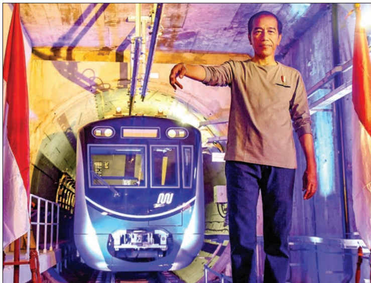
Indonesian President Joko "Jokowi" Widodo attends an inauguration ceremony in Jakarta on 24 March 2019, for the country's first mass rapid transit system.

ond phase of Jakarta's mass rapid transit project. It stretches to downtown Kota in West Jakarta.