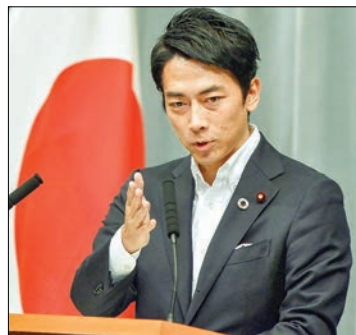
Newly appointed Japanese Environment Minister Shinjiro Koizumi attends a press conference at the prime minister's office in Tokyo on 11 September 2019.

"You become aware and learn about a range of things" by taking paternity leave, Koizumi told a gathering of ministry