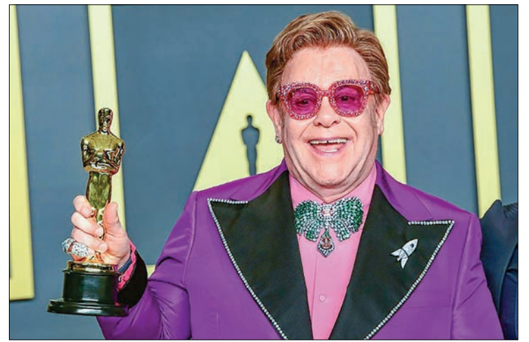
Elton John is currently on his 'Farewell Yellow Brick Road' world tour, which is scheduled to end in 2020.