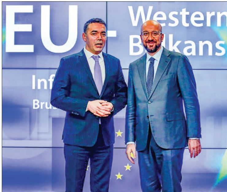
North Macedonia's Foreign Minister Nikola Dimitrov (L) was among Balkan nation leaders who met European Council President Charles Michel for talks.

talks as did EU Commission chief Ursula von der Leyen and Prime Minister Andrej Plenkovic of Croatia, which currently holds the EU's rotating presidency.