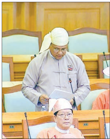
MP U Maung Maung Ohn.

MP U Maung Maung Ohn from Ayeyawady Region constituency 5 advised to make well preparations for spending the loan, with using local budgets in removing old pipelines and foreign loan in purchasing new pipes and relevant equipment while adopting the 50-year plans as the pipeline will pass through