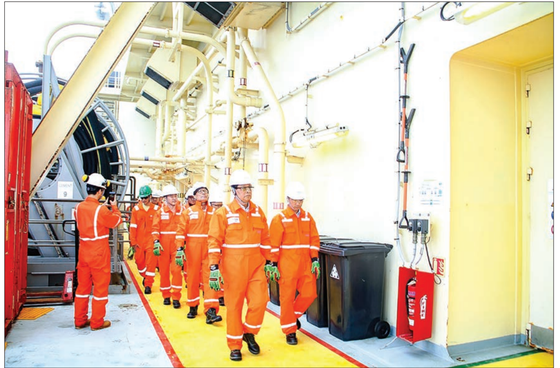
Union Minister U Win Khaing inspects the test drill Mahar (1) at the Block A-3 of Myanmar west offshore in Rakhine State.

Three test drills – Kisanpanadi (1), Mahar (1), and Yanaungmyin (1) – of the Block A3 are under the production sharing contract (PSC) between the Myanma Oil and Gas Enterprise (15