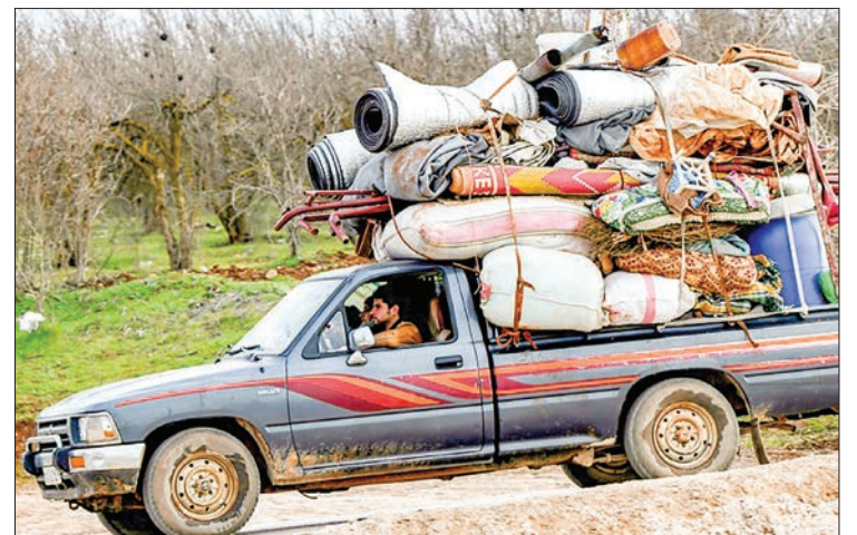
The offensive has triggered the largest wave of displacement in Syria's civil war, with 800,000 people fleeing since December, according to the UN.

States including Russia, France, the United Arab Emirates, and Egypt support strongman Khalifa Haftar, while the UN-recognized Government of National Accord is backed by Turkey and Qatar.—AFP ■