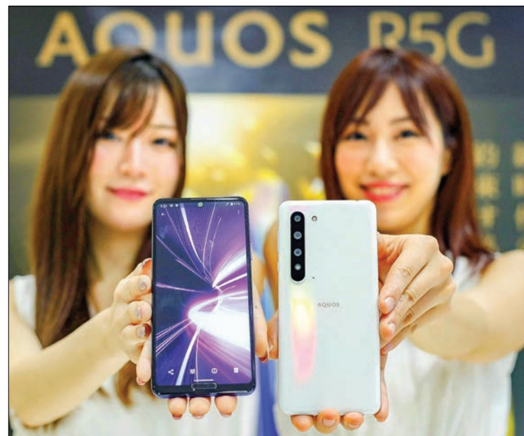
Sharp Corp.'s Aquos R5G smartphones that will operate on the 5G network.

Commercial 5G services have already started in the United States and South Korea. — Kyodo News ■