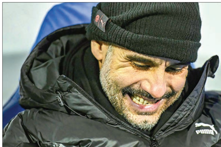
Guardiola's contract with City runs until 2021.

The Sun claims the former Barcelona and Bayern Munich manager has told friends he is going to at least see out his contract with the club which runs until 2021.—AFP