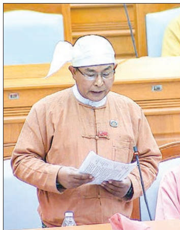
MP U Tun Tun.

MP U Tun Tun from Pwintbyu constituency said that the OAG has found deceptive accounting in its inspections to prevent misuse of public revenue, however, legal actions were hardly found at the relevant departments. He also called for lawsuits against misappropriations for such cases, in addition to disciplinary proceedings of the department.