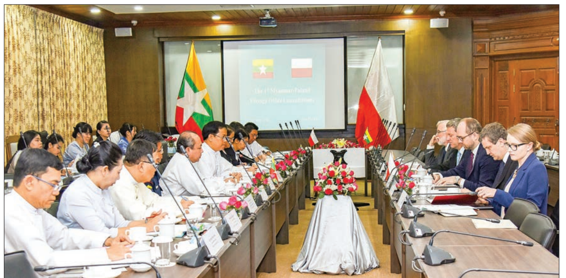
Union Minister U Kyaw Tin attends the 1st Myanmar-Poland Foreign Office Consultations at the Ministry of Foreign Affairs in Nay Pyi Taw on 17 February 2020.

Following the meeting, the Memorandum of Understanding on Cooperation between the Ministry of Foreign Affairs of the Republic of the Union of