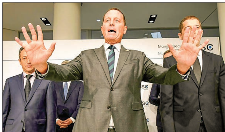
US Ambassador to Germany Richard Grenell (c, pictured February 14, 2020) said President Donald Trump told him that allies who use Huawei "will jeopardize our ability to share intelligence and information".

a generation ago, racial tensions in South Africa remain high and economic inequality and poverty run deep. An umbrella group called the Anti-Racism Network of South Africa this week launched an annual campaign to tackle racism at the grassroots level. —AFP ■