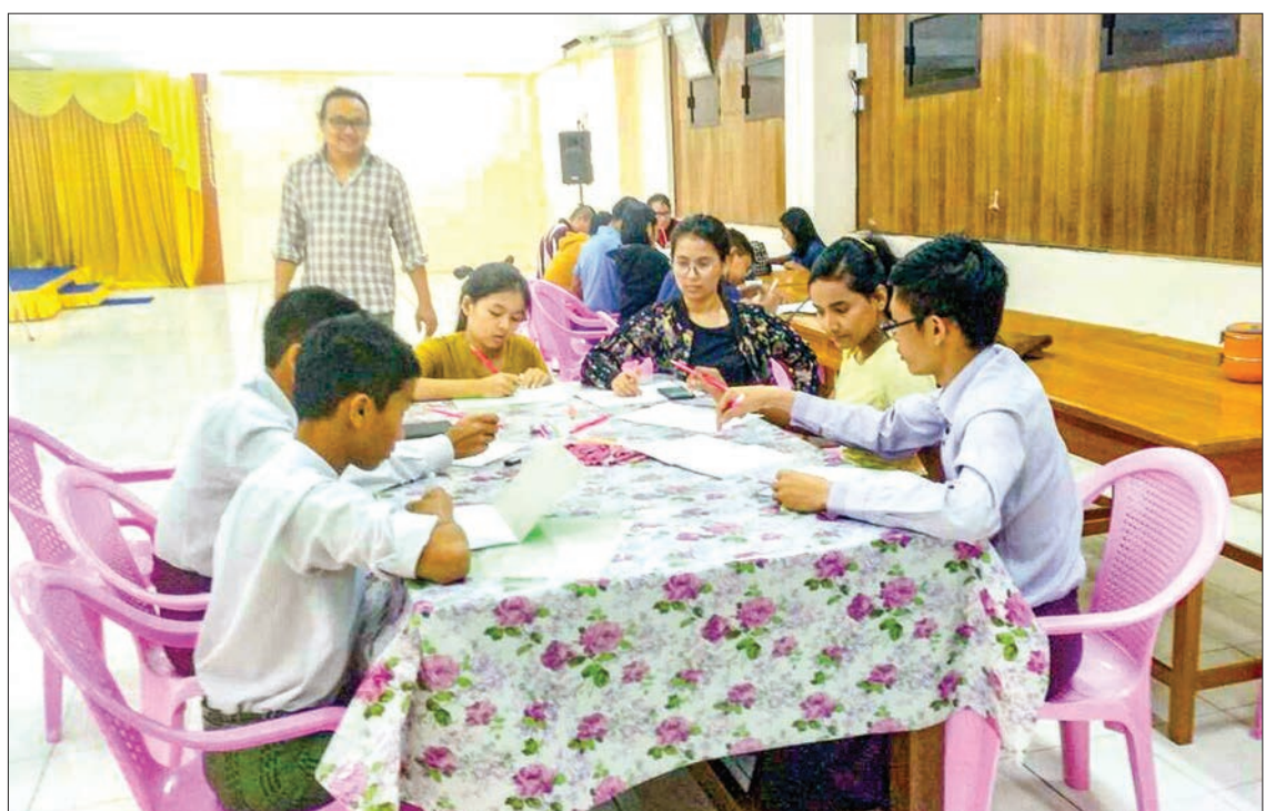
Storytelling workshop organized by Third Story Project held in downtown Yangon, yesterday.

She said Third Story Project was established in 2014 after some time in volunteering where it became apparent that Myanmar children's storybooks were becoming rarer. She said the project creates these storybooks and distribute them to impoverished areas.