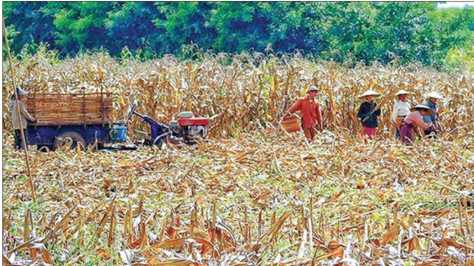
A corn plantation in a village near border with China.