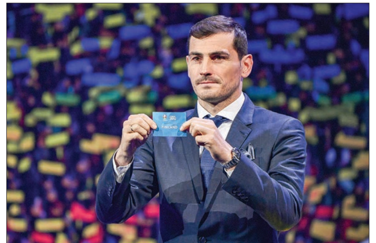
In this file photo taken on 30 November 2019 Spanish football player Iker Casillas holds up a slip of paper after drawing Finland from the pot during the UEFA Euro 2020 football competition final draw in Bucharest.

He played 167 times for Spain, also winning two Euros in 2008 and 2012, and made more than 700 appearances for Real Madrid, with whom he won five La Liga titles and the Champions League three times, before joining Porto in 2015.