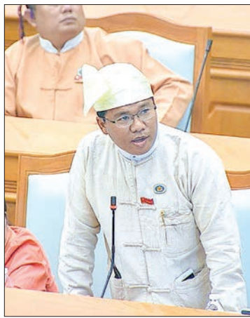
MP U Than Soe (a) Than Soe (Economy).

discussed drawing a policy and implementing it to cut the losses in the joint-venture businesses between the government and the private sector. He also suggested the Hluttaw and relevant committees to find solutions within a time frame by forming commissions with authority for inspection, guarantee, accountability and responsibility to complete their tasks.