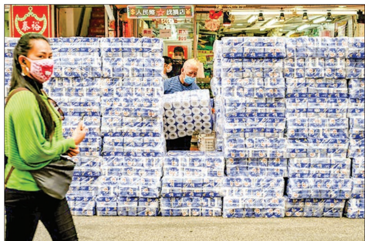
Toilet roll has become hot property in Hong Kong thanks to panic-buying.

Supermarket chain Wellcome called Monday's robbery a "senseless act", and called on people not to bulk buy or hoard toilet roll.— AFP ■