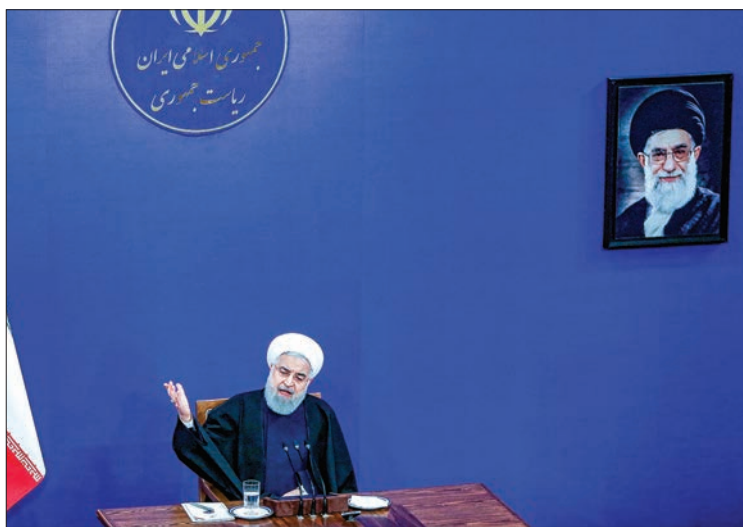
Iranian President Hassan Rouhani speaks during a news conference in the capital Tehran, on 16 February 2020.

TEHRAN (Iran) — Iran's President Hassan Rouhani on Sunday ruled out resigning and vowed to see out his term, even as he admitted he had offered to step aside twice since being elected.