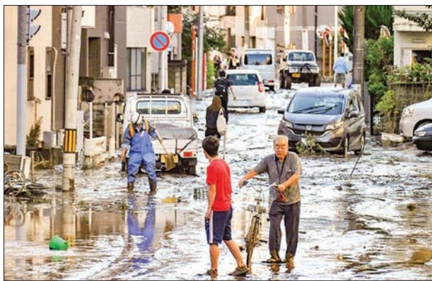
Typhoon Hagibis killed more than 100 people and caused widespread flooding in October.

The nation's gross domestic product in the three months to December shrank 1.6 per cent from the previous quarter, even before the novel