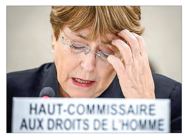
United Nations High Commissioner for Human Rights Michelle Bachelet speaks in Geneva, 20 March, 2019.

a 'blacklist' of companies represents the ultimate surrender to the pressure exerted by countries and organizations interested in harming Israel. This announcement was made despite knowing that the majority of countries around the world declined to join this political pressure campaign," he said. —ANI