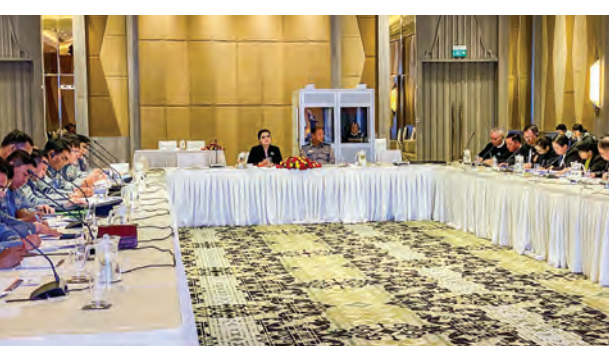
Officials from the Myanmar Police Force and the Union Attorney-General Office attend the workshop for prosecutions in human trafficking cases in Nay Pyi Taw.