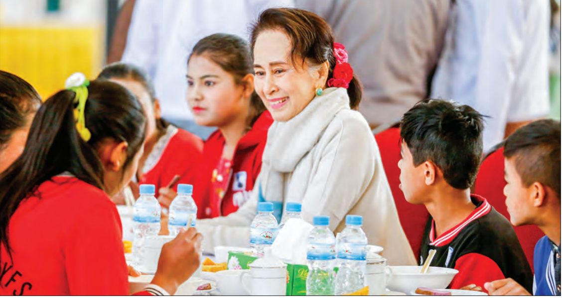
State Counsellor Daw Aung San Suu Kyi eating breakfast together with the children at the ceremony to mark the 105<sup>th</sup> birthday of Bogyoke Aung San in Taunggyi, yesterday.