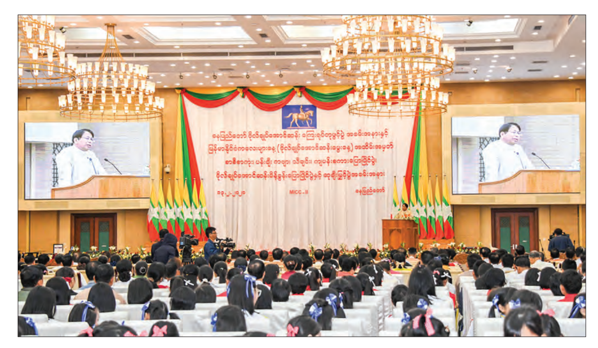
Union Minister Dr Pe Myint delivers the speech at the commemorative ceremony to mark the 105th birthday of Bogyoke Aung San in Nay Pyi Taw yesterday.

A COMMEMORATIVE ceremony to unveil the Bogyoke Statue, to hold the essays writing, drawings, poems, songs, impromptu talks and Bogyoke's Speeches contests, and to give prizes was convened on Myanmar Chil-