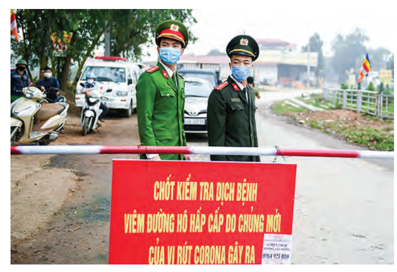
Checkpoints have been set up around Son Loi farming region near Hanoi after six cases of the deadly new coronavirus were found there