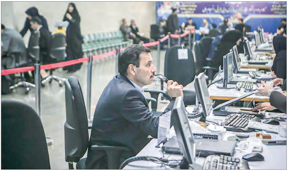
FILE PHOTO: A man registers his candidacy for Iran's parliamentary election at the Interior Ministry in Tehran. Iran. on 2 December. 2019.