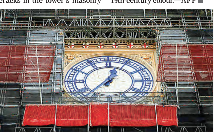
The renovations have meant Big Ben — whose chimes feature on British television and radio news bulletins — has been largely silent since 2017.

and corrosion in the roof, as well as to restore the edging around the clock faces to its original 19th-century colour.—AFP ■