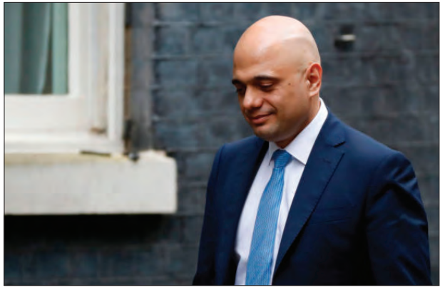
Sajid Javid has resigned as chancellor of the Exchequer for the UK.

But rumours began to circulate after his meeting with the prime minister went on longer than expected. "He has turned down the job of chancellor of the