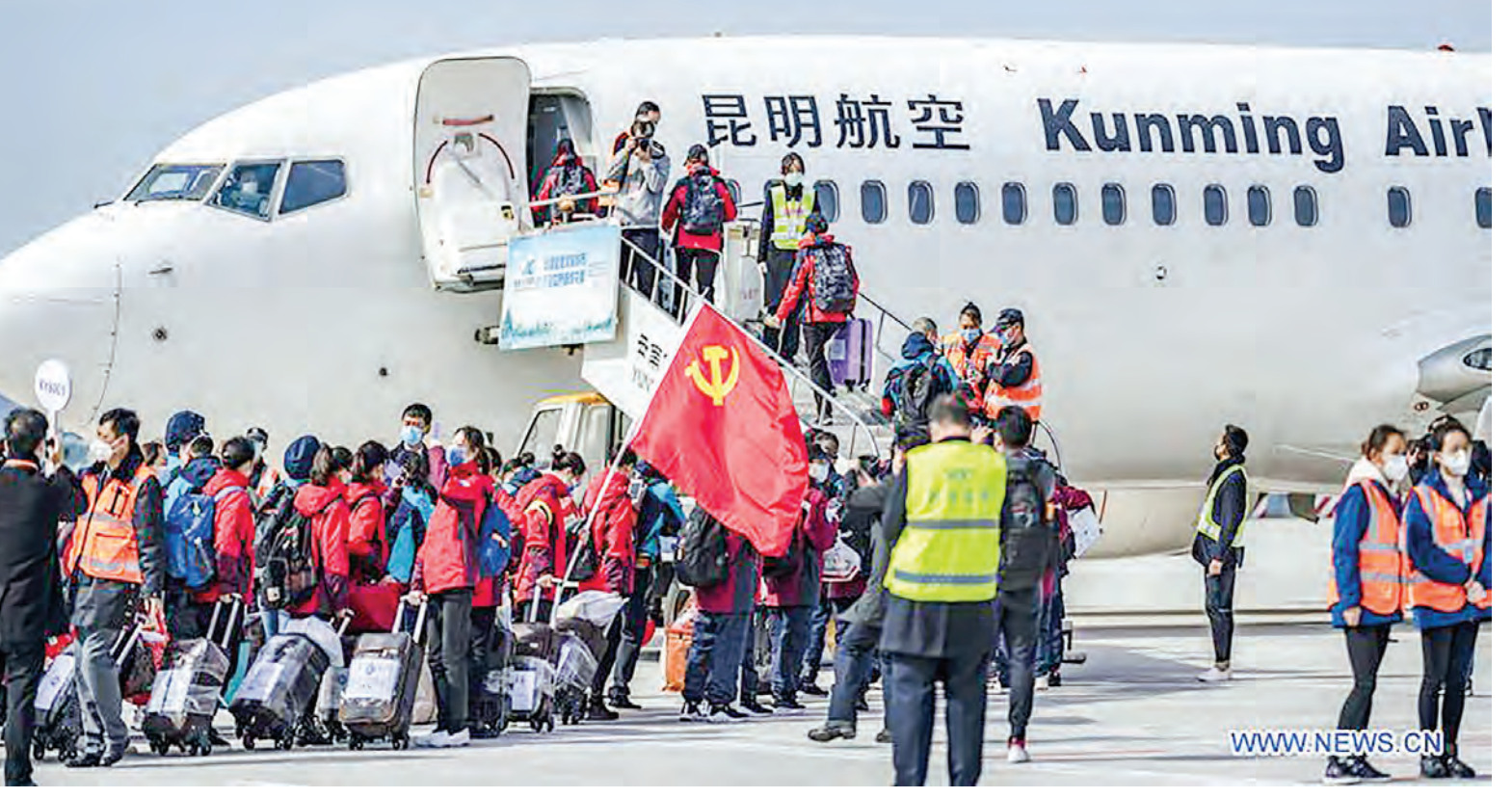
Medical team members board the flight to Hubei Province at Changshui International Airport in Kunming, capital of southwest China's Yunnan Province,

for candidate therapeutics and vaccines; ethical considerations for