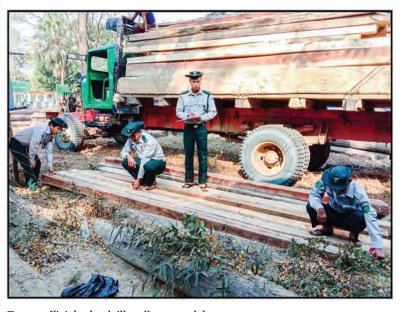
Forest officials check illegally cut teak logs.