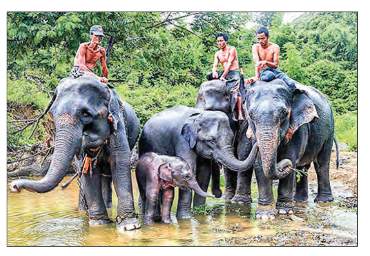
Mahouts seen cleaning elephants at the Winga Baw Elephant Camp near Yangon-Mandalay Highway.

The Wingabaw Elephant Conservation Camp opened on 3 November, 2016. It is located on the Phayagyi-Bawnet road in Bago Township, 3 miles and 7 furlongs from milepost 39. In the beginning, the Wingabaw