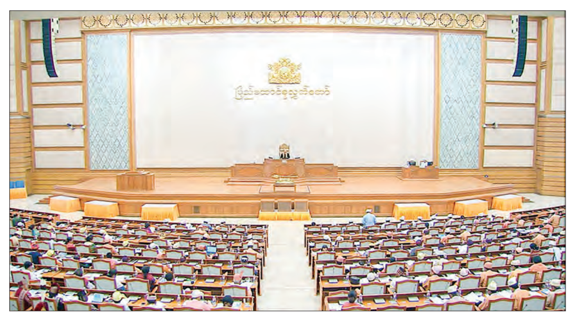
Second Pyidaungsu Hluttaw's 15th regular session is being convened in Nay Pyi Taw.

Lt-Gen Soe Htut also took the oath of office as Union Minister for Home Affairs in the presence of Pyidaungsu Hluttaw