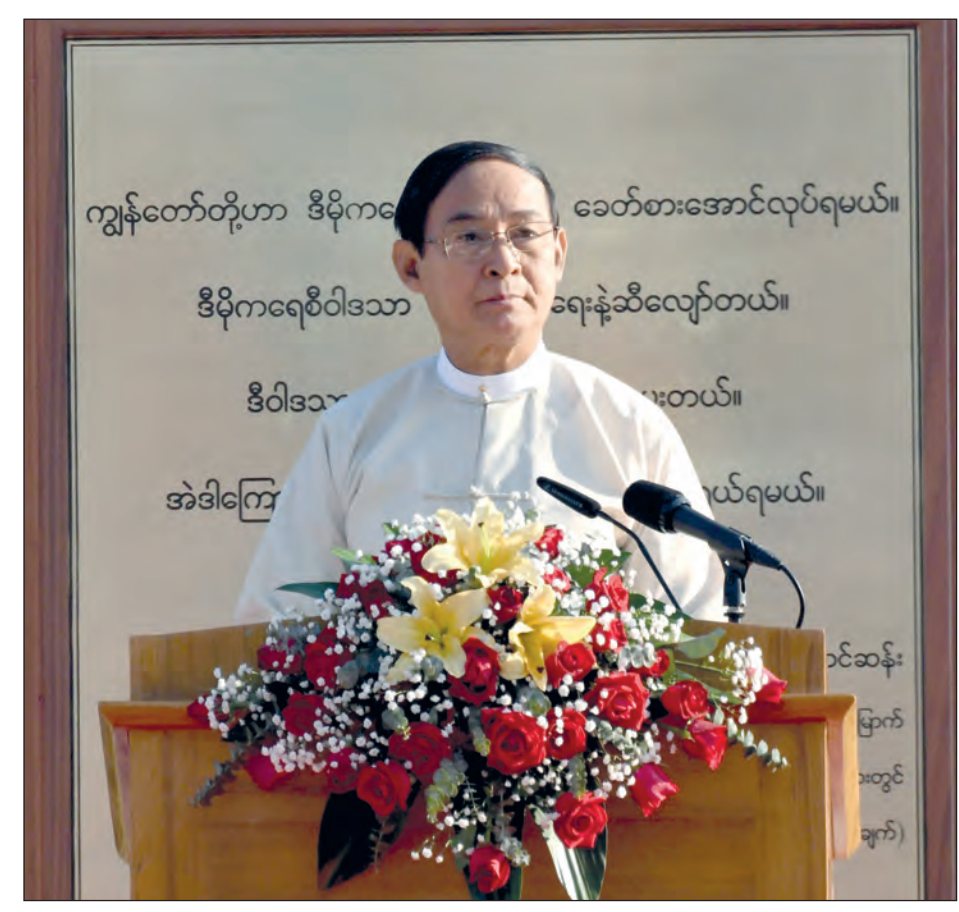
President U Win Myint addresses the unveiling ceremony of Bogyoke Aung San Statue in Nay Pyi Taw.

RESIDENT U Win Myint attended and spoke on the occasion to unveil the Bogyoke Aung San Statue at the Thabyaygon Roundabout in Nay Pyi Taw at 8 am yesterday.