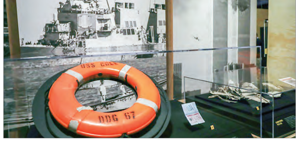
On 12 October, 2000, a rubber boat loaded with explosives blew up as it rounded the bow of the USS Cole in Aden, Yemen, killing 17 sailors. PHOTO: AFP

Seventeen American sailors were killed as well as the two perpetrators of the attack claimed by Al-Qaeda, in an early success for the terror group and its founder Osama bin Laden. A US court then ruled that Sudan, where the two bombers were trained, was responsible for the attack — a claim Khartoum always denied.— AFP