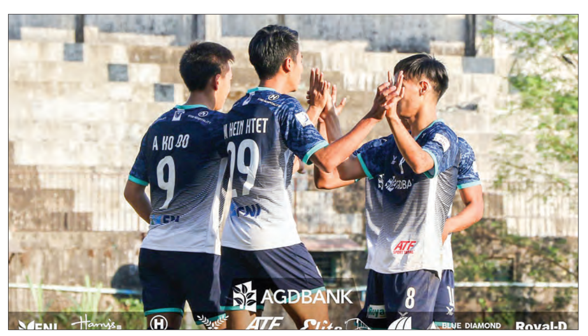
Yangon United U-21 players celebrate their big win over Yaw Myay FC.

IN the U-21 Myanmar National League match held yesterday, Yangon United secured a huge 6-0 victory over Yaw Myay FC at the Sa Lin stadium in Yangon.