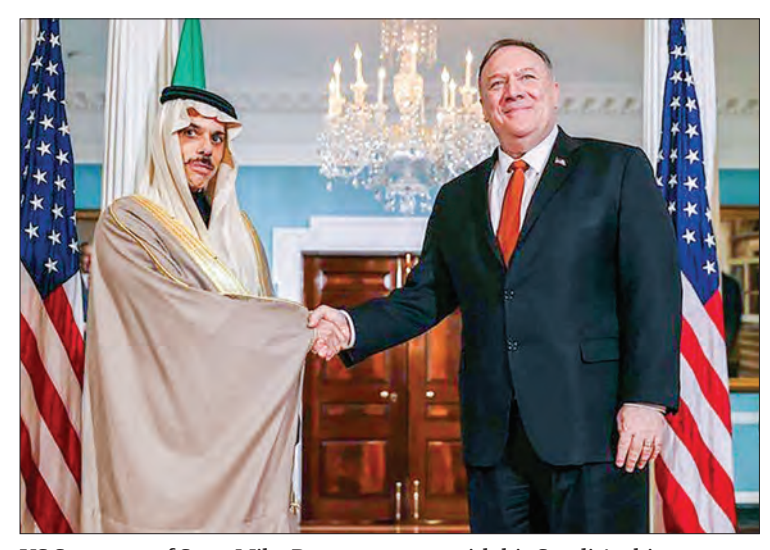
US Secretary of State Mike Pompeo meets with his Saudi Arabian counterpart, Foreign Minister Prince Faisal bin Farhan, at the State Department in Washington.

WASHINGTON — US Secretary of State Mike Pompeo on Wednesday (local time) met his Saudi Arabian counterpart Faisal bin Farhan Al Saud here and discussed among other issues, "the continued need to counter the Iranian regime's destabilizing behaviour."