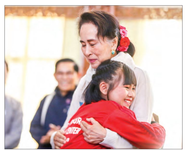
State Counsellor Daw Aung San Suu Kyi seen with the child at the event to mark the 105^{\rm th} birthday of Bogyoke Aung San in Taunggyi.