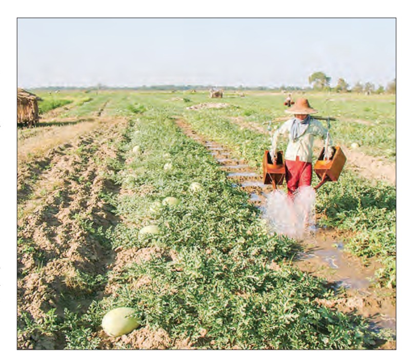
A farmer watering plants in a watermelon farm in Nay Pyi Taw.