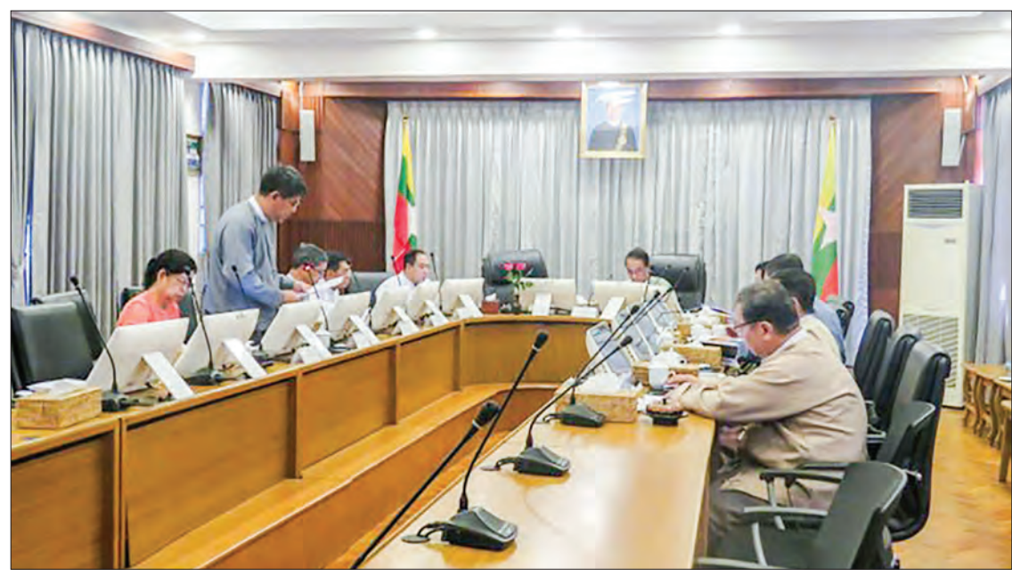
Union Minister Dr Than Myint attends the (3/2020) meeting of Myanmar Investment Commission (MIC) in Yangon yesterday.

At the end of December, 2019, the countries with the largest investments in Myanmar were Singapore, the People's Republic of China, and Thailand. The top sector was oil and gas sector, which accounted for 27 per cent of the total permitted foreign investment, followed by the power sector (26.15 per cent), and the manufacturing sector (14.07 per cent). —MNA