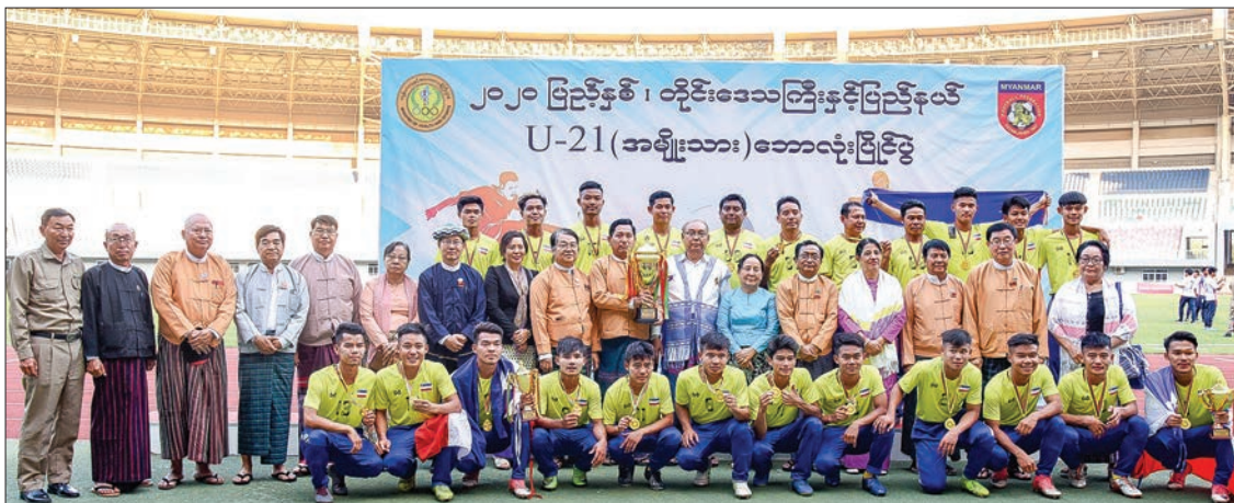
Amyotha Hluttaw Speaker Mahn Win Khaing Than and wife, attendees and winner team pose for a photo at the award-giving ceremony of 2020 States/Regions U-21 men's football match in Nay Pyi Taw yesterday.