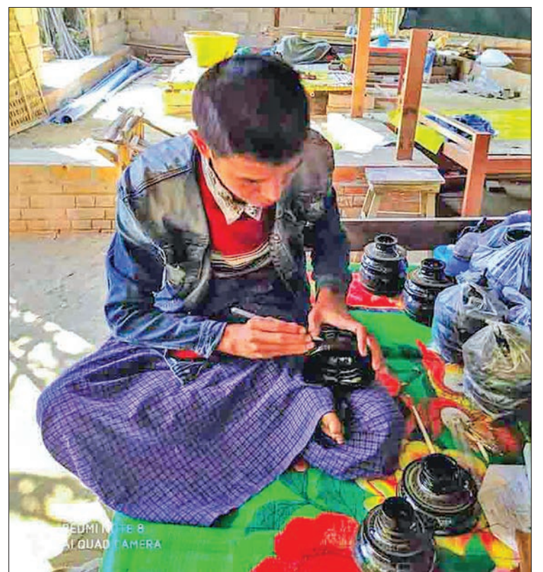
A worker makes lacquerware at a workshop in Bagan, Mandalay.