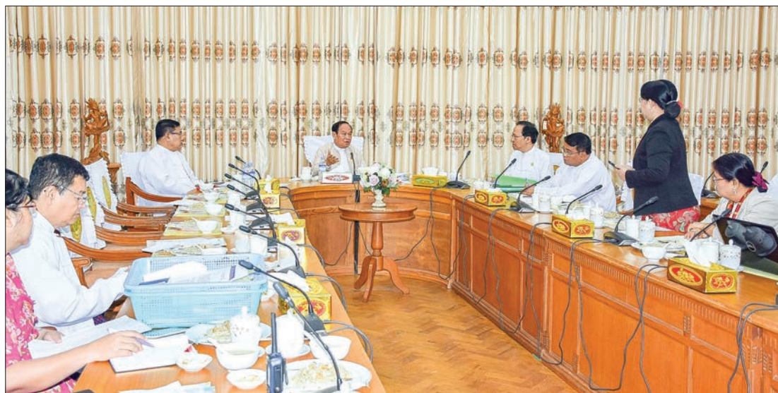
Union Minister Dr Myint Htwe attends the daily meeting 15/2020 for prevention Coronavirus.