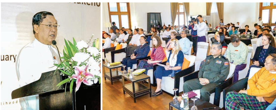
Union Minister U Thein Swe addresses the Labour Migration Stakeholders Meeting in Nay Pyi Taw yesterday.