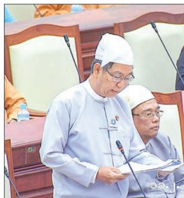
Deputy Attorney-General U Win Myint.

Mindat constituency asked for construction of a Bailey bridge crossing Maw Creek between Mindat and Htilin townships.