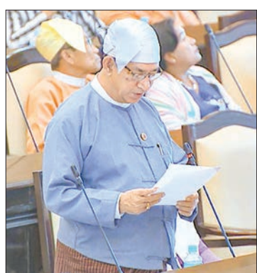
Deputy Minister Dr Ye Myint Swe.