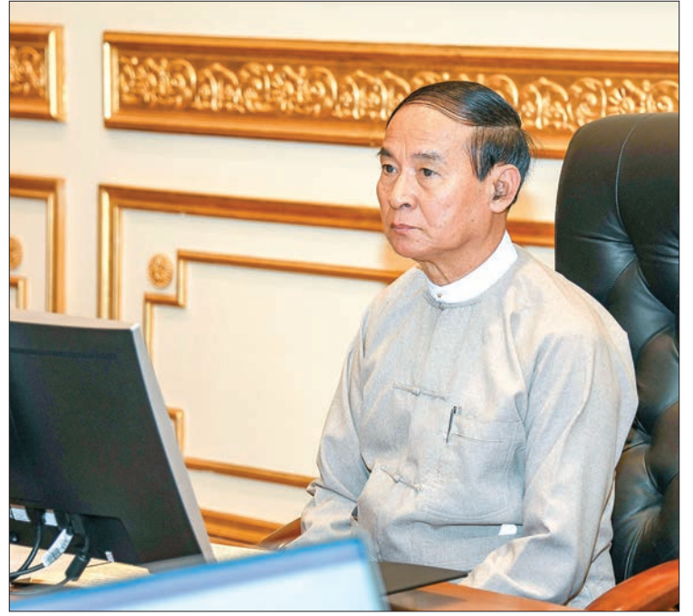
President U Win Myint addresses the meeting with State/Region ethnic affairs ministers at the Presidential Palace in Nay Pyi Taw yesterday.

P RESIDENT U Win Myint urged ethnic affairs ministers of States and Regions to make more efforts in making peace, unity and development of respective areas as he met with them at the Presidential Palace in Nay Pyi Taw yesterday afternoon.