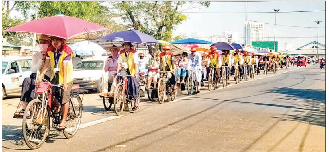
Tourists enjoy riding trishaws to explore places in Dala Township.

"These days, tourists are coming to Dala Township.