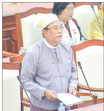
Deputy Minister Dr Kyaw Linn.