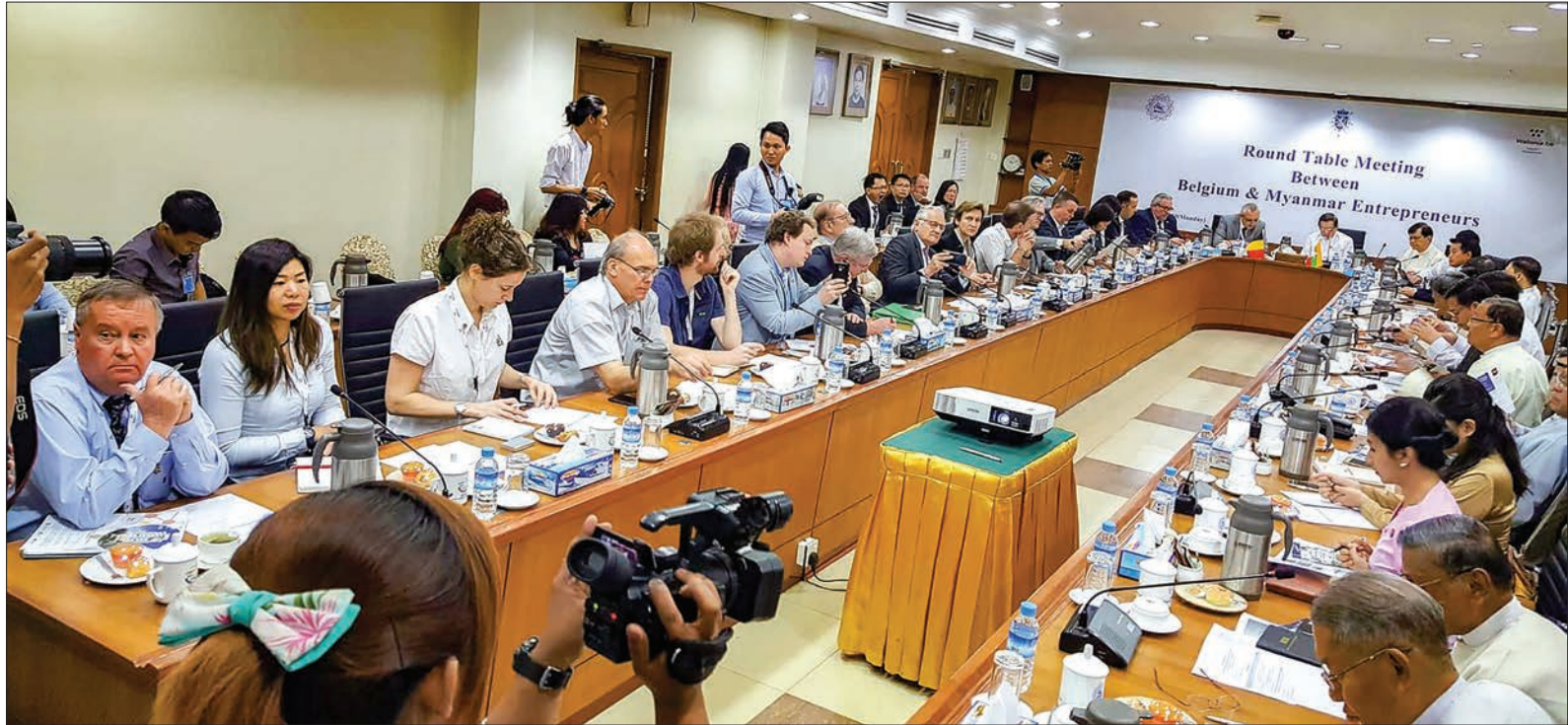
Round table meeting between Belgium and Myanmar entrepreneurs in progress.

With the rapid reforms in economic and political sectors, Myanmar managed to attract the intention of the investors from the international community who are coming to do