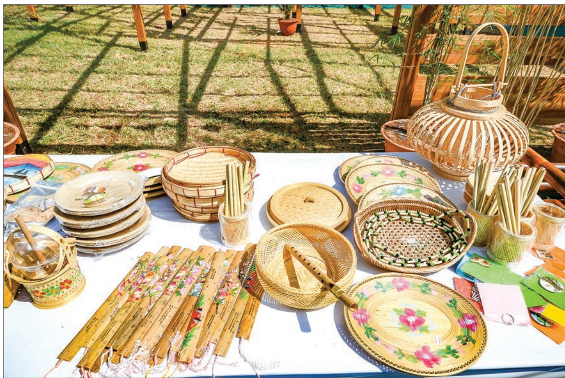
Handmade bamboo products displayed in a market.