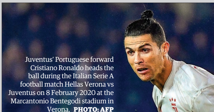
Juventus' Portuguese forward Cristiano Ronaldo heads the ball during the Italian Serie A football match Hellas Verona vs Juventus on 8 February 2020 at the Marcantonio Bentegodi stadium in Verona.

"It wasn't the result we wanted," said the 35-year-old Ronaldo despite becoming the first Juventus player to score in 10 succes-