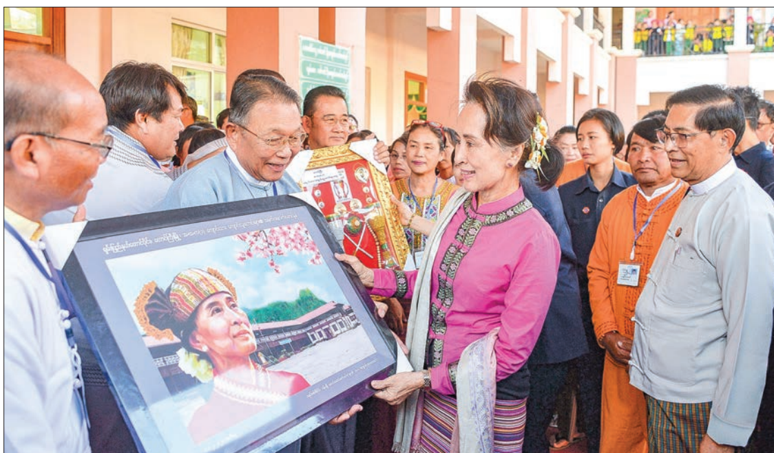
State Counsellor Daw Aung San Suu Kyi receives her portrait painting at No.1 High School in Taunggyi.