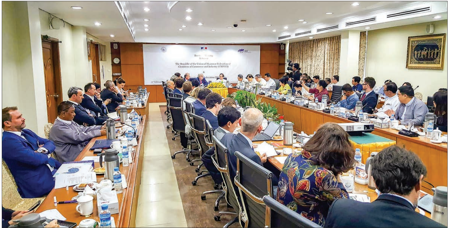
Business Meeting between UMFCCI and French Business Confederation (MEDEF) in progress.

sion is comprised of the business persons from the fields of construction, technology, child nutrition and medicines, medical equipment, gas and energy, air pollution controlling equipment, agriculture, livestock breeding and animal gene. Trade and bilateral investment were also discussed during the meeting.