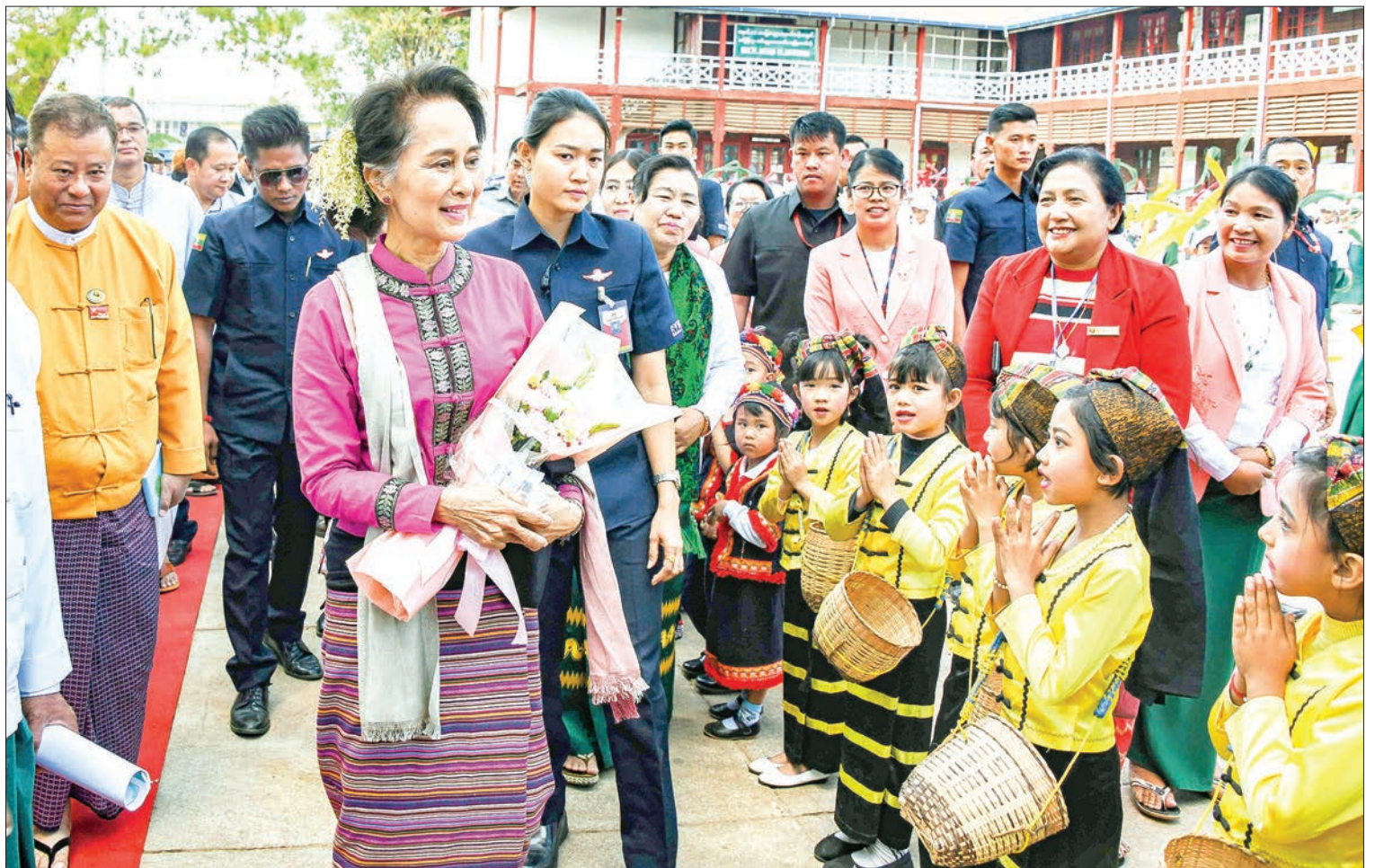
State Counsellor Daw Aung San Suu Kyi is welcomed by school children at No.1 High School in Taunggyi Township in southern Shan State.