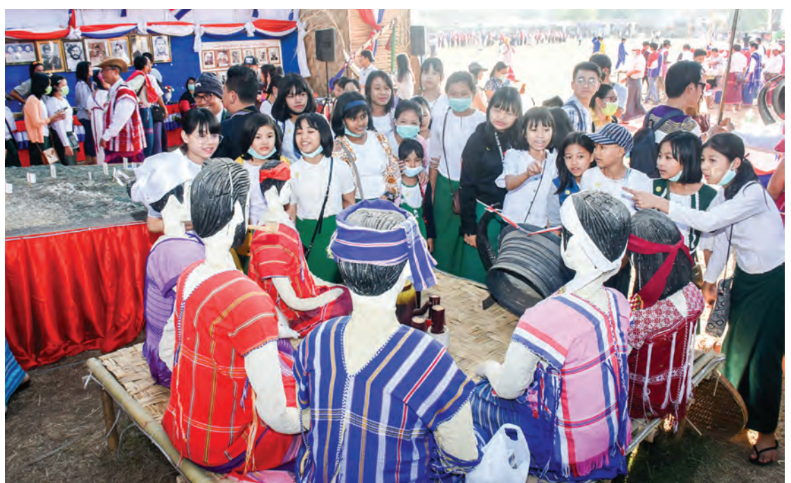
Kayin traditional cultural booths attract visitors at Ethnics Culture Festival 2020 yesterday.