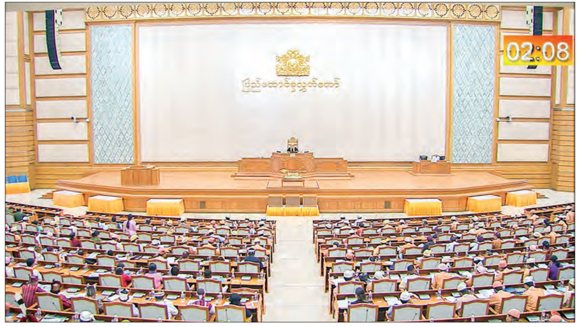
Pyidaungsu Hluttaw being convened in Nay Pyi Taw yesterday.

PYIDAUNGSU Hluttaw Speaker U T Khun Myat asked the MPs for their consent or objection to appoint Lt-Gen Soe Htut, nominated by the President, for the Union Minister for Home Affairs.