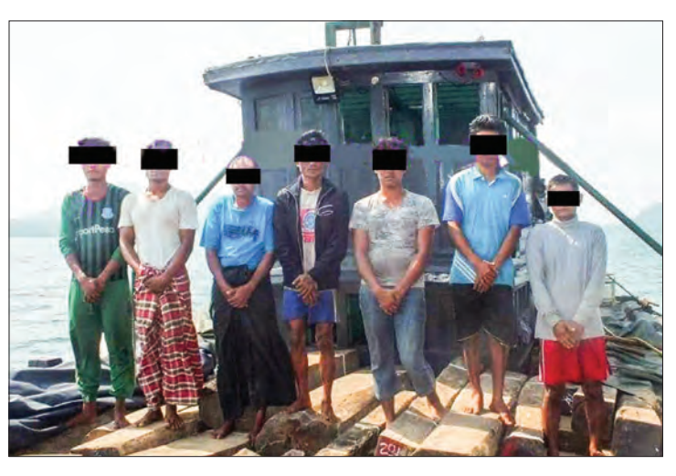
Seven workers seen on board the seized boat carrying illegal teak.

a boat carrying an illegal consignment of teak to Malaysia