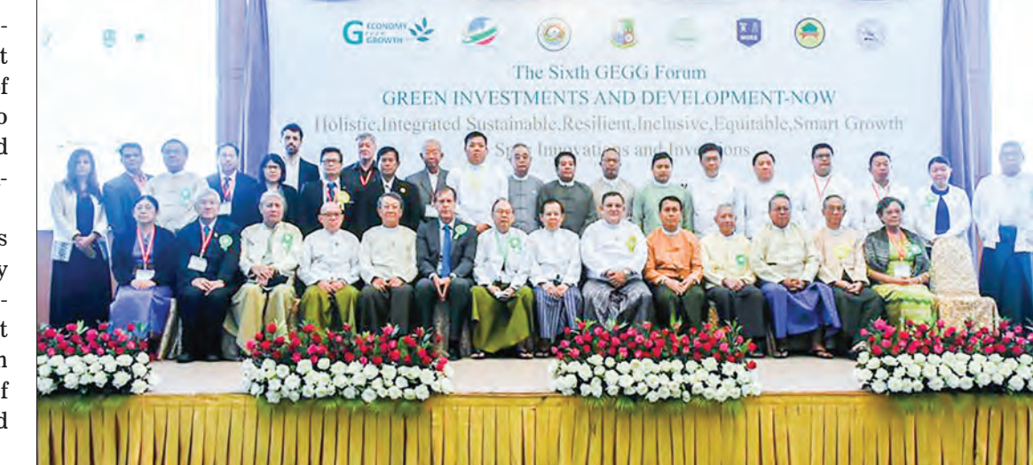
Yangon Region Chief Minister U Phyo Min Thein and attendees pose for a group photo at the Sixth Green Economy Green Growth (GEGG) Forum in Yangon on 6 February.