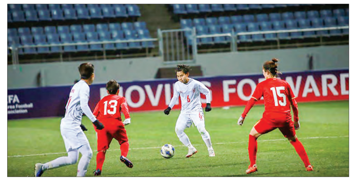
Myanmar did well to deny AFF Women's Championship 2019 winners Vietnam much chances in the first half and the score remained goalless as the two sides went into the half-time interval.

Myanmar had lost 7-0 to hosts South Korea in their opening match on February 3 meaning that Vietnam could ensure progression with a win in their opening match of the