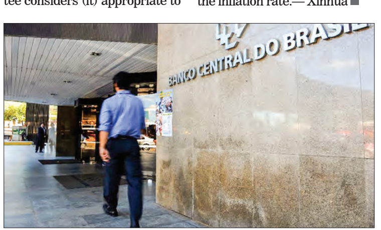
This is the fifth consecutive rate cut by the central bank, and the reduction was expected by the financial market.

People's Hospital to prevent infectious diseases