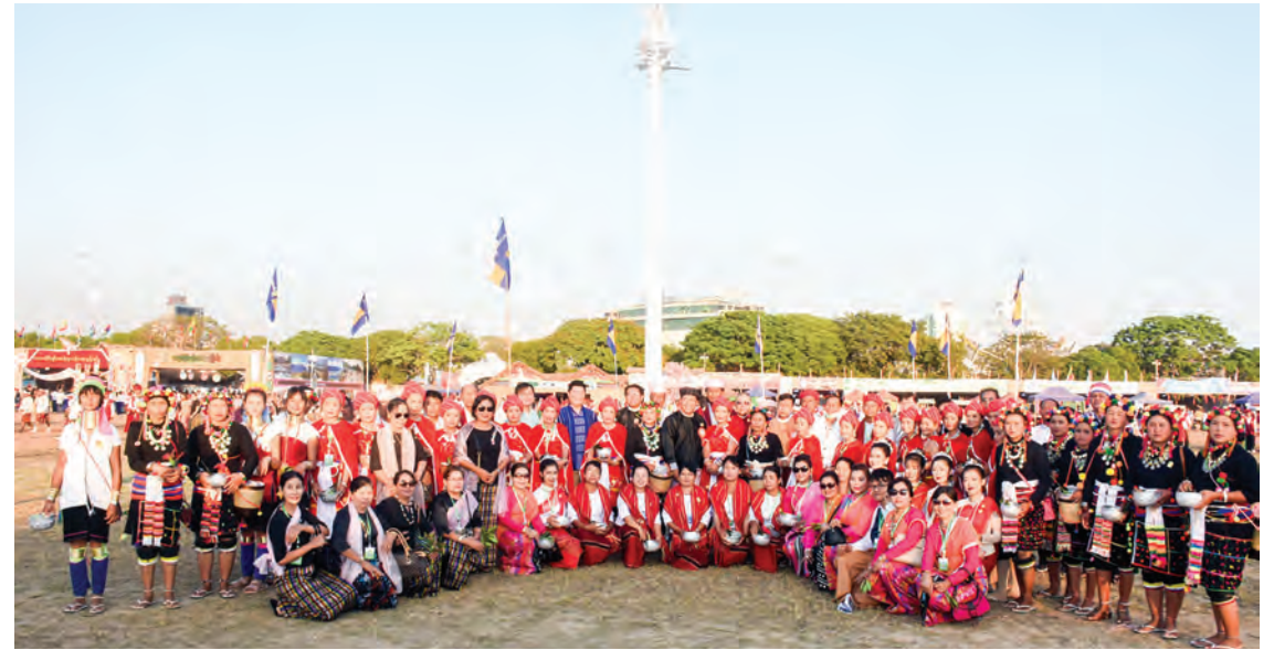
People with their traditional costume pose for a documentary photo at the Ethnics Culture Festival 2020.