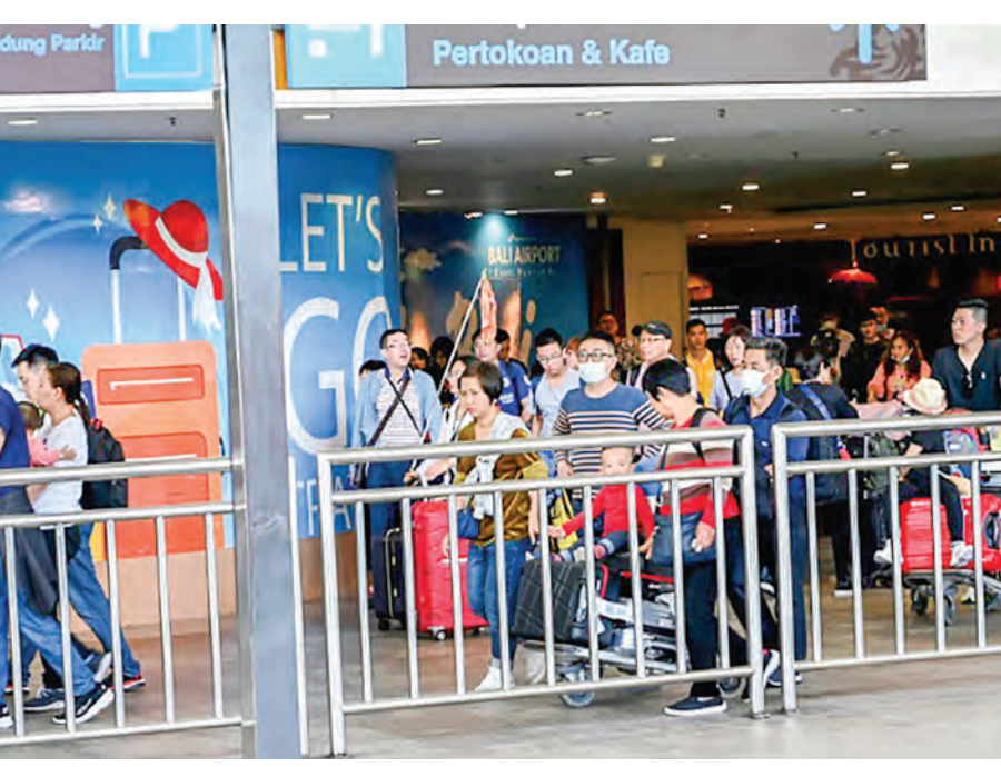
The Chinese consulate in Bali said at least 5,000 holidaymakers were on the island, the centrepiece of Indonesia's tourism industry.