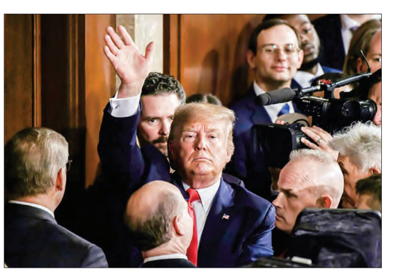
President Donald Trump immediately claimed "victory" after his acquittal in a historic impeachment, but Democrats said the outcome resulted from an unfair trial.

But the vote in the Senate showed just how solid a grip the former real estate mogul holds over the Republican Party an asset nine months before he