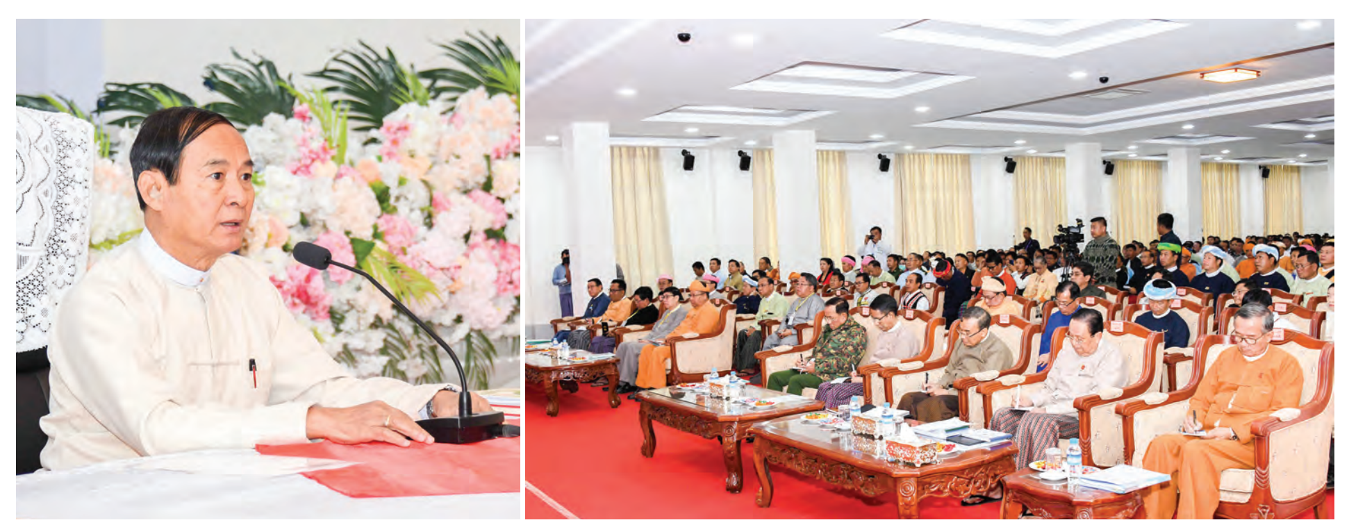
President U Win Myint delivers the speech at the meeting with local people in Taunggyi, Shan State, on 6 February 2020.