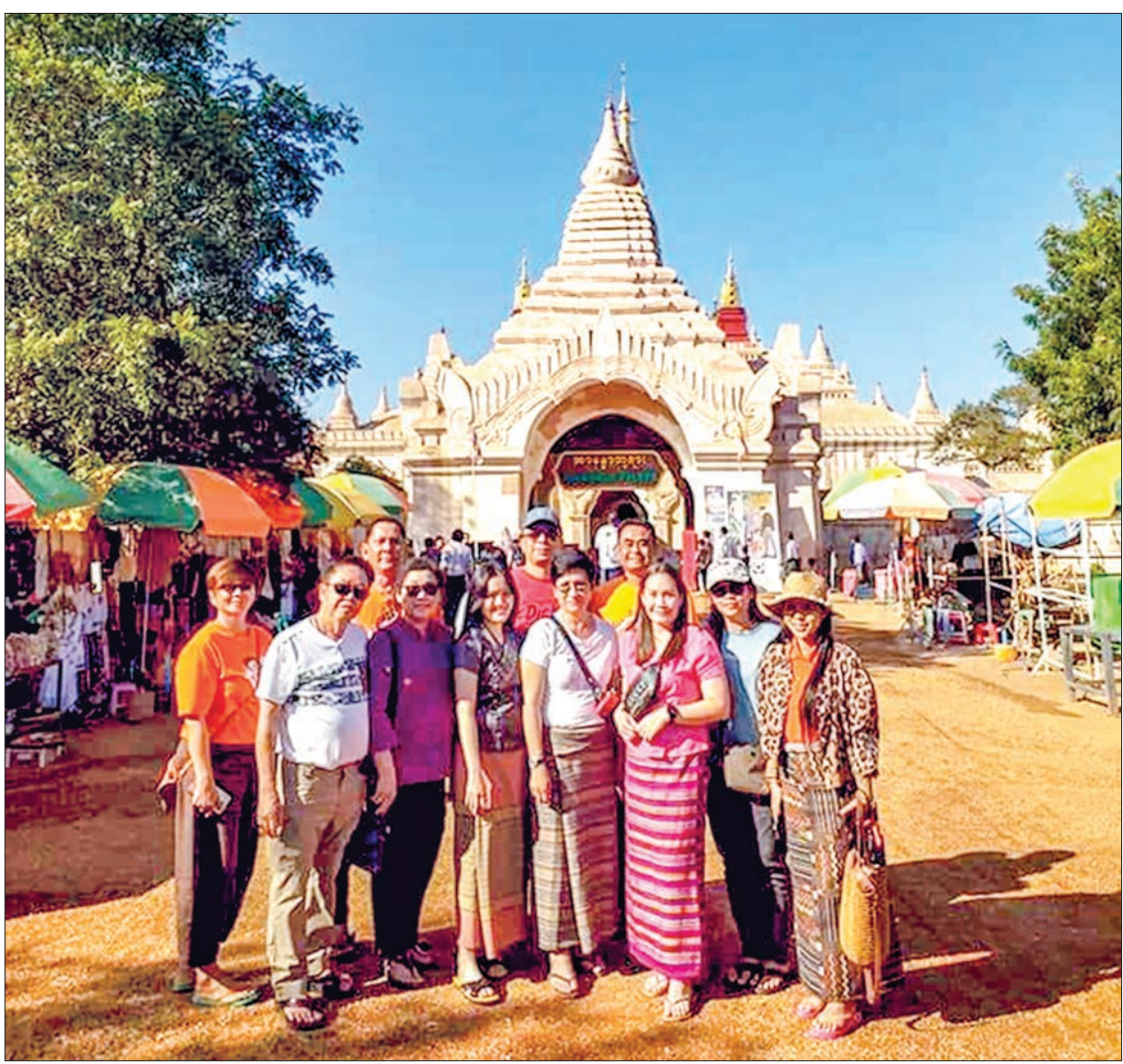
A group of tourists pose for a photo in front of Ananda Temple in UNESCO World Heritage Site Bagan.

arrangements to attract foreign visitors to the country in cooperation with private tour operators. The ministry of Hotels and Tourism also organized some travel itineraries for tourists who enter the country through border checkpoints. Some tourists enter the country by car or motorbike or bicycle in either groups or crossing alone through border checkpoints to