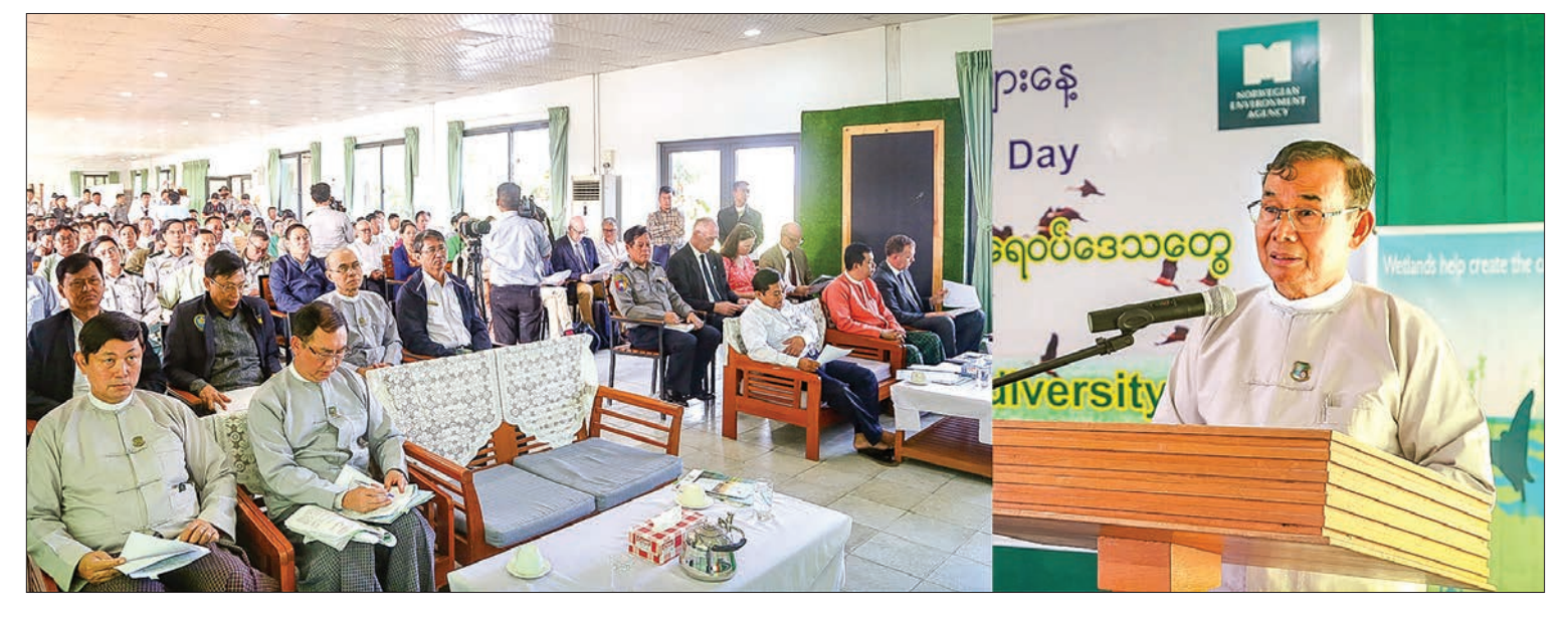
Union Minister U Ohn Win delivers the speech at the ceremony to commemorate World Wetlands Day 2020.

All these commemorative events indicate the wetlands provide goods and services upon people, then those related to them will in a greater collaboration conserve, manage, and make better use of the wetlands. They support sustainability of biodiversities as well as water resources. They are the key source of livelihood both for endangered species and native