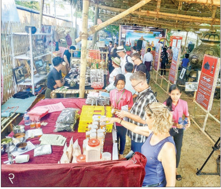
Tourists buying traditional utensils at the festival. PHOTO: MNA

The booths of the festival packed with visitors. PHOTO: MNA