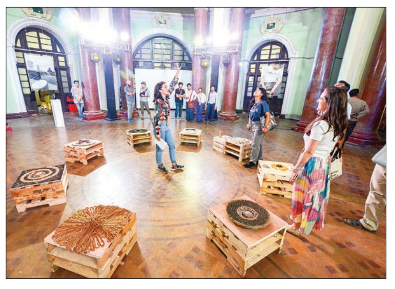
Myanmar sandalwood and starflowers showcased at the Singapore festival 2020.

MoHS releases update news of monitoring Novel Coronavirus