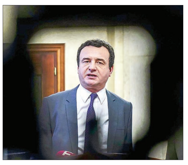
'We will govern together,' Vetevendosje head and prime minister-designate Albin Kurti said.

They inflicted a historic defeat on the PDK party, led by ex-guerrilla commanders who have