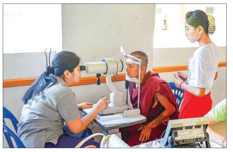
An eye specialist provides special eye treatment to the Sangha in Kawthoung.