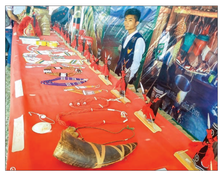
Utensils displayed inside the booth of Naga ethnic people.