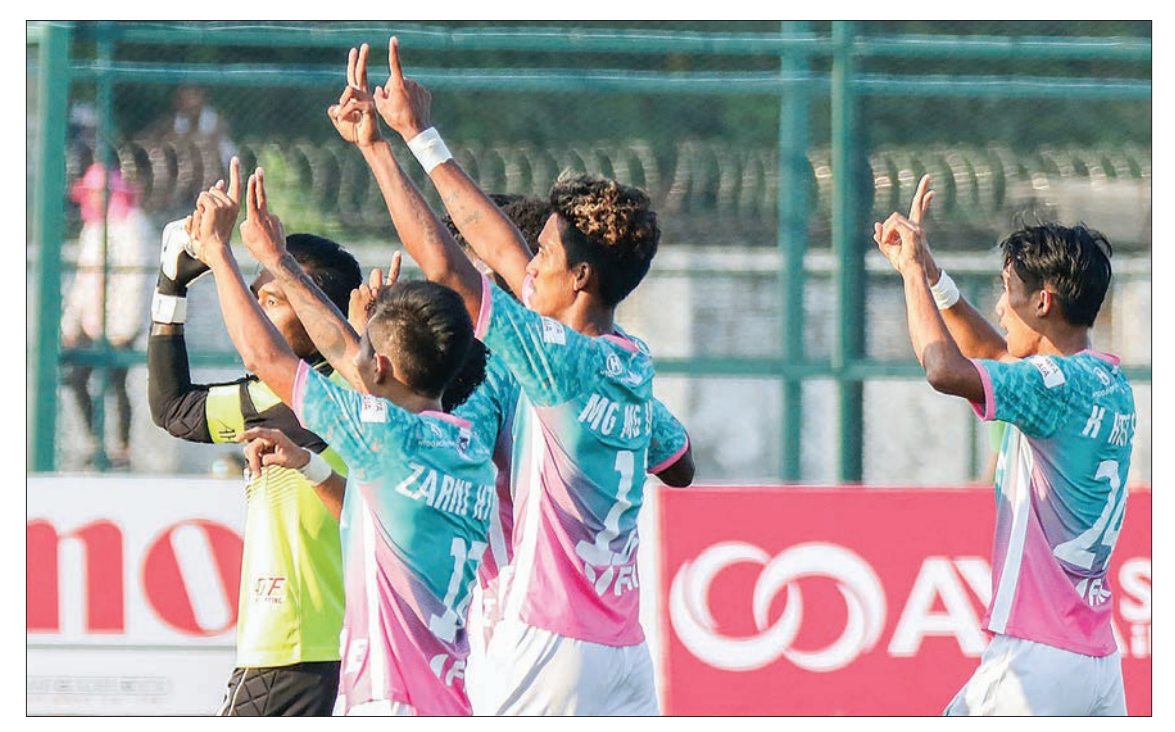
Yangon United players celebrate their 2-0 victory over Sagaing United yesterday at the Yangon United Sports Complex.