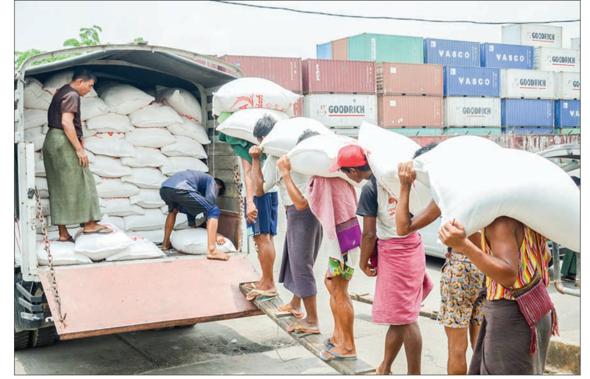
Workers carrying sacks of rice at the Botahtaung Jetty in Yangon.