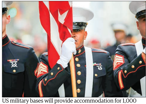
US military bases will provide accommodation for 1,000 people if they need to be quarantined because of the deadly novel coronavirus.

Several facilities each capable of housing at least 250 people in individual rooms will be made avail-