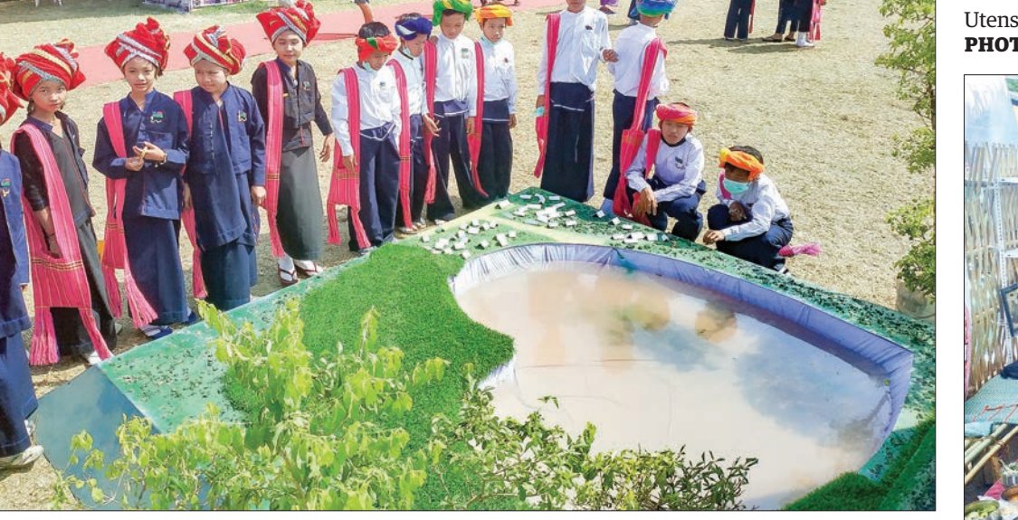
Pa-O ethnic people seen at the Ethnic Culture Festival.