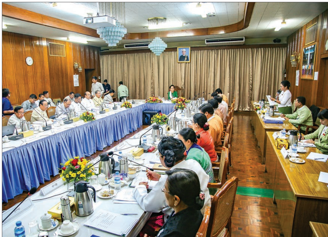
State Counsellor Daw Aung San Suu Kyi meets with members of the Yangon Region Government.

Take your own responsibility. Never let your life falls into other's hands. Never let your life falls under the influence of