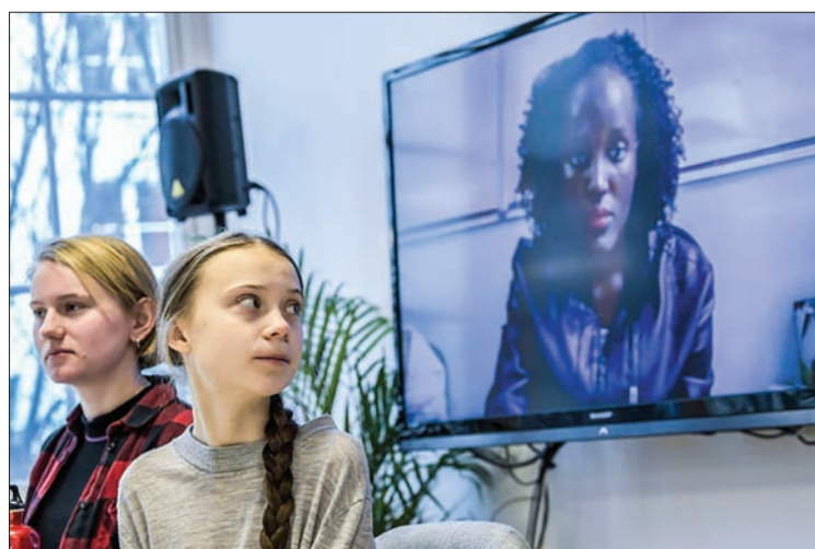
Greta Thunberg watches fellow eco warrior Vanessa Nakate, speaking from Kampala, after she was cropped out of a photo of young activists.

STOCKHOLM (Sweden) — After a racism debate in Davos on the invisibility of African climate activists, Greta Thunberg held a press conference Friday with fellow eco warriors from Kenya, Uganda and South Africa to stress the importance of their voices.