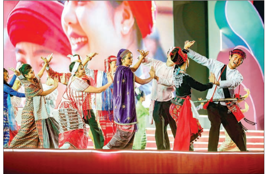
State Counsellor Daw Aung San Suu Kyi enjoys the performance of ethnic people at the Ethnic Cultural Festival-2020 in Yangon yesterday.