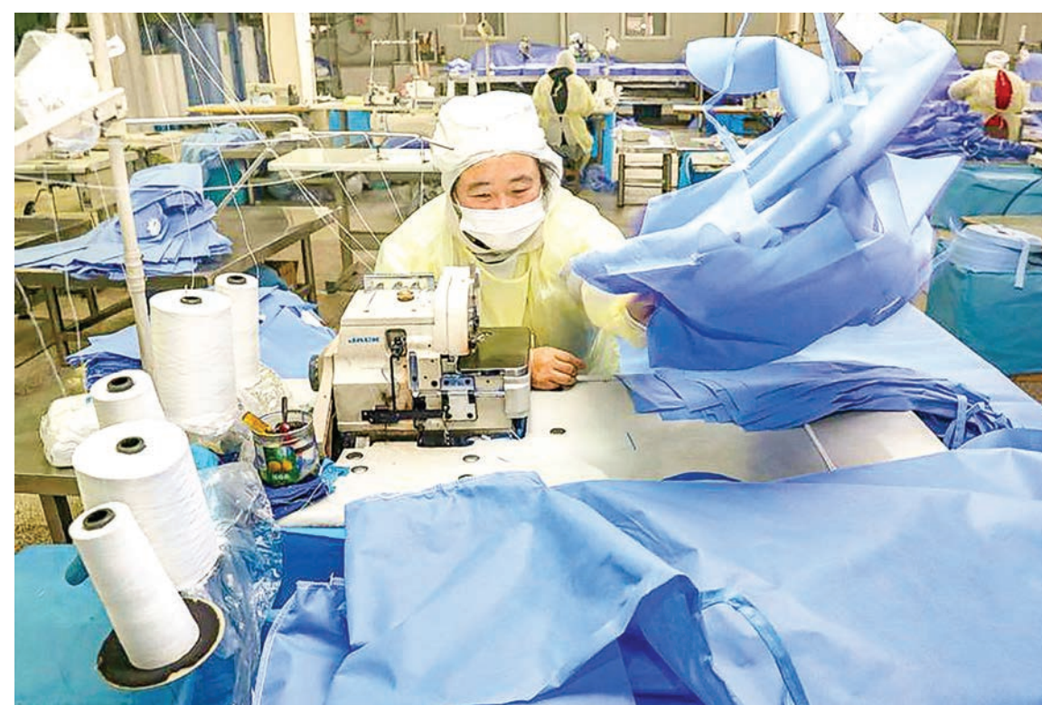
A worker produces protective suits at a factory in Nantong in China's Jiangsu province.

Australia and the US said they would deny entry to all foreign visitors who had recently