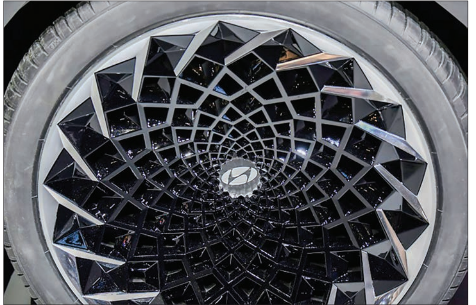
Factory closures in China due to the virus outbreak has led to shortages of supplies, including the complete electrical wiring system of a Hyundai Motor vehicle. PHOTO: AFP

Markets have struggled in recent days as the World Health Organization declared a global health emergency over the virus, with analysts concerned about its impact on world economic growth. — AFP