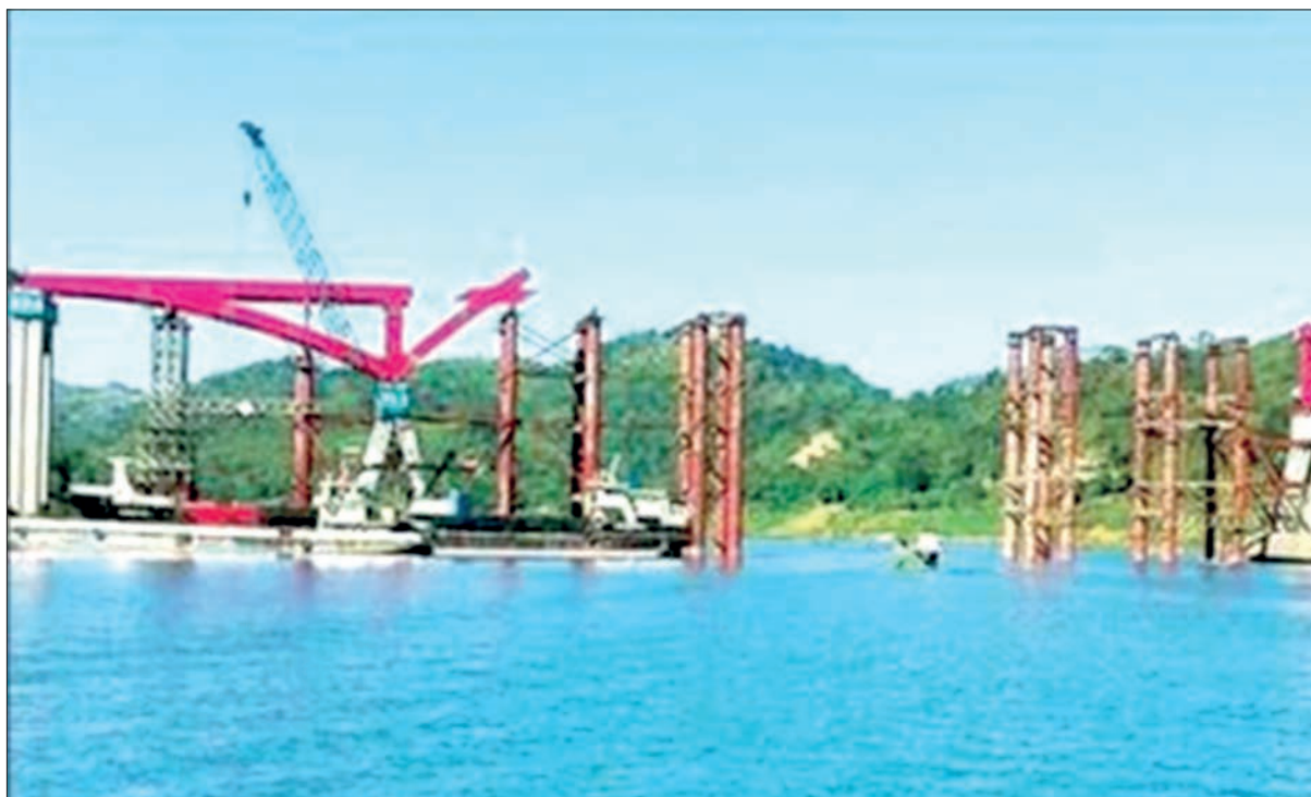
The Kaladan River Crossing Bridge Project is slated for completion by the end of March this year.

All road networks in Chin State were reportedly repaired by the local government in cooperation with the Ministry of Construction by spending over K91,669 million in the fiscal year 2018-2019. Maintenance work for road networks in Chin State will also be undertaken with the use of nearly K75,000 million in the current financial year, according to a senior official from the local government. Construction of a new road financed by the World Bank is scheduled to begin in October this year, the local government official said. The new road would link Kalay in Sagaing Region with Falam and Haka in Chin State. "The new road marks the first of