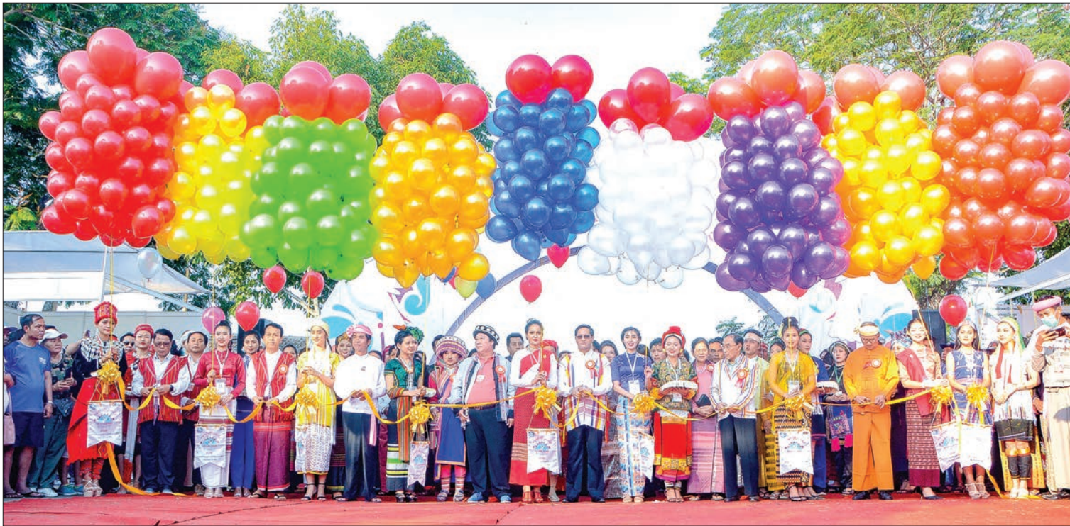
Vice President U Henry Van Thio, Union Ministers, Ministers and officials open the Ethnic Cultural Festival at the Kyaikasan Grounds in Yangon yesterday.

V ICE President U Henry Van Thio, Chairman of the Ethnic Affairs, Public Management and Services Committee, made an address at the opening ceremony of the “Myanmar Ethnic Cultural Festival” held at the Kyaikasan Grounds, Yangon yesterday morning.