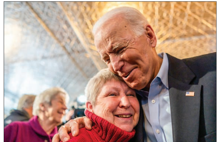
Democratic White House hopeful candidate Joe Biden, the former vice president, greets a voter during a campaign event on 31 January 2020 in Burlington, Iowa.

“I would argue, this is not the time to take the risk of falling back on the familiar or relying on an old playbook that helped get us to this point,” Buttigieg said.— AFP ■