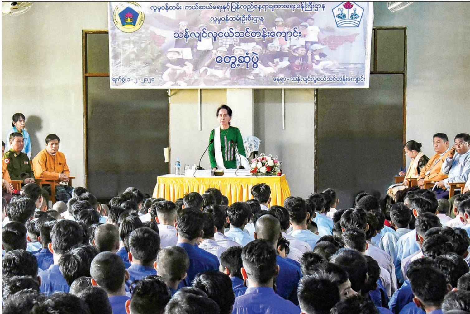
State Counsellor Daw Aung San Suu Kyi meets with the trainees at the Thanlyin Youth Training School in Yangon yesterday.