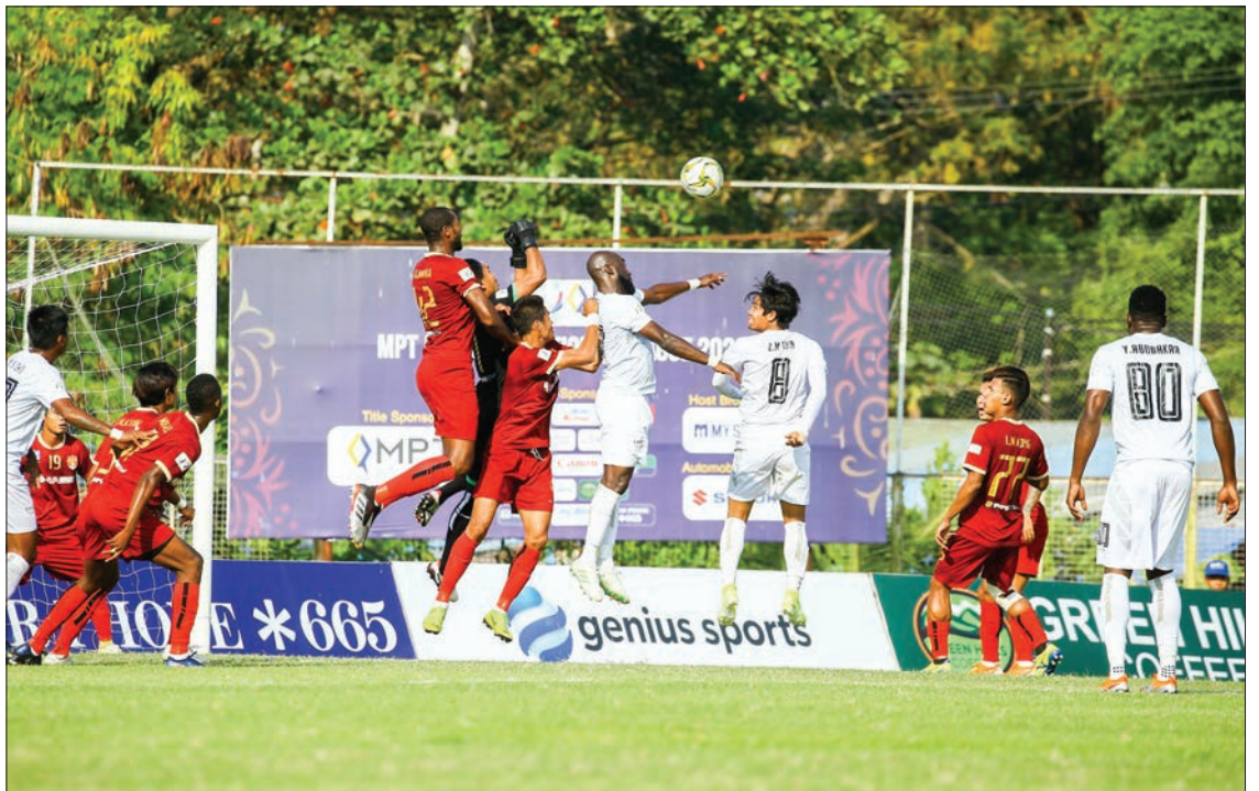
Players from Shan United (white) and Ayeyawady United (red) vying for the ball at yesterday's Week-4 match at home stadium of Ayeyawady in Patheingyi.

Also, GV Futsal club is sitting in third place with four points less than the top two teams.—Lynn Thit (Tgi)