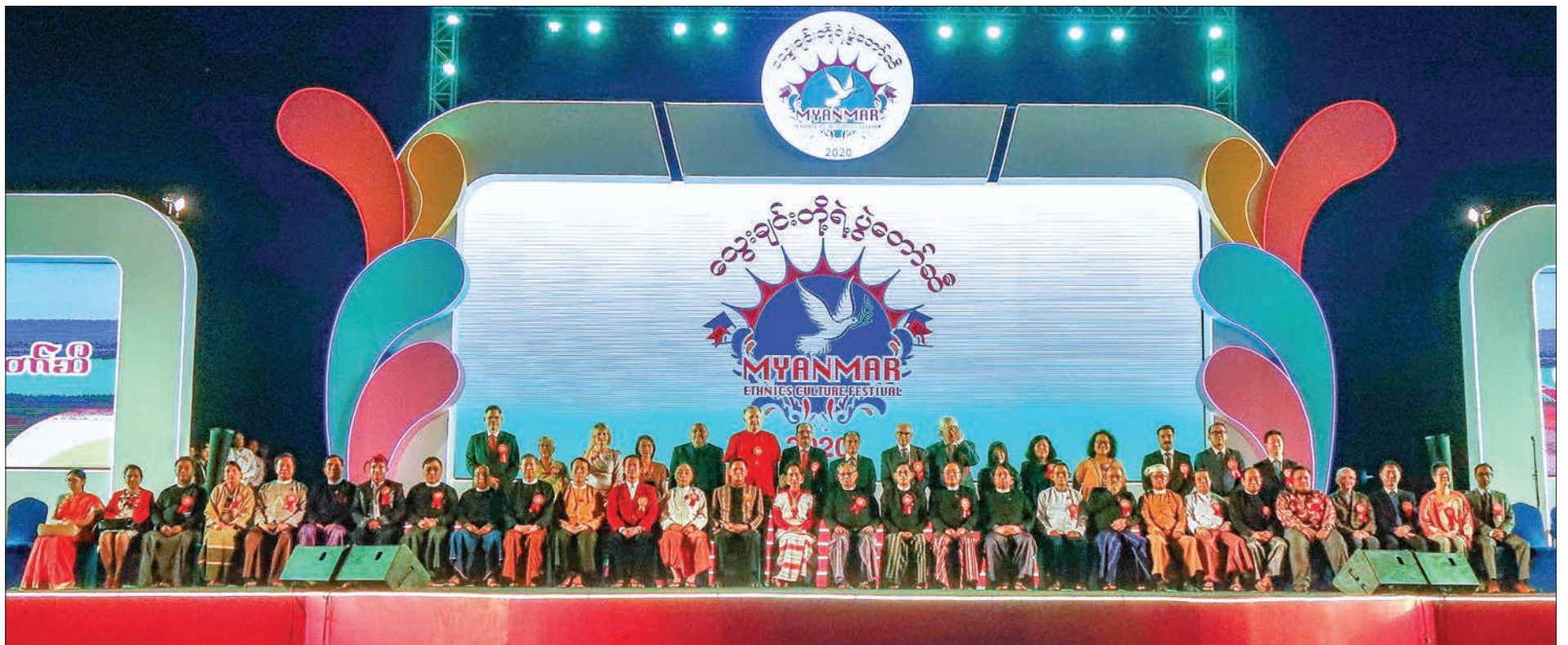
State Counsellor Daw Aung San Suu Kyi poses for a group photo with Ambassadors from Foreign Embassies in Myanmar, diplomats, UN Resident Representatives for Myanmar at the Ethnic Cultural Festival.