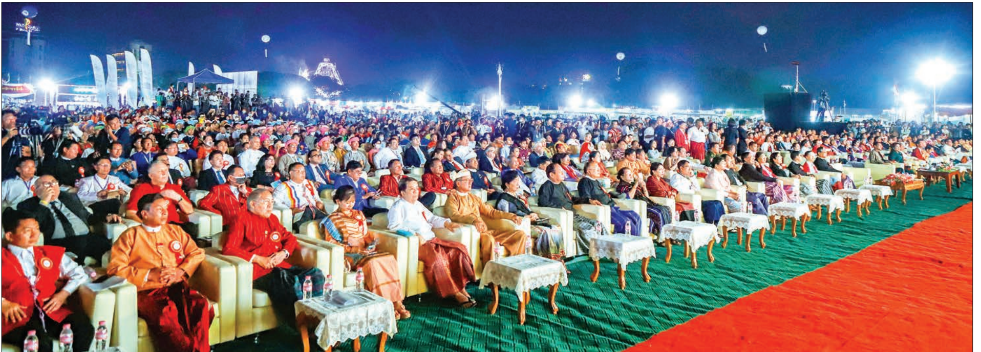
State Counsellor Daw Aung San Suu Kyi delivers the speech at the Myanmar Ethnic Cultural Festival at the Kyaikkasan Grounds in Yangon yesterday.