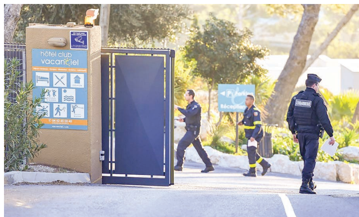
French gendarmes and health personnel prepare the holiday resort where the 200 Wuhan evacuees will be staying for two weeks.

marketing@globalnewlightofmyanmar.com မြေကြီးမြေရေများနှင့် မြေကြီးမြေအရောင်များအားဖြင့် မြေကြီးမြေ ထည့်သွင်းလိုပါက တိုက်ရိုက်ဆက်သွယ်သွေးဆွေးနိုင်ပါသည်။ Hotline Advertise with us. 09-974424848