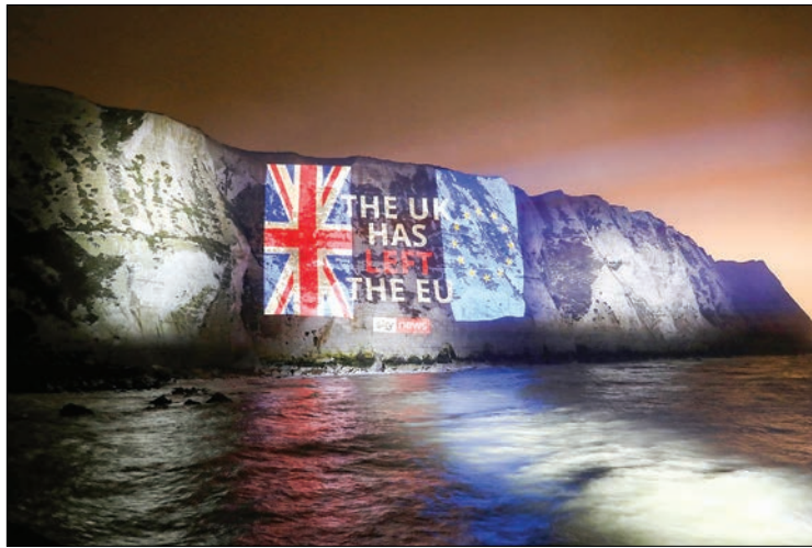
A farewell message was projected onto the White Cliffs of Dover, on the southern coast of England.

In an address to the nation, he hailed a “new era of friendly cooperation” acknowledging there could be “bumps in the road ahead” but predicting the