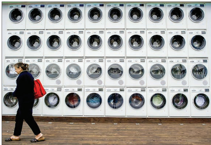
A major source of marine pollution -- microscopic bits of polyester, nylon and acrylic -- has up to now gone largely unnoticed.

Most people don't realise it, but "the majority of our clothes are made from plastic," said Imogen Napper, a researcher at the