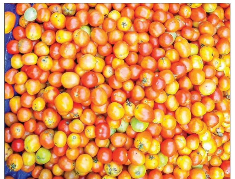
Tomato is mostly grown village-tracts in Yenangyoung Township.

The price of tomato declined in Yenangyoung because the tomato from Kyaukpadaung Township entered the Yenangyoung retail market.—Hsan Nyount (Yenangyoung) (Translated by Hay Mar)