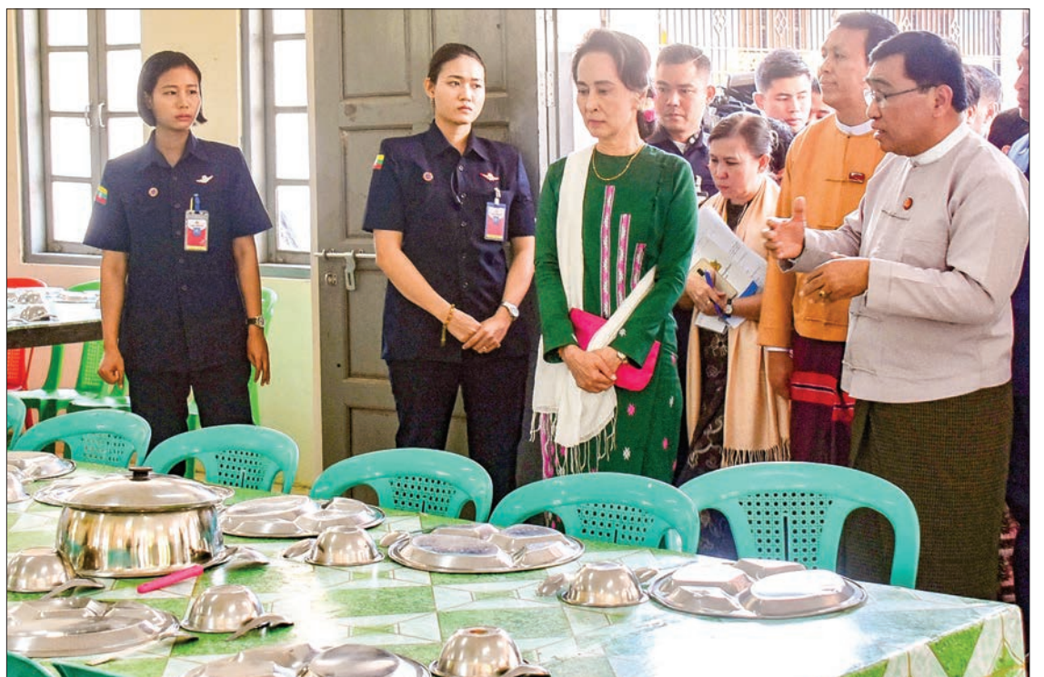
State Counsellor Daw Aung San Suu Kyi visits the Thanlyin Youth Training School in Yangon.