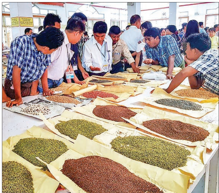
Merchants evaluate various kinds of bean in Mandalay.