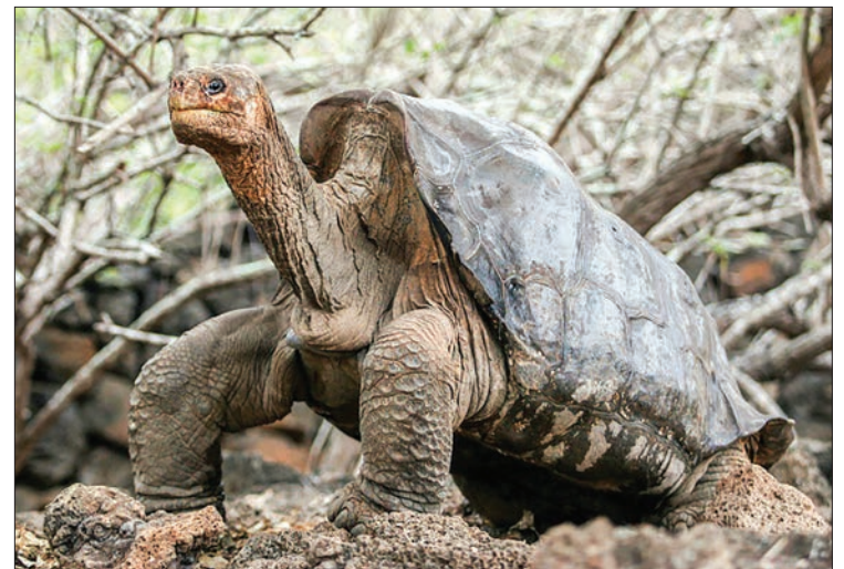
Lonely George, the last giant tortoise of the Pinta species, is seen at Galapagos National Park on Santa Cruz Island in June 2006. PHOTO: AFP

The park says there are 10,000 to 12,000 tortoises on the volcano. — AFP ■