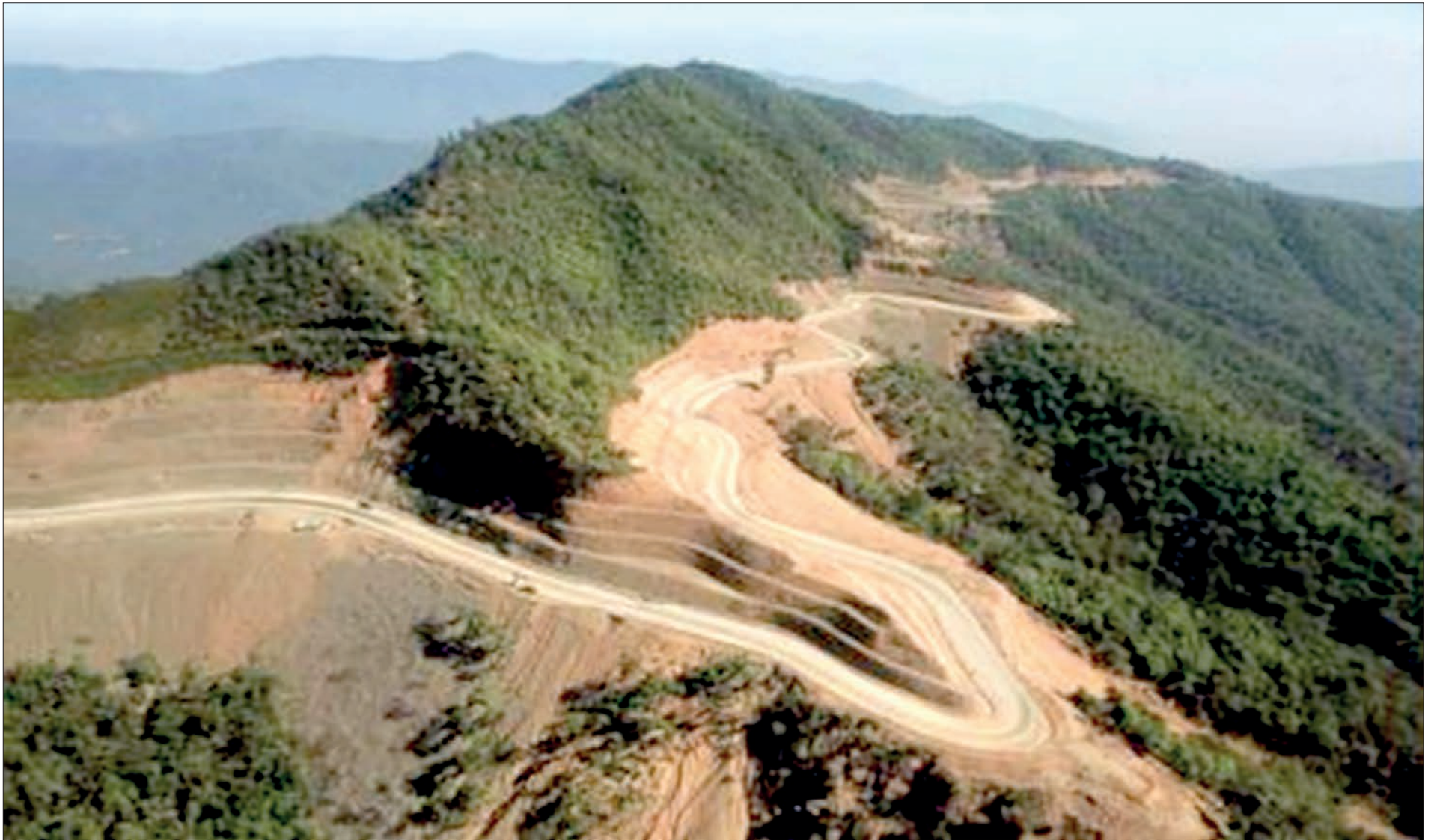
The 124-mile long Kalay-Falam-Haka Road will be upgraded by the Ministry of Construction.