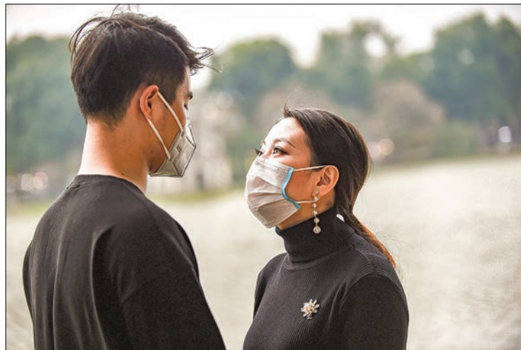
A couple wearing protective facemasks pose for photos by the Hoan Kiem Lake in Hanoi on 31 January 2020.

The World Health Organization declared the coronavirus out-