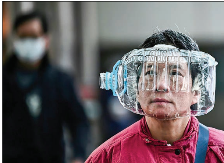
The coronavirus is causing panic around the world.

Britain said Saturday it was temporarily withdrawing some diplomatic staff and their families from across the country, a day after the US State