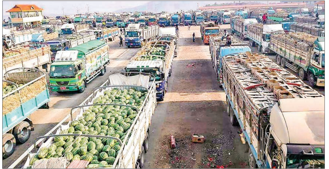
Trucks loaded with watermelons wait for passage at the Muse 105 Mile Trade Zone.

hopeful. Even 20 trucks of watermelons will not be sold. We cannot let the watermelons perish for no reason. We can only wish for the eradication of the infectious virus and for the border market to reopen. If there are other foreign markets, it will be good,” said Ko Zaw Min, an exporter to China.