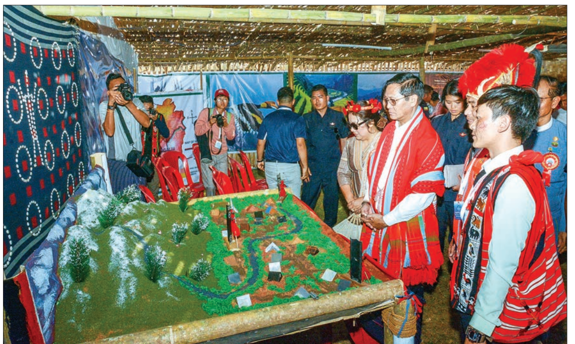
Vice President U Henry Van Thio visits the Naga ethnic booth showcased at the Myanmar Ethnic Cultural Festival in Yangon yesterday.