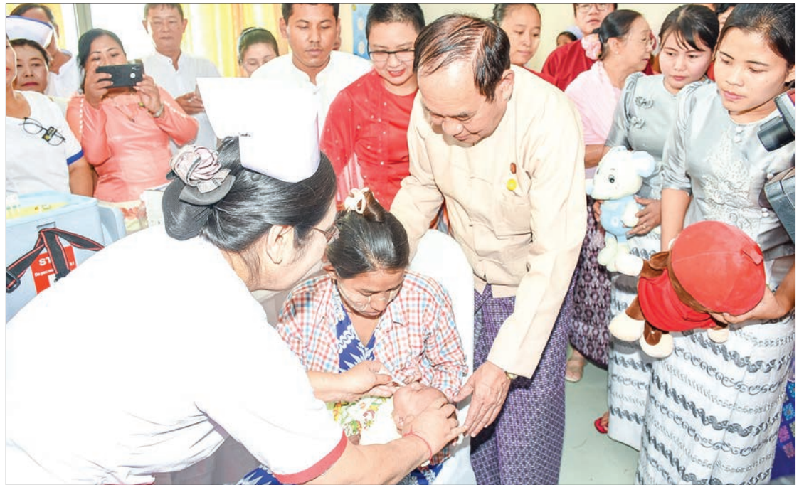
Union Minister Dr Myint Htwe observes Rotavirus vaccination at the opening ceremony of National Immunization Programme in Yangon yesterday.

nounced that the ministry will give anti-diphtheria/Tetanus vaccination to children aged 18 months and above.