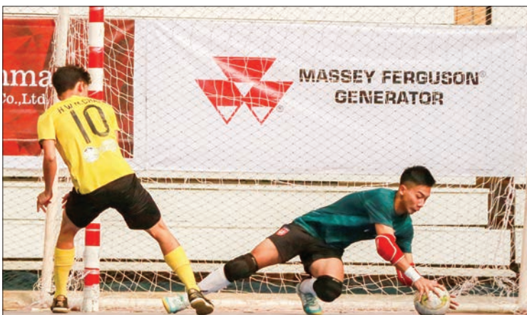
Goal keeper of the MFF U-19 futsal team (green) grabs the ball at the match against On Doctor FC at the Week-19 match of the Myanmar Futsal League at Thuwunna Indoor Stadium II in Yangon yesterday.