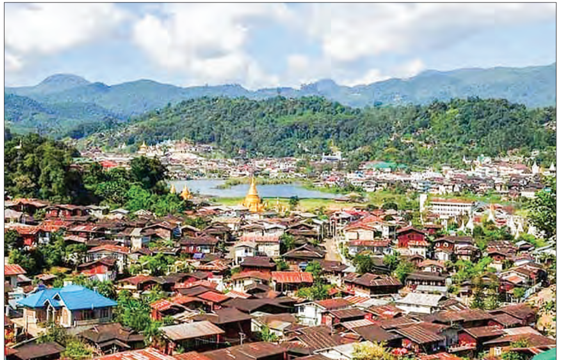
Photo shows the panorama view of Mogok which is also known as Ruby Land.