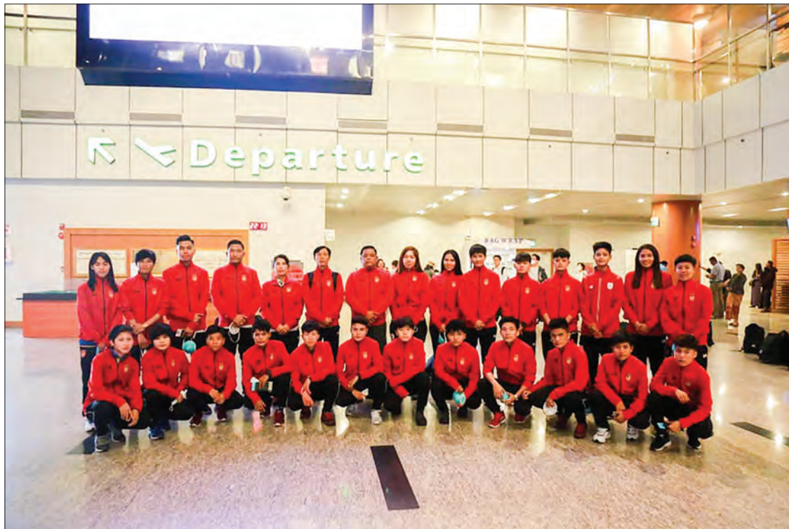
The Myanmar women's football squad and coaches seen at the Yangon International Airport yesterday before heading to South Korea.