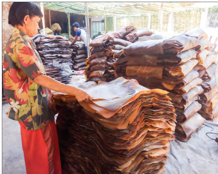
A farm worker checks the quality of smoked rubber sheets at a rubber market in Thuwunnawady in Mon State.

A slight decline in the rubber market has led to prices falling to K100 per pound this season compared with last November. Local farmers from villages near Thuwunnawady, Thaton Township, Mon State said they are not happy with the fall in price.