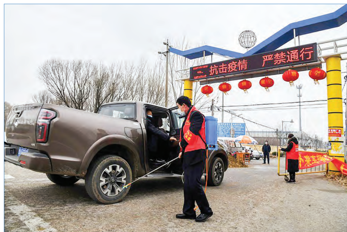
A man disinfects a vehicle at an entrance to Qianzhangjiashuang Village in Jiangshan Town of Laixi City, east China's Shandong Province, Jan. 28, 2020.

REFERENCES: Xinhua; Kyodo; AFP News Updates