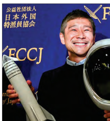
Yusaku Maezawa has cancelled his search for a girlfriend willing to join him on a journey to the moon.

"Despite my genuine and honest determination toward the show, there was a part of me that still had mixed feelings about my participation," he wrote, in English, on his Twitter account.