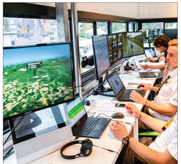
FILE: Inside the tech truck of NTT.

NTT introduced a similar system in Las Vegas, Nevada, from February 2019 after testing it in the US city in 2018. It will apply technologies used in the US project to the Malaysian smart city research.—Kyodo News