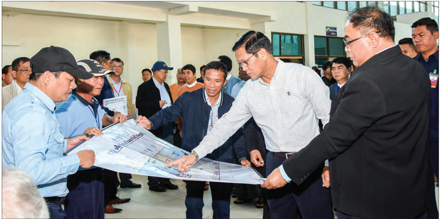
Vice President U Henry Van Thio inspects the upgrading process of the NyaungU airport project in NyaungU yesterday.