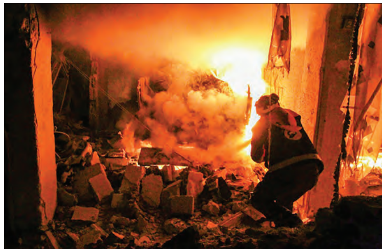
A volunteer firefighter battles a blaze after a night-time air strike on the Idlib province town of Ariha.

the West Bank and further Palestinian protests are expected in the coming days. The Israeli army announced Wednesday it would deploy additional troops in the West Bank and the near the Gaza Strip. "Following the ongoing situation assessment, it has been decided to reinforce the Judea and Samaria and Gaza Divisions with additional combat troops," the army said in a statement, using the Israeli terms for the West Bank. — AFP ■