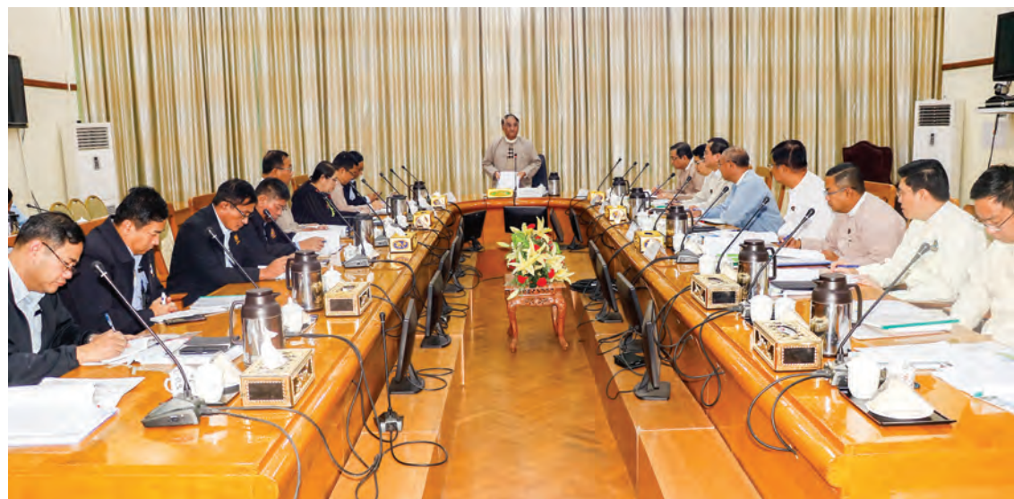
Union Minister for Commerce Dr Than Myint addresses the meeting of oversight committee on car imports and related activities in Nay Pyi Taw yesterday.