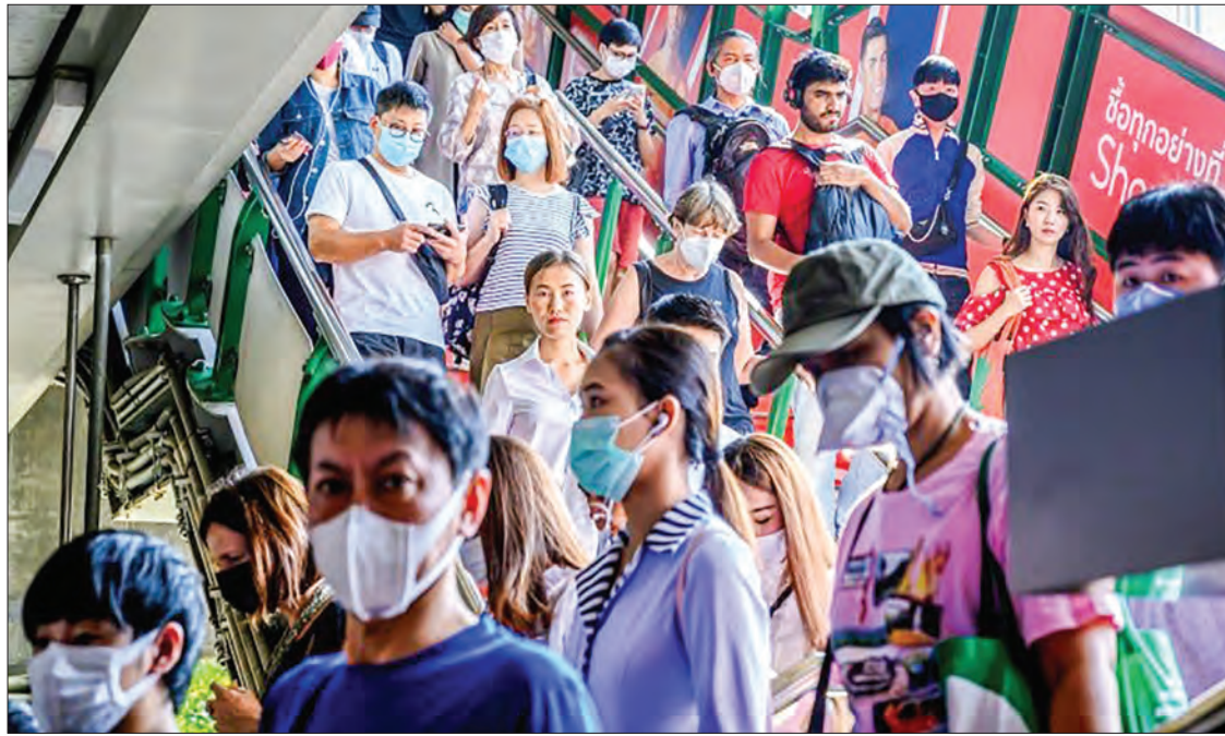
Thailand has so far detected 14 cases of the new coronavirus. PHOTO: AFP

“They already admitted that they created fake news,” Bud-