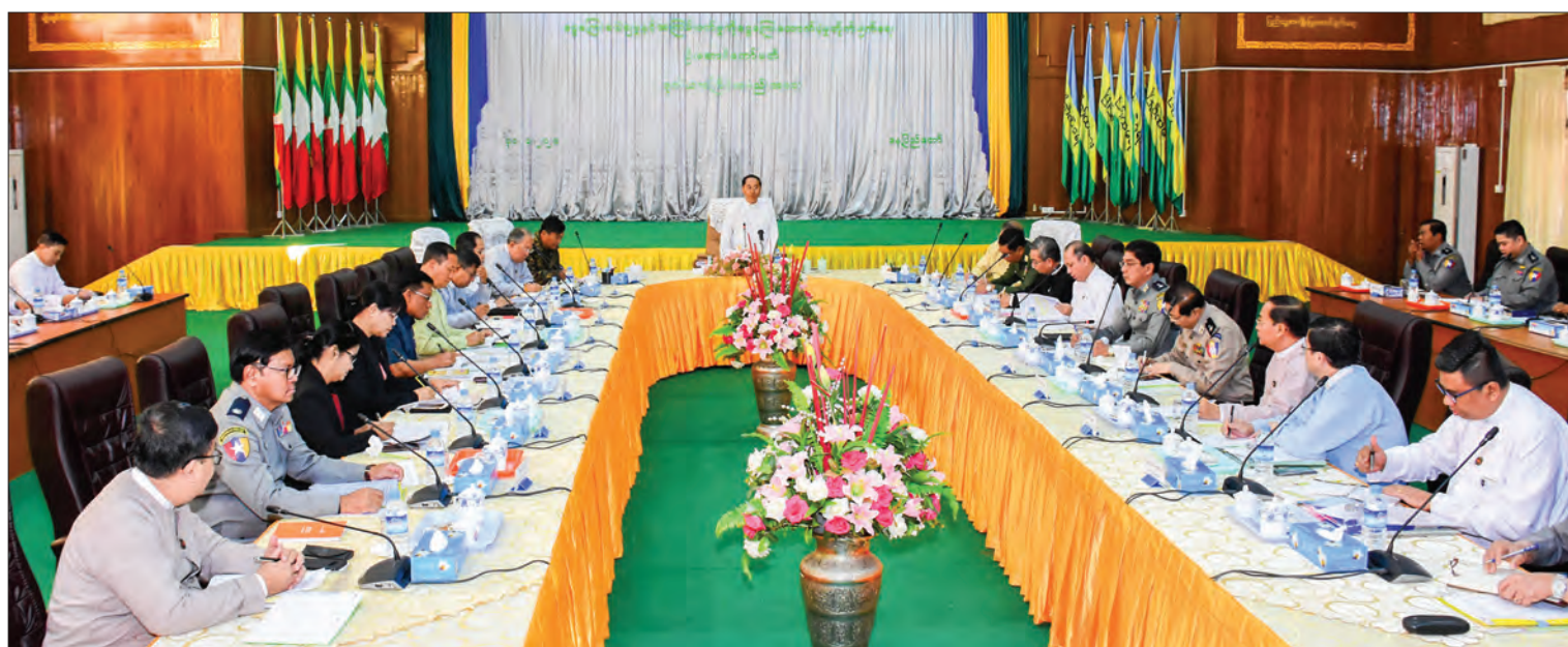
Vice President U Myint Swe delivers the opening address at the second coordination meeting of Steering Committee on Anti-Money Laundering and Combating Financing of Terrorism at the Ministry of Home Affairs in Nay Pyi Taw yesterday.

To enforce the measures, the President's Office formed the