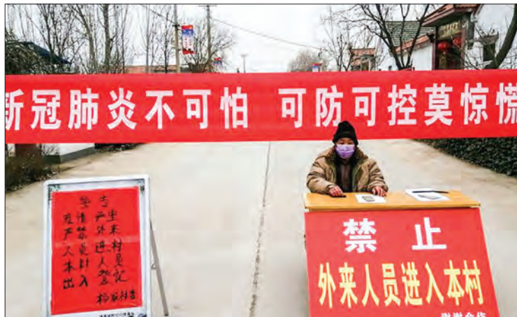
Unofficial checkpoints have been set up outside villages — like this one in Zouping — to stop outsiders bringing in the deadly virus.

Alarmed by daily reports of new cases across the country, ordinary citizens and local officials