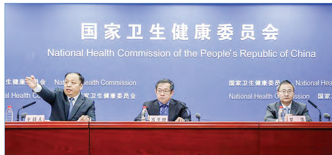
Feng Zijian (C), deputy head of the Chinese Center for Disease Control and Prevention, and Wu Hao (R), head of the Fangzhuang community health service center in Beijing, attend a press conference held by the National Health Commission in Beijing, capital of China, Jan. 29, 2020.

The coronavirus, known to be transmitted between humans, has already spread to other Asian nations such as Japan and South Korea, as well as North America,