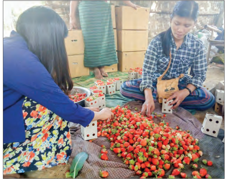
Growers packaging fresh red strawberries to sell at the market in PyinOoLwin.