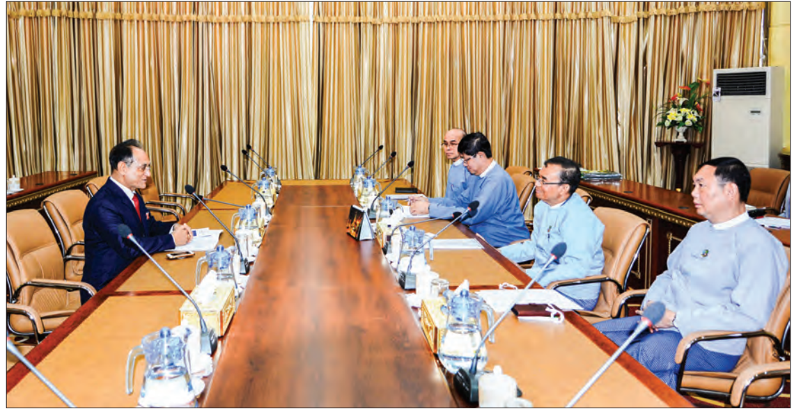
Union Minister U Ohn Win meets with Nepali Ambassador Mr Bhim K Udas in Nay Pyi Taw yesterday.