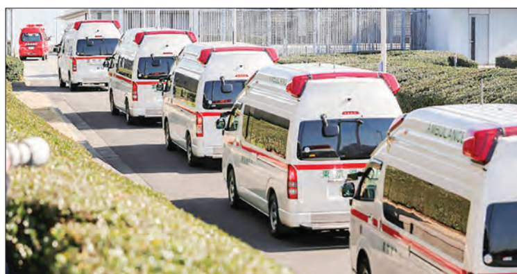
Ambulances arrive at Haneda airport in Tokyo to meet the second charter flight evacuating Japanese citizens from the Chinese city of Wuhan.

TOKYO — Three Japanese evacuated from the epicentre of a deadly new coronavirus outbreak have tested positive for the illness, the government said Thursday, as it faced criticism for the country’s minimal quarantine measures.