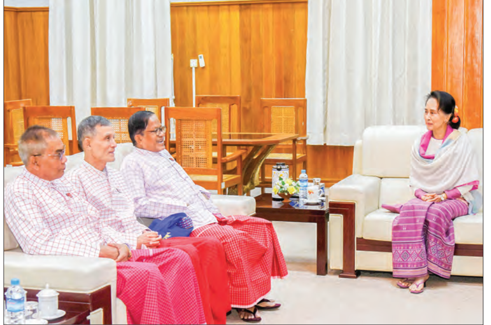
State Counsellor Daw Aung San Suu Kyi meets with New Mon State Party Chairman Nai Han Thar and party at the NRPC in Nay Pyi Taw yesterday.

Present on the occasion were U Kyaw Tin, Union Minister for International Cooperation and Director-General U Min Thein of the Protocol Department of the Ministry of Foreign Affairs.—MNA