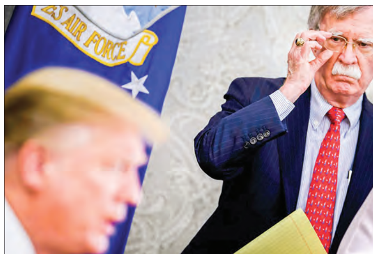
Democrats are seeking the testimony of former National Security Advisor John Bolton at the Senate impeachment trial of President Donald Trump.

The 100 members of the Senate will return at 1:00 pm (1800 GMT) on Thursday to pose