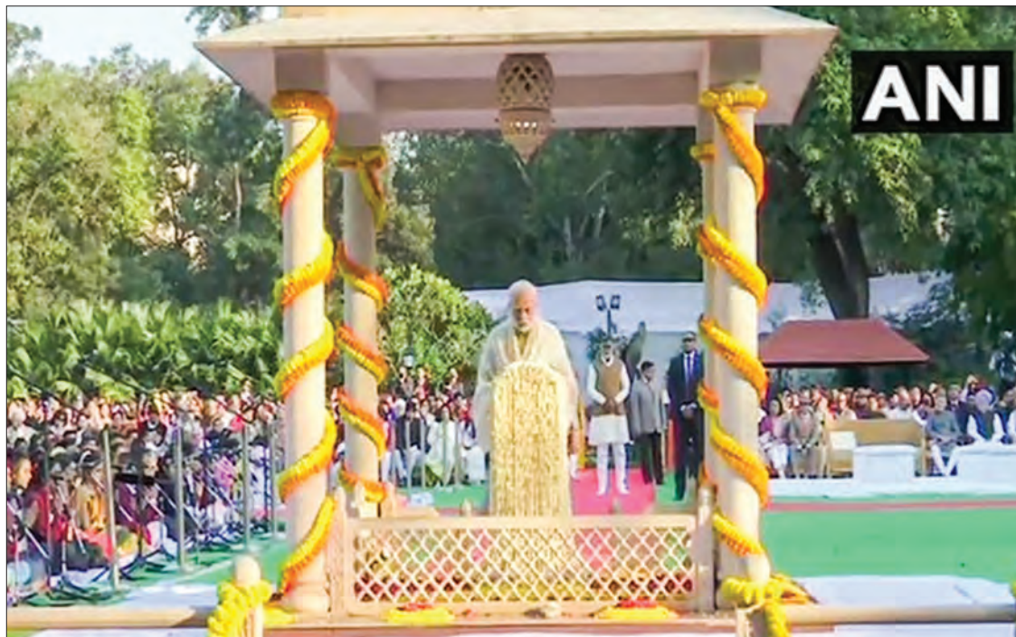
Prime Minister Narendra Modi at Gandhi Smriti on Thursday.

"In his final sacrifice, Gandhiji left a constant reminder for