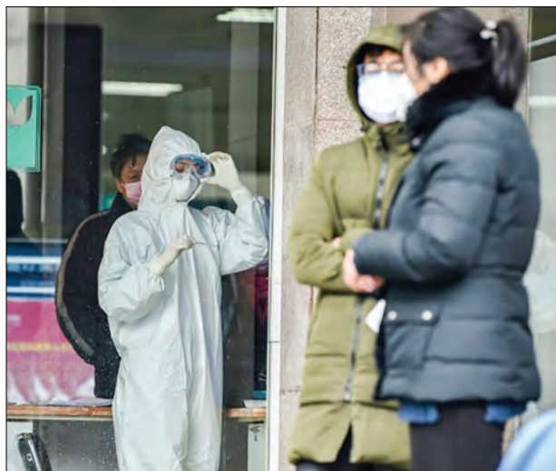
US Federal Reserve Chairman Jerome Powell said the coronavirus posed a new risk to growth in China and elsewhere.

The WHO, which initially downplayed the severity of the disease, has warned all governments