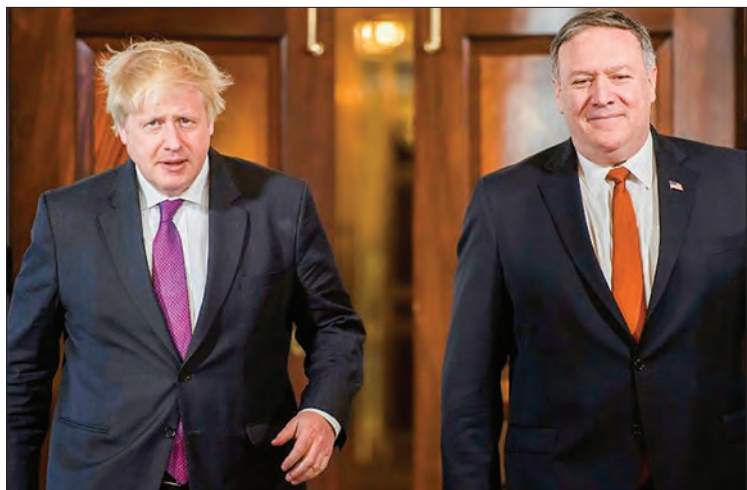
US Secretary of State Mike Pompeo's meetings with British Prime Minister Boris Johnson threaten to become a damage limitation exercise for the "special relationship".

LONDON — Prime Minister Boris Johnson will hold talks on post-Brexit trade with the top US diplomat on Thursday, eve of Britain's historic departure from the European Union.