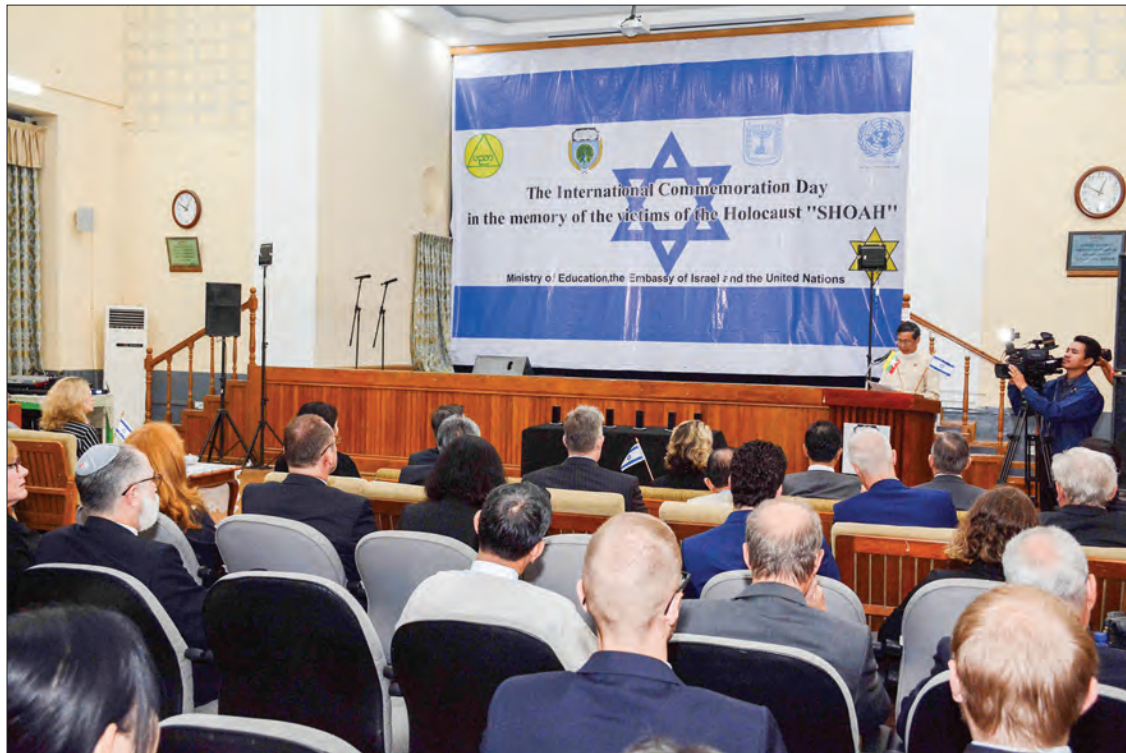
Union Minister Dr Myo Thein Gyi addresses the event of the 2020 International Commemoration Day in the memory of victims of the Holocaust in Yangon yesterday.

UNION Minister for Education Dr Myo Thein Gyi attended the 2020 International Commemoration Day in the memory of victims of the Holocaust at Arts Hall of University of Yangon yesterday morning.