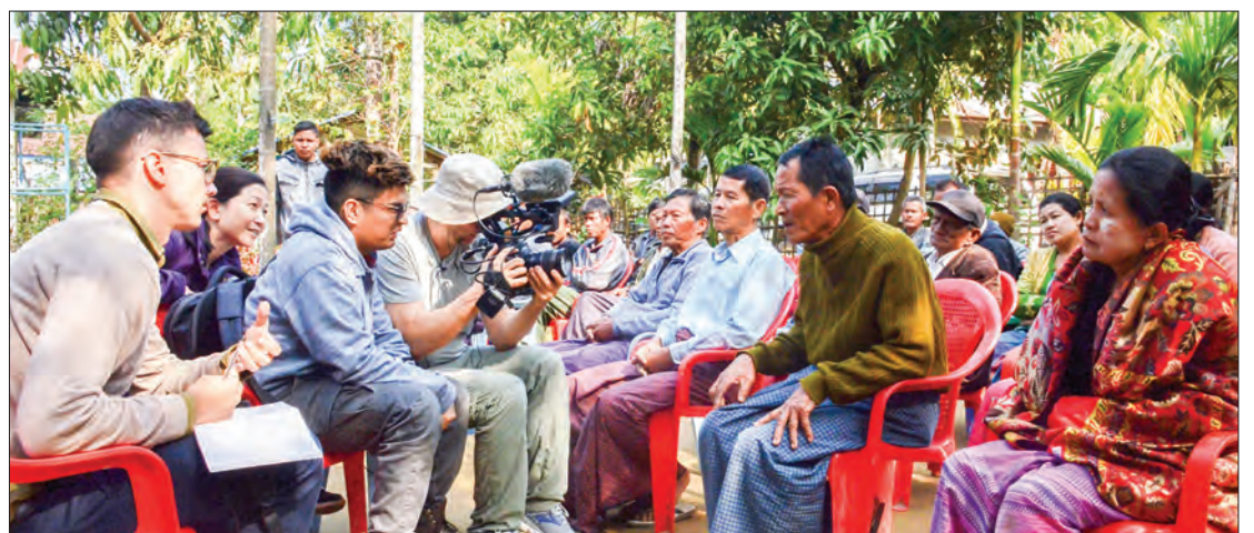
Journalists conducting interview with local residents during their trip to a village in Maungtaw Township, Rakhine State yesterday.