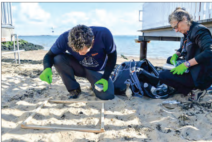
The Tara foundation’s last expedition found that 100 percent of samples from European rivers contained plastic and microplastics.

Instead, the research will rely on the Japanese Association for Marine Biology (JAMBIO) network, which has more than 20 coastal facilities equipped with research infrastructure.—AFP ■