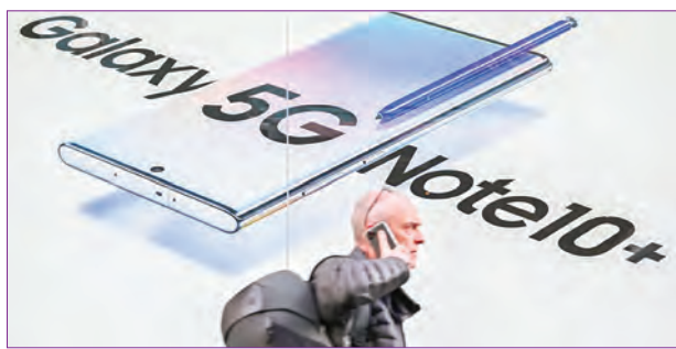
A pedestrian passes a sign advertising 5G in London on 28 January 2020 after Prime Minister Boris Johnson announced limited participation of the Chinese company Huawei in the UK's 5G network.

It leaves member states with the responsibility to ensure the safe rollout of 5G and warns them to screen operators carefully, saying security of the net-