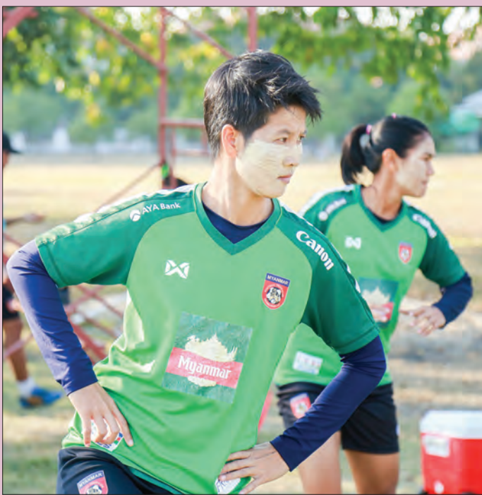
Players from the Myanmar women's national football team during a physical training session.

THE Myanmar Football Federation recently announced the final player list for the Myanmar women's national football team for the third round of the 2020 AFC Women's Olympics qualifying tournament, scheduled to be held on 3 February at the Jeju World Cup Stadium in Seogwipo, South Korea.