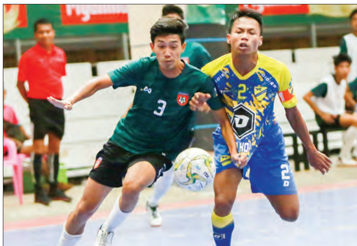
An MFF U-19 team player (left) vies for the ball with a player from Do Do Ko F.C. during the Week-17 match of the Myanmar Futsal League yesterday in Yangon.

Meanwhile, the GV Futsal Club is in the third place, trailing the first and second placed teams by four points. —Lynn Thit (Tgi)