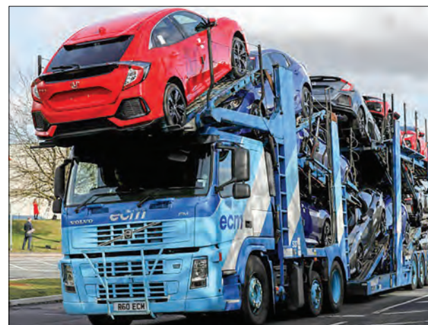
Japan chose Britain as its EU carmaking hub in the 1980s and is now said to be keen to strike a trade deal to maintain stability.

For now, until a transition period expires on 31 December, Britain will remain inside the EU's customs union and single market, which takes nearly half of all British exports including cars, meat and