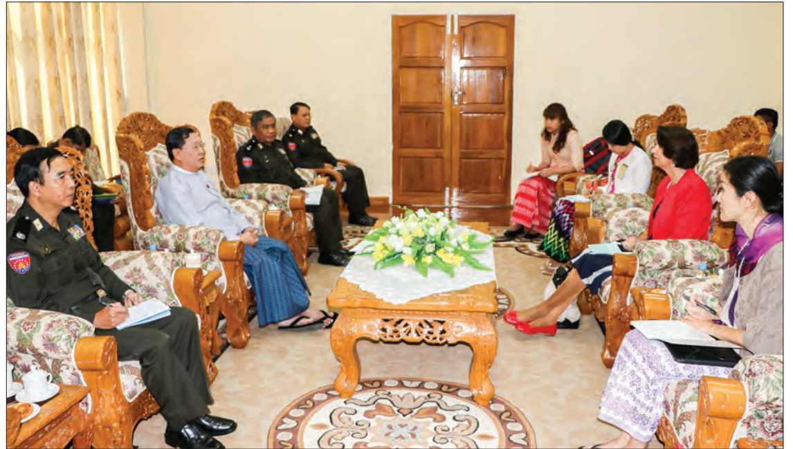
Union Minister U Thein Swe meets with a delegation led by Mrs Christine Schraner Burgener, Special Envoy of the UN Secretary-General, in Nay Pyi Taw on 29 January.

The ministry side also discussed the means for contacting the ministry's officials to get information on repatriation processes and raising awareness activities about advantages of holding the National Verification Card.