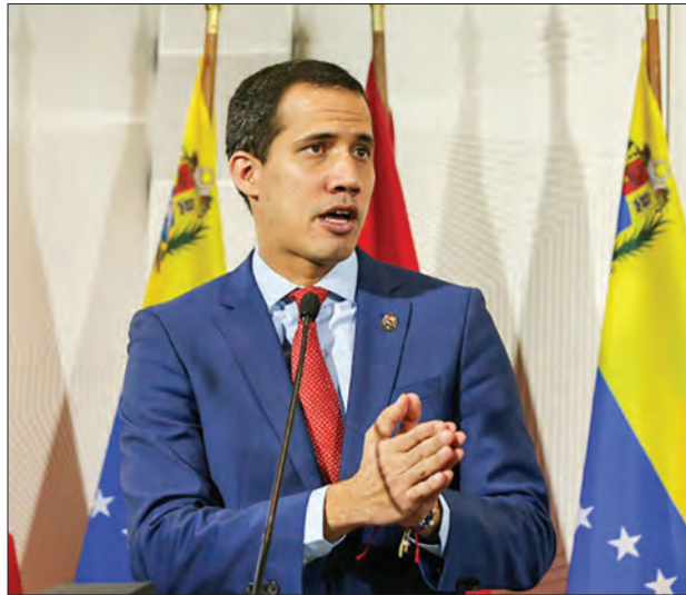
Colombia said it would seek the extradition of a fugitive former lawmaker through a request to Venezuela's opposition leader Juan Guaidó, who has been recognized by more than 50 countries as interim president.