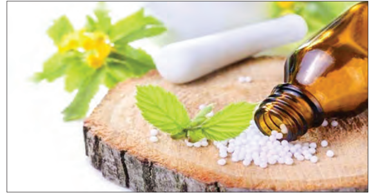
Homeopathy medicine.

“The amendments will ensure necessary regulatory reforms in the field of Homoeopathy education and enable transparency and accountability for protecting the interest of the general public,” the release