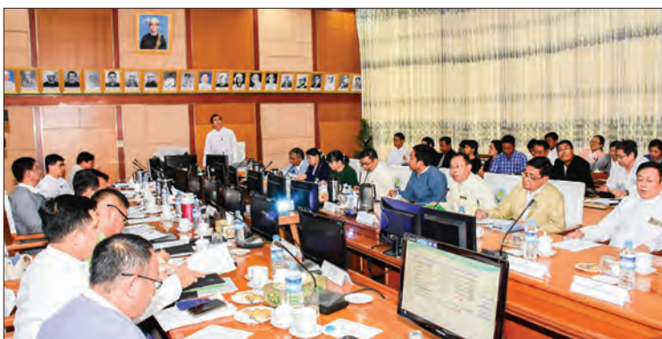
Deputy Minister U Aung Hla Tun attends the coordination meeting for accepting and scrutinizing tender for school textbooks in Nay Pyi Taw yesterday.