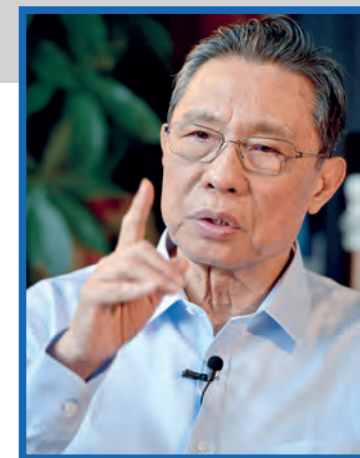
Renowned Chinese respiratory scientist Zhong Nanshan receives an interview with Xinhua in Guangzhou, south China's Guangdong Province, Jan. 28, 2020.

The country has taken a series of powerful measures,