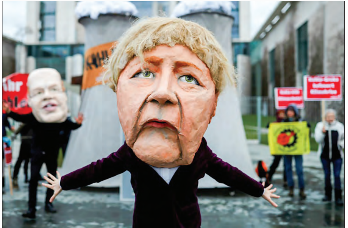
Outside Chancellor Angela Merkel’s office, marchers brandished signs reading “Shut off the coal plants NOW”.

Activists and campaign groups such as Greenpeace say the planned law falls far short of what is needed for Germany to fulfil its climate promises.