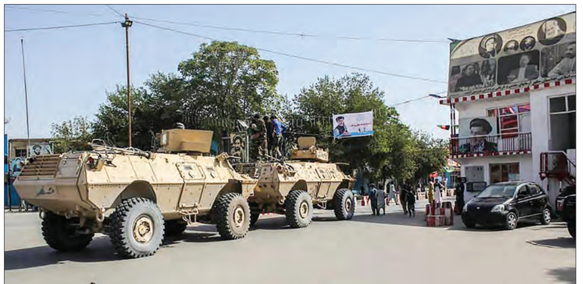
FILE: Afghan soldiers gather at a street in Kunduz after Afghan security forces “repelled” a coordinated Taliban assault on the northern city of Kunduz.

Zabihullah Majahid who claims to speak for the Taliban outfit in contact with media claimed that more than 30 soldiers had been killed in the raid. —Xinhua ■