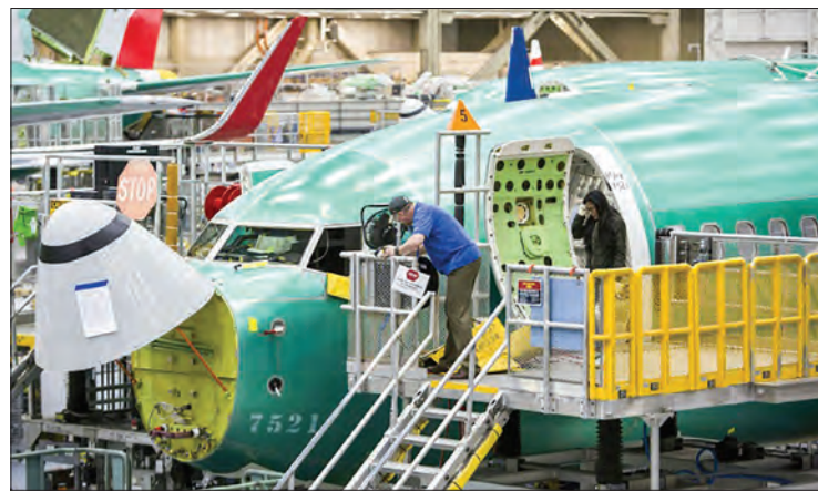
Boeing reported its first annual loss in more than two decades as the lengthy grounding of the 737 MAX weighed on revenues and added to costs.

The grounding of the MAX dented Boeing's earnings in mul-