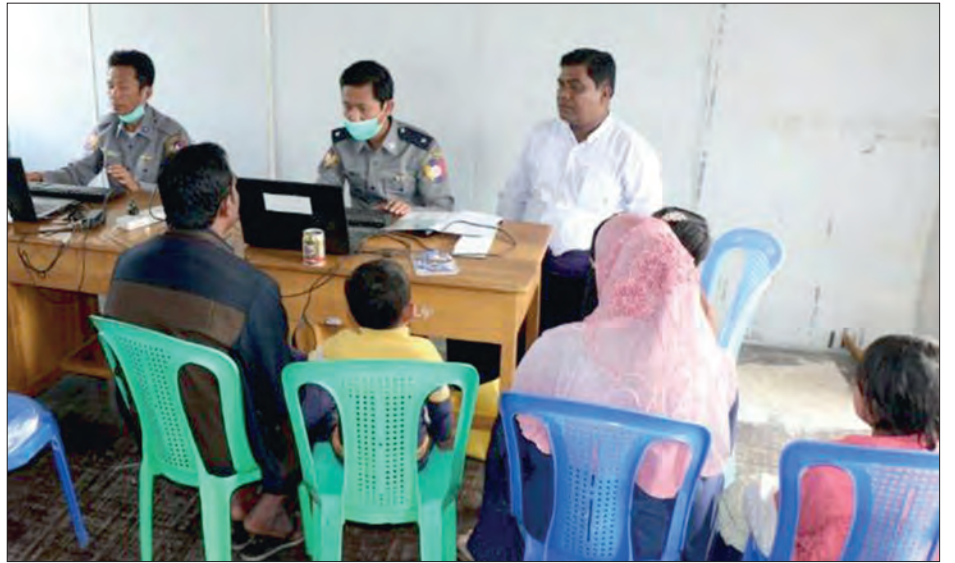
Officials from Nga Khu Ya Reception Centre working to issue National Verification Cards to the displaced persons in Maungtaw, Rakhine State yesterday.