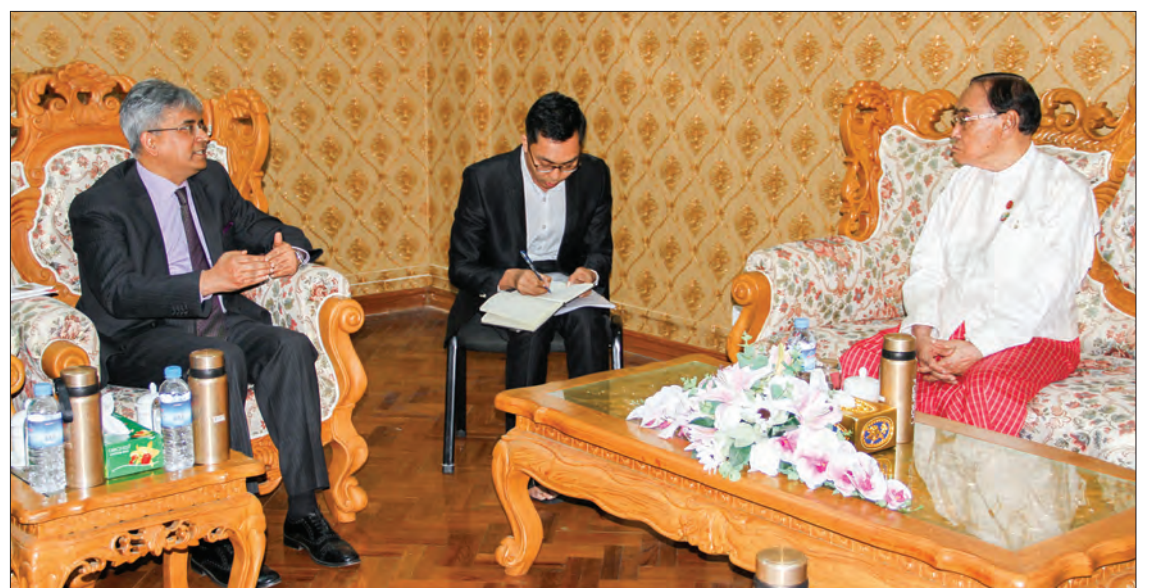
Union Minister for Ethnic Affairs Nai Thet Lwin meets with Indian Ambassador Mr Saurabh Kumar at he Ministry of Ethnic Affairs in Nay Pyi Taw yesterday.