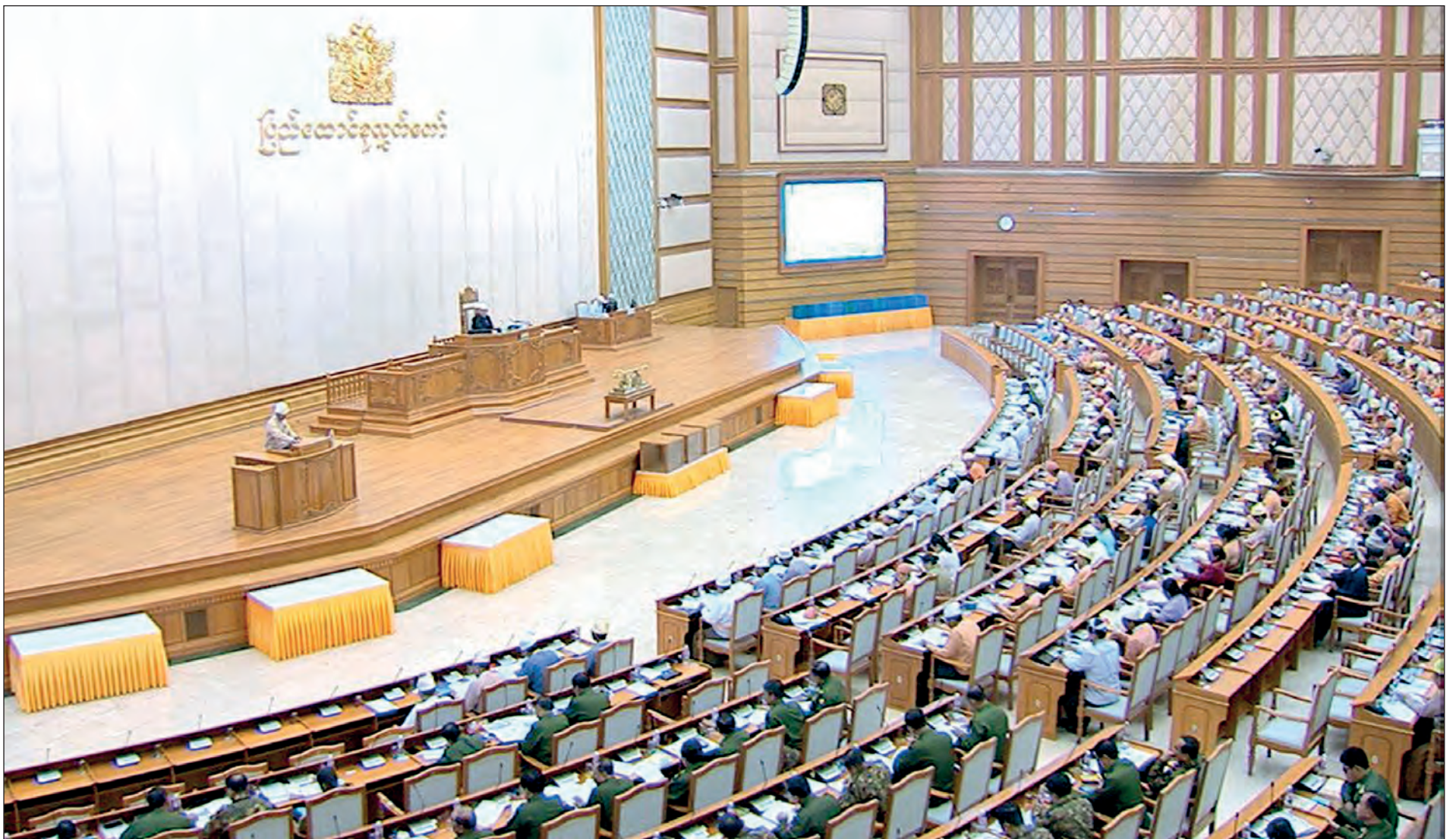
The 15 th regular session of Second Pyidaungsu Hluttaw holds its third day meeting at the Pyidaungsu Hluttaw Hall in Nay Pyi Taw yesterday.

T HE second Pyidaungsu Hluttaw convened the 3 rd day of its 15 th regular session yesterday, and MPs continued discussion about the Euro 50 million loan from the Government of Poland and the first section of Joint Public Accounts Committee Report(16/2019).