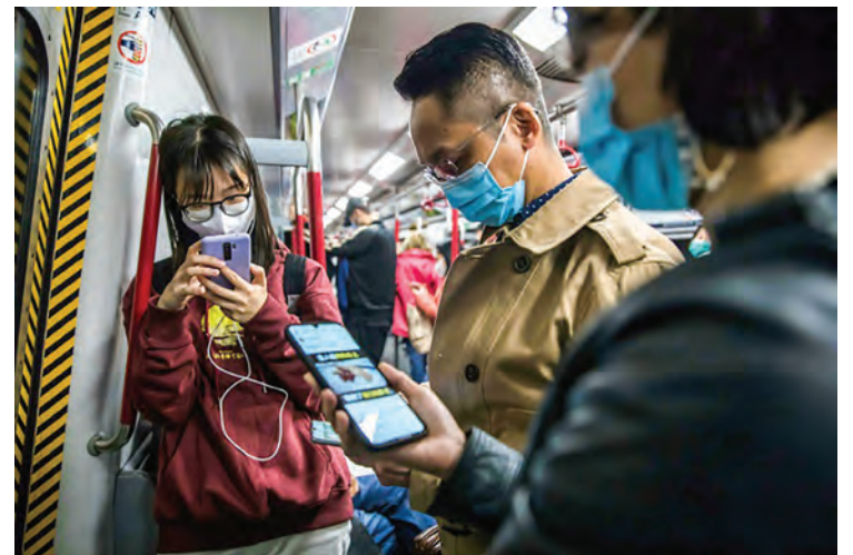
Hong Kong scientists say “draconian” measures are needed to stop the spread of the new virus.

The Chinese government has sealed off Wuhan and neighbouring cities, effectively trapping tens of millions of people, in a bid to contain the virus. — AFP ■