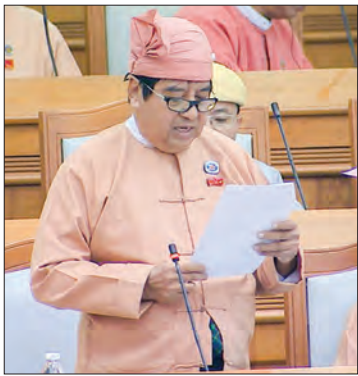
MP Dr Sein Mya Aye.