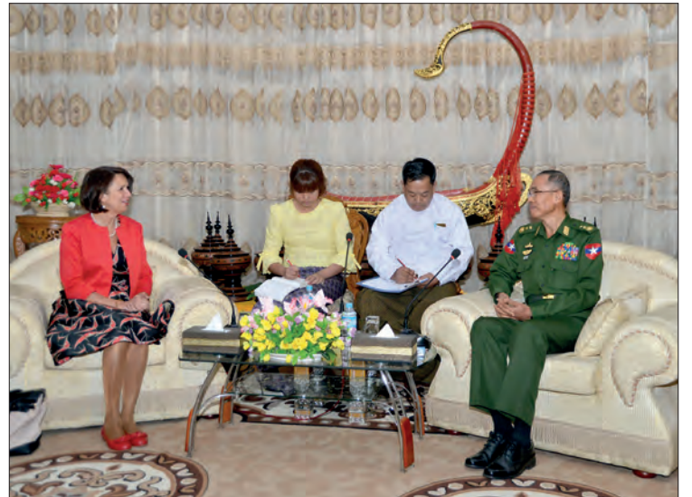
Union Minister Lt-Gen Sein Win meets United Nations Secretary General's Special Envoy on Myanmar Ms Christine Schraner Burgener in Nay Pyi Taw yesterday.