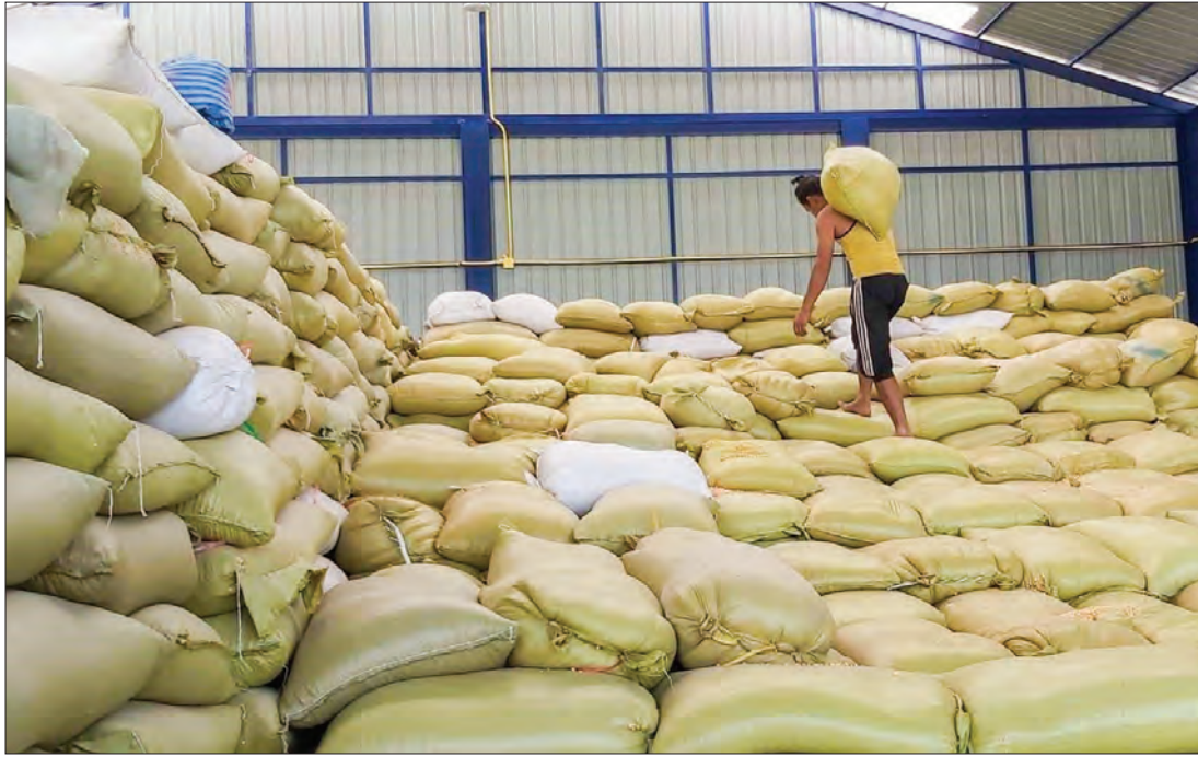
A worker piles sacks of corn a commodities warehouse in Myawady.

MYANMAR traders are stockpiling corns to export them to Thailand, but a high import barrier is posing difficulties, said traders from the Myawady border area.