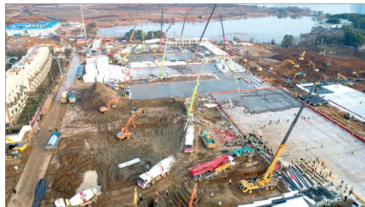
Aerial photo taken on Jan. 28, 2020 shows the construction site of Huoshenshan Hospital in Wuhan, central China's Hubei Province. The construction of Huoshenshan Hospital, a makeshift hospital for treating patients infected with the novel coronavirus, is underway in Wuhan.

confirmed cases of pneumonia caused by the novel coronavirus had been reported in 30 provincial-level regions. A total of 106 people had died of the disease, according to the National Health Commission.