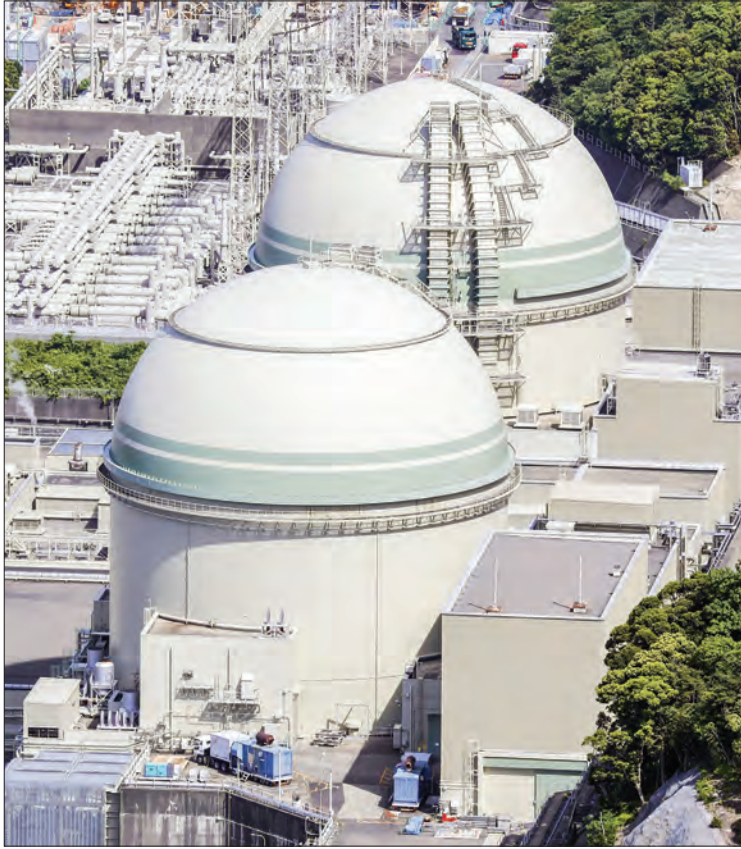
File photo taken from a Kyodo News helicopter on 30 May, 2019, shows the No. 3 (back) and No. 4 reactors at Kansai Electric Power Co.'s Takahama nuclear power plant in Fukui Prefecture, central Japan.

OSAKA — Kansai Electric Power Co. said Wednesday it will suspend operations at two nuclear reactors after missing the industry regulator's deadline to build counterterrorism facilities.