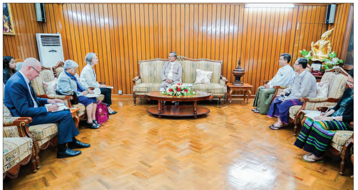
Union Minister for Hotels and Tourism U Ohn Maung meets with Australian Ambassador Ms Andrea Faulkner at the Ministry of Hotels and Tourism in Nay Pyi Taw yesterday.