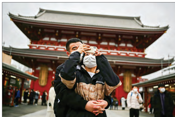
Chinese visitors make up 37 per cent of all Japan’s inbound tourists and the virus outbreak is likely to affect a range of local businesses.

In Japan, the fall in Chinese visitors was already being felt in Asakusa, a popular tourist desti-