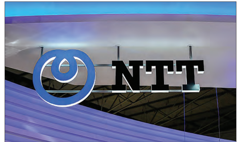
NTT logo, at NTT pavilion, during the Mobile World Congress day 3, on 28 February, 2018 in Barcelona, Spain.

The NTT group's business in Myanmar was formerly undertaken by a Yangon branch of its Thai subsidiary. — Kyodo News