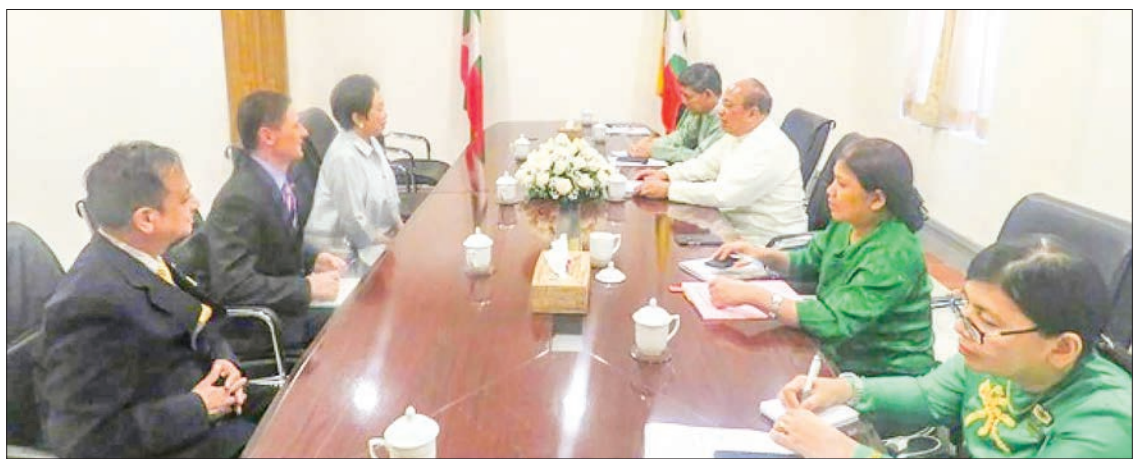
U Thaug Tun, Union Minister for Investment and Foreign Economic Relations and Chairman of the Myanmar Investment Commission (MIC) received Mrs Kay Kuok Oon Kwong, Chairman from Shangri-La Yangon Limited on 29 th November, 2019 in Yangon and cordially discussed the matters relating to the investment.

Commission (MIC) scrutinized and approved 85 local and foreign investment projects worth over US$ 1,940 million during the period from 1 October 2019 to 24 January this year, according to the figures released by the DICA. The MIC also gave the green light to Myanmar citizen-invested projects valued at more than K731,672 million and US$ 128.4 million in the same period, creating up to 1,587 job opportunities for Myanmar citizens. “The foreign investment