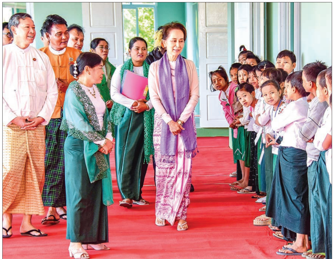
State Counsellor Daw Aung San Suu Kyi is welcomed by students at the opening ceremony of the new 'model building' of Basic Education Primary School (Bawgawadi) in Nay Pyi Taw yesterday.