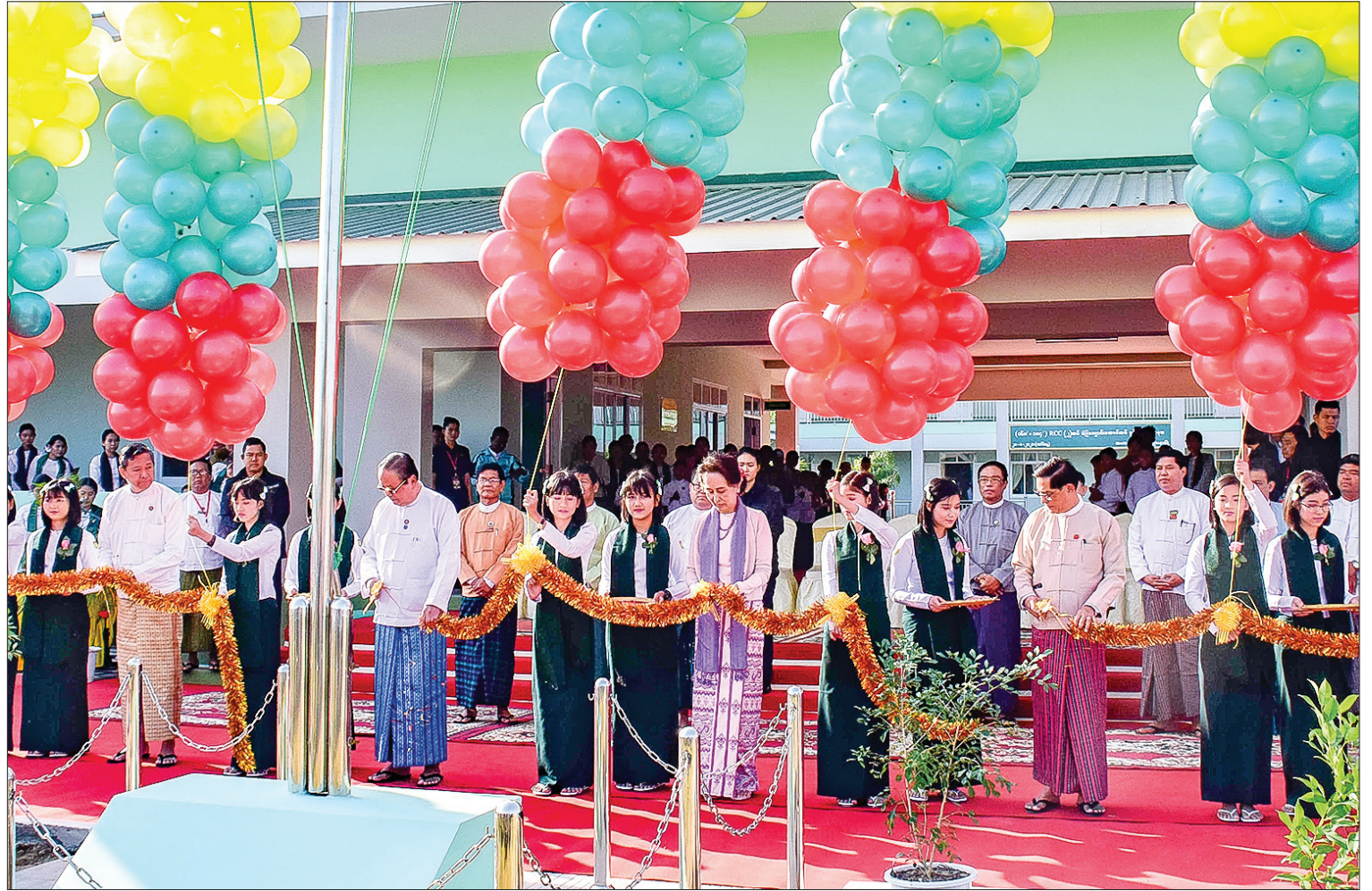
State Counsellor Daw Aung San Suu Kyi and dignitaries cut ribbon to open the new 'model building' of Basic Education Primary School (Bawgawadi) in Nay Pyi Taw yesterday.

After having a group photo taken, the State Counsellor received a commemorative gift presented by Officer of Nay Pyi Taw Education Department U