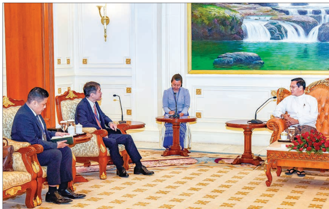
Vice President U Henry Van Thio meets with Ambassador of the Republic of Korea Mr Lee Sang-hwa at the Presidential Palace in Nay Pyi Taw yesterday.