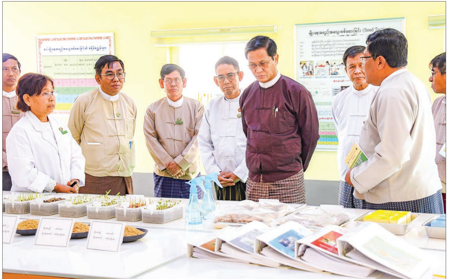
Vice President U Henry Van Thio visits the '2020 Seed Fair' at the State Agricultural Institute in Nay Pyi Taw yesterday.

The Vice President said that the term 'farmers' covers the persons in the livelihoods of agriculture and livestock, as well as those who are putting invest-