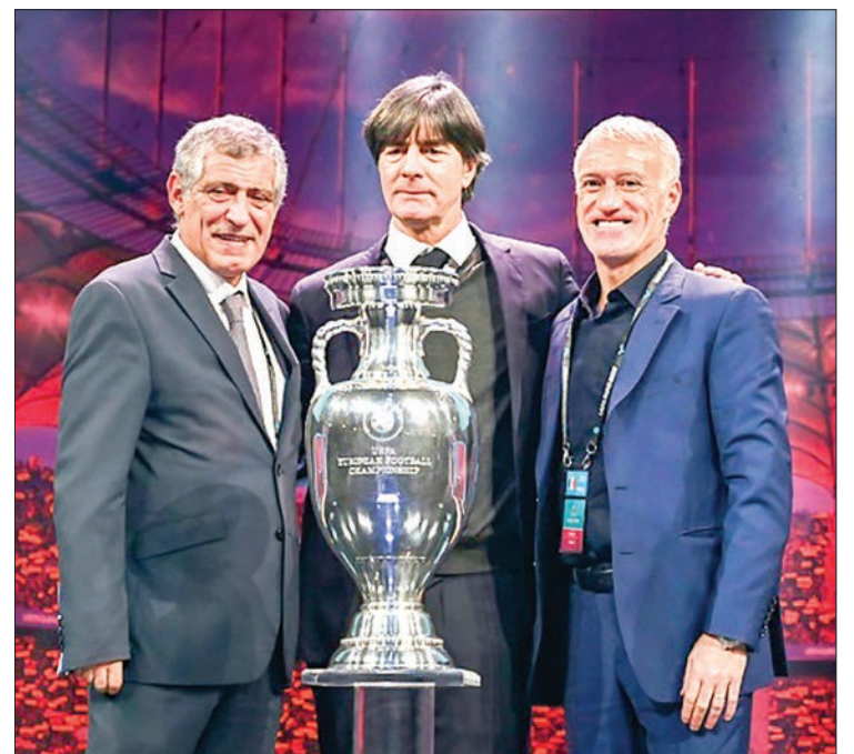
Joachim Loew (C) has been put under pressure to reach the semi-finals at Euro 2020.

ing the national team, currently 15th in the FIFA world rankings, is not among the favourites to win Euro 2020. "The opponents in the group stages are a big deal, but what I have seen in the last few (Germany) games gives me hope," said Keller, whose predecessor Reinhard Grindel gave Loew the 2018 contract extension.—AFP ■