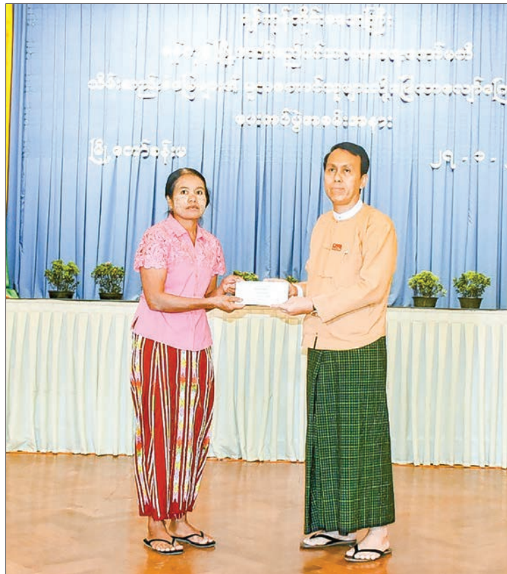
Yangon Region Chief Minister U Phyo Min Thein presents compensation to farmers in Yangon on 27 January.

The committee would be able to provide compensation only if it gets correct informa-