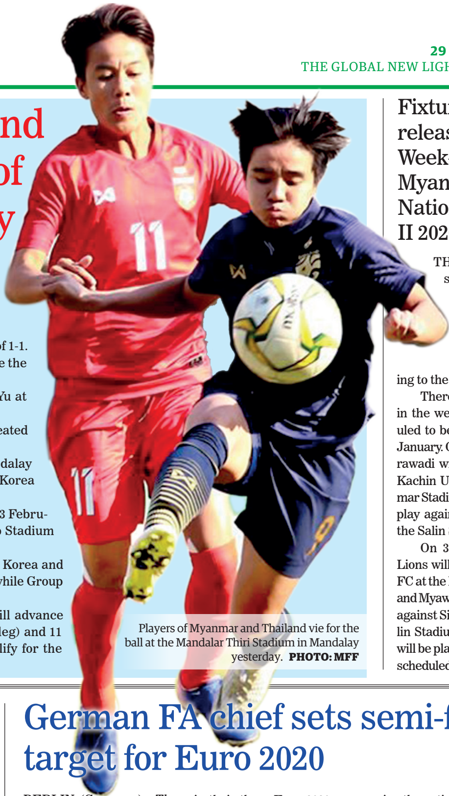
Players of Myanmar and Thailand vie for the ball at the Mandalay Thiri Stadium in Mandalay yesterday.

The winners and first runners-up from the two groups will advance to the play-offs, which have been scheduled for 6 March (first leg) and 11 March (second leg). The two play-off round winners will qualify for the 2020 Summer Olympics. — Kyaw Khin