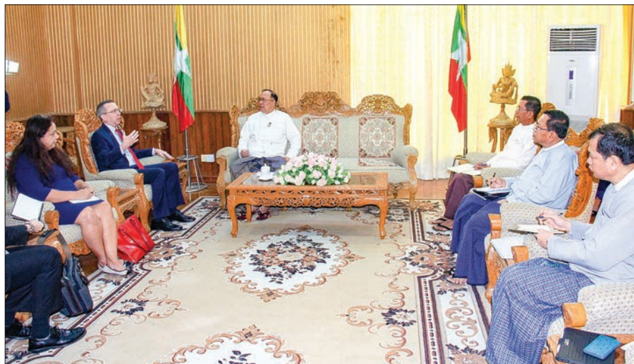
Union Minister U Thant Sin Maung meets with US Ambassador Mr Scot Marciel in Nay Pyi Taw yesterday.