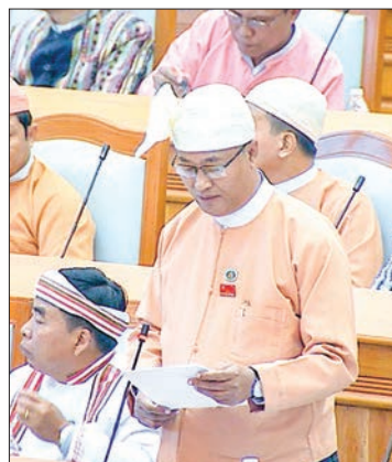
MP U Maung Maung Oo.