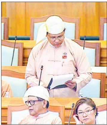
MP U Maung Maung Ohn.