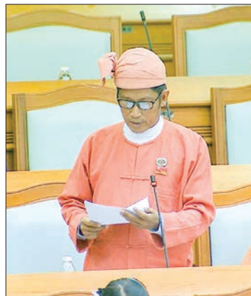
MP Dr Saw Naing.