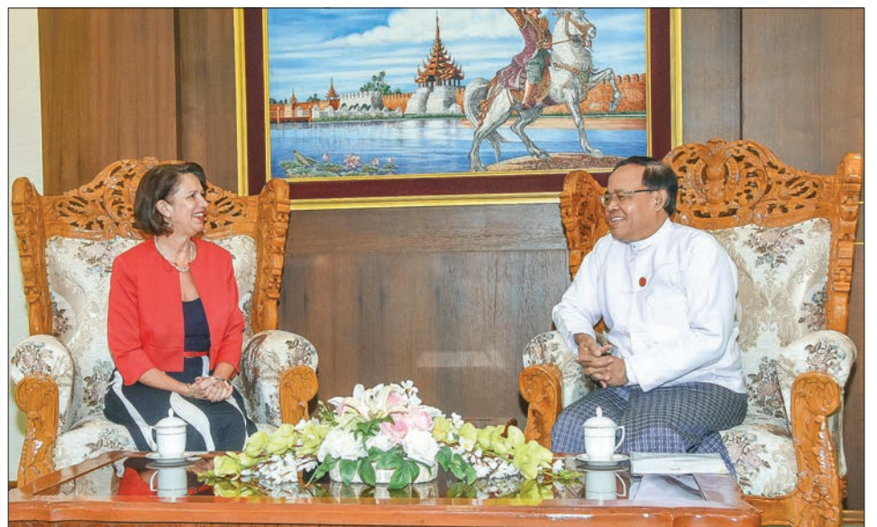
Union Minister U Kyaw Tin meets with United Nations Secretary-General's Special Envoy on Myanmar Ms Christine Schraner Burgener in Nay Pyi Taw on 28 January 2020.

Also present at the meeting were U Kyaw Thu Nyein, Deputy Director-General of the International Organizations and Economic Department of the Ministry of Foreign Affairs and officials from the Ministry of Foreign Affairs.—MNA