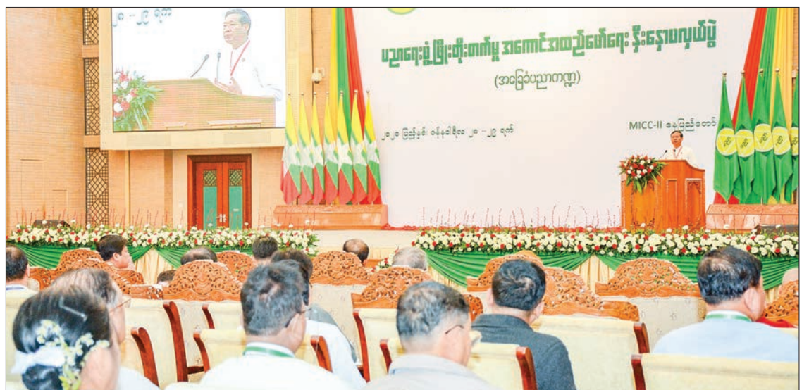
Union Minister Dr Myo Thein Gyi addresses the second session of Education Development Implementation Conference 2020 in Nay Pyi Taw yesterday.

Director-General U Ko Lay Win from the Department of Basic Education explained the development in the Education Development Implementation Conference (Basic Education Sector) 2018 Report.