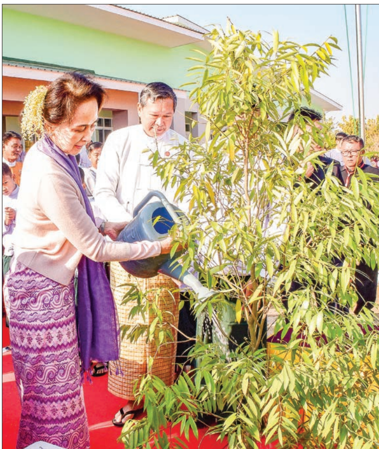
State Counsellor Daw Aung San Suu Kyi plants a Gangaw tree at the opening ceremony of the new 'model building' of Basic Education Primary School (Bawgawadi) in Nay Pyi Taw yesterday.