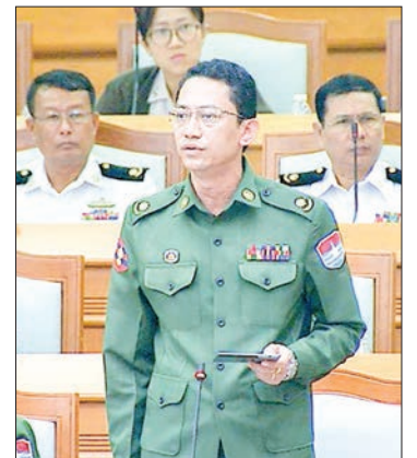
MP Major Zay Phyoo.

THE second day meeting of Pyidaungsu Hluttaw's 15 th regular session continued discussions yesterday about the Euro 50 million ODA loans from the Government of Poland and debated the first section of Joint Public Accounts Committee Report(16/2019).