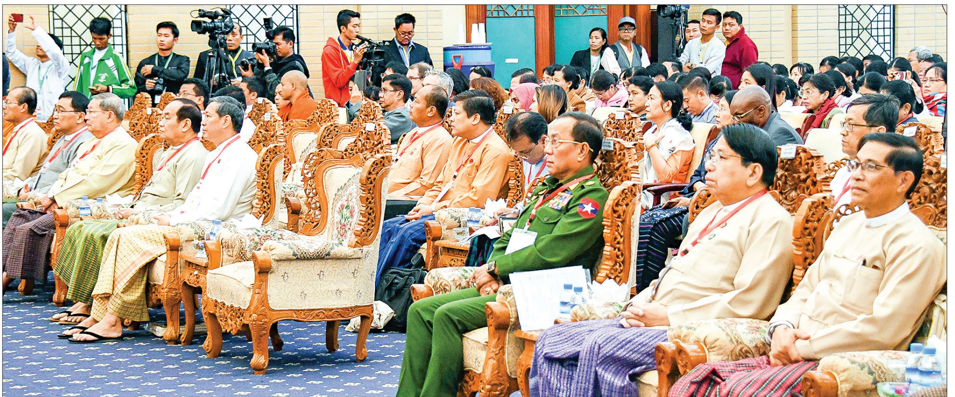
State Counsellor Daw Aung San Suu Kyi delivers the opening speech at the Education Development Implementation Conference 2020 (Basic Education Sector) in Nay Pyi Taw.