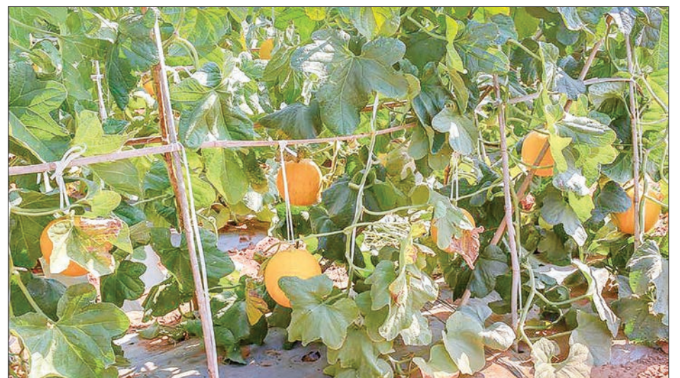
Muskmelon farm in ChaungU.

"Although fruit can be exported in this situation, it may prove difficult because China has imposed restrictions on travelling in the country. We are monitoring the situation. If China manages to control the virus and traders are allowed to travel around the country freely, we will let local farmers know so they can start work as soon as possible. In this situation, we do not want local farmers to pick fruits because they may suffer from disease and the farmers may lose profits," he added.