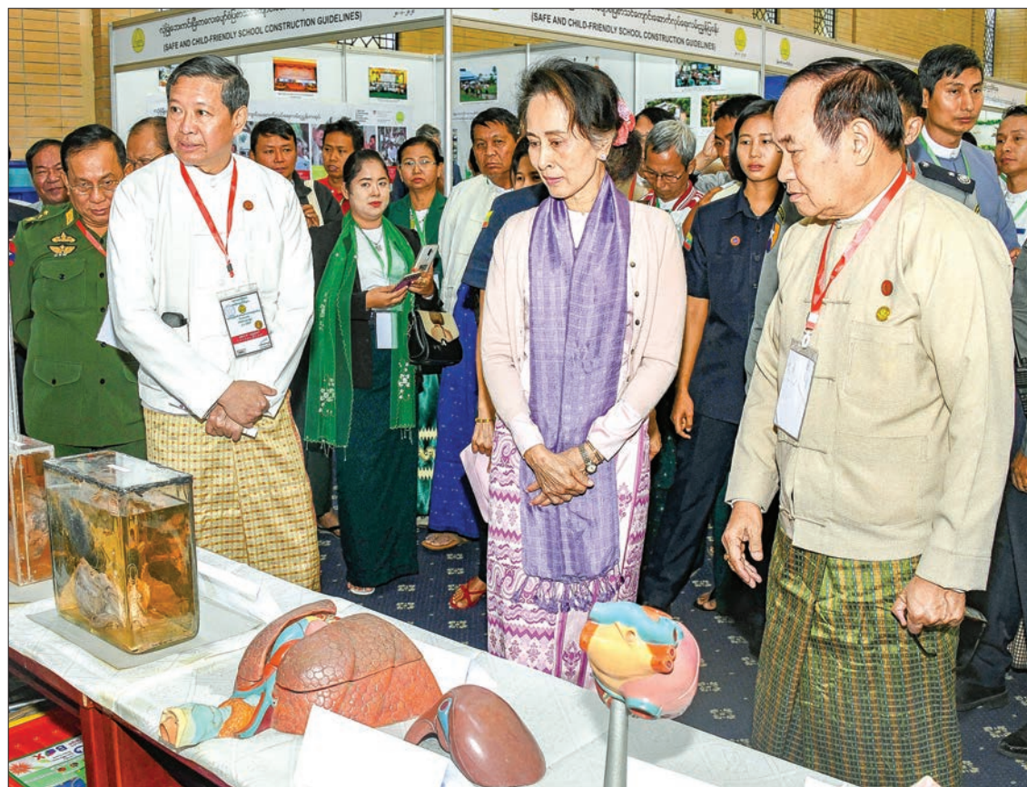
State Counsellor Daw Aung San Suu Kyi visits the exhibition at the Education Development Implementation Conference 2020 (Basic Education Sector) in Nay Pyi Taw yesterday.

Now, by implementing the new education system of KG+12 in the sector of the Basic Education, we hope we will be able