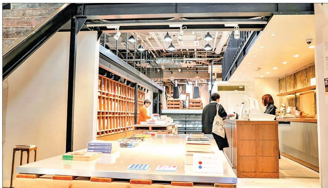
Japan is home to some of the most stunning bookstores in the world. PHOTO: KYODO NEWS

dollars) in 2019, the Research Institute for Publications in Tokyo also said.—Xinhua ■