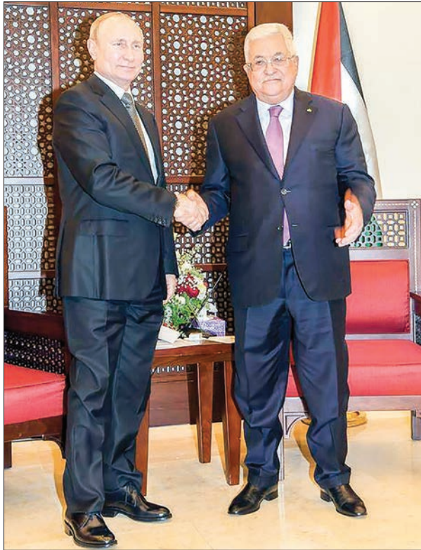
Palestinian President Mahmoud Abbas (r) shakes hands with Russian President Vladimir Putin during their meeting in the West Bank city of Bethlehem, on 23 January, 2020.

“I welcome my dear friend, President Vladimir Putin ... who never misses an opportunity to talk about or support the Palestinian cause, and this is what we are accustomed to,” said Abbas. For his part, the Russian president praised the historical relations between the two sides, expressing his readiness to cooperate with and support Palestine in all fields. This is Putin’s third visit to Palestine. His first visit was in 2005 and the second was in 2012.—Xinhua ■