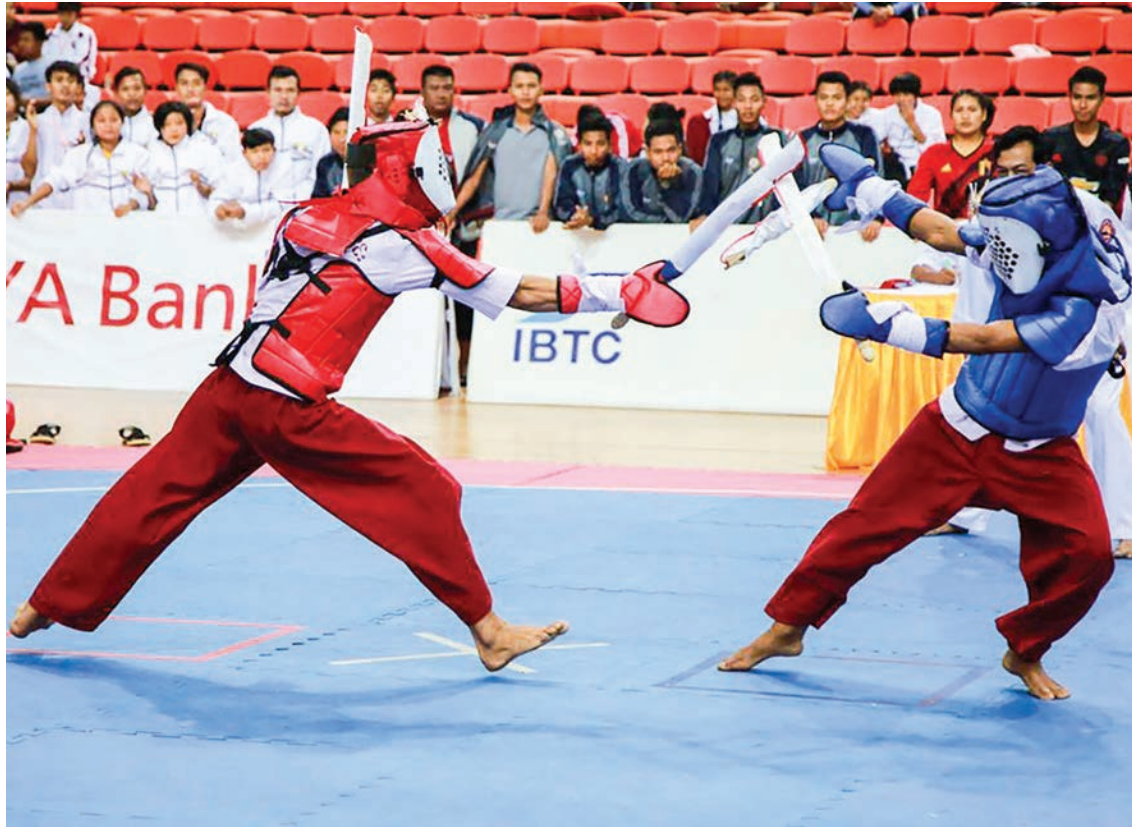
Two athletes compete in the attacking event of the men's fight at the Myanmar Martial Arts Tournament, held yesterday in Nay Pyi Taw.

The martial arts tourney will continue today at the same venue. Entry to the competition is free for fans, said officials.—Lynn Thit (Tgi) ■