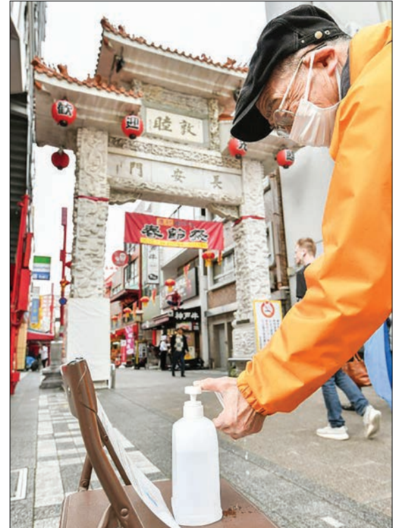
A man uses disinfectant placed near an entrance gate at Kobe's Chinatown in western Japan, on 24 January, 2020. Chinatown will host events celebrating the Chinese Lunar New Year, amid fears over the spread of a new deadly coronavirus circulating in China.

The cancellation will affect around 2,400 people, the unit of ANA Holdings Inc. said.—Kyodo News ■