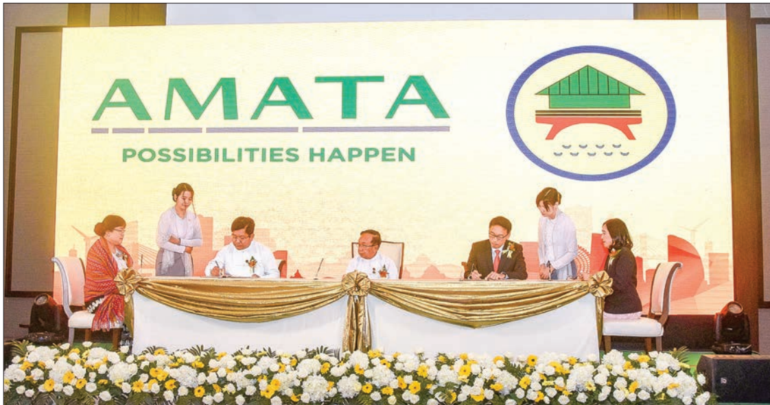
Union Minister U Han Zaw attends the signing ceremony for cooperation agreements on the Yangon Amata Smart and Eco City project in Nay Pyi Taw yesterday.

THE Urban and Housing Development Department (UHDD) and Amata Asia (Myanmar) Limited signed a Joint Venture Agreement on the Yangon Amata Smart and Eco City project at Kempinski Hotel in Nay Pyi Taw yesterday morning.