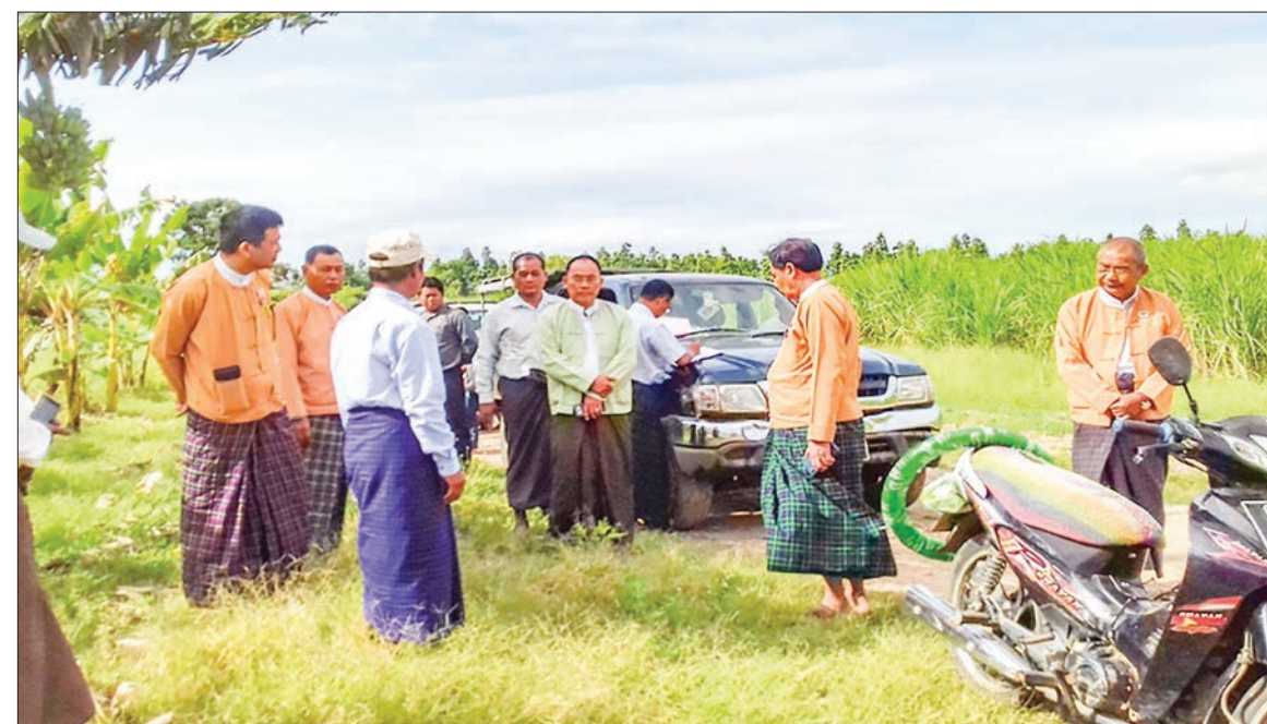
Amyotha Hluttaw Public Complaints Committee members making a field trip to Inndaung Forest Reserve in Htigyayng Township.