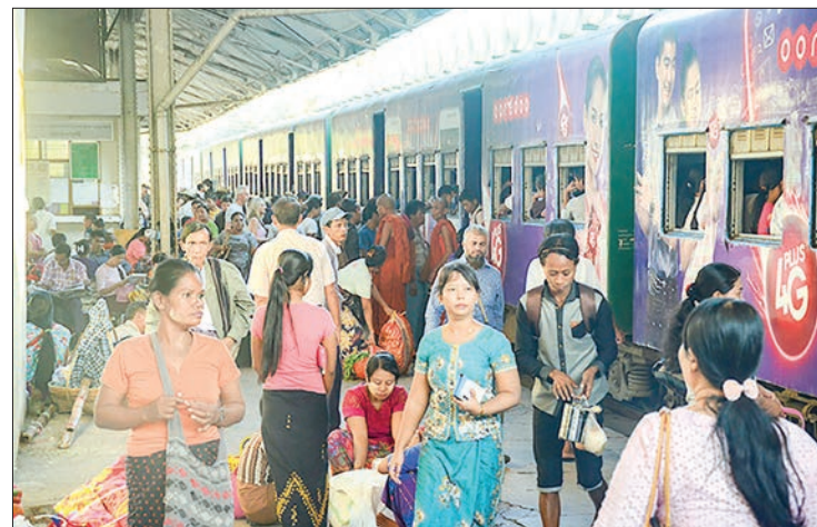
Commuters coming pouring out of a circular train at Yangon Railway Station.