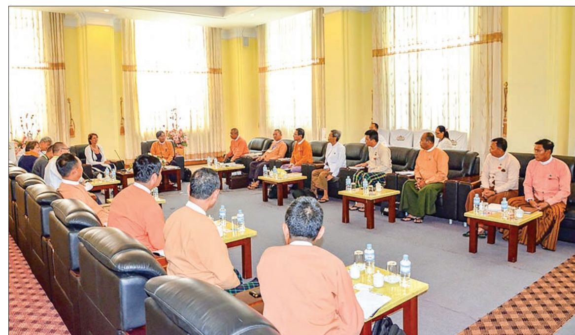
The Amyotha Hluttaw Public Complaints Committee meets with UNSC’s Special Envoy Mrs Christine Schraner Burgener.

“But there are complaint letters that the committee can’t