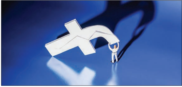
Facebook has repeatedly said it does not sell users' data.