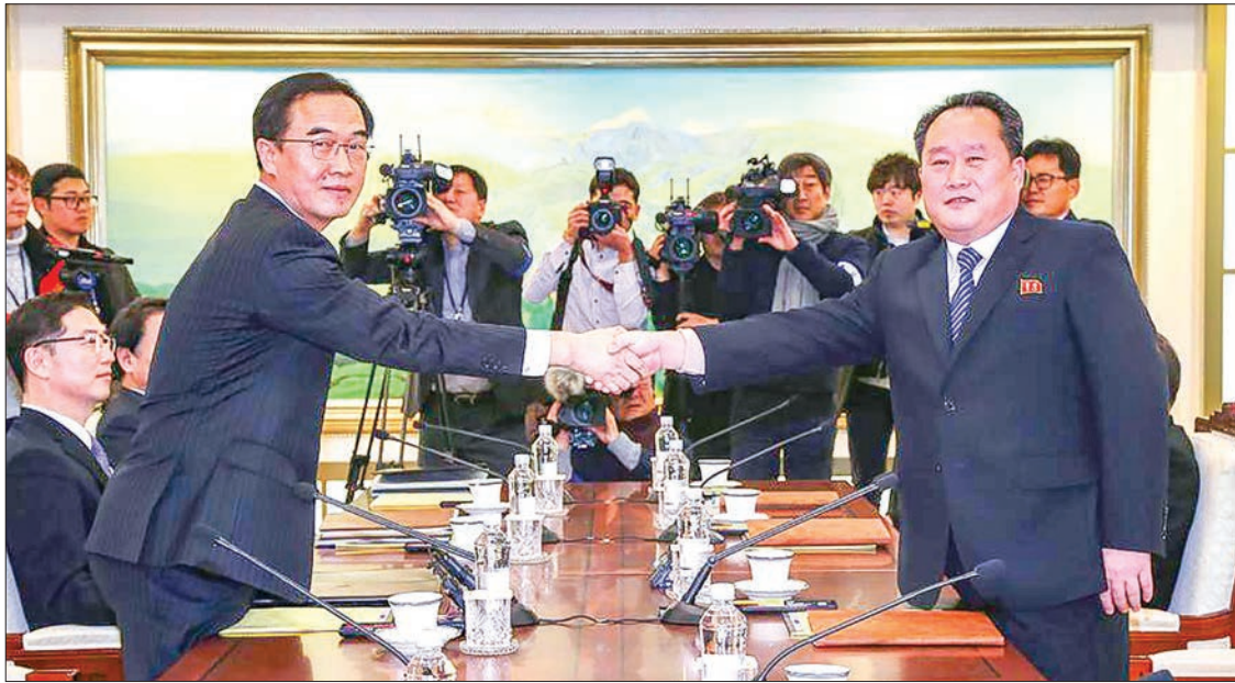
South Korea Unification Minister Cho Myung-Gyun (l) shakes hands with North Korean chief delegate Ri Son-Gwon (r) during their meeting at the border truce village of Panmunjom in the Demilitarised Zone (DMZ) dividing the two Koreas, on 9 January, 2018.