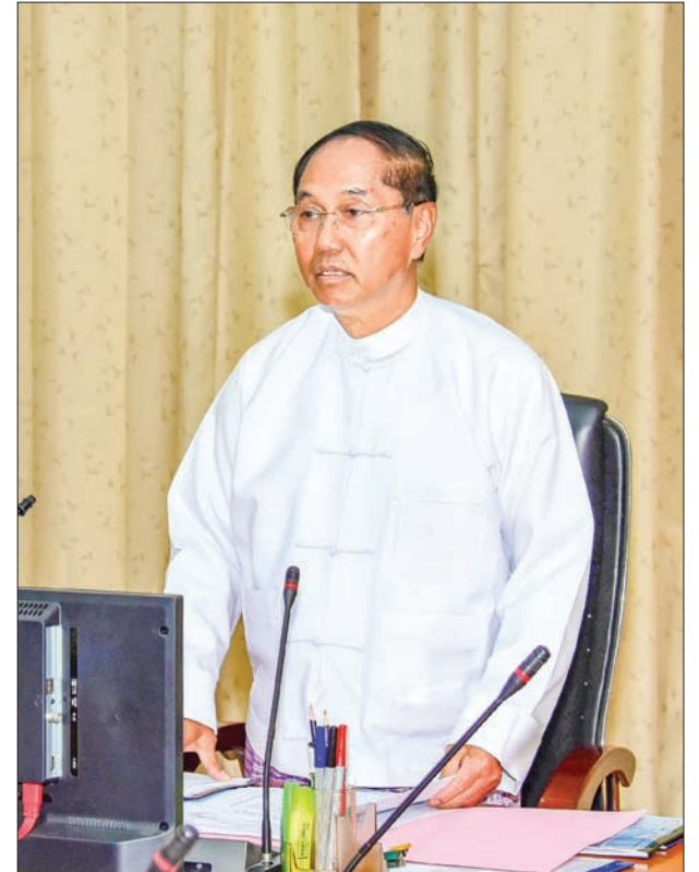
Vice President U Myint Swe delivers the speech at the committee meeting for holding the 73 rd Union Day in 2020 in Nay Pyi Taw yesterday.

T HE Central Committee for Convening the 73 rd Union Day in 2020 held their second coordination meeting at the meeting hall of the Office of the President in Nay Pyi Taw yesterday, where Central Committee Chairman Vice President U Myint Swe delivered a speech.