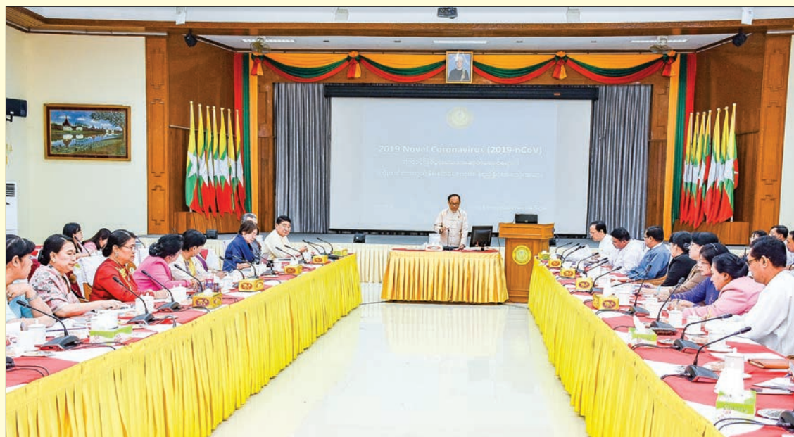
Union Minister Dr Myint Htwe addresses the work coordination meeting for prevention 2019 Novel Coronavirus (2019 nCoV) in Nay Pyi Taw yesterday.