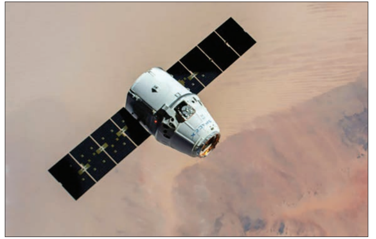
Three of the baked cookies returned to Earth on the SpaceX Dragon spacecraft and will undergo testing by food scientists to determine if they are edible.

While the astronauts said they looked and smelled like cookies, no one has tasted them.