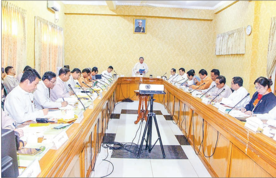
Union Minister U Soe Win delivers the speech at the 2 nd coordination meeting of Steering Committee for Supporting the Union-Level Tax Revenue-raising in Nay Pyi Taw yesterday.

THE Steering Committee for Supporting the Union-Level Tax Revenue-raising held its second coordination meeting at the Ministry of Planning, Finance and Industry in Nay Pyi Taw yesterday.