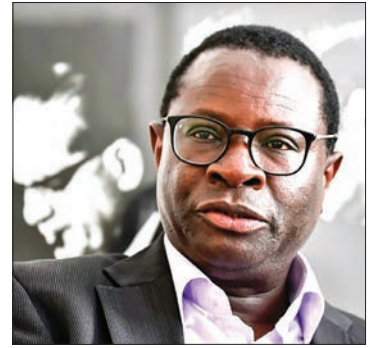
Karamba Diaby tweeted a picture of three holes in his office window, which investigators believe were made by plastic pellets shot from an “airsoft” gun.

liberal refugee policy, was shot at his home last June.