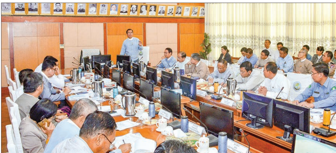
Deputy Minister U Aung Hla Tun delivers the speech at the coordination meeting for holding the second Inter-Ministries Htamane Making Competition in Nay Pyi Taw.

A COORDINATION meeting on holding the second Inter-Ministries Htamane Making Competition and fun fair was held at the meeting hall of the Ministry of Information in Nay Pyi Taw yesterday.