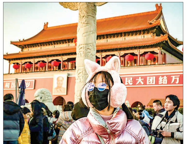
A woman wears a protective mask at Tiananmen Gate in Beijing. China is halting public transport and closing highway toll stations in two more cities in Hubei province, the epicentre of a deadly virus outbreak.

The previously unknown virus has caused alarm because of its similarity to SARS (Severe Acute Respiratory Syndrome), which killed hundreds across mainland China and Hong Kong in 2002-2003.—AFP ■