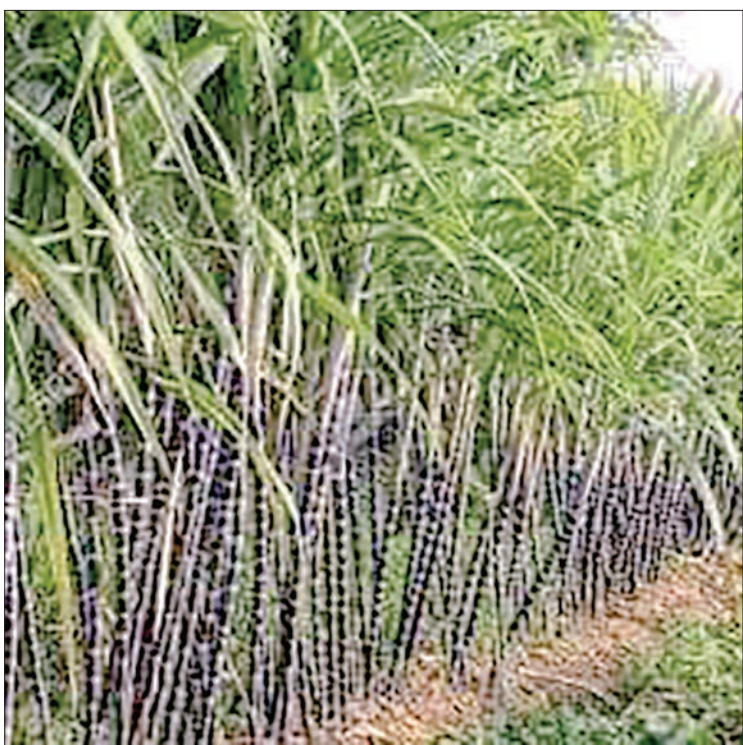
A sugarcane plantation thrives in Kaleinaung township, Dawei District.

GROWERS in Kaleinaung town, Dawei District, Tanintharyi region said they are pleased with the good profits generated from