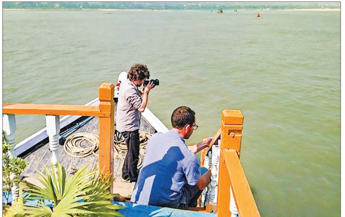
France crew filming a documentary along the Ayeyawady River.

The documentary consisted of scenes of livelihood and customs of Myanmar people