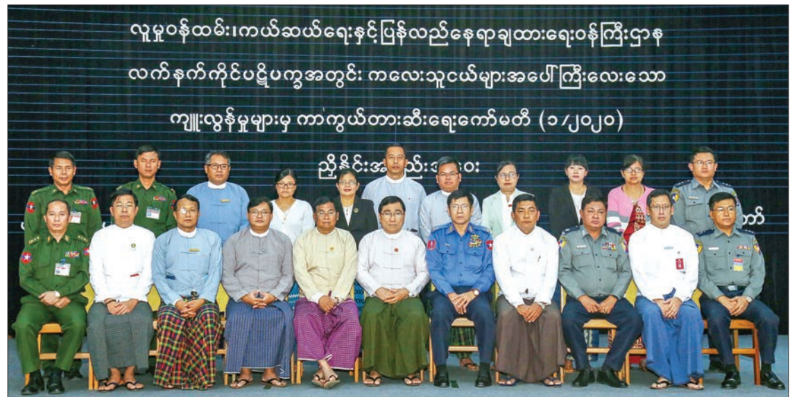
Union Minister Dr Win Myat Aye and attendees pose for a photo at the coordination meeting of the Committee for Preventing Grave Violations against Children in Armed Conflicts in Nay Pyi Taw yesterday.