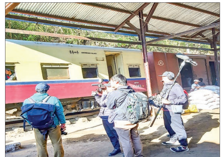
NHK Japanese film crew shooting the scenes at the Thazi station.