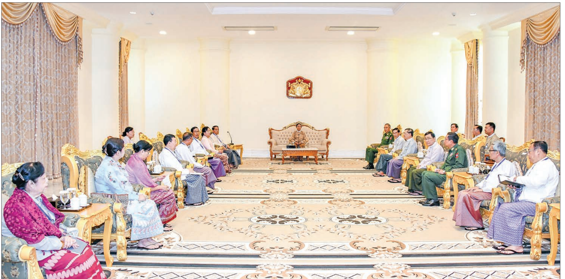
President U Win Myint meets the delegation led by Myanmar National Human Rights Commission Chairman U Hla Myint at the Presidential Palace in Nay Pyi Taw yesterday.

P RESIDENT U Win Myint received a delegation of the Myanmar National Human Rights Commission led by its Chairman U Hla Myint at the Presidential Palace in Nay Pyi Taw yesterday morning.