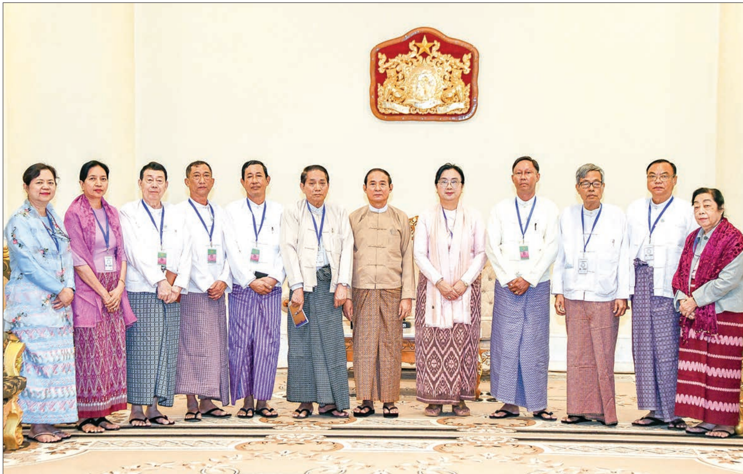
President U Win Myint poses for a documentary photo together with a delegation led by Myanmar National Human Rights Commission Chairman U Hla Myint at the Presidential Palace in Nay Pyi Taw yesterday.