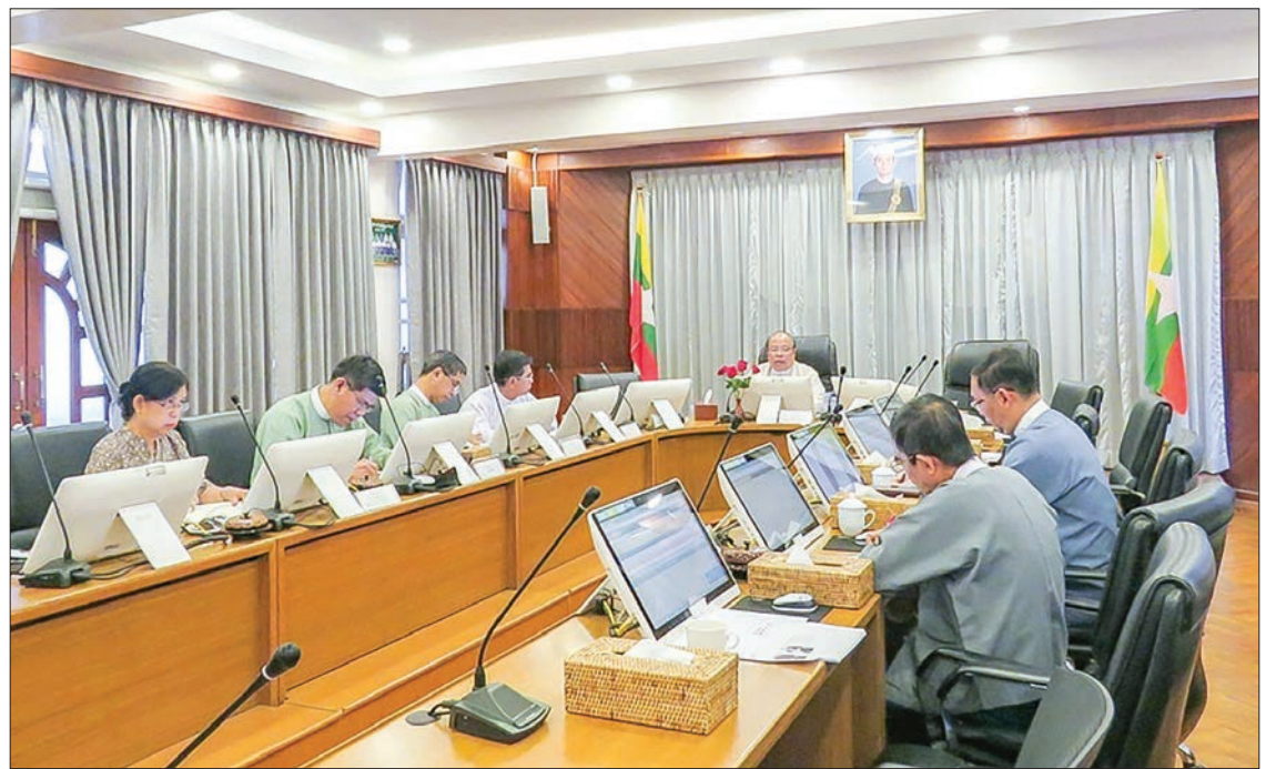
Union Minister U Thaug Tun and seven MIC members holds the Myanmar Investment Commission (MIC) meeting (2/2020) on 24 January, 2020 in Yangon.

THE Myanmar Investment Commission approved eight projects yesterday in the electricity, livestock and fisheries, real estate, manufacturing sectors, including generation of 350 MW LNG Turbine Power Plant at Thanlyin Township, Yangon Region.