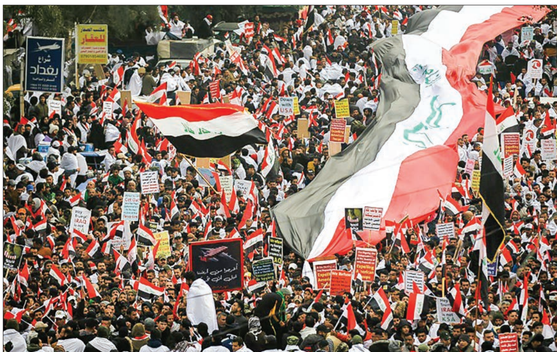
Thousands of Iraqi men, women and children of all ages massed in Baghdad to demand US troops leave the country.

BAGHDAD — Thousands of supporters of populist Iraqi cleric Moqtada Sadr gathered in Baghdad on Friday for a rally to demand the ouster of US troops, putting the protest-hit capital on edge.