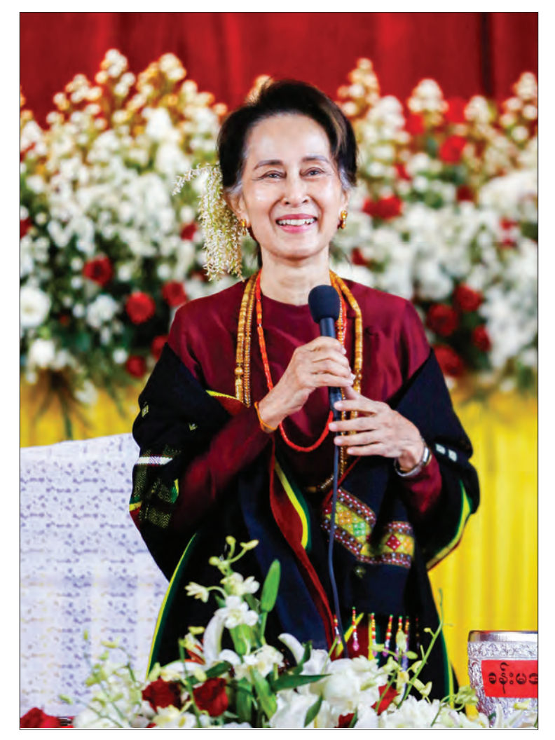
State Counsellor Daw Aung San Suu Kyi delivers the speech at the meeting with local people in Tamu Township, Sagaing Region.

Consideration for others can benefit oneself. I want you all to