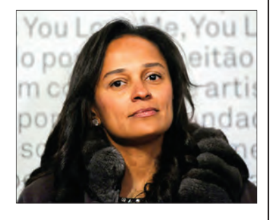
Dubbed Africa's richest woman, Isabel dos Santos is accused of using her father's backing to plunder state funds.

Dubbed Africa's richest woman, Isabel dos Santos is accused of using her father's backing to plunder state funds from