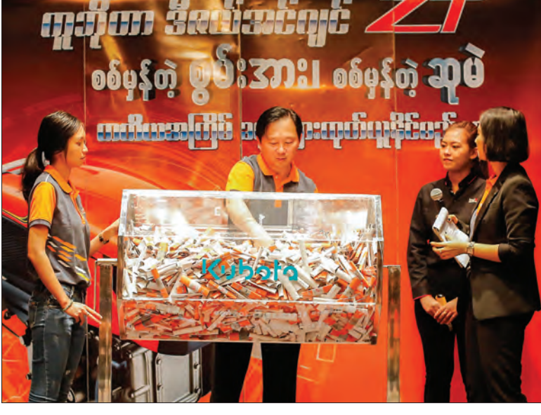
"KUBOTA Diesel Engine ZT Real Power Real Prize" lucky draw event held in Yangon on 16 January.

The company has entered Myanmar since 2011 with 34 authorized dealers and sub-authorized dealers around Myanmar including the North, Central, and the South with the plan to increase the number of the dealers in the near future.— GNLM