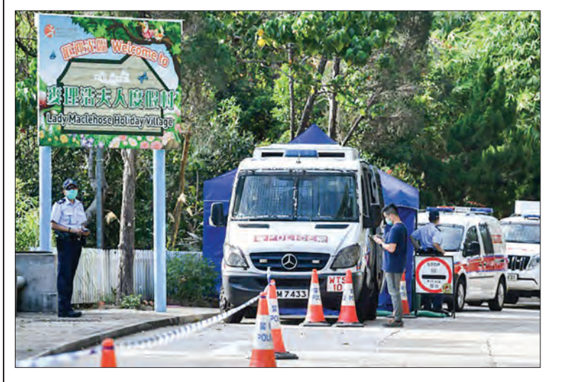
Police have set up blockades outside the quarantine camps.

So far, two people in the city have tested positive for the new coronavirus — which is similar to the SARS pathogen. Both had visited Wuhan in recent days and are