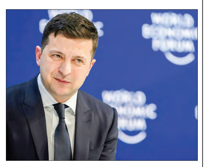
President Volodymyr Zelensky has pledged to make life easier for foreign investors in Ukraine.

Foreign direct investment (FDI) into Ukraine has plummeted since the 2014 annexation of Crimea by Mosocw and the war with pro-Russian separatists in the east which led to the rapid pullout of Russian investors. "We are offering an investment nanny," Goncharuk told a breakfast meeting of in-