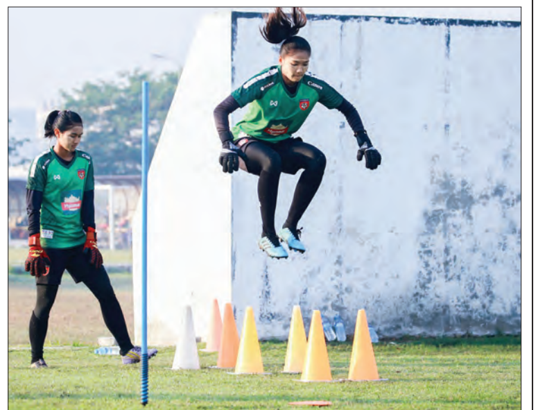
Myanmar women footballers take part in a training session in Mandalay ahead of friendly matches with the Thailand squad this month.

The friendly matches will be played on 25 and 28 January, and entry to the matches will be free, according to a statement issued by the MFF. —Lynn Thit (Tgi)