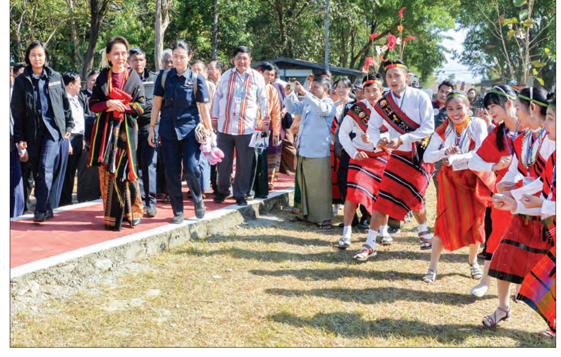
State Counsellor Daw Aung San Suu Kyi is welcomed by traditional dance troupes with traditional dance performance in Tamu, Sagaing Region yesterday.

After the speech of State Counsellor, the Union Minister,