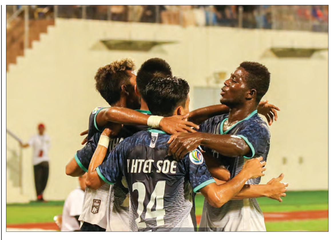
Yangon United players celebrate their 6-1 victory over Indera SC on 22 January at the HassanalBolkiah National Stadium in Bandar Seri Begawan, Brunei.