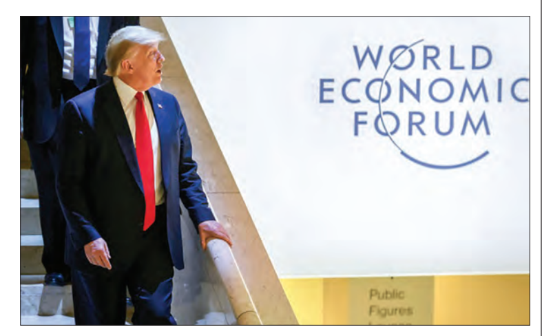
US President Donald Trump attended the 50th edition of the World Economic Forum in Davos this week.

The global business elite are gathered in the Swiss alpine resort for the 50<sup>th</sup> edition of the World Economic Forum, and dis-