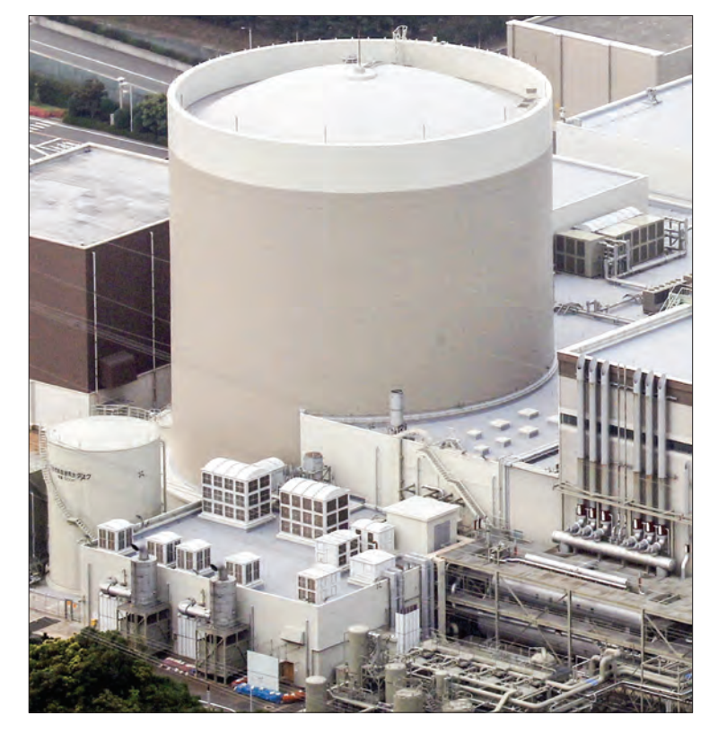
File photo taken in June 2011 shows No. 2 reactor of Genkai nuclear power plant in Saga Prefecture, southwestern Japan.

mayor of Genkai in Saga Prefecture, told Kyodo News he recently returned the money received days after he was elected in July 2018 from a then executive of Shiohama Industry Corp., which is known to have had close ties with a man at the heart of a gift scandal involving Kansai Electric Power Co.