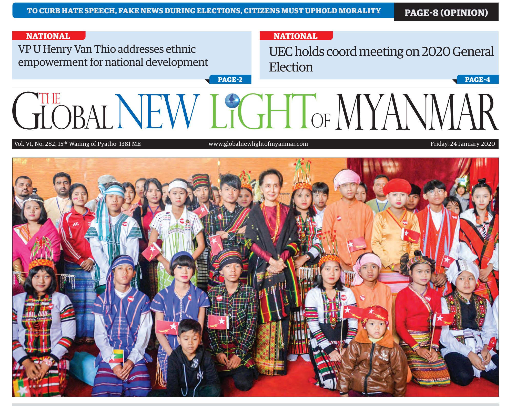
State Counsellor Daw Aung San Suu Kyi poses for a documentary photo together with local people in Tamu Township in Sagaing Region yesterday.