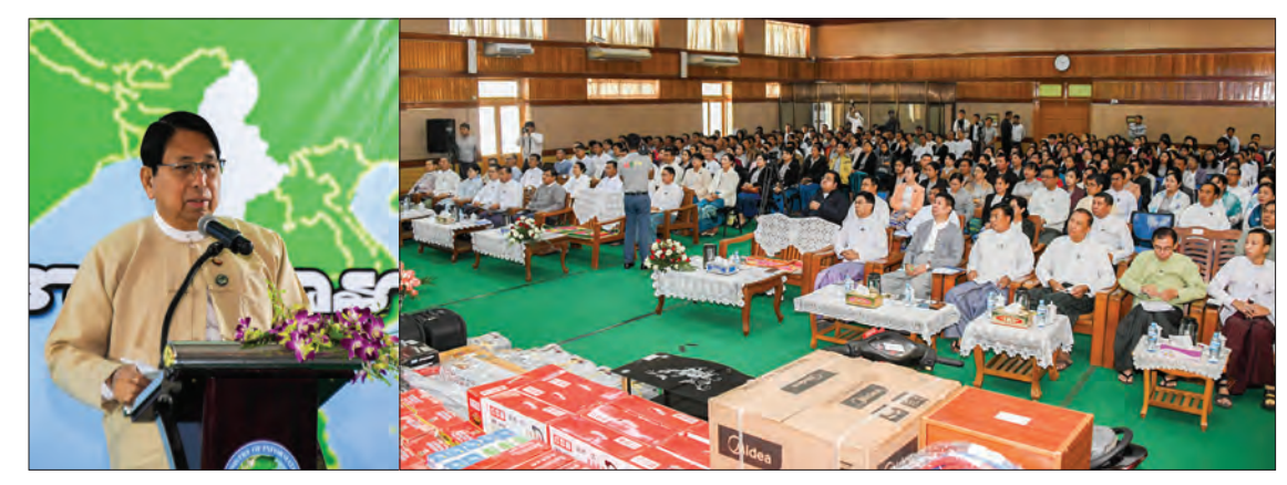
Union Minister Dr Pe Myint addresses the ceremony to mark 29<sup>th</sup> anniversary of Information and Public Relations Department in Nay Pyi Taw yesterday.

THE Information and Public Relations Department under the Ministry of Information held its 29<sup>th</sup> anniversary at its headquarters in Nay Pyi Taw yesterday.