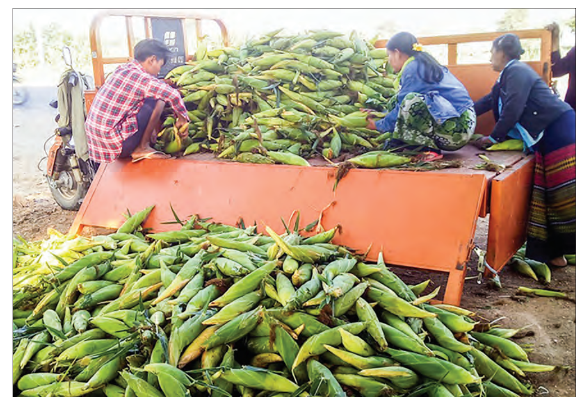
Farmers unloading the corns from the back of the truck at a distribution depot in NyaungU Township.

Additionally, the country requires specific export plans for each agro product, as they are currently exported to external markets based upon supply and demand. Contract farming systems, involvement of regional and state agriculture departments, exporters, traders, and some grower groups