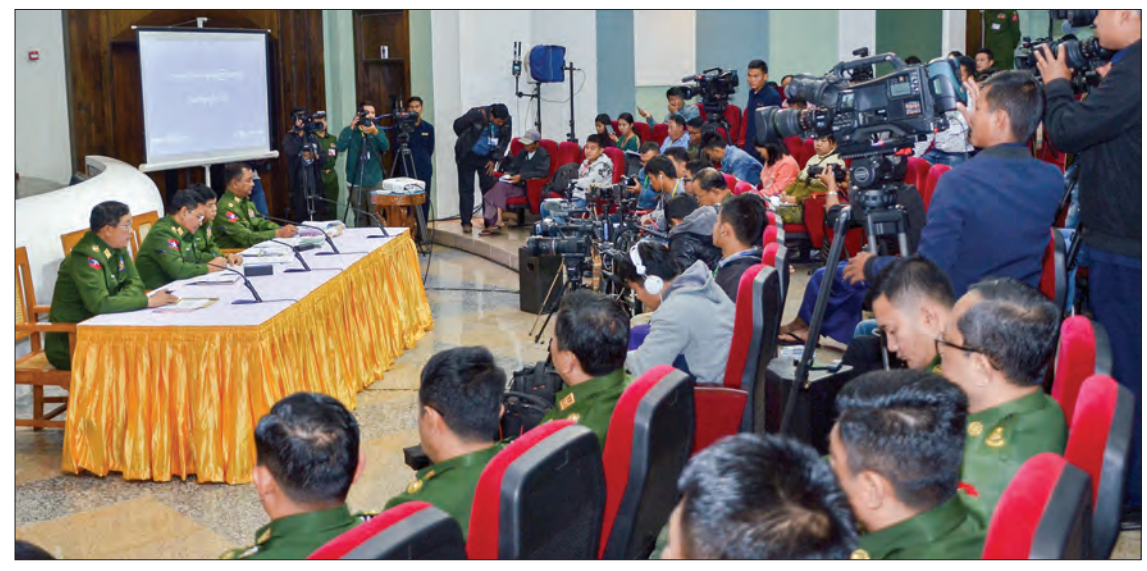
Tatmadaw True News Team holds a press conference at the Defence Services Museum in Nay Pyi Taw yesterday.

THE Tatmadaw True News Team organized a press conference at the Defence Services