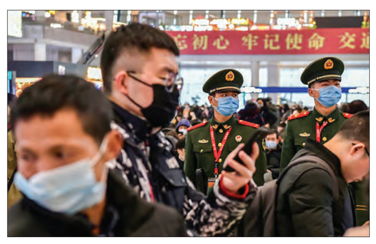
Chinese paramilitary police wearing masks stand guard at a Shanghai train station as the country faces a virus crisis at the start of the Lunar New Year holiday.