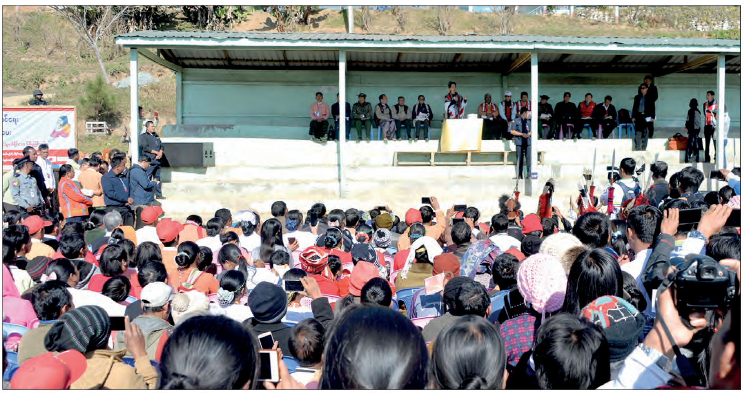
State Counsellor Daw Aung San Suu Kyi meets with local people in Leshi Township in Sagaing Region yesterday.

The State Counsellor gave instructions to give priorityfor making drinking water available and construction of community hall for Leshi Township. She also explainedavailable national healthcare services, building upa Democratic Federal Union, assistance for young people who did not complete matriculation exam, collecting the data of unemployment rate, scrutinizing appointment of local staff, assistance of local people to the civil service personnel from other regions, infrastructural development and responsibilities of local