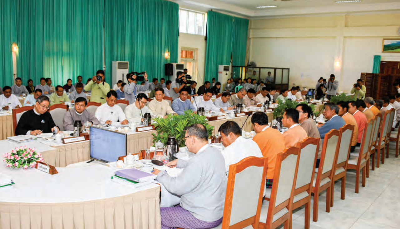
Vice President U Myint Swe addresses the ninth coordination meeting of the National-Level Environmental Conservation and Climate Change Central Committee at the Forest Department in Nay Pyi Taw yesterday.

THE National-Level Environmental Conservation and Climate Change Central Committee held its ninth coordination meeting at the Forest Department in Nay Pyi Taw yesterday morning, where the committee's patron Vice President U Myint Swe delivered a speech.