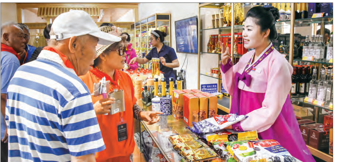
Chinese tourists shop at a souvenir store run by the North Korean government in Dandong, a Chinese city on the border with North Korea, on 22 June, 2018.

said it was contacted by a business partner in North Korea about the measure on Tuesday, adding Pyongyang's move may