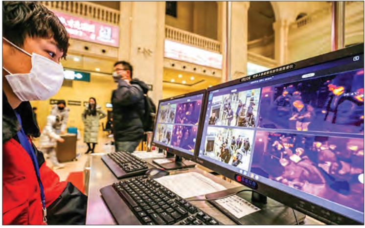
China has stepped up screening of travellers as the new virus spreads.

The illness, first discovered in the central city of Wuhan, is spreading just as hundreds of