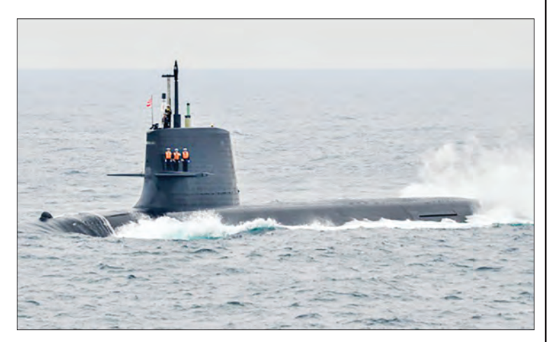
Japan's military is attempting to expand the role of women in its ranks as the Self Defence Forces struggle to attract young talent.

Japan's military as a whole is attempting to expand the role of women in its ranks as the Self Defence Forces struggle to attract young talent, with local media saying the navy has had particular difficulty attracting candidates to serve on submarines. Japanese Prime Minister