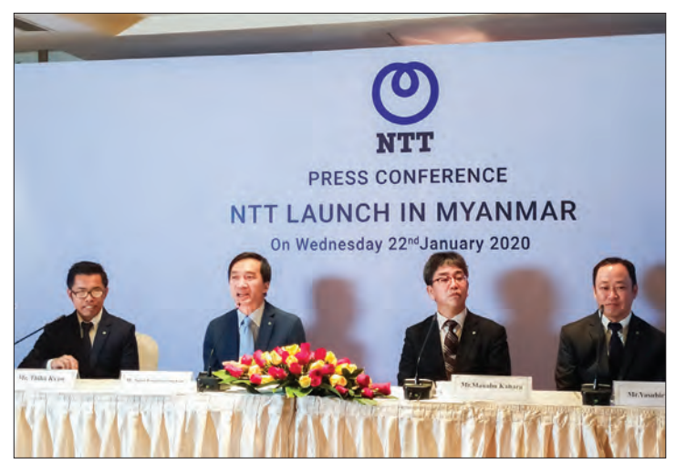
NTT Ltd holds a press conference in Yangon on 22 January.

A PROJECT to lay an undersea Communications cable linking Singapore, Myanmar