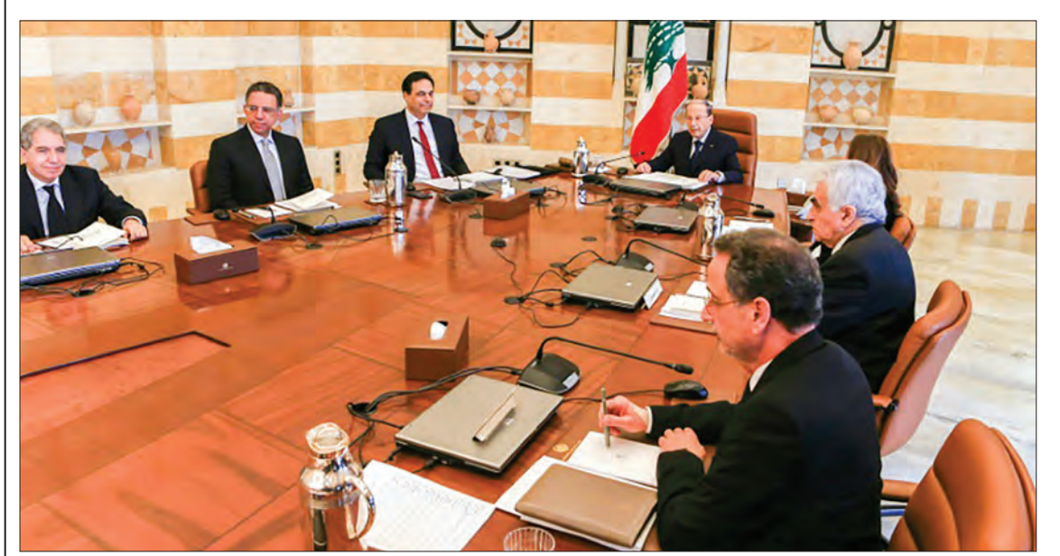
Lebanon's newly formed government faces the Herculean task of saving a collapsing economy while calming a three-month-old protest movement.

Protesters from across Lebanon's geographical and confessional divides had demanded a cabinet of independent technocrats as a first step to root out endemic government corruption and incompetence.— AFP ■