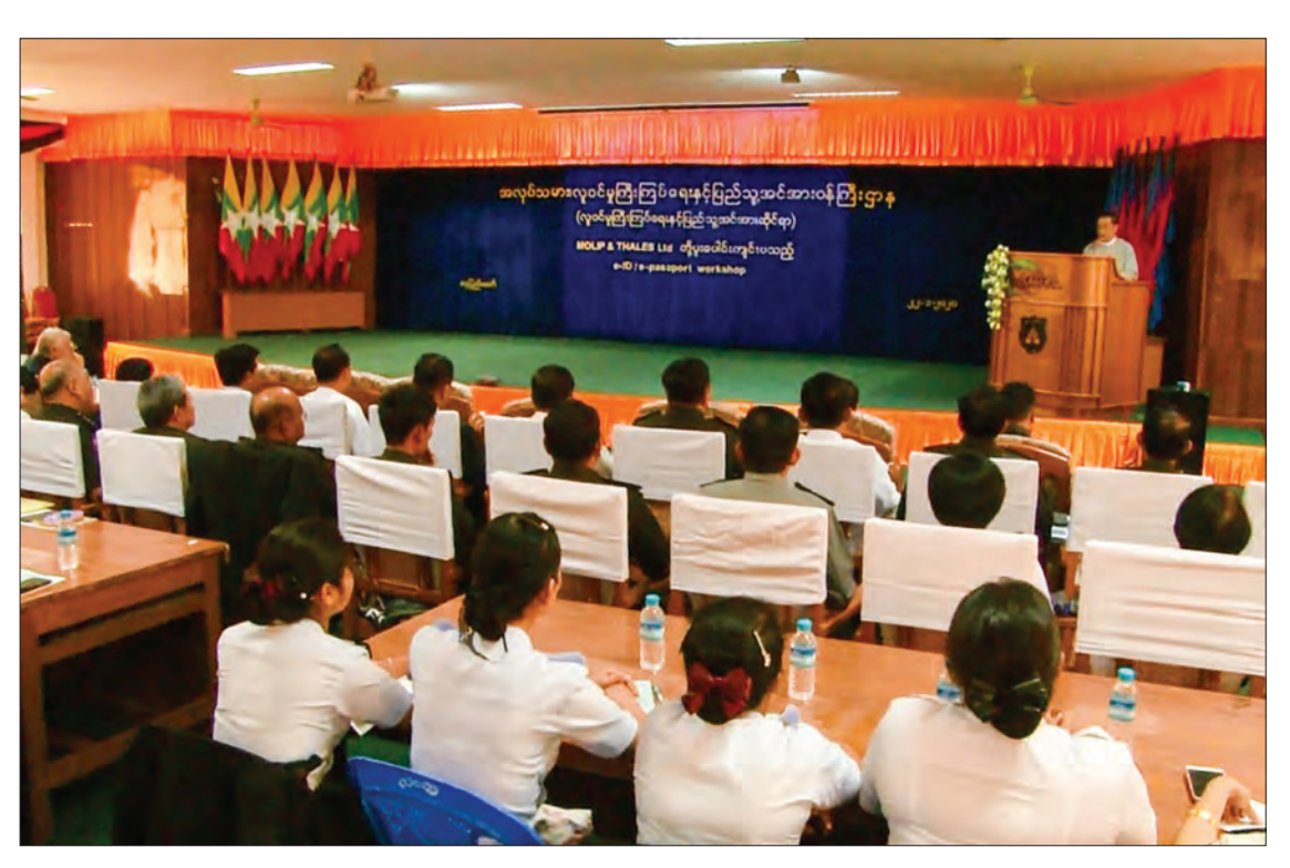
Union Minister U Thein Swe delivers the opening speech at the e-ID and e-passport workshop at the Ministry of Labour, Immigration and Population in Nay Pyi Taw yesterday.

The Union Minister added his ministry is going to roll out