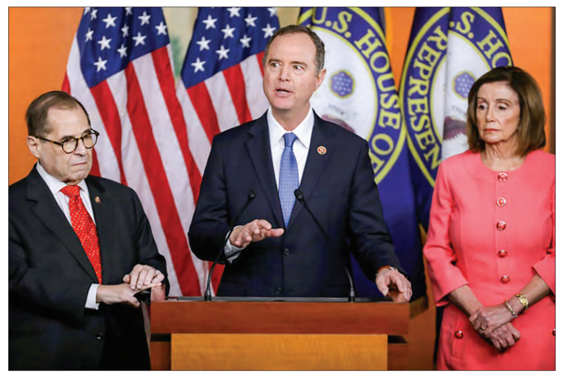
Adam Schiff, chairman of the House Intelligence Committee, is serving as the lead House prosecutor in the Senate impeachment trial of President Donald Trump.

They will have a total of 24 hours over three days to present their case that Trump should be impeached for abuse of power