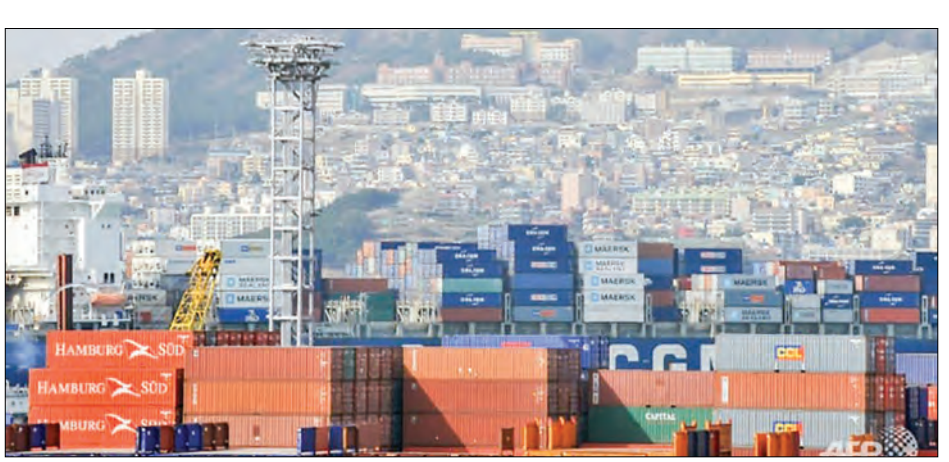
Slowing growth presents a challenge for the South, which enjoyed a decades-long boom known as the "Miracle on the Han" but where a highly educated youth now struggles to find well-paid jobs.

ic policy featuring public spending increases and the concept of "income-led growth", which has seen the minimum wage rise more than 30 per cent in three years. Opponents say it hurts those it is intended to help by raising employment costs. The trade-dependent economy slowed "due to factors such as a decrease in semiconductor prices", the Bank of Korea